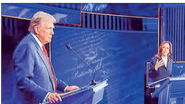
Trump claimed inflation is unprecedented, with prices soaring up to 80 per cent, and criticized the administration for allowing illegal immigrants to flood the country.

FORMER US President Donald Trump and Vice President Kamala Harris squared up in the first Presidential Debate in Philadelphia on ABC News. Kicking off the debate, Trump took on the Biden-Harris administration saying that inflation in the US is probably the worst in nation's history. Trump said that inflation is at 21 per cent and other things are 50 per cent, 60 per cent, 70 per cent, and 80 per cent higher than they were just a few years ago.