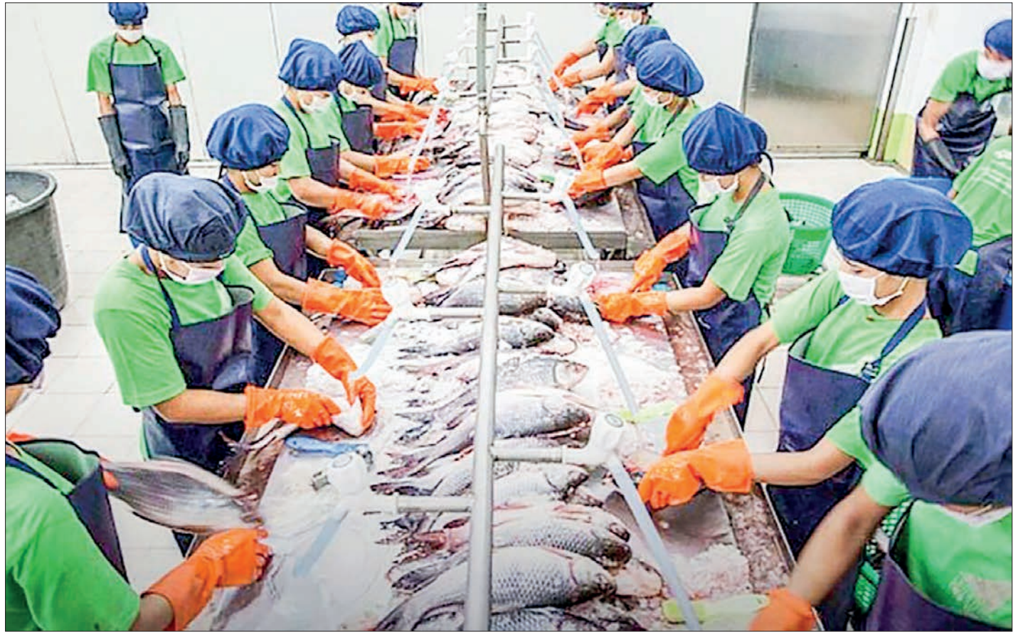
Diligent fishery workers operate the processing line at a cold storage facility, handling fishery products efficiently.

Custard apple in high demand from Yangon and Mawlamyine