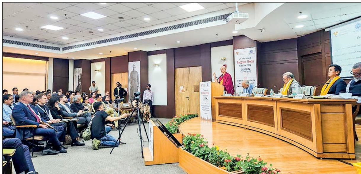
The second International Buddhist Media Conclave 2024 in progress at Vivekananda International Foundation in New Delhi, India, yesterday.

The conclave was jointly organized by the International Buddhist Confederation (IBC) and Vivekananda International Foundation (VIF).