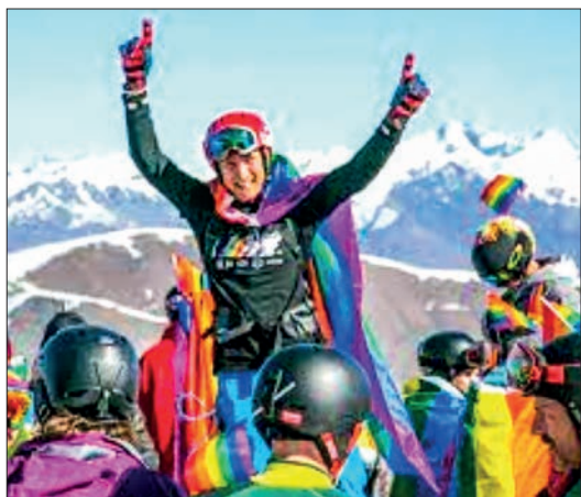
New Zealand has reported two additional cases of mpox, which are probably connected to the Queenstown Winter Pride event in August.