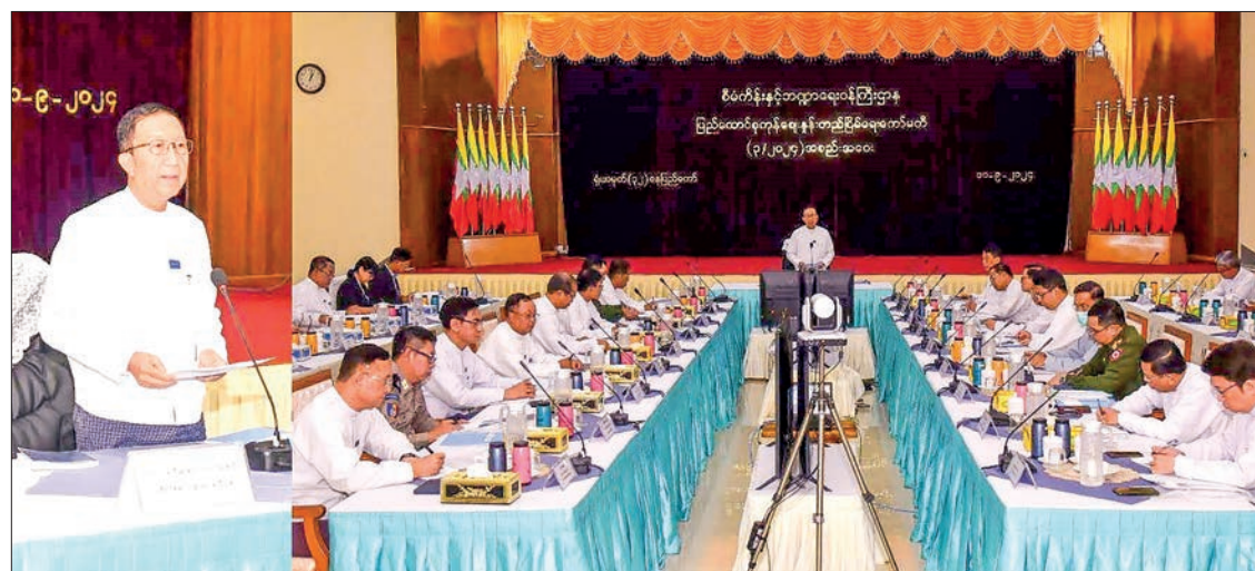
The third meeting of the Union Price Stability Committee in progress in Nay Pyi Taw yesterday.

supplies, he also mentioned the collective efforts of relevant ministries, region/state governments and private organizations not to face shortages and price increases.