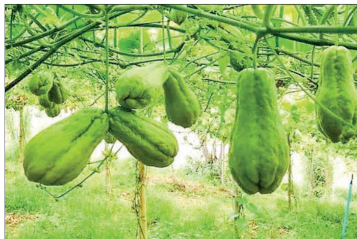
This image depicts a growing chayote plantation.

“Price varies on a daily basis. It has been about three days, and the chayote price has fallen. We transport it to Yangon’s Thiri Mingala Market and Mandalay, which are our main destinations. Compared to previous years, chayote price seems better for farmers,” he said.