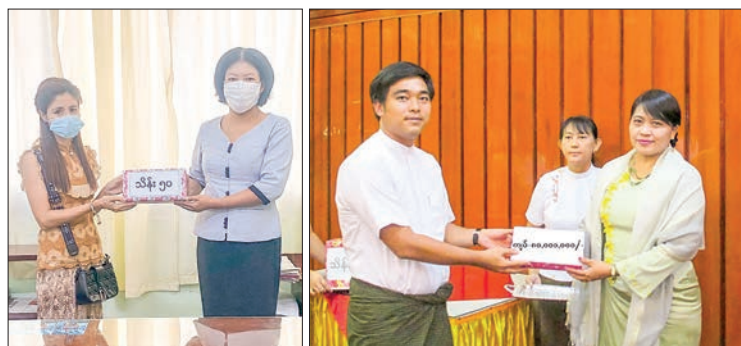
Some insurers are seen providing cash compensation for the insured.

State-owned Myanma Insurance covers third party liability insurance, inbound travel accident insurance, fire & allied perils insurance, burglary insurance, fidelity insurance, cash-in-safe insurance, cash-in-transit insurance, personal accident