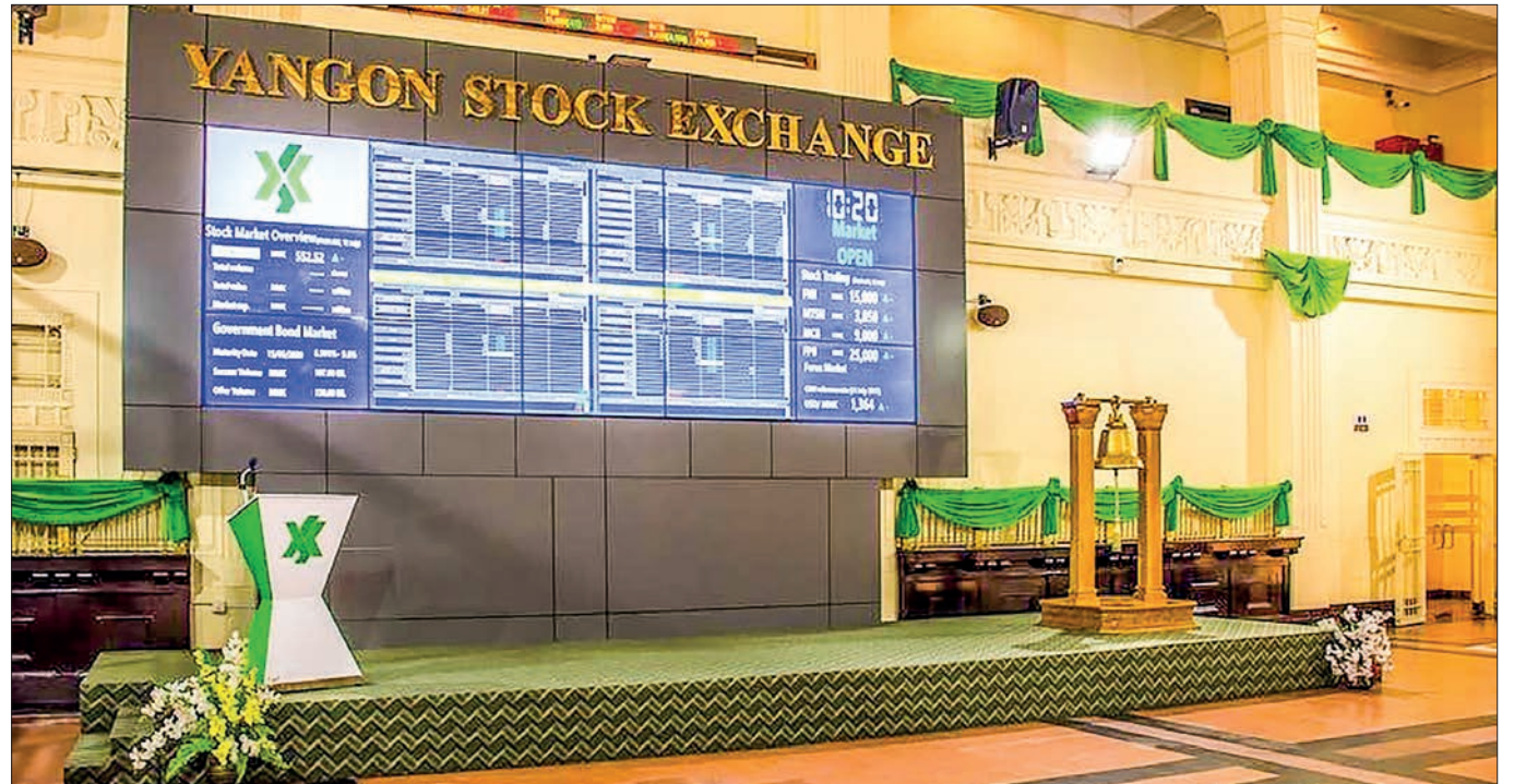
File photo shows a stock index panel at the Yangon Stock Exchange.

THE grand trading value of the eight listed companies on the Yangon Stock Exchange (YSX) surged to K3.35 billion, with over one million shares traded in August 2024, according to the monthly report released by the exchange.