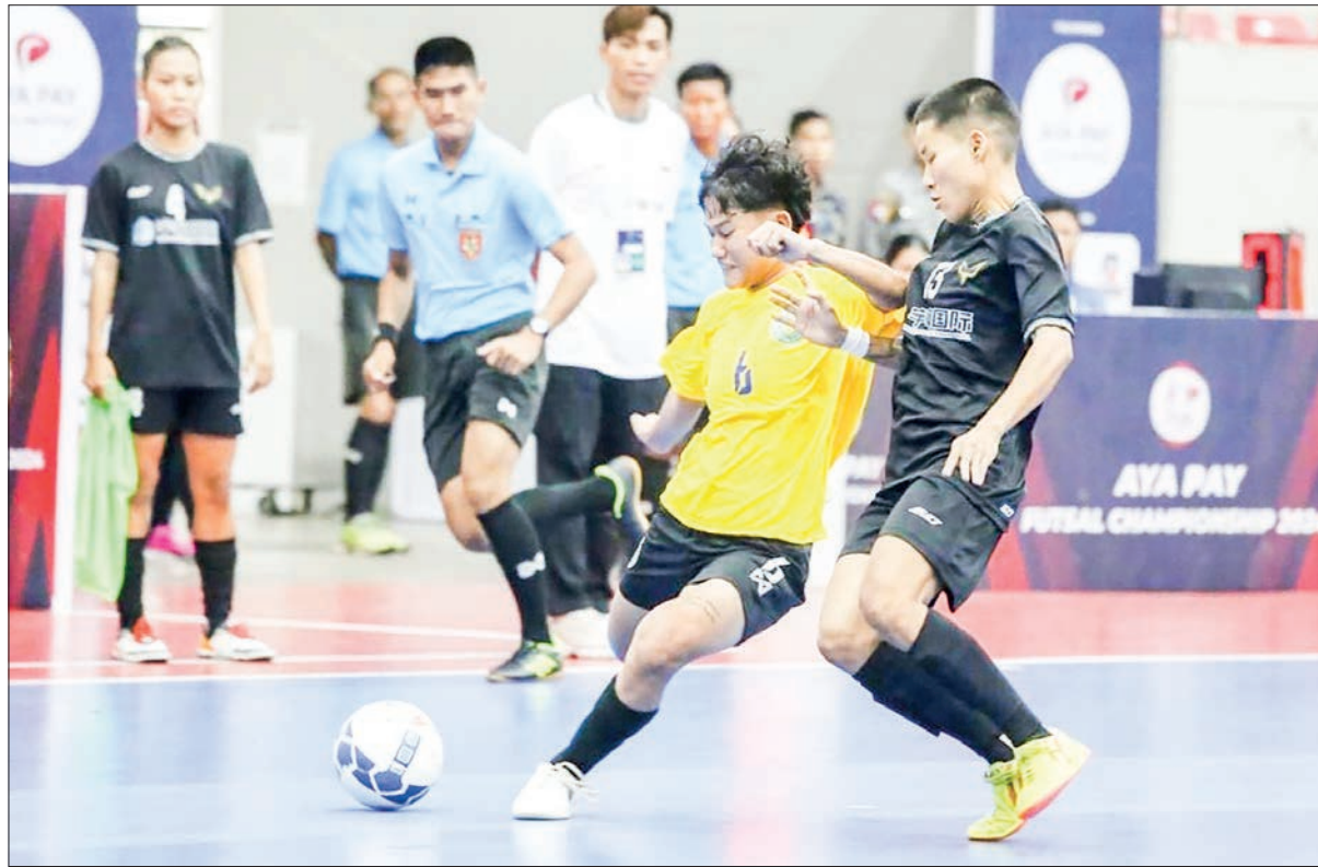
YRG in action against Phoenix FC in the MFF Women Futsal Invitation Cup 2024 match.

MYANMAR Football Federation (MFF) Women Futsal Invitation Cup 2024 commenced on 11 September at the MFF Futsal Arena in Thuwunna, Yangon.