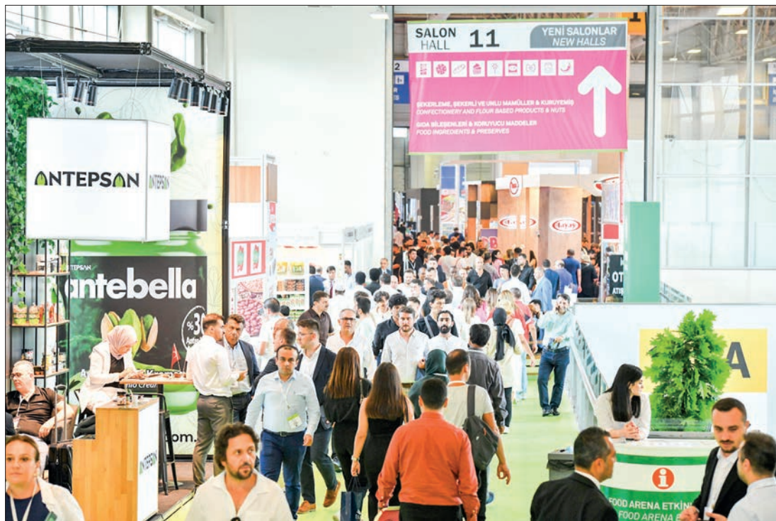
WorldFood Istanbul is the largest meeting point for the food industry and it continues to grow with the support of various key associations.

The exposition featured 36 Russian producers of various food and packaging products and took place from 3 to 6 September.