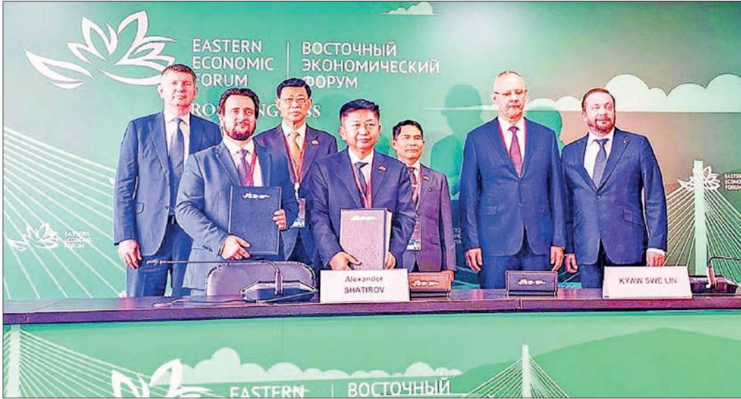
This photo depicts the signing ceremony of the Memorandum of Cooperation (MoC) between Russia and Myanmar for establishing a foliar spray production factory.

A Memorandum of Cooperation (MoC) between the Roscongress Foundation of Russia and the Myanmar government to establish a foliar spray production factory in Myanmar was signed during the Myanmar delegation's attendance at the Eastern Economic Forum in Russia, led by SAC Member Deputy Prime Minister and Minister for Transport and Communications General Mya Tun Oo.