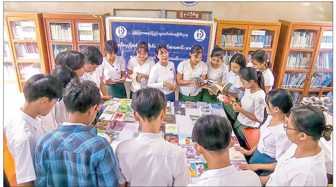
Students dip into books eagerly at the public library of Thegon Township Information and Public Relation Department yesterday.

Of the 14 political parties that applied for registration, 11 have already been granted registration approval. UEC continues to scrutinize the remaining applications for approval. — MNA/KZL