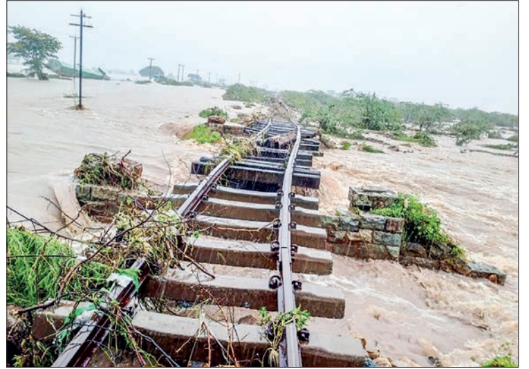
The photo shows the flood-affected rail lines on Thazi-Shwenyaung railway section by heavy rain in Shan State yesterday.

Moreover, the members of Tatmadaw, the Myanmar Police Force, the Fire Brigade and res-