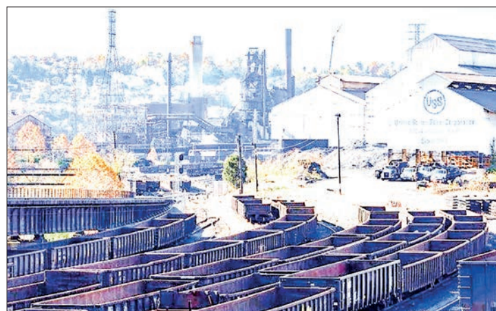
Japan’s Nippon Steel has agreed to buy US Steel Corp for $14.1 billion, the company said in a statement.

Financial Times reported Tuesday, citing people familiar with the matter. — Kyodo