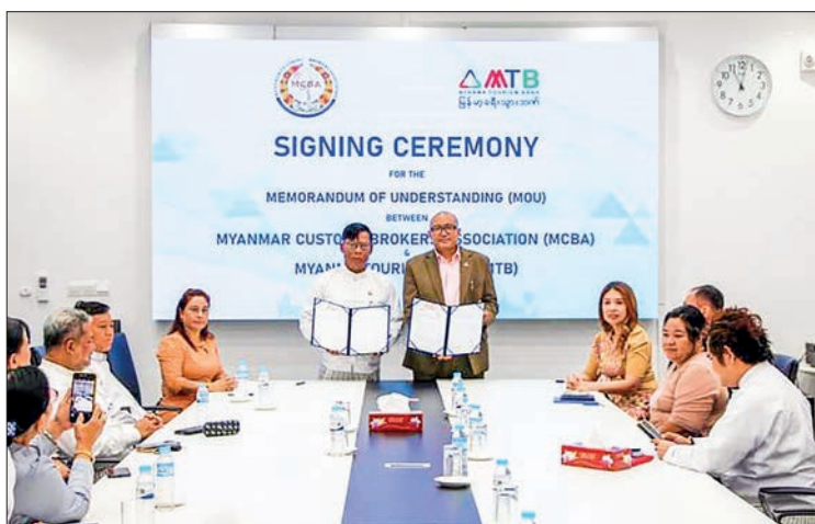
This photo shows the Myanmar Tourism Bank (MTB) and Myanmar Customs Brokers Association (MCBA) signing the MoU.

It is a two-year project, and the construction of Sarso Beikman will begin soon. — MNA/KTZH