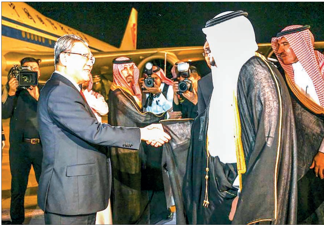
Chinese Premier Li Qiang arrives at the King Khalid International Airport in Riyadh, Saudi Arabia, 10 September 2024.

Reflecting on the 34-year diplomatic history between China and Saudi Arabia, Li highlighted the significant progress and successful cooperation achieved.