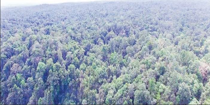
Nangsapi Protected Public Forest.

est is expected to safeguard valuable timber species in the area, such as teak, ironwood, and gumkino. Additionally, as the forest is connected to the Htamanthi Wildlife Reserve, it will help protect the habitats of rare species, including tigers, elephants, gaurs, pandas, monkeys, sambars, deer, and wild