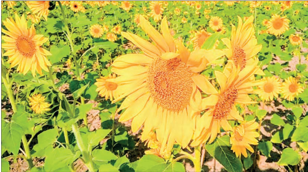
This picture captures a thriving sunflower plantation.