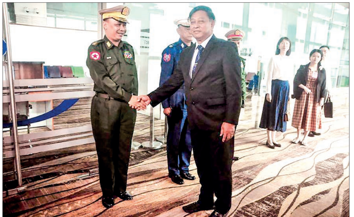
State Administration Council Member Deputy Prime Minister Union Minister for Defence Admiral Tin Aung San is seen off at Yangon International Airport before departing for China yesterday.

The Myanmar delegation led by Admiral Tin Aung San was seen off at Yangon International Airport by the Yangon Command commander, officials from the embassy and military attaché's office of the People's Republic of China and senior Tatmadaw officers.