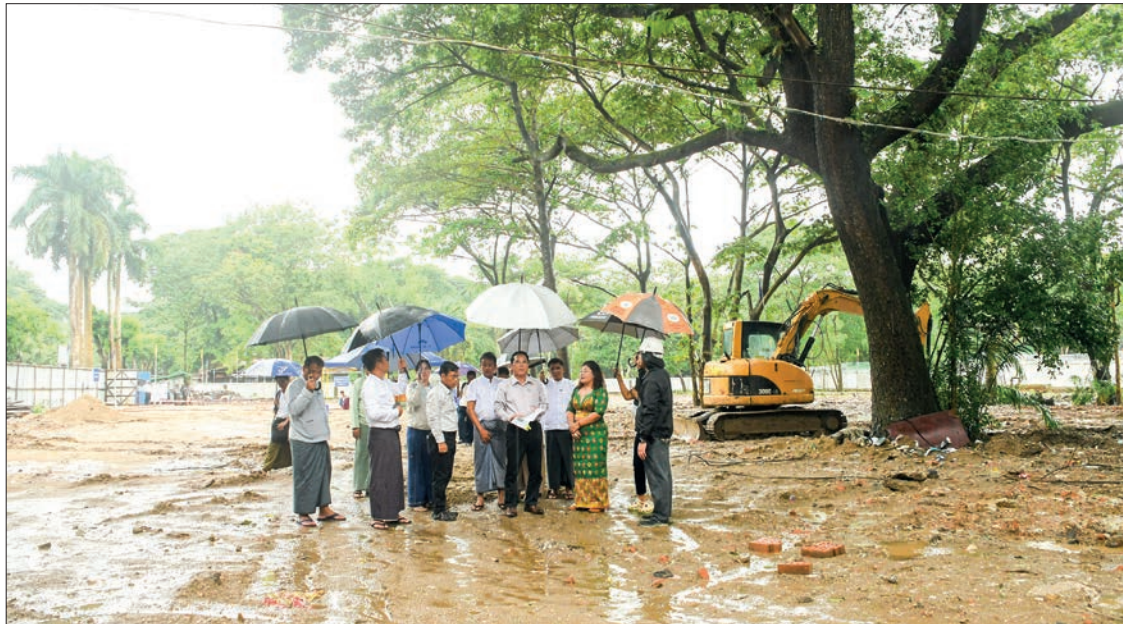
Union Minister for Information U Maung Maung Ohn inspects the preparations for a groundbreaking of the Sarso Beikman building in Mingala Taungnyunt Township, Yangon, yesterday.

Then, the Union minister instructed to grow trees and plants in the Sarso Beikman compound, complete the display, the progress and ongoing stages model of the building structure for the groundbreaking ceremony, meet the international museum standards as the palm-leaf manuscripts and Parabaik will be placed, use quality construction materials, conduct proper negotiation as it is a national-level building as an India-Myanmar friendship symbol, and place