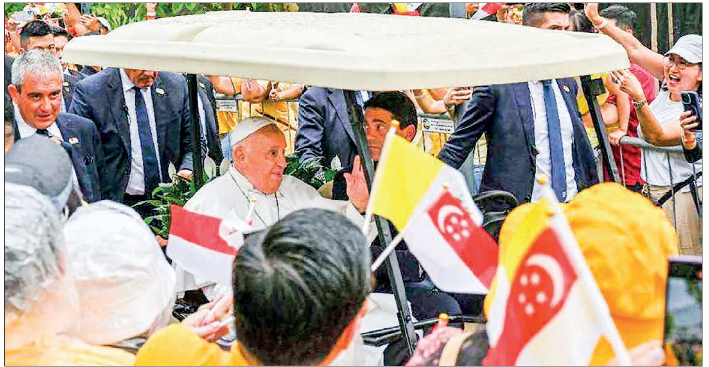
Pope Francis waves to Catholics as he arrives at Changi Jurassic Mile in Singapore on September 11 for the last stop of a four-nation Asia-Pacific trip. PHOTO: AFP

Emergency relief operations are underway to evacuate the residents, provide immediate shelter, and ensure their safety. — Xinhua