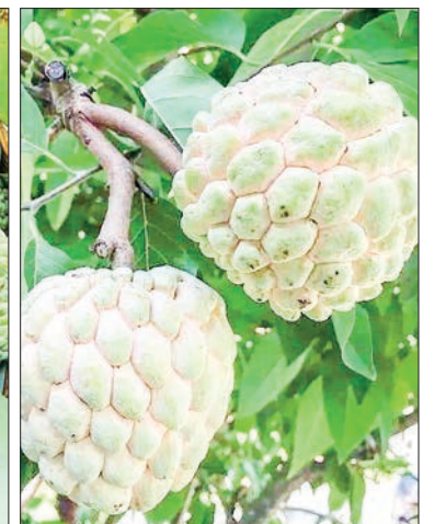
This photo shows custard apples produced from Pyay.