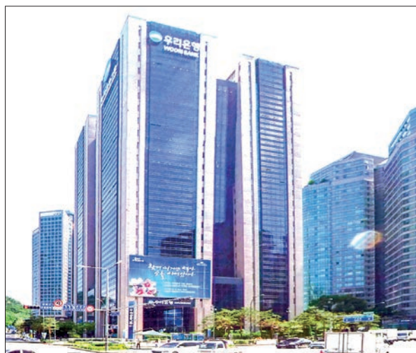
Woori Bank is a Korean multinational bank headquartered in Seoul. It is one of the four largest domestic banks in South Korea.

SOUTH Korean banks' household lending rose for the fifth straight month due to robust de-