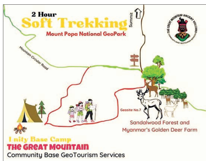
This image depicts the map showing the mountain climbing trek and Mount Popa.

He thought that there would be more tourists in the dry season as there are now visitors as well as some inquiries. The Mahagiri group currently provides mountain climbing services, cares for Popa langur conservation, and expands its services into geotourism. — MT/ZN