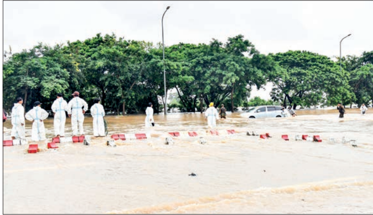
Rescue and relief team members push a vehicle surrounded by floodwaters in Nay Pyi Taw yesterday.

Due to the persistent rain starting on 10 September, floods occurred in Zeyathiri township, at the Kintha junction of Tatkon