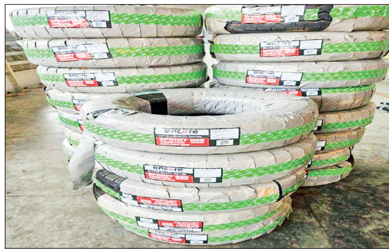
Confiscated illegal goods from different states and regions.

Similarly, the Nay Pyi Taw Illegal Trade Eradication Special Task Force seized K 1,281,722