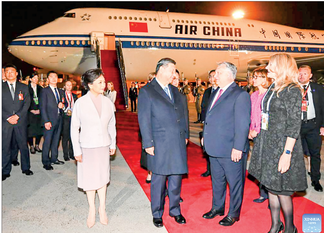
Chinese President Xi Jinping arrives in Budapest for a state visit to Hungary at the invitation of Hungarian President Tamas Sulyok and Prime Minister Viktor Orban, 8 May 2024. Xi was warmly welcomed by Hungarian Prime Minister Viktor Orban and his wife at Budapest Airport upon arrival.

The bilateral relationship has stood the test of the changing international landscape and continued to grow in depth from a friendship across the continent, to a friendly and cooperative partnership and then to a comprehensive strategic partnership, Xi said.