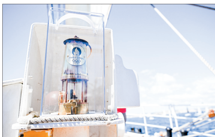
This photograph shows the Olympic flame on the French 19 th -century three-masted barque Belem as the boat sails near the coast of Marseille, in the Mediterranean Sea, on 8 May 2024, before landing with the Olympic torch, ahead of the Paris 2024 Olympic and Paralympic Games.

President Emmanuel Macron praised the "unprecedented effort" of the security forces in Marseille and said after watching the flame arrive that he hoped