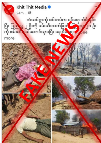
The screenshot validates misinformation.

REPORTS from certain media sources are spreading false information alleging that Tatmadaw security forces conducted a raid on Kanthit Village in Pakokku Township, Magway Region, on 8 May. They claim that two villagers were killed, 20 were arrested, and 13 houses were set on fire.