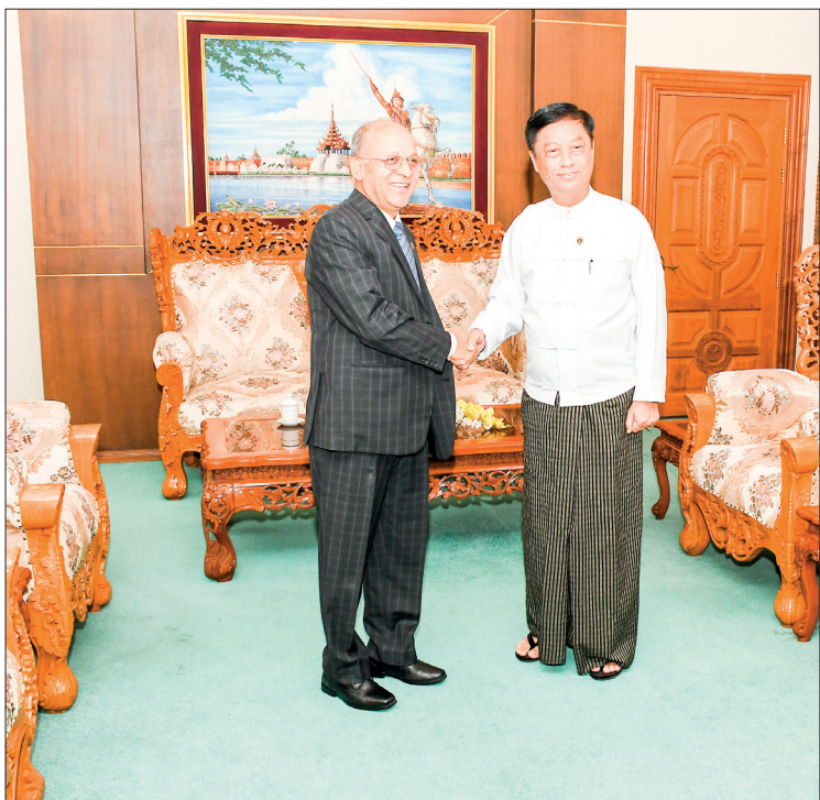
Deputy Minister U Lwin Oo greets the Nepali ambassador at yesterday's event.

DEPUTY Minister for Foreign Affairs U Lwin Oo received Mr Harishchandra Ghimire, Ambassador Extraordinary and Plenipotentiary of Nepal to the Republic of the Union of Myanmar, in Nay Pyi Taw yesterday.