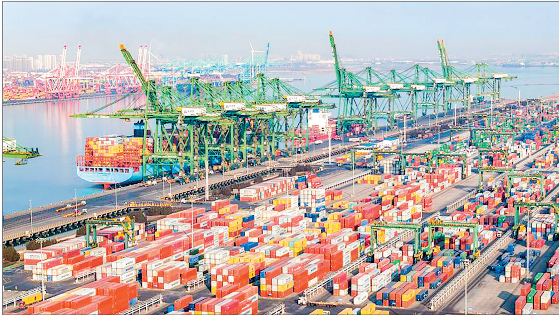
An aerial drone photo taken on 2 February 2024 shows an international container terminal of Tianjin Port in north China's Tianjin.

CHINA'S total goods imports and exports expanded 5.7 per cent year on year in yuan terms in the first four months of this year, stronger than the five per cent recorded in the first quarter, official data showed Thursday.