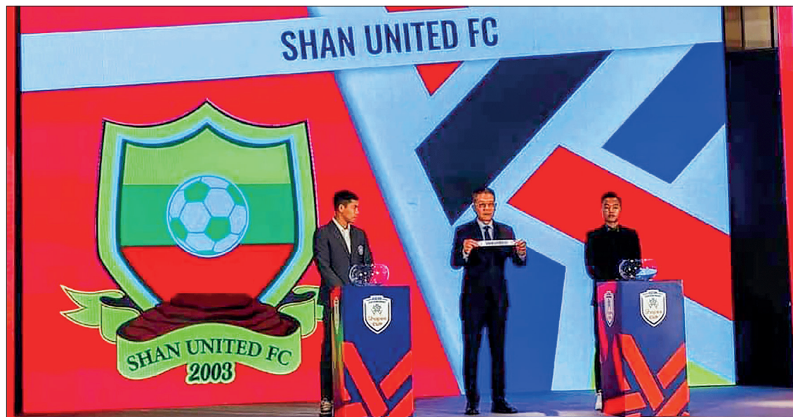
The Shan United logo is seen during the ASEAN Club Championship Qualifiers drawing-lots event held in Ho Chi Minh City, Viet Nam, on 9 May 2024.

ASEAN Club Championship Qualifiers and final round drawing-lots event held in Ho Chi Minh City, Viet Nam, on 9 May. Myanmar football club Shan United FC meets Brunei Football Club (Kasuka) in the qualifying play-off stage.