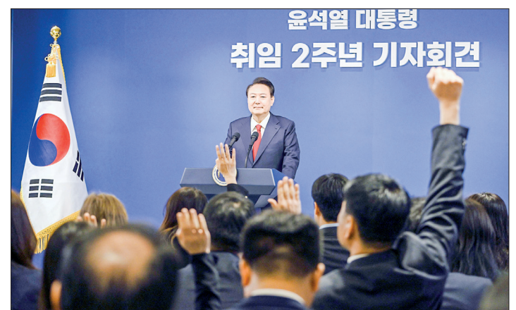
South Korean President Yoon Suk Yeol holds a press conference at his office in Seoul on 9 May 2024.

Yoon's administration decided to compensate the plaintiffs in a series of cases involving forced labour during Japan's colonial rule of the Korean Peninsula between 1910 and 1945 with money from a South Korean government-backed fund, rather than seeking restitution directly from the Japanese companies that were sued. — Kyodo