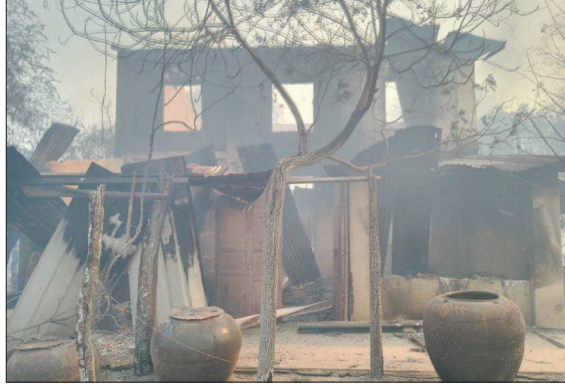
Damage and debris are seen in the aftermath of terrorists' attack.