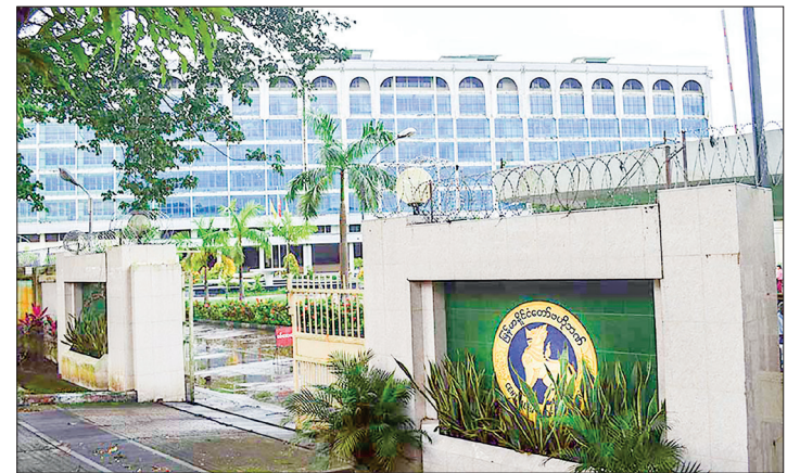
The front view of the office of Central Bank of Myanmar in Yangon.

According to CBM's notification on 15 March, it has been joining hands with law