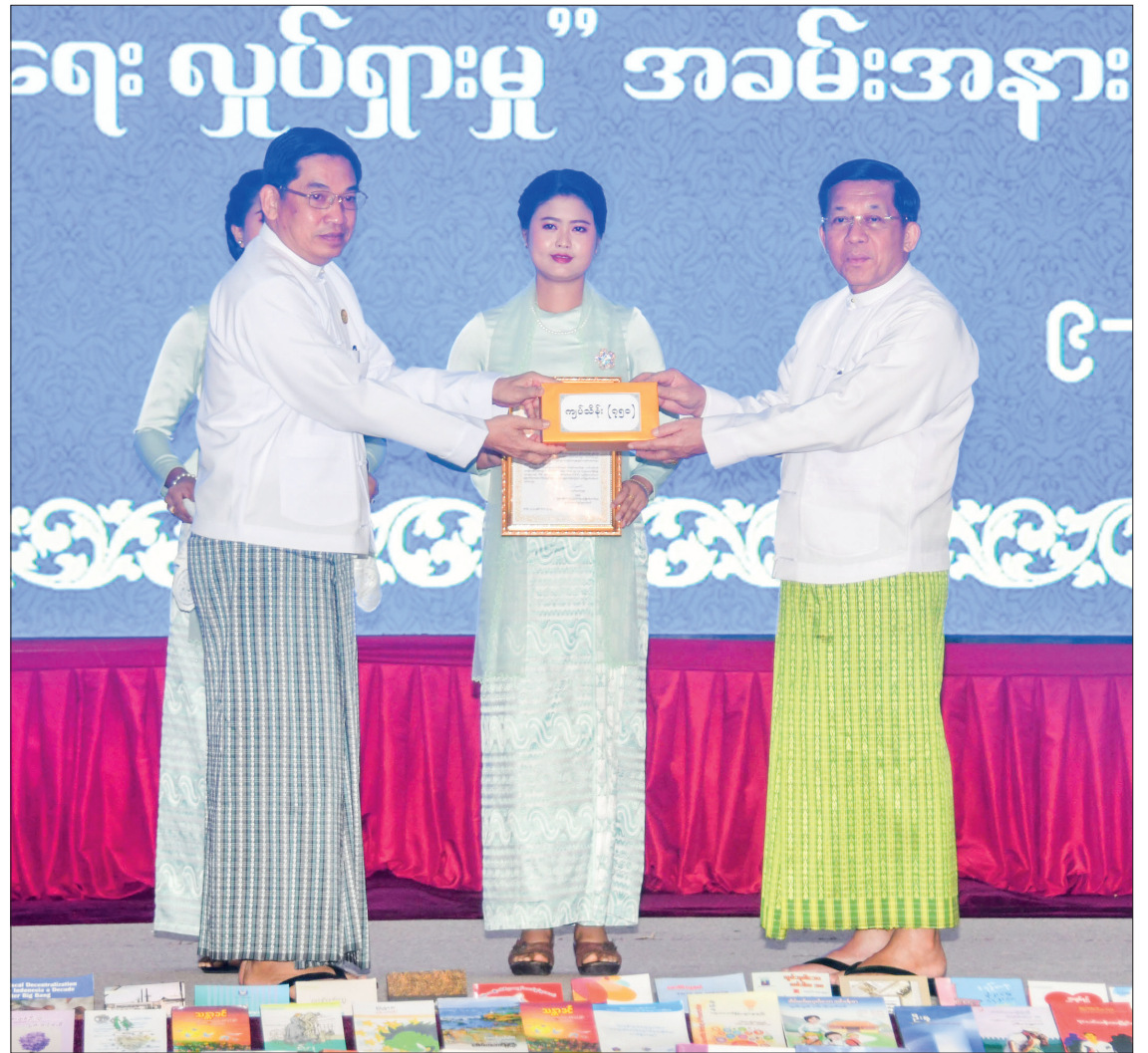
The Senior General accepts cash donations for the construction of libraries.