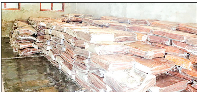
The private rubber manufacturing industry is seen in Mon State.

The rest of the regions, namely Yangon, Bago, and Taninthayi, also grow rubber. — TWA/KZL