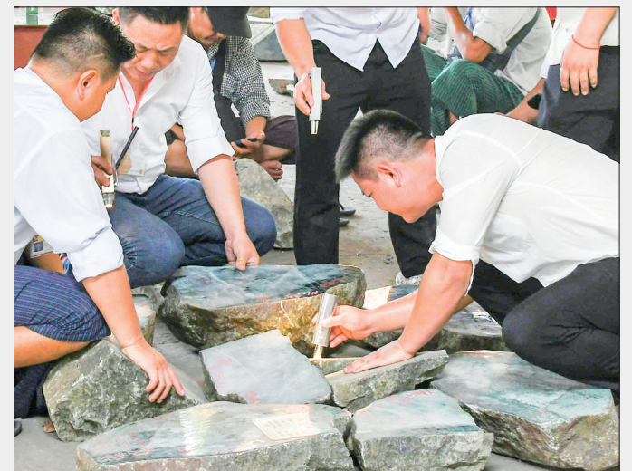
Gem traders look into jade stones at yesterday's emporium.

Officials will review and inspect the proposed price lists of jade lots numbered from 2751 to 3750 on the eighth day, and the sold-out jade lots will be announced on the ninth day of the exhibition.