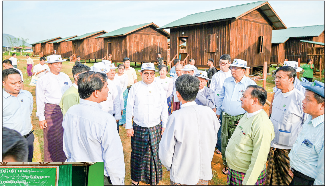
Photos show Kachin State Chief Minister U Khet Htein Nan and officials meeting household members and providing foodstuffs and cash assistance yesterday.