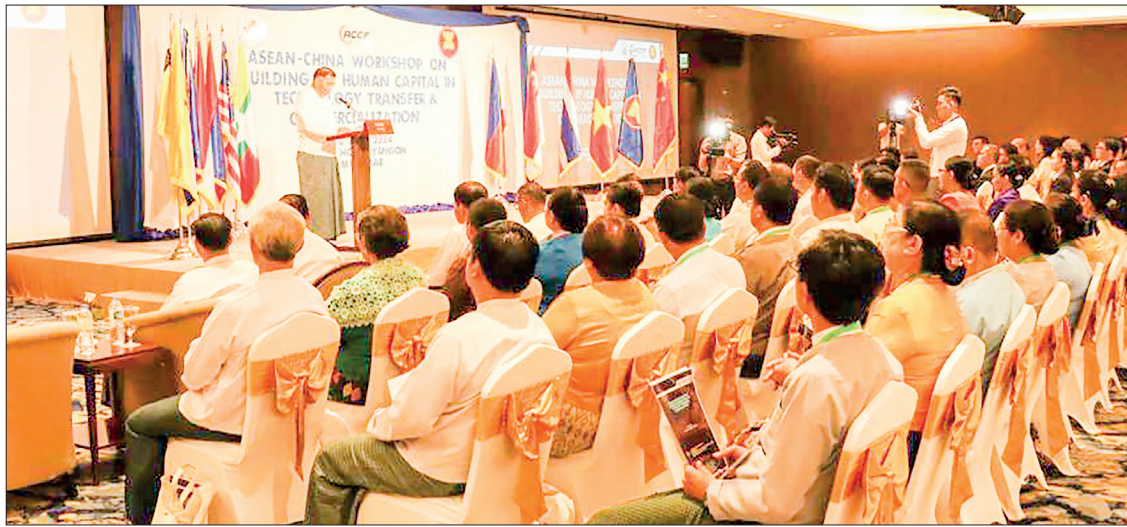
The ASEAN-China Workshop on Building Up Human Capital in Technology Transfer and Commercialization in progress yesterday in Yangon.

At the event, Union Minister Dr Myo Thein Kyaw, Minister Counsellor Dr Zheng Zhong of the Chinese Embassy