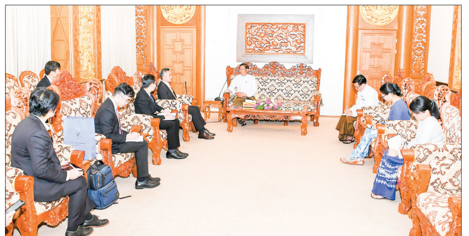
Thai Ambassador Mr Mongkol Visitstump calls on Deputy Prime Minister Union Foreign Affairs Minister U Than Swe yesterday.

of the existing long-standing cordial relations and bilateral partnership. Also, they discussed the expansion of mutually beneficial cooperation, especially in the areas of tourism, education, culture, trade, investment, and people-to-people connectivity between the two countries, as well as closer collaboration at both regional and multilateral arenas on the basis of mutual understanding and support. — MNA