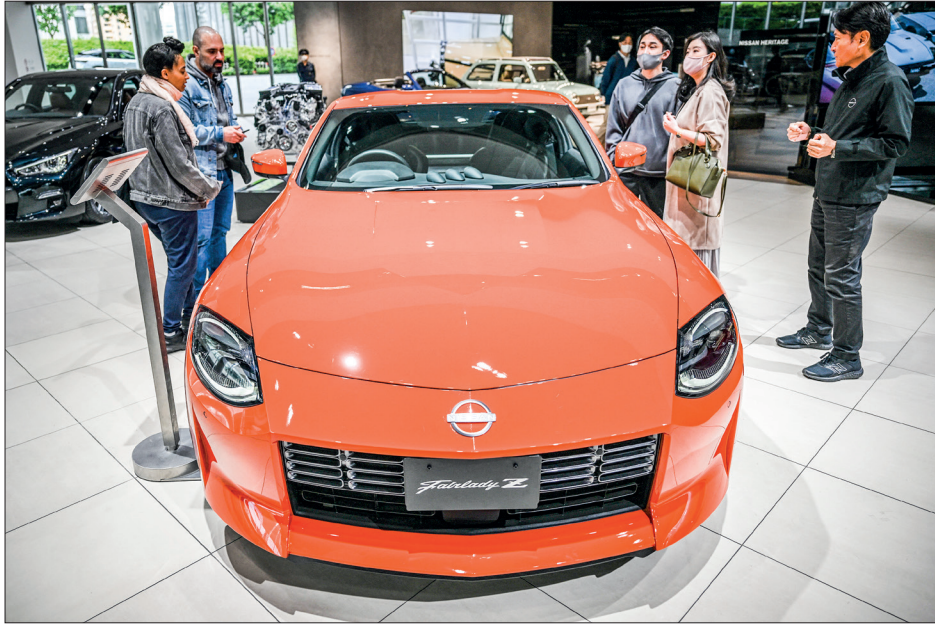
People look at a car on display at a showroom of Japanese automaker Nissan Motor in Yokohama on 9 May 2024.

NISSAN Motor Co said Thursday its net profit for the year ended March almost doubled from a year earlier to 426.65 billion yen ($2.7 billion), as vehicle sales grew following the coronavirus pandemic and a weaker yen boosted its overseas profit.