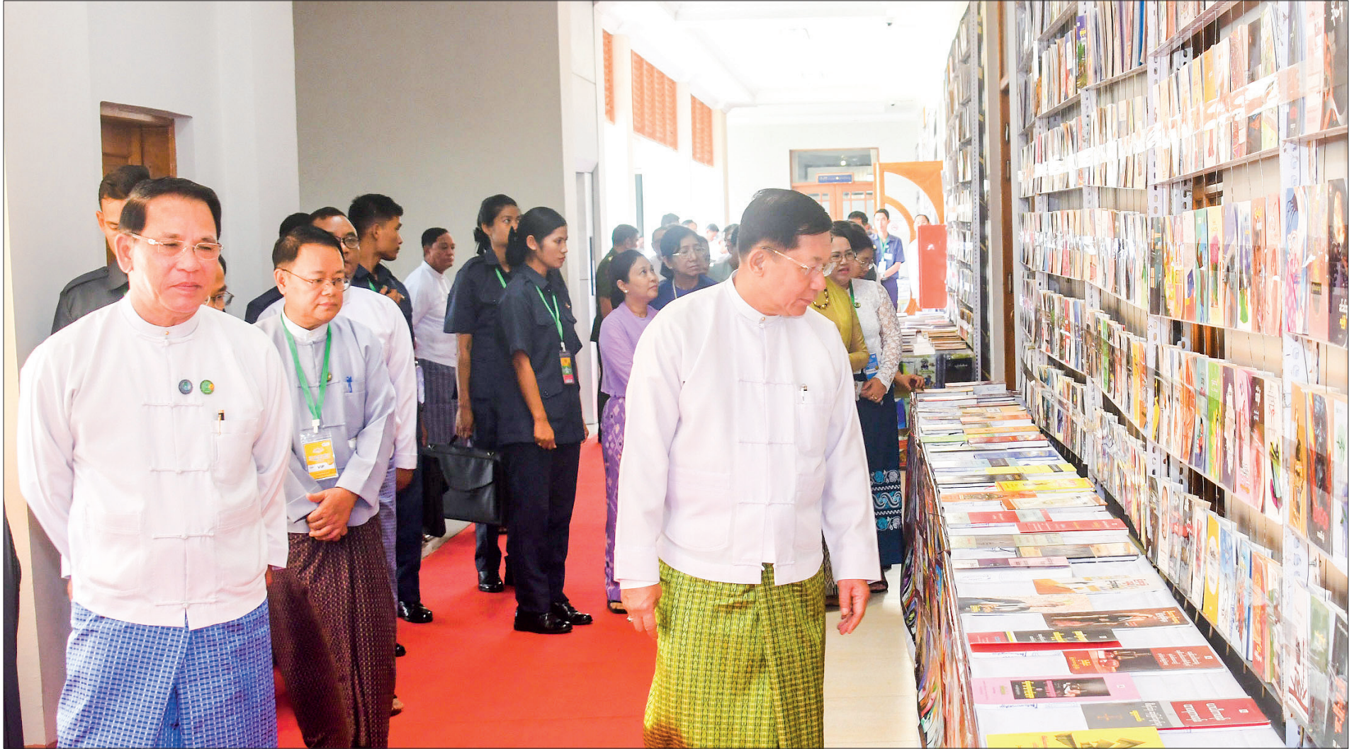
State Administration Council Chairman Prime Minister Senior General Min Aung Hlaing looks into the display at yesterday's event in Nay Pyi Taw.