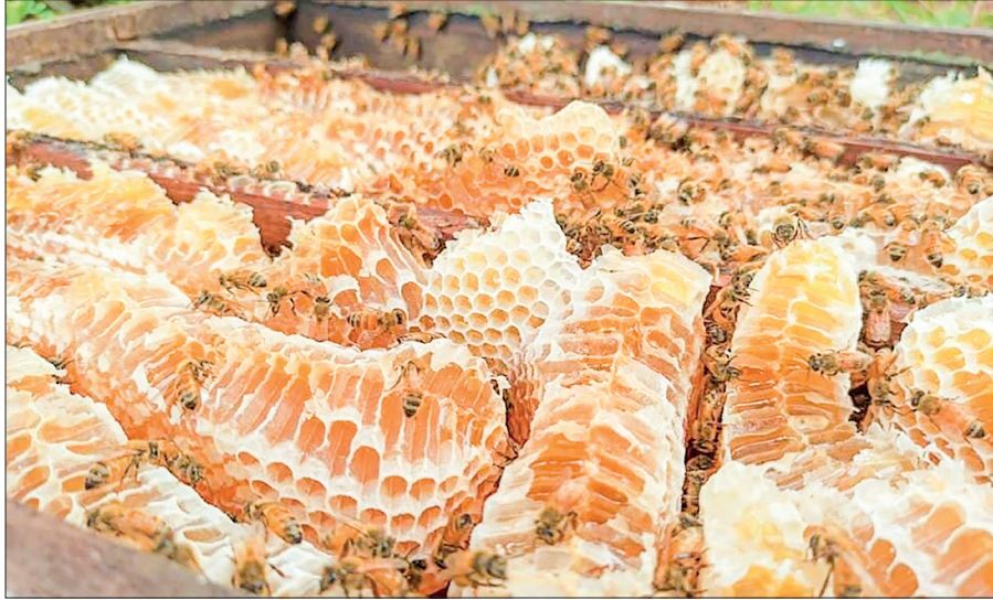
A glimpse of beehives.

THE Livestock Breeding and Veterinary Department warned the beekeepers of the deformed wing virus (DWV) induced by extreme temperature, causing twisted, shrunken and crumpled wings.