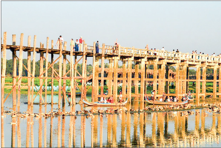
The photo shows some boats running in the lake.

U Soe Win, secretary of the U Bein Bridge Maintenance Committee, mentioned that nearly 600 local and foreign travellers frequent Taungthaman Lake and U Bein Bridge daily, with approximately 50 boats operating for passengers.