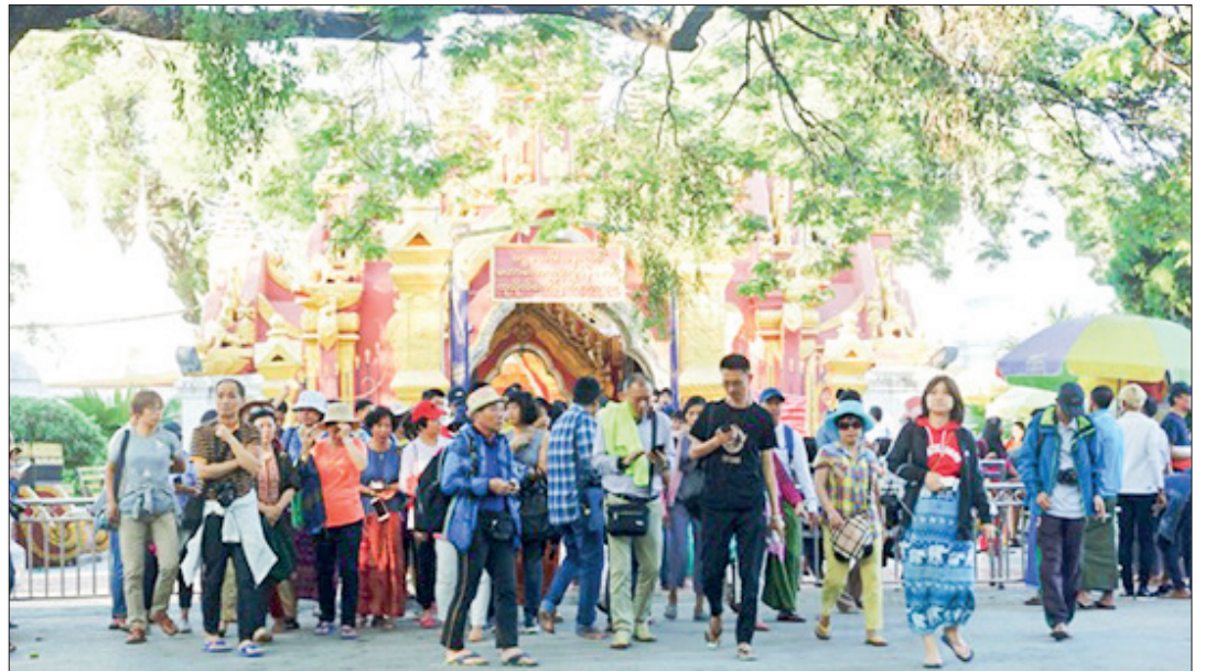
The image shows some foreign tourists visiting Myanmar.

In this year's tour season, the majority of visitors went to Mandalay, Bagan, Inlay, Kalaw, Kyaiktiyo, Chaungtha, Ngwehsaung, and newly developed beaches. In Thingyan, people flocked to famous destinations such as Chaungtha and Ngwehsaung beaches, but hotels could provide rooms for those only who had already made reservations. Some people couldn't find rooms in Chaungtha, and Ngwehsaung visited newly developed beaches. Some people took day trips during Thingyan. — MT/ZS