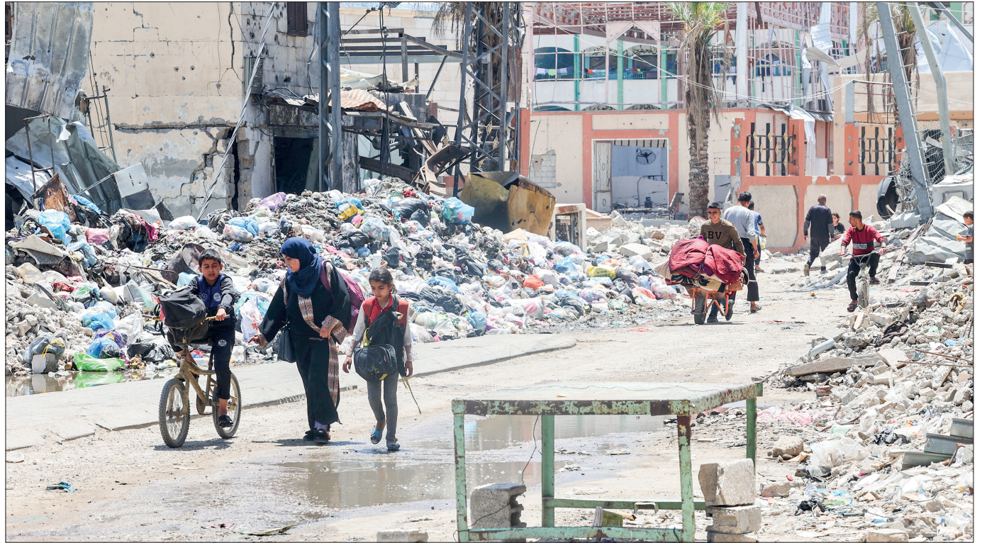
A boy rides a bicycle alongside a woman and girl walking past a mound of trash by a destroyed building in the Zaytoun neighbourhood of Gaza City on 9 May 2024 amid the ongoing conflict in the Palestinian territory between Israel and the militant group Hamas.

S MOKE rose from strikes on Gaza’s crowded southern city of Rafah Thursday after US President Joe Biden vowed to stop supplying artillery shells and other weapons to Israel if a full-scale offensive into the city goes ahead.