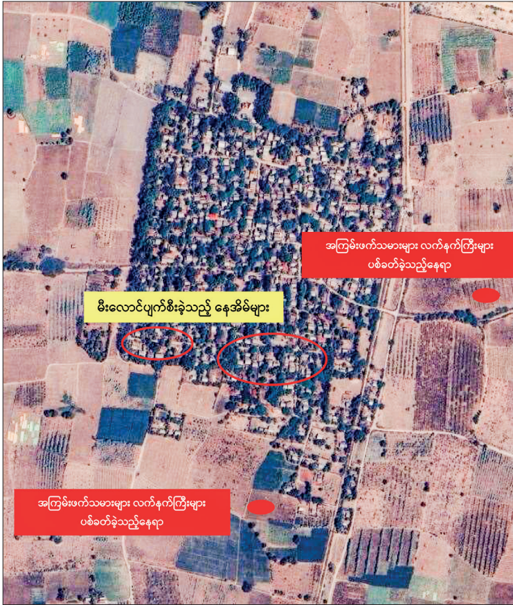
The location map of heavy-weapon attack by terrorists and houses ablaze.