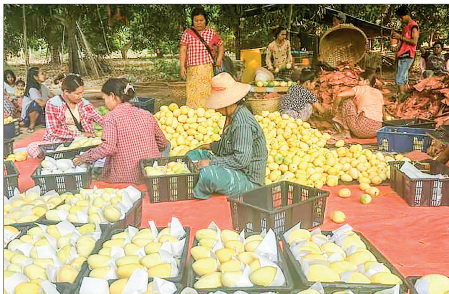
Mangoes that are being trial-exported to China.

Transportation charges have skyrocketed for export to foreign countries, and border-crossing export is lengthy, which is why it seems mango will have to rely more on the domestic market but needs to wait and see about exporters, said an official from Myanmar Mango Producers and Exporters Association. — MT/ZS