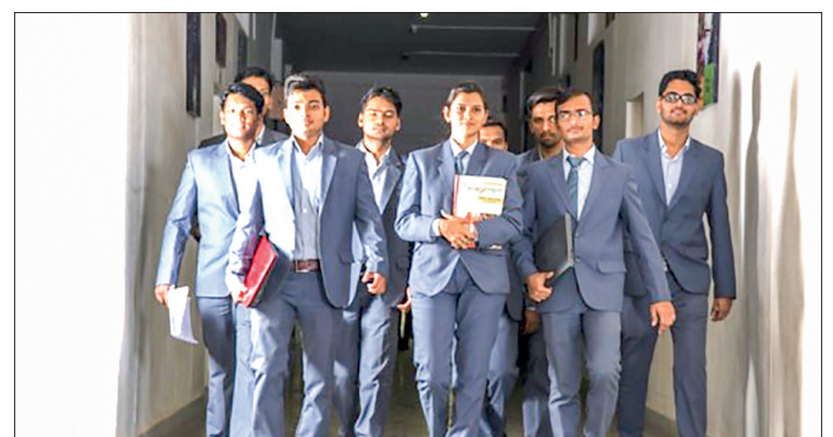
Ahmedabad has entered the top 100 global cities as destination for working professionals.

a different country for work, cited a strong emotional attachment to their country. The global average was 33 per cent. As many as 23 per cent participants are actively seeking jobs in other countries, and 63 per cent expressing an overall willingness to do so, the survey read. — ANI