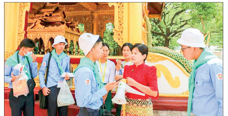
Visitors are exploring the Bagan Archaeological Museum in 2023.

"Foreigner admission is still few. There were about 40 foreign admissions in March and about 23 in February. So the number of local visitors was larger than foreign visitors,"