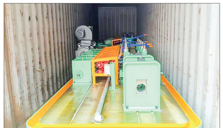
Seized illegal item.

Therefore, 11 arrests (estimated value of K920,785,714) were made on 30 April and 1 May, according to the committee. — MNA/KTZH