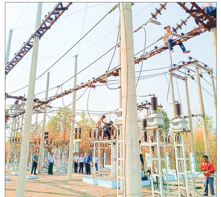
MoEP officials inspect the power line maintenance.

The report also highlights that dams have insufficient water levels due to lower rainfall during the 2023 monsoon compared to 2022. Water stored in dams and natural gas must be used cautiously from last November to the upcoming June for electricity production to ensure stable nationwide electricity distribution and prevent power outages before the monsoon season. As a result, the country can only meet around 50 per cent of its electricity demands. — TWA/TMT