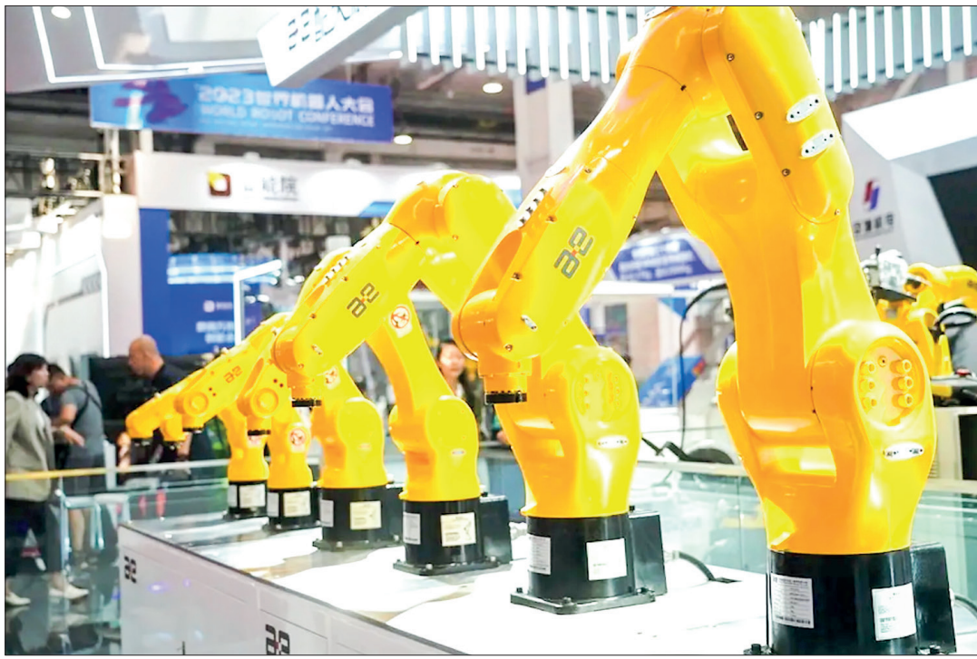
Desktop industrial robots are pictured at the World Robot Conference 2023 in Beijing.