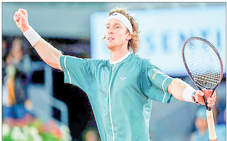
Andrey Rublev, ranked World No 8, delivered a masterclass performance to end Carlos Alcaraz's Madrid dominance in the ATP Masters 1000 event.

Under the cover of Manolo Santana Stadium, the 26-year-old occasionally overpowered Alcaraz with his powerful forehand wing hits. After defeating Jan-Lennard Struff for two hours and fifty minutes in the fourth round, Rublev won thirty games and often stepped inside the baseline to pressure the Spaniard.