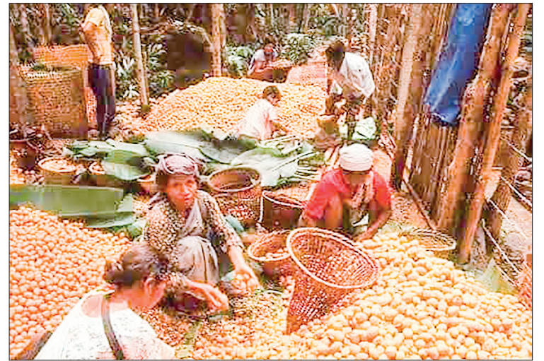
A betel farm and some female workers picking betel nuts.

“Betel nut is mainly exported to India. As the route situation is not good, we no longer deliver our products from Myeik to Tamu but send them down to Kawthoung for export to Ranong. The local betel nut production in one year cannot be consumed in three years. It has to rely on the export market. As demand is low while supply is high, betel nut price doesn't increase, and that's the nature of the market,” said a betel nut trader from Myeik. — Thit Taw/ZN