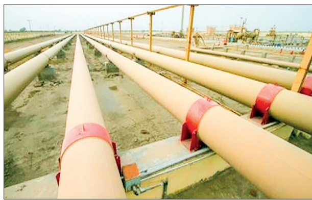
Authorities conducted a targeted operation against gas theft in Karachi, resulting in the arrest of the owner of Chai Gulab Hotel for allegedly stealing gas directly from the service line.

IN a recent operation targeting gas theft, authorities apprehended the proprietor of a well-known hotel for allegedly stealing gas directly from the service line in Karachi, according to ARY News.