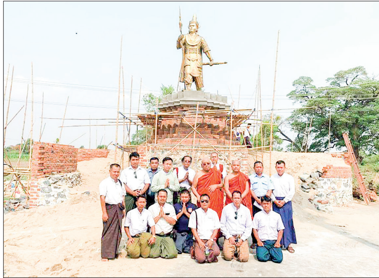
The compound inside the short-drum-shaped city wall of ancient Inwa seen with scarce trees in 2019 when the bronze statue of King Thatoe Minphya, founder of the First Inwa, was erected.

"To restore the originality of the north-south road in the short-drum-shaped city wall and the Thayetthonpin street from