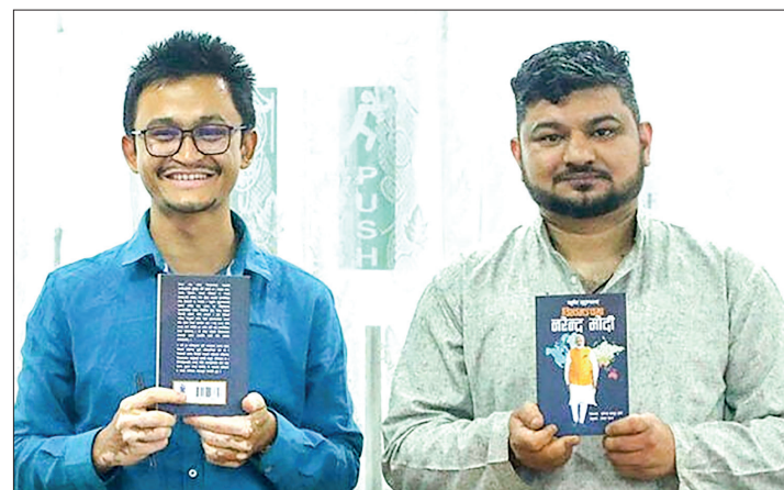
Chhetri compiled Modi's speeches meticulously, while Chand skillfully translated them into Nepali. The book offers insights into India's diplomatic strategies and global perspectives.

The compilation spans speeches delivered by PM Modi from 2014 to early 2024 during his various international engagements, shedding light on India's diplomatic approach