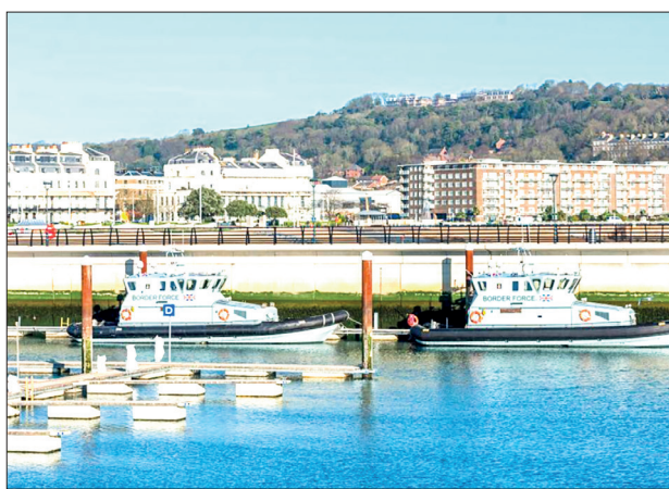
Photo taken on 29 November 2021 shows two Border Force patrol boats moored in Dover Docks in Dover, Britain. Authorities are exploring safer routes to deter illegal migration across the perilous English Channel.

BRITISH authorities have commenced the detention of asylum seekers as part of the new initiative aimed at deporting them to Rwanda, with initial flights slated for departure as early as July, the government announced, Al Jazeera reported. Home Secretary James Cleverly remarked, "Our dedicated enforcement teams are working at pace to swiftly detain those who have no right to be here so we can get flights off the ground."