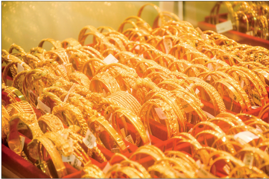
Jewellery is displayed at the gold outlet in Yangon.

THE domestic gold price slightly declined to K4.77 million per tical (0.578 ounce or 0.016 kilogramme) on 2 May after peaking at K4.85 million per tical on 26 April.