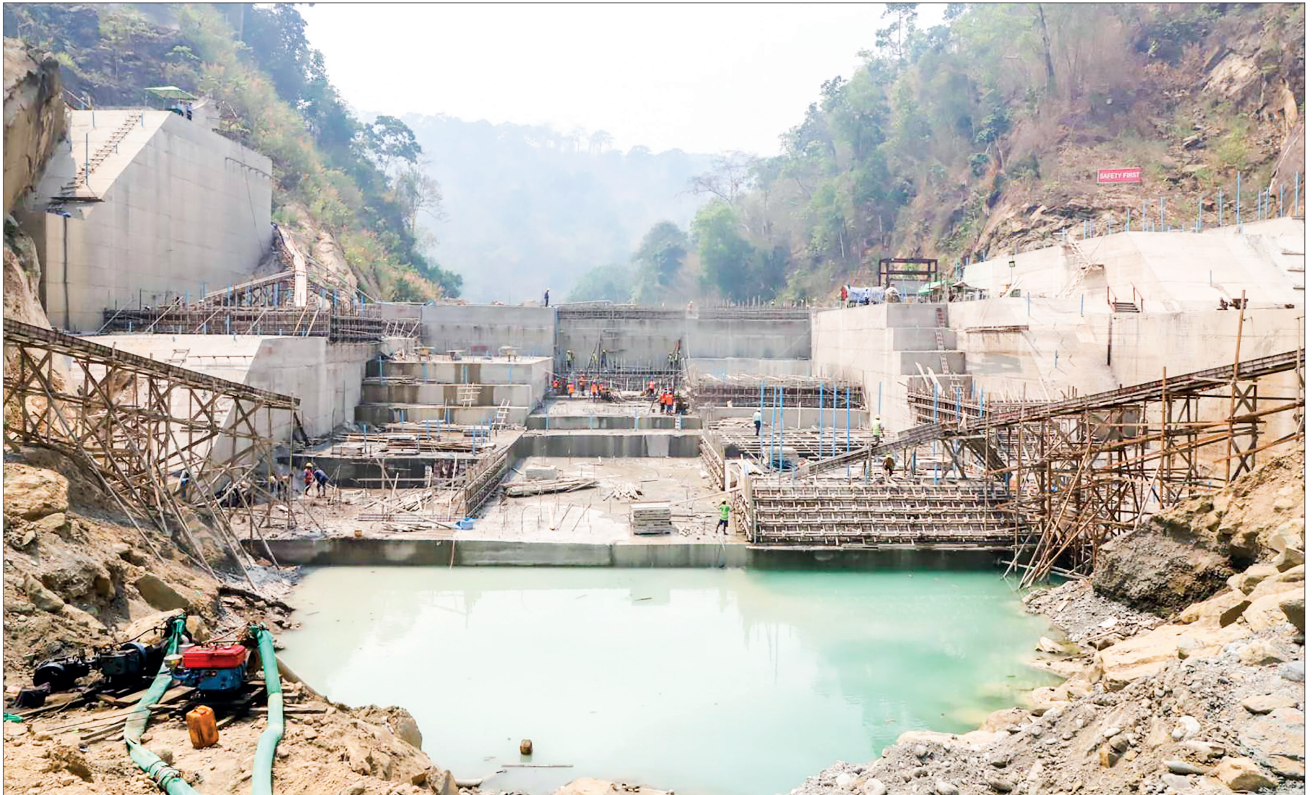
The image depicts the construction works of the Nampanga small-scale hydropower project in Homalin Township, Sagaing Region.