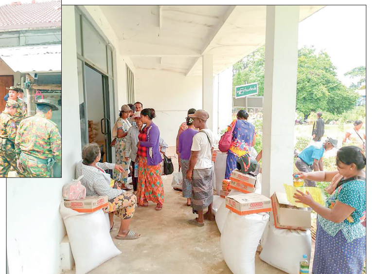
Photos show the restoration underway in Kawkareik.

As these redevelopment works are underway, Tatmadaw members, Myanmar police force members and members of