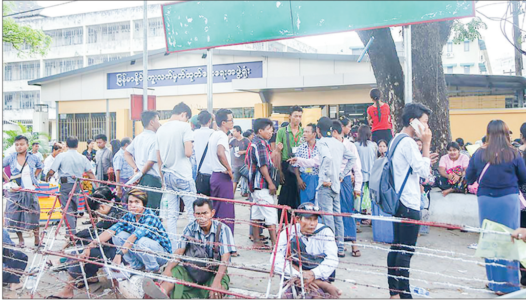
Passport applicants are seen at the office of the Myanmar Passport Issuing Board in 2023.

ACCORDING to the Myanmar Passport Office, the issuing of Myanmar passports through the online booking System will be extended to 11 cities.