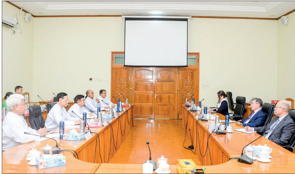
Union Minister U Nyunt Pe holds talks with the Russian ambassador yesterday.