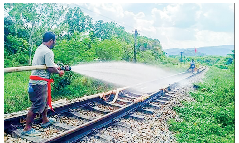
Thai railway workers doused the melting tracks with water to try to bend them back into shape /State Railway of Thailand. PHOTO: AFP

The well-known feline aversion to water means some link the animals to rainfall, with their furious meows after being drenched thought to summon precipitation. — AFP