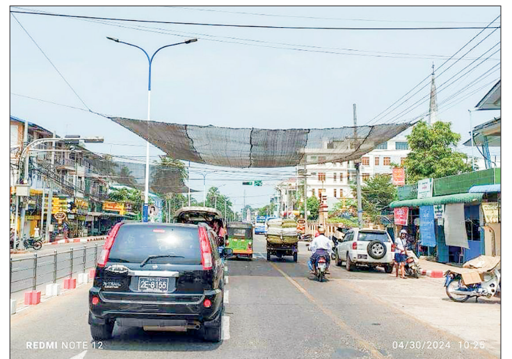
Sun protection roofs and shades installed at major roads in Mandalay.

sprinklers have been installed at major road intersections since early April to help mitigate the effects of the heat on the public. — ASH/TKO