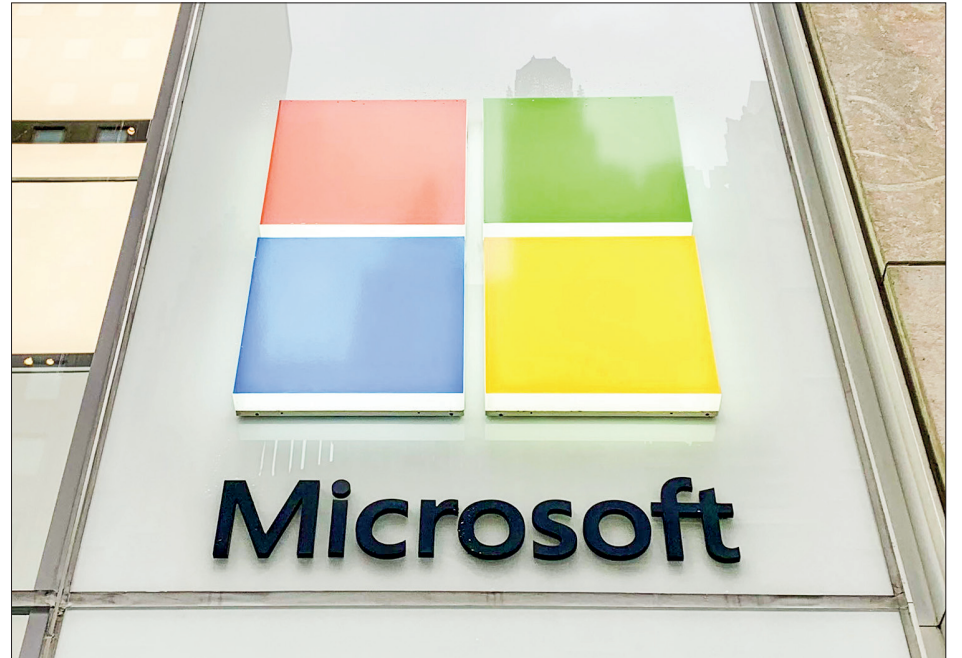
File photo taken in February 2020 in New York shows the logo of Microsoft Corp.

Nadella announced the investment during a forum in Kuala Lumpur. Earlier Thursday, he met with Prime Minister Anwar Ibrahim.