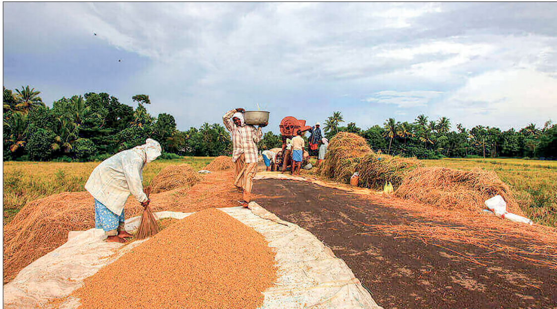
Some farmers are winnowing and packaging paddy in the Ayeyawady Region.

“There are buyers who buy paddy sensibly. In the past, when farmers sold in a rush, prices plunged down. This year, the price has been steady, and the trade has been normal. Paddy quality has become different between the beginning of harvest and now. In Pathein, paddy fields, in which saltwater flows, have declined in its quality, and the price of such non-premium paddy is K1.8-K2 million per 100 baskets,” said the association’s