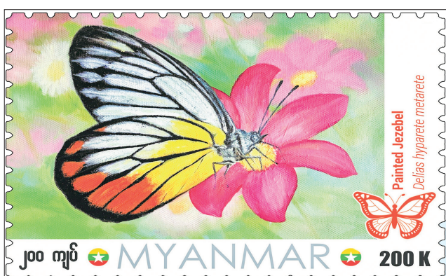
The image shows a "Painted Jezebel" butterfly stamp.

ural Resources and Environmental Conservation. As part of a special programme, stamps purchased on 5 May 2024 (Sunday) at post offices in Nay Pyi Taw, Yangon, and Mandalay will have the date sealed on them. — MNA/TRKM