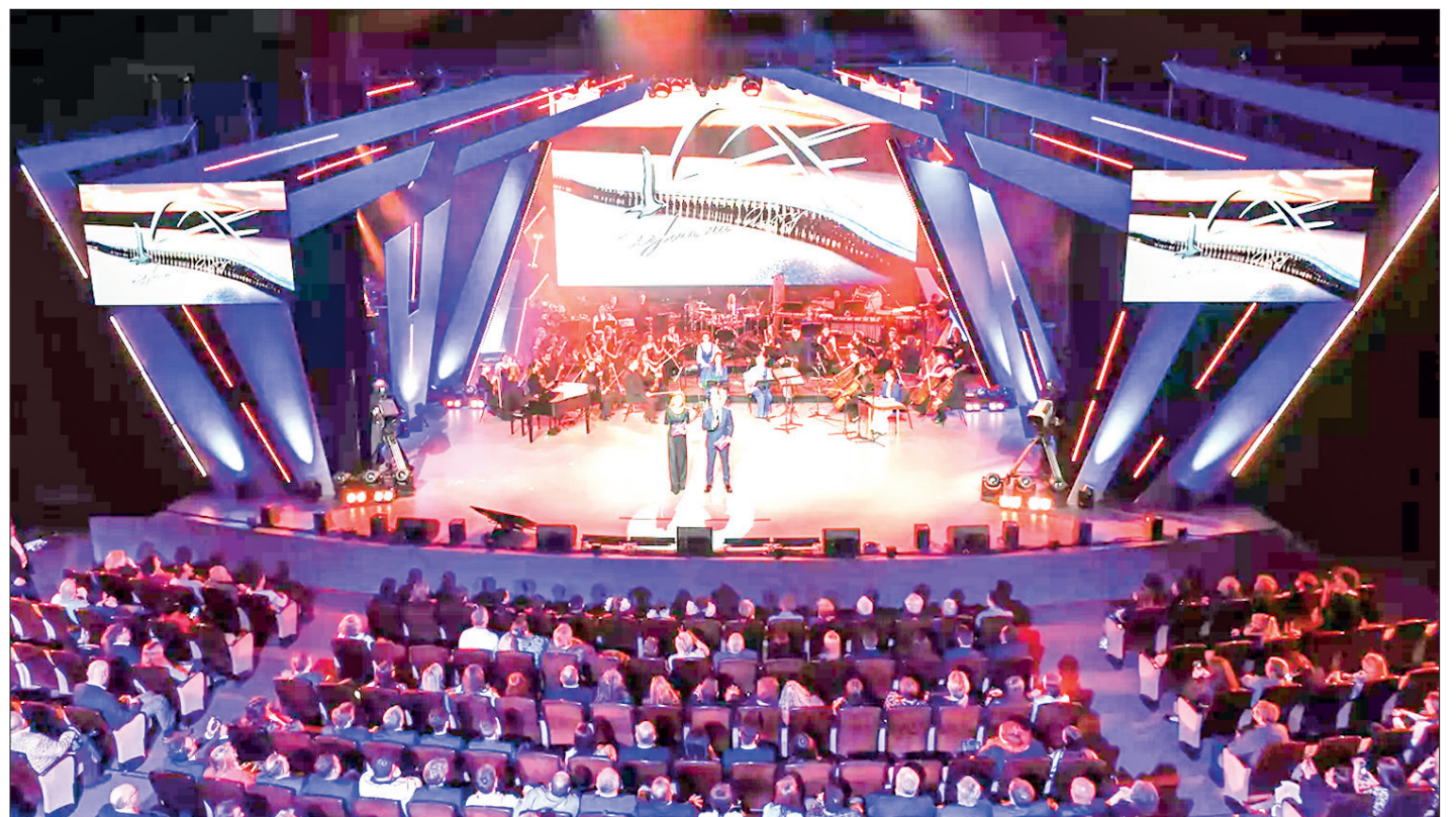
Solo performances by foreign vocalists took place on 28 April in the semi-final, with finalists teaming up for duets with Russian music and cinema stars during the final gala concert.

The festival, organized by the Russkiy Mir Foundation, received 210 applications from vocalists representing 55 countries, with 15 participants chosen after an online qualifying round.