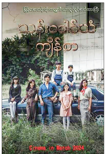
A poster of the Cambodian film ‘Midnight’s Curse’.

A Cambodian film titled ‘Midnight Curse’, featuring My-