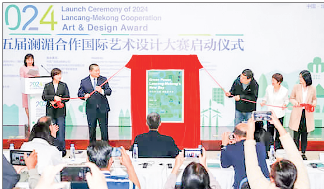
The photo captures the ceremony of the Lancang-Mekong Cooperation International Art Design Competition.

MSMEs and developing the MSMEs and local job opportunities. — Nyein Thu (MNA)/KTZH