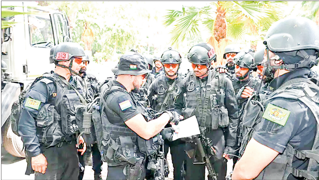
The exercise witnessed the involvement of various agencies including the Ministry of Home Affairs, the Delhi Police, the National Security Guard, and local emergency services such as the fire department and traffic police.