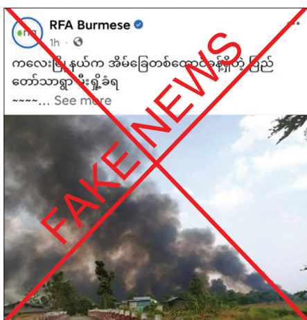
The screenshot validates false claims.

MALICIOUS media outlets spread fake news, claiming that security forces raided Pyitawtha village and torched the village in Kalay Township of Sagaing on 1 May.