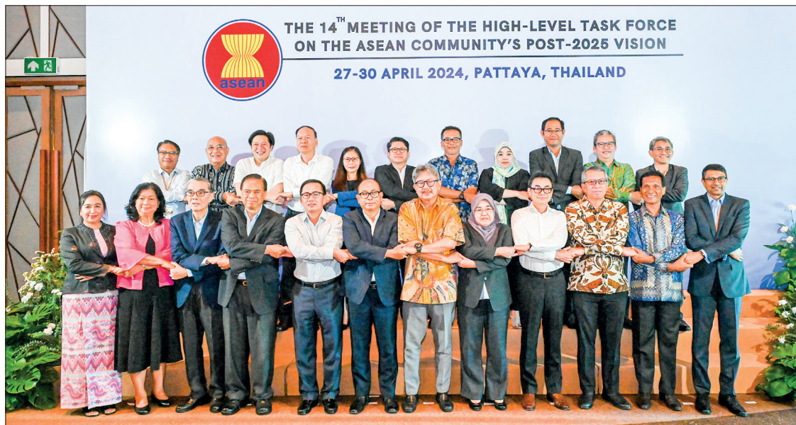
Myanmar delegates join the group documentary photo session at the 14 th (HLTF-ACV) meeting in Pattaya, Thailand on 27-30 April 2024.

Minister expressed appreciation to the Co-Chairs and the host for organizing the important Meeting. She commended high-level representatives for their efforts in completing the first reading of the APSC Strategic Plan of the ASEAN Community Vision 2045. She looked forward to its narrative format for further negotiations. On Strengthening ASEAN's Capacity and Institutional Effectiveness, the Deputy Minister highlighted the need to strengthen not only the ASEAN Secretariat but also the respective national secretariat so as to bridge the gap between human resources