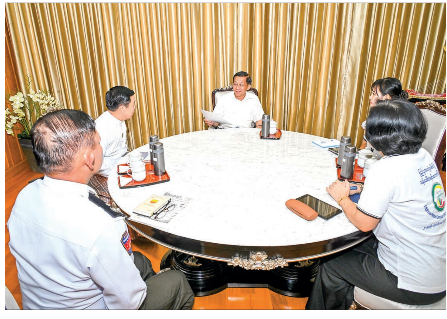
State Administration Council Chairman Prime Minister Senior General Min Aung Hlaing provides census data to enumerators led by Union Minister for Immigration & Population U Myint Kyaing (2L) in Nay Pyi Taw yesterday.

The Senior General altogether provided the needed data.