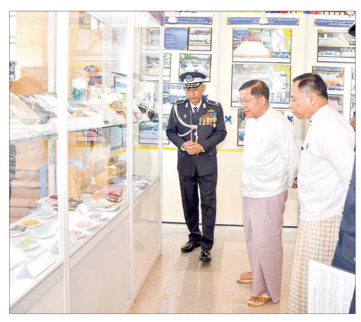
State Administration Council Chairman Prime Minister Senior General Min Aung Hlaing looks round the exhibition at yesterday's event in Nay Pyi Taw.

He underscored the functions of MPF to prevent crimes, expose the crimes to take action against offenders, manage disciplinary tasks in the country, ensure the security of the