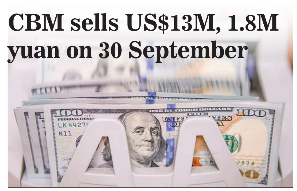
CBM aims to curb the instability in the foreign exchange market and the devaluation of currency

CBM pumped over $8.5 million and two million baht on 19 September and over 3.2 million baht on 18 September into the financial market. According to the CBM notification dated 17 September, it would sell 10 million baht to importers on 18 September.