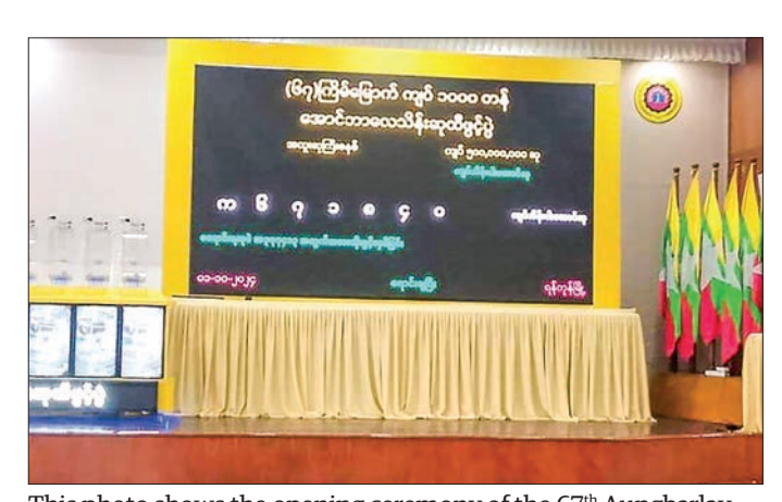
This photo shows the opening ceremony of the 67<sup>th</sup> Aungbarlay Lottery on 1 October 2024.

ON 1 October, the 67<sup>th</sup> Aungbarlay lottery took place, revealing the following winning numbers.