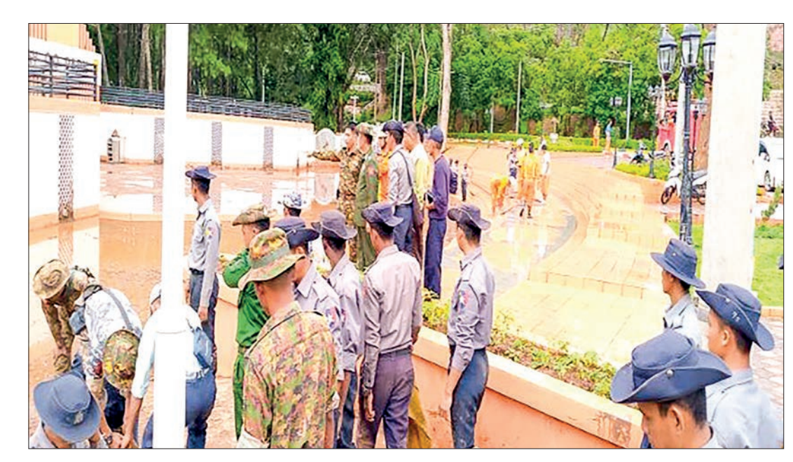
Rescue, relief and rehabilitation measures are ongoing amid the receding water.

EFFORTS for relief and recovery are proceeding vigorously in regions and states affected by flooding, including the Nay Pyi Taw Council Area. Assistance is being provided to relocate essential items for monasteries, schools, hospitals, and government buildings, while sanitation work is ongoing on local roads, bridges, and villages in Zeyathiri, Pyinmana, Lewe, and Pobbathiri townships within Nay Pyi Taw, as well as in Kalaw in southern Shan State and Loikaw in Kayah State. Members of Tatmadaw, police officers, firefighters, Red Cross personnel, and civil society organizations are collaborating with resi-