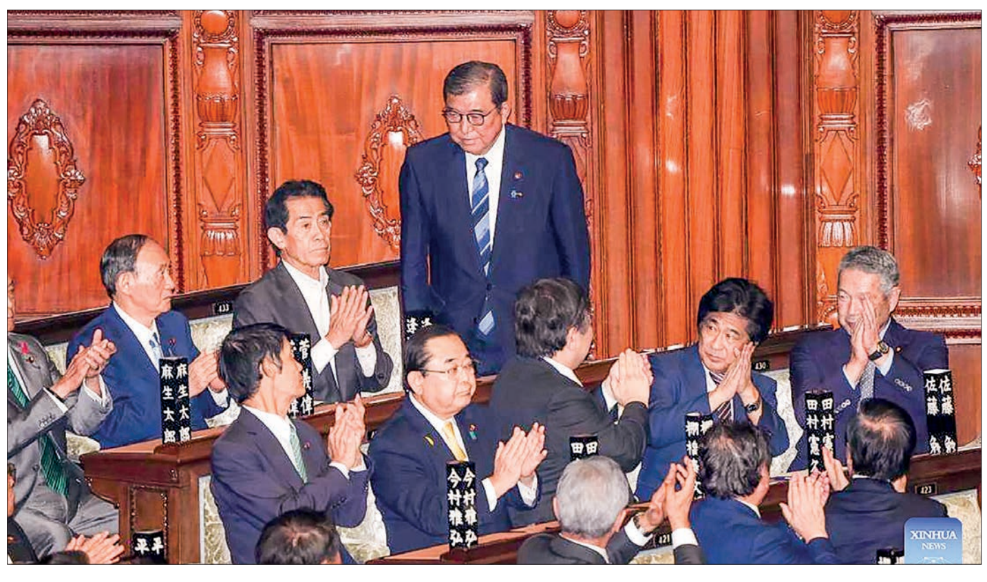
Shigeru Ishiba stands during a special Diet session in Tokyo, Japan, 1 October 2024. Shigeru Ishiba, leader of Japan's ruling Liberal Democratic Party, was officially elected the country's prime minister on Tuesday after winning a majority of votes in both houses of parliament.

German President Frank-Walter Steinmeier said that China actively responds to global challenges including the climate change, adding that it is more important than ever to carry out close and practical bilateral cooperation. He believed that Germany-China relations will continue to consolidate and deepen. – Xinhua