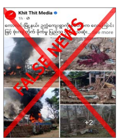
This screenshot reveals fake news.

Despite this, subversive media outlets continue to spread misinformation, aiming to create a rift between Tatmadaw and the public while concealing the utter inhumanity of the terrorists. — MNA/TRKM