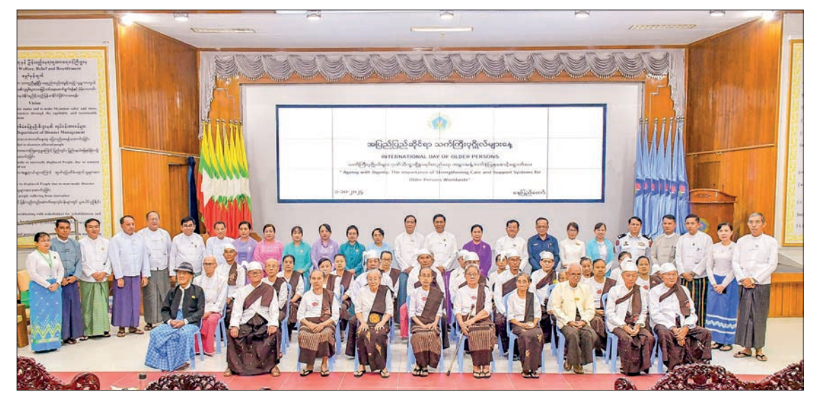
The documentary group photo of the International Day of Older Persons event held in Nay Pyi Taw yesterday.

The Union minister emphasized the need for comprehensive healthcare, support, and social services for older adults, both in Myanmar and globally. The theme for this year's 26th In-