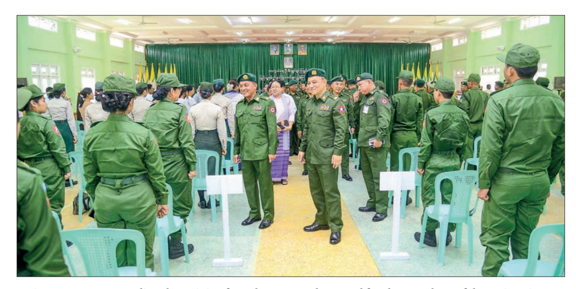
Trainees are seen attending the training for volunteer students and faculty members of the University Training Corps yesterday.

THE University Training Corps of the Directorate of People's Militia and Border Guard Force of the office of Commander-in-Chief (Army) conducted training for volunteer students and faculty members of the University Training Corps (UTC). The monsoon training opening ceremonies for UTC of the 2023-2024 academic year were opened in Nay Pyi Taw, Hmawby of Yangon,