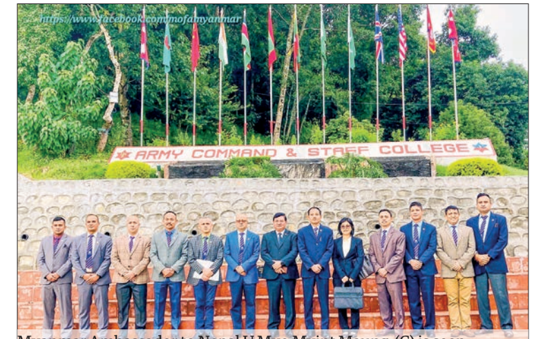
Myanmar Ambassador to Nepal U Myo Myint Maung (C) is seen alongside officials at the Army Command and Staff College of Nepal, where he gives a lecture at the 'Ambassador Talk Programme' of No 31st Command and Staff Course on 29 September 2024.

Additionally, the ambassador was present at the 45<sup>th</sup> World Tourism Day ceremony, celebrated by the Ministry of Culture, Tourism and Civil Aviation of Nepal at the Cultural Corporation Centre. — MNA/TH