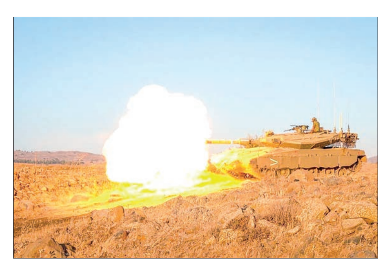
This photo released on 30 September 2024 shows Israeli troops stationed on the Israeli side of the Israel-Lebanon border. PHOTO: ISRAEL DEFENCE FORCES/HANDOUT VIA XINHUA

Katsunobu Kato, one of Ishiba's competitors in the LDP race, will take the position of finance minister, while Yoji Muto will serve as minister for economy, trade, and industry. Only two women were appointed to the cabinet: Toshiko Abe as minister of education, culture, sports, science, and technology, and Junko Mihara as minister for children's policies, reducing the number of female ministers by three compared with the Kishida cabinet. - Xinhua