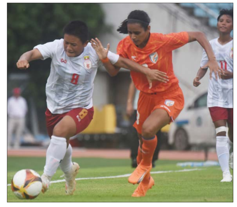
The Myanmar Women's National Team in action against the Indian Women's National Team in June.

The West Asian group matches will take place from 26 October to 1 November, while the East Asian group matches will be held from 27 October to 2 November. The group matches will be conducted simultaneously, with the quarterfinals and finals being single matches. — Ko Nyi Lay/KZL