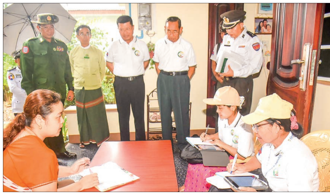
State Administration Council Member Mahn Nyein Maung views the Nationwide Census Collection process in Pathein yesterday.

In Ayeyawady Region, the 2024 population and housing census is being conducted across 26 townships, 302 wards, and 1,920 village-tracts, covering a total of 14,296 household enumeration areas. A total of 1,022 enumeration teams, 1,150 supervisors, and 4,328 enumerators are involved in the process, alongside supporting groups, including ethnic literature and cultural associations, 426 ethnic language teachers, and 49 university faculty and students, as well as community leaders, household heads, and fire brigade members. — MNA/KZL