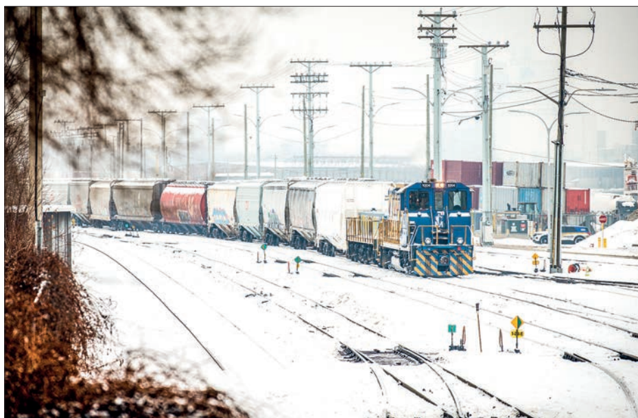
(FILES) A freight train is seen near the Port of Montreal in Montreal, Canada, on 3 February 2025.

Trump has also signed plans for sweeping "reciprocal tariffs" that could hit both allies and adversaries. — AFP