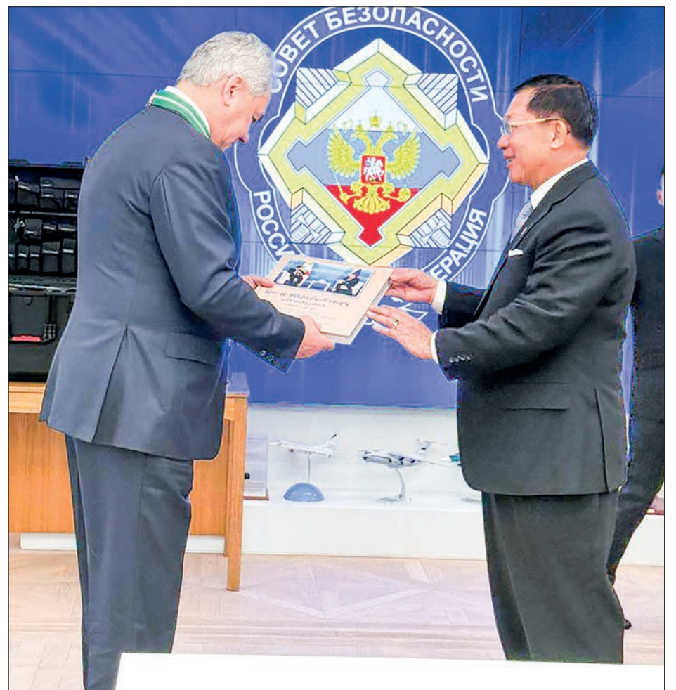
Russian Security Council Secretary Mr Sergey Kuzhugetovich Shoigu and Chairman of the State Administration Council Prime Minister Senior General Min Aung Hlaing exchange gifts.