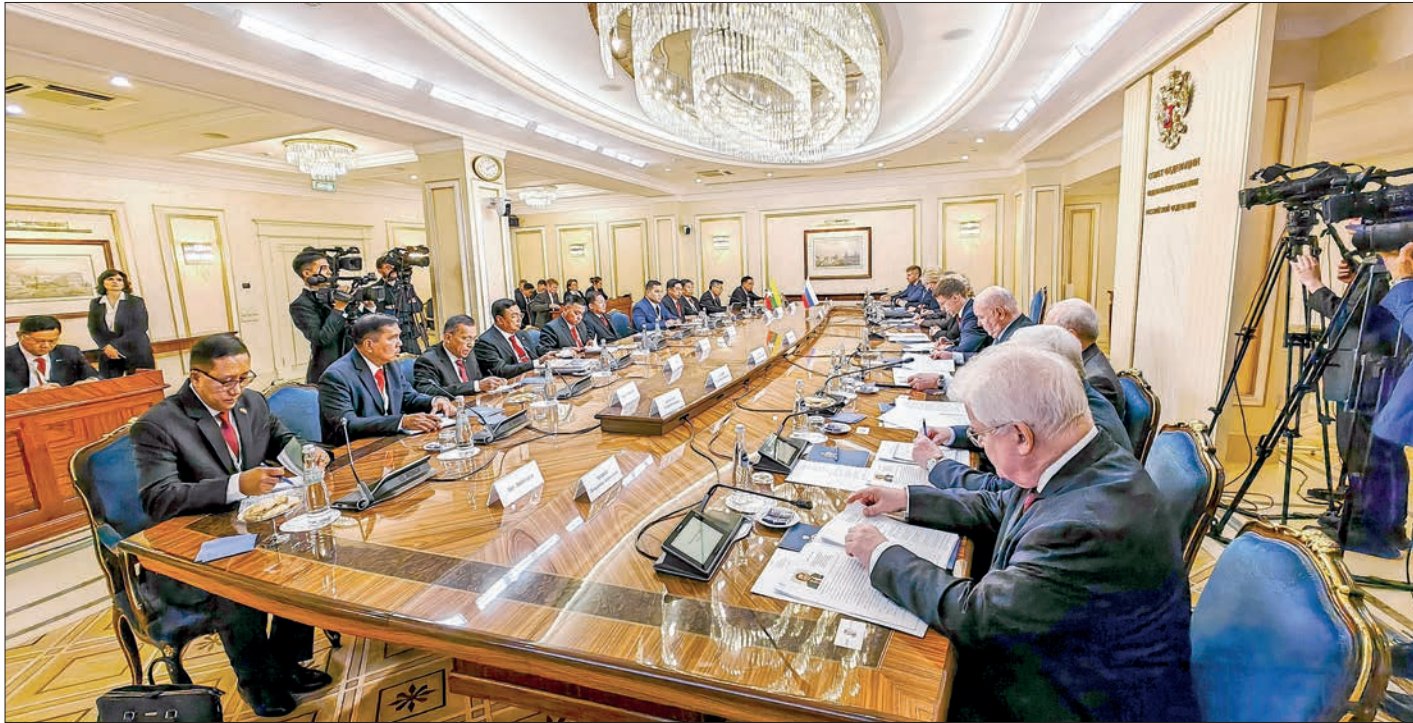
Chairperson of the Council of the Federal Assembly Ms Valentina Matviyenko has a discussion with State Administration Council Chairman Prime Minister Senior General Min Aung Hlaing in Moscow, the Russian Federation, yesterday.

Afterwards, the Senior General posed for a documentary photo together with the Chairperson and attendees.