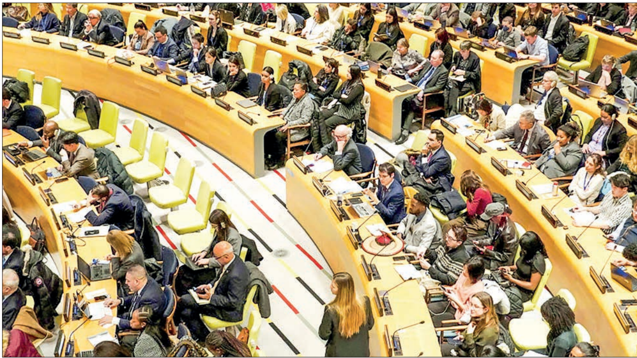
The third meeting of the state parties to the 2021 Treaty on the Prohibition of Nuclear Weapons is held in New York on 3 March 2025.

THE state parties to a UN treaty on banning nuclear weapons met in New York on Monday, with a Hiroshima atomic bomb survivor's son repeating his call for the eradication of such arsenals.