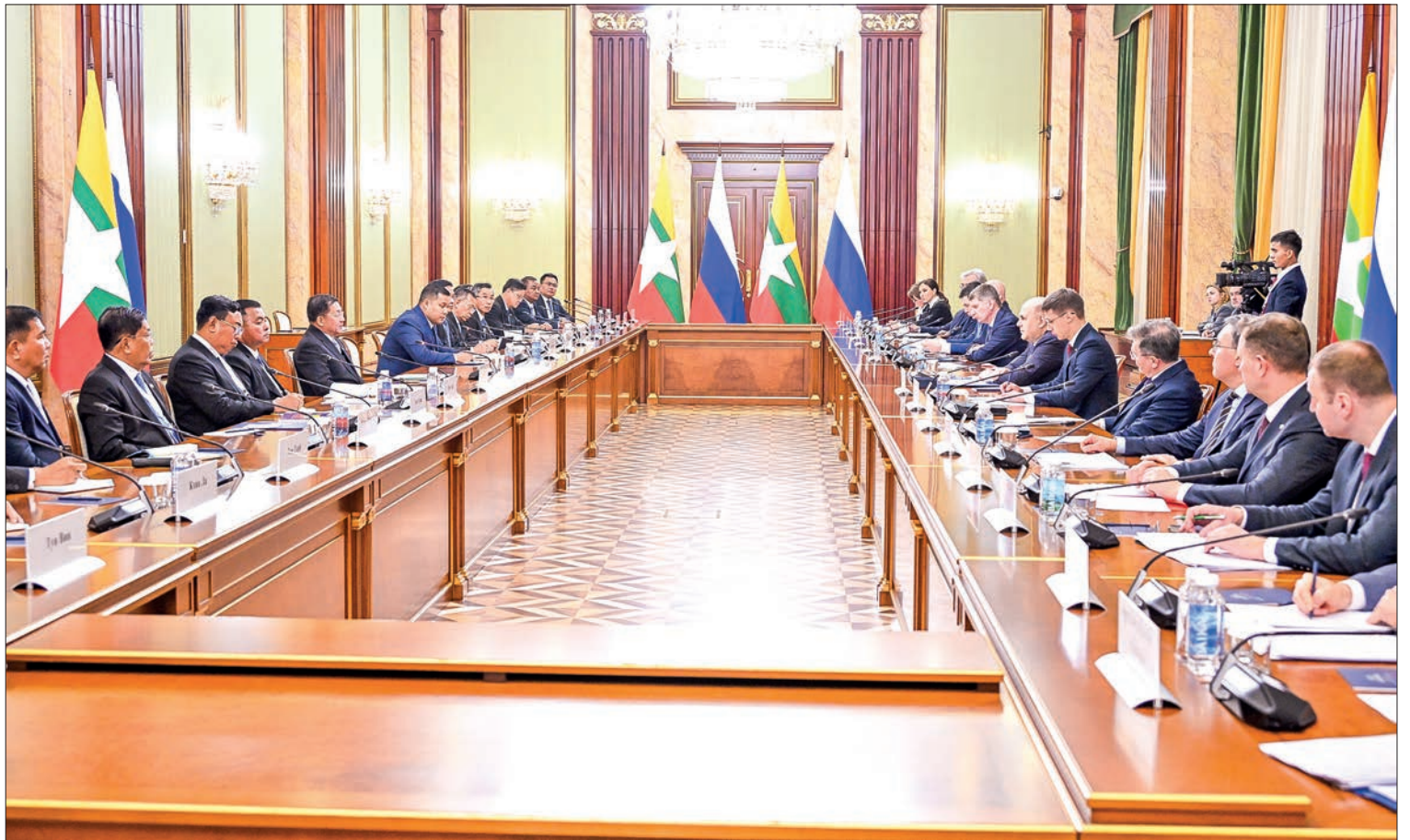
Prime Minister of the Russian Federation Mr Mikhail Vladimirovich Mishustim discusses with Chairman of the State Administration Council Prime Minister Senior General Min Aung Hlaing at the meeting hall of the Russian Federation Government House yesterday afternoon.