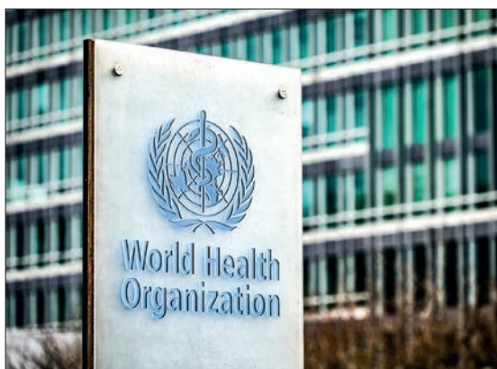
This photograph taken on 2 December 2021 shows a sign of the World Health Organization (WHO) next to theirs headquarters, in Geneva.

The United Nations health agency said it was