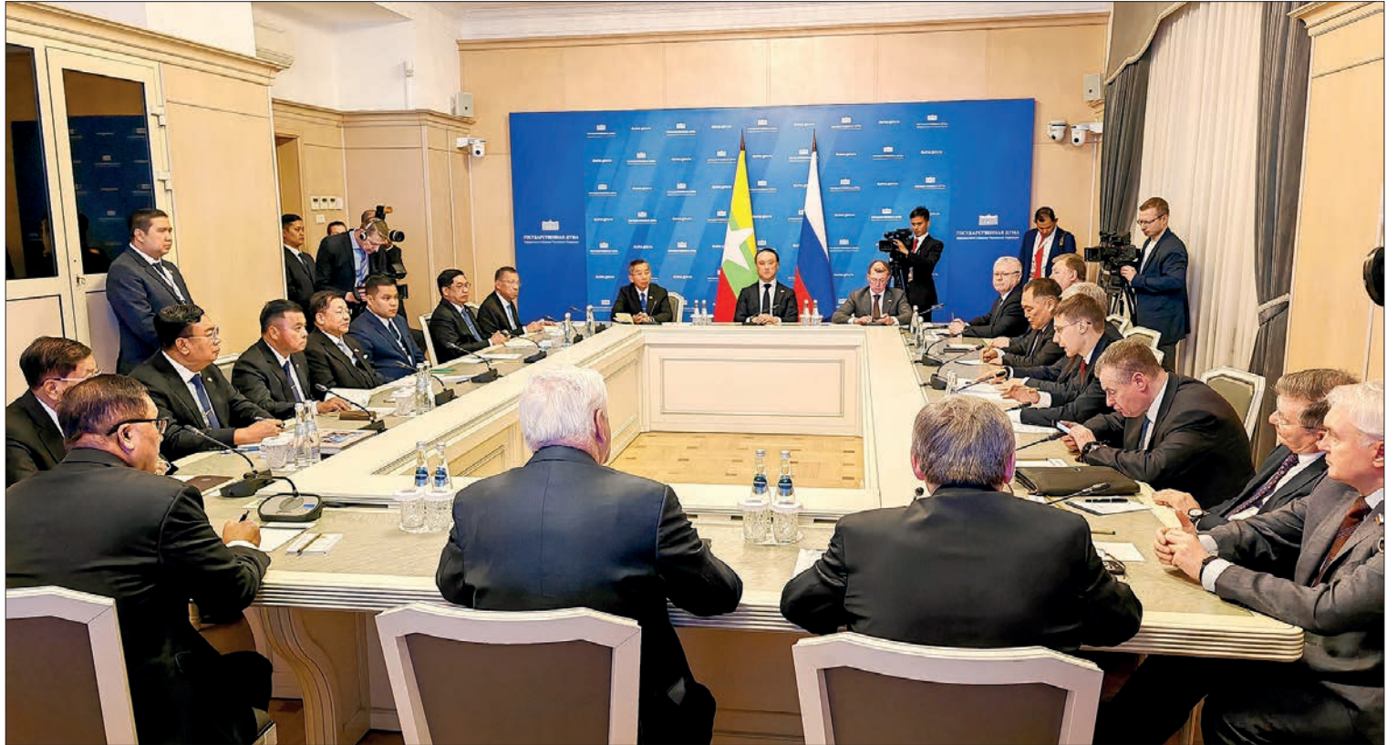
Mr Vyacheslav Volodin, Chairman of the State Duma of the Russian Federation, holds a meeting with Chairman of the State Administration Council Prime Minister Senior General Min Aung Hlaing, at the meeting hall of the State Duma yesterday morning.

At the meeting, they talked about functions of the State