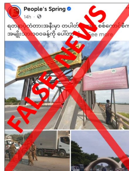
This screenshot discloses misinformation.

The false reports are part of a wider effort by PDF terrorists to disrupt peace in local communities. Authorities, in collaboration with residents, are conducting necessary security checks and patrols. These illegal media outlets are attempting to