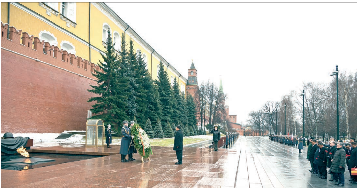
Chairman of the State Administration Council Prime Minister Senior General Min Aung Hlaing pays tribute at the Tomb of the Unknown Soldier in Moscow yesterday morning.

CHAIRMAN of the State Administration Council Prime Minister Senior General Min Aung Hlaing, who is currently in Moscow, the Russian Federation, on his official visit, paid tribute at the Tomb of the Unknown Soldier in Moscow yesterday morning.