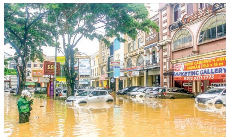
An online motorcycle taxi driver uses a smartphone while standing in the middle of the flood where several cars are submerged at the Grand Galaxy Shopping Area in Bekasi, West Java, on 4 March 2025.

"The heavy rain was caused by the detection of atmospheric waves such as the Equatorial Rossby wave and the Kelvin wave, followed by the formation of a low-pressure area and the convergence of several wind patterns from various directions," said Karnawati. — Xinhua