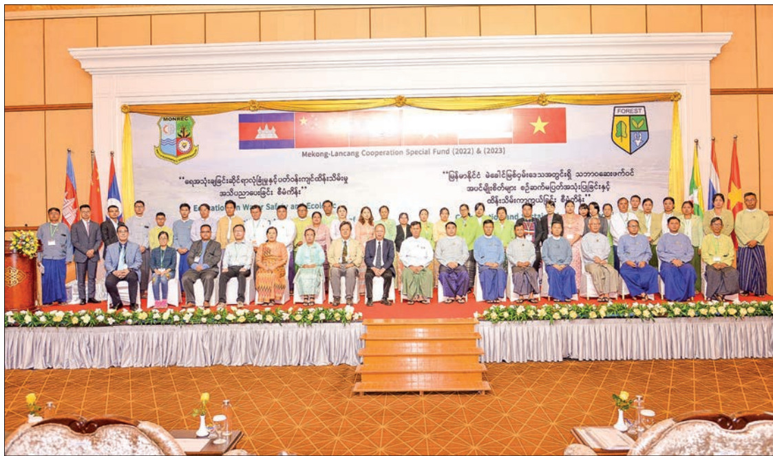
Attendees of the “Project Completion Workshop” and the “Regional Workshop” of the Mekong-Lancang Cooperation Special Fund (2022) pose for the documentary group photo at Hotel Max in Nay Pyi Taw yesterday.

A commemorative video showcasing projects implemented under the Mekong-Lancang Cooperation Special Fund was screened, followed by project officials explaining their respec-