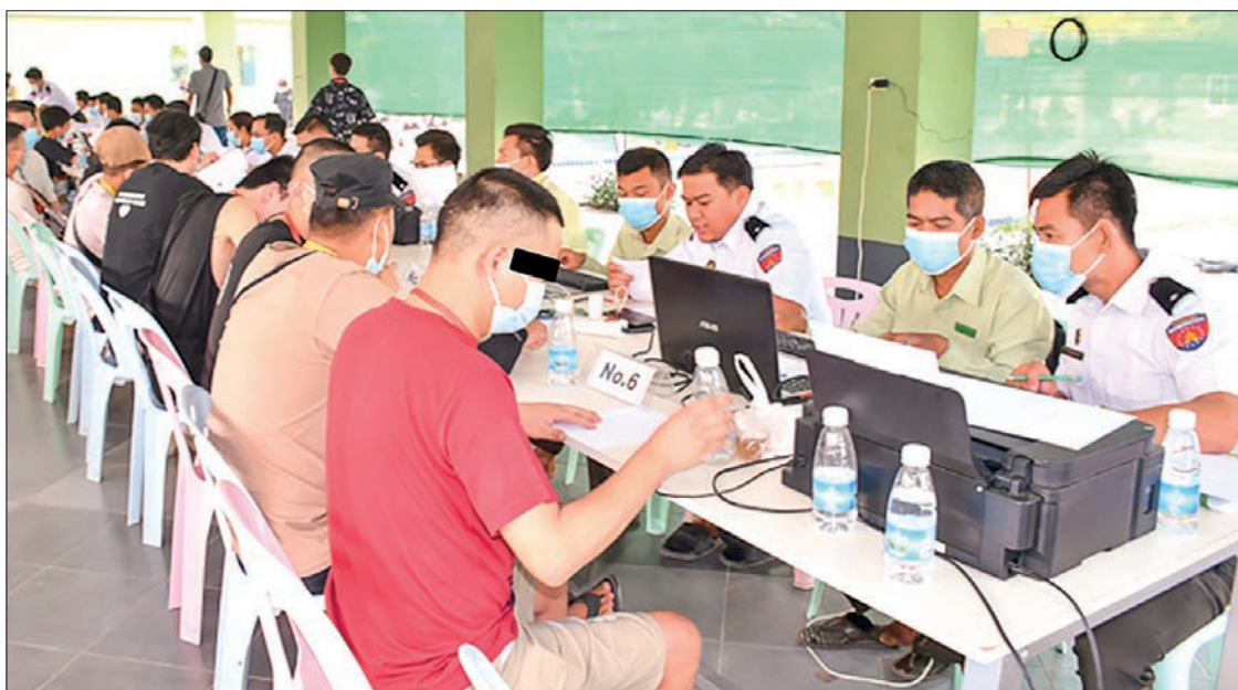
Immigration processing undocumented foreign migrants.

As part of these efforts, authorities detained 265 foreign undocumented entrants yesterday in Myawady-Shwe Kokko, who had crossed into Myanmar through illegal routes. Officials are now collecting the necessary personal information and records to facilitate their prompt repatriation to their respective countries. Kayin State government's Minister for Security and Border Affairs Colonel Min