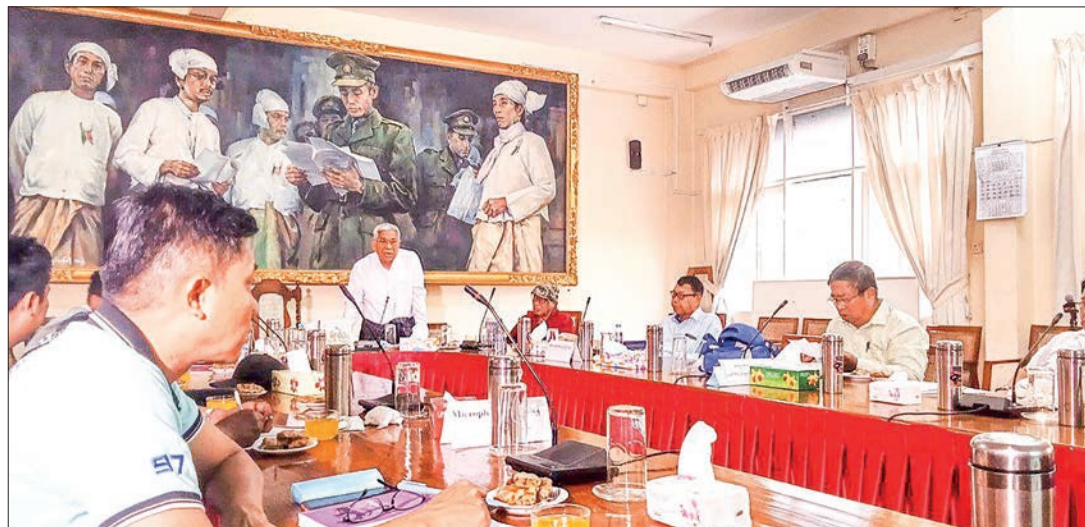
This photo showcases the media briefing held at the MMPO office on 4 March.

In addition, as a special programme, the Myanmar Motion Pictures Museum will also open on that day. — MT/TH