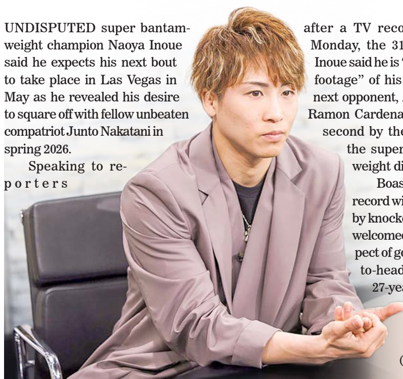
Japanese boxer Naoya Inoue is pictured during the recording of a television programme on 3 March 2025.

For 2025, the "Monster" stated he is anticipating a match with Uzbekistan's interim WBA champ Murodjon Akhmadaliev in September in Japan before moving up a division to face WBA featherweight belt holder Nick Ball of Britain in December in Saudi Arabia. — Kyodo