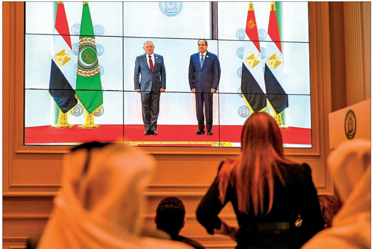
People watch on a big screen as Egypt's President Abdel Fattah al-Sisi (R) welcomes Jordan's King Abdullah II ahead of an Arab League summit on Gaza on 4 March 2025.

Egyptian President Abdel Fattah al-Sisi and Bahrain's King Hamad are expected to deliver opening remarks, according to a scheduled shared by the Arab