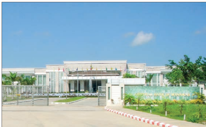
The facade view of the Central Bank of Myanmar (CBM) in Nay Pyi Taw.

THE Central Bank of Myanmar (CBM) announced on 3 March that it will inject $23 million and 150 million baht into the fuel oil sector.