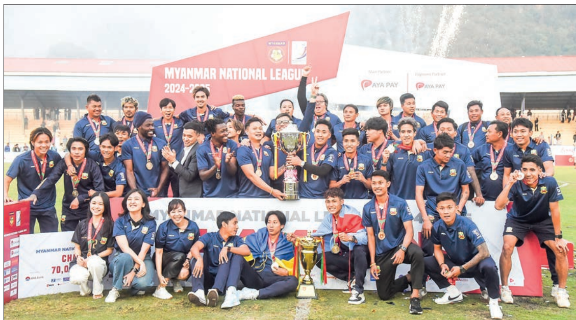
Shan United celebrating their 2024-2025 MNL championship win.

Shan United will play their first leg of the quarterfinals away on 6 March, followed by the second leg on 13 March at Thuwunna Youth Training Centre in Yangon. The club secured its spot in the quarterfinals by