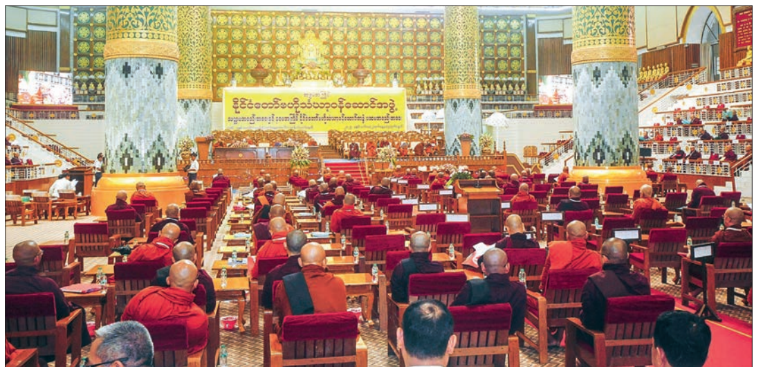
The first meeting of the ninth State Central Sangha Working Committee in progress yesterday in Yangon.

THE Ninth State Central Working Committee of the Sangha held its first meeting at Maha Pasana Cave on Thiri Mingala Kaba Aye Hill in Mayangon Township, Yangon Region, yesterday morning.