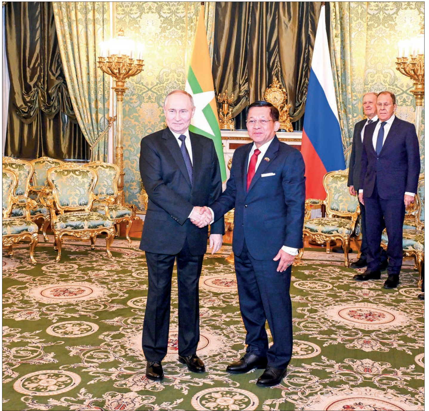
President of the Russian Federation Vladimir Vladimirovich Putin welcomes Myanmar's Prime Minister Senior General Min Aung Hlaing at Kremlin Palace in Moscow yesterday.

The Prime Minister's visit to Russia is expected to significantly strengthen bilateral ties and foster enhanced cooperation across multiple sectors, including trade, economy, health, energy, security, and cultural exchange.