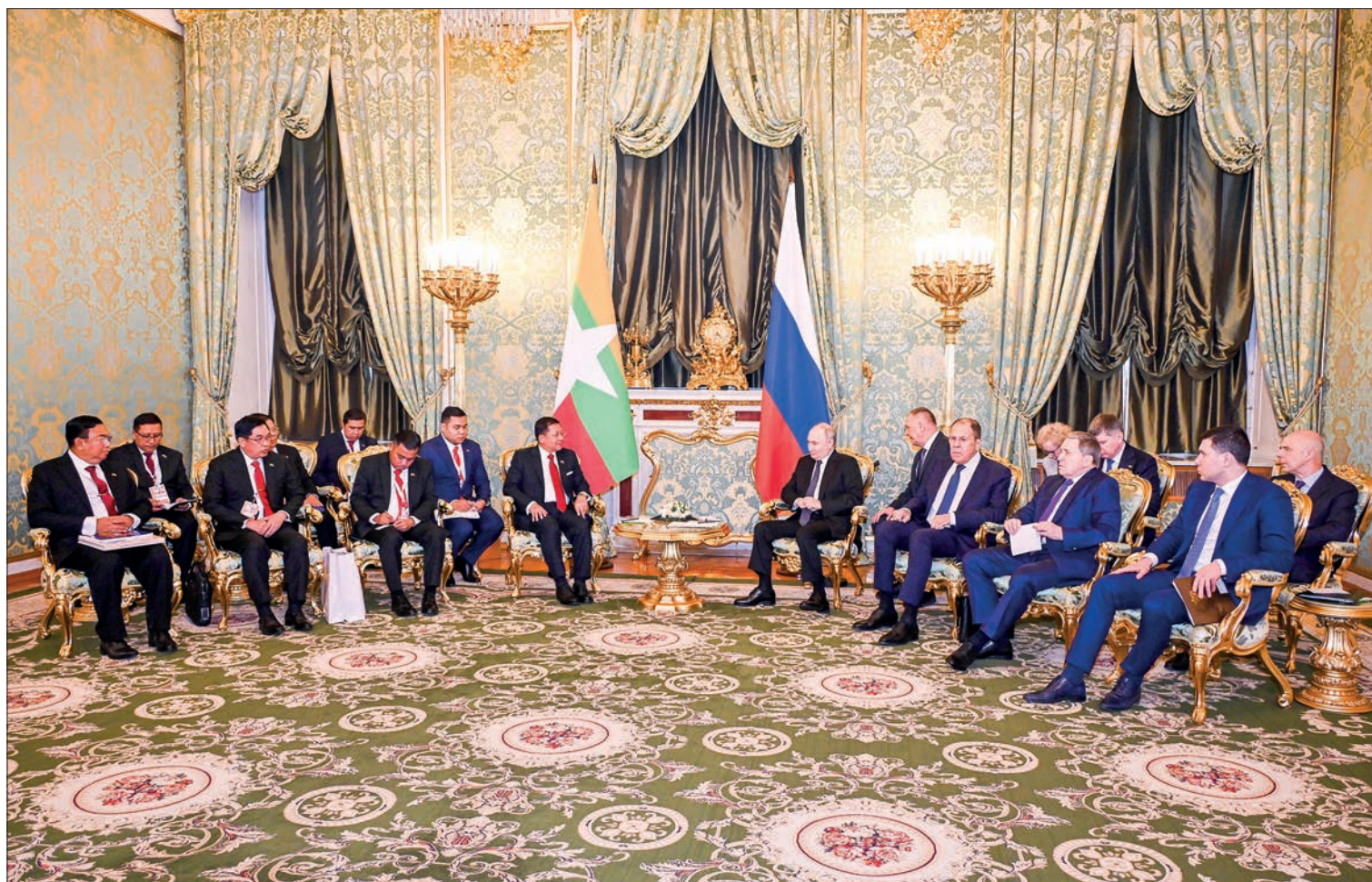
Russian President Vladimir Vladimirovich Putin hosts Myanmar's Prime Minister Senior General Min Aung Hlaing for a historic meeting and discussions in Moscow.

They also exchanged views on the enhancement of friendly relations and cooperation between the two countries, man-