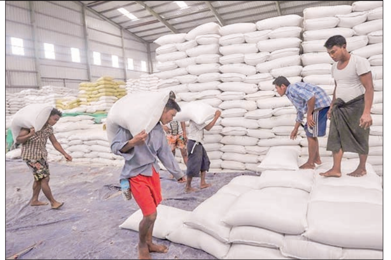
Diligent workers stack rice bags in a Yangon warehouse.

Additionally, MRF will support pedigree seeds and cultivation inputs to help farmers who suffered damage recover from flood damage.