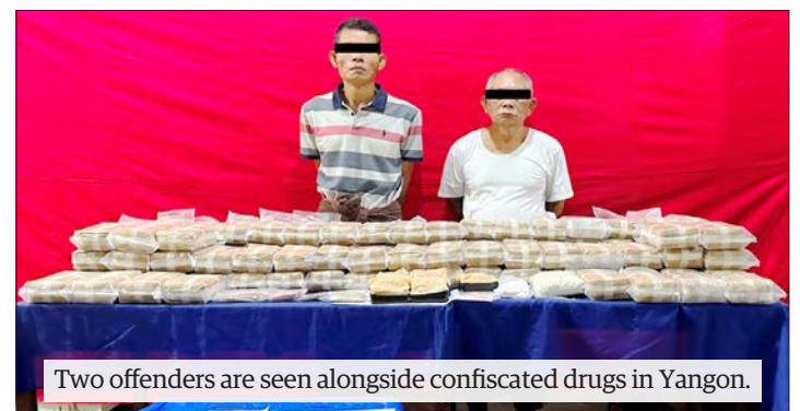
Two offenders are seen alongside confiscated drugs in Yangon.

with a combined value of over K2.41 billion. Legal action has been taken under the drug and anti-money laundering laws. — MNA/TMT