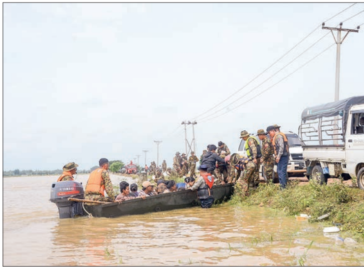
This photo shows the evacuation of flood victims during ongoing search and rescue operations.

The torrential rain has caused water levels in creeks and rivers to rise, resulting in flooding across wards and villages in 56 townships within Nay Pyi Taw Council Area, Kayah State, Kayin State, Bago Region, Magway Region, Mandalay Region, Mon State, Shan State, and Ayeyawady Region. The flood has damaged roads, bridges,