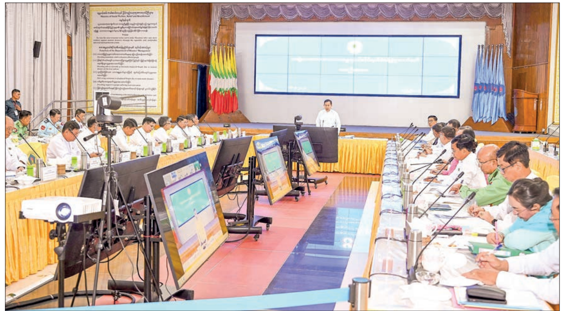
The second meeting of the National Disaster Management Committee is in progress yesterday, chaired by SAC Vice-Chairman Deputy Prime Minister Vice-Senior General Soe Win.

The relevant organizations and officials provided rescue work in flood-affected areas. According to the 15 September report, the death rates in 69 townships of seven regions and states showed that there were