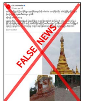
This screenshot validates misinformation.

based on information from residents seeking peace. The damage to pagodas is attributed to terrorists themselves, who have been known to attack sacred Buddhist sites using backhoes, taking refuge in pagodas during fights, and dropping bombs. Locals are aware of these acts of terrorism. The subversive media, which supports terrorism, is spreading false information to obscure terrorists' actions and mislead the public about Tatmadaw. — MNA/TRKM