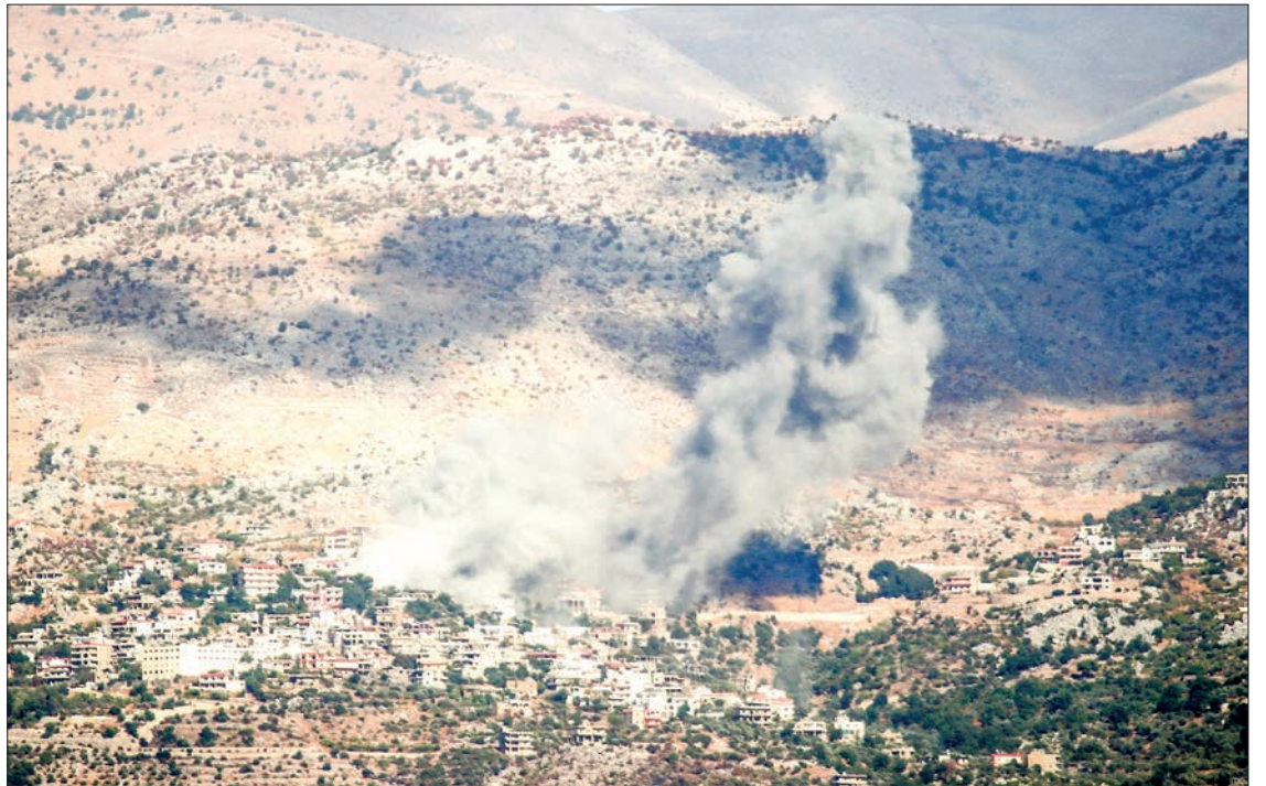
A smoke plume billows during Israeli bombardment on the village of Kfarshuba in south Lebanon near the border with Israel on 16 September 2024 amid ongoing cross-border tensions as fighting continues between Israel and Hamas in the Gaza Strip.

Gaza's civil defence agency said six Palestinians were killed in a similar air strike during the night on a house belonging to