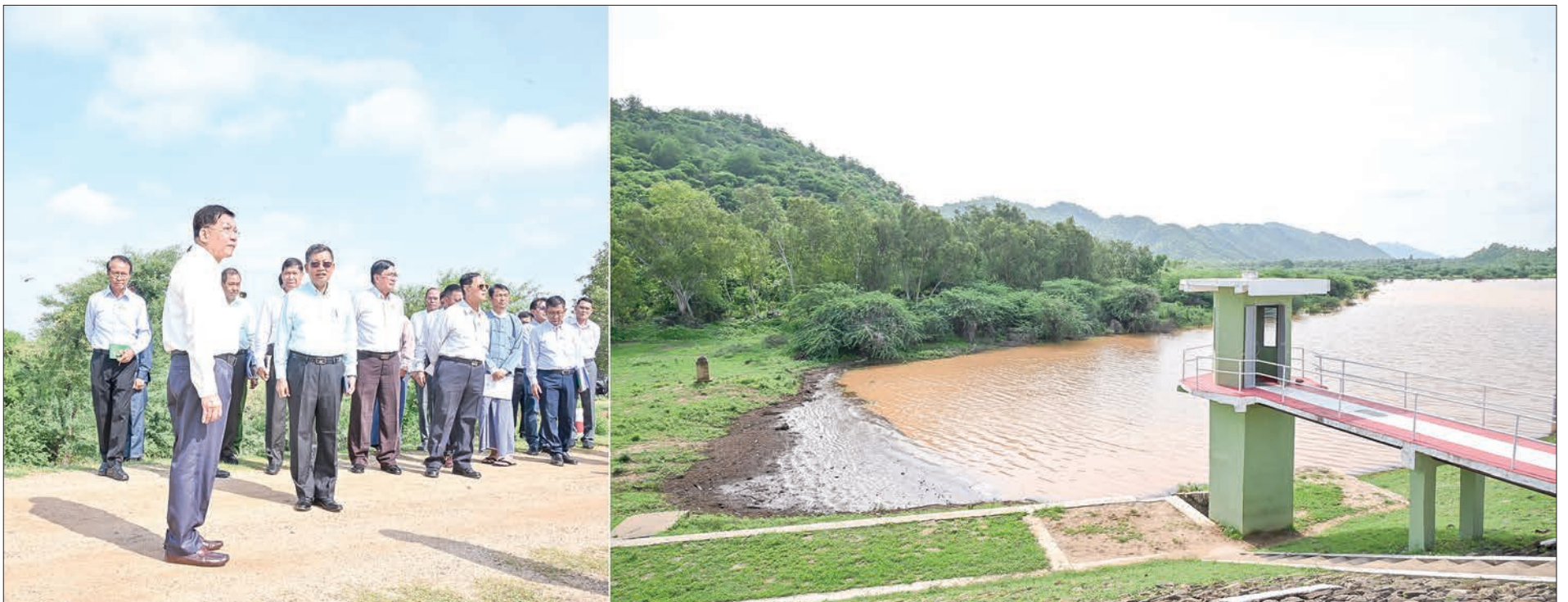
State Administration Council Chairman Prime Minister Senior General Min Aung Hlaing views round the Emerald Lake and its vicinities yesterday.

Senior General Min Aung Hlaing stressed that seasonal crop cultivation, which may reduce the inflow of water volume into the lakes, must be located at a set distance from the lake under the disciplines and laws.