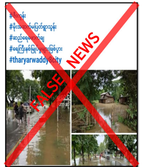
This screenshot proves misinformation.

An official from the relevant irrigation department has stated that the dam has not been drained. If the dam were to overflow or require breaching, authorities would be informed immediately. A notification would then be issued, and residents would be evacuated as a safety measure. The official added that such procedures cannot be undertaken independently. The news was deliberately fabricated to mislead the public and tarnish the government's reputation. — MNA/TRKM