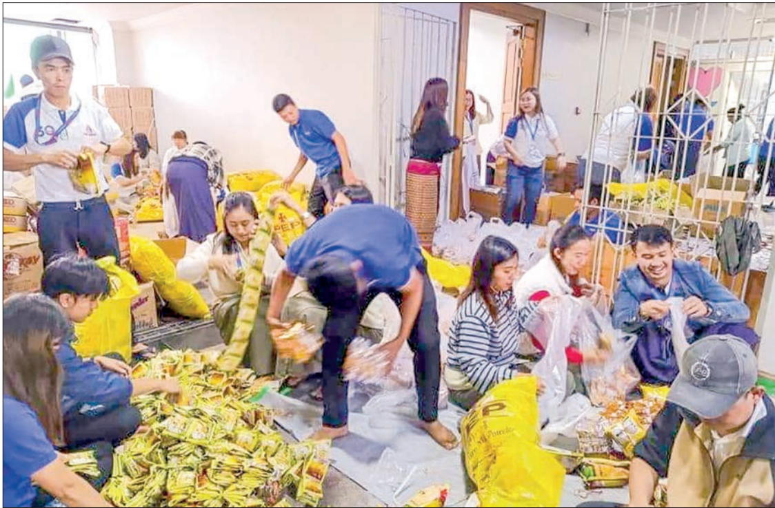
This photo shows packing foodstuffs and relief supplies to donate to the people affected by the floods.

KBZ Bank Ltd has donated K10 billion for the relief and rehabilitation of people in flood-hit areas in Myanmar during September 2024.