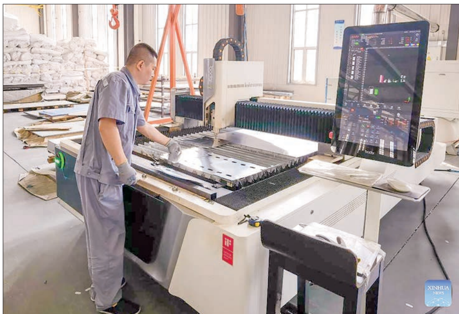
A man works at a workshop in Tianjin Carlieuklima Heat Energy Equipment Manufacturing Co Ltd, in north China's Tianjin, 11 September 2024.

Since its entry into the Chinese market in 2013, Carlieuklima has provided customized radiant