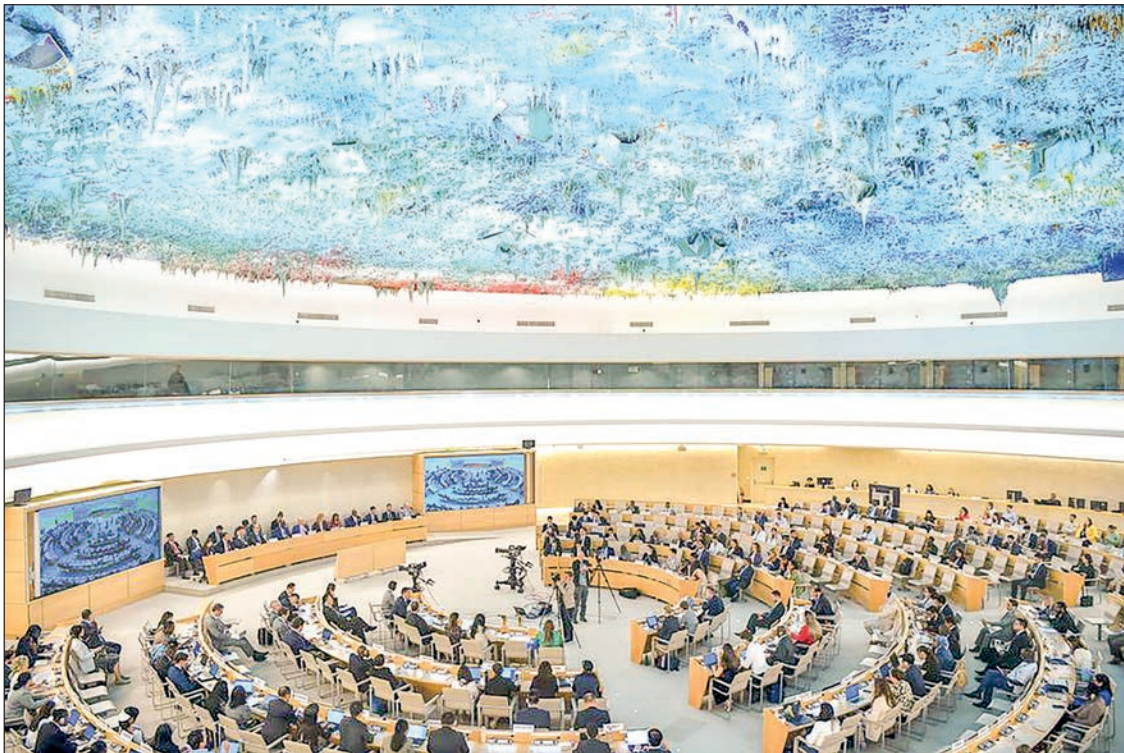
This photo taken on 4 July 2024 shows a view of the 56 th session of the United Nations (UN) Human Rights Council in Geneva, Switzerland.

“TO my regret, sanctioning states deny the existence of the humanitarian and often disastrous impact of unilateral sanc-