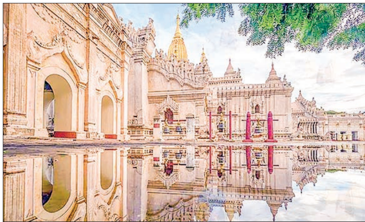
This photo shows a picture being included in the photo exhibition.

Leading patron Sayadaw of Nanda Aungmyay Foundation and will-wishers plan to make further donations for people from the flood-affected areas.