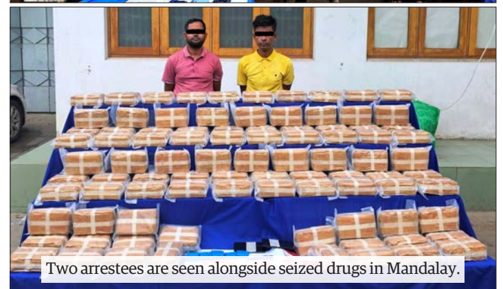
Two arrestees are seen alongside seized drugs in Mandalay.