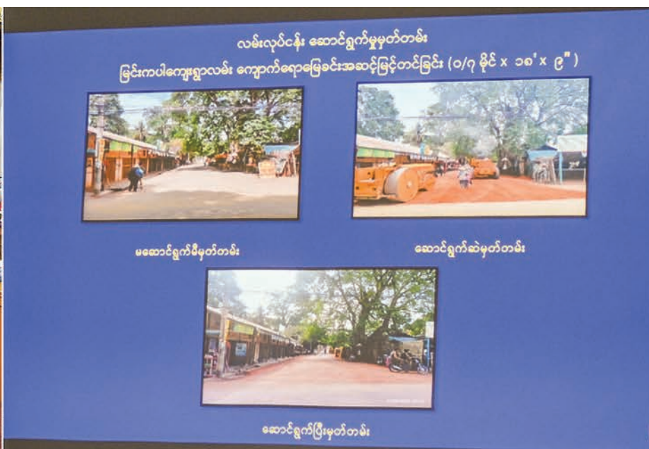
State Administration Council Chairman Prime Minister Senior General Min Aung Hlaing hears the report on the upgrading of roads during the meeting with departmental officials of NyaungU District yesterday.