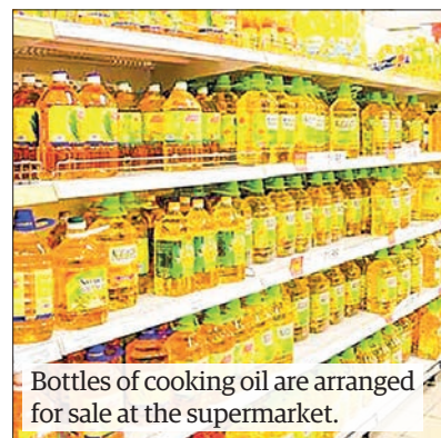
Bottles of cooking oil are arranged for sale at the supermarket.

Consumer Affairs Department under the Ministry of Commerce informed the consumers of lodging the complaints for overcharging through the call centre hotline in late August. The department urges consumers not to buy palm oil at high prices. The Committee notified that any person who is involved in price gouging and oil storage to attempt market ma-