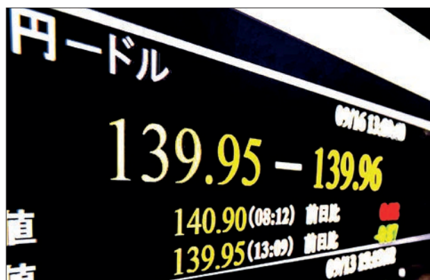
A financial data monitor in Tokyo shows the US dollar trading in the 139 yen level on 16 September 2024. PHOTO: KYODO

Heat Energy Equipment Manufacturing Co Ltd — positioning the factory as a major global production base. — Xinhua