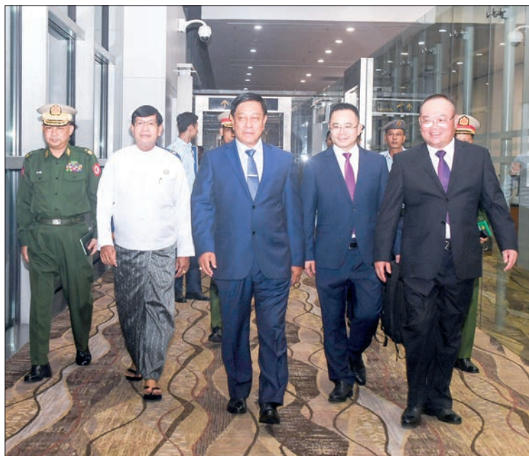
SAC Member Union Defence Minister Admiral Tin Aung San (C) is seen upon his arrival back from China yesterday.

THE Myanmar delegation led by State Administration Council Member Union Minister for Defence Admiral Tin Aung San arrived back in Myanmar on 15 September after attending the 11 th Beijing Xiangshan Forum.