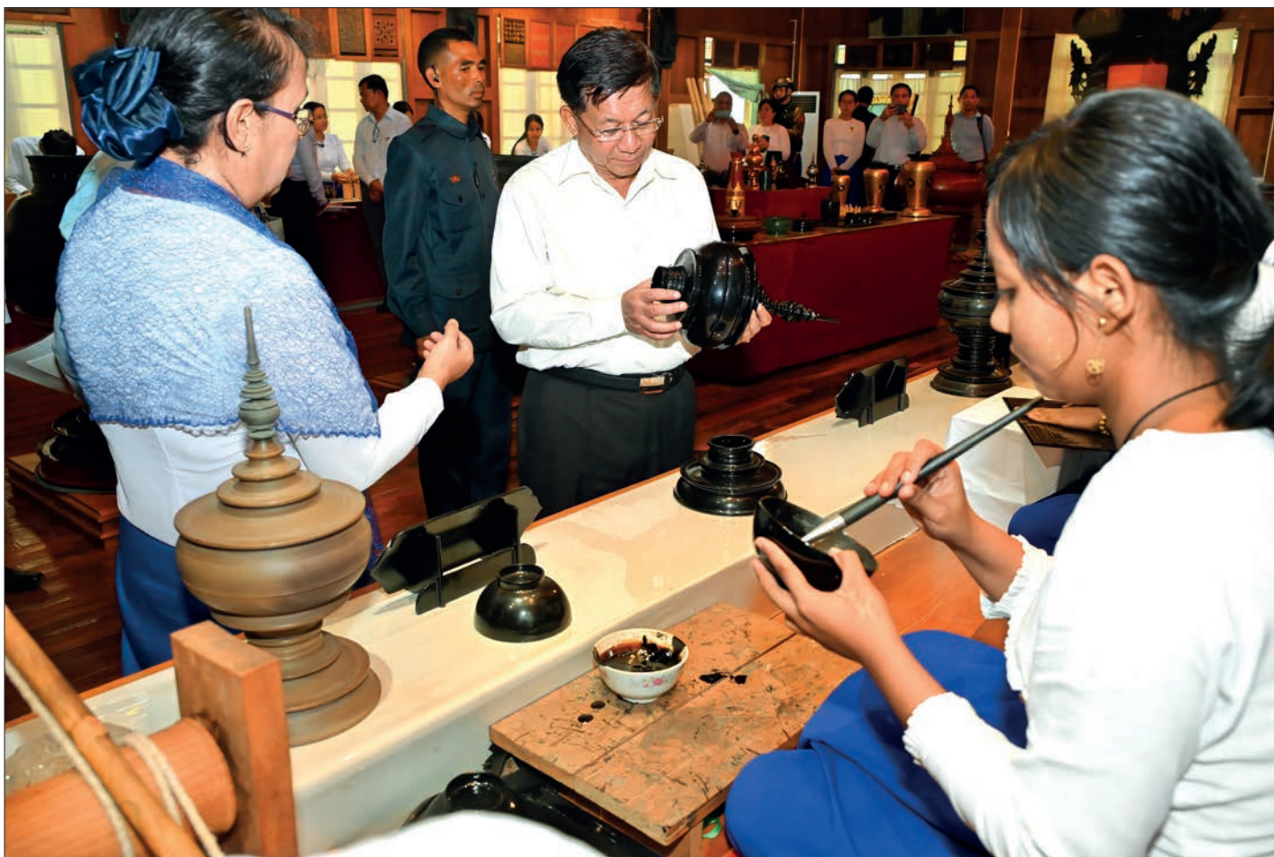
State Administration Council Chairman Prime Minister Senior General Min Aung Hlaing examines lacquerware created by trainees at the Lacquerware Technology College in NyaungU District yesterday.

Salient points from the speech delivered by the Senior General at the meeting with departmental officials in Bagan