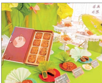
This photo showcases the display of mooncakes at the festival.

union and prosperity according to Chinese culture.