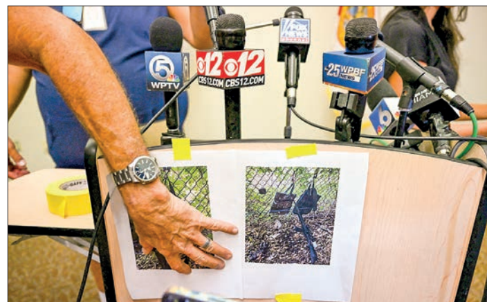
Pictures of evidence found at the fence of US president Donald Trump’s golf course are shown at a press conference in West Palm Beach, Florida, on 15 September 2024 following a shooting incident at former US president Donald Trump’s golf course.

KAMALA Harris and Donald Trump head into a newly intense phase of the US presidential campaign on Monday, with tensions heightened after a second apparent assassination attempt against the Republican former president.