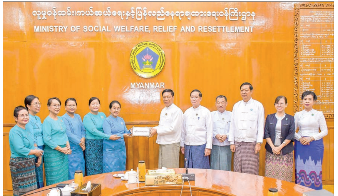
The donation ceremony for the flood-battered areas is in progress yesterday, attended by Union Minister for Social Welfare, Relief and Resettlement Dr Soe Win.

Additionally, the Myanmar ambassador to Thailand, diplomatic staff, companies in Thailand, Myanmar workers in Thailand, and other donors contributed 500 rice bags. The Ministry of Foreign Affairs donated 100 rice bags, and Ko Thiha (Nay Pyi Taw) donated 6,000