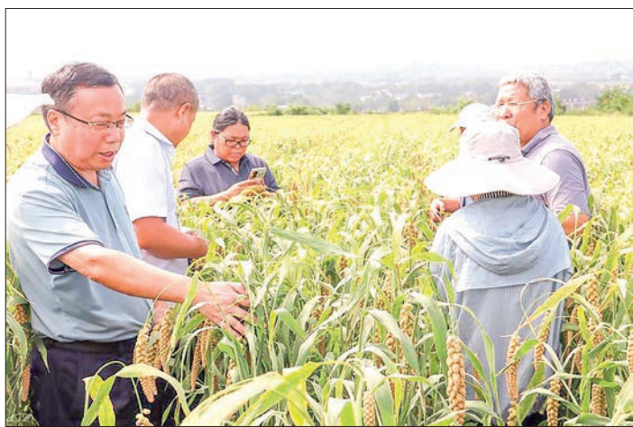
Experts check the growth of the new foxtail millet variety, Zhonggu 25, cultivated in a demonstration field in central China's Henan Province, 10 September 2024.

CHINESE agricultural scientists have developed a new variety of foxtail millet, setting a summer yield record, with the breakthrough expected to provide strong support for boosting grain production and revitalizing the country's millet industry.