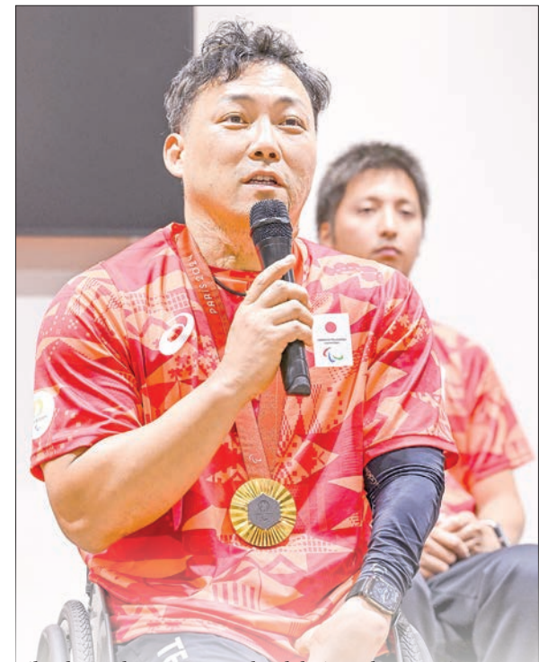
File photo shows Japan wheelchair rugby captain Yukinobu Ike speaking at Tokyo's Haneda airport after returning from the Paris Paralympics on 5 September 2024.

"I'm happy to be able to tell you that if you keep trying and don't give up, your dreams will come true," he said.