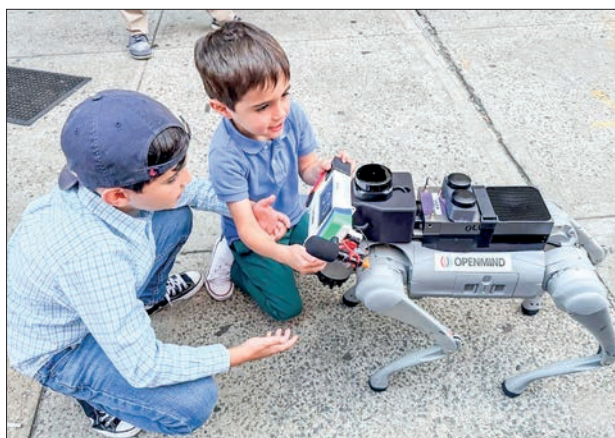
Children interact with a robotic dog outside the KOID Shop in New York City. PHOTO: XINHUA

Once filled, the stuffed fried tofu is ready to serve and enjoy as an exceptionally tasty traditional Myanmar snack. — MOON