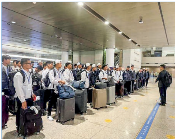
More than 120 Myanmar EPS workers are seen arrival at the Incheon International Airport.

The labour attaché from the embassy in Seoul welcomed them, advised them what they should