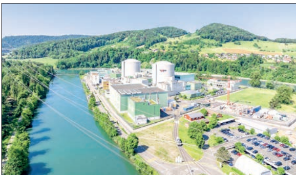
The temperature of the Aare River reached 25C.