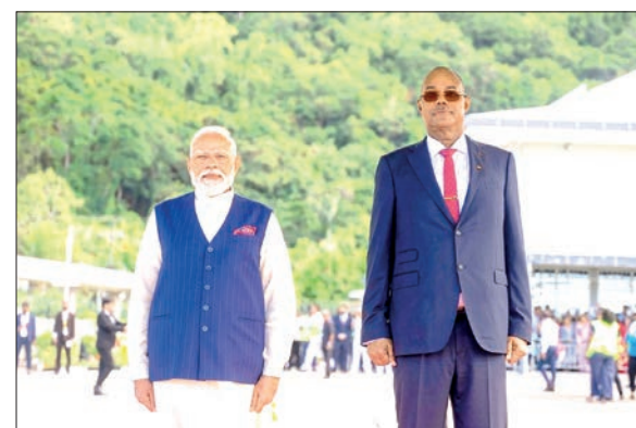
Prime Minister Narendra Modi meets Seychelles President Patrick Herminie, in Victoria on Sunday.