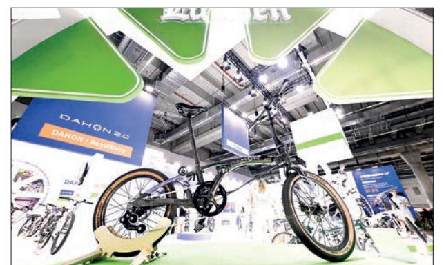
A foldable bike is seen at the booth of Dahon at the EUROBIKE 2026 fair of the international bicycle industry in Frankfurt am Main, western Germany on 24 June 2026.

Canyon is also collaborating with Volkswagen on a system to enable bicycles to communicate with cars and infrastructure, though widespread adoption faces hurdles due to the limited vehicle readiness. — AFP