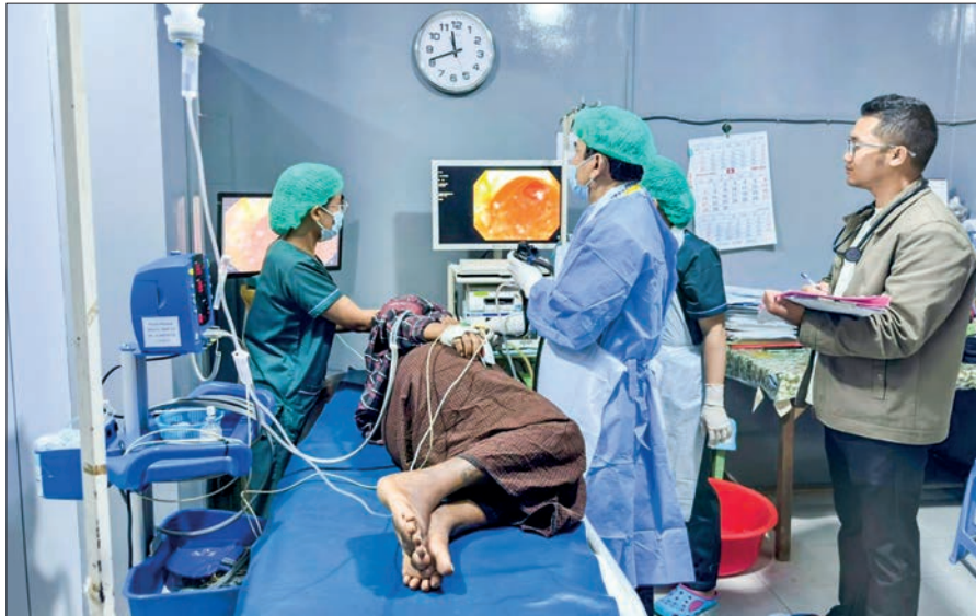
The specialist and health staff perform medical checkup on the patient with the aid of diagnosis machines in Taunggyi on 27 and 28 June.

During this outreach, a total of 1,642 patients received treatment, including individuals from 11 townships in Shan and Kayah states. The medical conditions treated ranged from cardiac diseases, gastrointestinal issues, and neurological ailments to orthopaedic