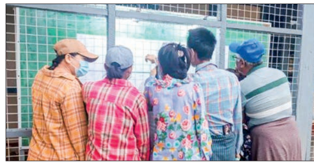
Minbu (Saku), Magway Region.