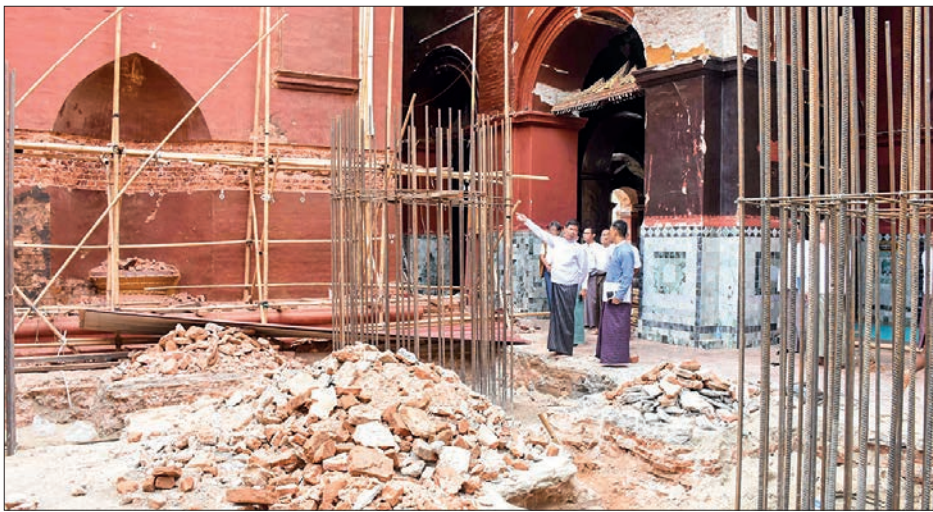
This photo depicts officials inspecting religious buildings currently undergoing repairs.

AN official from the Department of Archaeology and National Museum, under the Ministry of Hotels, Tourism and Culture said that 175 ancient pagodas, stupas, temples, and religious buildings damaged by the 2025 Mandalay earthquake have been fully repaired over the past year.