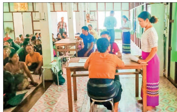
An official presents loans to members of Mya Sein Yang Village project in Zalun Township.