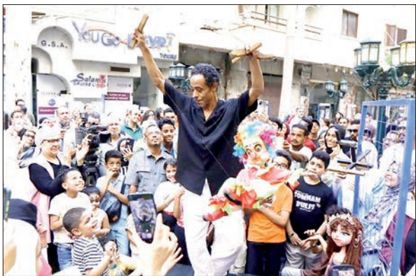
A puppeteer presents a show in downtown Cairo, Egypt on 20 June 2026.

For Zin-hom, a student at the Higher Institute of Music, this