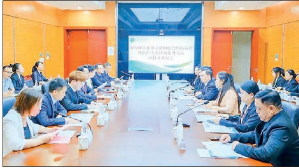
This photo shows delegations from China and Myanmar attending the China-Myanmar bilateral medical exchange programme.