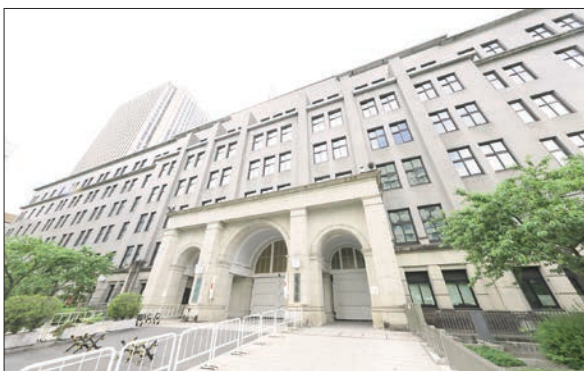
File photo taken on 3 May 2026 shows the Finance Ministry in Tokyo.

Bond purchases by individual investors have been soaring as the Bank of Japan moves to raise interest rates. The ministry is also eager to diversify buyers of its debt given that the BOJ is reducing bond purchases as part of its monetary normalization following a decade of unorthodox easing.