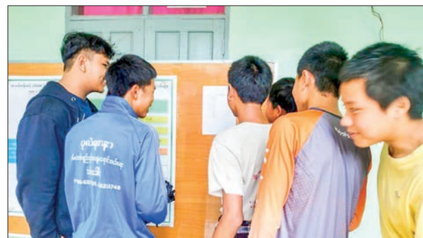
Kalaw, Shan State.