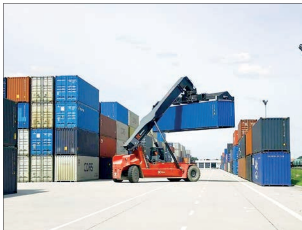
A reach stacker lifts a container at Inbap's container terminal in Malaszewicze, Poland, 24 June 2026.

"It required a great deal of effort," he recalled. "But it marked the beginning of cooperation that