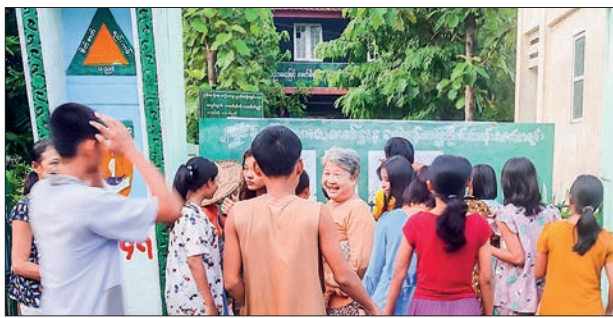
Mawlamyinekyun, Ayeyawady Region.