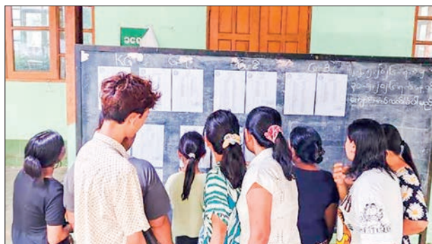
Dawbon, Yangon Region.

scorers by subject combination, have also been uploaded to www.myanmarexam.org for easy public access, according to the Department of Myanmar Examinations. — MNA/KZL