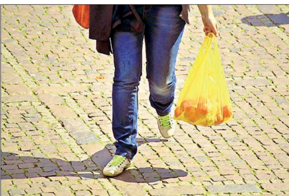
Several vendors do not have a practical alternative to the plastic products they use on a daily basis.

Faced with tight supply and soaring prices due to the monthslong closure of the Strait of Hormuz, petrochemical companies mainly in South Korea and Japan have scaled back production capacity, sending the cost of basic goods such as plastic bags surging. — AFP