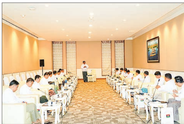
Union Minister for Industry and MSME Development Dr Charlie Than meets regional MSME agency chairpersons at the World MSME Day commemorative event at MICC-I in Nay Pyi Taw yesterday.

Presentations covered topics including supporting MSMEs for economic development, future growth strategies, and the role of digital adoption in