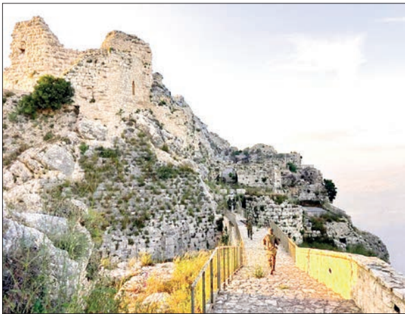
This photo released on 31 May 2026 shows Israeli ground forces conducting a military operation in the Beaufort Ridge, southern Lebanon.

THE Israel Defence Forces (IDF) are preparing for a long-term deployment in the security zone in southern Lebanon until the complete disarmament of Hezbollah, Israeli Defence Minister Israel Katz said on Saturday. On Friday, Lebanon and Israel signed a framework agreement in Washington with US mediation to resolve the ongoing conflict. “[Israeli] Prime Minister [Benjamin Netanyahu] and I instructed the IDF to prepare for