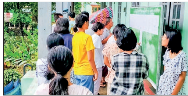
Myitkyina, Kachin State.