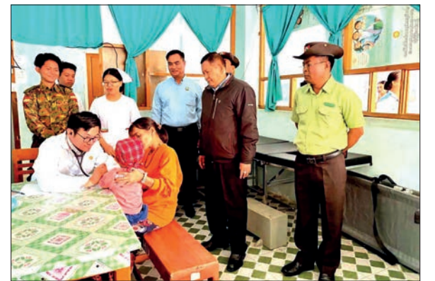
Officials visit the Tonzang People's Hospital (50-bed) while the doctor examines a child at the Tonzang People's Hospital (50-bed).

DEPUTY Minister for Construction U Myo Myint, accompanied by members of the Chin State Rehabilitation and Reconstruction Committee, inspected the progress of reconstruction work in Tonzang yesterday.