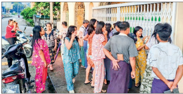
Myeik, Taninthayi Region.