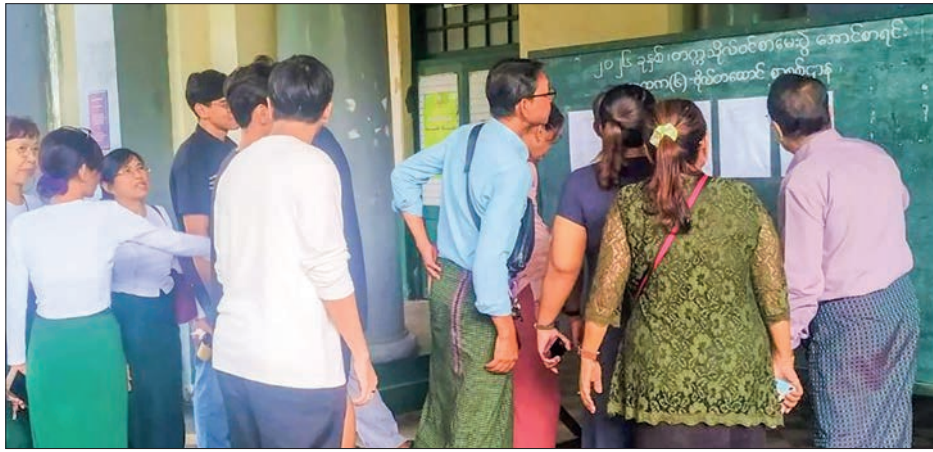
Students and people check results of matriculation examination at BEHS 6 Botahtaung, Yangon, yesterday.