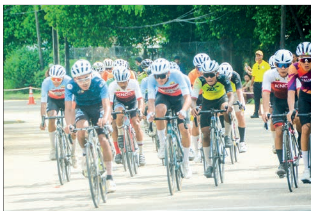
Cyclists compete in the men's long-range race.

RANGOON Cycling Club won the overall title at the 64 th National Cycling Championship, which concluded yesterday at the Thuwunna Youth Training Centre in Yangon.