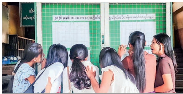
Kyaikto, Mon State.