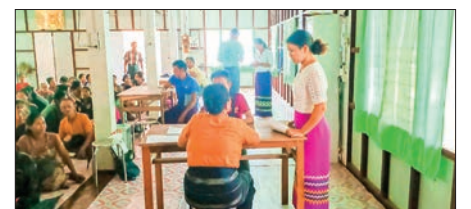
Zalun disburses K56M under MSY Project using MMQR system