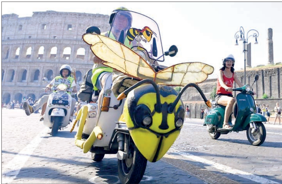
Vespa means wasp in Italian and one enthusiast dressed up his motorbike to reflect this.

“We brought our Vespa over from the Unit-