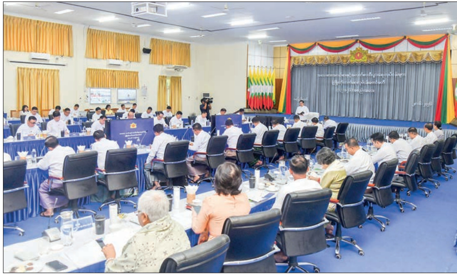
Vice-President U Nyo Saw delivers a speech at the meeting of the Micro, Small and Medium Enterprise Development Work Committee in Nay Pyi Taw yesterday.

The Vice-President urged all to expand agricultural activities in