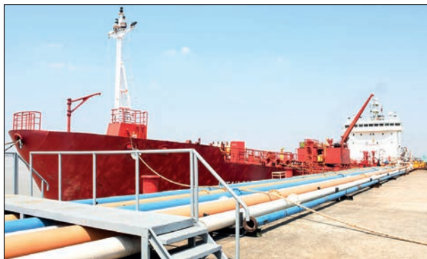
This photo shows an oil tanker from Singapore at the port.

Furthermore, the ministry is using and monitoring digital systems to improve the management of the fuel supply chain and reduce unnecessary costs. These measures include installing Automatic Tank Gauge (ATG) systems in storage tanks, using GPS tracking sys-