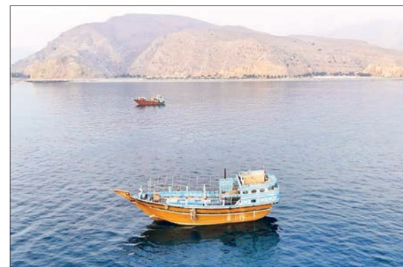
Boats anchored off Oman's northern Musandam Peninsula near the Strait of Hormuz.

Iranian Foreign Minister arrived in Iraq on 28 June. The official is