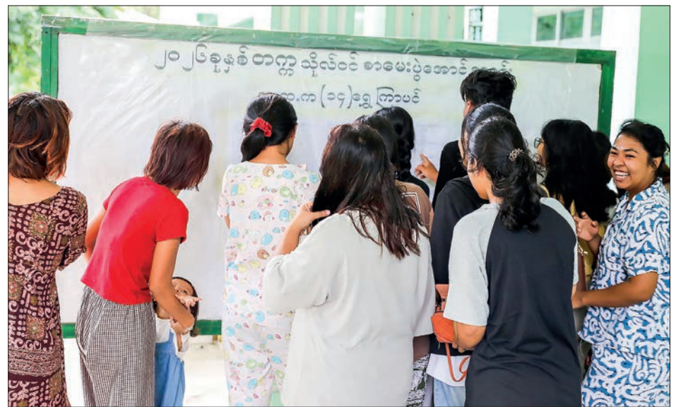
Students are seen viewing exam results for the 2025-2026 academic year at Basic Education High School No 14, Shwekyarbin, Nay Pyi Taw, yesterday.