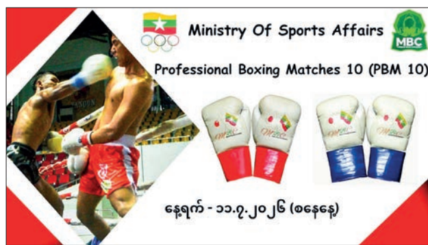
A poster for Professional Boxing Matches 10 (PBM 10), organized by the Ministry of Sports.