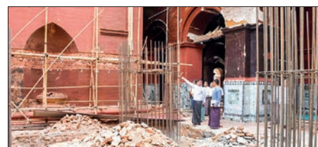
175 ancient religious structures damaged by Mandalay earthquake fully repaired