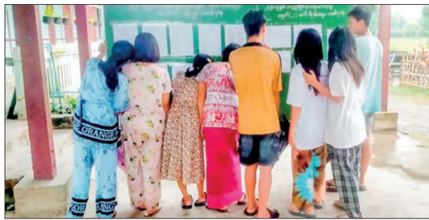
Mohnyin, Kachin State.