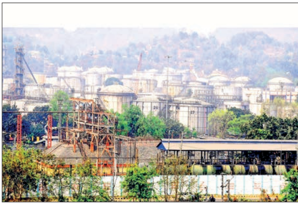
India's expanding crude oil refining capacity protected its domestic economy from a West Asia-led energy crisis.

It stated, "India may continue to augment its