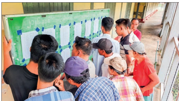
Gyobingauk, Bago Region.