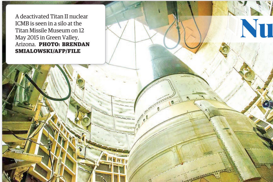
A deactivated Titan II nuclear ICBM is seen in a silo at the Titan Missile Museum on 12 May 2015 in Green Valley, Arizona.