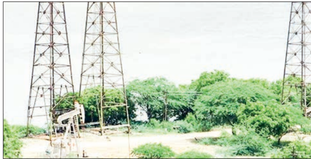
An old oil pump.

The Ministry of Energy decided to drill deep wells in old oil fields with the technological assistance of MPRL E&P Company in the 2024-25 financial year.