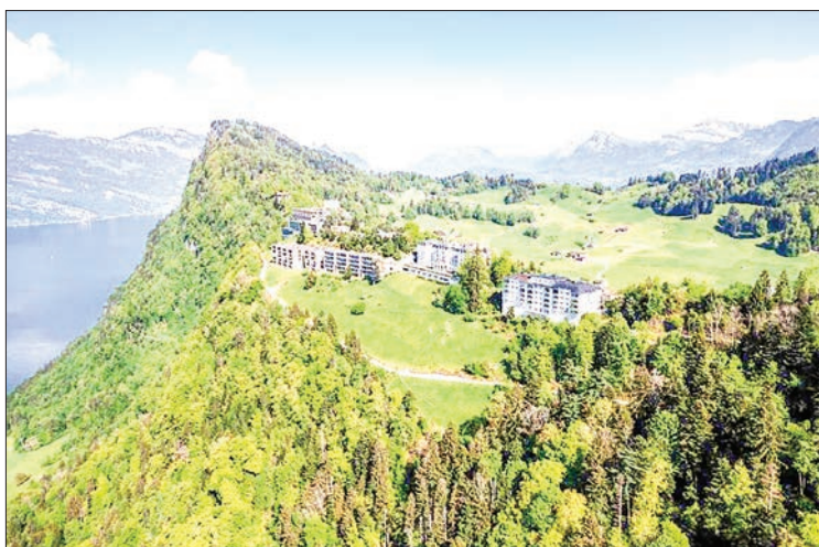
The 'peace conference' is scheduled to take place at the Bürgenstock resort, perched high above Lake Lucerne in Switzerland.

Xi stressed that the key to the ever-strengthening iron-clad friendship between China and Pakistan lies in mutual understanding, high trust, and firm support between the two sides. He thanked Pakistan for its long-term and firm support for China on issues related to China's core interests and major concerns. — Xinhua