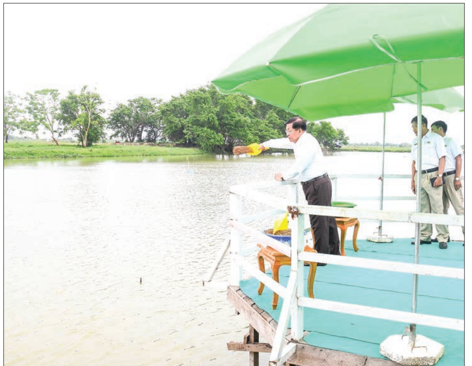
SAC Chairman PM Senior General Min Aung Hlaing feeds fish at a fish farm of the Thilawa Multi-Agriculture and Livestock Zone yesterday.