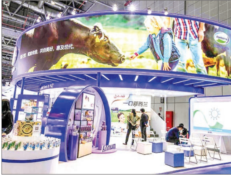
A Fonterra stand seen in the 2019 China International Import Expo in Shanghai.

Fonterra plans to enhance its food service business, focusing on second- and third-tier cities, through innovation, menu development, and strengthening offerings in Chinese cuisine.