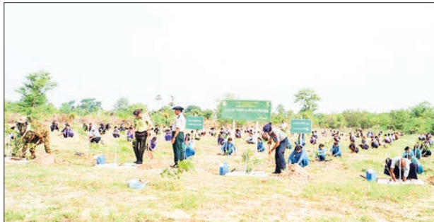
Locals grow various kinds of trees in Ngazon, Mandalay Region, recently.

Myanmar plans to grow 22.332 million saplings nationwide during this monsoon season. The 2020 report of FAO stated Myanmar possessed 42.19 per cent of forest coverage.