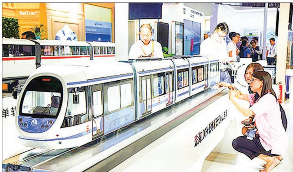
Visitors look at the latest models of urban rail trains shown at the International Urban Rail Exhibition in Beijing.

Last month, China saw new operation length of 12.5 kilometres, as well as a new section of urban rail transit line in Hefei, Anhui Province, the ministry added. — Xinhua