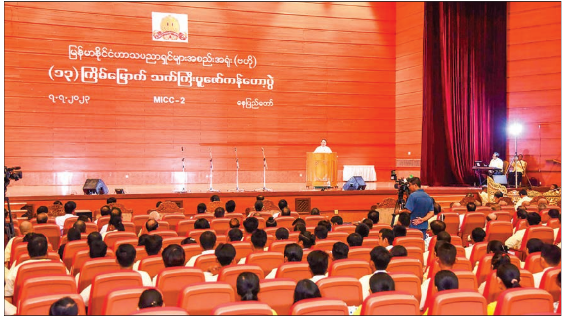
The photo shows the 13 th Respect-Paying Ceremony to Senior Comedians by the Myanmar Comedians' Association in Nay Pyi Taw.

A total of nine awards, including four Excellent Comedian Awards, one Supporting Comedian Award, and four Best Comedy Creation Awards for 2023-2024, will be given. These awards will be granted based on the screening and selection of comedians who have consistently demonstrated brilliant comedic skills in movies, videos, state TV channels, and social media platforms such as Facebook and YouTube channels, among others. — ASH/TRKM