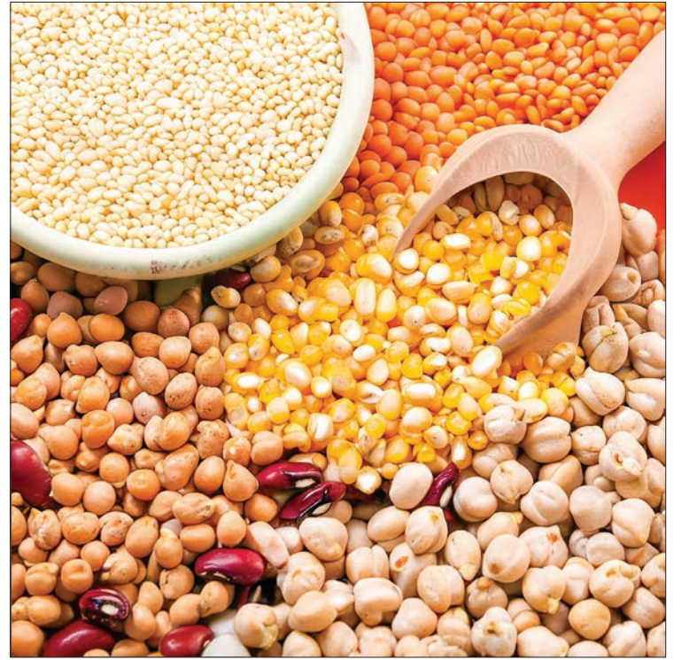
Pulses and beans seen being displayed for sale in the market.

The Myanmar Pulses, Beans, Maize and Sesame Seeds Merchants Association stated that black grams, which