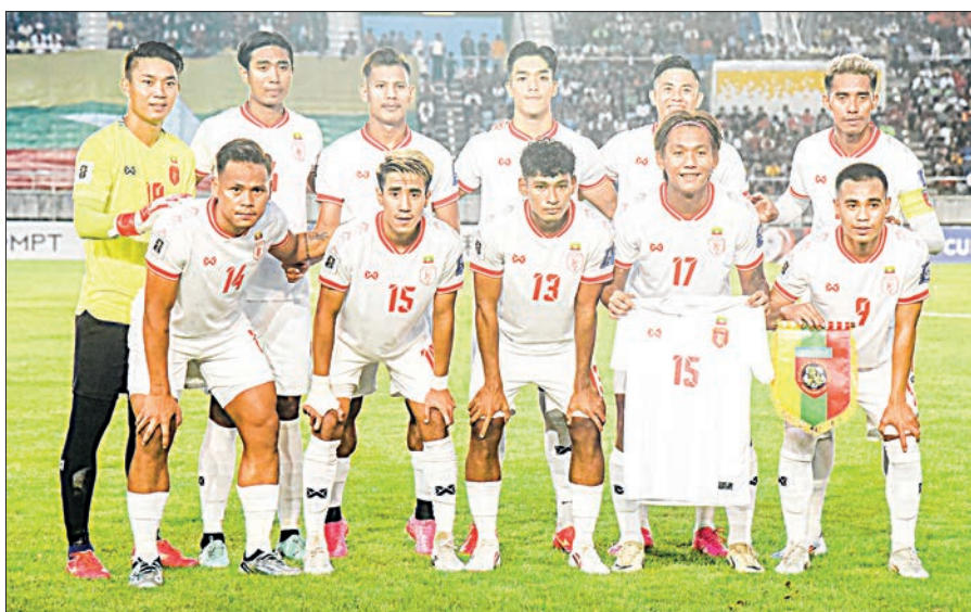
The Myanmar national football team is seen posing for a group photo.

The North Korean team was unable to host home games, so Laos will host their match against the Syrian squad on 6 June and the Myanmar team on 11 June. The Myanmar-North Korea game will be at 7:30 pm Myanmar Standard Time.