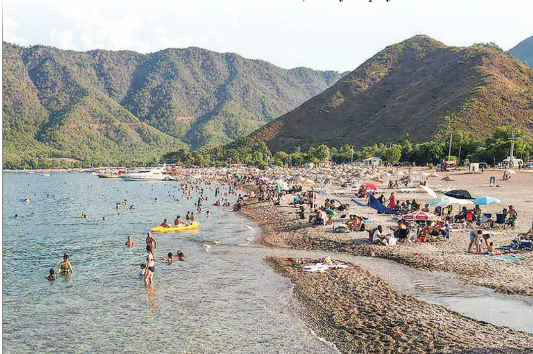
The photo taken on 6 June 2024 shows tourists enjoying leisure time at a beach in Antalya, Türkiye.

"State and private stakeholders must collaborate. Türkiye needs to refine its pricing policy, as competition in the Mediterranean is strong, and some regional countries offer compelling alternatives," Sahinalp stressed. "Sustainability is crucial; Türkiye must be a sustainable and reliable player." — Xinhua