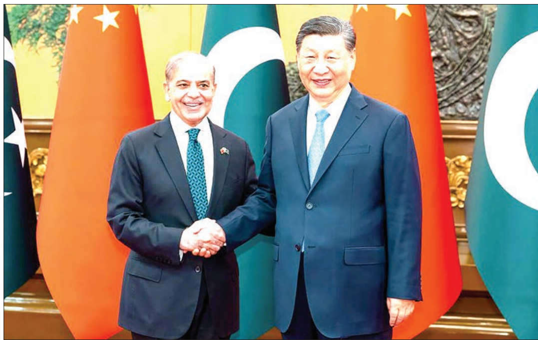
Chinese President Xi Jinping meets with Pakistani Prime Minister Shehbaz Sharif, who is on an official visit to China, at the Great Hall of the People in Beijing, capital of China, 7 June 2024.

Chinese President Xi Jinping emphasized the deepening and solidifying of the China-Pakistan all-weather strategic cooperative partnership during his meeting with Pakistani Prime Minister Shehbaz Sharif in Beijing.