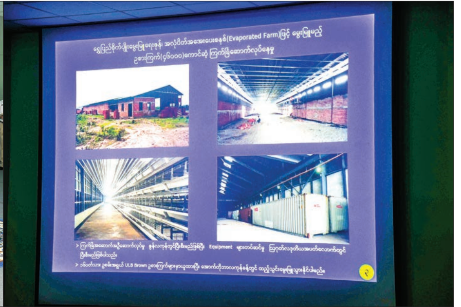
Chairman of the State Administration Council Prime Minister Senior General Min Aung Hlaing hears the reports by officials during the inspection tour of the Shwe Pyi Agriculture and Livestock Zone in the Thilawa Multi-Agriculture and Livestock Zone Project yesterday.