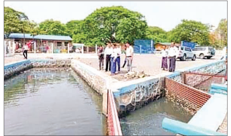
Officials make an inspection tour of a water pumping station in Mandalay.

The nine pumping stations have a total capacity of releasing 217.92 million gallons of water to the river to prevent floods in the residential areas.