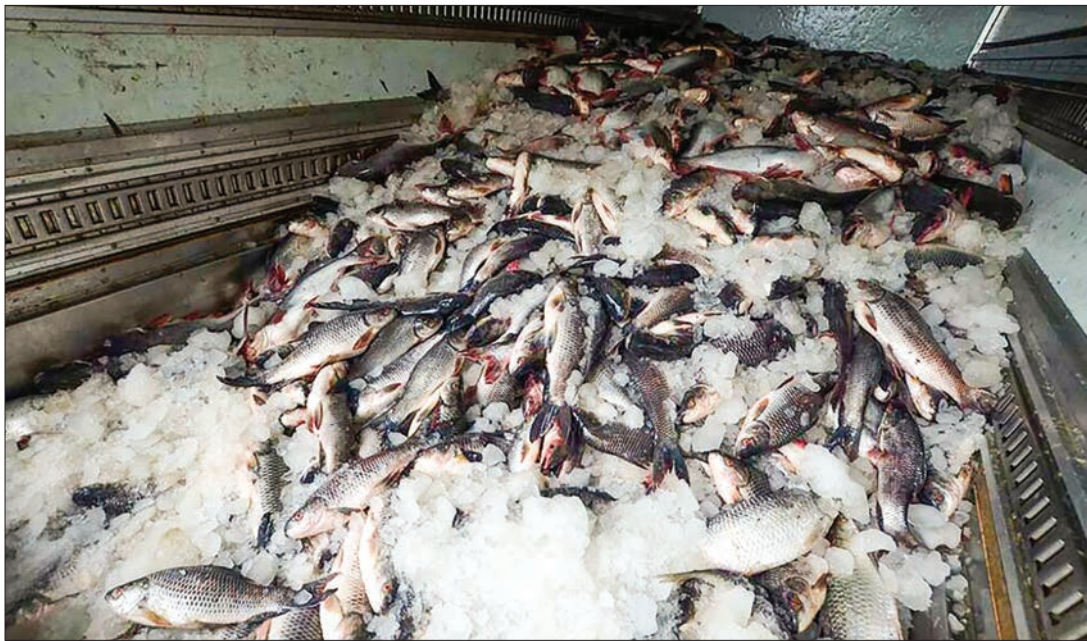
File photo shows the fish at a cold storage.

India primarily purchases, are commonly found only in Myanmar, while pigeon peas, green grams and chickpeas are grown in African countries and Australia. — NN/EM