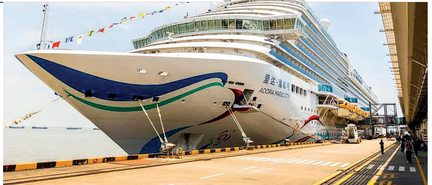
This photo taken on 26 May 2024 shows the cruise ship Adora Magic City docking at the Shanghai Wusongkou International Cruise Terminal in east China's Shanghai.