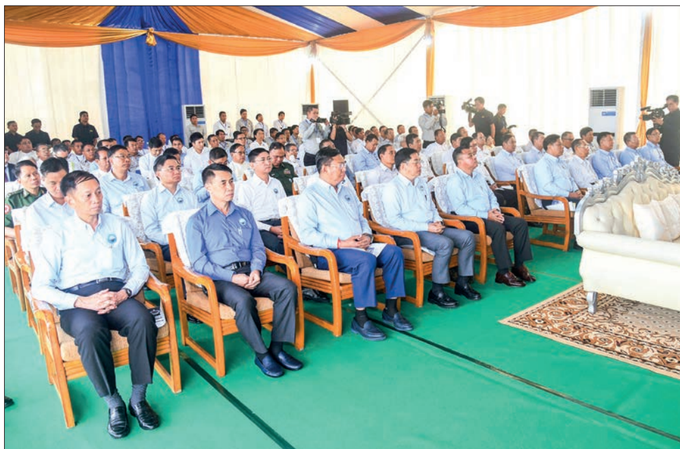
Chairman of the State Administration Council Prime Minister Senior General Min Aung Hlaing delivers a speech at the ceremony to commission the Bago River Crossing Thanlyin Bridge 3 into service in Yangon Region yesterday.