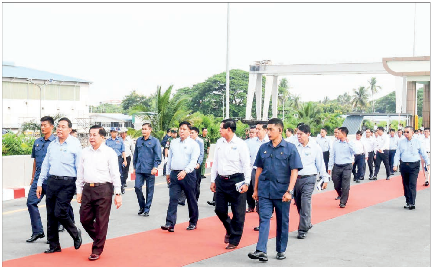
Chairman of the State Administration Council Prime Minister Senior General Min Aung Hlaing walks along the Bago River Crossing Bridge (Thanlyin Bridge 3) in Yangon Region during the inaugural event yesterday.

The newly-inaugurated Thanlyin Bridge 3 will help ease traffic junctions on the Thanlyin Bridge 1.