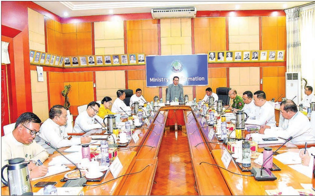
The Fifth National Sports Festival Organizing Committee meeting in progress on 6 June 2024.

A logo competition representing the Fifth National Sports Festival will be held in Nay Pyi Taw on 12 and 13 June 2024.