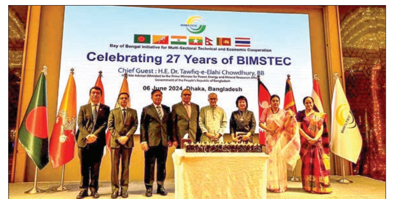
Myanmar attendees seen at the 27 th anniversary of the establishment of BIMSTEC.