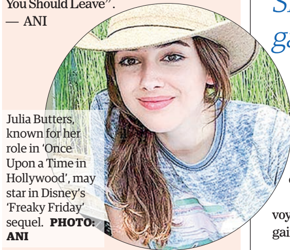
Julia Butters, known for her role in 'Once Upon a Time in Hollywood', may star in Disney's 'Freaky Friday' sequel.