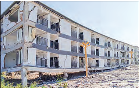
The images show the burning of materials used by undocumented foreign entrants in Shwe Kokko, Myawady, Kayin State.

THE Myanmar government has intensified efforts to combat online gambling in the KK Park and Shwe Kokko areas. Yesterday, authorities demolished ten additional illegal buildings used for on-line gambling operations in Myawaddy-Maethawtalay (KK Park), including one four-storey building, one three-storey building, and eight two-storey structures. These demolitions are part of a larger crackdown, which has already seen 361 out of 635 illegal buildings systematically