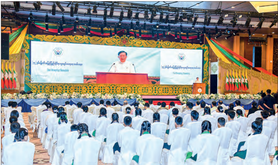
The 77 th International Human Rights Day event is in progress yesterday in Nay Pyi Taw, addressed by National Defence and Security Council Office Executive Chief U Aung Lin Dwe.

The Universal Declaration of Human Rights consists of 30 articles and sets out the fundamental rights of all human beings, including civil and political rights, as well as economic, social, and cultural rights and responsibilities. The Declaration is the first historical document to recognize the inherent rights of all human beings. When the UN General Assembly voted to adopt the UDHR on 10 December 1948, Myanmar was among the 48 countries that supported the Declaration. The UN General Assembly later designated 10 December – the day the Decla-