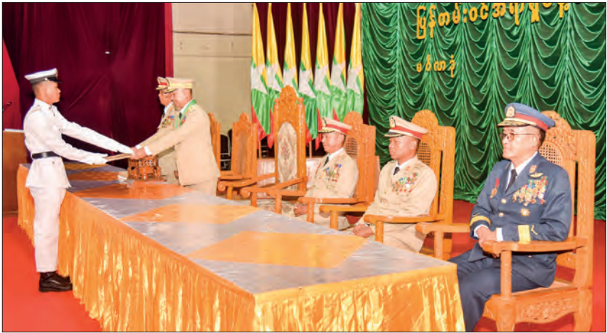
The commissioning ceremony for the DSMA 26 th Intake graduates is underway.