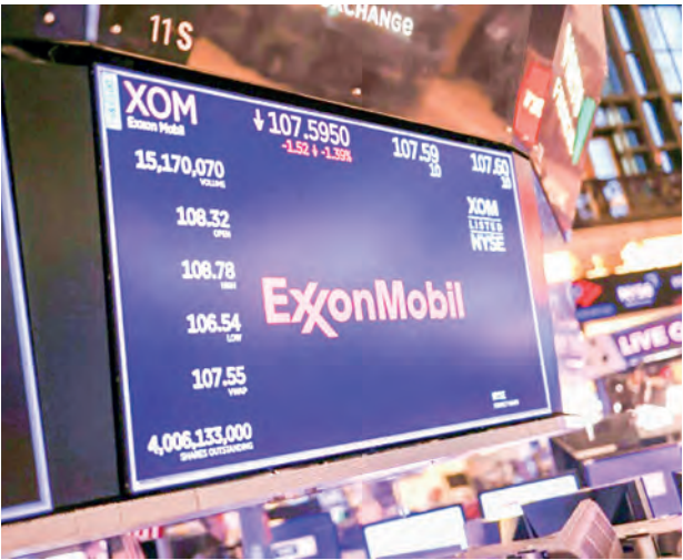
Oil giant ExxonMobil is dialing back low-carbon investments. low-carbon solutions “will continue to be con- tingent on the development of supportive policy

EXXONMOBIL is slowing medium-term investments in low-carbon ventures by some $10 billion compared with its outlook a year ago, the oil giant announced Tuesday. The US petroleum company expects to spend about $20 billion in low-emission investments between 2025 and 2030, according to its annual corporate plan. The equivalent forecast last December estimated $30 billion in spending over the same period. Investments in