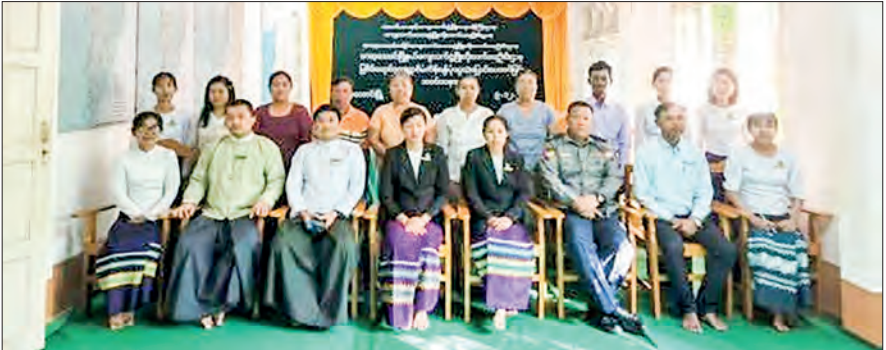
This photo captures attendees at the ceremony for the handover of Emerald Green Project funds in Kawthoung Township.