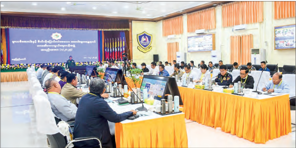
The first meeting of the Central Committee on the Prevention and Control of Narcotics and Psychotropic Substances is underway yesterday, chaired by Union Minister Lt-Gen Tun Tun Naung.

THE Central Committee on the Prevention and Control of Narcotics and Psychotropic Substances Meeting 1/2025 was held yesterday at the Myanmar Police Headquarters. The meeting was chaired by Union Minister for Home Affairs Lt-Gen Tun Tun Naung, with participation from the Anti-Corruption Commission, Myanmar Police, relevant ministries, and regional drug prevention officials via video conference. Officials discussed global drug threats, citing UNODC data showing 316 million drug users worldwide in 2023, and highlighted how drug production and trafficking fuel cross-border crime, terrorism, and threaten national security. Myanmar faces increased drug