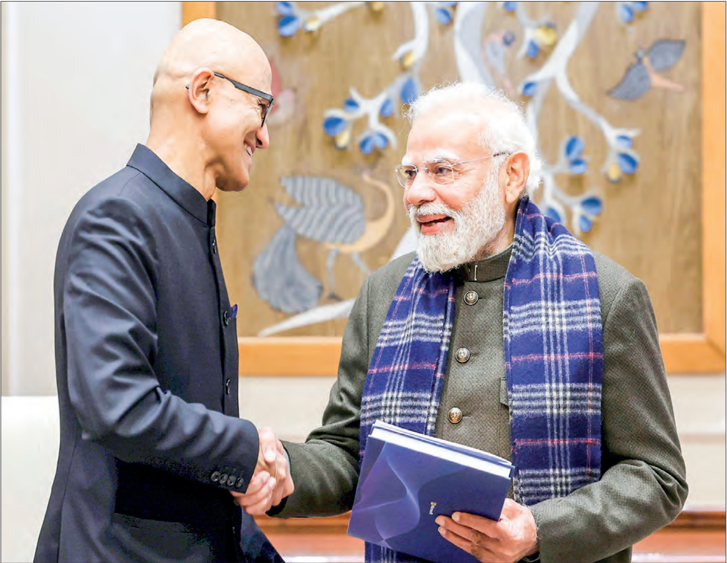
In this handout photo provided by Microsoft, Chief Executive Officer Satya Nadella, left, shakes hands with Indian Prime Minister Narendra Modi during their meeting in New Delhi, India, Tuesday, 9 December 2025.

P RIME Minister Narendra Modi on Tuesday welcomed Microsoft's significant investment in India's artificial intelligence (AI) sector. Microsoft Chairman and CEO Satya Nadella announced that the company will invest $17.5 billion in India to boost the country's AI ecosystem, making it Microsoft's largest investment in Asia. In a post on X, PM Modi said the world is "optimistic about India" in the AI era and hailed Microsoft's plan — its largest-ever investment in Asia — as a major opportunity for India's youth to drive innovation and build a more sustainable future. "When it comes to AI, the world is optimistic about India! Had a very productive discussion with Mr Satya Nadella. Happy to see India being the place where Microsoft will make its largest-ever investment in Asia. The youth of India will harness this opportunity to innovate and leverage the power of AI for a better planet," PM added in his X post. Microsoft announced US$ 17.5 billion investment in India to support the country's rapidly expanding artificial intelligence ecosystem. — ANI