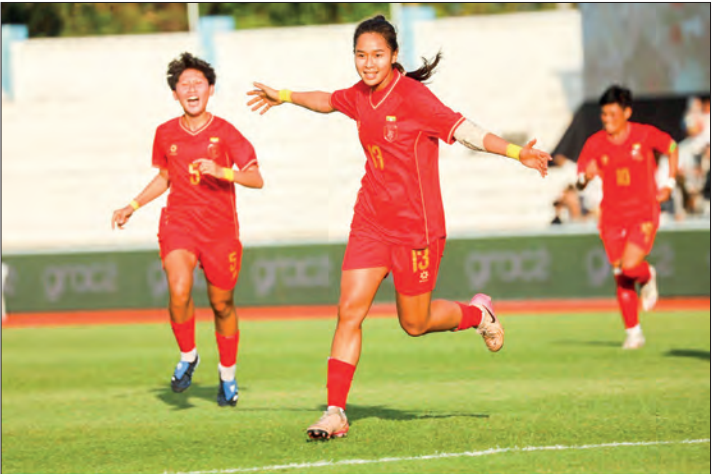
Myanmar women's football players celebrate victory in the previous match.

THE final matches of SEA Games Women's Football Group B will take place at 3:30 pm (MST) on 11 December, and the Myanmar women's team will face Vietnam, whereas the Philippines meets Malaysia.