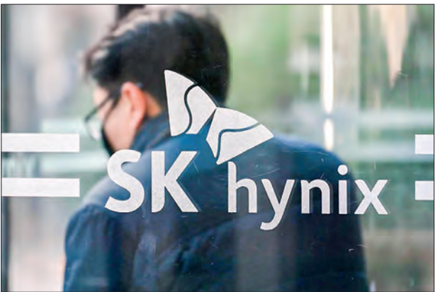
South Korean chip giant SK hynix said on Wednesday it was considering a US stock market listing using its treasury shares.

was considering listing its treasury shares as American Depositary Receipts (ADRs), instruments representing a foreign stock that is traded on a US exchange. SK hynix shares were up 4.6 per cent in early trading in Seoul. — AFP