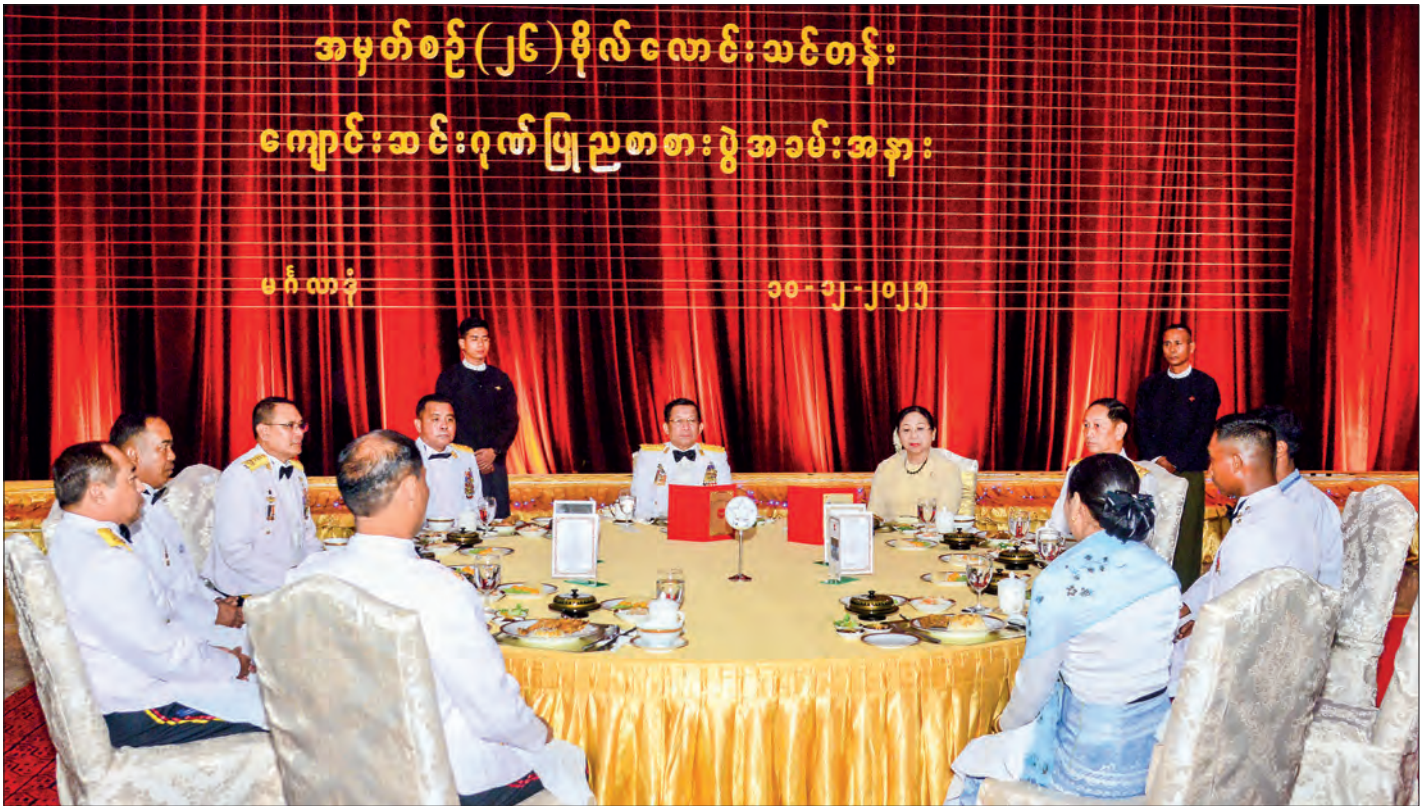
SSPC Chairman and Defence Services C-in-C Senior General Min Aung Hlaing enjoys the honouring dinner together with the graduate officers yesterday.