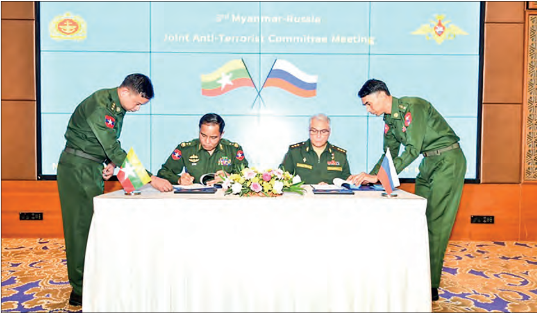
The agreements signing ceremony in progress during the second-day session yesterday.