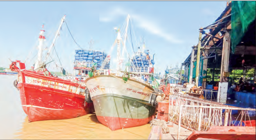
Images show fishery products and fishing vessels.