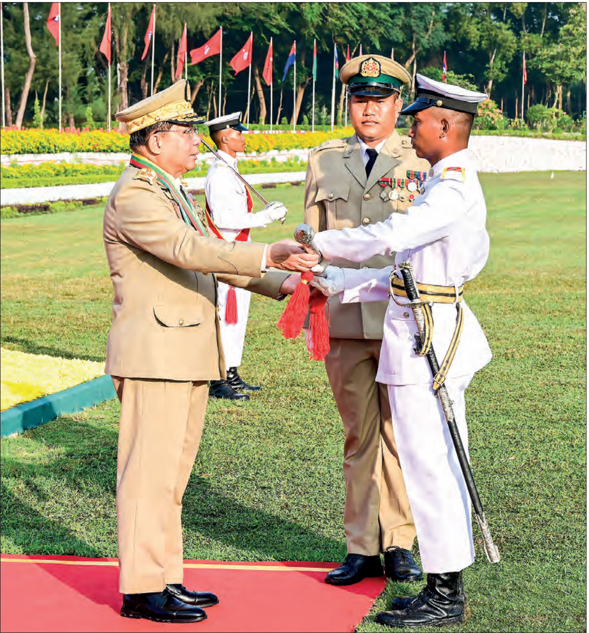
State Security and Peace Commission Chairman and Defence Services Commander-in-Chief Senior General Thadoe Maha Thray Sithu Thadoe Thiri Thudhamma Min Aung Hlaing presents the Best Cadet Award at yesterday’s event in Yangon.

The Defence Services Medical Academy is recognized by the World Federation for Medical Education (WFME) and provides medical education and knowledge in line with international curriculum standards.