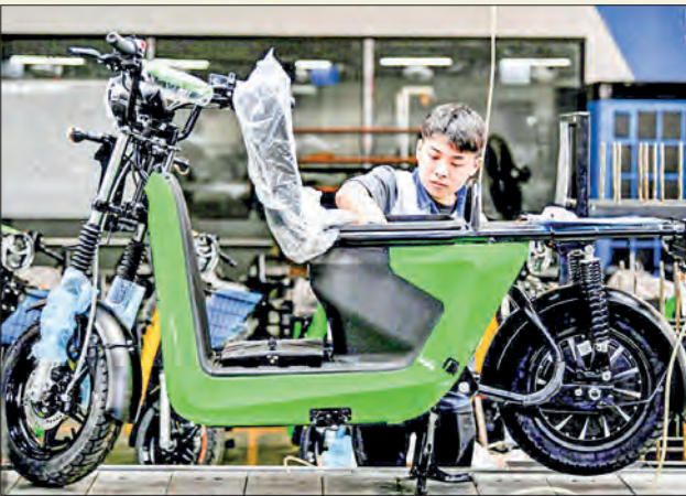
A worker assembles electric motorbikes at the Selex factory in Hanoi.

VIETNAM'S capital Hanoi has proposed a range of financial support schemes to encourage residents and businesses to shift from gasoline-powered to electric vehicles, local daily VnEconomy reported Wednesday. Dao Viet Long, deputy director of the municipal Department of Construction, noted that owners of gasoline-powered motorbikes who switch to electric models would receive support covering 20 percent of the vehicle's value, capped at five million Vietnamese dong (about US$192). Low-income households could receive support covering up to 100 per cent of the vehicle's value, with a maximum of 20 million dong (about $768), while near-poor households may be eligible for 80 per cent support, up to 15 million dong (about $576). The city would also cover 50 per cent of the registration fee for converted motorbikes. Low-income and near-poor households would receive full support, the report said. — Xinhua