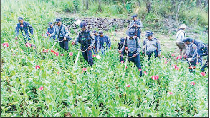
An anti-narcotics campaign in action on 9-10 December in Shan State (South). dent ethnic people destroyed blooming poppy plantations on 9 and 10 December. They destroyed 35 acres of 2.5 feet high poppy plantations in the field, some two miles southwest of Lonaung Village of Hsinchayphone Village-tract in Loilem Township, Shan State (South), 25 acres of 3.5 feet high poppy plantation, two miles southwest of Sanphu Village, 30 acres of three feet high plantation, three miles southwest of Taungnauk Village in Taungnauk Village-tract, and 25 acres of three feet high plantation, three miles and four furlongs west of the village, totalling 115 acres. A plan is underway to continue the destruction of the poppy plantations. — MNA/TTA

MYANMAR is actively conducting the narcotics eradication operations in cooperation with the United Nations, neighbouring countries, ASEAN member states, countries in the Mekong region, member countries of the BIMSTEC, and international drug control organizations. As part of these efforts, Myanmar is carrying out the destruction of poppy fields, which is one component of the broader anti-narcotics campaign. In this regard, Tatmadaw personnel, Myanmar Police Force members, those from the relevant departments from the combined team, including the General Administration Department, the Forest Department and the Department of Agricultural Land Management and Statistics, local people’s militia troops and resi-