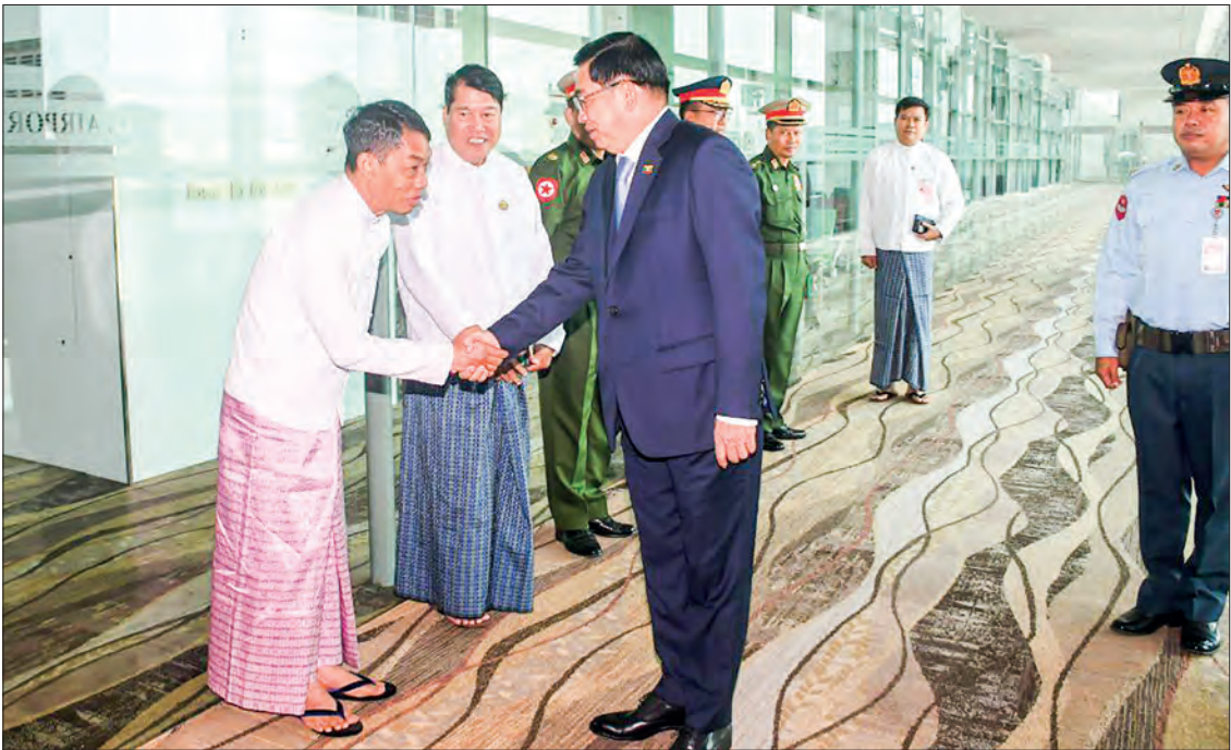
Prime Minister U Nyo Saw is seen at Yangon International Airport before departing for Turkmenistan.

The Myanmar delegation led by Prime Minister U Nyo Saw was seen off at Yangon International Airport by Union Minister U Tun Ohn, Yangon Region ministers and departmental officials. — MNA/MKKS