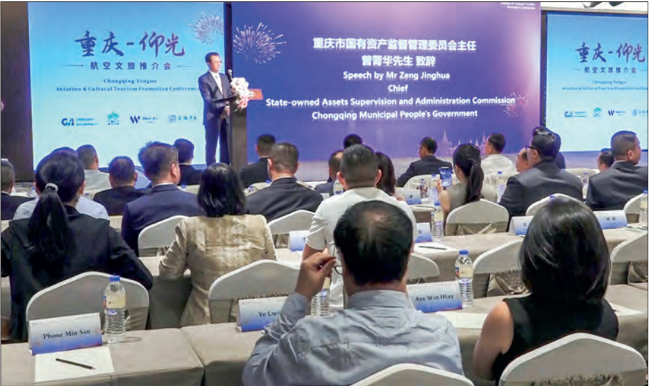
The Chongqing-Yangon Aviation and Cultural Tourism Promotion Conference held at the Lotte Hotel in Yangon on 9 December.

The images show demolished three-storey buildings in KK Park Section 3, as part of ongoing demolition measures in KK Park, Myawady, Kayin State. ensure such operations cannot take root within the country. These measures underscore the authorities' commitment to upholding law and order and safeguarding public safety.