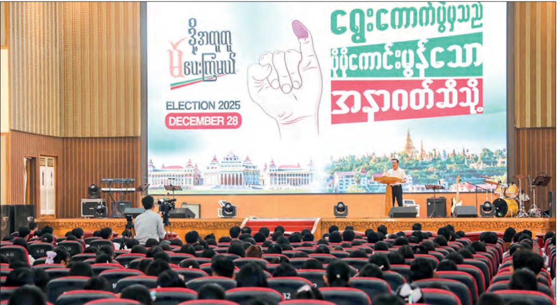
A nationwide campaign for the 2025 multiparty democratic election kicks off yesterday, attended by Union Info Minister U Maung Maung Ohn.

THE Ministry of Information initiated a nationwide campaign for the 2025 multiparty democratic election by cooperating with the Nay Pyi Taw Council, the region and state governments. Union Minister for Information U Maung Maung Ohn yesterday attended the campaign held at the Yezin Agricultural University, together with the pro-rector, department heads, faculty members and students of the Yezin Agricultural University, University of Veterinary Science and University of Forestry and Environmental Science (Yezin). Speaking at the event, the Union minister highlighted the intention of the campaign for all eligible voters to cast their votes in the forthcoming multiparty democratic general election on 28 December. He continued that every citizen loves their nation, ward and region, and every citizen who is already 18 is responsible for