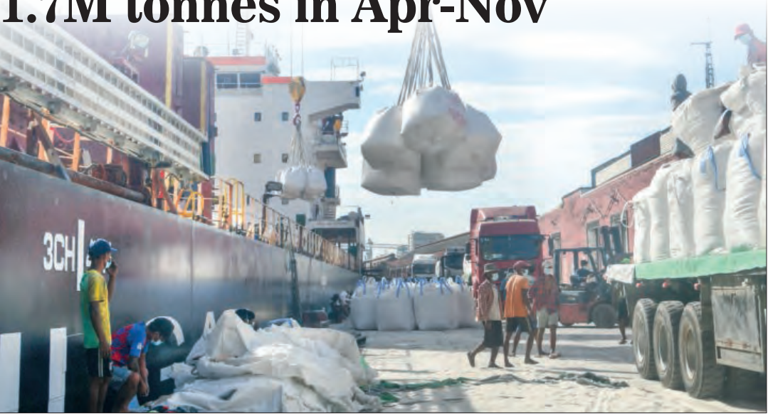
Export rice bags are seen being loaded onto the overseas-bound merchant vessel.

MYANMAR'S rice export in the past eight months of the current financial year 2025-2026, beginning 1 April, reached over 1.78 million tonnes worth US$575 million, according to the Myanmar Rice Federation (MRF). Myanmar conveyed over 142,000 tonnes ($52M) in April, over 250,000 tonnes ($90M) in May, 210,000 tonnes ($71M) in June, over 230,000 tonnes ($77M) in July, over 190,000 tonnes ($65M) in August and 160,000 tonnes ($52M) in September and 310,000 tonnes ($92M) in October and 263,815 tonnes ($76M) in November, totaling 1.787 million tonnes worth around $575 million, said a representative of the Myanmar Rice Federation. Myanmar mostly relies on sea trade for rice export. The federation aims to achieve three million tonnes of rice exports in the current FY. Myanmar bagged over $1.129 billion from 2.48 million tonnes of rice and broken rice exports in the financial year 2024-2025 (1 April-31 March). Ministry of Commerce is working together with the Union of Myanmar Federation of Chambers of Commerce and Industry, Myanmar Rice Federation, Myanmar Rice Federation, Myanmar Pulses, Beans, Maize and Sesame Seeds Merchants Association, Myanmar Garment Manufacturers Association, Myanmar Industries Association, Myanmar Rubber Planters and Producers Association, Myanmar Fisheries Products Processors and Exporters Association to meet monthly export targets and facilitate exports. – NN/KK