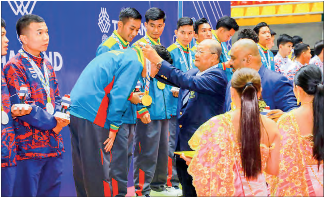
Myanma Chinlone players are seen receiving gold medals.

The men's Chinlone team followed with another gold medal for Myanmar, overcoming Thailand 574-501. Athletes Maung Min Thit-