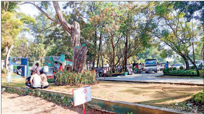
Visitors throng Pwelkaut waterfall in PyinOoLwin on 6 December 2025.

FOR December holidays, Kayin New Year Day and Christmas, and New Year, bookings for hotel rooms have surged, and local visitor arrivals are expected to be high, an official from the Union of Myanmar Travel Association (UMTA) told The Global New Light of Myanmar (GNLM).