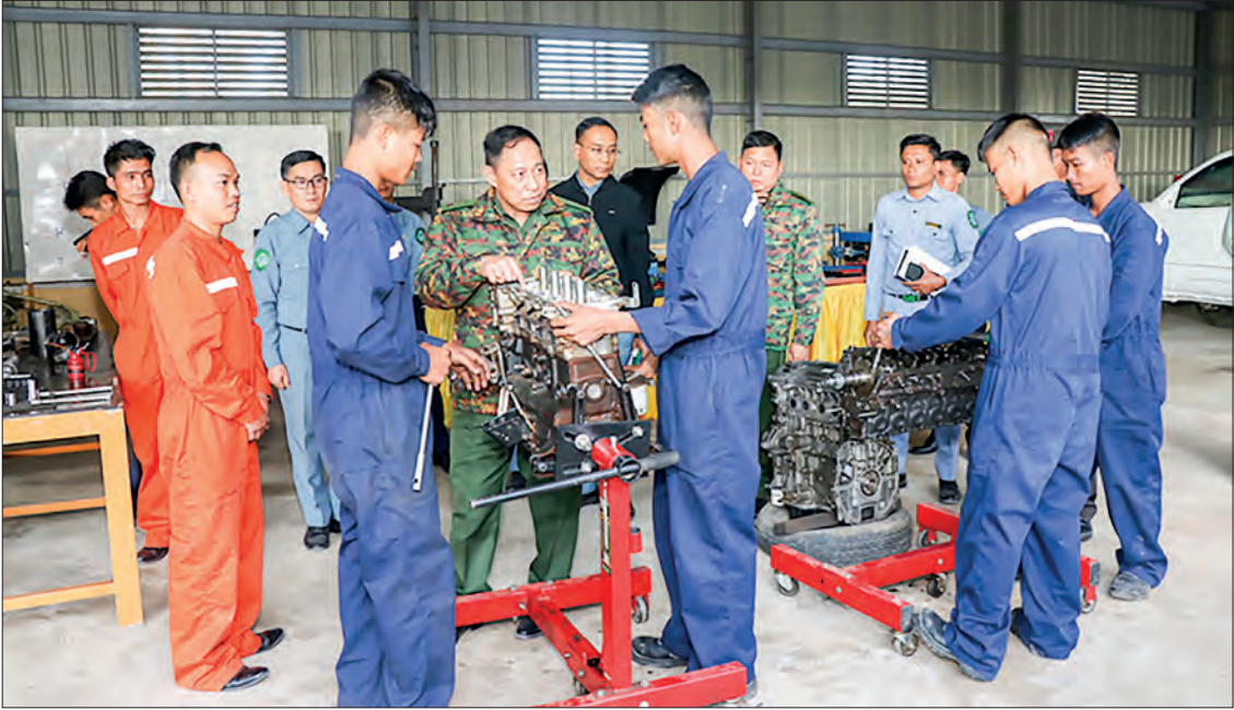
Union Minister Lt-Gen Yar Pyae, Shan State Chief Minister U Aung Aung, and other officials are pictured during their inspection tours in Shan State (South) yesterday.

The Union minister and party proceeded to Shan State Ethnic Affairs and Vocational Training Centre, and the Union minister urged the officials to provide the required assistance to conserve the literature, tradi-