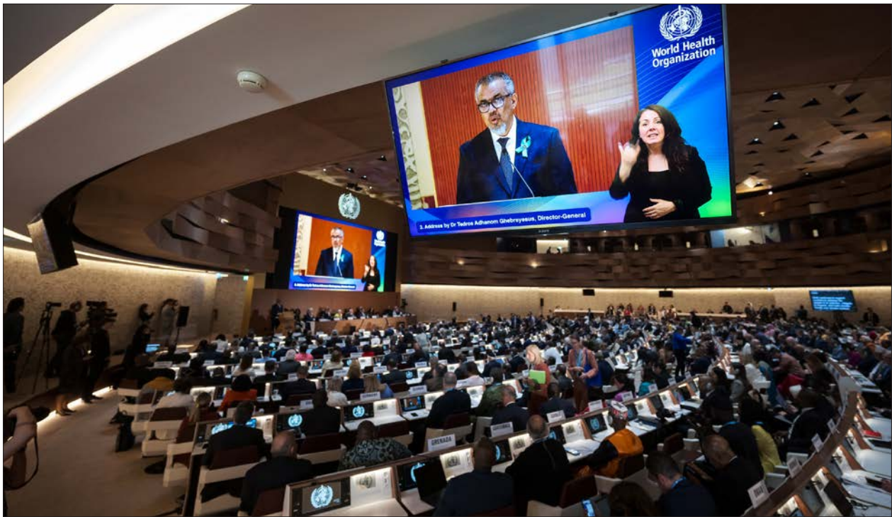
World Health Organization (WHO) Director-General Tedros Adhanom Ghebreyesus is seen on a screen delivering his report before delegates during the World Health Assembly in Geneva on 19 May 2025.

THE UN health agency on Tuesday adopted a landmark Pandemic Agreement on tackling future health crises, struck after more than three years of negotiations sparked by the COVID-19 crisis. The accord aims to prevent the disjointed response and international disarray that surrounded the COVID-19 pandemic, by improving global coordination and surveillance, and access to vaccines, in any future pandemics.