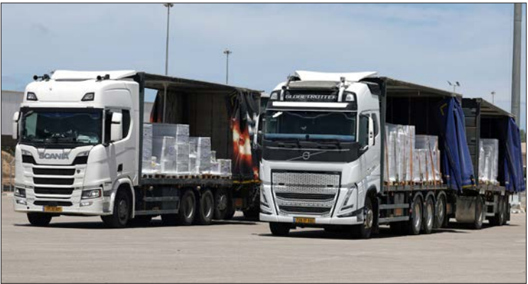
Trucks carrying aid wait to enter the Gaza Strip from the Israeli Kerem Shalom crossing, on 20 May 2025, amid the ongoing war with the Palestinian militant movement Hamas. Israel announced it would let limited aid into Gaza and said the first five trucks entered on 19 May carrying supplies “including food for babies”.

Israel has intensified a military offensive in Gaza, which it says is aimed at crushing Hamas. — AFP