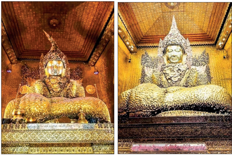
This photo features the Mahamuni Buddha Image adorned with its newly renovated crested headdress.

THE Mahamuni Buddha Image, currently under renovation following the Mandalay earthquake, is scheduled to open to the public every Sabbath, according to a statement from the Image Board of Trustees.