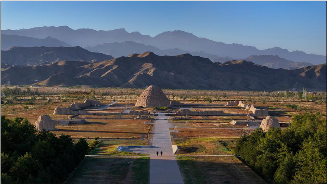
An aerial drone photo taken on 10 October 2024 shows a Xixia imperial tomb at the foot of Helan Mountain, northwest China's Ningxia Hui Autonomous Region.

Visitors can manipulate the digital twin with gesture controls, rotating the virtual artifact to ex-