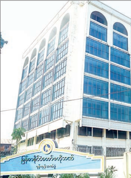
The office building of the Central Bank of Myanmar in Yangon.