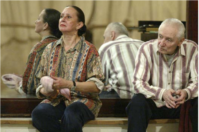
(FILES) Picture taken on 4 April 2003 shows legendary Russian ballerina Natalia Bessmertnova (L) during a rehearsal at the Bolshoi theatre with her husband famous choreographer Yuri Grigorovich in Moscow. Famous Soviet and Russian choreographer Yuri Grigorovich passed away at the age of 98, local media report.

"He was able to see in artists what we ourselves did not notice. He helped us unleash (ourselves) on stage, making