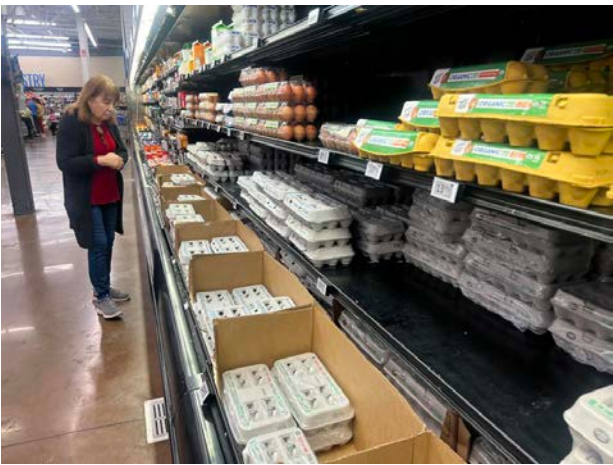
This photo taken with a mobile phone on 7 February 2025 shows a customer shopping for eggs at a Walmart in El Monte, Los Angeles County, California, the United States. have failed to agree on measures to reverse the trend of large annual fis- cal deficits and growing interest costs,” it said.