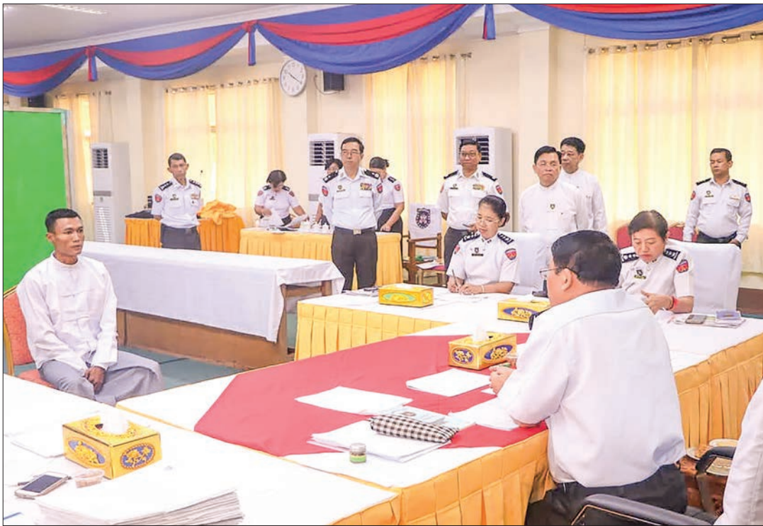
Computer and face-to-face tests for the position of Assistant Immigration Officer to serve in the Ministry of Immigration and Population were being conducted on 29 April 2024.

AS the Ministry of Immigration and Population intends to compile and publish annual robust population estimates, the Population Department has now invited applications for the position of international consultant.