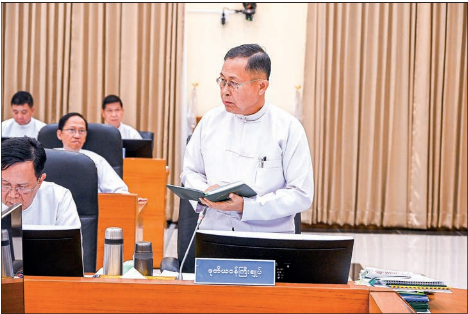
SAC Vice-Chairman Deputy PM Vice-Senior General Soe Win puts forward discussion points at yesterday's meeting.

He instructed the Ministry of Border Affairs to carry out the development of agriculture and livestock farms in border regions. Graduates from the University for the Development of National Races and degree colleges have