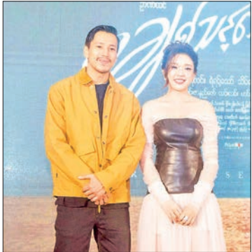
Scenes from the fan meeting with the cast and attending artistes.