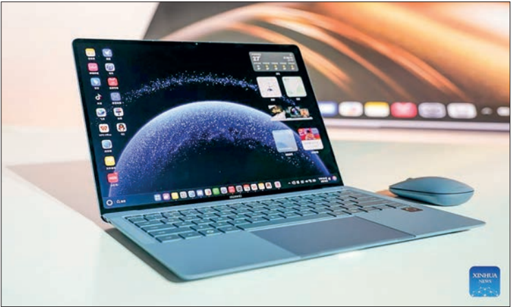
This photo shows the HarmonyOS-powered Huawei MateBook Pro. Chinese tech giant Huawei on Monday unveiled two laptops powered by HarmonyOS, marking the debut of its self-developed operating system on personal computers (PCs). The launch of the Huawei MateBook Pro and MateBook Fold Ultimate Design signals the company's push to expand HarmonyOS beyond smartphones and tablets into a PC market long led by Microsoft's Windows and Apple's macOS.

HarmonyOS, or Hongmeng in Chinese, is an open-source operating system designed for various devices and scenarios. Originally launched in 2019, it has since been applied across smartphones, tablets, wearables, smart home appliances, and new energy vehicles. Analysts said Chinese companies had launched domestic computer operating systems before, but those were mostly derivative works built on the open-source Linux kernel, lacking a truly independent technol-