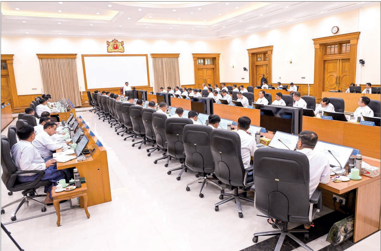
The second-day session of the Union Government Meeting in progress yesterday, chaired by SAC Chairman Premier Senior General Min Aung Hlaing.

It is essential to systematically document the actions and achievements of the current government during its tenure.