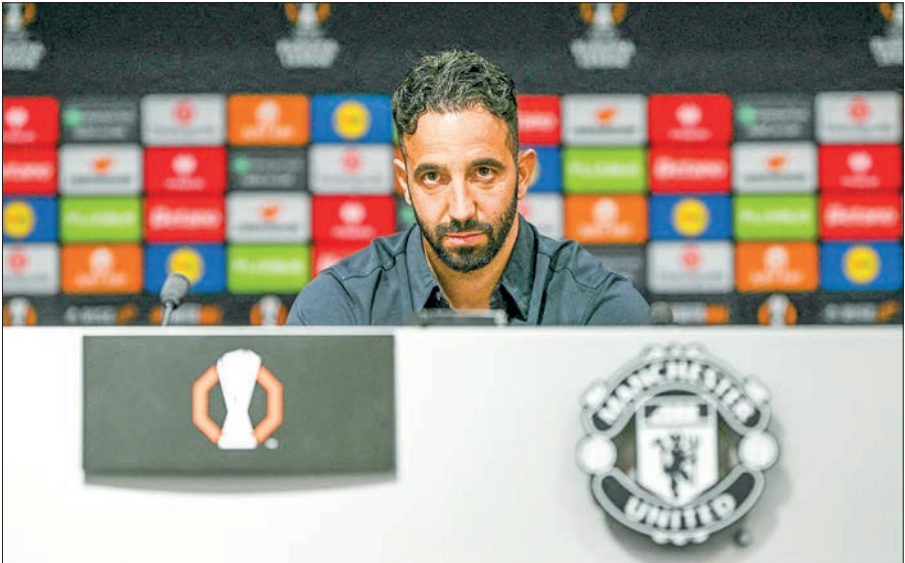
Manchester United's Portuguese head coach Ruben Amorim looks on during a press conference at Old Trafford in Manchester, north-west England on 14 May 2025 during a media day ahead of their UEFA Europa League final against Tottenham Hotspur. The UEFA Europa League final will take place on 21 May in Bilbao.

pions League and to salvage something from what has been a dreadful domestic season for both teams. Manchester United are 16 th in the Premier League, with 10 wins and 18 defeats in the club's worst ever season since the competition began in 1988. The season saw Erik ten Hag sacked at the end of October with Ruben Amorim brought in to turn things around. Amorim has failed to do that in the Premier League, but his side has progressed unbeaten to the final, beating hosts Athletic Club Bilbao in the semifinal after several controversial refereeing decisions all went its way. Tottenham's campaign has been even worse, with speculation that coach Ange Postecoglou will leave in the summer even if his team lifts the trophy. Spurs are 17 th in the table with 21 defeats from 37 games, and although 63 goals scored points to a laudable commitment to attack, the 61 goals conceded also highlights chaotic defending. — Xinhua