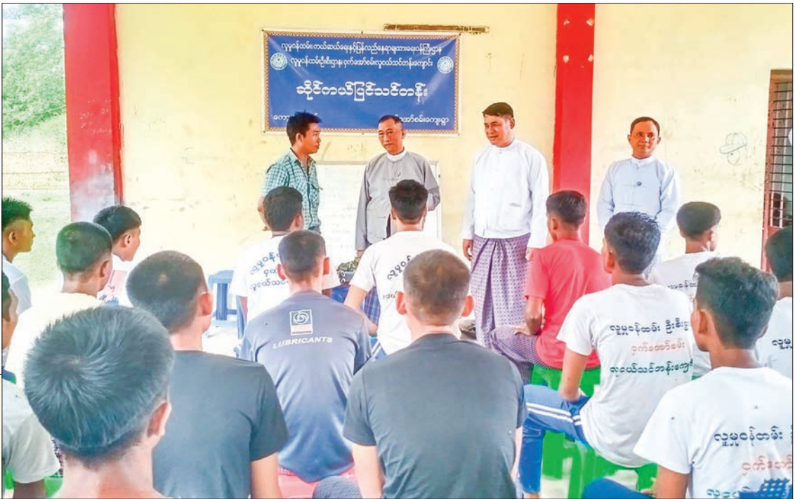
The MNHRC inspection team views the training session at the Hnget.

A total of 31 foreigners involved in telecom fraud and other online crimes were deported to their respective countries through the Myanmar-Thailand Friendship Bridge (No 2) on 20 May. The deportees included one South Korean, seven Nigerians, 10 Indians, one Russian and 12 Filipinos. They entered Myanmar illegally via border routes through neighbouring countries and were found operating online scams and gambling activities in areas such as Myawady-Shwe Koko, Moehtawthalay (KK Park) and Kyaukkhat in