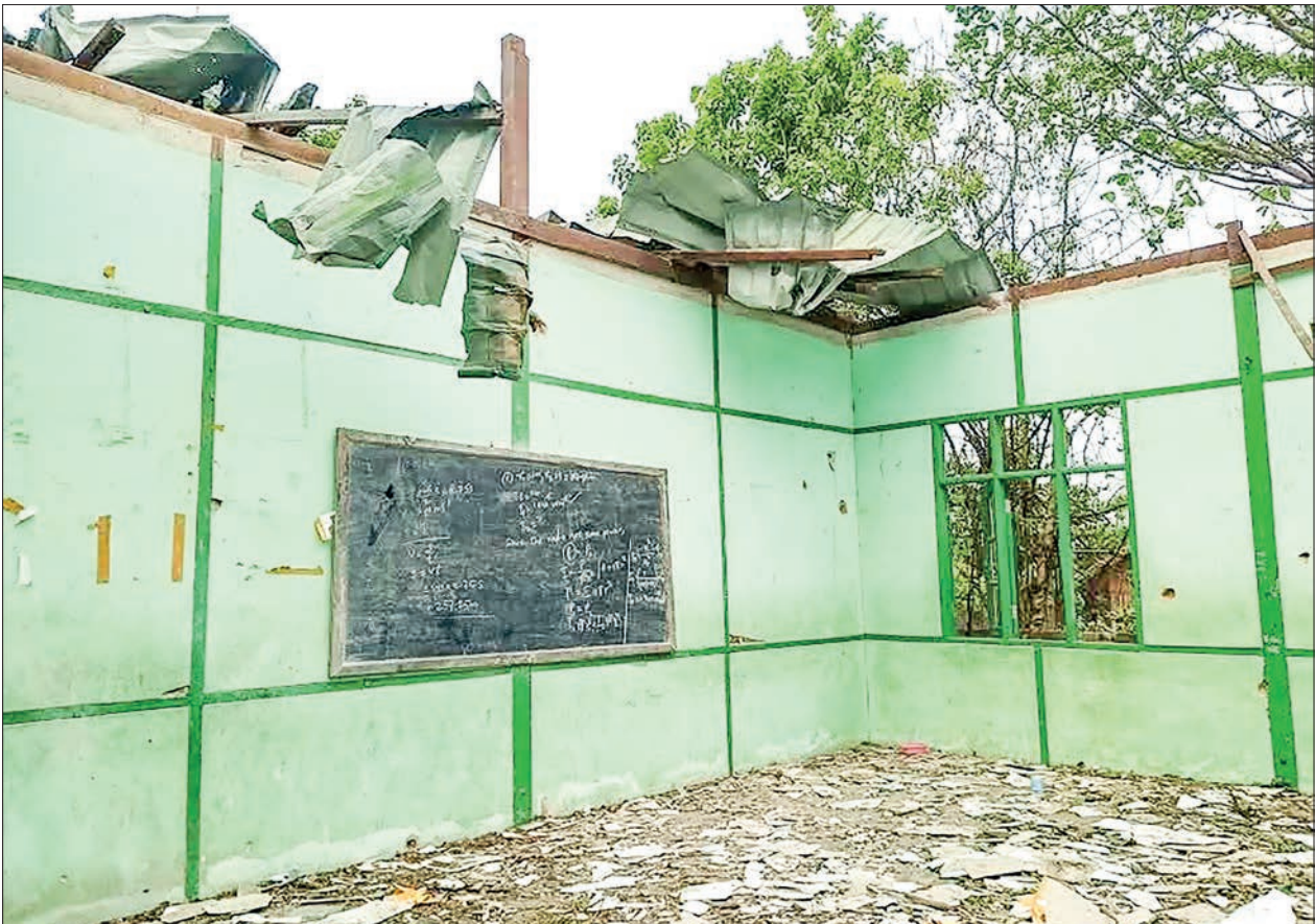
Photo shows damaged parts of the blast at the school in Ohtainkwin Village in Dabayin Township.