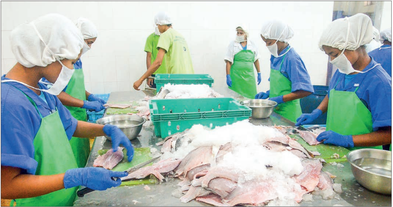
Female workers processing seafood at a cold storage facility.

MYANMAR conveyed about 30,000 metric tonnes of fish with an estimated value of US$29.46 million in April of the current FY (2024-2025), according to the Department of Fisheries. Myanmar exported $13.67 million worth of over 10,231 metric tonnes of fish by sea, while $15.79 million valued 19,640 metric tonnes of fish were sent to neighbouring countries through land borders. Myanmar's fish export reached over 27,250 metric tonnes in the corresponding period of the previous financial year (2023-2024), generating over $28.553 million. The figure showed a significant increase of over 2,620 tonnes ($0.9 million) compared to that of the previous FY. Myanmar steadily exports seafood to 40 countries, including China, Thailand, Bangladesh and Japan through maritime and border trade channels. More than 20 fish species, including hilsa, rohu, catfish, and seabass, are conveyed to foreign markets, according to the Myanmar Fisheries Federation. There are over 140 cold-storage seafood processing factories in Myanmar. The Department of Fisheries processes a licence renewal yearly. — NN/KK