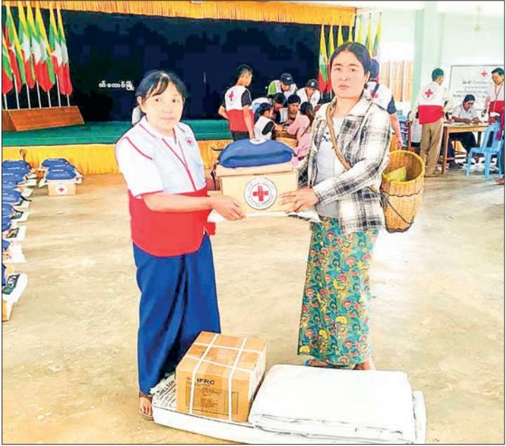
An MRCS official is seen handing over relief items to quake survivors in Pinlaung Township.

Women’s and men’s health and personal care items, mosquito nets, blankets, tarpaulin, clothes and kitchen utensils are also provided to each household. Mattresses for 30 elders above 65 years old and housing materials to 52 wholly damaged houses were also distributed. MRCS is exerting their efforts to reach out its a helping hand to the various regions that were battered by the earthquake. — ASH/KK