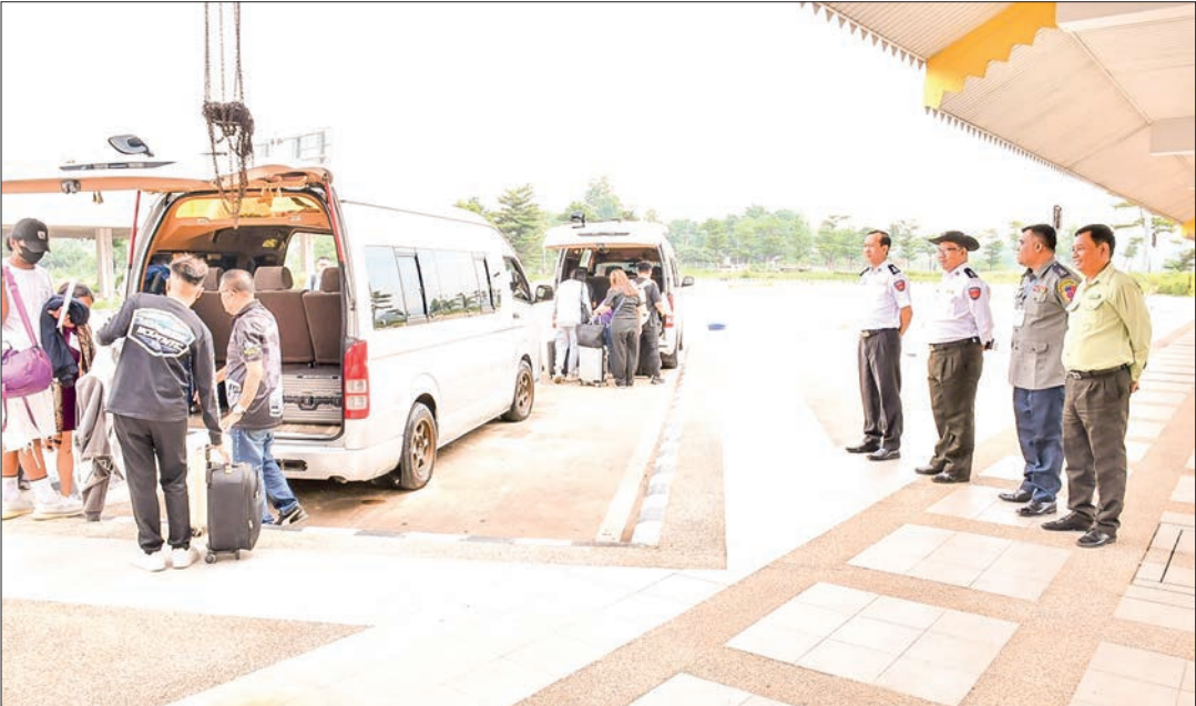
Immigration officials oversee the deportation of undocumented foreign entrants.

border areas. Between 30 January and 20 May 2025, authorities detained a total of 9,099 foreigners who had entered Myanmar illegally. Of these, 8,469 were deported to their home countries, while 630 are currently held in preparation for deportation. The Myanmar government is continuing its efforts to crack down on online scams and gambling activities, working closely with neighbouring and international partners to identify and prosecute all those involved, including foreign nationals. — MNA/KZL