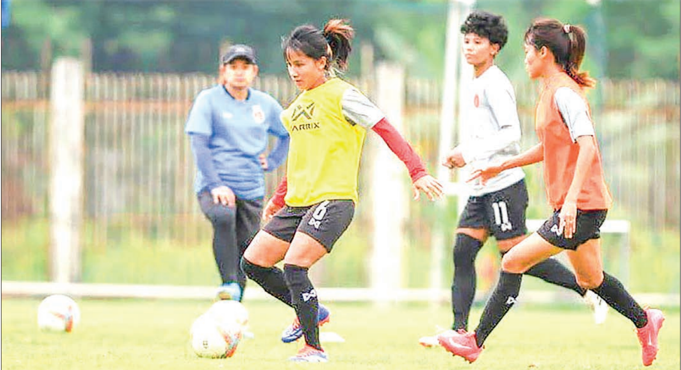
Myanmar reached the semifinal stage in all three editions and has claimed third place twice and fourth place once.

nament, the team is also scheduled to compete in the AFC U-20 Women's Asian Cup qualifiers. In the past three tournaments, Thailand has won the title twice, while Australia has won once. Myanmar reached the semifinal stage in all three editions and has claimed third place twice and fourth place once.