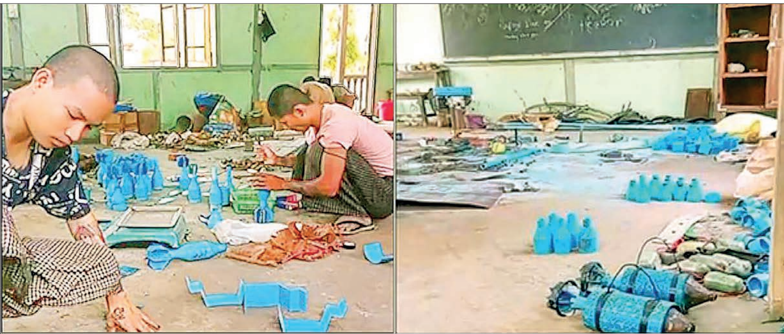
Photos show PDF terrorists manufacturing weapons and bombs in the school.