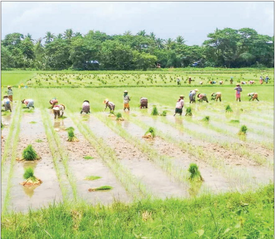
Farmers diligently transplanting rice in the paddy field.

MYANMA Agricultural Development Bank (MADB) notified that it has started to pay out monsoon agricultural loans to farmers this year. MADB, under the Ministry of Planning and Finance, yearly provides agricultural loans to farmers across the country. Farmers have already cleared previous loans before the monsoon cultivation season. Only when they paid off the debts could they take out new loans for the next growing season. MADB offers both short-term and long-term loans in line with rules and regulations. Starting from 19 May, the respective bank branches have disbursed loans to those farmers who have paid debts and interest. The interest per annum is set unchanged at five per cent this year as well. Those who want to get access to 2025 agricultural loans need to contact the MADB branches in the respective townships at the earliest. — NN/KK