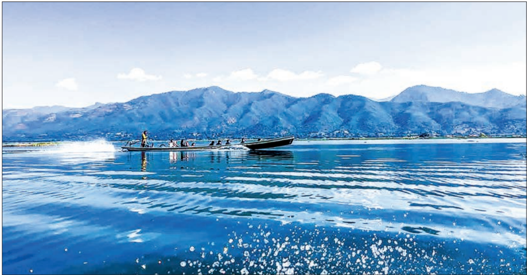
Some tourists visit to enjoy the beauty of the Inlay Lake by boat.

LOCAL tourism operators have reported that there are many travellers visiting the Kalaw-Inlay-Taunggyi route with beautiful natural scenery.