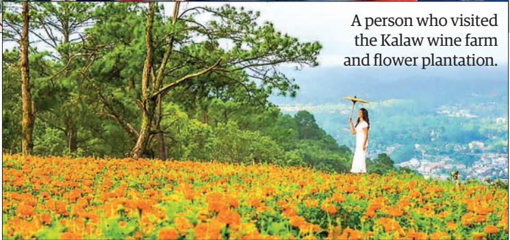
A person who visited the Kalaw wine farm and flower plantation.

In addition to the Kalaw-Inlay-Taunggyi tour, domestic travellers visit Bagan-NyaungU, PyinOoLwin, Kyaiktiyo, Hpa-an,