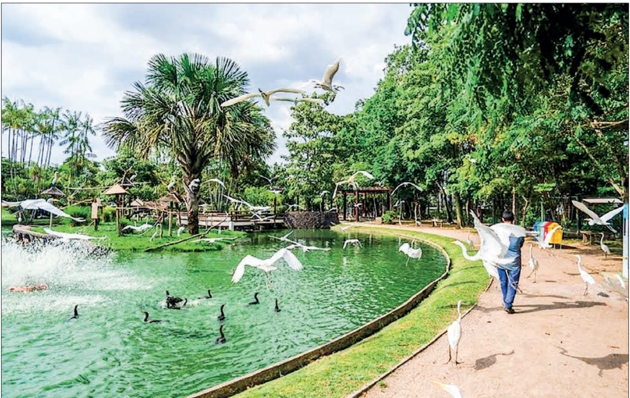
Birds fly at an ecological park in Belem, Brazil, 13 November 2025.

The event convenes representatives from nearly 200 countries and regions to focus on key climate initiatives.