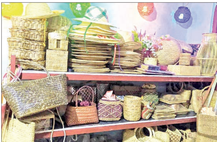
Some bamboo handicraft items are seen.

"The demand for bamboo items is good. Current basic worker's wage is over K 10,000. If people could do this work while staying at home, and earn for about K 8,000 to K10,000, then the industry would thrive. But when raw materials are expensive, and the cost of labour and the paints go up, people have to calculate the costs before working. They do it more as a hobby than for income. The domestic market alone has