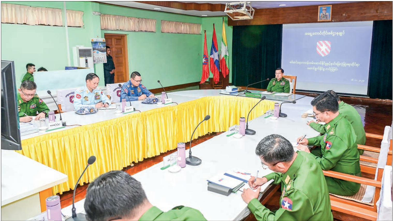
Chairman of the State Security and Peace Commission, Commander-in-Chief of Defence Services, Senior General Min Aung Hlaing presides over the meeting regarding general staff, adjutant and quartermaster measures taken by the South-East Command Headquarters yesterday.

It is necessary to successfully carry out military operations, security measures, and territorial administration within the Military Command area.