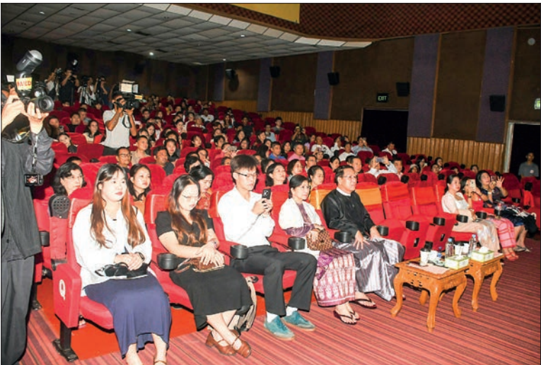
Union Minister U Maung Maung Ohn attends the opening ceremony of the China-Myanmar Film Festival in Yangon yesterday, while Chinese Ambassador to Myanmar Ms Ma Jia delivering at the ceremony.

AS part of a cultural exchange programme commemorating the 75 th anniversary of China-Myanmar diplomatic relations, the 2025 Chinese Image Film Week and the opening ceremony of the China-Myanmar Film Festival, which will run until 19 November, were held yesterday afternoon at Nay Pyi Taw Cinema in Kyauktada Township, Yangon. First, a video of the opening ceremony of the Chinese Image Film Week and the China-Myanmar Film Festival was shown. Then, Ambassador of the People’s Republic of China to Myanmar Ms Ma Jia delivered a speech. After that, Union Minister for Information U Maung Maung Ohn said: ‘Previously, film festivals hosted by China were held annually in Yangon and Mandalay. Myanmar audiences have always been fond of Chinese films and have enthusiastically supported them at these festivals. In interactions between countries and peoples, even if some audiences do not understand the language, the portrayal of stories in films has helped people understand each other and brought them closer. Myanmar and China are cooperating in all areas, and the two