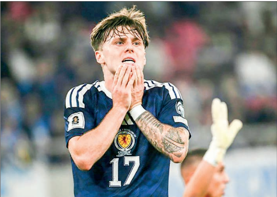
Scotland can still qualify automatically for the World Cup despite a 3-2 defeat in Greece.

SCOTLAND face a winner-takes-all shootout against Denmark on Tuesday with an automatic World Cup berth at stake despite a 3-2 defeat against Greece. On an evening of compelling drama on Saturday, Steve Clarke's men narrowly failed to recover from 3-0 down while Belarus held Group C leaders Denmark 2-2 in Copenhagen in a shock result. The Danes, with 11 points, lead Scotland by a single point after five matches ahead of their decisive meeting in Glasgow, though they have a far superior goal difference and can afford to draw. Scotland must secure all three points to reach their first World Cup since 1998. Scotland captain Andy Robertson said his team were relieved to still be alive. — AFP