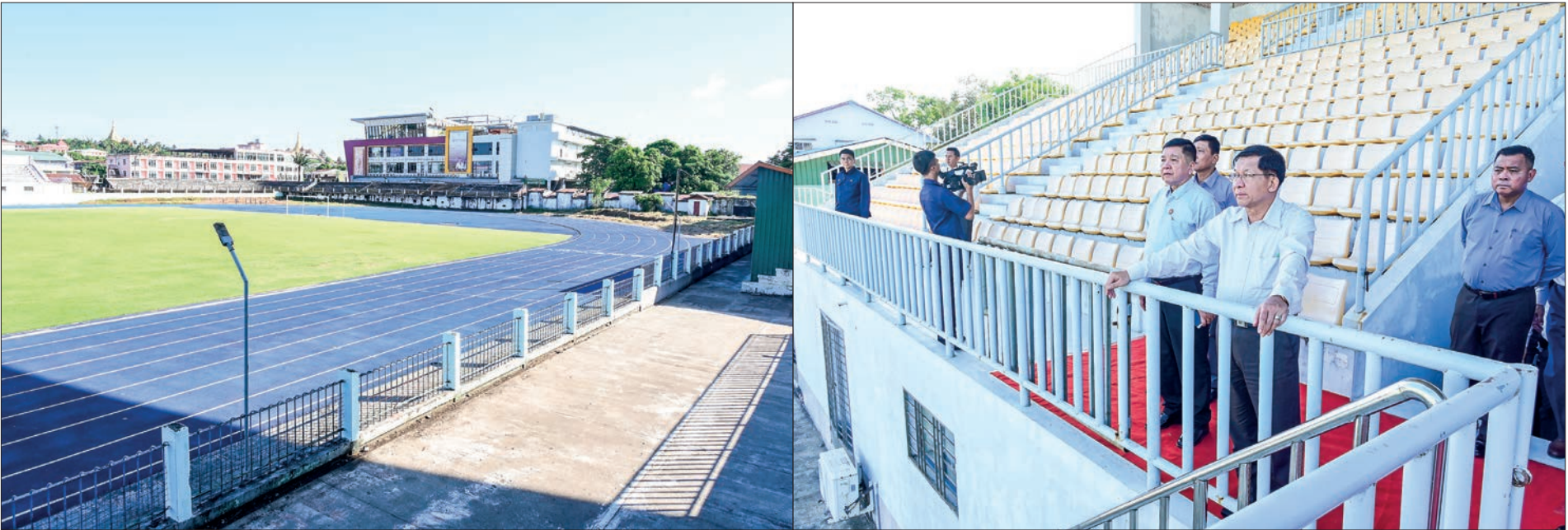
Acting President of the Republic of the Union of Myanmar, Chairman of the State Security and Peace Commission, Senior General Min Aung Hlaing inspects the Yamanya Stadium of the Sports and Physical Education Department in Mon State yesterday.

(An excerpt from guidance given by Chairman of the State Administration Council, Prime Minister Senior General Min Aung Hlaing to Shan State cabinet members and state-level departmental officials on 3 September 2024)