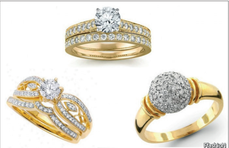
This photo showcases gold jewellery and ornaments crafted by Myanmar goldsmiths.

trade,” he added. Over 1,000 gold shops have sought a metal (gold) trading licence in Yangon Region. There are 1,500 gold shop operators seeking a gold business licence, with two new shops opening every month, Yangon Region Gold Entrepreneurs Association. — ASH/KK