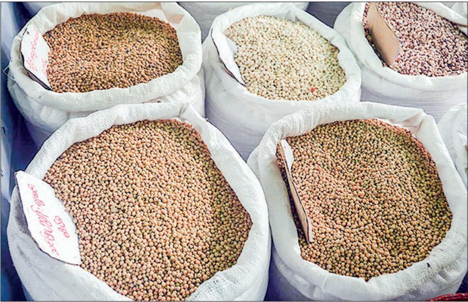
Beans and pulses neatly arranged for sale in the market.

planned to cover two townships each in Ayeyawady Region, Bago Region and Shan State. The first project is the soybean incorporation in rice crop rotation project to enhance agricultural productivity, and the second project is boosting soybean output to implement the research and development project for the soybean crushing project to ensure self-sufficiency of cooking oil and soybean meal. Furthermore, he urged building a Public Private Partnership (PPP) for farming research activities for high-grade and high-yielding soybean varieties, seed multiplication and distribution efforts to