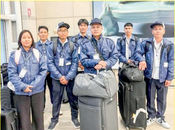
EPS worker, a Myanmar woman (first on the left) was at the airport on 19 March along with male workers.

will have to attend the job training course on 17 November and apply OWIC on 18 November. They will need to resubmit if they are unable to do by the schedule. Agencies will need to resubmit Excel soft copy of list of sending workers, copy of passport and copy of OWIC in a week from the departure date, to the Department of Labour, dolmigrationjapan@gmail.com. — MT/ZS