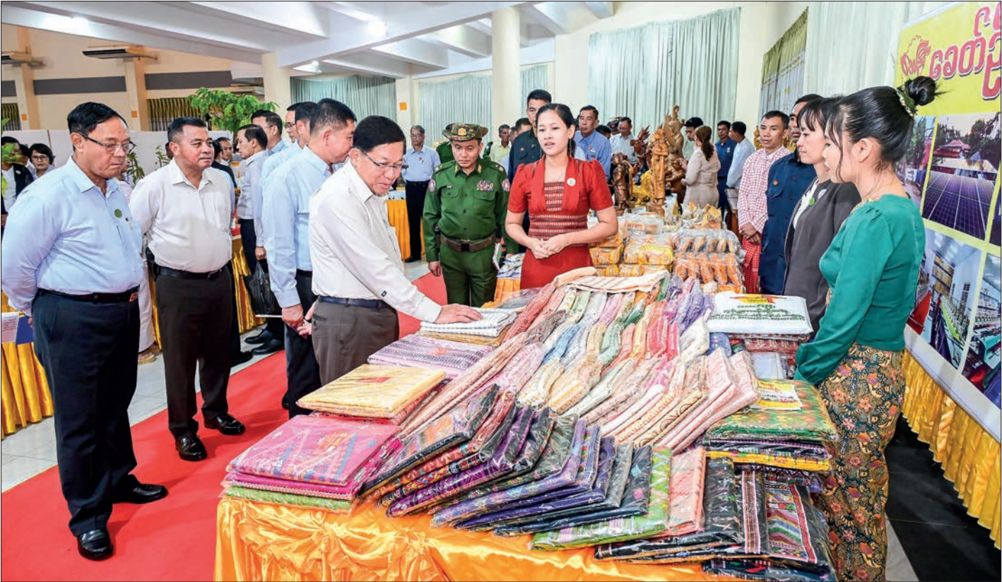
Acting President of the Republic of the Union of Myanmar, Chairman of the State Security and Peace Commission, Senior General Min Aung Hlaing views round textile products at the booth of MSME exhibition in Mawlamyine yesterday.

Although the government builds basic infrastructure, reconstruction efforts are ongoing to repair damage caused by certain destructionists. As a result, the progress of further national development projects has been delayed.