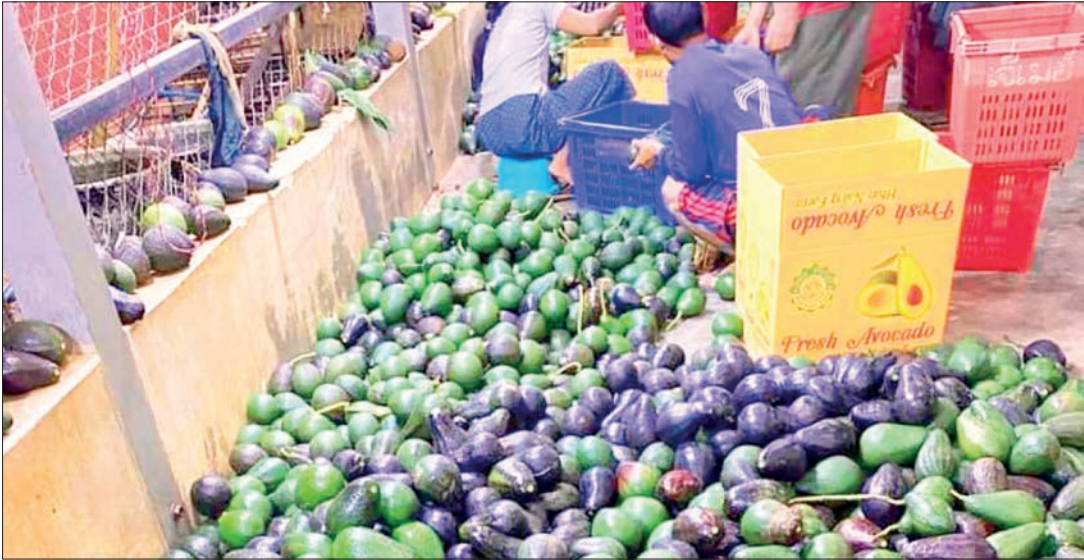
This photo showcases Hass avocados prepared for export.

THE Myanmar Avocado Producers and Exporters Association (MAVO) said that this year’s high-quality Hass avocados will be exported to Singapore and Thailand mainly. Last year, about 3,000 tonnes of high-quality Hass avocados were produced during the avocado season, and MAVO expects to produce even more this year. Hass avocados and Buccaneer avocados, which are commonly grown locally, are mainly consumed in major cities such as Yangon and Mandalay. The association urges avocado farmers to prioritize varieties that meet market demand, as locally grown avocados are in strong demand in both domestic and international markets. Avocados are usually harvested from September to December each year, and in addition to Hass avocados, other varieties such as Buccaneer, 034, Booth 7, and Amara are consumed domestically and exported to foreign markets.