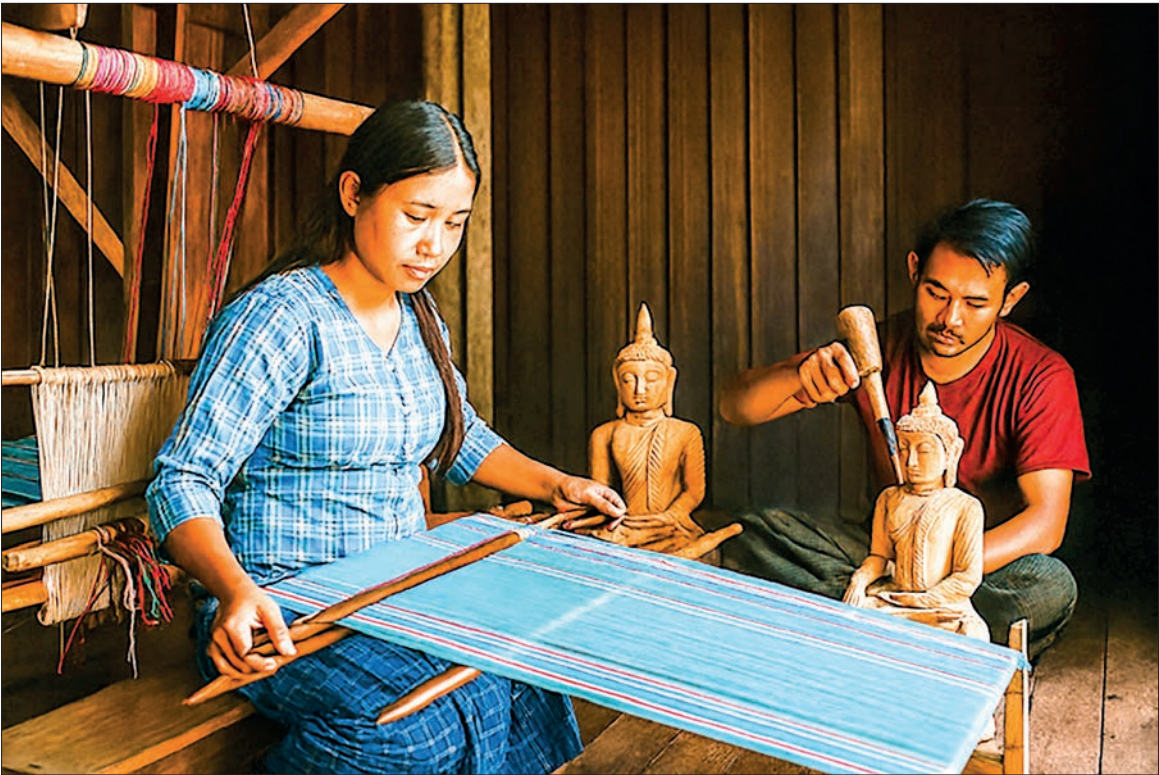
Myanmar's artisans are not just makers; they are memory keepers. Through weaving and woodwork, they hold the threads of history and carve the contours of identity.

The process itself is deeply meditative and communal. Women, who make up the majority of weavers, often gather in open-air huts, chatting and singing as they work. The loom becomes a space of connection – between generations, between craft and culture, between past and present.