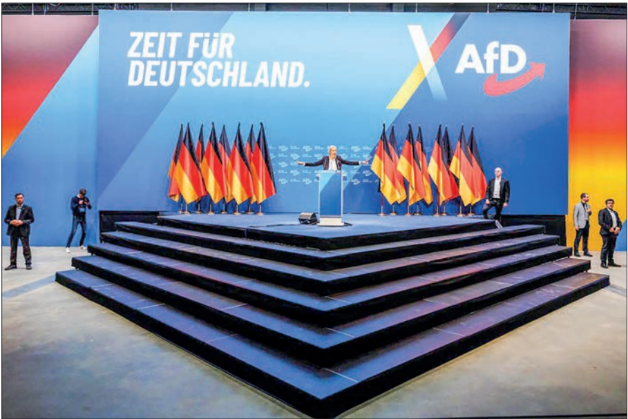
Alice Weidel, co-leader of Germany’s far-right Alternative for Germany (AfD) party, addresses delegates during a party congress in Riesa, eastern Germany on 11 January 2025.

“Quite the contrary, this pressure certainly strengthens our understand-