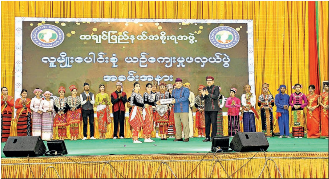
Member of the State Security and Peace Commission and Union Minister for Border Affairs and for Ethnic Affairs Lt-Gen Yar Pyae presents an honorary award to dance troupes in Myitkyina, Kachin State, yesterday.

Initially, the Union Ministers, the State Chief Minister, members of the Central Advisory Body of the National Defence and Security Council, the Chief Justice of the State High Court, and the Chairman of the Association of Myanmar-China-India Exchange and Flow of Goods formally opened the multi-ethnic cultural exchange event. Following this, the State Chief Minister