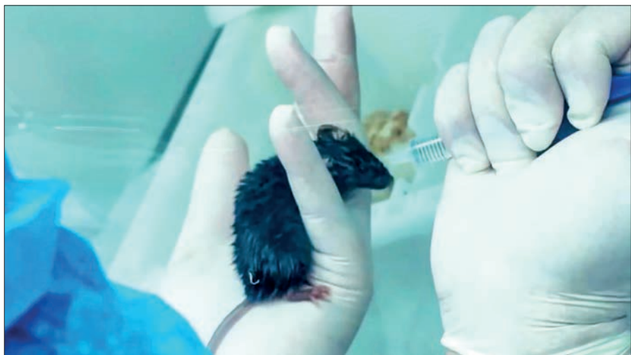
The researchers plan to examine the mice's behaviour, along with key physiological and biochemical indicators, to assess their stress responses and how they adapted to spaceflight conditions.

Upon landing, the mice from the life science experiments underwent immediate field processing. Researchers will analyze their behaviour and key physiological and biochemical indicators to understand the animals' stress responses and adaptive mechanisms to spaceflight conditions. These findings will provide critical insights into how space environments affect living organisms, according to the CSU. Other biological samples — including zebrafish, hornwort, streptomyces, planarians and brain organoids — along with select materials science and combustion experiment samples, were transported to the CSU in Beijing at 00:40 am Saturday. After initial status checks, these specimens were handed over to research teams for further study. The remaining samples will be transported to Beijing along with the Shenzhou-21 return capsule. — Xinhua