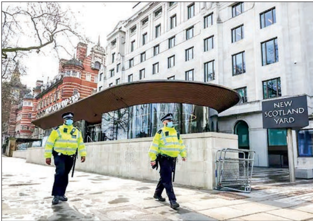
Police officers walk past New Scotland Yard, the headquarters of the Metropolitan Police Service in London, UK on 15 March 2021.

be open in both directions, including to show Moscow that “there are sensible people in Germany and not only war-mongers,” Kotre added. — SPUTNIK