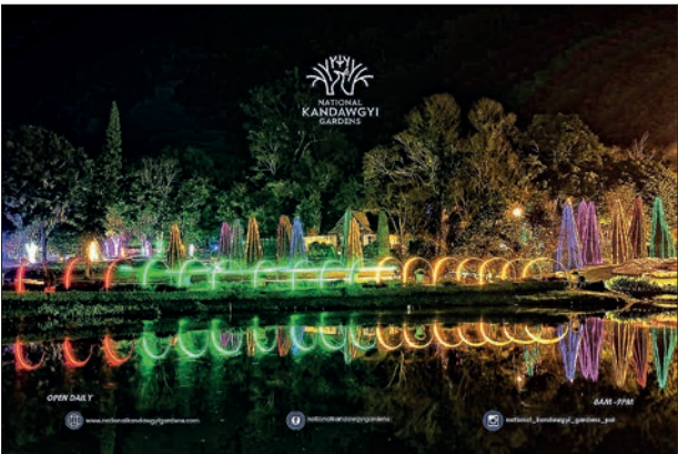
A glimpse of night scenery at the National Kandawgyi Garden in PyinOoLwin.

During the one-month festival period, live musical performances and other entertainment programmes will be presented, particularly on busy days, including the opening ceremony. Additional performances, such as music shows, magic shows and dance presentations, will be held during Christmas, New Year, Independence Day and weekend holidays.