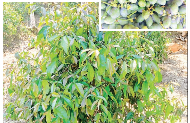
Photos feature a Tanyin plantation in Pyigyimandaing, highlighting thriving Tanyin fruit in close-up view.

The people are urged to receive vaccination of COVID-19 without fail as full-time vaccination of COVID-19 and receiving booster shots can effectively mitigate infection of the virus, severe suffering from the disease and increase of death rate due to the disease.