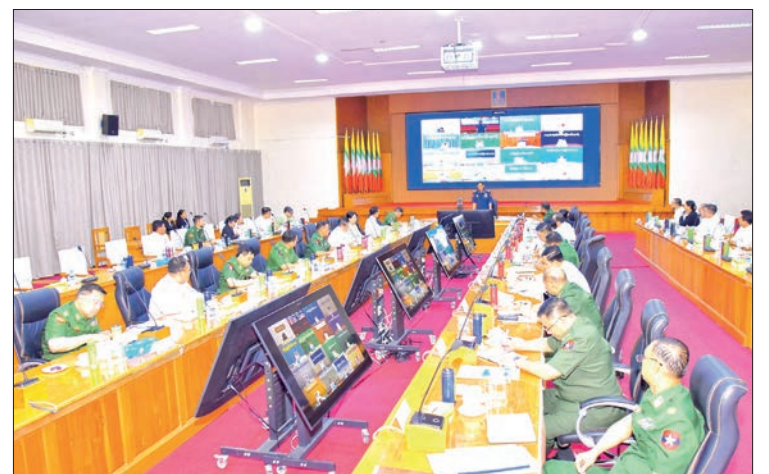
Union Defence Minister General Tun Aung addresses the coordination meeting of the Central Body for Summoning People's Military Servants.

Members of the central body and Nay Pyi Taw, Region/State committees' chairpersons and officials reported on the matters related to military training.