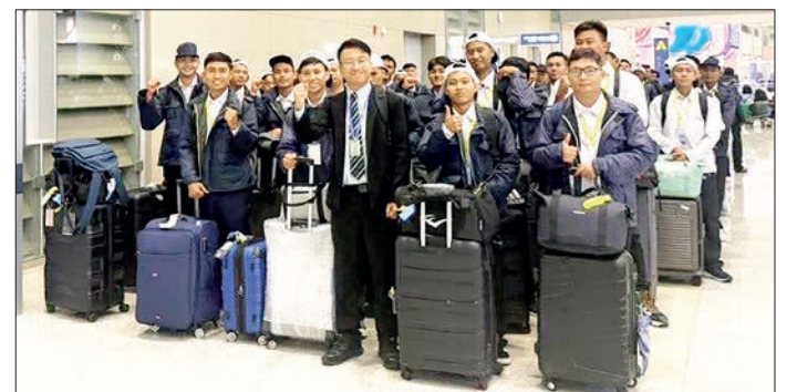
New Myanmar EPS workers are seen arriving at the Incheon International Airport on 12 May.

He also spoke with officials from the Human Resources Development Service of Korea about work that requires coordination and urged them not to hesitate to contact the embassy if there is an issue, said the embassy. — MT/ZS