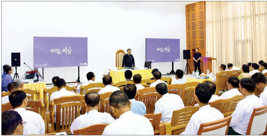
Pyithu Hluttaw Speaker U Khin Yi meets Pyithu Hluttaw representatives and Region Hluttaw representatives in Magway Region yesterday.

He underscored that the Hluttaw must review the previously repealed laws for the sake of national security, public peace and stability. Committees formed