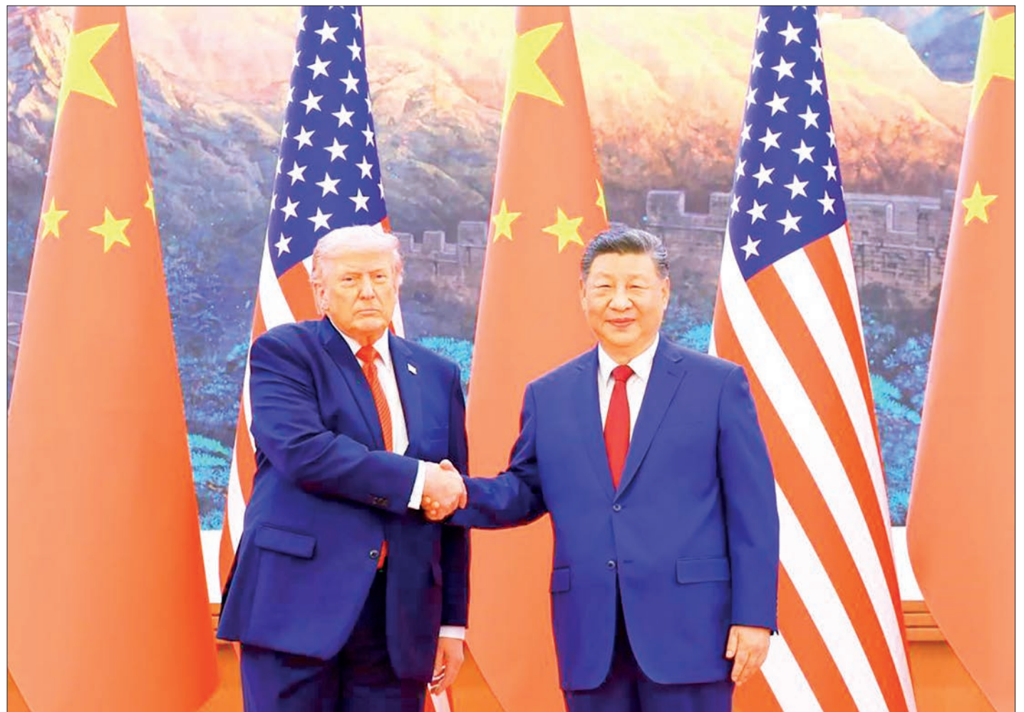
Chinese President Xi Jinping holds talks with US President Donald Trump, who is on a state visit to China, at the Great Hall of the People in Beijing, capital of China, 14 May 2026.

The building of a constructive China-US relationship of strategic stability should not be a mere slogan, but concrete action taken by both sides towards the same goal.