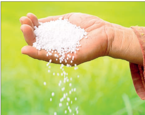
The 2026 war in Iran has severely disrupted global fertilizer supplies, with over 30 per cent of global urea and 20 per cent of phosphorus passing through the blocked Strait of Hormuz.

struck with Indonesia's state producer PT Pupuk, it said, adding the move aimed to provide certainty for farmers during planting decisions, ensuring domestic and export food supply. The government has also announced a 7.5-billion-Australian-dollar (US$5.43-billion) fuel and fertilizer security facility to boost storage and supply, alongside measures to streamline fertilizer imports and strengthen industry coordination. — Xinhua