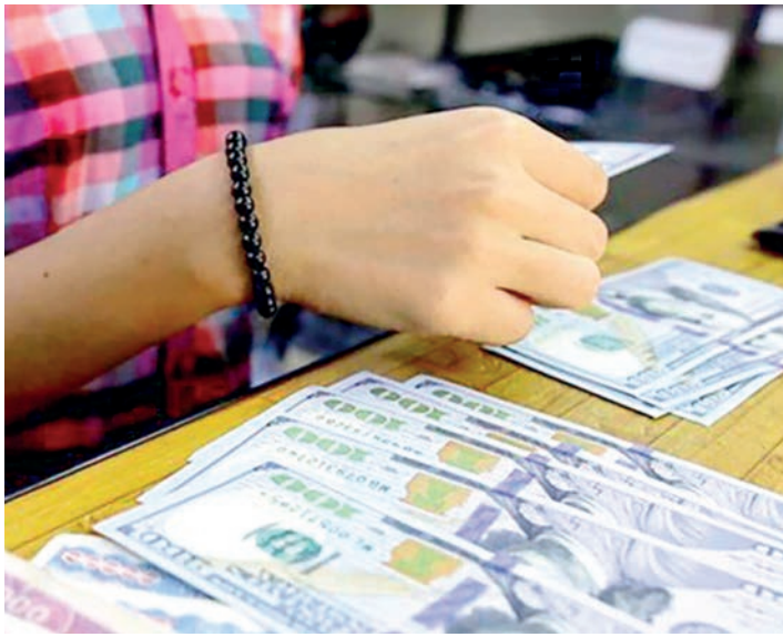
The USD exchange rate has steadied following the CBM's announcement, allowing for free trading at market prices.

CBM injected forex into the market, with a view to curbing the instability in the foreign exchange market and currency devaluation. Accord-