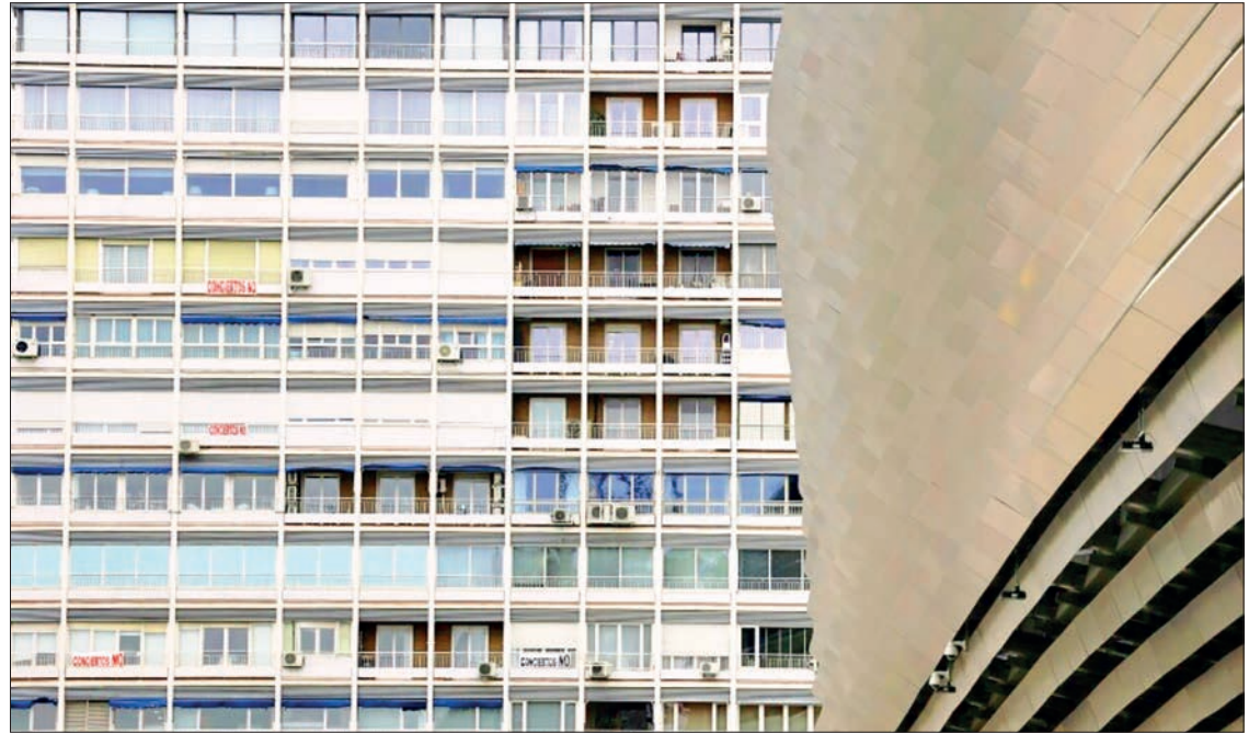
This picture taken on 8 October 2024 shows banners put on the balconies by neighbours protesting against concerts at Real Madrid’s Santiago Bernabeu stadium.

The proceedings targeted the company Real Madrid Estadio, which runs the iconic stadium, reopened in 2023 after a rebuild, as well as its adminis-