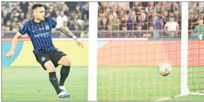
Lautaro Martinez scores Inter Milan's second goal in the Italian Cup final, won 2-0 against Lazio.

INTER Milan won the Italian Cup on Wednesday after beating Lazio 2-0 and completing a domestic double alongside their 21 st Serie A title.