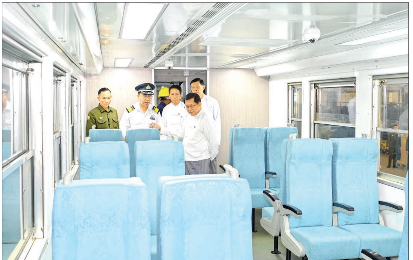
President U Min Aung Hlaing inspects the interior of a train carriage during his tour of the new Locomotive Assembly Factory (Nay Pyi Taw) yesterday.

The President pointed out that at present, due to changes in global political conditions, fuel shortages are being encountered. In such circumstances, efforts must be made to improve public transport services for the benefit of the general public.