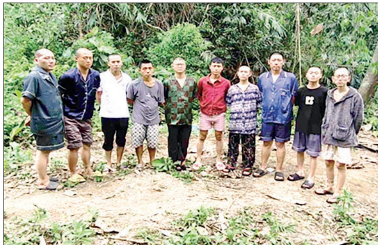
Images depict detained Chinese online scammers and confiscated scam-related materials.

MYANMAR authorities arrested 90 Chinese online scammers and gambling items in Metman township of Shan State (North), and such information has already been released on 12 and 13 May.