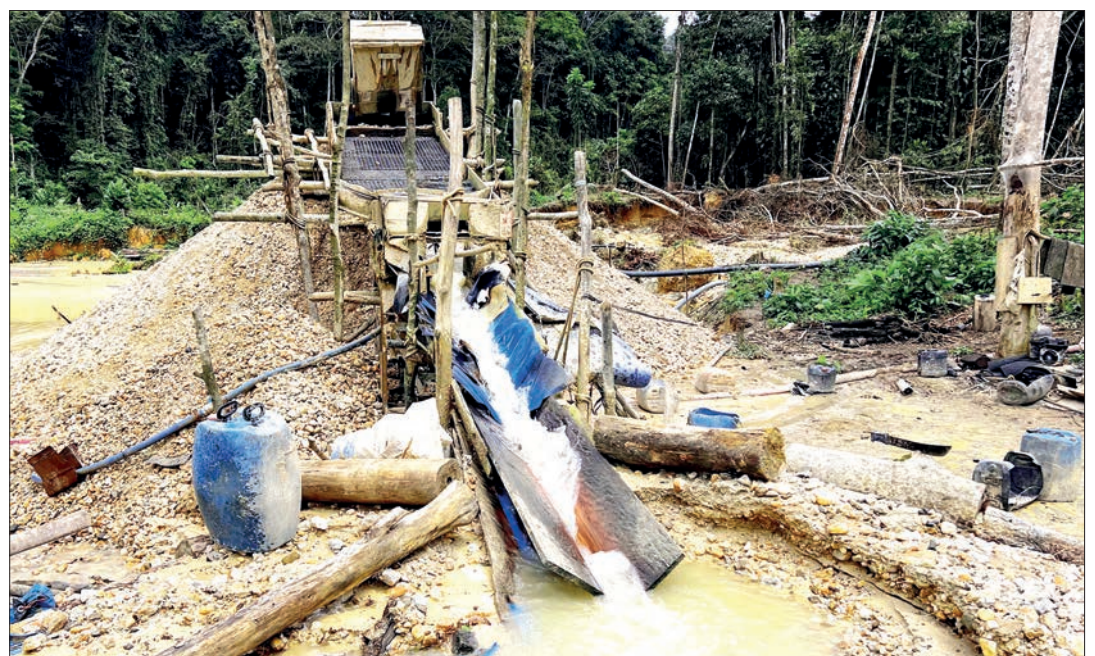
Illegal gold miners in the Brazilian Amazon devastate pristine rainforests, contaminate vital waterways with toxic mercury, and trigger severe humanitarian and health crises for indigenous communities.

"What used to be primarily a conservation challenge has become a political and security crisis," he added.