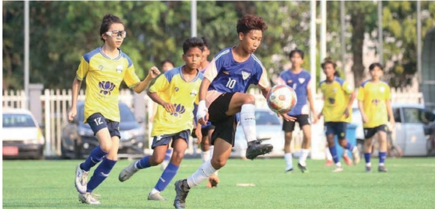
East Dagon Star and Future Star compete in the Yangon Zone qualifiers.

best eight teams: four from Yangon, second-placed team from the other three zonal champions and the best zones. — Ko Nyi Lay/KZL