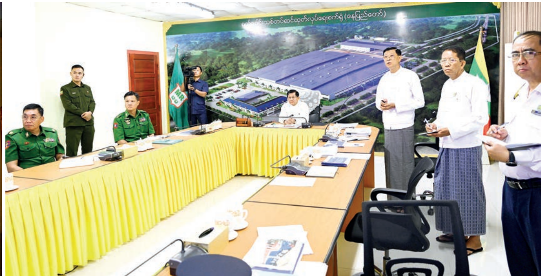
President U Min Aung Hlaing hears reports on railway and bridge construction, locomotive and carriage production, operation of DEMUs and battery electric trains, railway repairs, and training programmes conducted by Myanma Railways.

“ ... at present, due to changes in global political conditions, fuel shortages are being encountered. In such circumstances, efforts must be made to improve public transport services for the benefit of the general public.