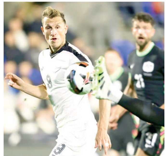
New Zealand captain Chris Wood wants his team to "create some history" at next month's World Cup.

"It's been a long time, 16 years, since we've been in the World Cup," Wood said via video link at the squad