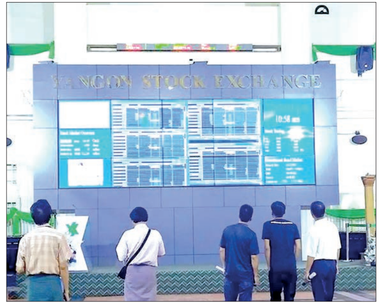
This photo shows market observers at the Yangon Stock Exchange.

Furthermore, the grand trading values of the eight listed companies on the exchange were recorded at K1.63 million from 332,880 shares in April, K2.889 billion from 693,616 shares traded in March 2026, K1.7 billion with 469,160 shares and K1.22 billion with 382,083 shares traded in January, according to YSX's monthly report. — ASH/KK