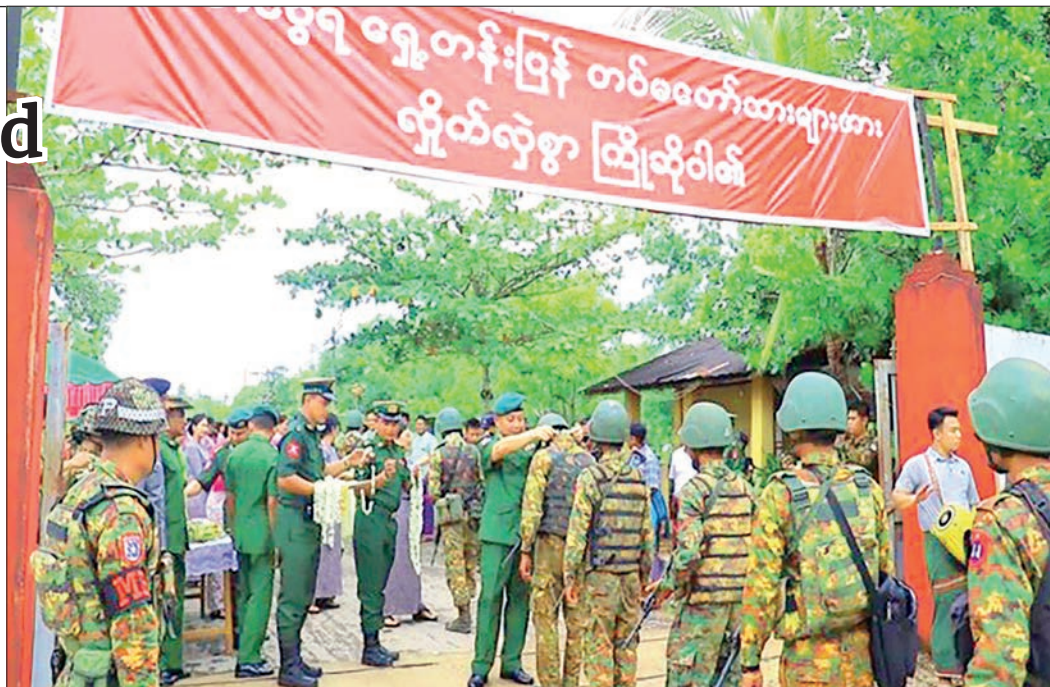
Triumphant Tatmadaw members are seen being warmly welcomed back at the South-East Command Headquarters.

The commander delivered a congratulatory speech and presented honorary cash awards to the returning personnel before joining them for a special lunch.