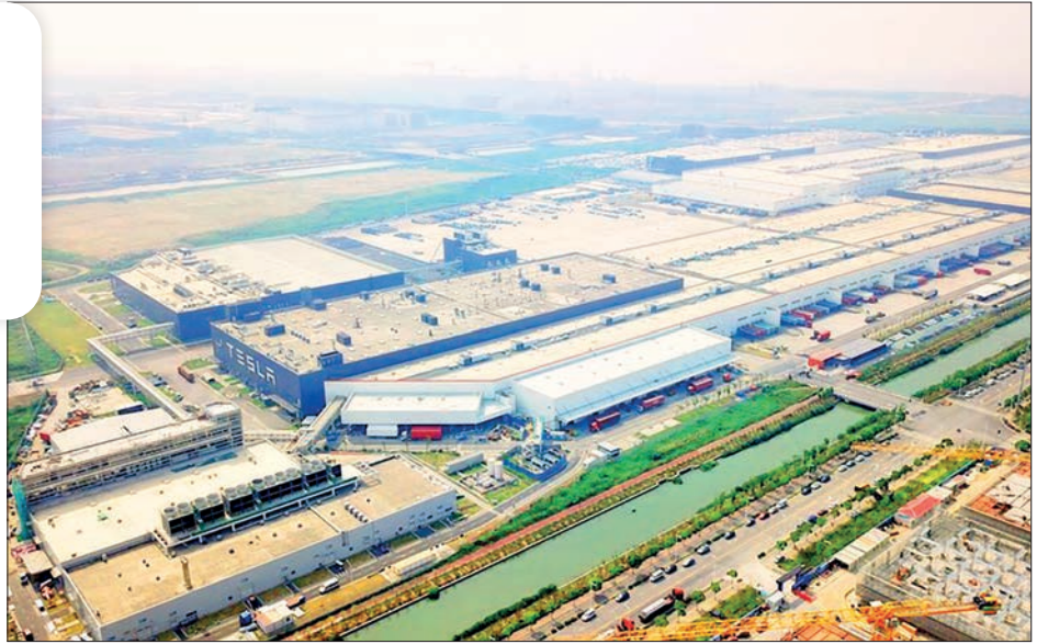
Musk is part of a delegation of business leaders to China, where his interests include Tesla's electric vehicle factory and solar panels. This aerial photo taken on 20 August 2022 shows the Tesla Gigafactory in the Lin-gang Special Area of China (Shanghai) Pilot Free Trade Zone in east China's Shanghai.

involved in China's reform and opening up, and both sides have benefited from this. Noting that China's door will only open wider, Xi said China welcomes the United States to enhance mutually beneficial cooperation with China, and expressed belief that US companies will enjoy even broader prospects in China. — Xinhua