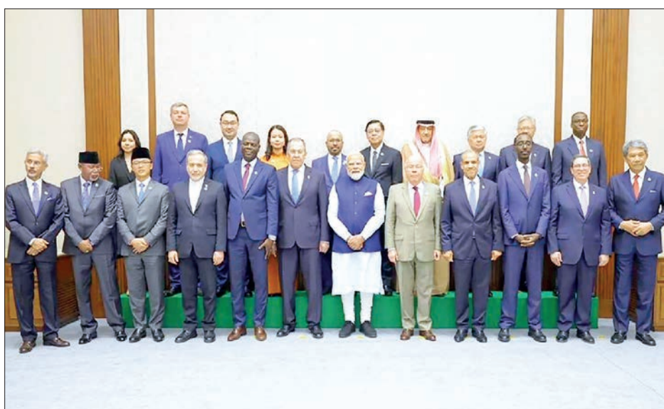
Prime Minister Modi joined the BRICS ministers and delegates for the official family photo.

beneficial and win-win in nature, said Xi. "Where disagreements and frictions exist, equal-footed consultation is the only right choice," he said. — Xinhua