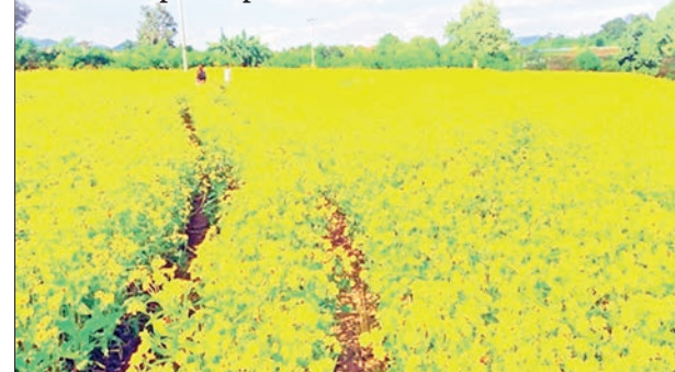
This image displays an oil crop plantation in Magway Region.

Due to insufficient domestic edible oil production, Myanmar still has to import palm oil from abroad. During the 2025-2026 financial year, nearly 8.7 million acres of groundnuts, sesame, sunflower, mustard, niger and soybean were targeted for cultivation, and it is estimated that around 860,000 tonnes of edible oil could be produced if the oil crops are processed. — ASH/MKKS