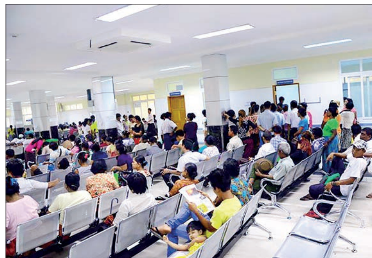
Patients are seen receiving medical care at the OPD of Yangon General Hospital.

According to the latest estimates from the Ministry of Health and the World Health Organization, approximately 1.1 million people in Myanmar are living with chronic hepatitis C. This accounts for roughly 2.7 per cent of the population. Hepatitis C is a common blood-borne viral liver disease. Most people infected are unaware they have the virus. It is primarily spread through blood-to-blood contact and the use of injections. — ASH/MT/ZN