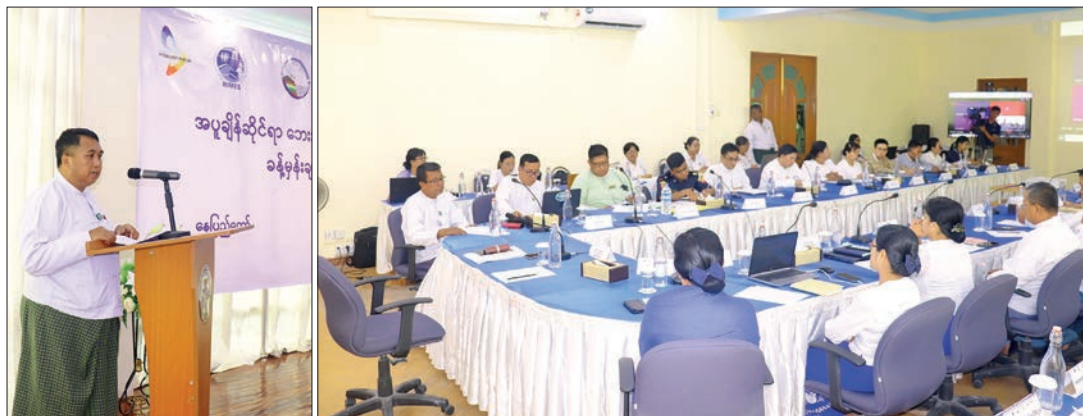
The Stakeholders Consultation Workshop on Impact-Based Forecasting (IBF) is underway yesterday.

THE opening ceremony of the Stakeholders Consultation Workshop on Impact-Based Forecasting (IBF) was held in the Multi-Hazard Early Warning Centre, Nay Pyi Taw, organized by the Department of Meteorology and Hydrology (DMH), Ministry of Transport, yesterday.