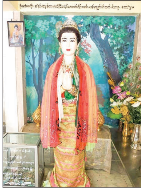
Photos capture the ceremony for Princess Supankahlya of Thailand at Kyaikkaloh Pagoda.

A discussion exploring the life of Princess Supankahlya, who is linked to the history of Toungoo, Myanmar, will take place on 21 December in the ancient city of Phitsanulok, Thailand.