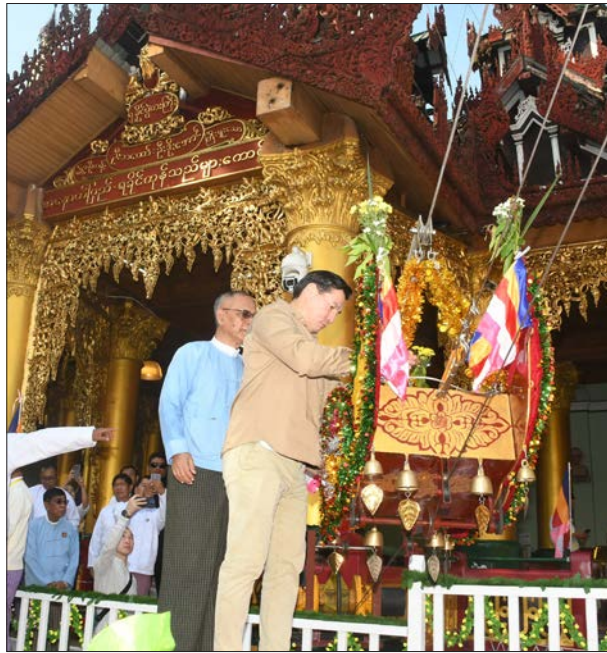
Mr Batu Sergeevich Khassikov (left), Head of the Republic of Kalmykia of the Russian Federation and the delegation pay homage to the Shwedagon Pagoda.