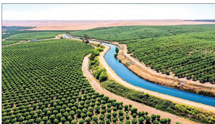
In an aerial view, an irrigation canal runs between almond orchards on 26 May 2021 in Snelling, California.

If a major trade war were to erupt, the report said, Califor-