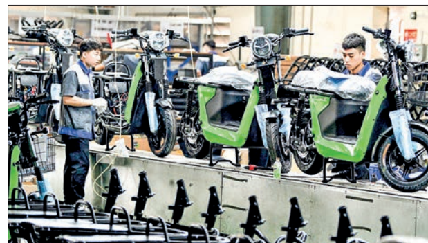
This photo taken on 7 November 2024 shows workers assembling electric motorbikes at the Selex factory in Hanoi.

During the January-November period, the country saw over 147,200 new enterprises set up with a total registered capital of over 1.45 quadrillion Vietnamese dong (US$57.1 billion), a reduction of 0.5 per cent in the number of enterprises while the registered capital is relatively