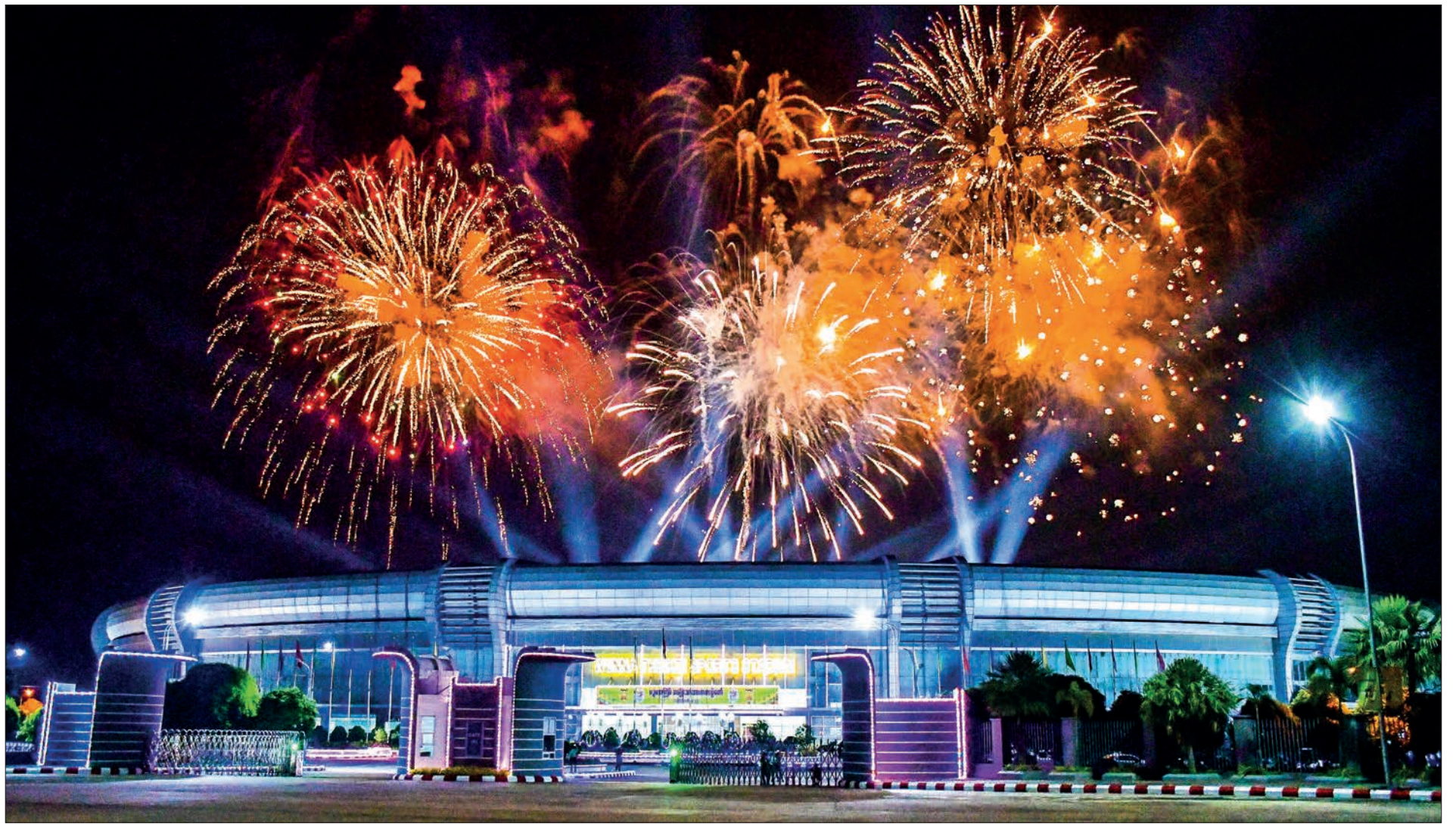
Fireworks light up the sky to mark the opening of the Fifth National Sports Festival following SAC Chairman PM Senior General Min Aung Hlaing's unveiling speech yesterday.

Promoting sports can help cultivate a disciplined and healthy spirit, strengthening the nation's human resources, which can contribute to the country's success through unity and cooperation.