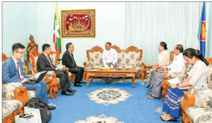
The ASEAN-China Centre Secretary-General calls on Deputy Minister U Ko Ko Kyaw yesterday.

DEPUTY Foreign Affairs Minister U Ko Ko Kyaw received Mr Shi Zhongjun, Secretary-General of the ASEAN-China Centre (ACC), and members of the delegation at the Ministry of Foreign Affairs, Nay Pyi Taw, yesterday.