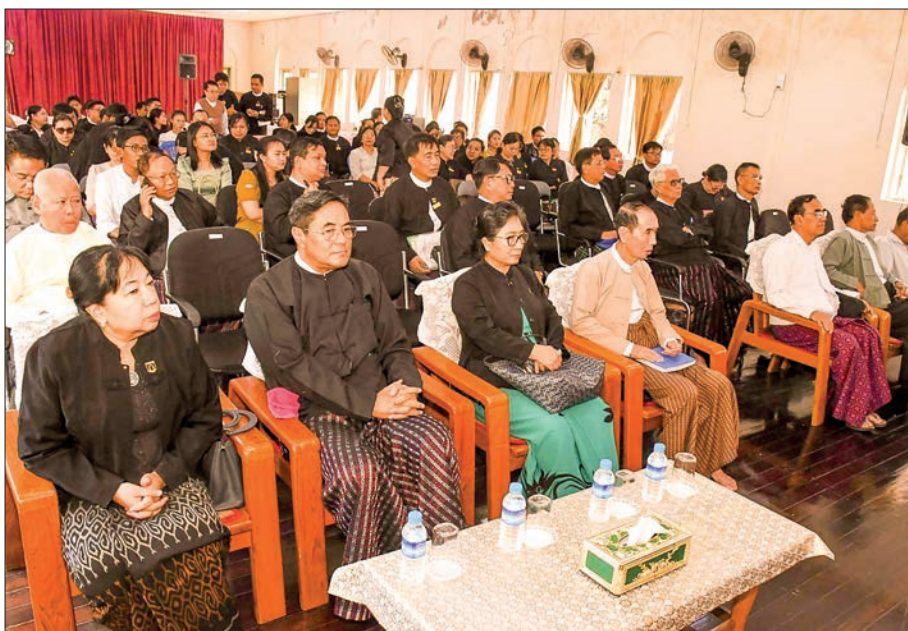
The awareness-raising seminar on sharing knowledge about Trademark Law, Industrial Design Law, Patent Law and Copyright Law (IP Laws) is in progress on 7 December 2024.

AN awareness-raising seminar on the Trademark Law, Industrial Design Law, Patent Law, and Copyright Law (collec-