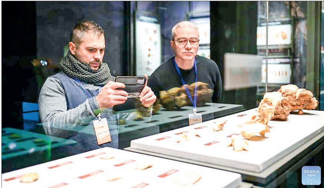
International experts attending the Hualongdong site academic conference visit the exhibition hall of the Hualongdong site in Dongzhi County of Chizhou City, east China's Anhui Province, 6 December 2024.

Chinese researchers reported their latest discoveries and studies concerning the Hualongdong ancient human site at an academic conference held in Dongzhi County from Friday to Sunday this week. Nearly 100 researchers and scholars, including over a