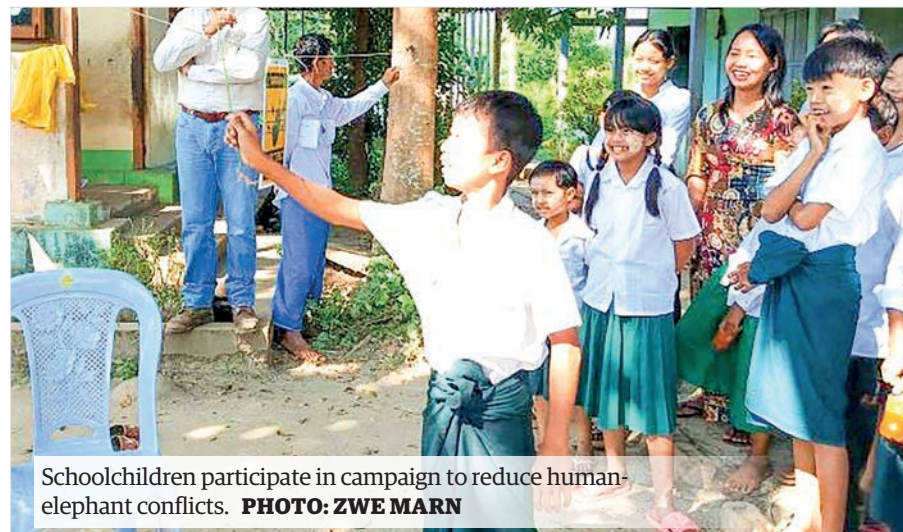
Schoolchildren participate in campaign to reduce human-elephant conflicts.

THE Forest Department and NGO jointly install electric fences and conduct awareness campaigns to reduce the death cases through human-elephant conflicts in Yangon Region, according to Taikkyi Township Forest Department.