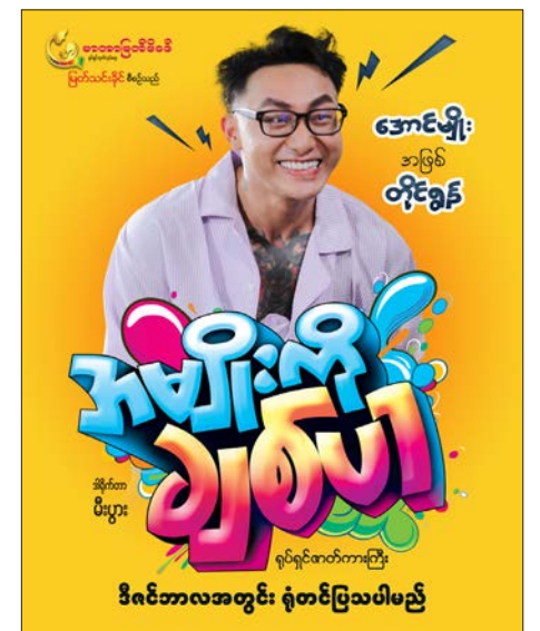
This image showcases the poster of the 'A Myo Ko Chit Par' movie.