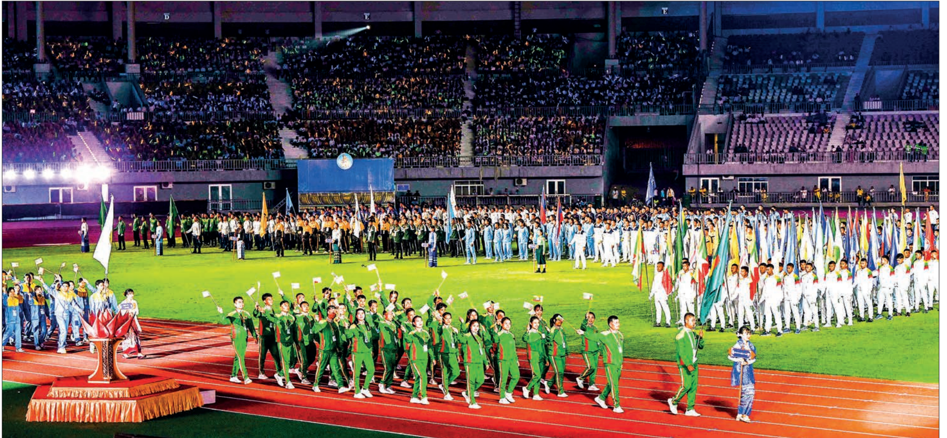
Sports contingents march into Wunna Theikdi Stadium for the launch of the Fifth National Sports Festival yesterday in Nay Pyi Taw.