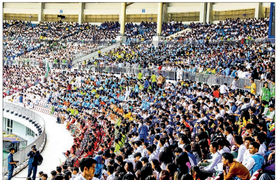
Spectators crowd the stands at Wunna Theikdi Stadium.