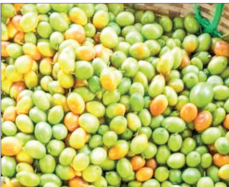
This image depicts sweet 'Salay' plums at the Kyaukpadaung fruit market.

"Orders are placed from different regions and states but the major destination is Mawlamyine. The price is pretty good. It can't say about the production now but can predict at late December," she added. — Thit Taw/ZS