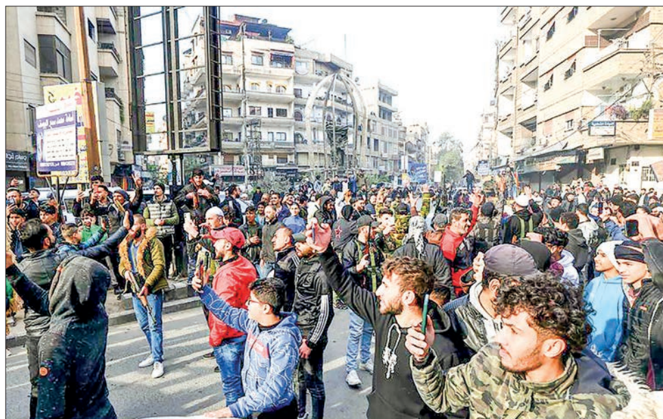
Locals rally in a street in Damascus, Syria, 8 December 2024.

IRANIAN President Masoud Pezeshkian said on Sunday that Syria's future, including its political and ruling systems, should be decided only by the Syrian people.