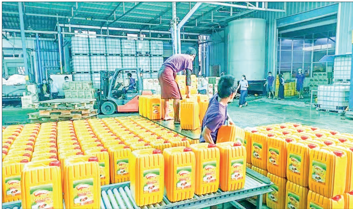
Workers prepare for distribution at the local cooking oil mill.

To control overcharging, the Consumer Affairs Department under the Ministry of Commerce informed the consumers of lodging the complaints for overcharging through the call