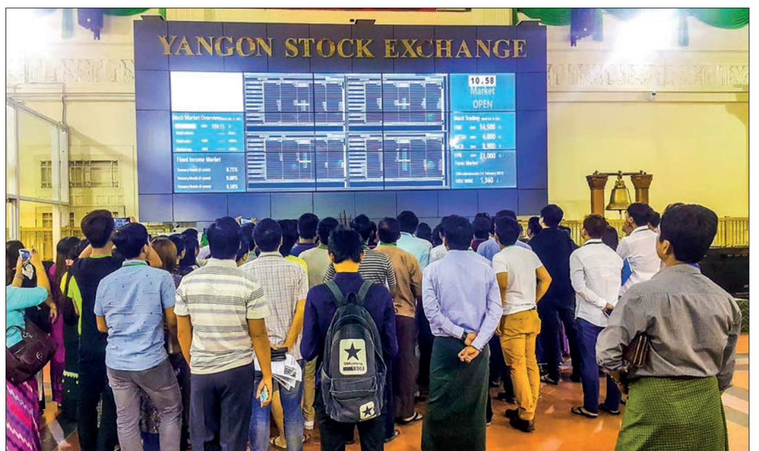
Shareholders observe the index panel at Yangon Bourse.

THE grand trading value of the eight listed companies on the Yangon Stock Exchange (YSX) exceeded K933 million with 247,803 shares in November, according to the monthly report released by the exchange.