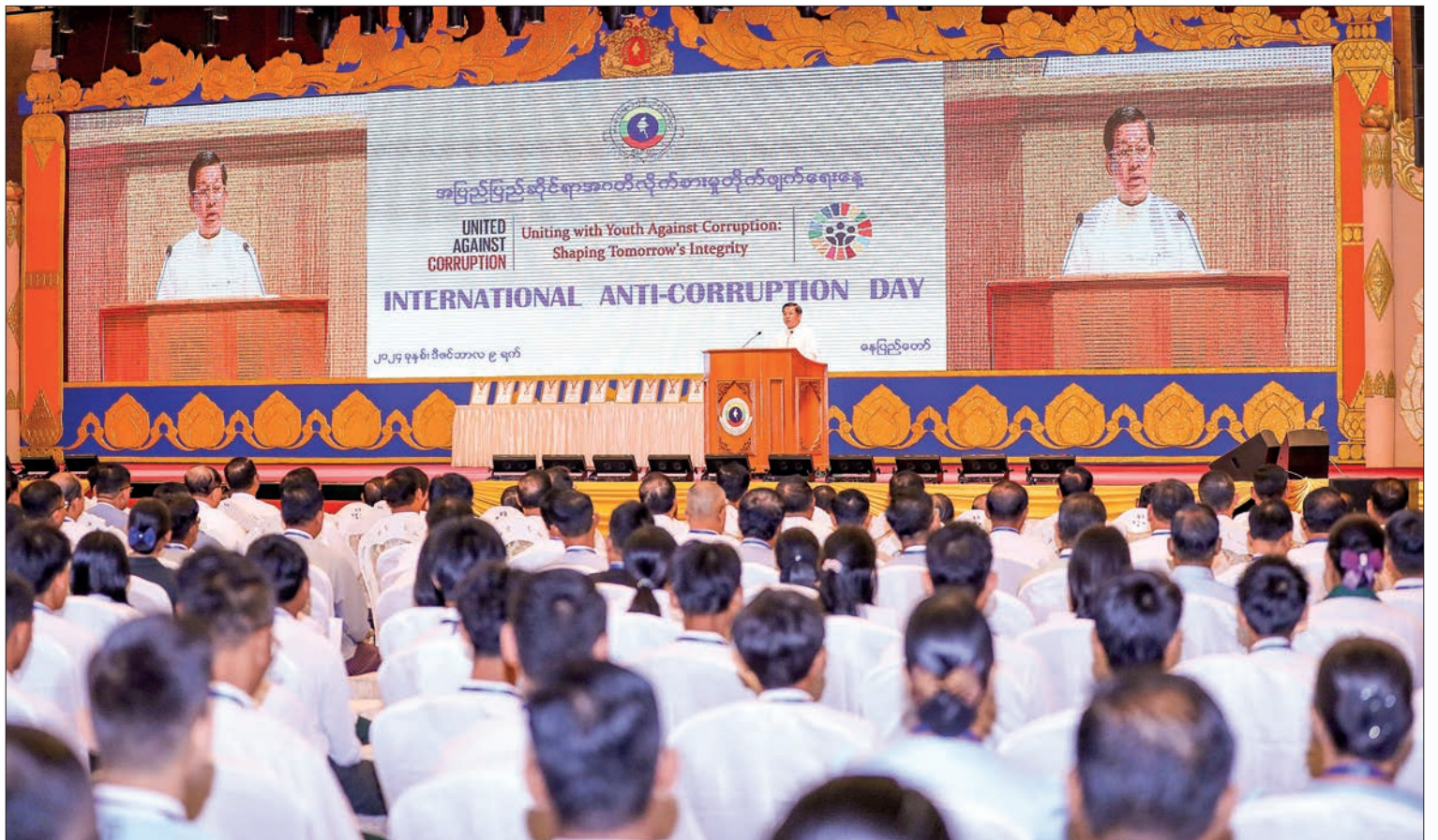
State Administration Council Chair PM Senior General Min Aung Hlaing addresses the International Anti-Corruption Day ceremony yesterday.

He unveiled that the Ministry of Education and the Ministry of Science and Technology jointly organize edutainment programmes and youth discussions at basic education schools and universities to promote the