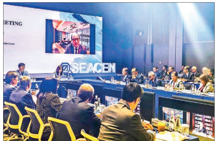
The 60 th Conference of the Governors of the South East Asian Central Banks, Seminar, and BOG meeting in progress on 6-7 December in South Korea.

On 7 December, they discussed the launching of in-person and online training courses by SEACEN Centre in 2025, research projects, the estimated budget for 2025 approved by EXCO, and rules and regulations for Senior Managements of SEACEN at the closed-door session of SEACEN. — MNA/KTZH