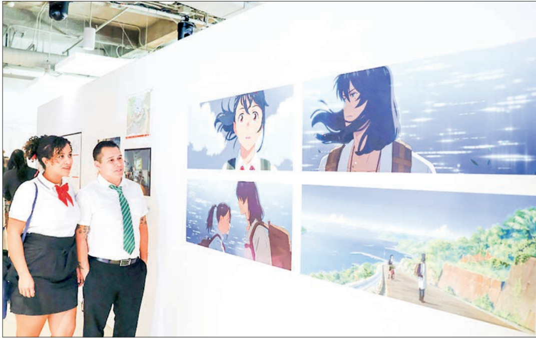
Visitors enjoy the displays in the private pop-up installation showcasing the complete works of Japanese animation filmmaker Makoto Shinkai in Los Angeles on 19 November 2023.