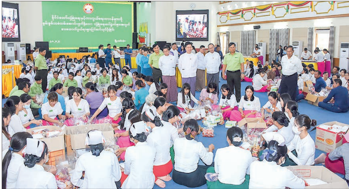
Union Ministers and officials encourage preparatory work for food donations to frontline Tatmadaw and security force members.

The ministry will distribute foodstuffs worth K13 million to members of Tatmadaw and security forces on the frontline.