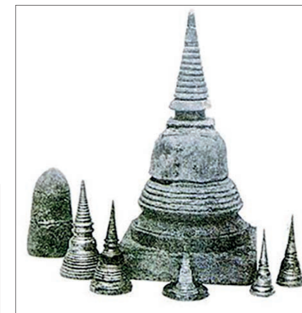
Figure 3: Reliquary-Type Stupas Found at the Eastern Stupa, Wat Phra Si Sanphet, Ayutthaya, Thailand

stupas (see Figure 3) used for religious purposes have also been found at the Eastern Stupa, Wat Phra Si Sanphet, in Ayutthaya.