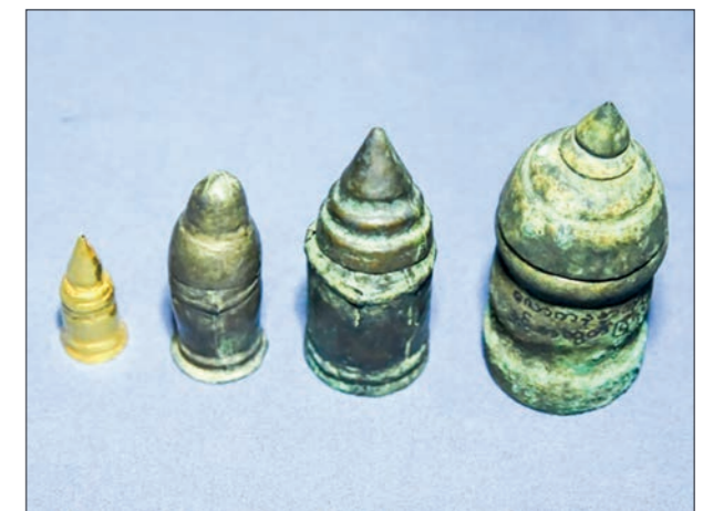
Figure 4: Relic Caskets Found at Lokananda Stupa, Bagan, Myanmar

The history of the Shwedagon stupa in Myanmar also records the discovery of relics associated with the three preceding Buddhas, namely the staff, water-dipper, and lower garment, during excavations at the site. These relics, along with the eight sacred hairs of the Gotama Buddha brought by the brothers Taphussa and Bhallika from Okkala (Yangon), were re-enshrined in the Shwedagon stupa (Aung Thaw, 1972). The Shwedagon stupa is one of Myanmar's encased stupas, and successive Myanmar kings and donors have ritually re-enshrined these relics multiple times for the purposes of worship and veneration.