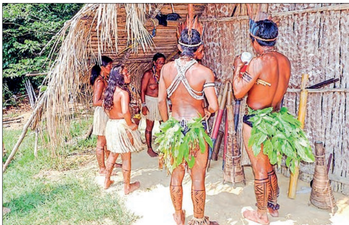
The Amazon rainforest, home to numerous indigenous communities, has been experiencing rapid deforestation, threatening the very survival of these ancient cultures and the delicate ecosystem they inhabit.

Despite the recent rise, deforestation has dropped 45.7 per cent over the past year, reflecting a significant overall reduction.