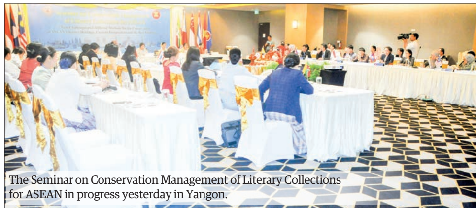
The Seminar on Conservation Management of Literary Collections for ASEAN in progress yesterday in Yangon.

experiences among ASEAN countries is the best way to develop libraries and highlighted the benefits brought by the seminar.