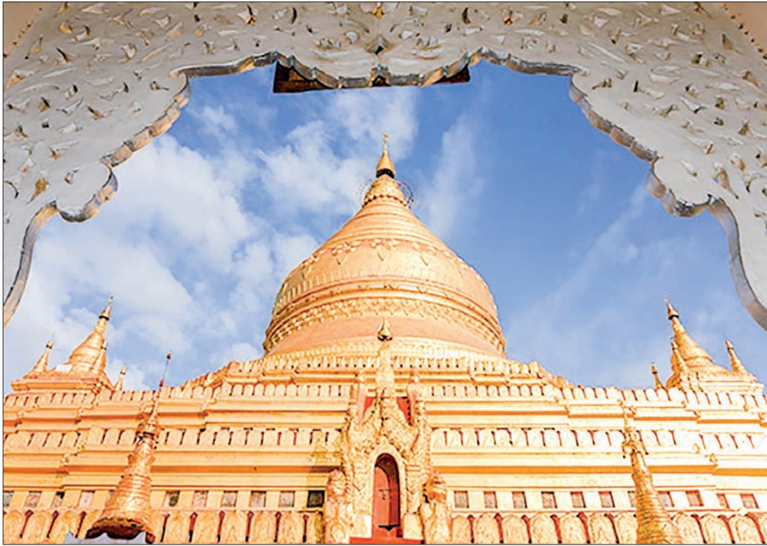
This image depicts the Shwezigon Pagoda.