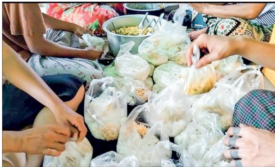
Social workers are distributing food packs to flood victims.

vide sanitary napkins for women and also wants to help pets in flood-affected areas.