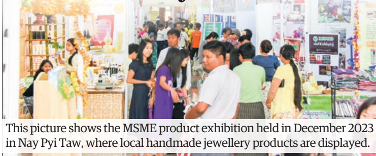
This picture shows the MSME product exhibition held in December 2023 in Nay Pyi Taw, where local handmade jewellery products are displayed.

THE Ministry of Industry stated that the Central Committee for Development of Micro, Small and Medium Enterprises (MSME) has been planning to hold an MSME products exhibition by the end of the year in Nay Pyi Taw.