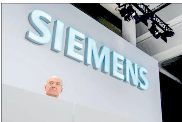
Siemens CEO Roland Busch said the German group was 'benefiting from the boom in artificial intelligence'.

Siemens, whose sprawling global business runs from making trains and factory equipment to systems that manage