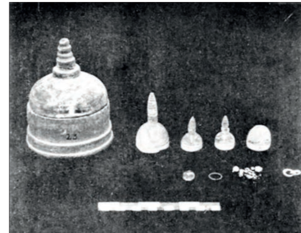
Figure 2: Reliquaries Found at Ruwanveli Stupa, Anuradhapura, Sri Lanka

the stupas for religious purposes. Some relic caskets (see Figure 2) have been found in Ruwanveli Dagaba, Anuradhapura, Sri Lanka (Fernando, 1965). The relics of the Buddha may have been placed inside multiple layers of relic caskets made from various substances to ensure their security and protection, reflecting religious objectives. According to archaeological excavations in Sri Lanka, the relics of the Buddha with their reliquaries have mostly been discovered at the centre of stupas, on the floors or platforms, possibly as consecrated deposits. These relic caskets, unearthed in Sri Lanka, also diminish in size toward the innermost layer. It can be assumed that the multiple layers of the reliquaries are similar to the concept of encasements.