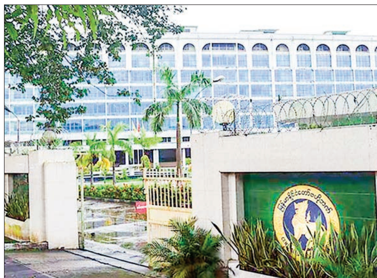
The office building of the Central Bank of Myanmar in Yangon.

The newly issued notification came into effect on 8 August 2024, CBM stated. — NN/KK