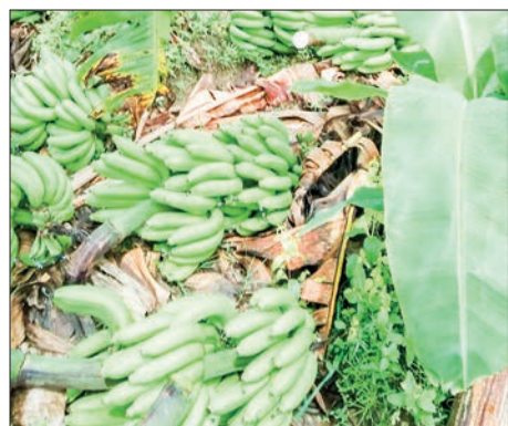
Several bunches of bananas produced from Toungoo.

“Fruit production will be abundant when monsoons end, and trading will be more active. Now, there is production, but there are just a few. These are leftover trees from last year, and they yield fruits now after receiving care,” said a banana farmer from Toungoo. — Thit Taw/ZS