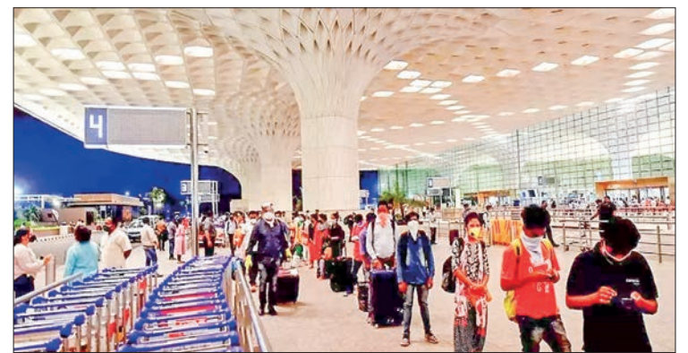
Mumbai International Airport is a major hub for international travellers, connecting the bustling city with destinations around the globe.

Contrary to the query's specifics, the ASAs do not designate individual airports as points of call (PoC). Instead, the agreements typically specify cities as points of call. — ANI