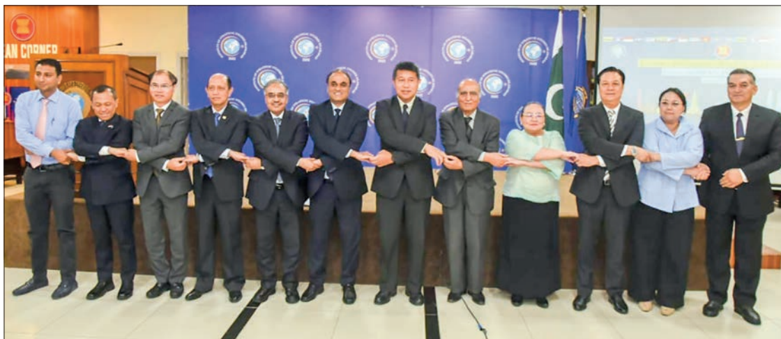
Participants of Pakistan and ASEAN: A growing partnership roundtable discussion is in progress in Pakistan.