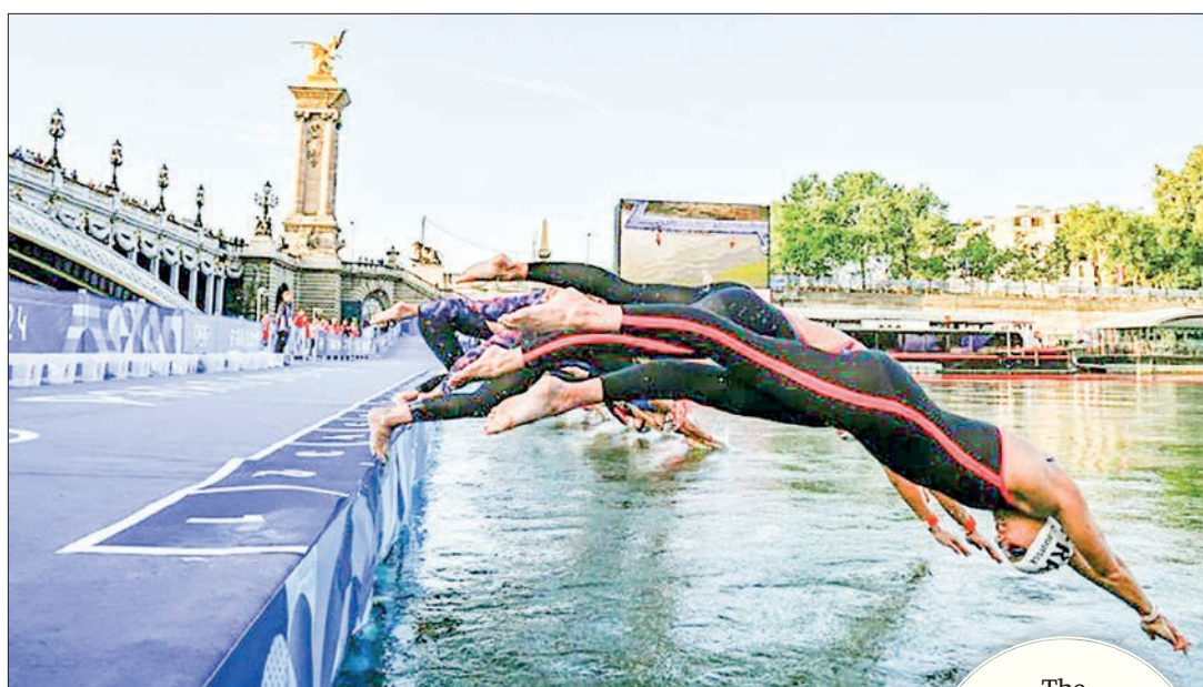
The marathon swimming final took place despite some concerns over water quality.