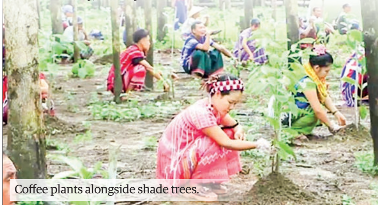
Coffee plants alongside shade trees.

There is a coffee powder manufacturing factory in Thandaunggyi Township, and the coffee produced there is both consumed domestically and exported to Thailand. — ASH/TMT