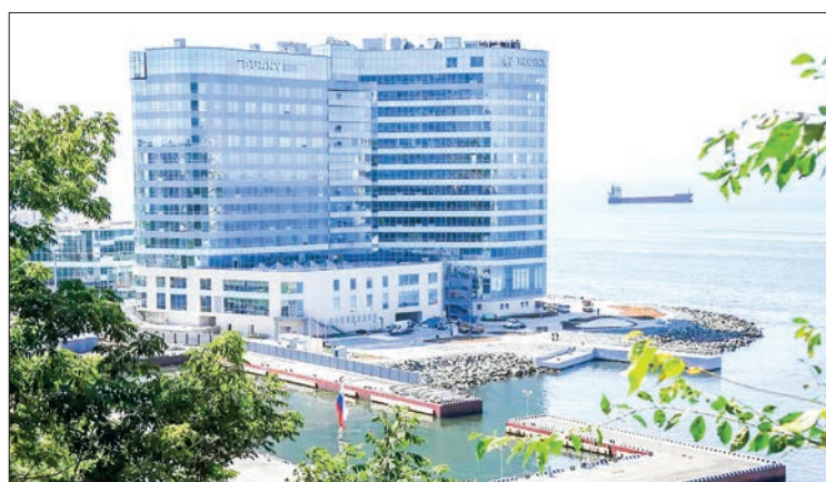
The Eastern Economic Forum 2024 (EEF) will take place in the city of Vladivostok on 3-6 September under the slogan: Far East 2030. Let's join efforts and create opportunities.

At the event, the World Heritage Tour Plan, under the theme of "See 10 World Heritage Sites in 10 Days", was also launched.— Xinhua