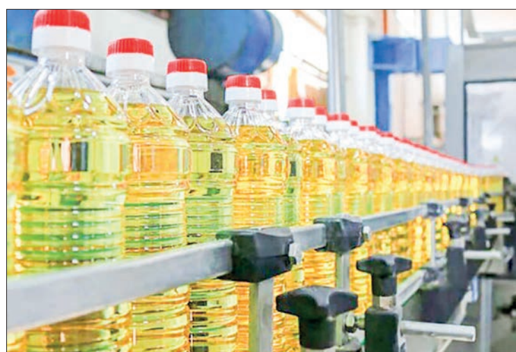
Plastic bottles of cooking oil. About 700,000 tonnes of palm oil are yearly imported through Malaysia and Indonesia to meet domestic demands.

The wholesale reference rate of palm oil for the Yangon market is set at K5,780 per viss this week, ending 11 August, according to the Supervisory Committee on edible oil import and distribution.