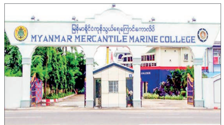
Myanmar Mercantile Marine College.

Applicants will be selected through personal interviews, and more detailed information can be obtained from the Office of the Registrar and the Training Department during office hours. — TWA/TKO