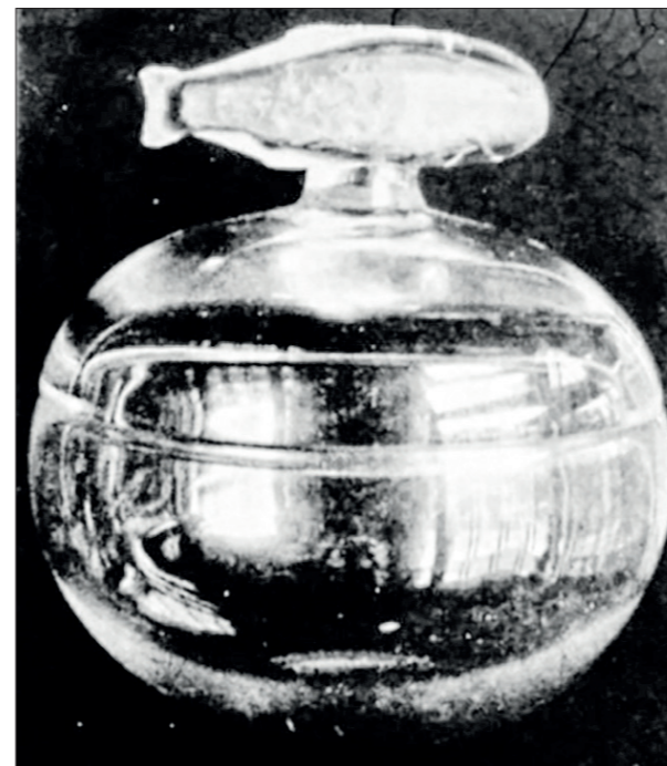
Figure 1: Crystal Casket Found at Piprahwa Stupa, India

Archaeological excavations in India have uncovered various relic caskets, such as a large round stone box with a green marble relic casket inside, recovered from the Dharmarajika stupa at Sarnath. Other finds include a copper relic casket from the Nandangarh stupa, a soapstone relic casket from a stupa at Vaishali, and gold, crystal, and ivory relic caskets from the Amravati stupa (Mitra, 1971). These relic caskets are made of different materials, each diminishing in size to the innermost layer. The relics of the Buddha found in India were also enshrined in stupas. To protect and preserve them from natural disasters and vandalism, these relics were placed in reliquaries composed of multiple layers. According to archaeological excavations in India, these reliquaries are often found at the centre and bottom of stupas to secure the Buddha's relics. The placement and enshrinement of the Buddha's relics inside multiple layers of reliquaries within Buddhist stupas in India were done to facilitate worship and express religious devotion.