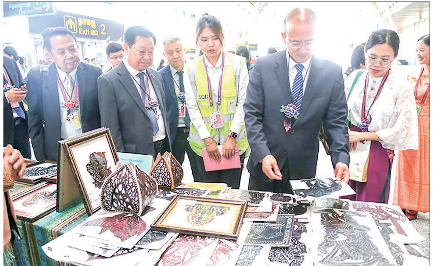
People visit a display showcasing the intangible cultural heritage of southwest China's Yunnan province and Cambodia at the launching ceremony of the China-Cambodia Cultural Corridor in Siem Reap Angkor International Airport in northwest Cambodia on 6 August 2024.

The event, part of the 2024 China-Cambodia people-to-people exchange year, featured exhibits of cultural heritage and artwork from China, Cambodia, and Lancang-Mekong countries.