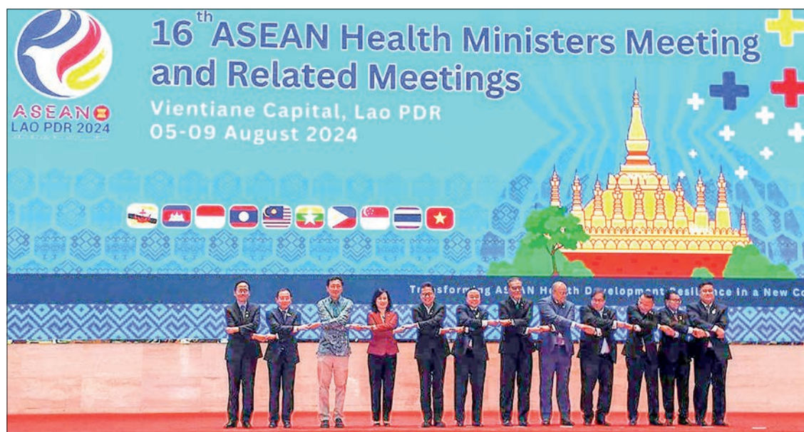
The commemorative group picture of the 16 th ASEAN Health Ministers' meeting and relevant meetings held yesterday in Vientiane, Laos.