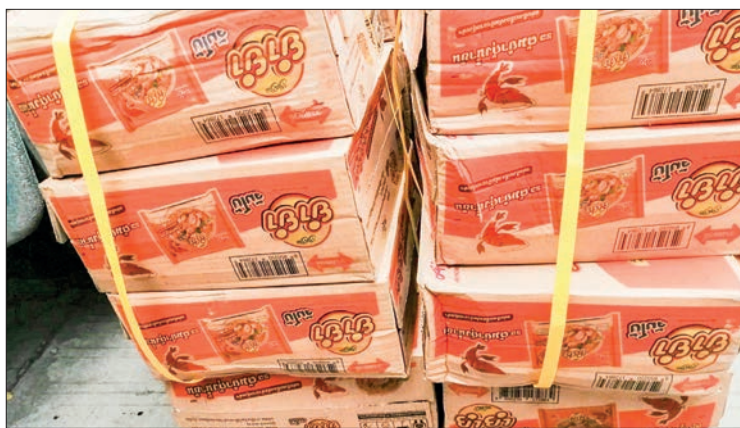
Confiscated illegal items in different states and regions.

On 6 August, a combined team under the management of the Customs Department conducted inspections at Yangon Airport (warehouse) and seized 44 vials of laboratory fragrance oil samples from Singapore, one engine generator controller from the United Kingdom (estimated value is K2.8 million) was confiscated, and the action