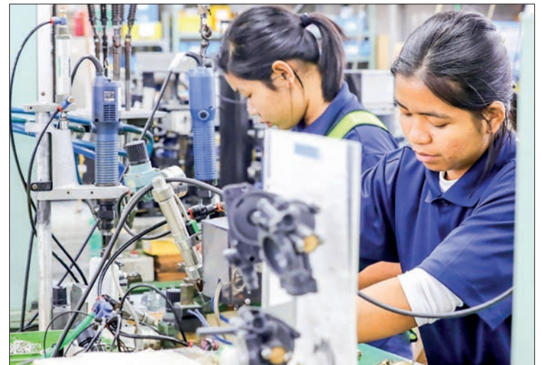
The photo shows Myanmar workers working in Japan.

The document verification process confirmed that the Japanese labour supervision company and the recruiting factories or companies offering employment to over 760 Myanmar workers are officially registered in Japan. — TWA/TRKM