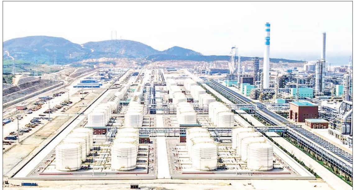
Aerial photo taken on 17 May 2019 shows the industrial park of the Hengli Petrochemical (Dalian) Refining Co, Ltd on the Changxing Island in Dalian City, northeast China's Liaoning Province.

Since 2025, the United States, under its executive orders targeting other countries, has imposed sanctions on these Chinese firms for their alleged involvement in petroleum transactions with Iran, an MOC spokesperson, in response to the ban, said on Saturday. The US measures, the spokesperson said, improperly prohibit or restrict normal economic and trade activities between Chinese companies and third countries as well as their citizens, legal persons or other organizations, in violation of international law and basic norms of international relations. — Xinhua