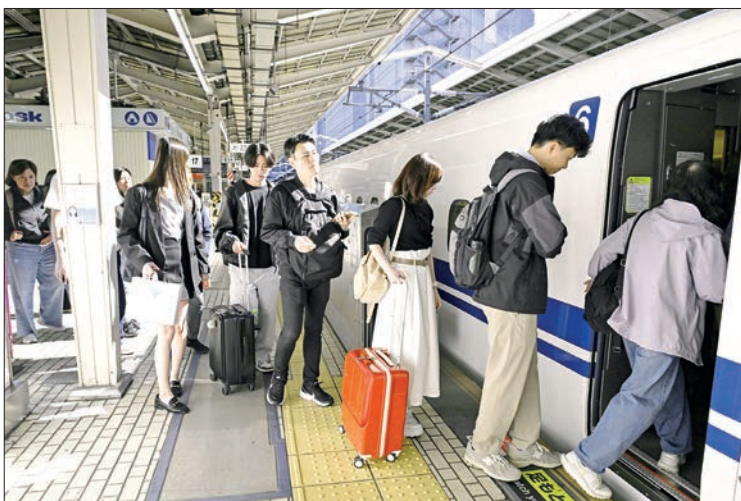
Passengers board a shinkansen bullet train at JR Tokyo Station on 2 May 2026.

In Osaka, station staff were busy guiding customers near ticket gates at JR Shin-Osaka Station, while people in the station building waited in line to buy souvenirs. — Kyodo