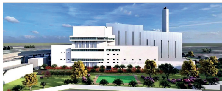
The facility processes municipal solid waste using stoker-type incineration technology to generate power

Ltd, a China-invested company, the plant has been in operation since 2016, with a daily processing capacity of 500 tonnes of waste. To date, it has treated over 1.68 million tonnes in total and generated over 636 million kWh of electricity