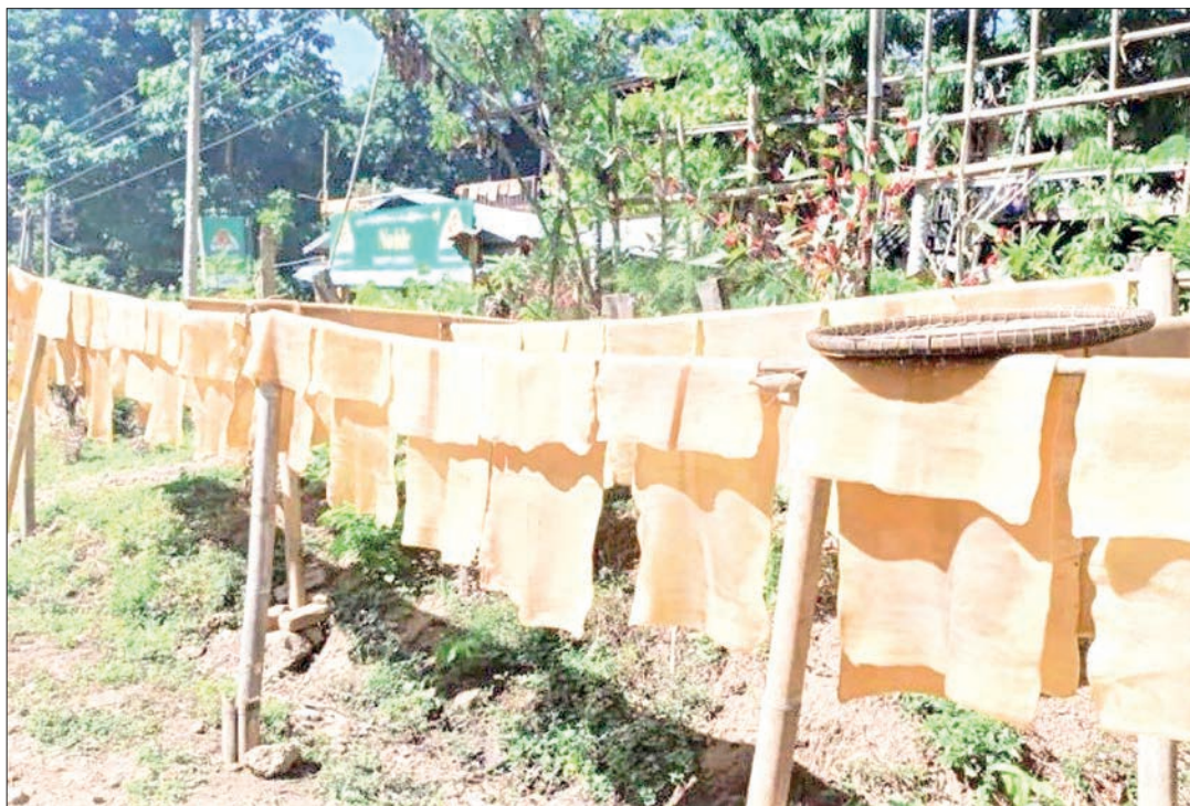
This photo features raw rubber sheets produced locally.

There are 1.64 million acres of rubber plantations in Myanmar, of which about 850,000 acres are used for extraction of rubber latex. Mon State produces the largest volume of rubber in the country, followed by Taninthayi Region and Kayin State, while other regions and states also contribute to rubber production. — ASH/TH