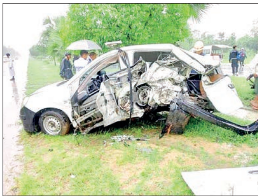
Scenes from some of the traffic accidents that occurred nationwide.

DURING the first three months of 2026, a total of 888 traffic accidents occurred nationwide, resulting in 486 fatalities and 1,208 injuries, according to the Ministry of Transport.