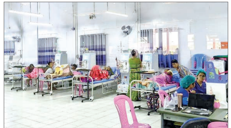
Patients are seen receiving free kidney dialysis treatment at KBZ Centre Mandalay.

KBZ Centre Mandalay, which provides free kidney dialysis services to patients, has announced that it will install 16 additional dialysis machines to expand its capacity to serve more patients.