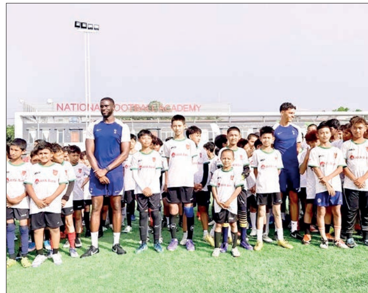
Premier League's Tottenham Hotspur FC coaches and Myanmar young football players are seen at the National Football Academy in Yangon on 3 May.

es later led practical sessions, teaching basic football techniques to the young trainees