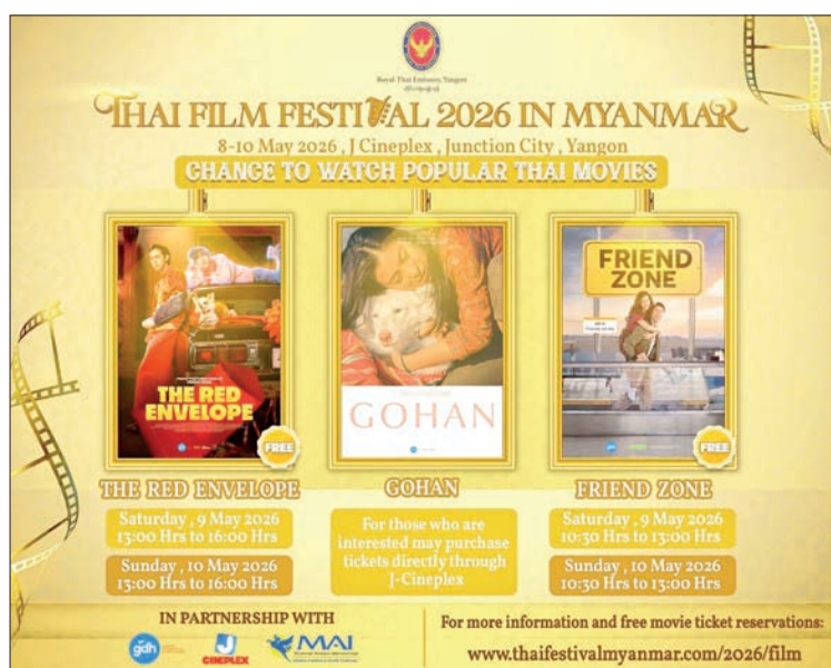
Film posters of the three Thai movies.

THE Thai Film Festival 2026 in Myanmar will be celebrated from 8 to 10 May at J Cineplex at Junction City in Yangon and three Thai films which are related to Myanmar will be shown, according to Thai Festival in Myanmar.