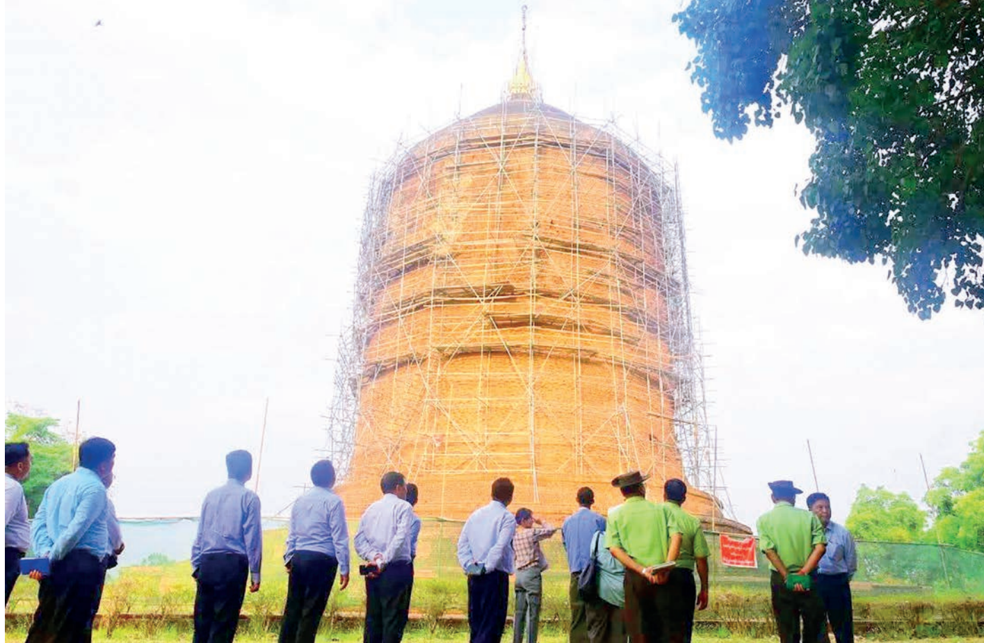
Officials inspect the progress in renovation process at ancient Bawbawgyi Stupa.