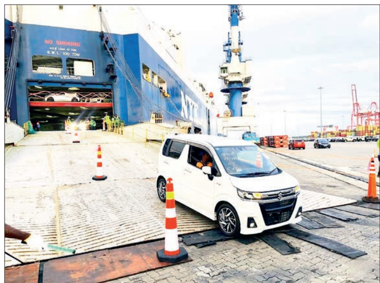
Imported vehicles from Japan are unloaded from a ship at Hambantota Port in Sri Lanka, 27 February 2025.

The suspension on vehicle imports had been introduced in early 2020 as Sri Lanka moved to control foreign exchange outflows amid external sector pressures. The restrictions remained in place during the country's economic crisis, when conserving foreign currency reserves became a key policy priority. — Xinhua