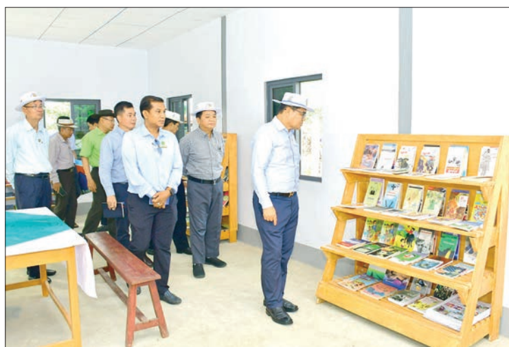
Kachin State Chief Minister U Khet Htein Nan observes the smart library of Padauk Myaing Village in Myitkyina Township.

During the meeting, the chief minister, state ministers, and officials presented 100 bags of rice (24-pyi per bag) for 511 households in the smart village. They also donated 200 educational and fiction and non-fiction books to the village's Smart Library, which was established under the Smart Village Project to enhance rural livelihoods. Ad-