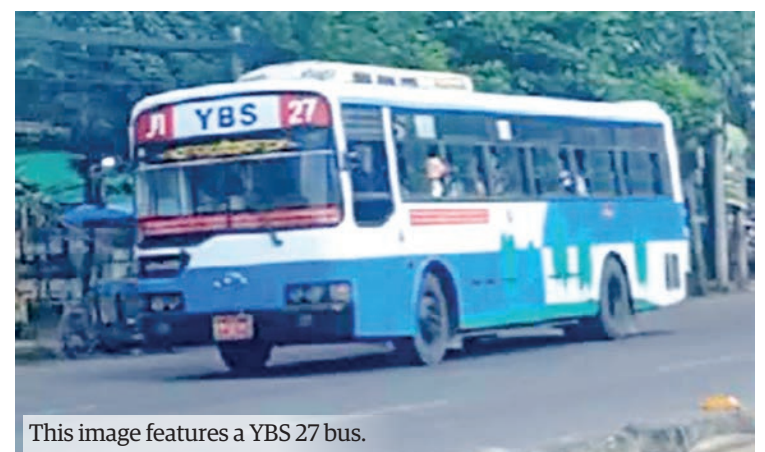
This image features a YBS 27 bus.

The previous route started at the mental health hospital to Min Ye Kyaw Swa Road, ward 133, Dagon University, Pyidaungsu Road, Bohmu Ba Htoo Road, U Wisara Road, Bailey-Thanthuma Road, Yadana Road, Moegaung Road, East Horse Race Course Road, Kyaikkasan Road, Yuzana Plaza and Mingala Market. — MT/ZS