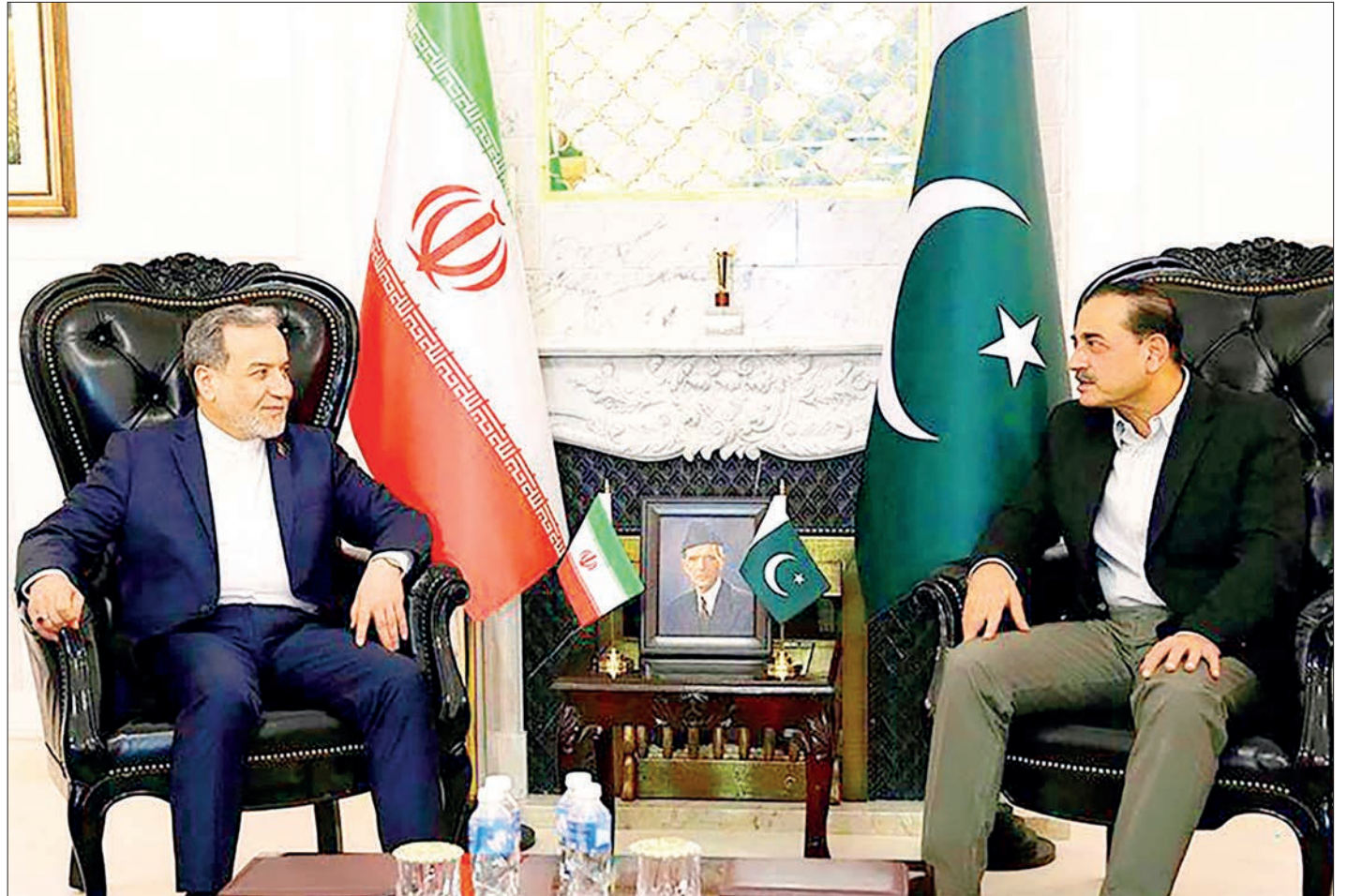
Iranian Foreign Minister Abbas Araghchi (L) meets with Pakistani army chief Staff Asim Munir in Islamabad on 25 April.

Iran demands a permanent end to the war rather than a short truce.