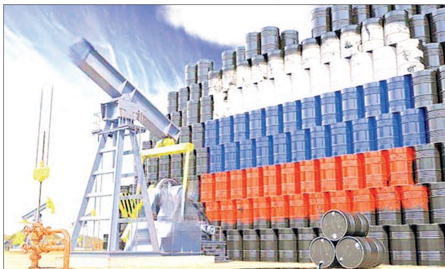
Seven OPEC+ countries have an agreement in principle to raise oil output targets by about 188,000 barrels per day in June.

get production by approximately 188,000 barrels per day in June, despite the UAE leaving the alliance, media reported.