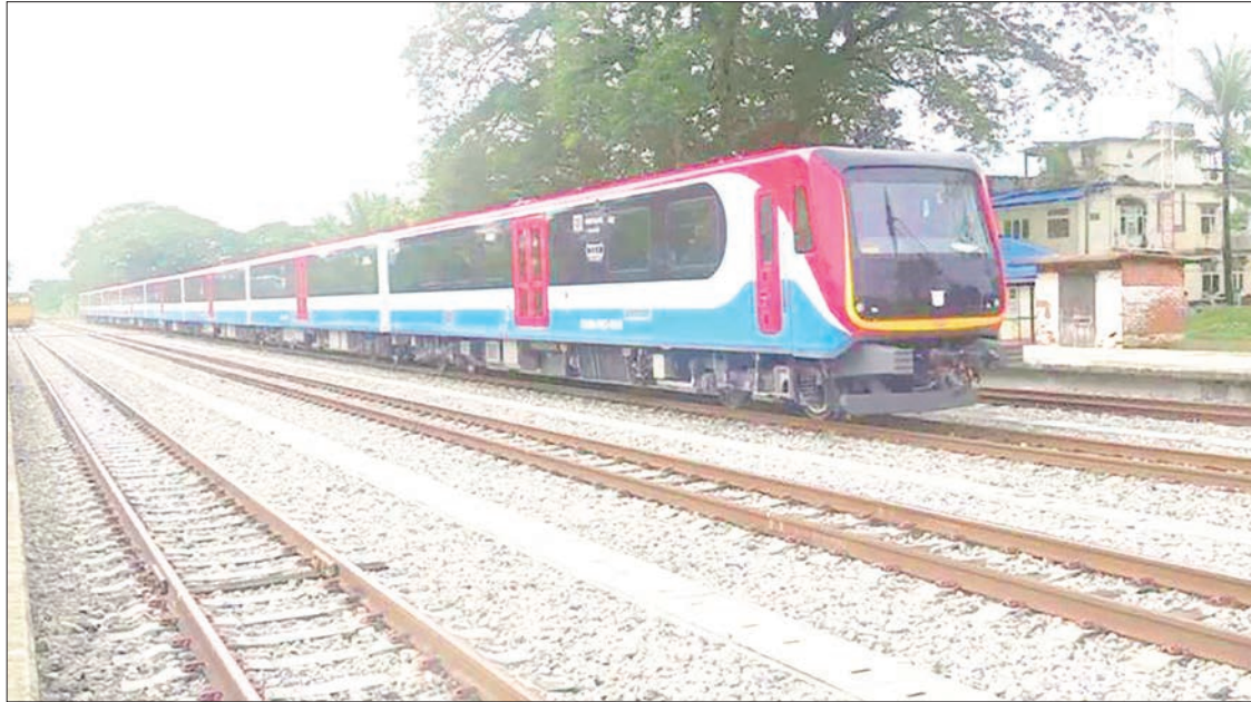
The 5-up DEMU express passenger train is seen in operation on the Yangon-Mandalay route.

On the Yangon-Mandalay-Yangon route, trains will stop at nine stations in total: Toegyauhgale, Bago, Nyaunglebin, Toungoo, Pyinmana, Nay Pyi Taw, Yamethin, Thazi and Kyaukse. 5-up DEMU express