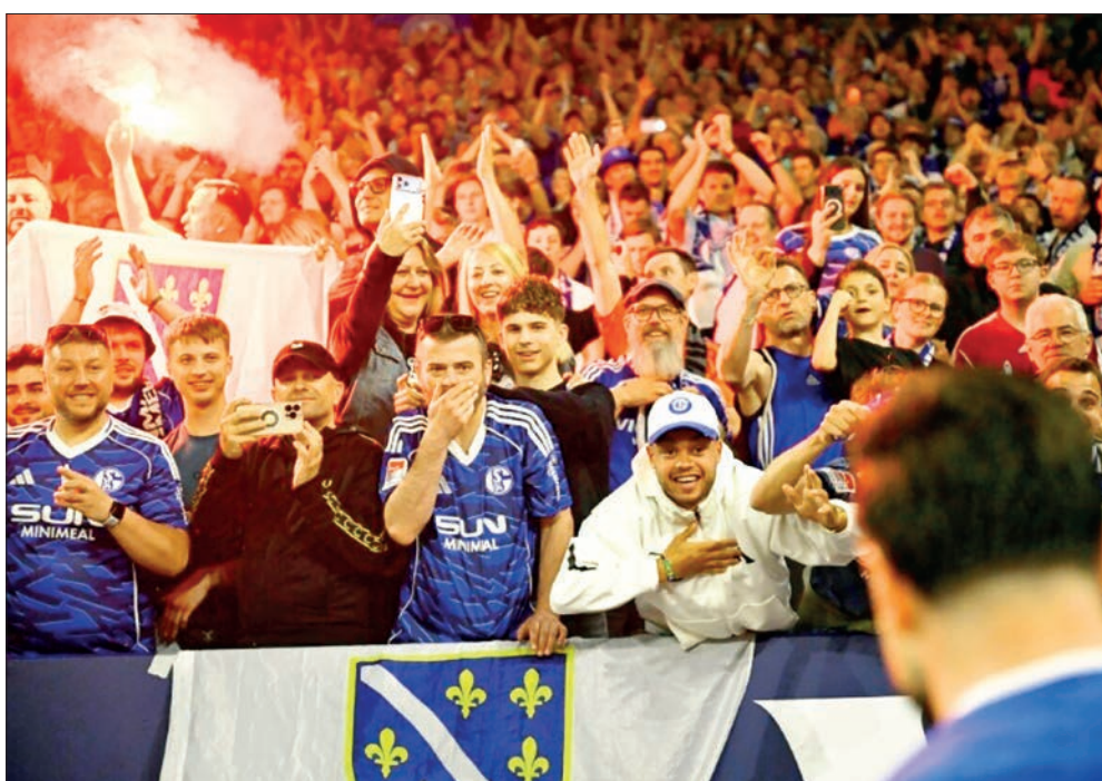
Schalke fans celebrate the club's promotion to the Bundesliga.

"We are not a second division club when it comes to fans, to infrastructure," he said. — AFP