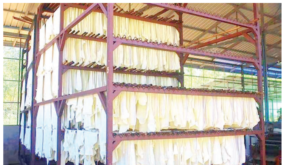
This photo features raw rubber sheets produced locally.