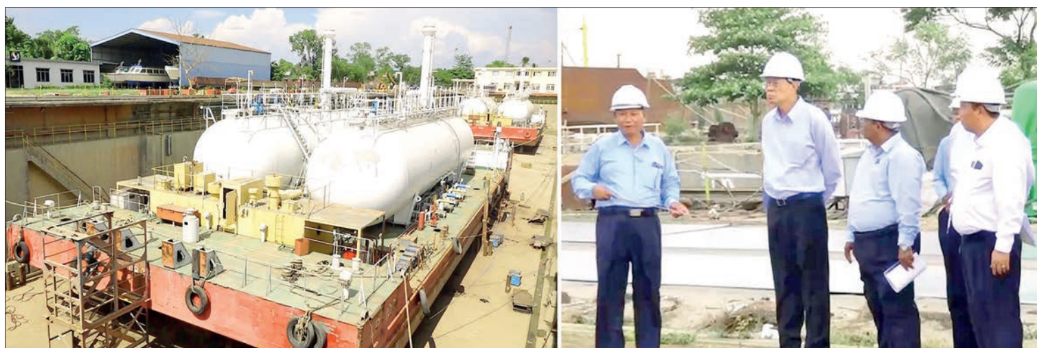
Union Minister for Transport U Mya Tun Oo inspects the repair progress of two LPG tankers at the 12,000-tonne dry dock of the Myanmar Shipyards in Kamayut Township, Yangon, on 2 May.

Following this, the Union minister inspected the con-