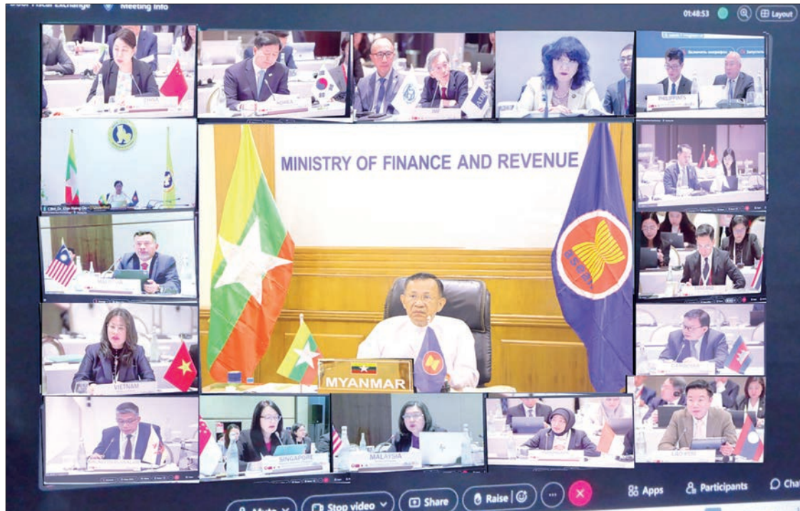
Union Minister Dr Kan Zaw takes part in The 29 th ASEAN+3 Finance Ministers' and Central Bank Governors' Meeting (AFMGM+3) in Samarkand, Uzbekistan, virtually on 3 May.

In the morning session of fiscal exchange, representative from the ASEAN+3 Macroeconomic Research Office (AMRO) presented optimizing budgetary performance management and revenue strategies for demographic change and Finance Ministers from the ASEAN+3 countries made recommendation on it. At the meeting, regarding fiscal management, the Union Minister discussed that Myanmar's budget is being prepared based on the Medium Term Fiscal Framework (MTFF) and that appropriate projects are being coordinated with public policies. The financial linkages and budget allocations between the Union and Region and State governments are also being implemented through the MTFF through policy-based budgeting and rule-based budgeting, and financial activities of the government. Regarding demographic changes and tax revenue management, the Union Minister