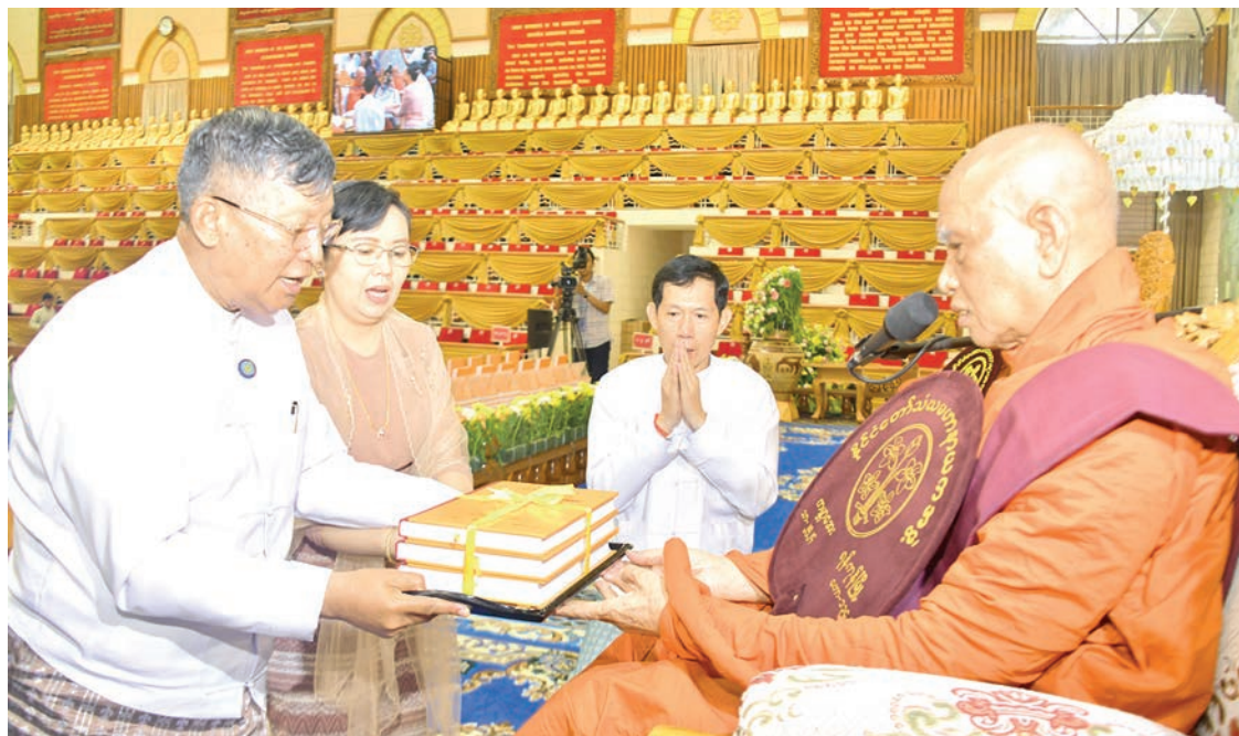
Union Minister for Religious Affairs U Tin Oo Lwin presents the books which are computer-typeset editions of the Atthakatha texts of Tri Pitakat treatises to Sayadaw Dr Bhaddanta Candima Bhivamsa yesterday.

Attendees observed the Five Precepts while members of the Sangha recited Paritta. The Union minister then explained the purpose of donating the computerized editions of the