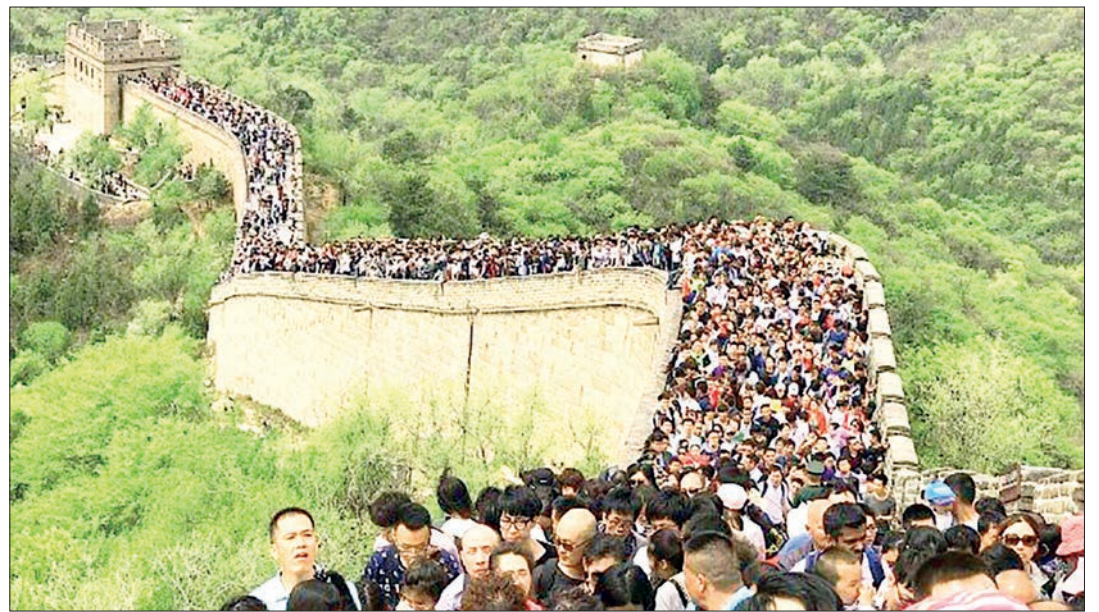
Visiting the Great Wall during the May Day holiday (May 1-5) is a vibrant but high-density experience.