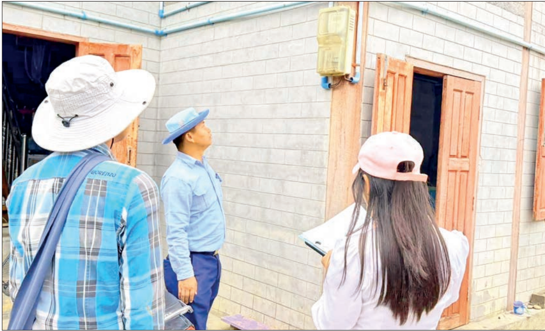
Reading of consumption units at electric meters was carried out in Nyaungshwe Township.

IN order to be accurate reading of electricity units in consumption, Nyaungshwe Township, Shan State (South), electrical engineering office has conducted a field survey at each household in the township.