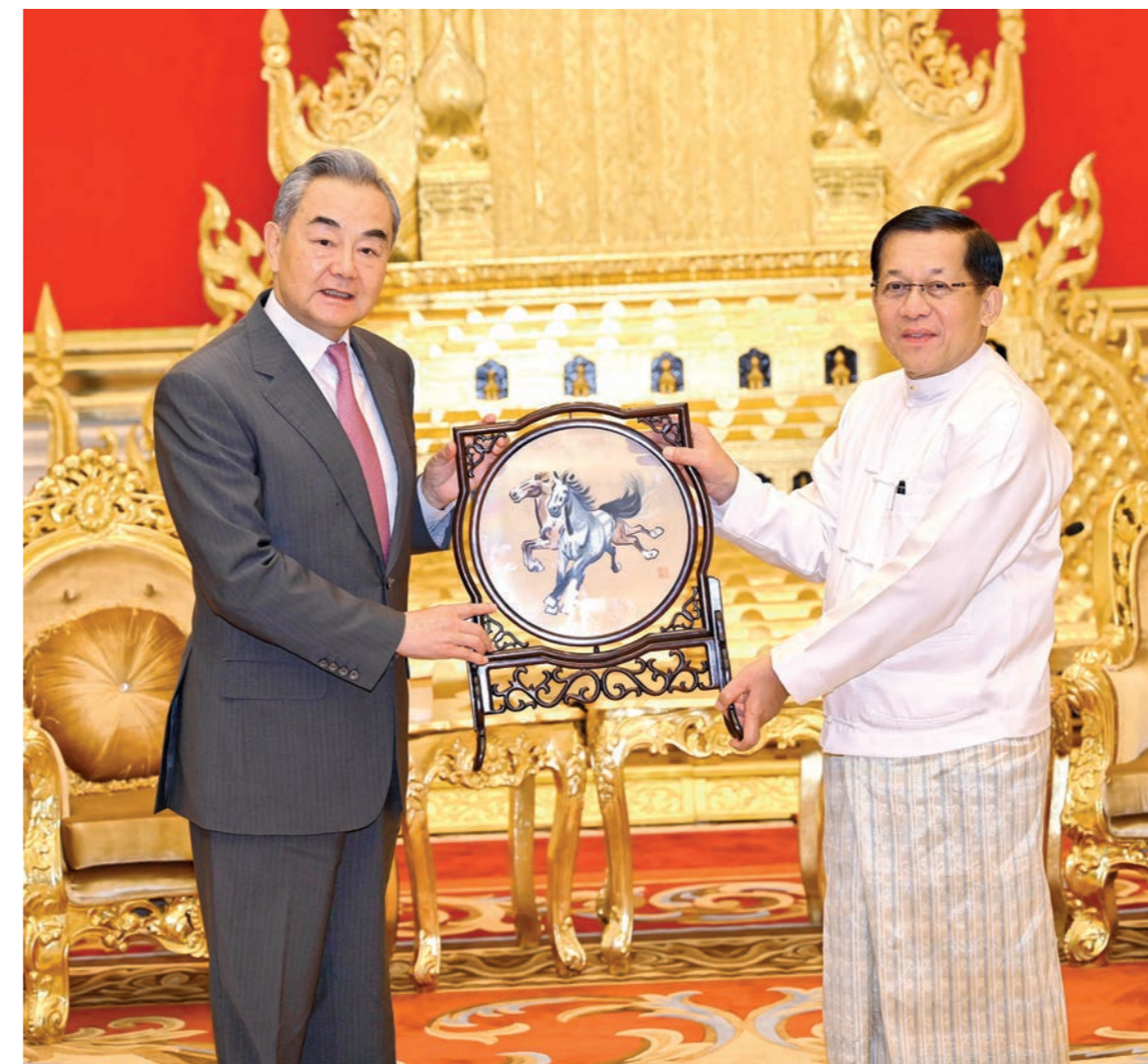
President of the Republic of the Union of Myanmar U Min Aung Hlaing and Member of the Political Bureau of the Chinese Communist Party Central Committee and Minister of Foreign Affairs Mr Wang Yi exchange commemorative gifts in Nay Pyi Taw on 25 April.

Economically, the discussions during Foreign Minister Wang Yi's visit focused on advancing the construction of the China-Myanmar Economic Corridor (CMEC). This initiative is a cornerstone of our bilateral cooperation, promising