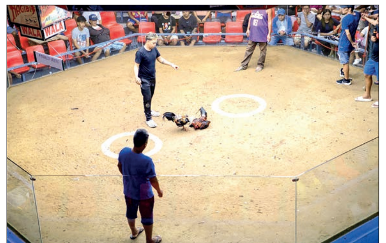
In this photo taken on 5 July 2025, people watch a cockfight in Bulacan province, north of Manila.

In a post on X, the monitoring firm identified the vessel as "HUGE" and noted that it was last spotted off the coast of Sri Lanka more than a week ago. The tanker is currently reported to be traversing the Lombok Strait of Indonesia, heading towards the Riau Archipelago. TankerTrackers.com stated that "HUGE" had not transmitted on the Automatic Identification System (AIS) since 20 March following its departure from the Strait of Malacca for Iran. — ANI