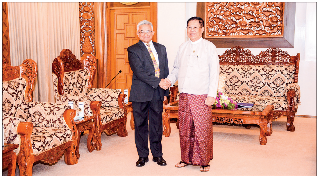
Deputy Prime Minister MoFA Union Minister U Than Swe receives Indian Ambassador Mr Abhay Thakur yesterday.

DEPUTY Prime Minister and Union Minister for Foreign Affairs of the Republic of the Union of Myanmar U Than Swe received Mr Abhay Thakur, Ambassador Extraordinary and Plenipotentiary of the Republic of India to the Republic of the Union of Myanmar, yesterday at the Ministry of Foreign Affairs in Nay Pyi Taw.