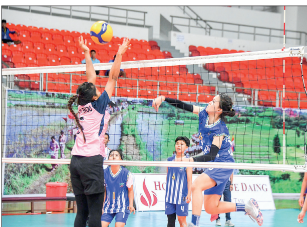
Taninthayi versus Kachin in volleyball.