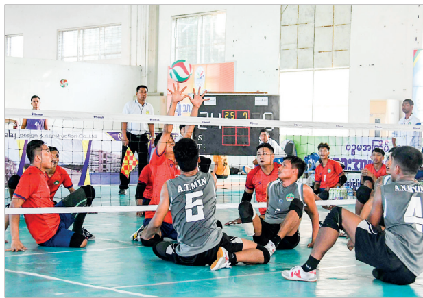
Para-sports athletes competing in para-volleyball.