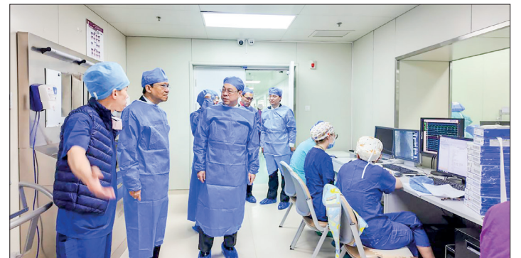
Union Minister Dr Thet Khaing Win touring Fuwai Hospital in Beijing, China.

During the visit, officials from Fuwai Hospital provided an overview of their collaboration with the National Centre for Cardiovascular Diseases under the National Health Commission of the People's Republic of China. They discussed the hospital's work in treating cardiovascular diseases, conducting research, and offering both short-term and long-term training programmes for international trainees. As one of the largest cardiology-specialized hospitals in the world, Fuwai Hospital also shared details of its ongoing cooperation with