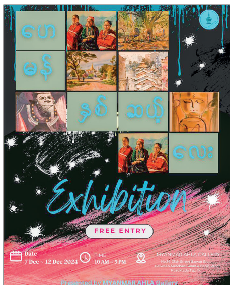
This image showcases the catalogue of the 'Hay Marn 24' group art exhibition.

"The exhibition will appeal to nature lovers, providing a serene escape into the beauty of nature. If you're drawn to the soft and soothing colours of watercolour and enchanting landscapes, we invite you to immerse yourself in this showcase. Featuring the works of over 30 artists, the 'Hay Marn 24' watercolour exhibition highlights the unique charm of watercolour art and the reasons these pieces are worth collecting," said a gallery organizer. — ASH/TRKM