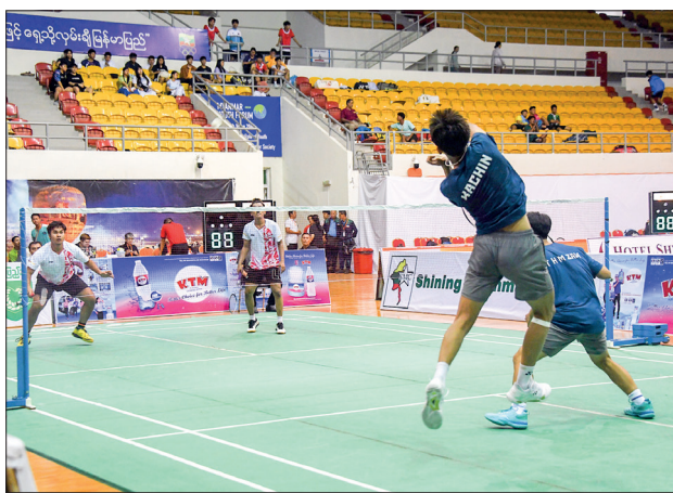
Kachin versus Taninthayi in badminton.