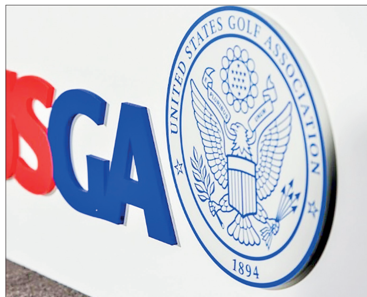
The US Golf Association and LPGA Tour announced updated gender policies requiring players be born female for women's events or complete gender transition before reaching male puberty.

"Accordingly, under the new policy, athletes who are assigned female at birth are eligible to compete" in LPGA, Epson Tour, Ladies European Tour and all elite LPGA competitions. — AFP