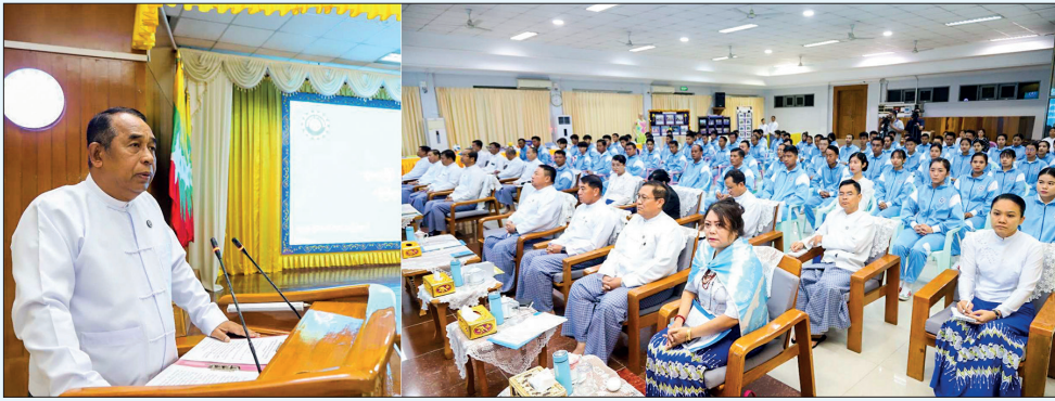
Union Minister U Myint Naung supports and encourages the ministry's contingent for the Fifth National Sports Festival.

UNION Minister for Labour U Myint Naung met athletes who will represent the ministry in the Fifth National Sports Festival 2024 during a gathering held yesterday morning at the ministry's main hall.