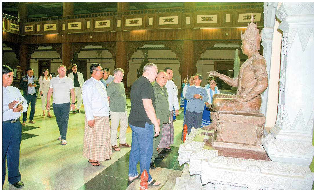
The Russian State Duma delegation during their tour in Bagan.