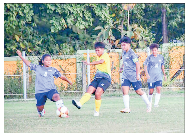
U-25 women's football match.