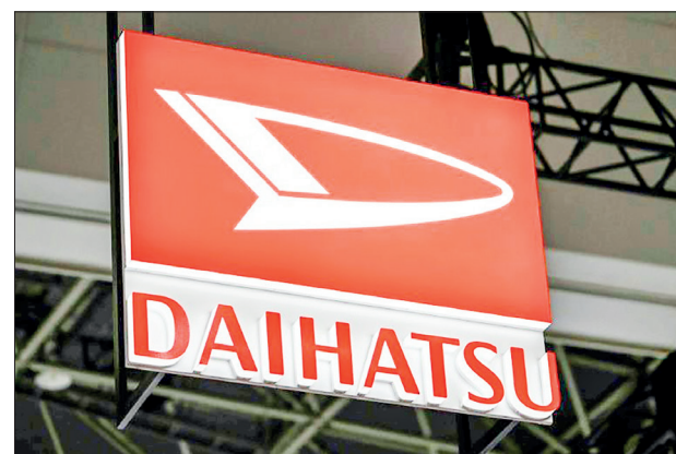
Daihatsu has received 608 reports of related problems.

Affected models include Daihatsu Move, Hijet, Subaru Sambar, and Toyota Pixis Van.