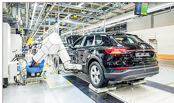
Manufacturers race to meet stricter EU emissions requirements due to come into force in 2025.