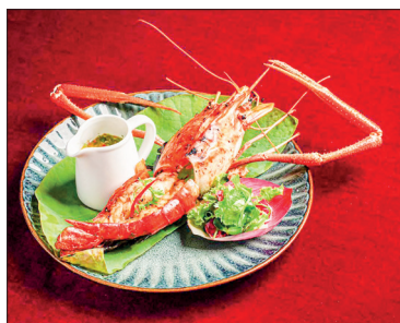
This image showcases the sample royal meals rediscovered in their original style.

"The royal meals of Konbaung have long since disappeared. I would say that they were only eaten by royal family members. Ordinary people didn't eat them. That is why we carefully researched and rediscovered the lost cuisine so that other people could also