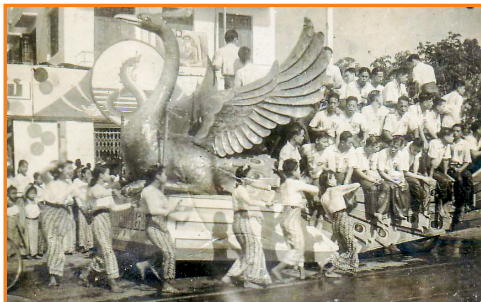
Revellers with a decorated vehicle enjoying the traditional Myanmar Thingyan Festival in Mandalay.

The nomination was officially approved on 5 December 2024 during the 19 th Session of the Intangible Cultural Heritage Committee, held in Asunción, Paraguay, from 2 to 7 December.