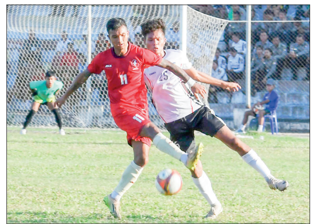
Men's footballers in action.