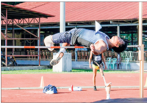
A glimpse of the high jump competition.

The Inter-State and Region U-21 men's football matches at Wunna Theikdi Training Ground