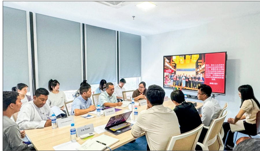
This photo shows the China-Myanmar rural tourism development meeting.

ACCORDING to the Chinese Embassy to Myanmar, a meeting on China-Myanmar rural tourism development was held in Yangon on 3 December.