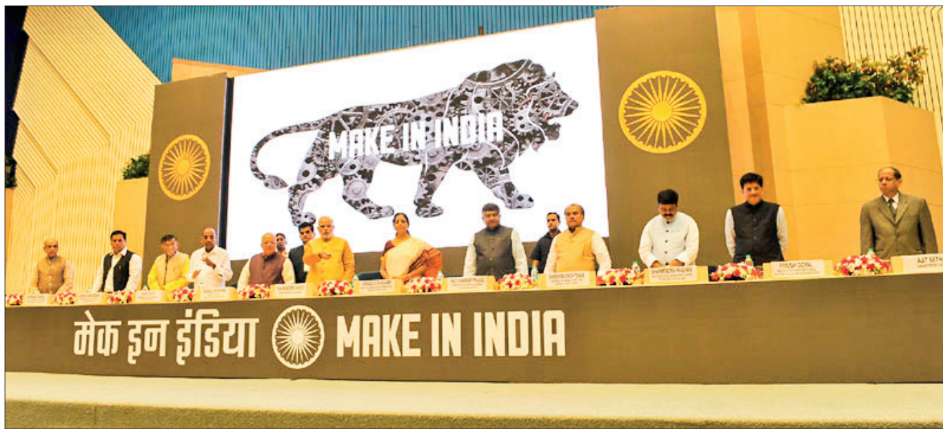
The "Make in India" initiative, launched by Prime Minister Narendra Modi on 25 September 2014, aims to transform India into a global design and manufacturing hub.

Russian President praises India's "Make in India" initiative, citing stable conditions and profitable investment opportunities under Modi's leadership.