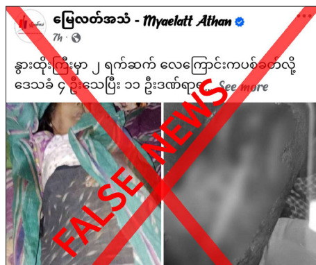
This screenshot reveals false claims.

Subversive news media are accused of concealing the extremists' activities while spreading false claims to create public fear, disrupt regional stability, and sow division between security forces and civilians. The fabricated news appears to serve as propaganda aimed at furthering the extremists' agenda. — MNA/KZL