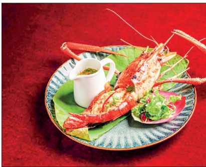
Konbaung era's royal meals restored in original style