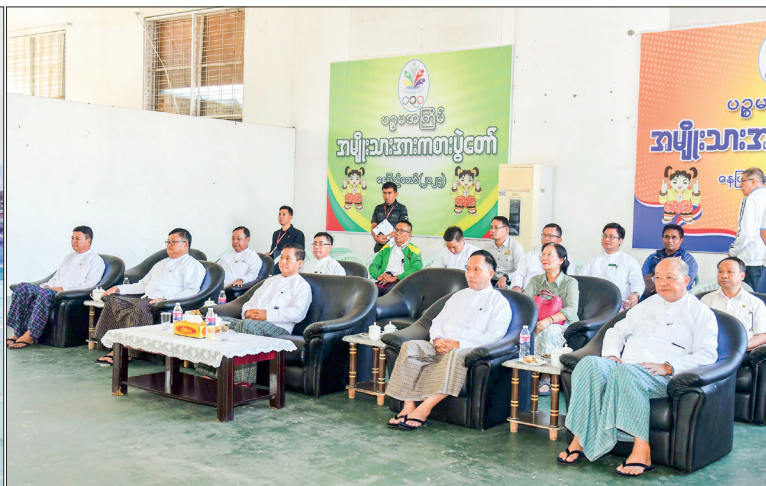
Para-sports athletes compete in para-volleyball (left) as SAC members observe yesterday in Nay Pyi Taw.

and Mandalay regions in men's S6/7 50-metre breaststroke.