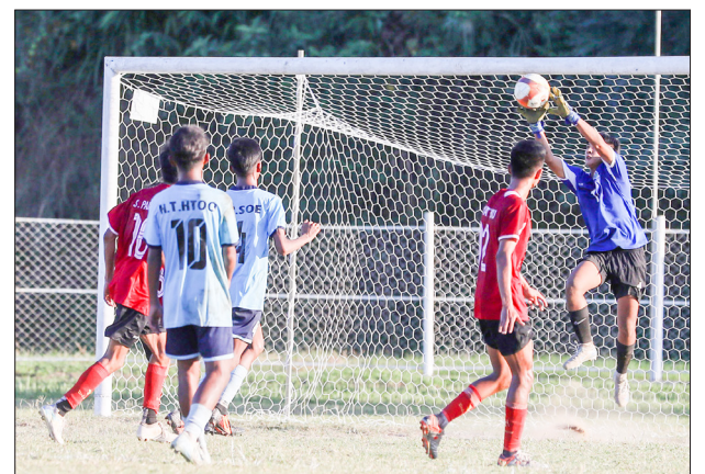
Inter-States & Regions football tournament.