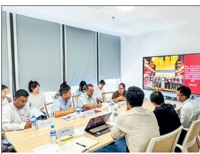
China, Myanmar explore rural tourism development, collaboration