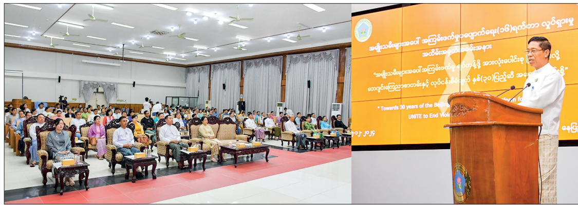
Union Minister Dr Soe Win addresses the 16 Days of Activism Against Gender-Based Violence commemoration yesterday.

In his speech, the Union Minister noted that the '16 Days of Activism Against Gender-Based Violence' is an annual global campaign, also observed