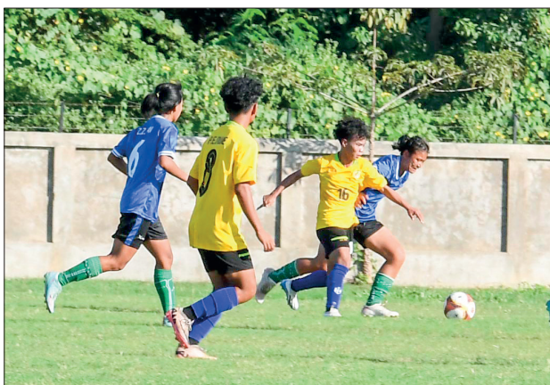
Ayeyawady versus Kayah in women's football.