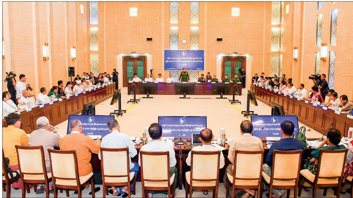
The meeting between the National Solidarity and Peacemaking Negotiation Committee and registered political parties underway yesterday.

In his opening remarks, Lt-Gen Tun Tun Naung emphasized the importance of understanding and accepting differences to implement a federal system compatible with Myanmar. He highlighted the need to resolve disputes through negotiation based on the spirit of the Union, eliminate regional racial and ideological bias, and promote nationalism. He also discussed the circumstances of meetings with political parties, proposed amendments to the 2008 Constitution, the status of the peace process based on the Nationwide Ceasefire Agreement (NCA), dissemination of the peace process in the public, and achieving stability