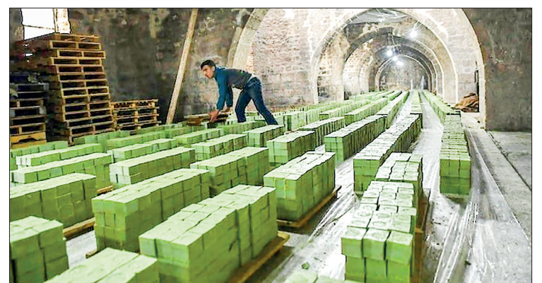
A Syrian worker stacks laurel soap at the Jbaili soap factory, an 800-year-old artisanal soap manufacturer, in the old city of Syria's northern city of Aleppo. PHOTO: AFP

But the soap remains essential to the families and communities involved in the trade. — AFP