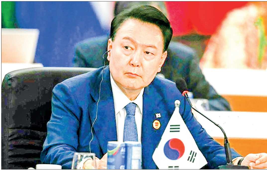
Yoon's popularity has slid since his election in 2022.

The Democratic Party, with five opposition parties, submitted an impeachment motion against Yoon, citing constitutional violations over martial law.