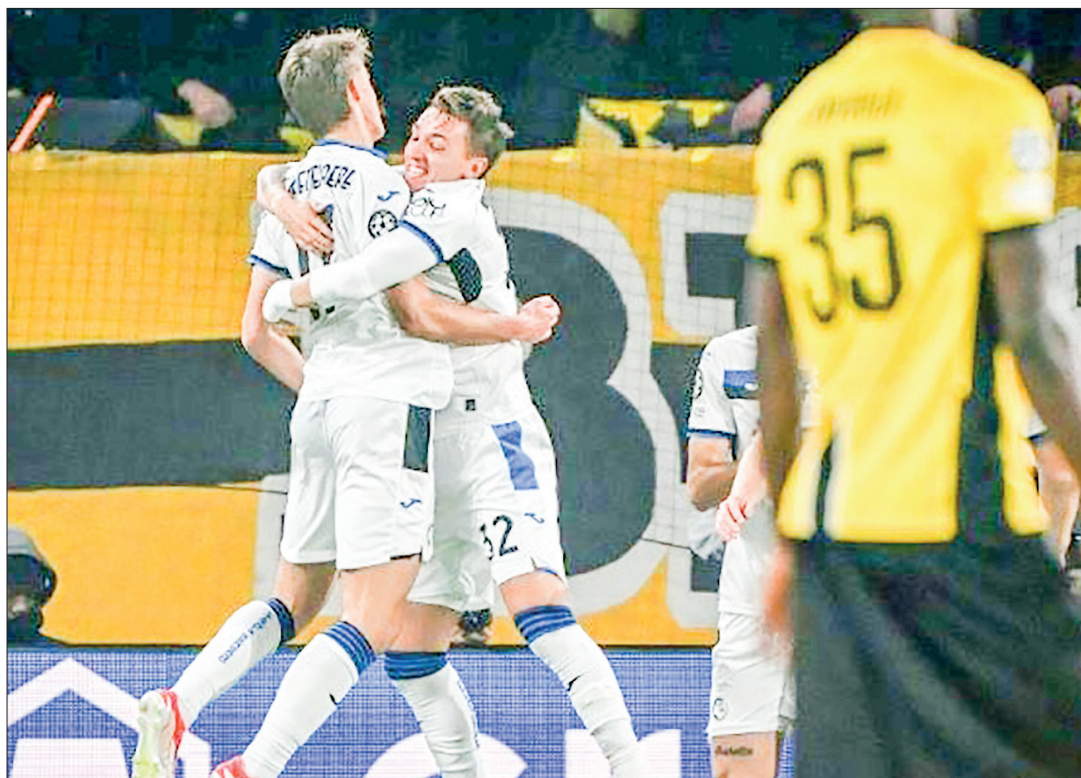
Atalanta are on a high after eight straight wins in all competitions.