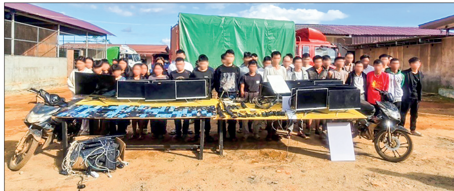
Scammers - 18 Chinese nationals and 27 Myanmar citizens—being arrested along with weapons, munitions and scam-related items.

MORE than 40 suspected of being online scammers were arrested in Shan State on 2 December.