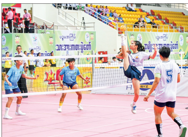
Mon versus Bago in Sepak Takraw.