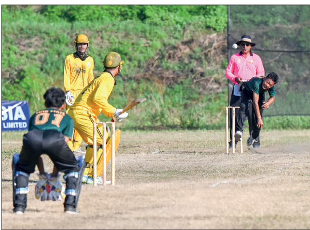
Mon versus Yangon in cricket.