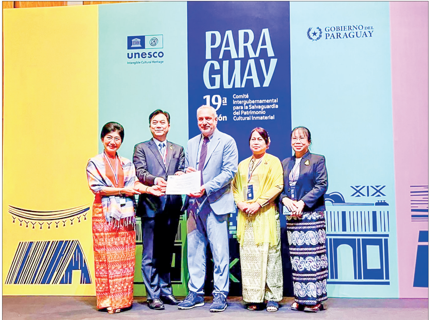
Myanmar receives UNESCO Intangible Cultural Heritage List certificate in Asuncion, Paraguay.