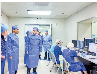
Union Health Minister visits Beijing's Fuwai Hospital for cardiovascular collaboration talks