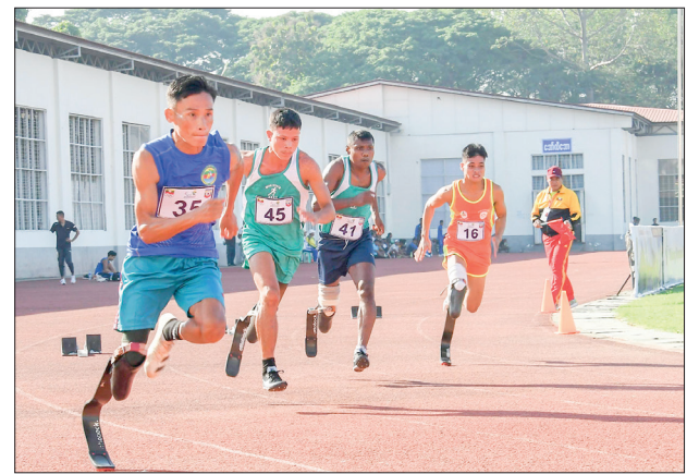
Men's 200-metre sprint.