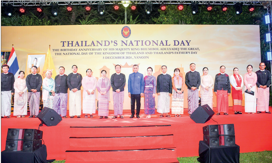
Deputy Prime Minister MoPF Union Minister U Win Shein poses for the documentary group photo alongside the Thai ambassador and attendees at yesterday's event.

THE ceremony to commemorate the birthday of His Majesty King Bhumibol Adulyadej, Thailand's National Day and Thailand's Father's Day was held at 5:30 pm yesterday at the Thai Ambassador's residence at No 94, Pyay Road, Dagon Township, Yangon. Deputy Prime Minister and Union Minister for Planning and Finance U Win Shein and his wife were present on the occasion.