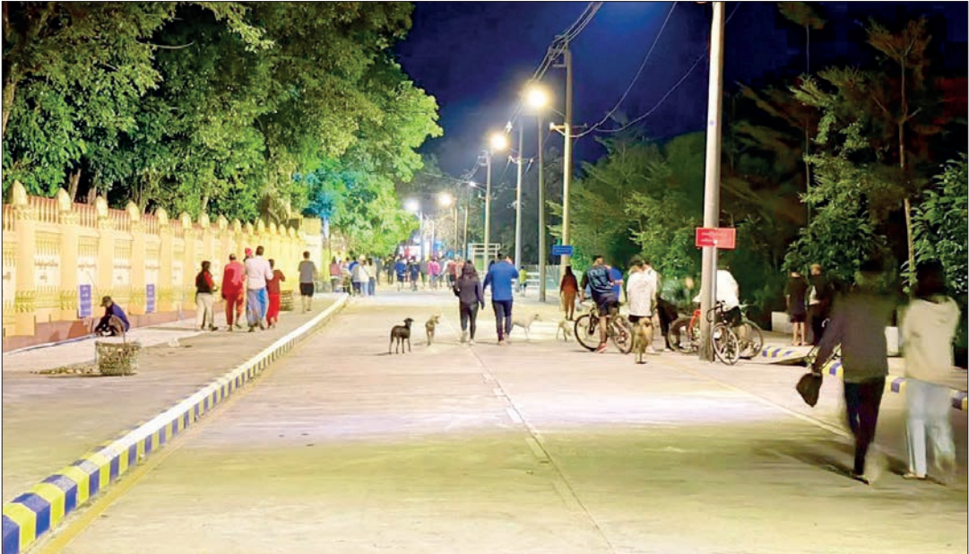
This image captures hikers on Mawlamyine's Taungwine in the previous year.

be left at the free parking areas at the entrance from 4:30 am to 9 am, and car owners are advised to park systematically in the car park. Hikers are advised not to smoke and to properly dispose of trash in the designated bins, and vendors are instructed not to sell their goods on the concrete path and to avoid selling food that produces offensive odours, alcohol, and beer, according to the Thathana Nwe Foundation Sayadaw. — MT/ZN