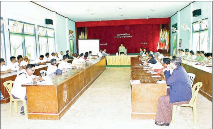
The training on ward and village subcommission guidelines for 2025 elections is in progress yesterday in Kawthoung.

the ward/village subcommission operational guideline manual to subcommissions from each ward and village in Kawthoung Township. The manual was prepared by the Union Election Commission in accordance with the Hluttaw Election Law. — District IPRD/MKKS