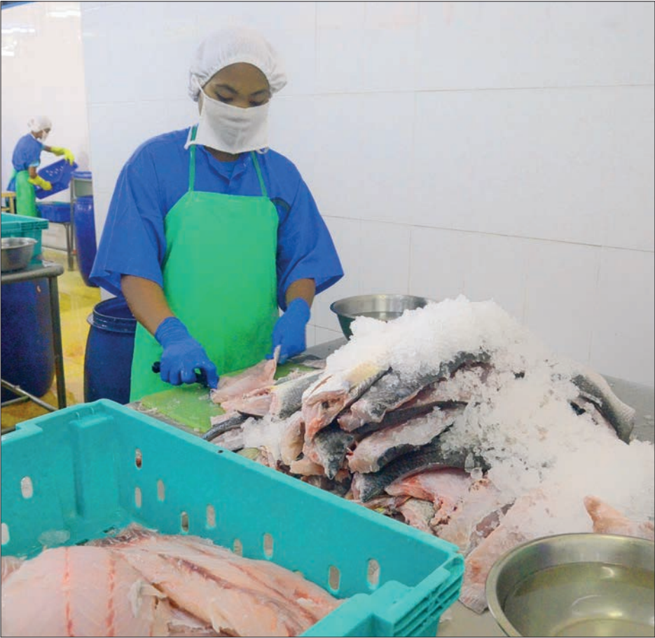
A worker is processing export fishery products at the cold storage facility.

AT the invitation of His Excellency Senior General Min Aung Hlaing, Acting President of the Republic of the Union of Myanmar, His Excellency Mr Aleksandr Lukashenko, President of the Republic of Belarus, will pay a State Visit to the Republic of the Union of Myanmar in the near future. — MNA