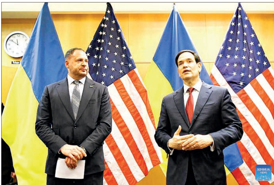
US Secretary of State Marco Rubio (R) and Andriy Yermak, head of the Ukrainian Presidential Office, meet the press at the United States Mission to the United Nations and Other International Organizations in Geneva, Switzerland, 23 November 2025.

Representatives from the United States, Ukraine and European countries met in Geneva on Sunday as the White House pushes for agreement on a 28-point plan to end the Ukraine crisis.