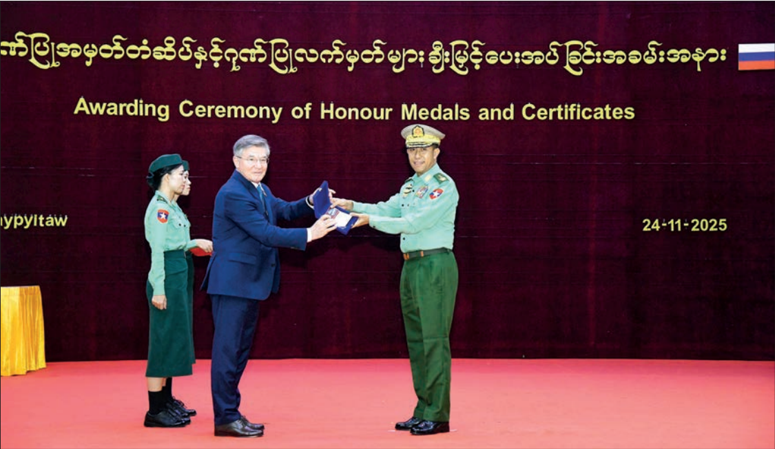
The awards event to honour the representatives from the Ministry of Defence for their excellent efforts in quake rescue operations in progress yesterday in Nay Pyi Taw. The Russian Ambassador remarked and presented honorary medals and certificates to the outstanding representatives of the Ministry of Defence. The region’s chief minister expressed words of gratitude on behalf of the recipients and concluded the event.