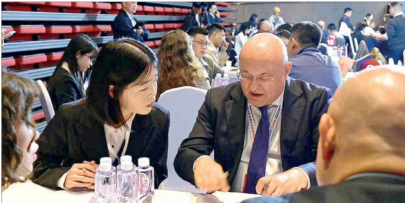
Participants attend the Europe-China B2B Matchmaking Meeting during the 18 th Europe-China Business & Technology Cooperation Fair in Chengdu, southwest China's Sichuan Province, 20 November 2025.

Under the theme "Mutual Trust and Connectivity, Shared Success and Prosperity," this year's event underscored a growing consensus among European stakeholders that China is not a dependency, but a vital partner with ample room for collaboration.