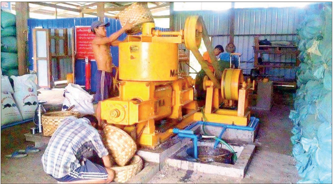
This image displays workers working at a domestic oil mill.

Involvement of private banks will help oil millers across the country get easy access to loans, upgrade oil mills, distribute high-quality edible oil and reduce palm oil imports. The domestic consumption of palm oil is estimated at one million tonnes per year, and palm oil worth about US$800 million is imported. There are over 4,250 oil mills running across the country, with over 230 large mills, over 920 medium-scale mills and over 3,100 small-scale mills. The State Economic Promo-