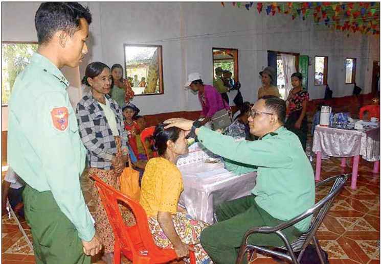
Health services are being provided by the Thanlwin, the Tatmadaw Seagoing Hospital Ship, in Ngaputaw Township, Ayeyawady Region.

59 patients, and dental care for 52 patients. Moreover, eight patients underwent general surgery, six received eye surgery, 37 had x-ray examinations, 50 were tested using ultrasound, eight underwent ECG heart screenings, and 49 had laboratory tests.