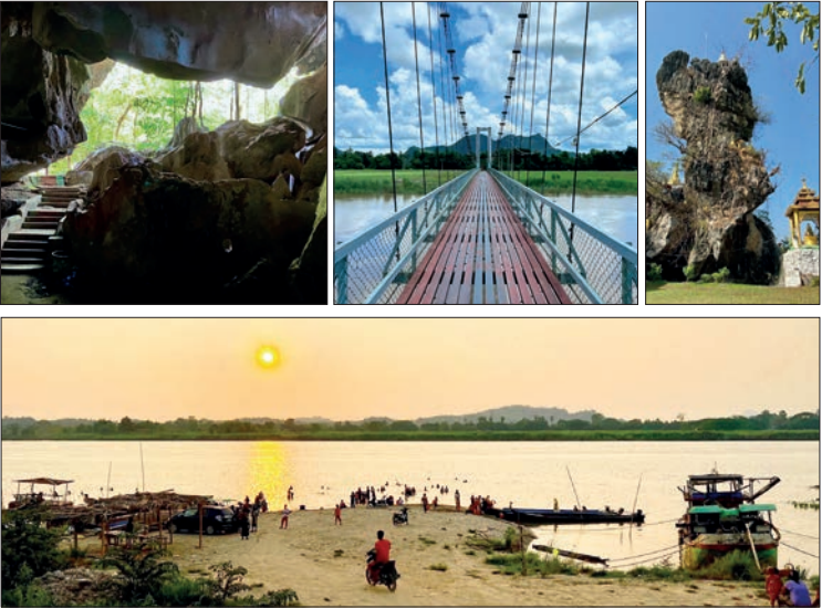
Photos showcase tourist attraction places in Hpa-an.

FOR the coming Kayin New Year Day and December holiday, local visitors have made preparations for their planned trips by connecting with car rental services as well as by the management of travel companies. Those who have planned to take a pilgrimage tour or vacation during the December holidays said they have now started making preparations. “Our family has hired a car to visit Kyaiktiyo and Bago on Kayin New Year's Day. We have a three-day holiday, so it is convenient for travelling. Some people have planned to go visit Bagan,” said a woman.