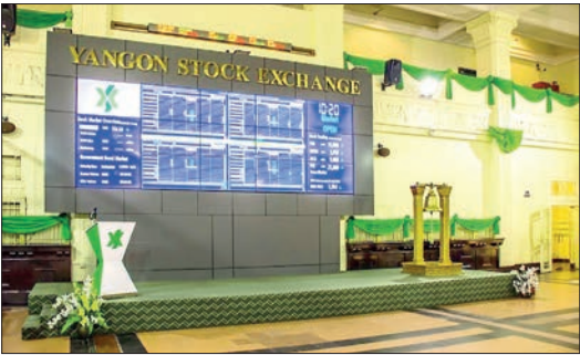
The stock share index panel of Yangon Bourse.

THE grand trading value of the eight listed companies on the Yangon Stock Exchange (YSX) exceeded K530 million from 151,197 shares traded in October 2025, according to YSX's statistics. At present, shares of eight listed companies – First Myanmar Investment (FMI), Myanmar Thilawa SEZ Holdings (MTSH), Myanmar Citizens Bank (MCB), First Private Bank (FPB), TMH Telecom Public Co Ltd (TMH), the Ever Flow River Group Public Co Ltd (EFR), Amata Holding Public Co Ltd (AMATA) and Myanmar Agro Exchange Public Co Ltd (MAEX) are traded in the securities market. MTSH topped the trading on equity with over K191 million from 56,183 shares, followed by FMI with stocks worth K139 million from 17,005 shares, EFR with K61.35 million from 32,959 shares, FPB with over K51.6 million from 21,830 shares, MAEX with K41.65 million from 12,350 shares, MCB with K20.4 million from 2,602 shares, TMX with K15.86 million from 5,705 shares and AMATA with K8.6 million from 2,563 shares.