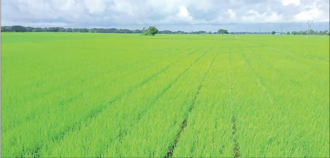
This image shows a thriving rice field in Ayeyawady Region.

ACCORDING to the Ayeyawady Region Government, plans are underway to implement a 100,000-acre rice export zone in the Ayeyawady Region under a contract farming system. In implementing this 100,000-acre rice export zone through contract farming, discussions have been held on designating district-level areas for businesses that will invest in the Ayeyawady Region and operate under the contract farming system. “Aiming to produce quality rice, those participating in the export zone will work on the basis of four key elements: