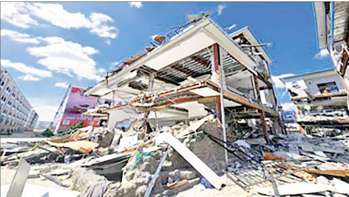
Images reveal the demolition measures underway and immigration officers processing the deportation of undocumented foreign entrants.

A further 101 illegal foreign nationals were detained in the Shwe Kokko area as authorities continued their intensified crackdown on unlawful activities.