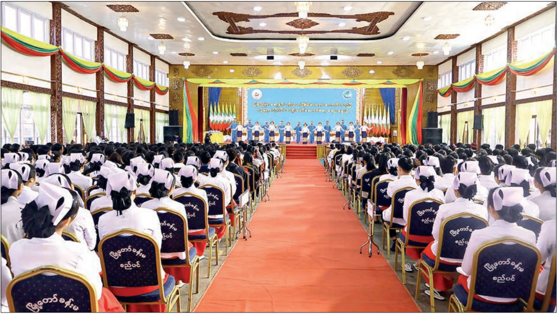
The discussion on the information and development of a resilient and strong social community is in progress yesterday in Taunggyi, attended by Union Minister U Maung Maung Ohn.

Union Minister highlighted the need to be cautious and discerning about the dangers of fake