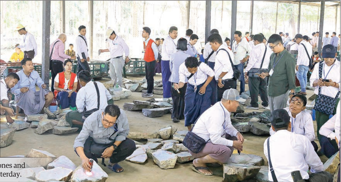
Gem merchants evaluate the gemstones and jade at the 60 th Gems Emporium yesterday.

evening, and the results will be announced on the morning of 25 November. Yesterday evening, Union Minister for Natural Resources and Environmental Conservation and Chairman of the Central Committee of the Myanmar Gems Emporium U Khin Maung Yi, inspected the tender-opening process and gave necessary instructions to officials. Sales of the Group C jade lots will continue until 26 November. — MNA/MKKS