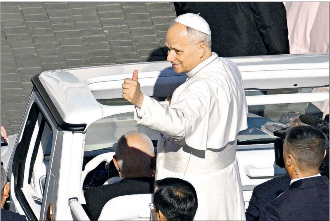
Pope Leo XIV (C) gestures to the crowd from the popemobile as he leaves at the end of the mass of Jubilee of Choirs and Choral Society at St Peter’s Square in The Vatican on 23 November 2025.

written. While the Chicago-born pontiff’s upcoming visit has so far garnered little attention in the predominantly Muslim country, where Christians represent only 0.2 per cent of the 86 million inhabitants, it is eagerly awaited in Lebanon. Lebanon has long been held up as a model of religious coexistence. But since 2019, it has been ravaged by crises, including economic collapse which has caused widespread poverty, a devastating blast at Beirut port in 2020, and the recent war with Israel. “The Lebanese are tired,”