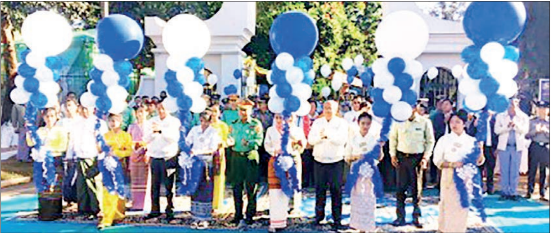
North-East Command Commander Brig-Gen Aye Min Oo and dignitaries unveil the reopening launch yesterday.

couragement. Afterwards, they inspected the renovation of the classrooms and addressed the necessary requirements. The commander and officials also visited Lashio Education Degree College, where they observed learning of students and toured the classrooms. — MNA/MKKS