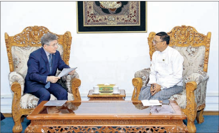
Russian Ambassador Mr Iskander Azizov calls on Deputy Minister U Ko Ko Kyaw yesterday.

The ethnic literature and cultural groups performed a dance to the song “A Song for Unity,” and the Union Minister and the State Minister for Security and Border Affairs presented cash prizes to the performers. – MNA/KTZH