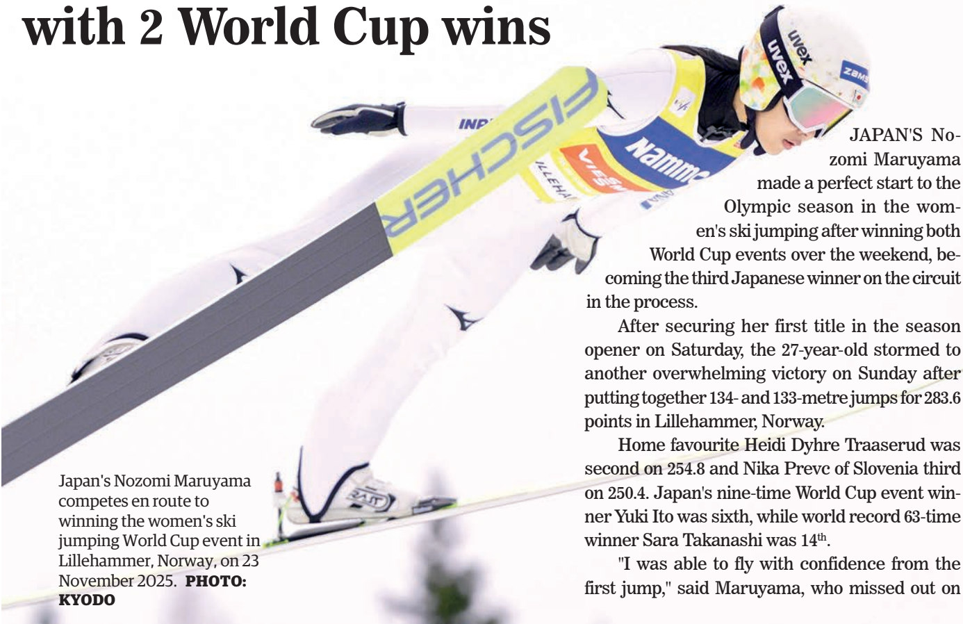
Japan's Nozomi Maruyama competes en route to winning the women's ski jumping World Cup event in Lillehammer, Norway, on 23 November 2025.

JAPAN'S Nozomi Maruyama made a perfect start to the Olympic season in the women's ski jumping after winning both World Cup events over the weekend, becoming the third Japanese winner on the circuit in the process. After securing her first title in the season opener on Saturday, the 27-year-old stormed to another overwhelming victory on Sunday after putting together 134- and 133-metre jumps for 283.6 points in Lillehammer, Norway. Home favourite Heidi Dyhre Traaserud was second on 254.8 and Nika Prevc of Slovenia third on 250.4. Japan's nine-time World Cup event winner Yuki Ito was sixth, while world record 63-time winner Sara Takanashi was 14 th . "I was able to fly with confidence from the first jump," said Maruyama, who missed out on