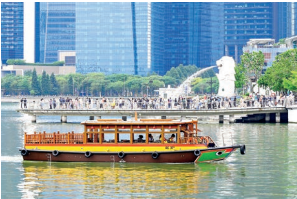
People gather at the Marina Bay waterfront as a boat passes in Singapore on 21 November 2025.

On a month-on-month basis, core consumer prices