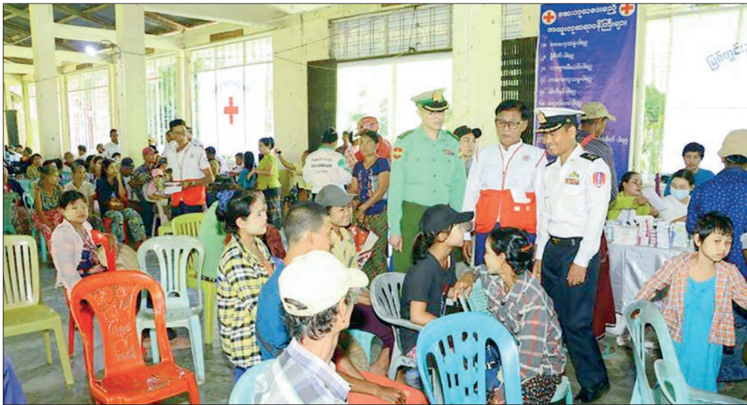
Healthcare services underway yesterday in Wakema Township, Ayeyawady Region.

TATMADAW Naval Hospital Ships named Shwe Puzun and Saku provided healthcare services to locals in Kanasogon village in Wakema Township yesterday. During the healthcare programme, the medical team provided healthcare to 615 locals. The treatments includ-