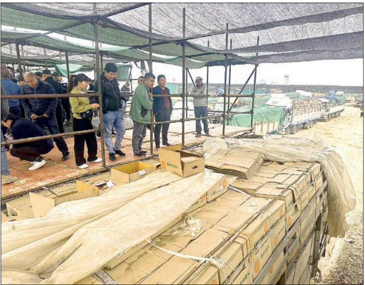
This image reveals a lorry carrying fruits to China.

“Muskmelons, which were grown with the expectation of the Muse trading route, have been exported through Mongla only for now. Even if it costs more and takes the journey longer, there is no option but to transport them to their destination when the time arrives. The price of melon and muskmelon is good,” said the person in charge of the fruits wholesale trading centre. Despite a good price, good-quality melon and muskmelon are being exported in limited quantities. — MT/ZS