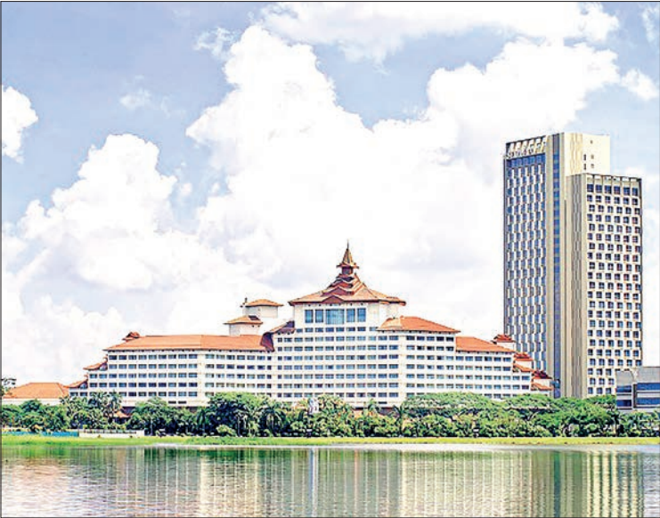
A glimpse of the hotel in Yangon Region.

THE Yangon Region Tourism Committee has approved hotel investment projects worth K9.878 billion, which are expected to create 223 job opportunities, according to the committee’s meeting 3/2025. “Among the approved pro-