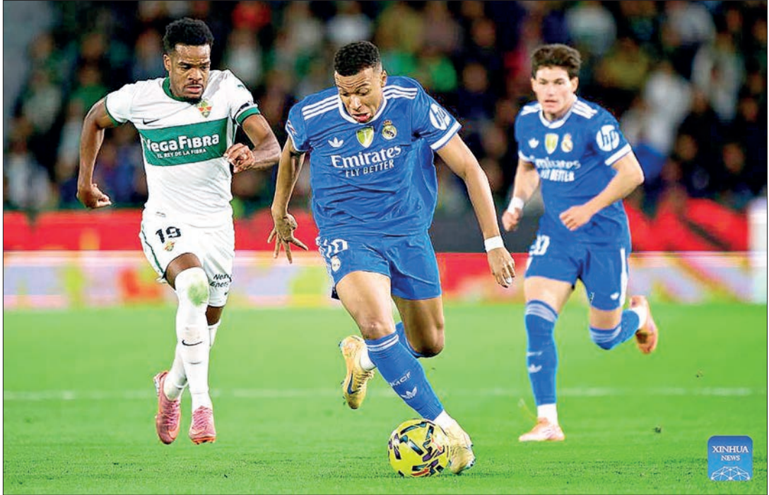
Kylian Mbappe (C) of Real Madrid dribbles the ball during the La Liga football match between Elche and Real Madrid in Elche, Spain, on 23 November 2025.

REAL Madrid's lead at the top of La Liga was cut to one point after a 2-2 draw in a chaotic game away to Elche on Sunday. All of the goals came in the second half, with Aleix Febas putting Elche ahead after getting in behind Trent Alexander-Arnold eight minutes into the second half. Dean Huijsen headed Real Madrid level in the 78 th minute, but Elche was back ahead again six minutes later when Alvaro Rodriguez cut inside to beat goalkeeper Thibaut Courtois with a low shot. Jude Bellingham saved a point for Real Madrid with an 87 th -minute tap-in after good work from Kylian Mbappe and Huijsen, with Elche asking for a foul from Vinicius Jr on goalkeeper Inaki Pena which the VAR did not give. The home side ended the game with 10 men as Victor Chust was sent off in the 96 th minute. Atletico Madrid won 1-0 away to Getafe, whose defender Domingos Duarte deflected Giacomo Raspadori's cross into his own net. — Xinhua