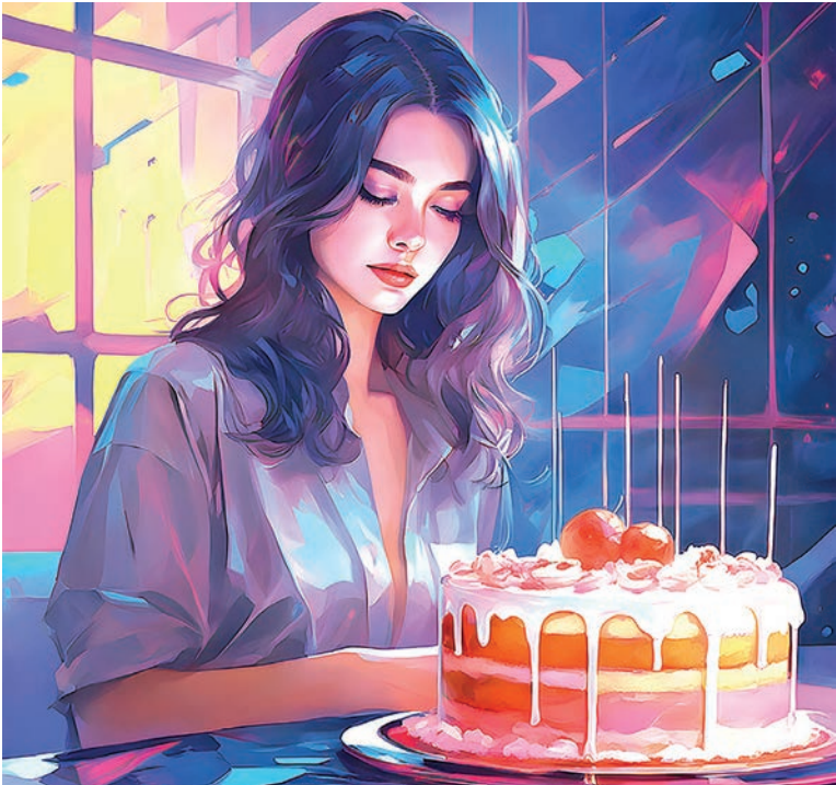
Birthdays offer a subtle yet powerful emotional uplift in our hectic lives, serving as a gentle reminder that we matter beyond our daily roles.

parents, or friends but as human beings whose presence matters. Someone thought of us. Someone