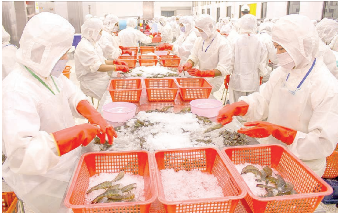
The photo shows shrimp being processed for export markets.

Those individuals executing edible oil, oilseeds, stuffed pastry products, edible bird's nest and related products, edible grains, grains milling industrial products and malt, fresh and dehydrated vegetables, dried beans, plant species, nuts and seeds, dried fruits, unroasted coffee and cocoa bean, special dietary food excluding milk-based formula, functional foods, bee products, aquatic products including farm products, animal products and animal feed and livestock animal businesses need to apply for GACC license in order to place their goods in China's market. The relevant authorities for the registration with GACC are the