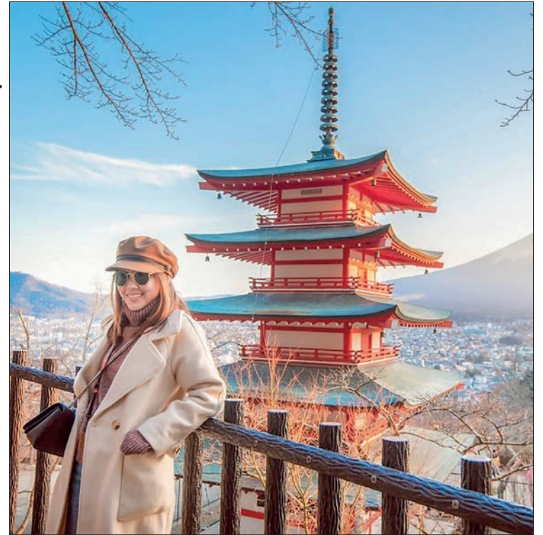
A tourist at the Chureito Pagoda near Japan's Mount Fuji. New services have been launched and regulations eased to encourage wealthy visitors to the country to go off the beaten track as regions look to recover following the Covid-19 pandemic.

China, Germany, France, Hong Kong, India, Indonesia, Singapore, South Korea, Chinese Taipei, Thailand, the United Arab Emirates and Vietnam. Asked what respondents looked for in their visit to Japan, 28.6 per cent cited the diverse food scene, while 27.9 per cent were drawn to the country's culture and 25.6 per cent to unique natural landscapes. — Kyodo