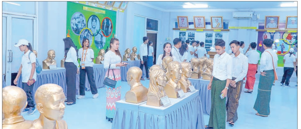
Youths visit the sports museum at the Wunna Theikdi Stadium in Nay Pyi Taw operated by the Ministry of Sports and Youth Affairs, yesterday.

THE youth study programme and social benefit activities organized by the Myanmar Youth Affairs Central Committee commenced yesterday morning, with the aim of enabling young people to exchange experiences and knowledge in a friendly manner, to identify and promote traditional cultural heritage and national cultural characteristics, and to establish a harmonious community that develops steadily.