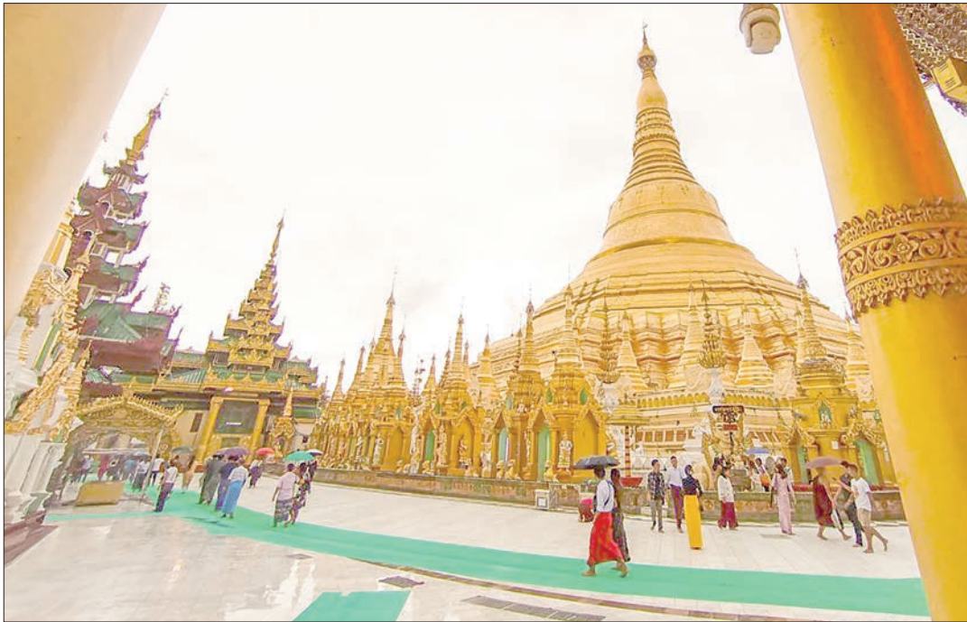
This photo showcases Shwedagon Pagoda in August 2024.