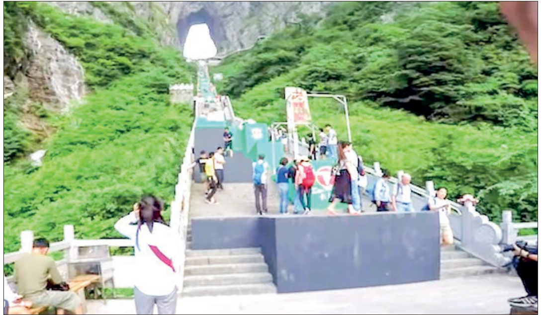
This file photo shows a competitor completing a sequence of jumps and flips at the Tianmen Mountain National Forest Park in Zhangjiajie, central China's Hunan Province.

the Olympic Refugee Foundation (ORF) - with support from UNHCR, the UN Refugee Agency - to give forcibly displaced athletes the chance to showcase their talents on the highest sporting stage. "These refugee athletes have overcome immense challenges, but their success is a reminder to the world of what can be achieved when refugees are given a helping hand to pursue their dreams," said Deputy High Commissioner for Refugees, Kelly T Clements, who watched the team take part in the Paris 2024 closing ceremony on Sunday. — Xinhua