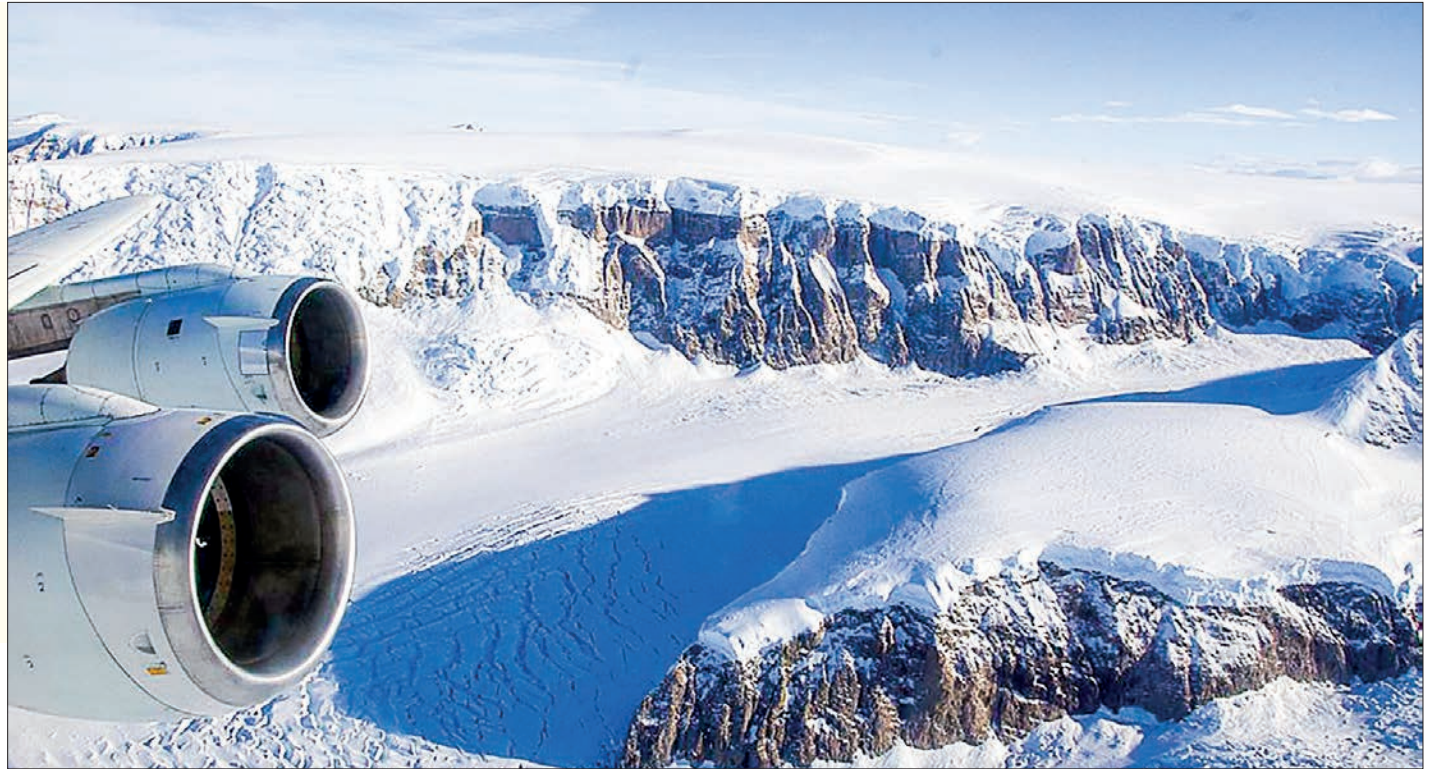
Cryospheric sciences study the Earth's ice and snow systems, including glaciers, ice caps, and sea ice. This field examines their impact on climate, sea level rise, and ecosystems.

This initiative aims to tackle challenges related to melting glaciers and changes in the cryosphere by promoting scientific research and monitoring.