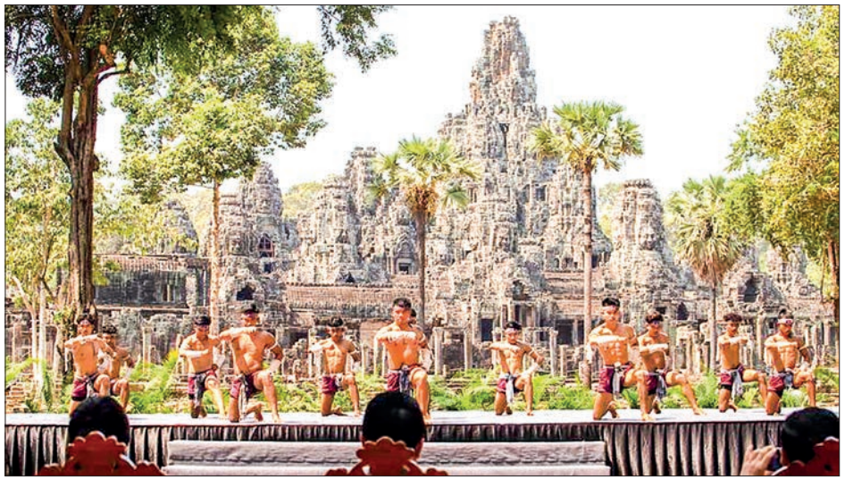
Cambodian Bokator martial artists perform at the northern part of Bayon Temple in the complex of the Angkor Archaeological Park in Siem Reap province, Cambodia, 24 April 2024.

Cambodia's strong ties with China significantly enhance economic cooperation and exchanges between the two nations.