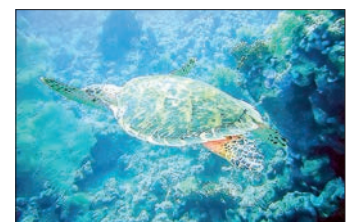
India's blue economy initiative aims to sustainably harness ocean resources, fostering economic growth while protecting marine ecosystems. PHOTO: REPRESENTATIVE IMAGE/WIKIMEDIA COMMONS

est, including the maritime security environment in the Indo-Pacific region, maritime domain awareness, Humanitarian Assistance and Disaster Relief (HADR) coordination, regional and multilateral engagements and sustainable use of marine resources. — ANI