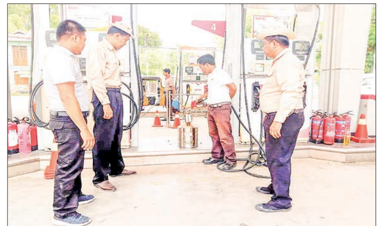
This photo shows petrol stations under inspection to ensure compliance with quality standards and accurate measurements.

The Petroleum Products Supervision and Inspection Department under the Ministry of Energy is responsible for the supply chain of petroleum products. The specification inspections will be carried out more effectively at petrol stations in relevant regions and states to ensure the continued development of a responsible supply chain for petroleum products and ensure compliance with quality standards and accurate measurements. — TWA/MKKS