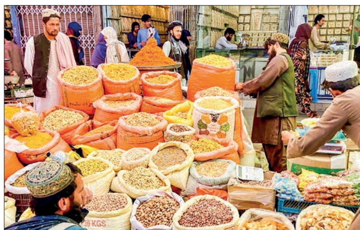
Afghan people buy dry fruits at a local market in Kandahar province, Afghanistan, 20 April 2023.

Afghanistan has great mineral and agricultural potential, which the Taliban government is attempting to exploit, but they are impeded by poor infrastructure and a lack of domestic and foreign expertise and capital. — AFP