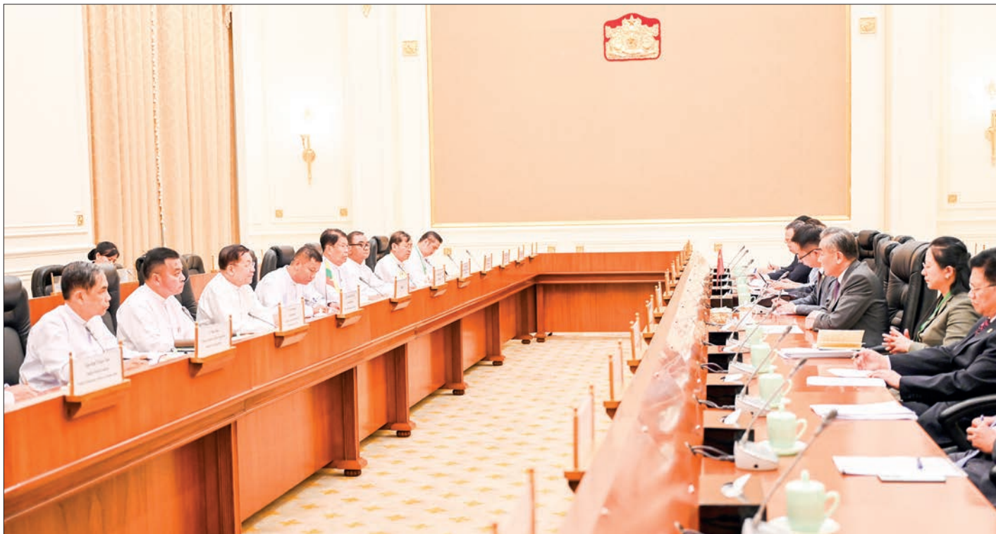
SAC Chairman Prime Minister Senior General Min Aung Hlaing holds talks with HE Mr Wang Yi and the delegation yesterday in Nay Pyi Taw.