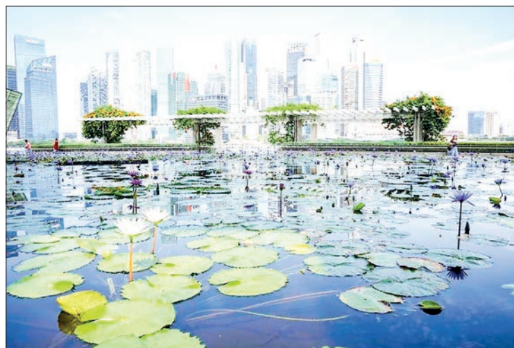
This photo taken on 13 August 2024 shows the business district at Singapore's Marina Bay.

THE Singapore economy expanded 2.9 per cent year-on-year in the second quarter of