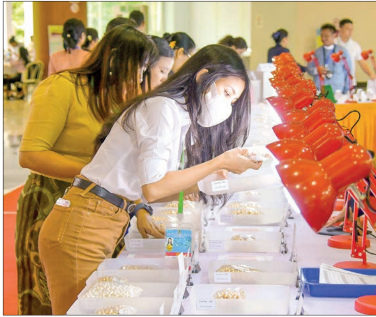
Gem traders evaluate Myanmar's South Sea pearls at the third day of the emporium in Nay Pyi Taw.