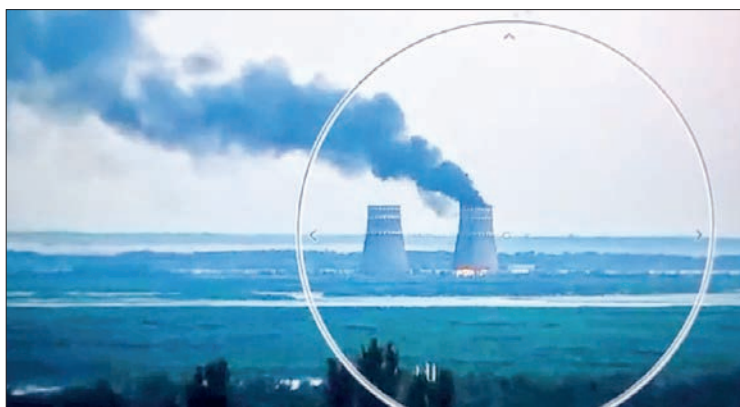
The IAEA noted that the fire's primary source likely did not originate at the base of the cooling tower and that the damage appeared concentrated inside the tower, specifically around the water nozzle distribution level about 10 metres high.

The IAEA will continue its analysis of the situation.