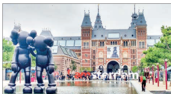
The Netherlands saw a sharp rise in company bankruptcies in the first seven months of 2024. PHOTO: PEXELS

When workers at the mine went on a 44-day strike in 2017—the longest in Chile's mining history—BHP lost $740 million, contributing to a 1.3 per cent decline in the country's GDP. — AFP