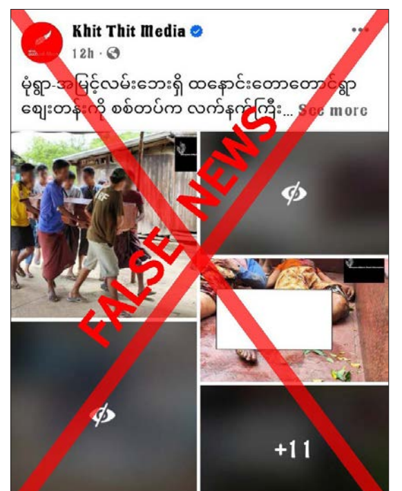
The screenshot of Khit Thit media validates their fake news.

Similarly, subversive media also fabricated stories claiming that security forces in KhinU Township, Sagaing Region, fired heavy weapons into villages in KhinU Township on 11 August, killing an elderly woman, and security forces in Longlon Township, Taninthayi Region, fired heavy weapons at villages in Longlon Township on 12 August. — MNA/TKO