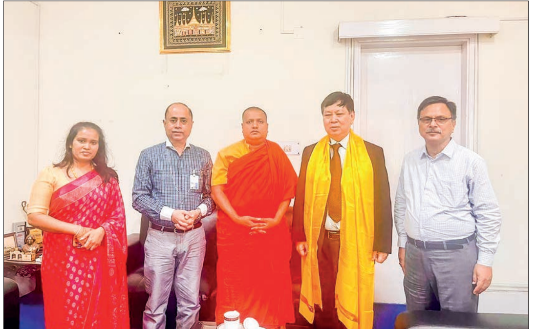
A discussion in progress between Myanmar Ambassador to India U Moe Kyaw Aung and Venerable M Dhammalankara Thero, Bhikkhu-In-Charge of the Maha Bodhi Society of India.

A discussion on promoting religious cooperation between Myanmar and India took place at the Embassy of Myanmar in New Delhi on 13 August, according to the Ministry of Foreign Affairs.