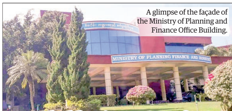
A glimpse of the façade of the Ministry of Planning and Finance Office Building.

Selected photos will be given an appropriate reward, and details can be requested by contacting the Shwedagon Pagoda Board of Trustees office. — TWA/MKKS