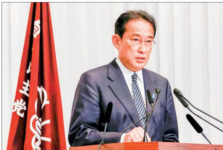
Fumio Kishida, Japan's prime minister, is set to resign at the end of his ruling party's presidential term in September, largely due to his failure to dissolve the House of Representatives at a strategic moment.

Kishida aimed to bolster his political standing and secure a long-term government for his conservative Liberal Democratic Party (LDP), but a series of scandals, including undisclosed income from fundraising parties, led to a significant drop in his approval ratings to around 20 per cent.