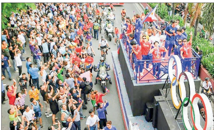
Philippines' Carlos Yulo (C), Paris 2024 Olympic Games double gold medalist in gymnastics, and other Philippine athletes wave during a homecoming parade in Manila.

The organizers said the competition has attracted over 200 enthusiasts to register, and international runners are also invited to compete. — Xinhua