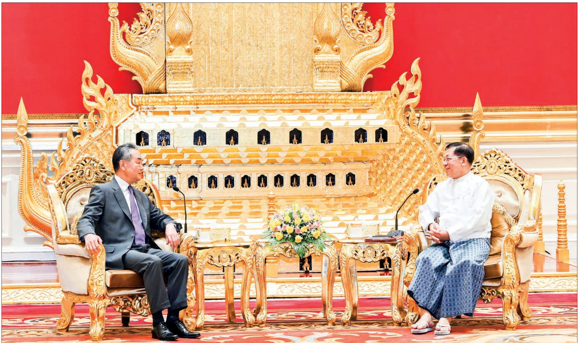
State Administration Council Chairman Prime Minister Senior General Min Aung Hlaing receives HE Mr Wang Yi, Member of the Political Bureau of the CPC Central Committee and Minister of Foreign Affairs of the People's Republic of China yesterday in Nay Pyi Taw.

C HAIRMAN of the State Administration Council Prime Minister Senior General Min Aung Hlaing received a delegation led by HE Mr Wang Yi, Member of the Political Bureau of the CPC Central Committee and Minister of Foreign Affairs of the People's Republic of China at the Credentials Hall of the Office of the State Administration Council Chairman in Nay Pyi Taw yesterday