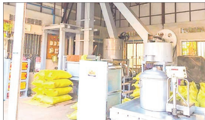
This photo shows a domestic oil mill operating.

The loan scheme started in 2022. Those millers who met loan criteria have already been received. — TWA/KK