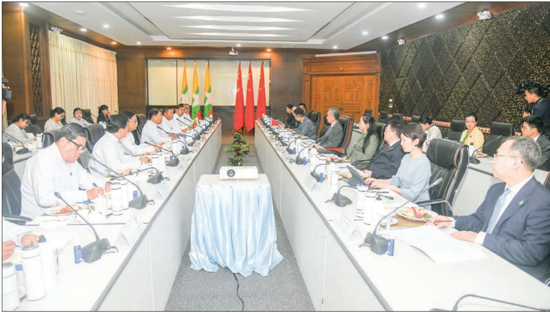
Deputy PM MoFA Union Minister U Than Swe holds talks with Mr Wang Yi, Member of the Political Bureau of the CPC Central Committee and Minister of Foreign Affairs, yesterday in Nay Pyi Taw.

U THAN SWE, Deputy Prime Minister and Union Minister for Foreign Affairs of the Republic of the Union of Myanmar, held Myanmar-China bilateral consultations with Mr Wang Yi, Member of the Political Bureau of the Chinese Communist Party Central Committee and Minister for Foreign Affairs of the People's Republic of China, yesterday at the Ministry of Foreign Affairs, Nay Pyi Taw.