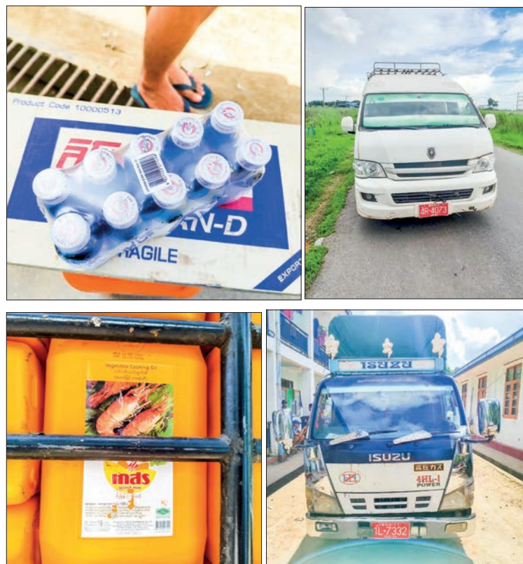
Confiscated illegal items and vehicles at the Mayanchaung checkpoint.

The combined efforts on 12 and 13 August resulted in the seizure of 15 cases of illegal goods, with an estimated total value of K659.77 million, according to the Leading Committee for the Prevention of Illegal Trade. — MNA/KZL