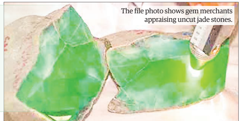
The file photo shows gem merchants appraising uncut jade stones.

They must also present a CV form, citizenship scrutiny card, education certificate or recommendation, three passport-sized photos taken within three months, health certificate, recommendation letter from the ward administrator or village administrator and parent or guardian approval.