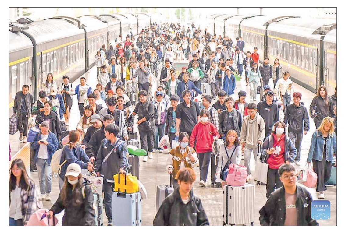
Passengers walk on the platform at Yantai Railway Station in Yantai, east China's Shandong Province, 6 October 2024. China sees a surge in return trips on Sunday as the week-long National Day holiday draws to a close

DURING the seven-day National Day holiday that concluded on Monday, the number of passenger trips exceeded two billion, the Ministry of Transport announced on Tuesday.