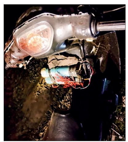
Seized handmade mine.

Upon inspecting the motorcycle, security personnel discovered two handmade mines made with concrete pipes. The