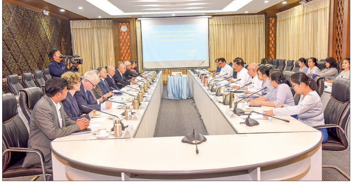
The briefing to representative of the UN agencies in Myanmar facilitated by Deputy Prime Minister MoFA Union Minister U Than Swe in progress yesterday in Nay Pyi Taw.

At the briefing, he stressed that the Government assures all available assistance to reach the needy population without any discrimination. The Government does not block any humanitarian aid from UN agencies and international organizations. It allows access to all secured areas while taking into consideration the safety and security of their