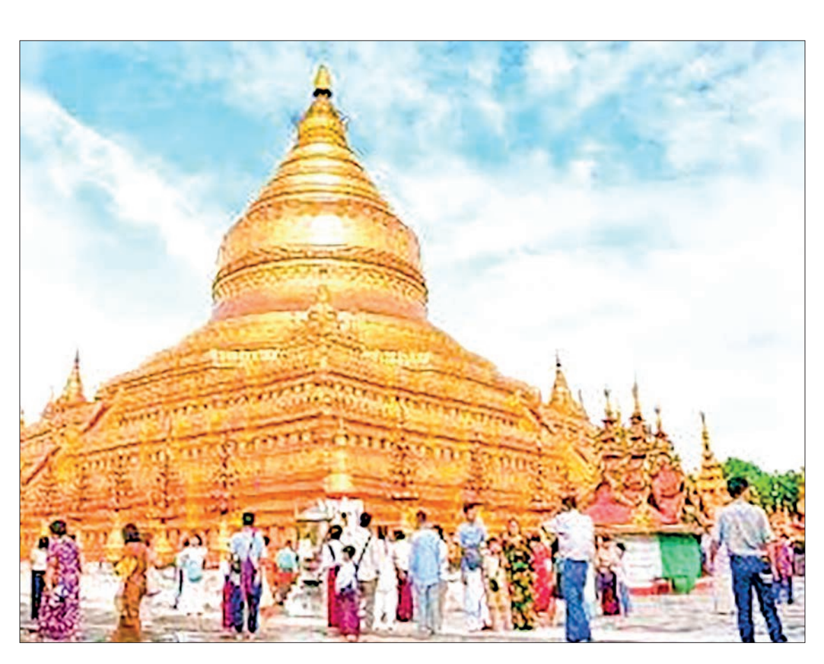
The photos above and below show both local and international visitors exploring pagodas and temples in the Bagan Ancient Cultural Heritage Zone.

Bagan hosted over 600,000 visitors on the full moon day of Thadingyut last year, whereas about 8,000 on the day before the full moon day, a well-known pagoda hosted about 6,000 travellers. Therefore, the hotels and guesthouses were fully booked, and the locals enjoyed proper job opportunities.