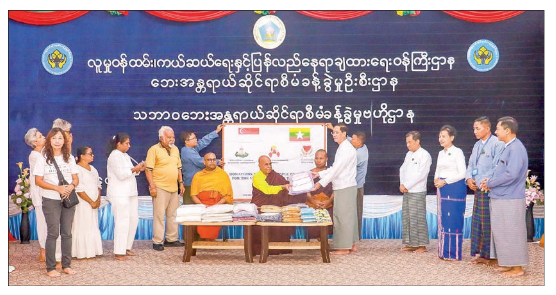
This photo captures Deputy Minister U Soe Kyi receiving donations for flood-ravaged regions.

ter Management Committee (Ministry of Foreign Affairs), a delegation led by Sayadaw Dr K Gunaratana arrived in Nay Pyi Taw on 8 October. They personally delivered relief items to the flood-impacted areas there, under the arrangement of the Ministry of Social Welfare, Relief, and Resettlement. — MNA/TRKM