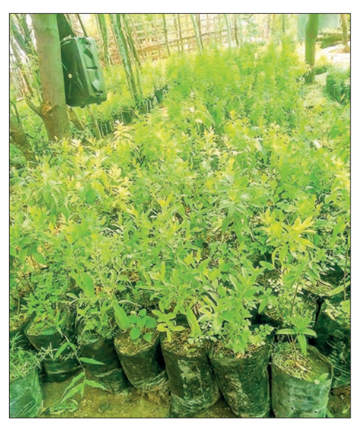
Sandalwood nursery farms