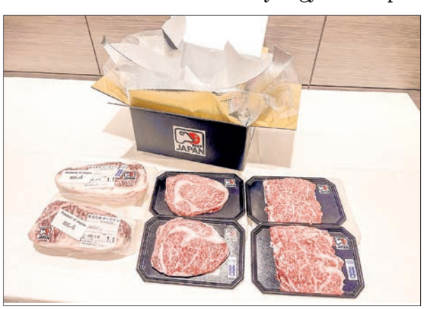
Photo taken on 7 October 2024 shows wagyu beef to be sold by Japan Airlines Co.

Monday to sell Japanese luxury wagyu beef to pas-