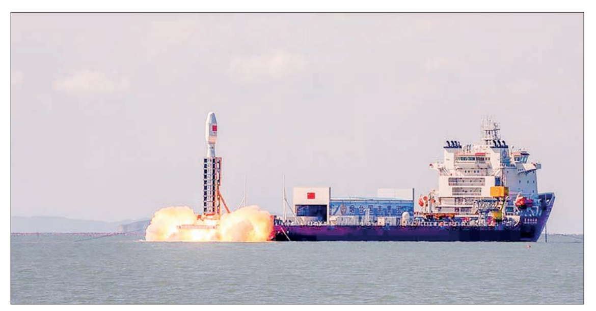
A Smart Dragon-3 carrier rocket carrying eight satellites blasts off from the waters near the city of Haiyang in east China's Shandong Province, 24 September 2024.

ADA Space, a Chinese AI satellite internet technology company, announced on Sunday that its recently-launched satellite has successfully completed the technical verification of AI large-model technology during the in-orbit operation.