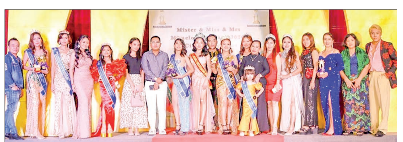
This photo showcases the Mister & Miss Miracle Myanmar 2025 City Winner selection event.

anmar 2025 City Winner competition awarded titles to several participants. They include the Bagan City Winner, Thanlyin City Winner, Pyay City Winner, Taunggyi City Winner, Taunggoo City Winner, and Yangon West City Winner. Additionally, outstanding contestants received awards for categories such as Best Body, Best Evening Gown, Best Personality, Best Catwalk, and Best Opening & Introduction.