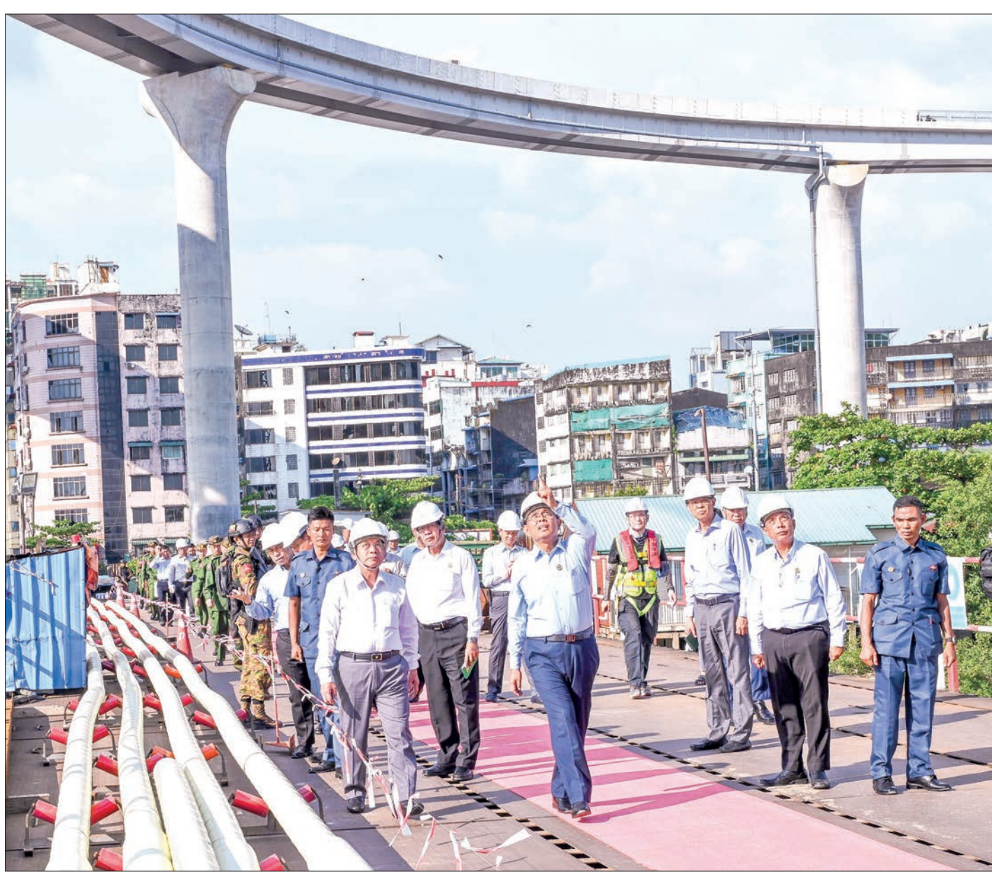
State Administration Council Chairman Prime Minister Senior General Min Aung Hlaing views round the construction project site of the Myanmar-Korea Friendship (Dala) Bridge yesterday.

During the goodwill visit to the Republic of Korea in 2012, President U Thein Sein discussed with officials the implementation of the Myanmar-Korea Friendship (Dala) Bridge project. The