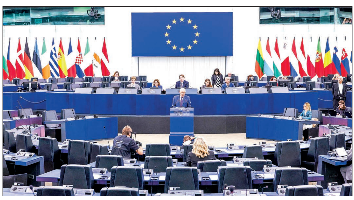
European Union High Representative for Foreign Affairs and Security Policy Josep Borrell (C) delivers a speech during a debate on the escalating conflict in the Middle East and events in Lebanon, as part of a plenary session at the European Parliament in Strasbourg, eastern France, on 8 October 2024.

EU lawmakers on Monday held a minute of silence in remembrance of the victims of the 7 October attack by Hamas on Israel, as the bloc's chief vowed to step up the fight against antisemitism.