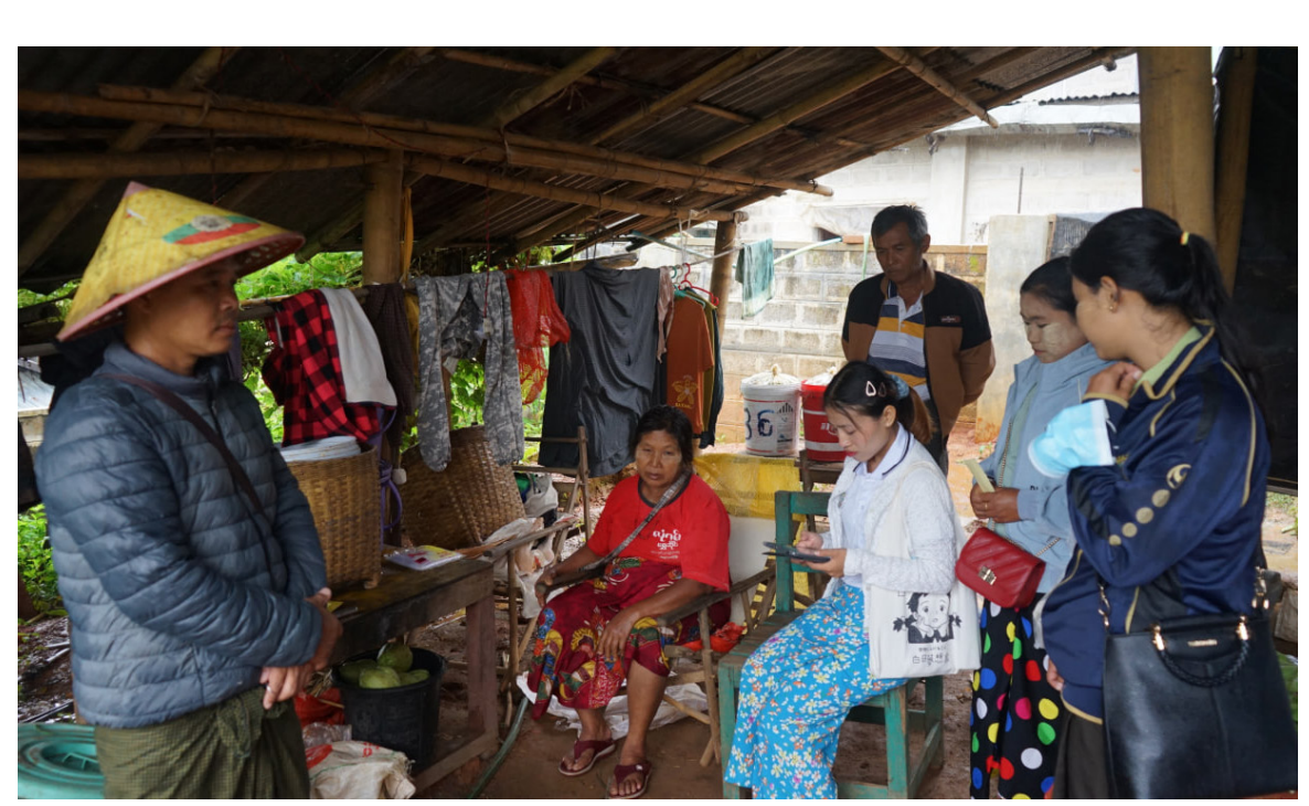
Census-collecting activities are underway in the PaO Self-Administered Zone.

Census collection in Myanmar has a long history, dating back to the British colonial period when the first official census was con-