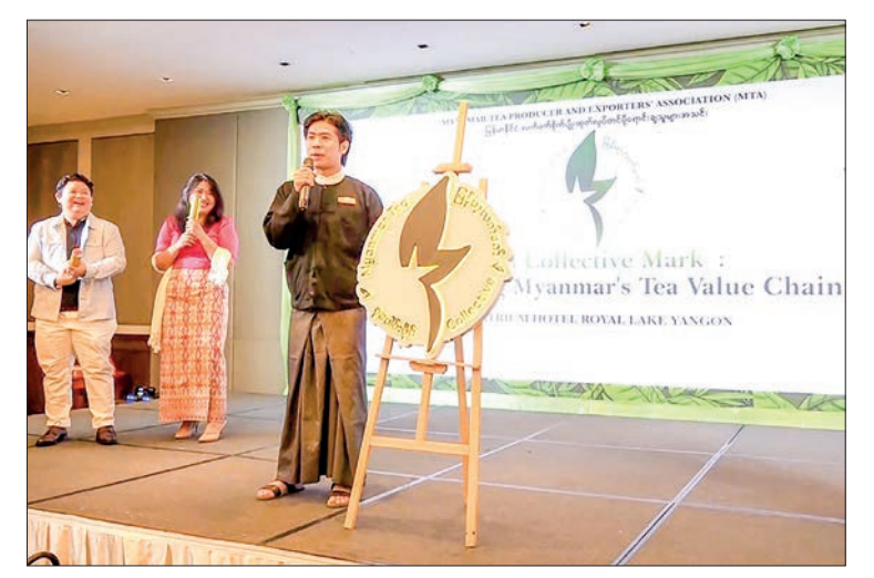
This image shows a Myanmar Tea Collective Mark logo to be used in the tea product and service sector.

This mark is associated with all the stakeholders in the tea supply chain, including growers, producers, traders and service providers. — ASH/KK