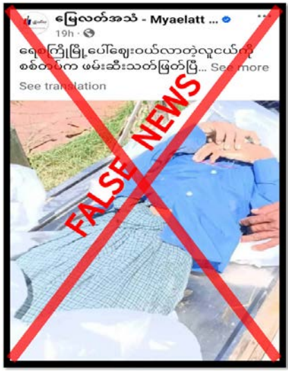
This screenshot validates misinformation.

IN the Kyetmwe port of the Chindwin River, located in Thukhawady ward, Magway Region, unverified reports suggest that security personnel have captured and killed a young shopper before disposing of the body in the river. These claims have emerged from malicious news media outlets, which are circulating unconfirmed and misleading information.