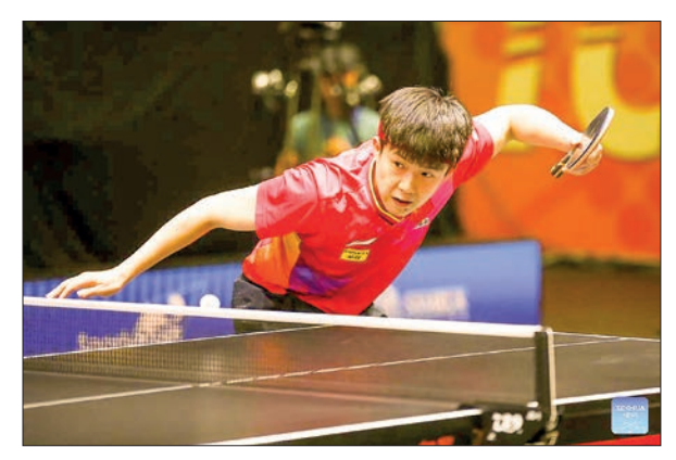
Wang Chuqin of China serves against Noshad Alamiyan of Iran during the men's teams quarterfinals match between China and Iran at the 27<sup>th</sup> ITTF-Asian Table Tennis Championships in Astana, Kazakhstan, 8 October 2024.

CHINA overcame world No 1 Wang Chuqin's shocking defeat in the opening set to dispatch Iran 3-1, reaching the men's team semifinals of the Asian Table Tennis Championships on Tuesday.