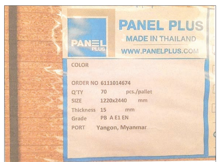
Confiscated illegal items in different states and regions.

The Illegal Trade Eradication Steering Committee reported that a total of 28 arrests were made on 7 and 8 October. with illegal goods worth approximately K327 million being seized. — MNA/MKKS