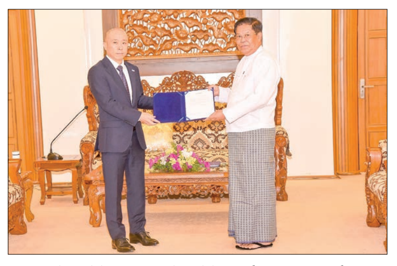
\label{lem:continuous} Deputy\ Prime\ Minister\ MoFA\ Union\ Minister\ U\ Than\ Swe\ accepts\ the Letter\ of\ Accreditation\ from\ the\ IOM\ Chief\ of\ Mission\ in\ Myanmar\ yesterday.

Also present at the call were senior officials from the Ministry of Foreign Affairs. — MNA