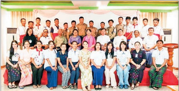
This photo captures the opening ceremony of the basic family reunification training course in Magway.

Twenty-four Red Cross volunteers from sixteen townships in Magway Region are attending the three-day training, which runs from 13 to 15 August. The opening ceremony was attended by the club’s executive, members of the Magway Region Red Cross Supervisory Committee, officials from the Disaster Management and Family Reunification Departments, representatives from the ICRC, and Red Cross volunteers participating in the training. — ASH/TH