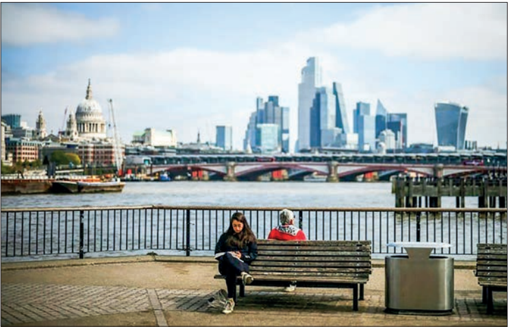
Britain’s economy grew 0.3 per cent in the second quarter – better than feared but a slowdown from 0.7 per cent in the first three months of the year.

Total approved investments from both foreign and Filipino nationals in the second quarter of 2025 reached 299.08 billion pesos (about $5.27 billion), a 58.5 per cent decline from a year earlier. — Xinhua