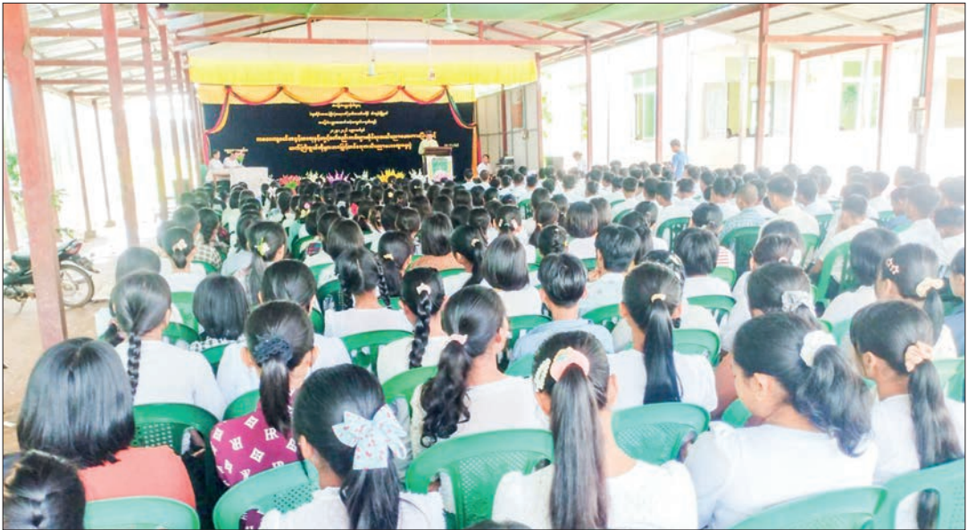
The awareness session on children’s rights and ethical conduct in progress yesterday in Bago Region.

After the talks, students had the opportunity to ask questions, which the officials answered in detail. Gifts were presented to students who took part in the question-and-answer session. — Maung Shwe Win (Pyay)/KZL