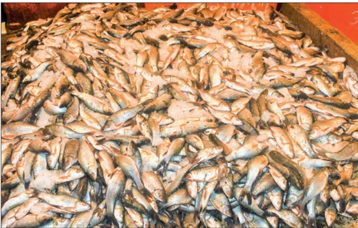
Photos show a freshwater product, rohu, being sold at the Shwe Padauk Fish Market in Hline Township, Yangon.

Before the first week of July, when saltwater products started entering the market, freshwater products were fetching good prices. As a result, fish pond owners in Ayeyawady Region, Yangon Region, and Bago Region harvested their ponds ahead of schedule. This was because the current market prices offered higher profits than raising the fish to full maturity, and the savings on fish feed costs and the ability to avoid possible flooding of ponds caused by weather conditions. The fish were then sent