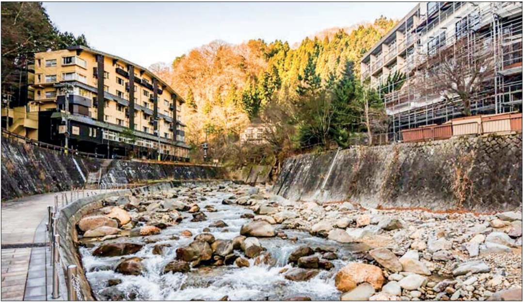
Tsuchiyu Onsen is a charming hot spring town located in Fukushima Prefecture, about 40 minutes by bus from Fukushima Station.

Le Furo aims to export Japan’s hot springs and establish several onsen facilities in the Gulf region by 2026.