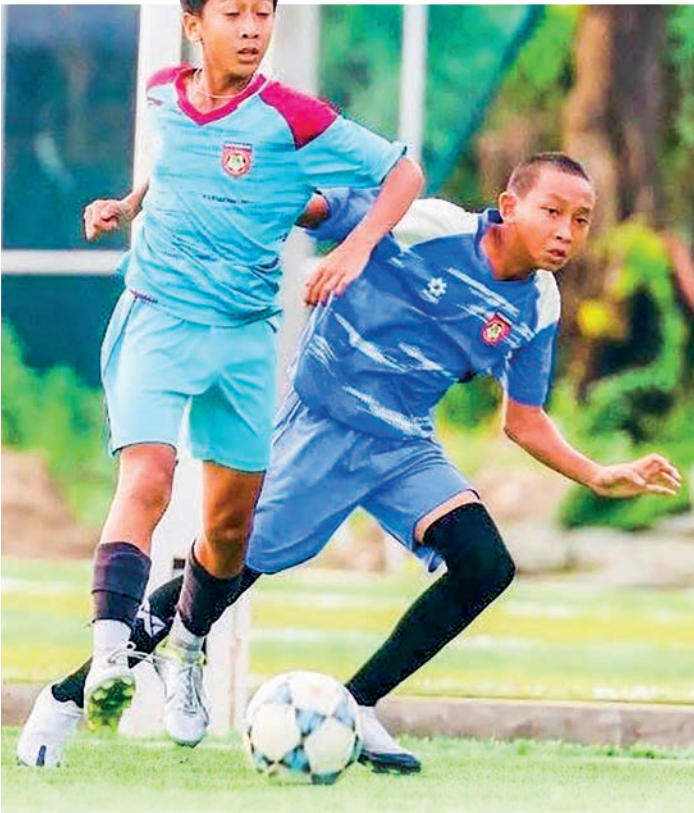
The Myanmar U12 football team to compete in the Japan Invitation Junior Soccer World Challenge 2025.

The Myanmar U12 team is formed with 18 players selected from regions and states, as well as