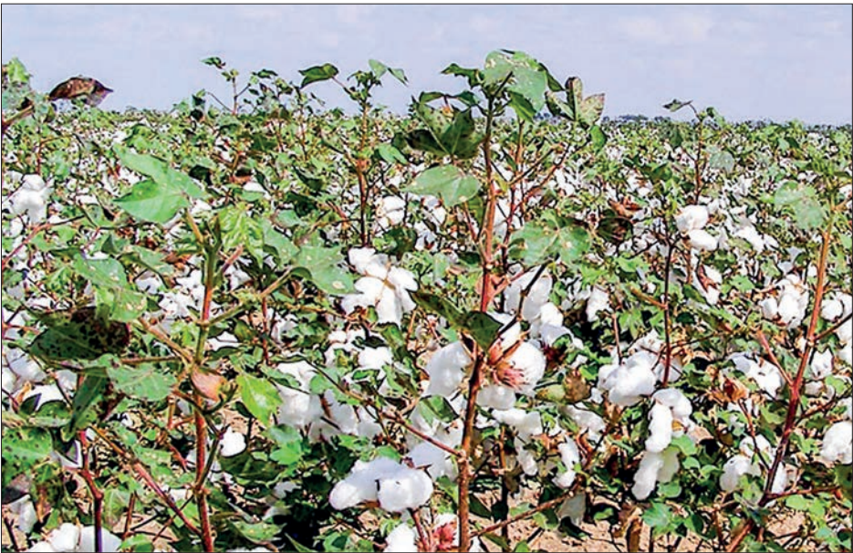
This photo shows a thriving cotton field in Myanmar.

“When growers neglect cottonseed consistency, their efforts will be fruitless. Ginnerers need to maintain quality by categorizing the cotton varieties and processing systematic operations. This way, nothing will go in vain. If not, the