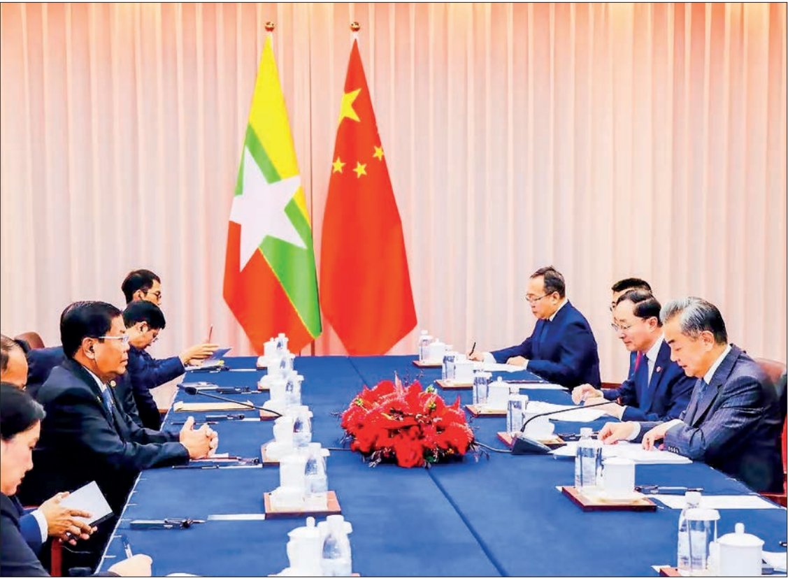
Union Minister for Foreign Affairs U Than Swe holds talks with Chinese Minister of Foreign Affairs Mr Wang Yi in Anning, China.

During the meeting with the Minister of Foreign Affairs of China, the two sides discussed matters related to bilateral relations and cooperation. The Union Minister also apprised his Chinese counterpart of the preparations for the upcoming election in Myanmar. In response, the Chinese Foreign Minister expressed the full support of China for the holding of the election and political development in Myanmar. — MNA