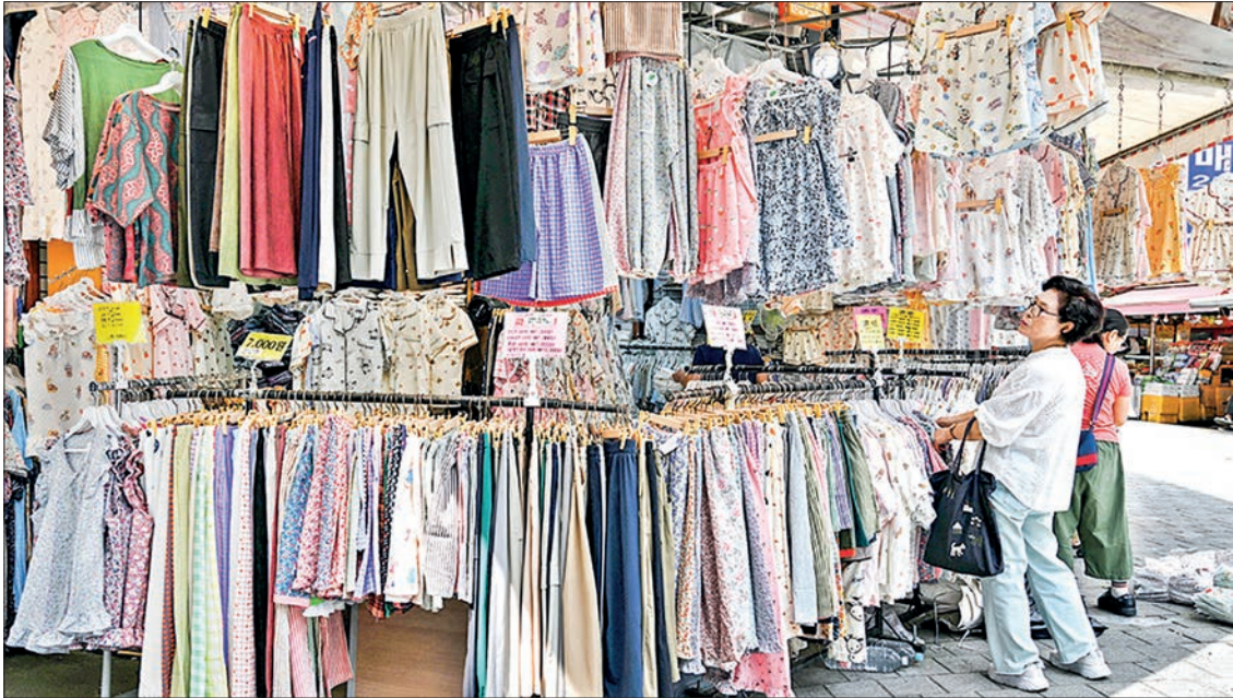
A woman browses for clothes at a stall at Namdaemun Market in Seoul.

Despite positive trends, concerns persist regarding the Asian economy, particularly due to delayed recovery in construction investment.