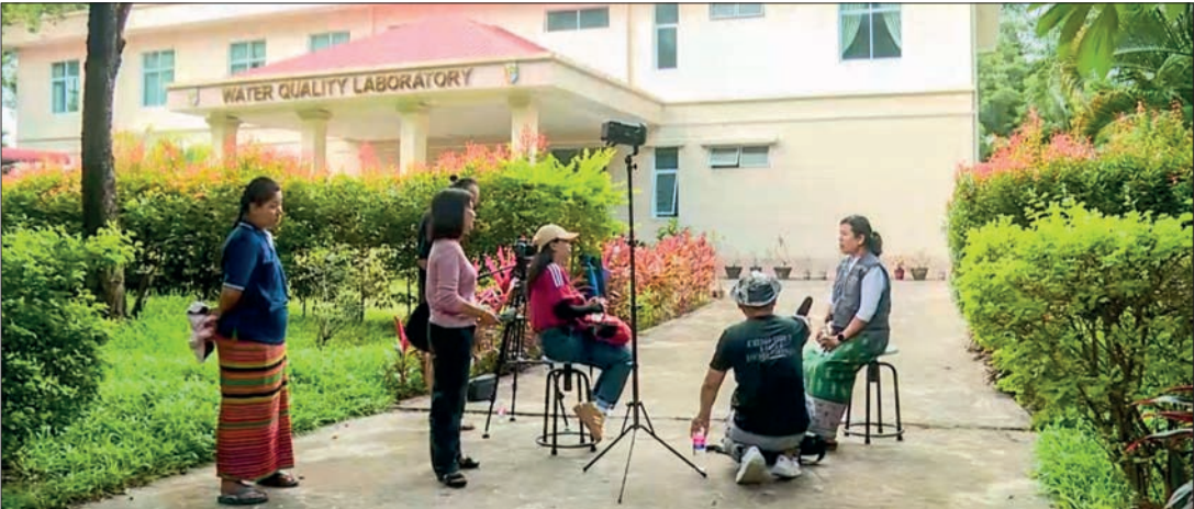
This photo shows a documentary film shooting of Chinese Guangxi Broadcasting and Television Bureau from Guangxi in Nay Pyi Taw.

carved in Pali and Romanized scripts using modern tools, as well as the Mucalinda Lake and Nagayon Pagoda. The filming will continue in Nay Pyi Taw and Yangon until 19 August. Once completed, the documentary will also include footage from other Lancang-Mekong region countries and be broadcast across the region, showcasing Myanmar's development achievements. — MNA/KZL