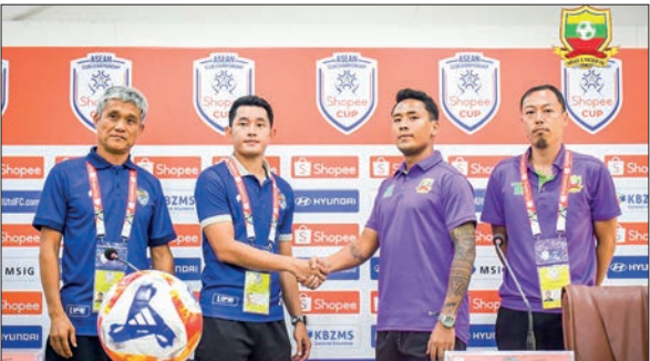
This photo showcases Shan United and EZRA head coaches and captains present at the pre-match press conference.