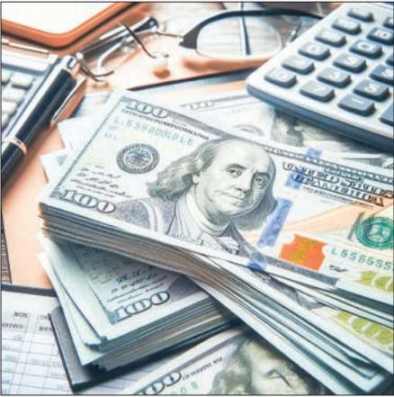
Foreign currencies are seen at a foreign currency exchange counter.

THE Central Bank of Myanmar (CBM) sold over US$1.55 million to edible oil-importing companies and over $128,200 to CMP companies and individuals who made non-trade payments on 13 August.