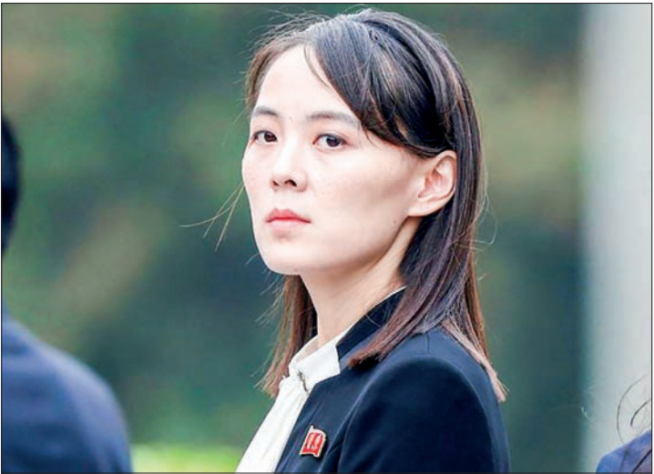
Kim Yo Jong, the powerful sister of North Korea’s leader, has denied reports by Seoul’s military that Pyongyang removed propaganda loudspeakers along the border.

NORTH Korea on Thursday rejected the conciliatory approach taken by the new South Korean government of President Lee Jae Myung as a “pipe dream”, denying Seoul’s claim that Pyongyang has removed loudspeakers for blasting noise along the border in response to a similar move by the South. Kim Yo Jong, the sister of North Korean leader Kim Jong Un and a senior ruling party official, said in a statement carried by the official Korean Central News Agency, “We have never removed loudspeakers installed on the border area and are not willing to remove them,” adding Seoul is “misleading the public opinion”. Soon after his inauguration in June, Lee ordered the South Korean military to stop propaganda loudspeaker broadcasts along the border with North Korea in an effort to ease tensions on the Korean Peninsula. Last week, Seoul said it has begun dismantling the loudspeakers. The broadcasts had been resumed after a six-year hiatus under Lee’s predecessor Yoon Suk Yeol, who adopted a hard-line stance on Pyongyang. — Kyodo