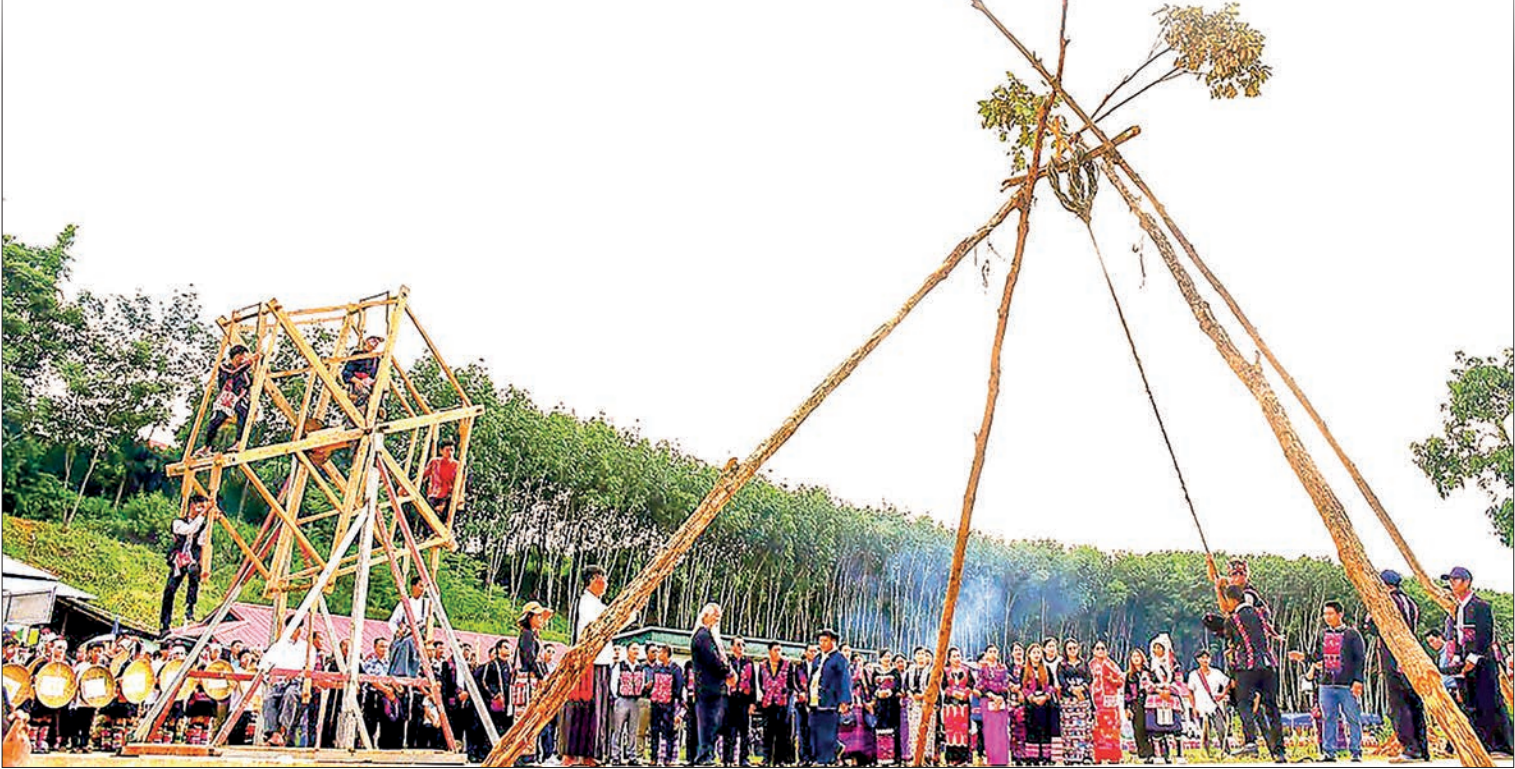
This photo showcases the Akha swing-riding festival held in the previous year.

Myanmar partners with India, Uzbekistan to boost cotton resilience, fair pricing