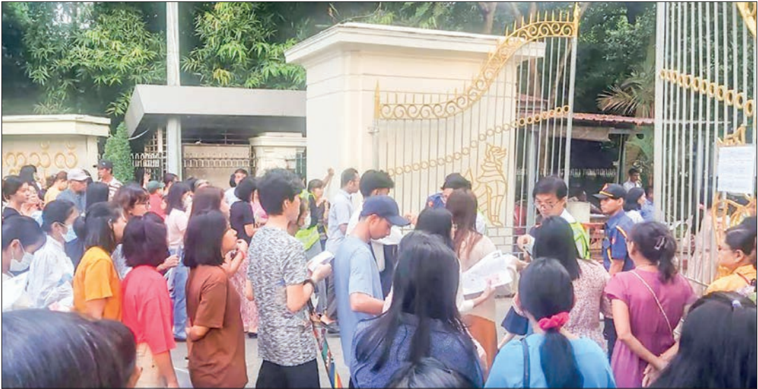
File photo shows applicants for JLPT 2024.

The application will be available at the JLPT Test Management Centre (MAJA) office, located at Snow Garden Housing in Thingangyun Township, as well as at the MAJA Mandalay branch, located at Mandalay Swan Hotel in Chanayethazan Township, from 9 am to 3 pm. The acceptance of applications will be at the same locations. — MT/ZS