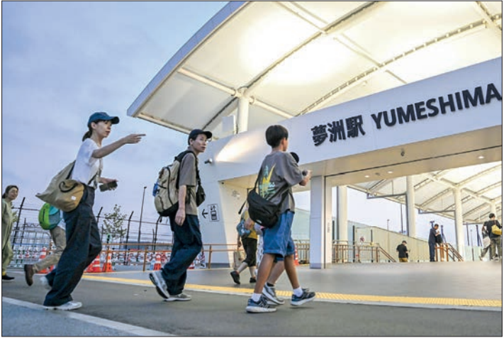
People head from Yumeshima Station to an entrance gate of the World Exposition in Osaka on 14 August 2025.

THE World Exposition in Osaka opened 30 minutes later than usual at 9:30 am on Thursday, following disruptions to the local metro service that left a large number of visitors stranded in the area well into the night before. The opening time was brought forward from the earlier planned 10 am, as there was a large build-up of visitors in front of the entrance gate, the organizers said. The Osaka Metro's Chuo Line, which offers sole direct train access from the city centre to the expo site on