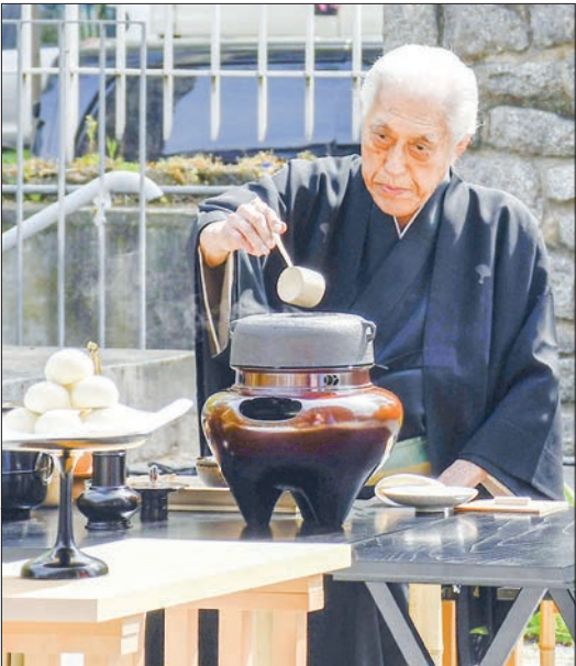
File photo shows Sen Genshitsu, a former grand master of the Urasenke Japanese tea ceremony school, serving tea during a ceremony at the UNESCO headquarters in Paris in April 2019.

MASTER of Japanese tea ceremony Sen Genshitsu, known for his pursuit for world peace through the art, died Thursday, the tea ceremony school he formerly headed said. He was 102. Genshitsu, a former grand master of Urasenke, one of the art’s top three schools in Japan, was recruited to the Imperial Japanese Navy during World War and trained to be a kamikaze pilot but was demobilized following Japan’s defeat. After visiting the United States in 1951 to introduce tea ceremony, he travelled to more than 60 countries to convey his philosophy of “peacefulness through a bowl of tea”. — Kyodo