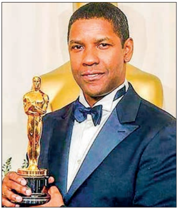
Washington expressed that awards do not define his worth or success.

DENZEL Washington, a celebrated actor with nine Academy Award nominations and two Oscars for his roles in “Glory” and “Training Day,” places little importance on awards, according to a recent interview with Variety. During his press tour for “Highest 2 Lowest,” Washington emphasized that his career decisions are not influenced by the desire to win accolades. He stated, “I don’t do it for Oscars. I don’t care about that kind of stuff,” reflecting on his long career and the inconsistencies of award recognition.