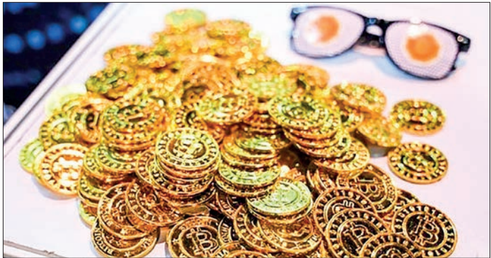
Bitcoin’s value has recently soared, fuelled by US regulatory changes under US President Donald Trump.

above its previous July record, briefly exceeding $124,500 before retreating. US stocks ended higher Wednesday, with the S&P 500 index and the tech-heavy Nasdaq reaching new heights this week, contributing to the cryptocurrency’s rise.