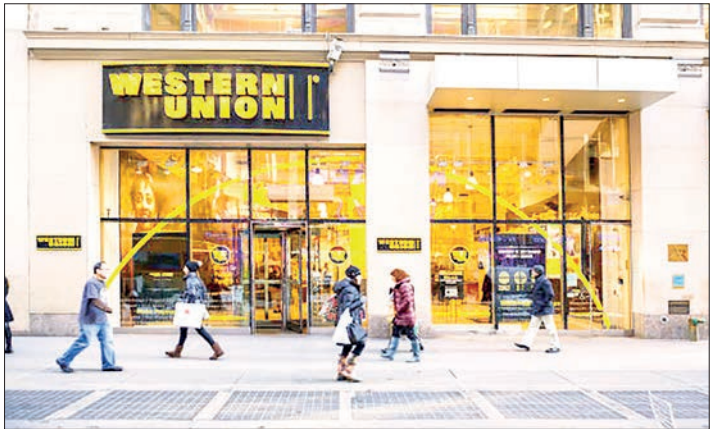
Western Union is a global financial services provider specializing in remittance transfers.