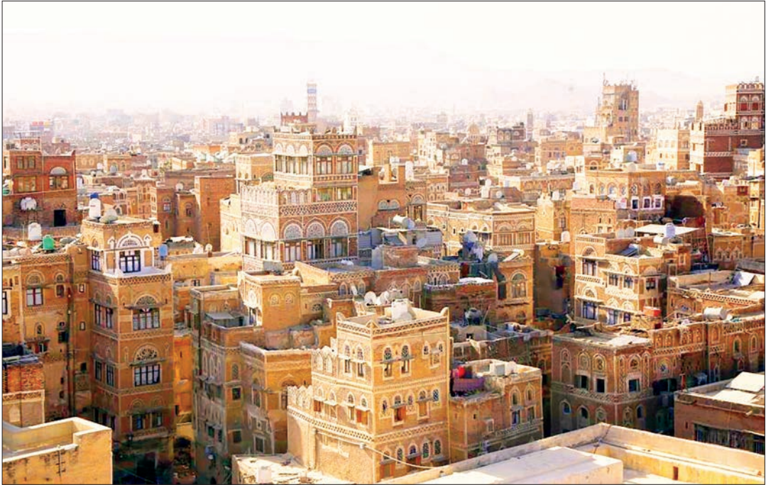
Photo taken on 3 February 2026 shows historical buildings in the UNESCO-listed Old City of Sanaa, Yemen. Yemen’s UNESCO-listed Old City of Sanaa is home to over 6,000 unique multi-storey mud-brick structures dating back 2,500 years.

disappear. AFP reports that the decline has also devastated tourism, once a vital source of income for locals. With buildings collapsing and livelihoods lost, the story highlights growing calls for international support to safeguard Sanaa’s identity before centuries of history vanish. — AFP