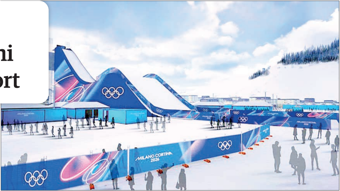
The Milan-Cortina 2026 Winter Olympics are scheduled for 6 to 22 February 2026.

della Pace at the end of Friday's opening ceremony at the San Siro stadium in the city. Compagnoni will be responsible for lighting the other cauldron, inspired by Leonardo da Vinci's knots, in the centre of Cortina d'Ampezzo, 250 kilometres (155 miles) from Italy's economic capital, in the Dolomites. Known as "Tomba la Bomba", or "Tomba the Bomb", Tom-