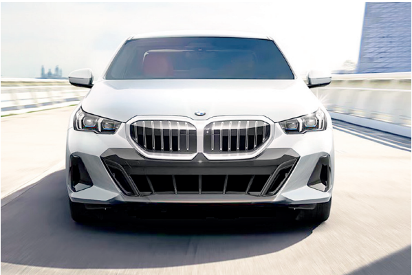
German automaker BMW ranked first in terms of automotive sales in South Korea among foreign companies by selling 6,270 units in January.

The number of imported vehicles sold here jumped 37.6 per cent from a year earlier to 20,960 in January, according to the Korea Automobile Importers & Distributors Association (KAIDA).