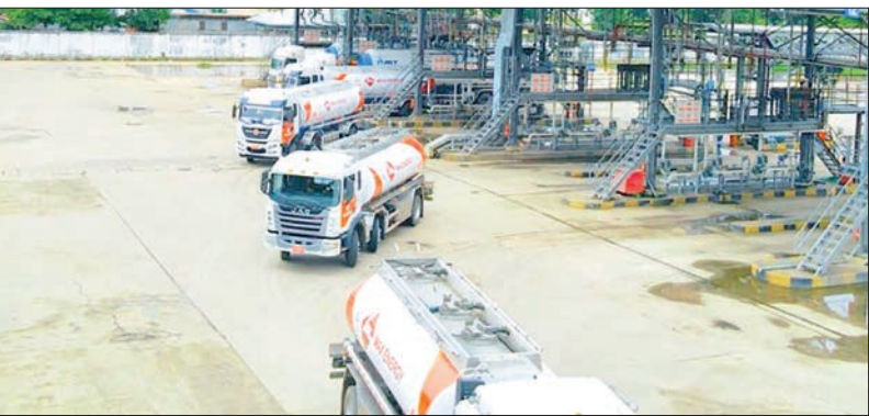
Oil bowsers heading to regions and states for fuel distribution.

THE Vehicles, Heavy Machinery Management and Maintenance Department of the Yangon City Development Committee called for tenders through a competitive bidding system for the sales of unusable tyres, old batteries and irreparable machine parts and discarded metallic materials, according to the Tender Acceptance and Evaluation Committee. Individuals can enquire about tender rules and regulations through the department at Ward 68, Ayeyawun Street, Dagon Myothit (Seikkan) Township at 09 5078561, 09 5154916, and 09 443036564. The tender form is available at the department by 18 February. The deadline for the tender submission is 20 February. Tender opening will be held on 25 February at a two-storey religious building, according to the committee. — NN/KK