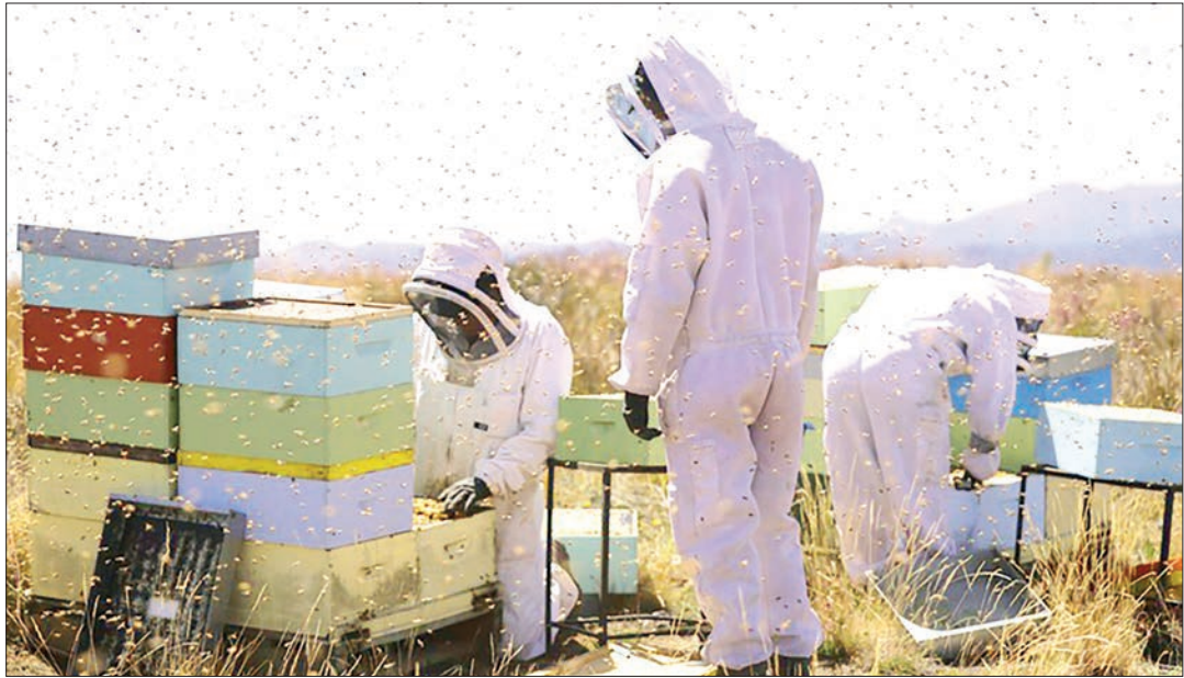
Bee keepers work at Matakana Village, the North Island, New Zealand, 11 February 2020.

NEW Zealand’s unemployment rate rose to 5.4 per cent in the December 2025 quarter, the highest since the September 2015 quarter when it was 5.7 per cent, Stats NZ reported Wednesday. The unemployment rate of 5.4 per cent was up from 5.3 per cent in the previous quarter, said the statistics department. The number of unemployed people rose by 5,000 to