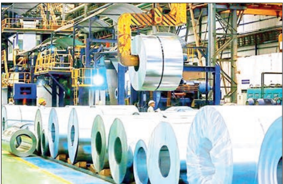
The deal supports India’s manufacturing push, export diversification, and ambition to climb the global value chain.

INDIA-US trade deal complements India’s manufacturing push under the PLI schemes, supports export diversification, and advances its goal of