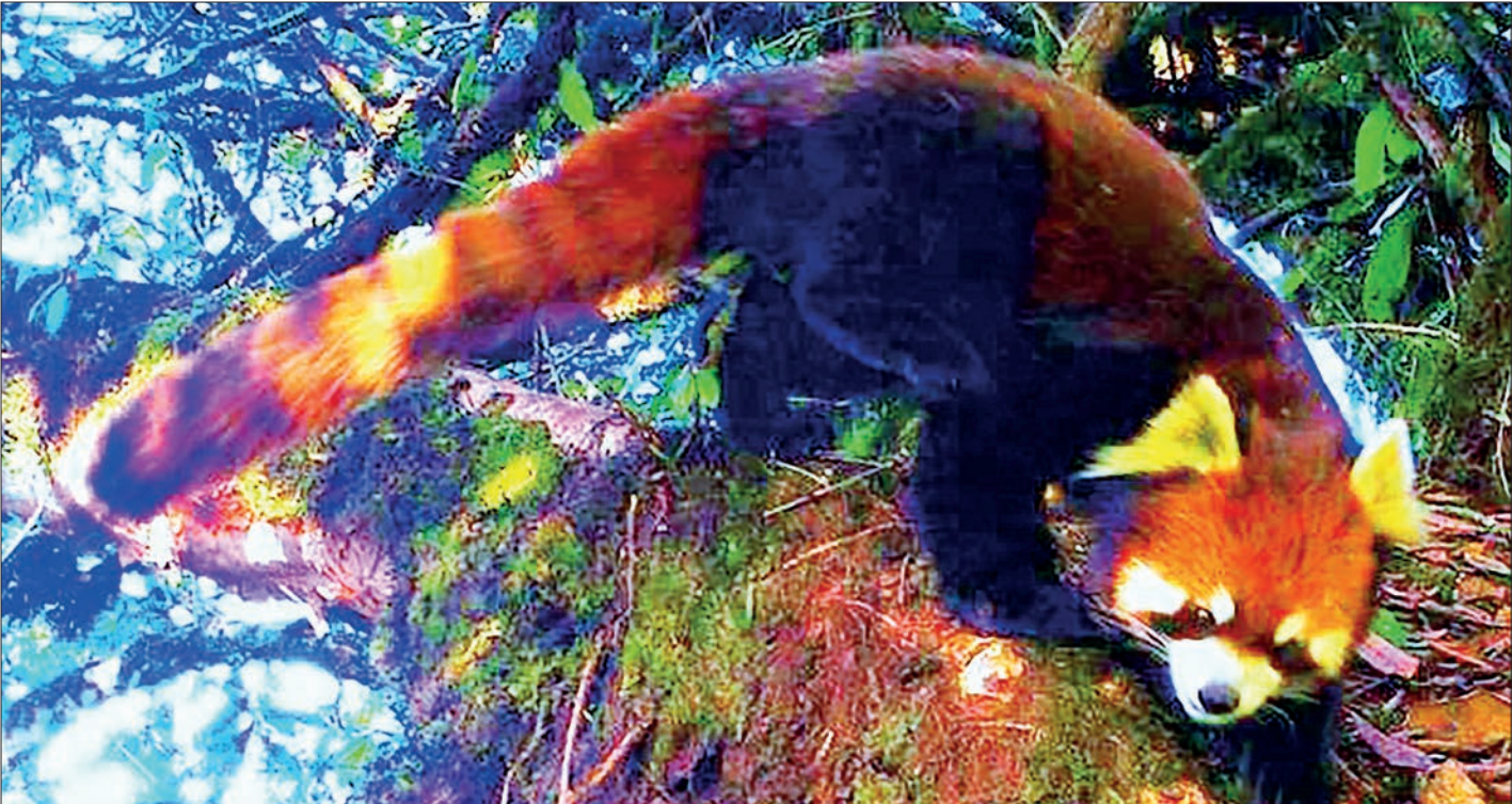
This photo features the Hkakaborazi National Park – a habitat for Myanmar’s red pandas.

Eurasia and North America between 18 and 25 million years ago, similar to now-extinct related species. Covered in reddish-brown fur, red pandas are difficult to spot. The International Union for Conservation of Nature (IUCN) has listed them as a rare species facing the risk of extinction, with only about 10,000 individuals remaining worldwide. They are most commonly found in the eastern Himalayan region, south-western China, and the glacial mountains of northern Myanmar. As mammals, they are the only surviving species of their entire family. Although classified as carnivores, red pandas mainly feed on young bamboo leaves, similar to giant pandas, and also consume birds, bird eggs and insects. — Thitsa (MNA)/MKKS