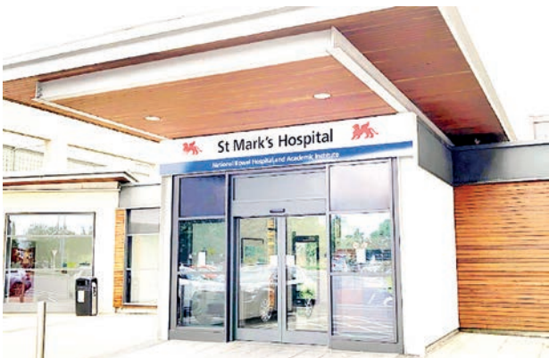
In northwest London, Saint Mark's hospital houses over a century of preserved tumour and tissue specimens, forming a unique medical archive of bowel disease history.

The project aims to transform past suffering into future hope, with findings expected in three years. — AFP