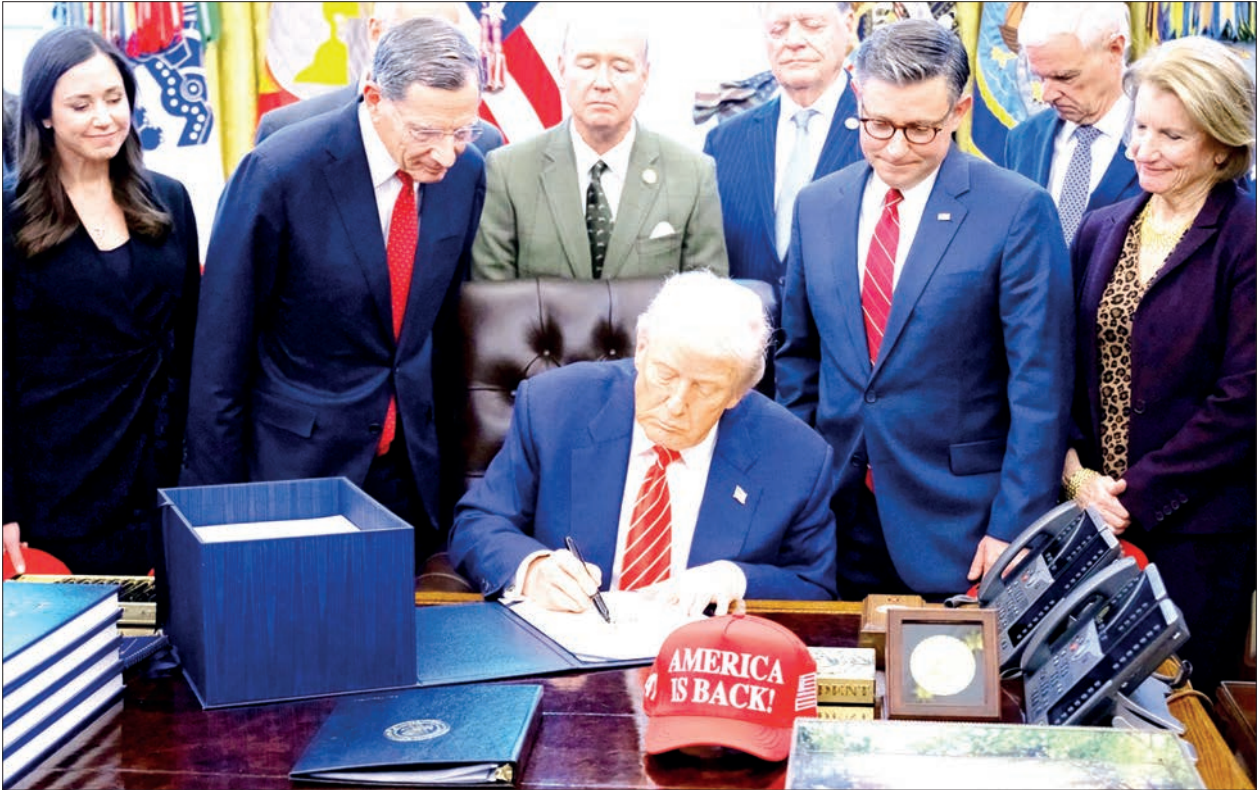
President Donald Trump signs a funding bill to end a partial government shutdown in the Oval Office of the White House in Washington, on 3 February 2026.