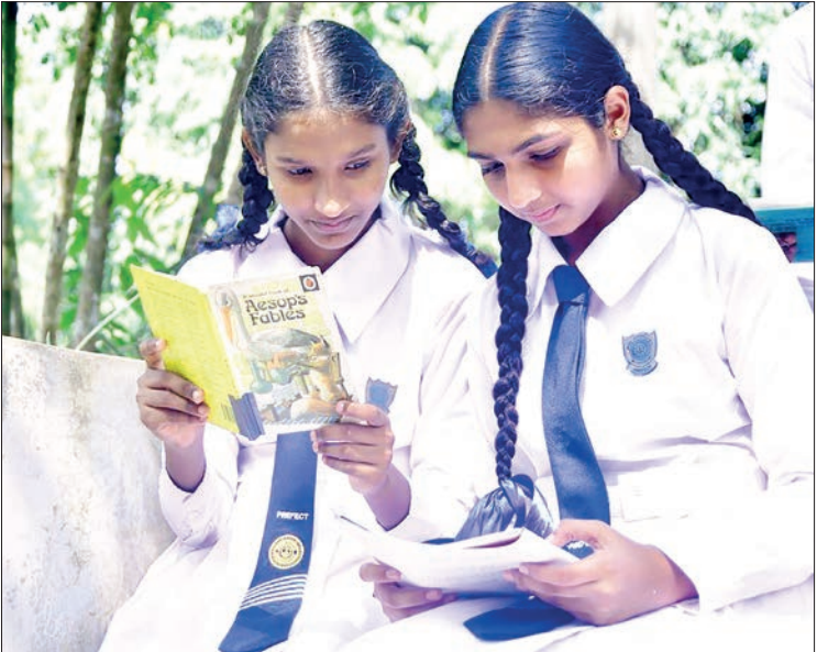
Students are engaged in educational activities at a school in Gampaha, Sri Lanka's Western Province on 12 November 2024.

unity, social stability, and the rule of law are essential foundations for rebuilding the economy and restoring Sri Lanka’s standing in the international community. Sri Lanka gained independence in 1948 after more than a century of colonial rule. The president said the country must now focus on rebuilding the nation through sustainable development and stronger institutions for future generations. — Xinhua