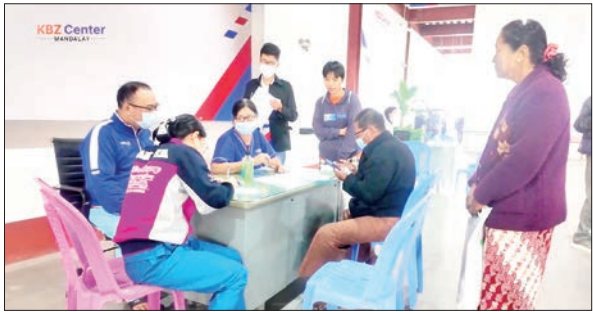
KBZ Centre Mandalay provides health services, including free kidney dialysis.

THE KBZ Centre Mandalay has been providing free haemodialysis (kidney dialysis) services for financially disadvantaged patients since 2 February.