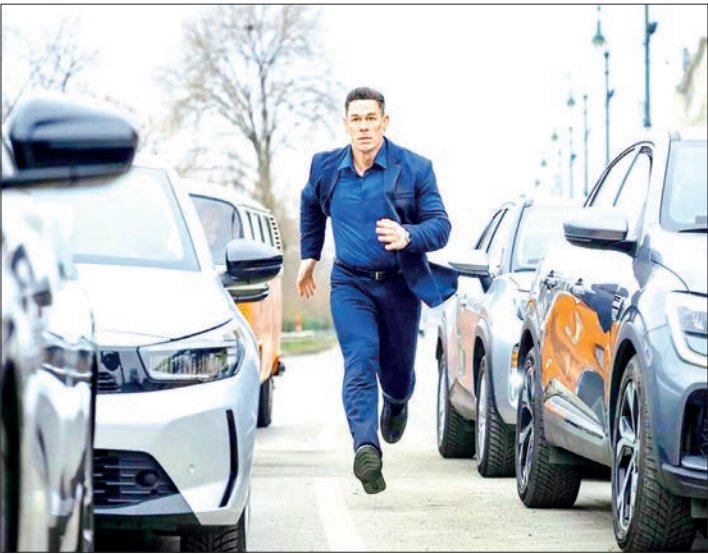
Apple TV+ revealed first-look images Tuesday and announced the global release date for its upcoming action-adventure comedy.

THE first look of John Cena’s upcoming action film ‘Matchbox: The Movie’ is out, and it shows the actor on the run with his old gang back together. Apple TV+ on Tuesday, unveiled the first look images from the action-adventure comedy along with the global release date. The announcement was made during TV+’s press event in Santa Monica, according to The Hollywood Reporter. ‘Matchbox: The Movie’ is based on the famous Mattel toy