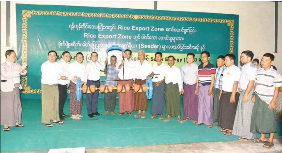
A handover event is underway to provide K450,000 per acre, fertilizer, and seeders to farmers in Yangon Region.

search to move towards sustainable development of the livestock sector” to mark the fourth anniversary of the department on 1 April 2026. The paper reading session will cover the following areas: sustainable livestock production systems, high-value marketable livestock products, animal feed and nutrition, disease prevention and control measures, and socio-economic studies on livestock farming. The research papers must be submitted by 18 February 2026, the department notified. Interested individuals can enquire about details of the paper reading session through the official website of the ministry www.moali.gov.mm and the department’s website https://www.dlar.moali.gov.mm or the deputy director of the department at 09 250205990, email: sawvetdlar@gmail.com or Director Dr Than Than Sint at 09 972915850, and email: sintsint1974@gmail.com . — NN/KK