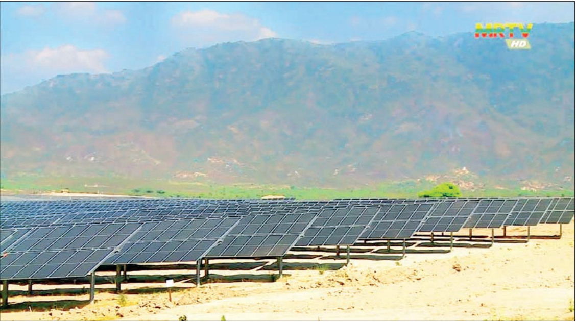
This photo features the Shwe Myoh Solar Power Plant in Zeyathiri Township, Nay Pyi Taw Council Area.

electricity daily starting in June. The electricity will be directly connected to the national grid and transmitted to the Shwe Myoh Substation, which is owned by the Ministry of Electric Power. The Shwe Myoh Solar Power Project uses the latest technologies. The solar tracker system is equipped with AI technology and weather stations and includes automatic control systems that rotate the solar panels toward the sunlight and protect them from damage caused by hail and strong winds.