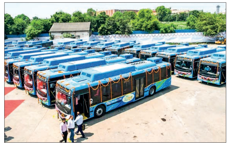
This image showcases some EV buses in India.

sive and no one will consider trying it. But we won't give up. It is less possible but we need to acquire feasibility. The problem is the project is very expensive so it might be difficult to ensure cost-effective. But we have planned to run on a trial so that we can identify its feasibility. It was not easy to run air-conditioned buses last seven or eight years, but we acquired feasibility to implement but lost as expected. However, we will have to try again after making calculations based on the data we acquired. It is impossible to do public transport like a commercial business," he said. — Htet Oo Maung/ZS