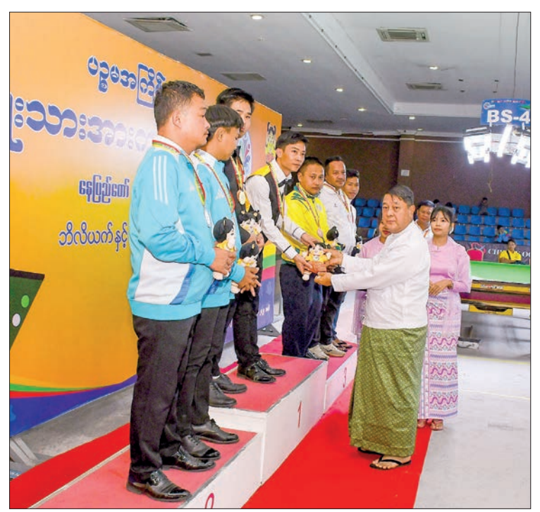
Union Chief Justice U Tha Htay offers awards.

FINAL matches at the Inter-Ministry and Inter-State and Region levels of the Fifth National Sports Festival 2024 were held in conjunction with the prize-presentation ceremonies at relevant sports venues in Nay Pyi Taw yesterday.