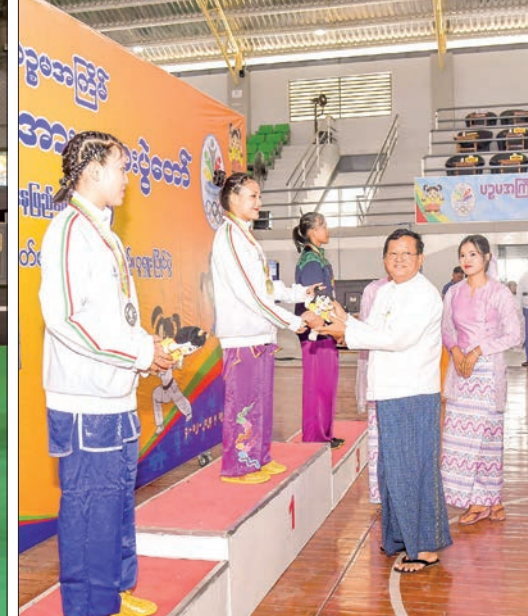
Nay Pyi Taw Council Member U Myint Soe awards prizes.