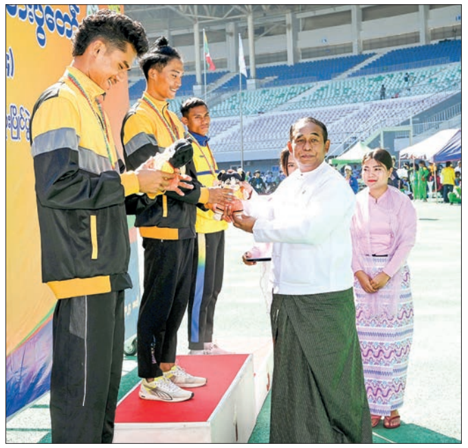
Union Minister U Myint Naung bestows prizes.

Final matches and awarding ceremonies will occur at relevant stadiums and gymnasiums on 17 December. — MNA/