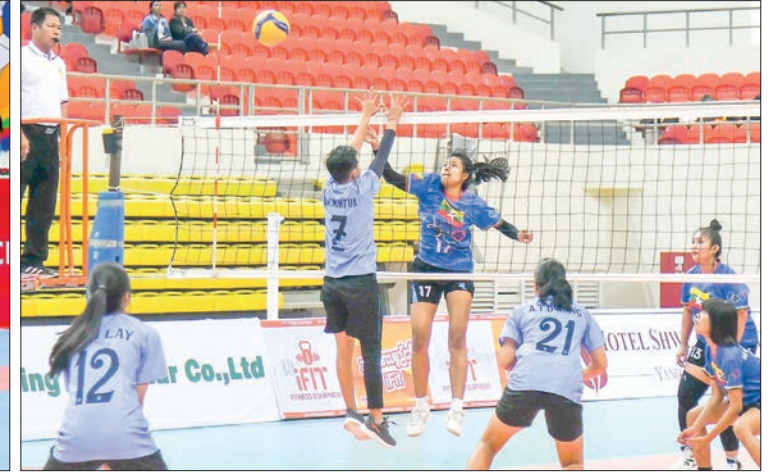
ISR women's volleyball tournament.