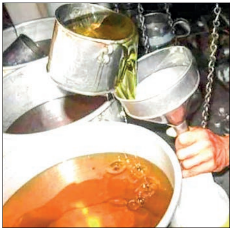
A vendor arranges cooking oil for sale.

The domestic consumption of palm oil is estimated at one million tonnes per year. The local palm oil production is just about 400,000 tonnes. About 700,000 tonnes of palm oil are yearly imported through Malaysia and Indonesia to meet domestic demands. — NN/KK