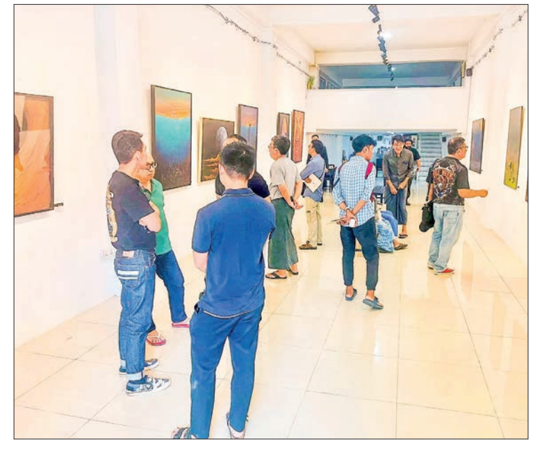
This image shows visitors to the 'Duet Show'.

The exhibition includes a diverse collection of paintings in various sizes, created using watercolours, oilcolours, and acrylics. — ASH/TKO