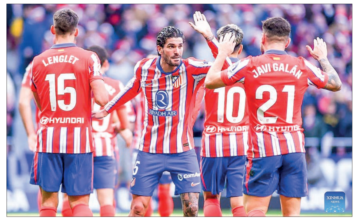
Atletico de Madrid players celebrate scoring during the La Liga football match between Atletico de Madrid and Getafe CF in Madrid, Spain, on 15 December 2024.

second place above Real Madrid after a hard-fought win at home to Getafe, which was decided by Alexander Sorloth's towering