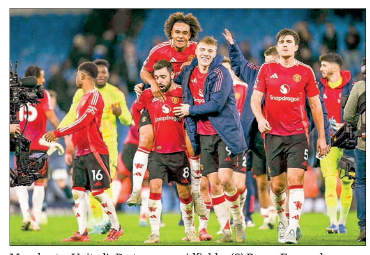
Manchester United's Portuguese midfielder (8) Bruno Fernandes (2L) Manchester United's Dutch striker (11) Joshua Zirkzee (C) and Manchester United's Danish striker (9) Rasmus Hojlund (2R) celebrate following the English Premier League football match between Manchester City and Manchester United at the Etihad Stadium in Manchester, north west England, on 15 December 2024.

MANCHESTER United stunned Manchester City with two late goals to claim the Manchester derby and deepen the crisis in Pep Guardiola's side on Sunday evening.