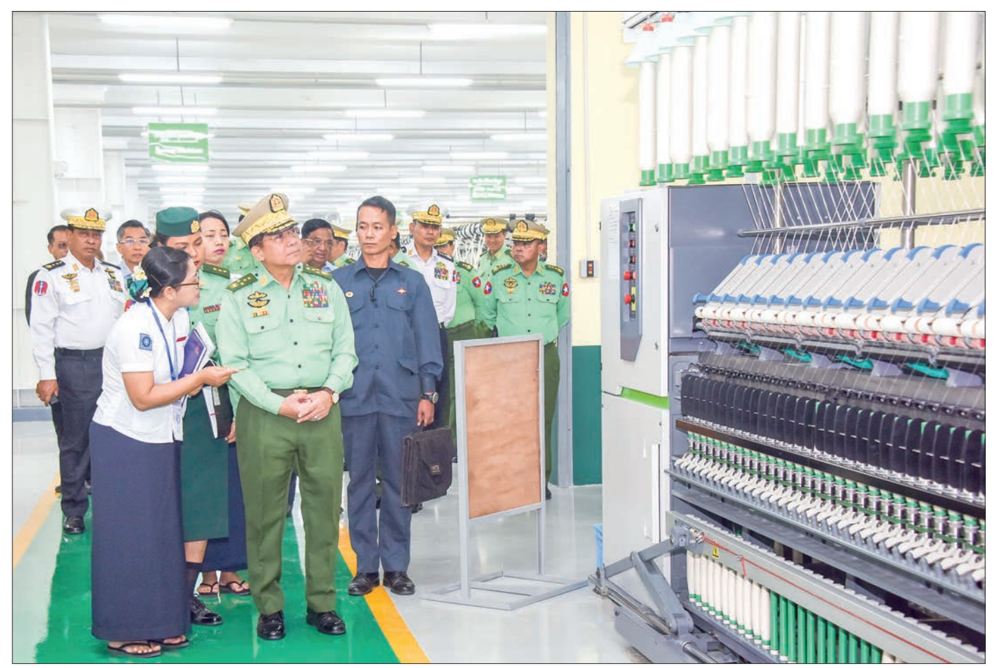
State Administration Council Chairman Defence Services Commander-in-Chief Senior General Min Aung Hlaing tours production line at newly-established 2/80 Thread Factory Branch in Meiktila yesterday.

Tatmadaw Textile Factory (Meiktila) manufactures military apparel for the entire Tatmadaw by using cotton wool while the newly-opened 2/80 thread factory will fulfil the clothing requirement of the nation.