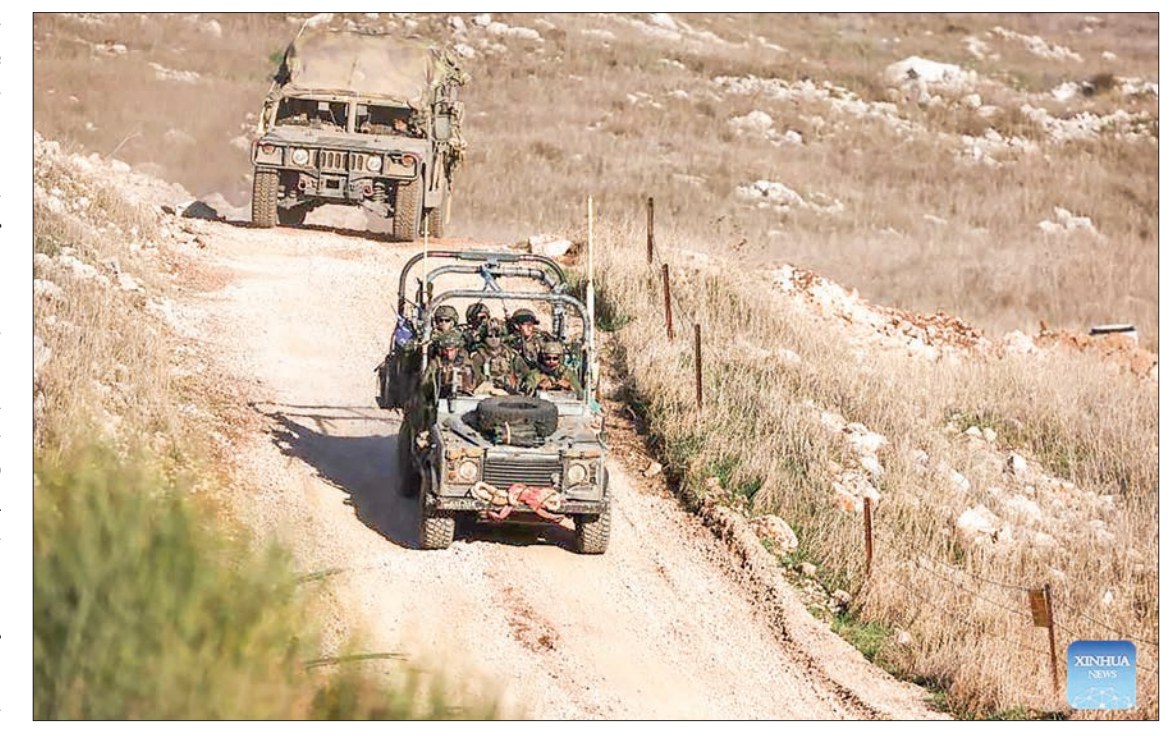
Israeli troops are seen in the buffer zone in the Golan Heights on 15 December 2024. The Israeli government approved a plan on Sunday to expand settlements in the Golan Heights, a Syrian territory currently occupied by Israel, according to a statement by Israeli Prime Minister Benjamin Netanyahu's office.

As Islamist-led rebel forces swept Syrian president Bashar al-Assad from power last week, Israeli Prime Minister Benjamin Netanyahu ordered troops to seize the demilitarized zone on the Golan Heights.