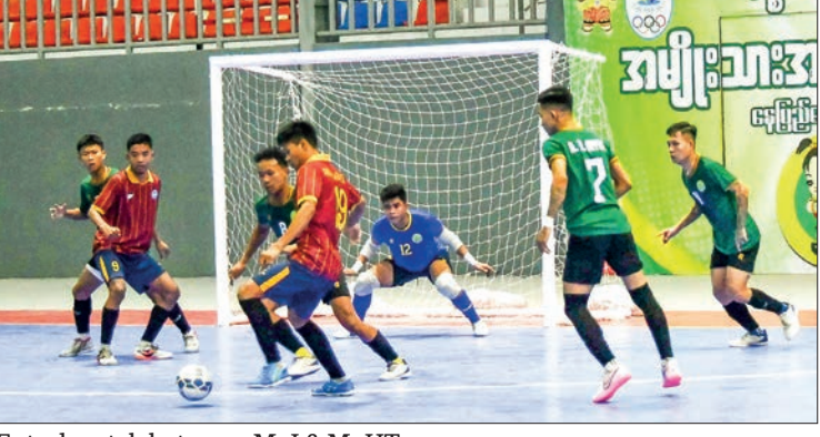
Futsal match between MoI & MoHT.

Theikdi Sports Complex hosted the second leg matches of the Inter-State and Region traditional Chinlone contest, snooker 6 Red singles and double, 9 Ball Pool singles and double, snooker 15 Red singles and billiard double, and snooker 15 Red double of the