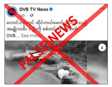
This screenshot validates misinformation.

intentionally spread misinformation to affect the peace and stability of the region and mislead the public about security forces. — MNA/KTZH