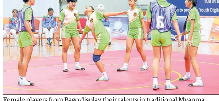
Female players from Bago display their talents in traditional Myanma Chinlone.

The Inter-State and Region U-21 men's football tournament continued to semifinals at the training grounds 3 and 4 of Wunna