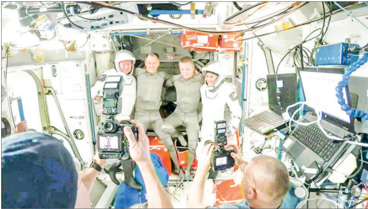
This screengrab made from a NASA video shows astronauts Butch Wilmore (L) and Suni Williams (R) posing for pictures before departing from the International Space Station on 18 March 2025.

A pair of astronauts stranded in space for more than nine months were finally headed home Tuesday after their capsule undocked from the International Space Station.