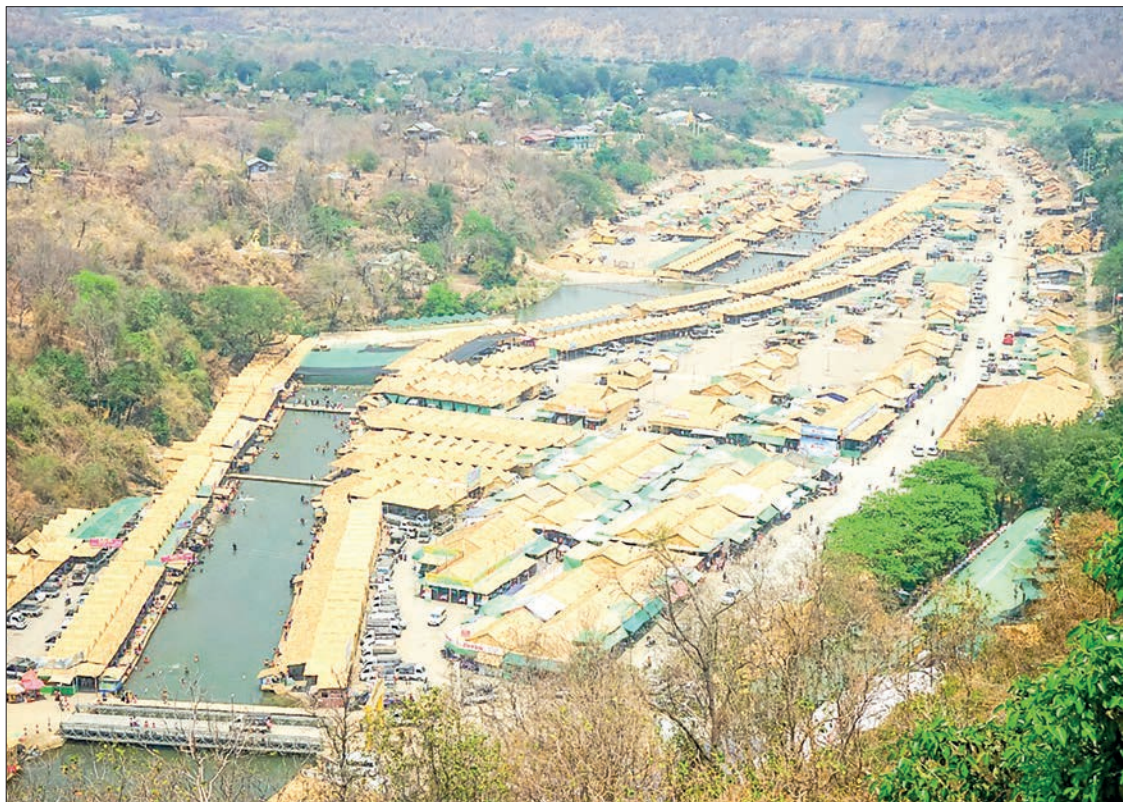
Captivating aerial drone shots of Mann Shweseztaw Pagoda Festival: Vibrant stalls and festive entertainment.