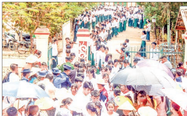
Namhsan, Shan State (South).