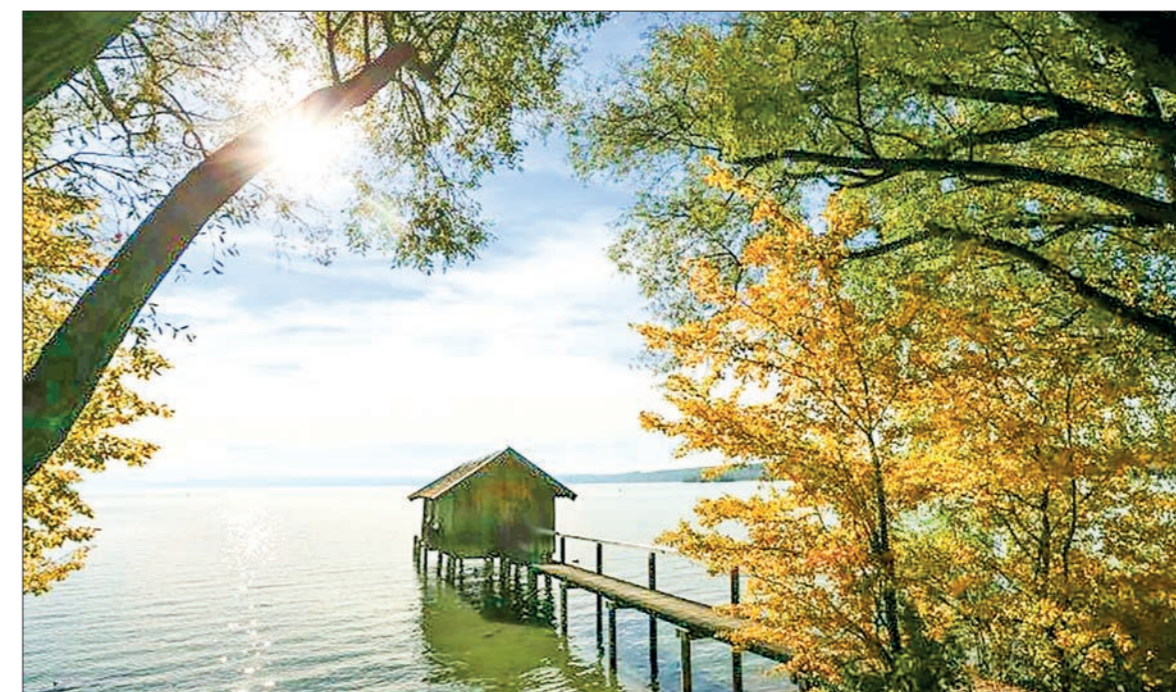
Feel better? Just looking at digital pictures of nature can help relieve pain, according to new research.