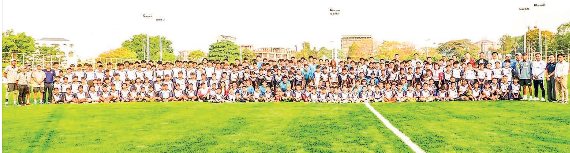
The opening ceremony for free training sessions is seen at the National Football Academy (Yangon) on 17 March.

THE Myanmar Football Federation (MFF) began the MFF Summer Football Skills Course 2025 in Yangon, Mandalay, Taunggyi and Patheingyi. Over 1,400 trainees are taking part in the free basic football and futsal training sessions starting 17 March.