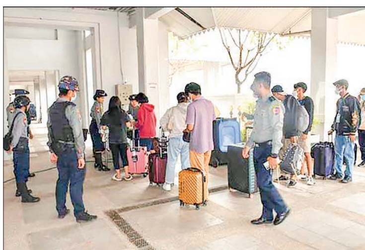
Deportation process underway for telecom fraudsters.

On this occasion, 169 Indonesian nationals, 19 Bangladeshi nationals and one Japanese national – a total of 189 individuals – were deported through the No 2 Myanmar-Thailand Friendship