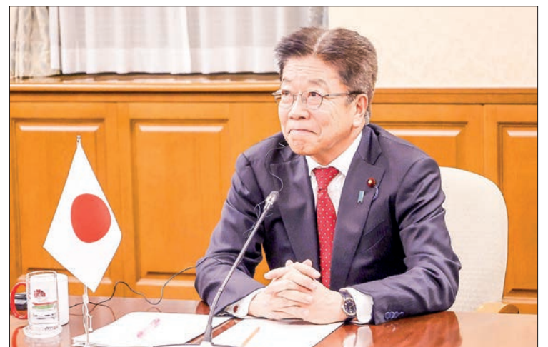
Japanese Finance Minister Katsunobu Kato attends online G7 talks at the Finance Ministry in Tokyo on 17 March 2025.

Since his inauguration on 20 January, Trump's administration has announced a series of tariffs, such as 25 per cent duties on all steel and aluminium imports, which came into force on Wednesday, triggering retaliatory moves by some of its major trading partners. — Kyodo