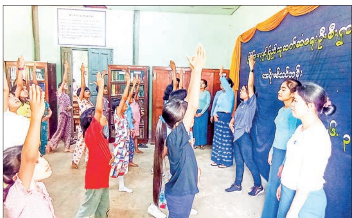
Schoolchildren energized during fitness dance training session.

IN a bid to promote fitness and well-being among young people, a fitness dance training course was launched at the Community Centre Hall of the Information and Public Relations (IPRD) Department in Thaegon Township, Nattalin District, Bago Region, yesterday.