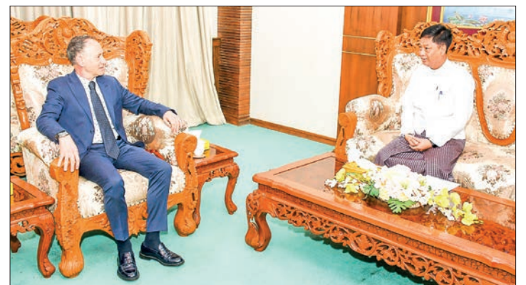
UN Resident and Humanitarian Coordinator ad interim Mr Marcoluigi Corsi calls on Deputy Minister U Lwin Oo.

They exchanged views on matters related to the existing cooperation between the Government of Myanmar and the United Nations agencies. — MNA