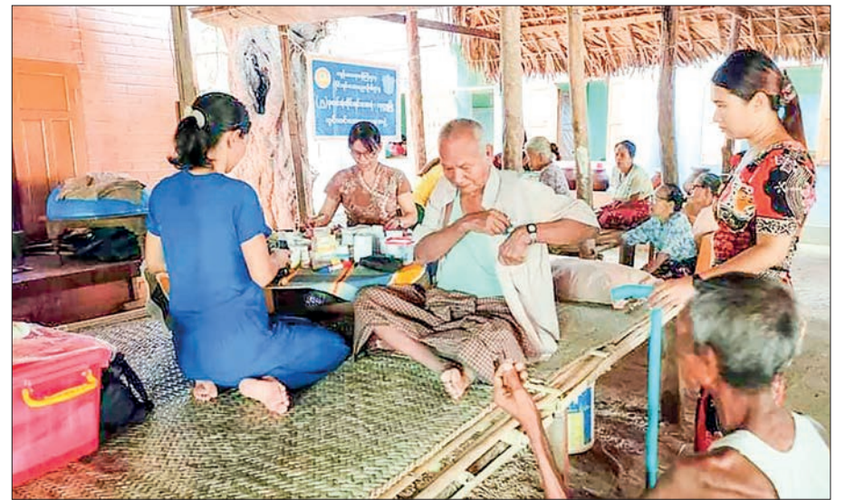
This photo captures elderly people at heat relief camps opened in Chauk and Magway, where record temperatures rose last April.

Chauk Township in Magway Region holds the record for the hottest city in Myanmar, with temperatures reaching 48.2 degrees Celsius in April of last year. — ASH/TH