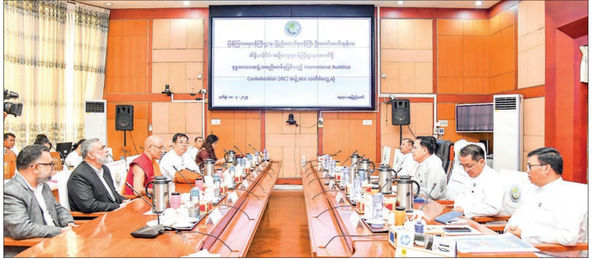
Union Minister U Maung Maung Ohn meets General Secretary Venerable Shartse Khensur Rinpoche Jangchup Choeden of the International Buddhist Confederation yesterday.

The meeting was attended by Deputy Minister U Ye Tint, the Permanent Secretary, departmental officials, and representatives from the International Buddhist Confederation (IBC). — MNA/TH