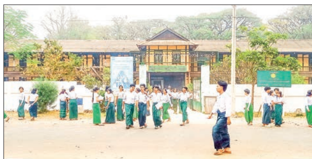
Katha, Sagaing Region.