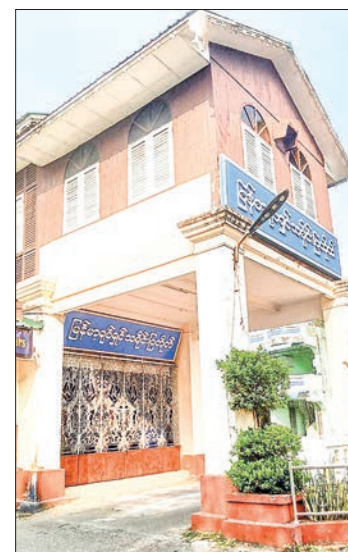
A glimpse of the Myanmar Motion Pictures Museum.

At the academy awards section, photos of award winners, academy award statues that have changed from gen-