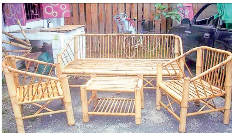
Images showcase bamboo handicrafts being sold well this summer.

According to a bamboo expert, over recent years, bamboo has been widely used as utensils, sculptures, furniture and accessories at resorts, tea-shops and restaurants to create a natural vibe. — MT/ZS