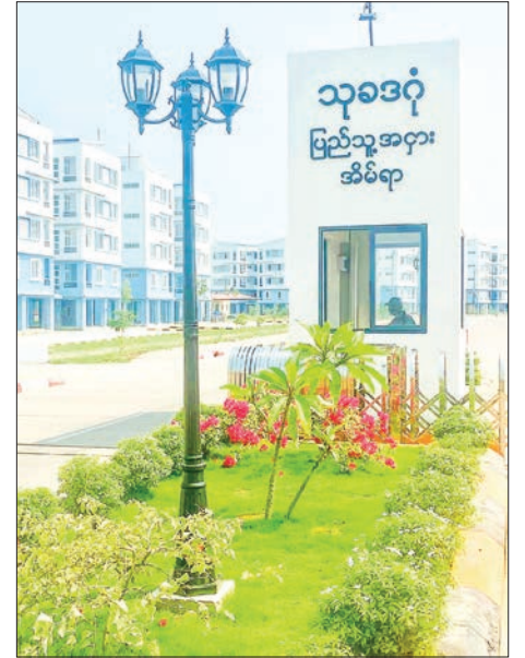
Entrance to the Thukha Dagon public rental housing.

Those who violate the rules will get their rental permit revoked and the head of the household registration is subjected to legal action. The department has recently warned home buyers of fraudulent real estate transactions by providing fake property purchase permit notification letters of the Department. — NN/KK