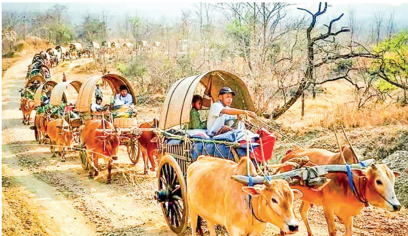
This photo captures visitors riding in an ox-cart caravan at this year’s Mann Shwesettaw Pagoda Festival.