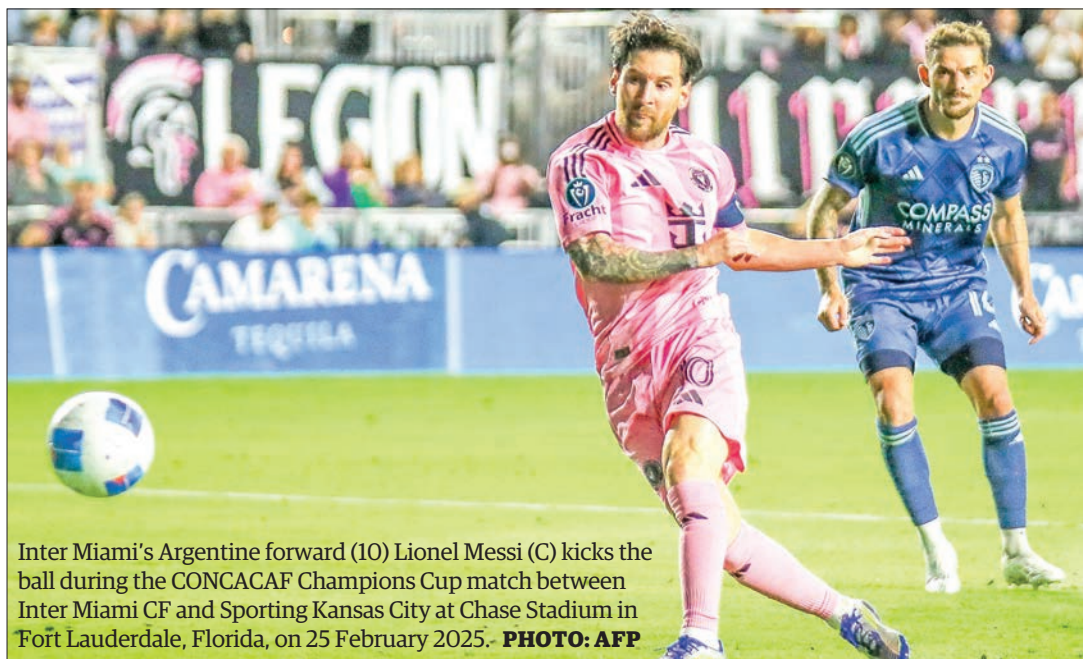
Inter Miami's Argentine forward (10) Lionel Messi (C) kicks the ball during the CONCACAF Champions Cup match between Inter Miami CF and Sporting Kansas City at Chase Stadium in Fort Lauderdale, Florida, on 25 February 2025.

Brazil will be without 33-year-old Neymar, who has suffered a thigh injury and has had to postpone his return to the national team, who are fifth, seven points behind Argentina.