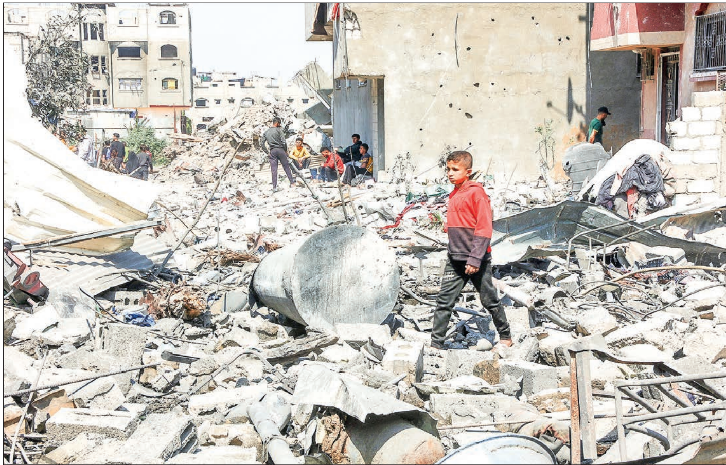
Palestinian youths salvage items from the destroyed house of the Quayqea family in the Shujaiya district in eastern Gaza City on 18 March 2025 following Israeli strikes at dawn. Israel on 18 March unleashed its most intense strikes on the Gaza Strip since a January ceasefire, with Gaza's health ministry saying their toll rose to 413 people killed, and the Palestinian Hamas movement accusing Israel's premier of deciding to "resume war" after a deadlock on extending the truce.

E GYPT and the Arab League (AL) on Tuesday strongly condemned Israel's latest airstrikes on the Gaza Strip, calling them a brutal escalation and a blatant violation of the ceasefire agreement.