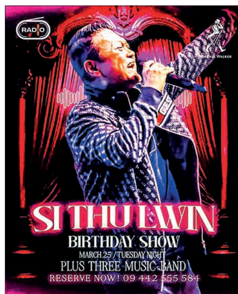
This image depicts an advert for Sithu Lwin's Birthday Show concert.