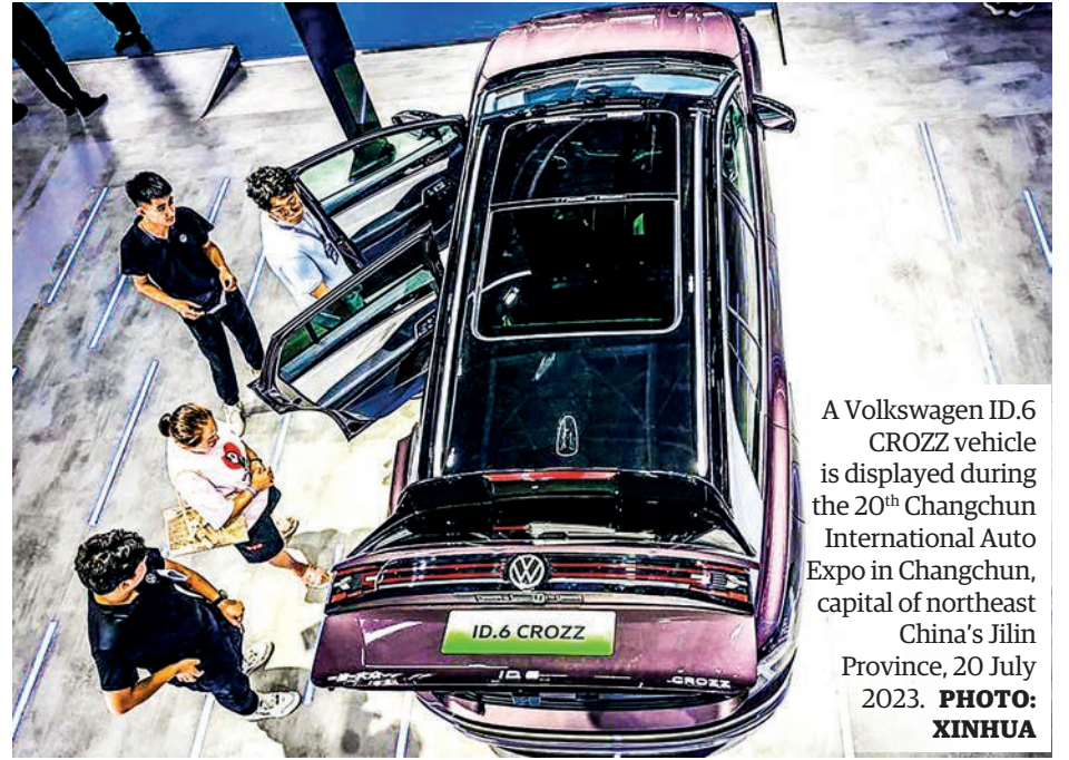
A Volkswagen ID.6 CROZZ vehicle is displayed during the 20th Changchun International Auto Expo in Changchun, capital of northeast China's Jilin Province, 20 July 2023.

launch its first all-electric model by 2026 as part of a strategic pivot to tap into China's fast-growing entry-level BEV market. Volkswagen Group is powering its transformation in China by advancing its capabilities in e-mobility, digitalization and autonomous driving. Future products will have upgraded intelligent features, such as