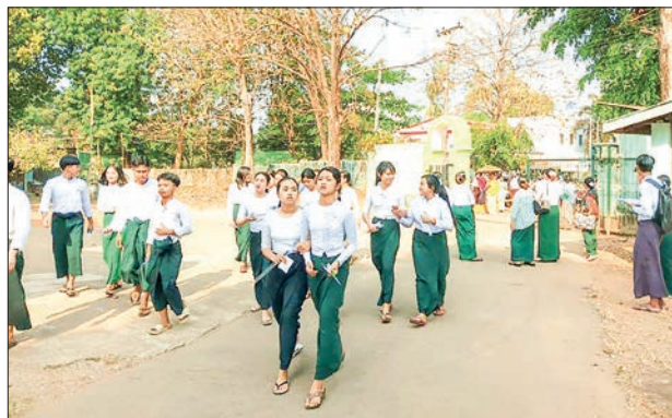
Kyaiкто, Mon State.