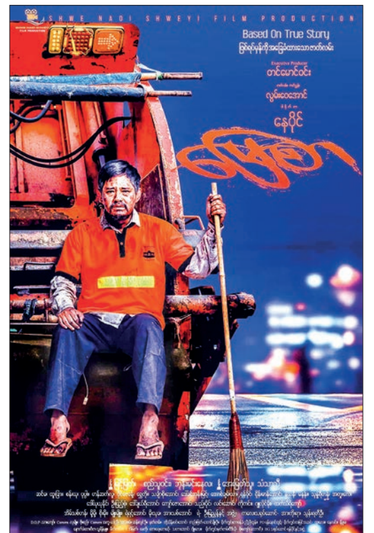
This photo showcases a poster for the 'Myaysa' movie.