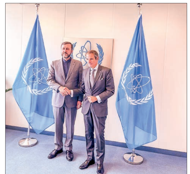
Published on X by Kazem Gharibabadi (left), Deputy Foreign Minister for Legal and International Affairs, he meets Rafael Grossi, director-general of the International Atomic Energy Agency (IAEA) in the Austrian capital Vienna, on 17 March 2025.

Gharibabadi stressed that while safeguarding its national security and interests, "Iran remains committed to cooperating with the IAEA within the framework of its safeguards obligations". — Xinhua