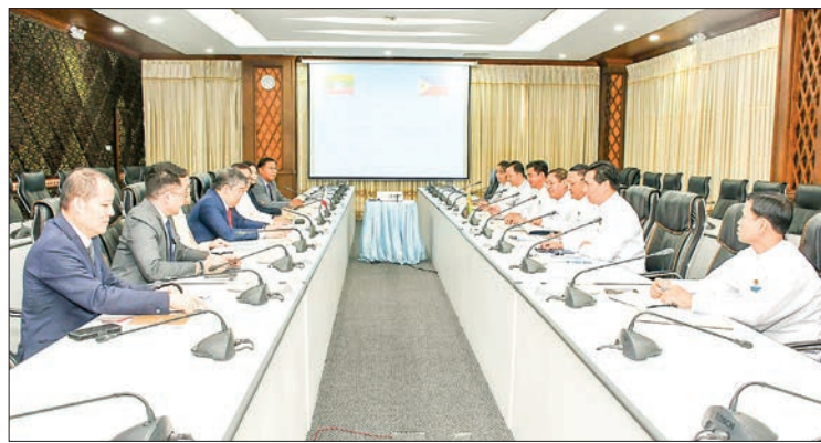
The meeting between MoFA Deputy Minister U Ko Ko Kyaw and the Philippines delegation underway yesterday.