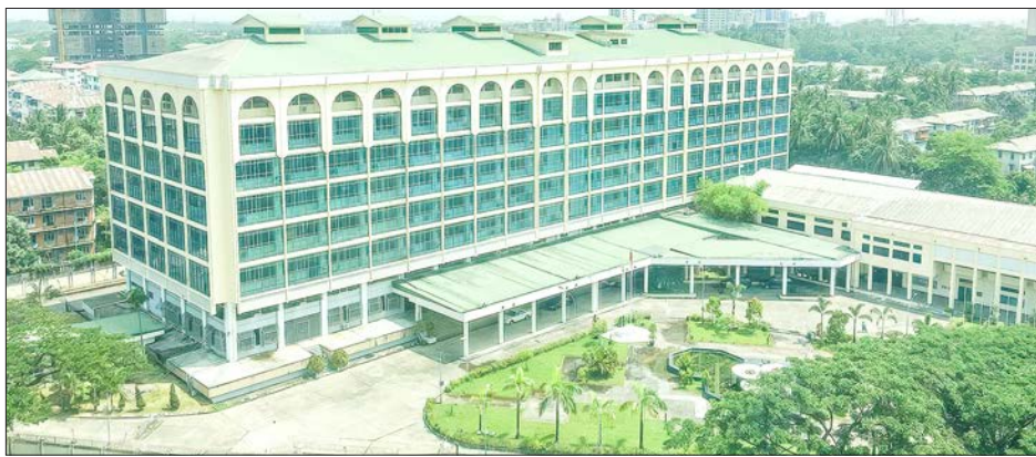
An aerial drone view of the Central Bank of Myanmar (CBM).