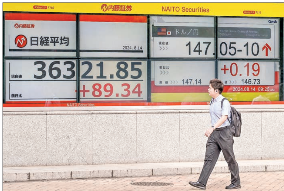
A man walks past a brokerage display showing the early numbers (L) on the Tokyo Stock Exchange as well as the Japanese yen versus US dollar (R), along a street in Tokyo on 14 August 2024.

But the main focus is Powell's remarks on