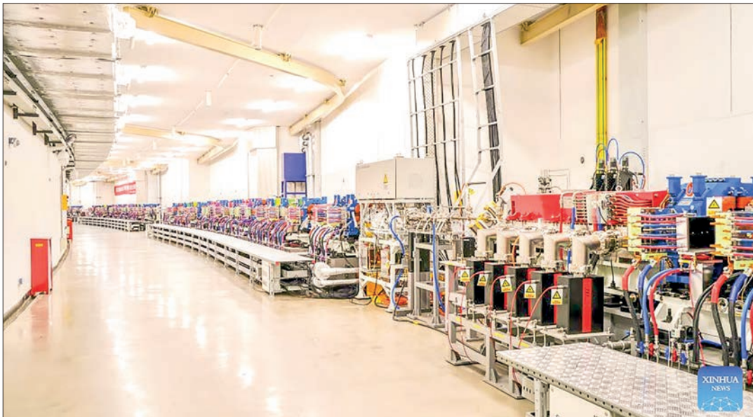
This photo taken on 23 July 2024 shows the tunnel of the High Energy Photon Source (HEPS) storage ring in Beijing, capital of China.

A major progress has been made in the construction of the High Energy Photon Source (HEPS), the first high-energy synchrotron radiation light source in China, with the electron beams with currents reaching 12 mA stored in the HEPS storage ring.