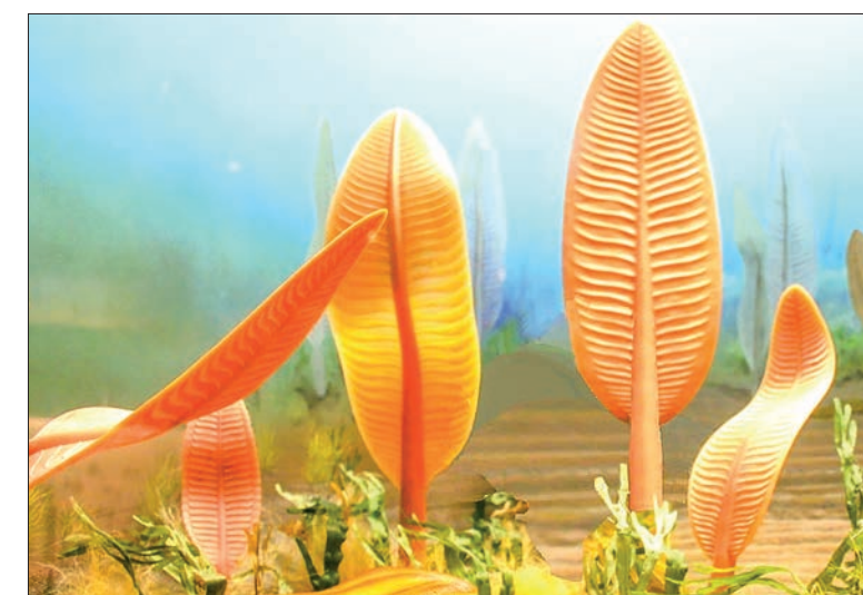
Life in the Ediacaran Period as imagined by researchers. ILLUSTRATION: IMAGE FOR VISUAL PURPOSE/ WIKIMEDIA COMMONS