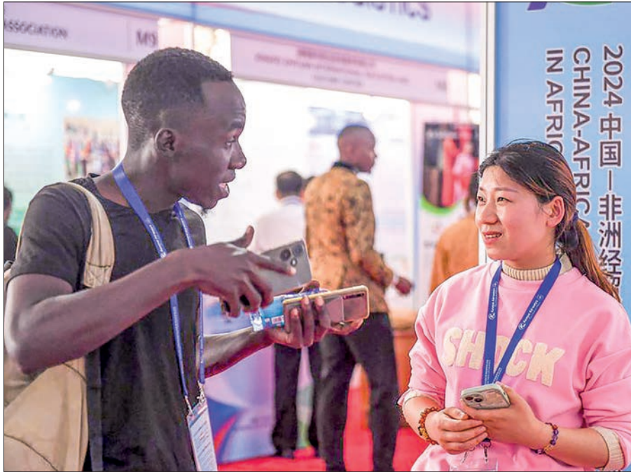
An exhibitor (R) briefs products to a visitor during the China-Africa Economic and Trade Expo (CAETE) in Africa (Kenya) 2024 in Nairobi, Kenya, 9 May 2024.

Tang made the remarks at a press conference detailing the progress and achievements that have been made under the nine cooperation programmes China announced during the FOCAC's 8 th Ministerial Conference held three years ago in Senegal. These nine programmes span categories such as medical and health, poverty reduction and agricultural development, trade and investment promotion, digital innovation, green development and capacity building,