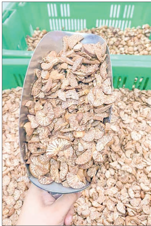
This photo shows betel nut slices and halves being sold in the market.

SALES of betel nuts in slices and halves are good in the Magway retail market of the Magway Region, according to market sources.