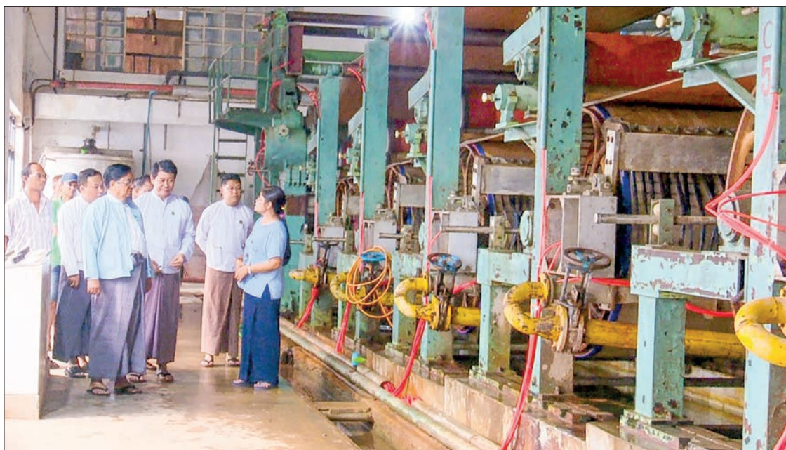
Union Minister for Industry Dr Charlie Than inspects machinery at Paper Mill (Yeni).

In his meeting with staff and employees, the Union minister instructed officials and employees to use raw materials after systematically purifying them, adding