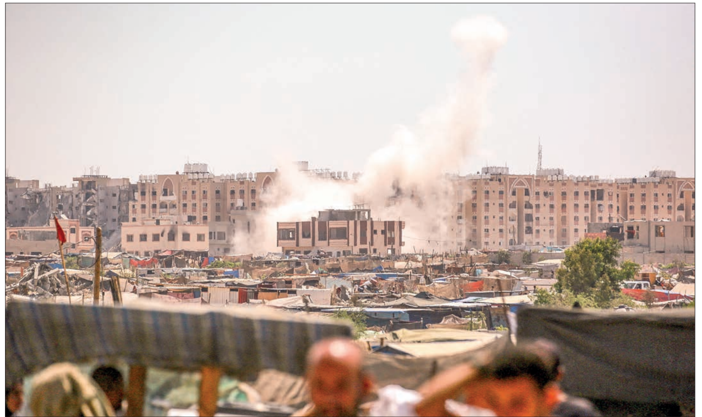
Displaced Palestinians watch from a makeshift camp as shells fired from Israeli tanks hit an area near the Hamad residential complex in Khan Yunis in the southern Gaza Strip on 18 August 2024 amid the ongoing conflict between Israel and the Hamas militant group.