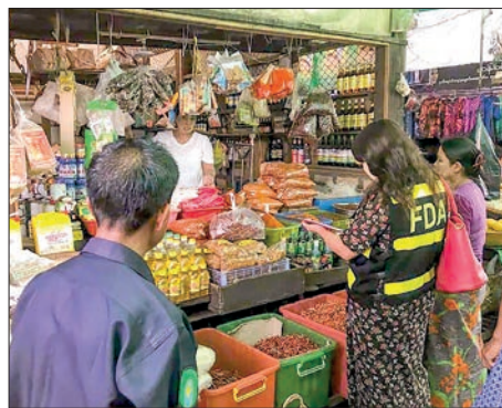
Surprise inspections were seen at municipal markets in Mandalay Region to check food dyes in 2019.

This move is to check unsafe dyes in food commodities (bamboo shoots, fish paste, dried fish, chilli powder) across over 40 markets in the city. If the foods are identified as containing harmful dyes, they will be seized and