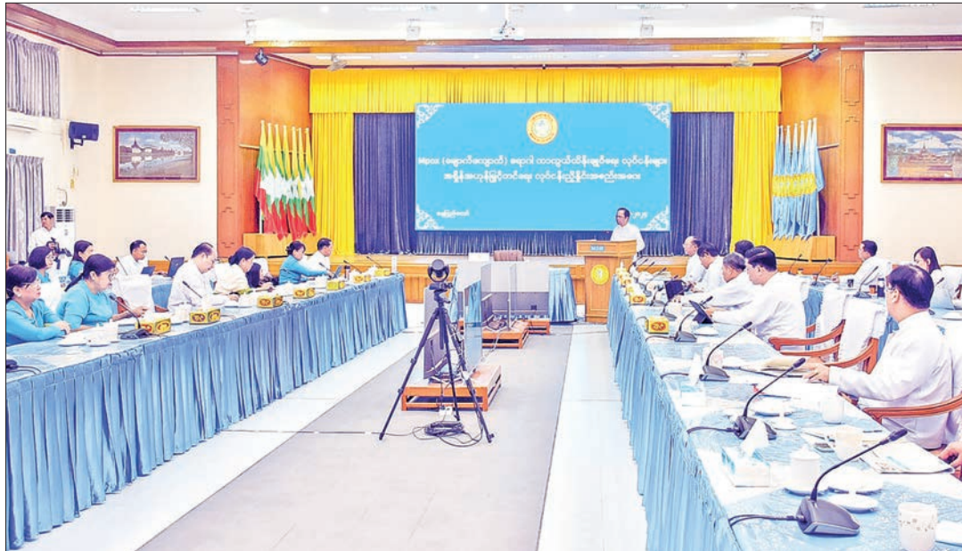
The mpox disease prevention and control work coordination meeting is in progress on 19 August 2024 at the Ministry of Health's meeting hall.