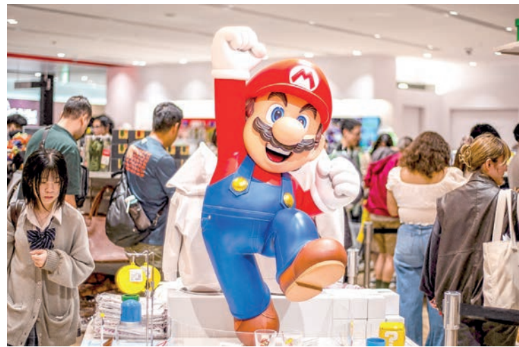
People visit a Nintendo store in Shibuya district of Tokyo on 2 May 2024.

JAPAN'S Nintendo said Tuesday it will open its much-awaited first museum on 2 October featuring vintage video games and an interactive shoot-em-up with "Super Mario" characters.