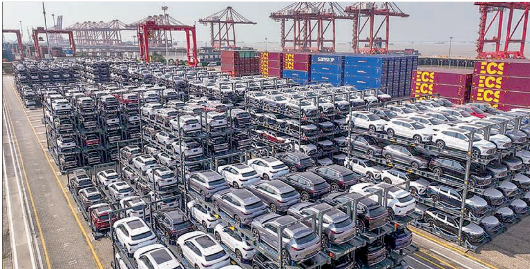
This aerial panoramic drone photo taken on 11 July 2023 shows new energy vehicles for export at a terminal of Taicang Port, east China's Jiangsu Province.

THE total foreign trade value of the Yangtze River Delta region reached 9.1 trillion yuan (about US$1.28 trillion) in the first seven months of 2024, hitting a record high, Shanghai Customs said Tuesday.