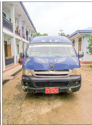
Confiscated illegal goods and vehicle.