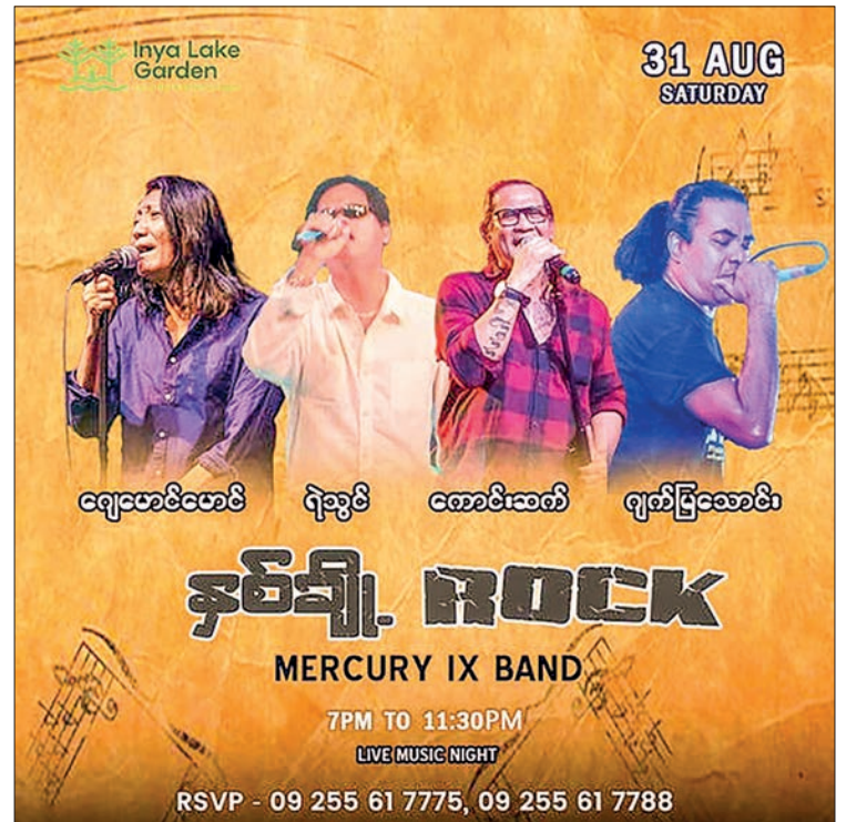
This image shows a glimpse of the poster for the 'Hnitchoh Rock' music show.

ACCORDING to singer J Maung Maung, a rock music show titled 'Hnitchoh Rock' (veteran rockstars), featuring four renowned Myanmar rock singers, will be held at Inya Lake Garden in Mayangon Township on 31 August.