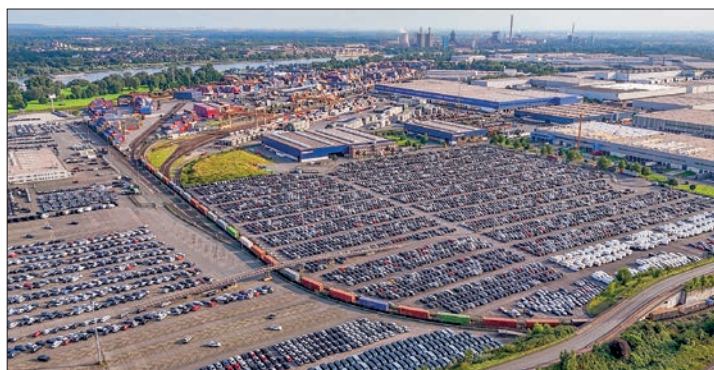
An aerial view shows new cars of various brands parked for export on the parking of a car terminal at the harbour of Duisburg, western Germany, on 7 August 2024.

2023, according to the Federal Statistical Office (Destatis). — Xinhua