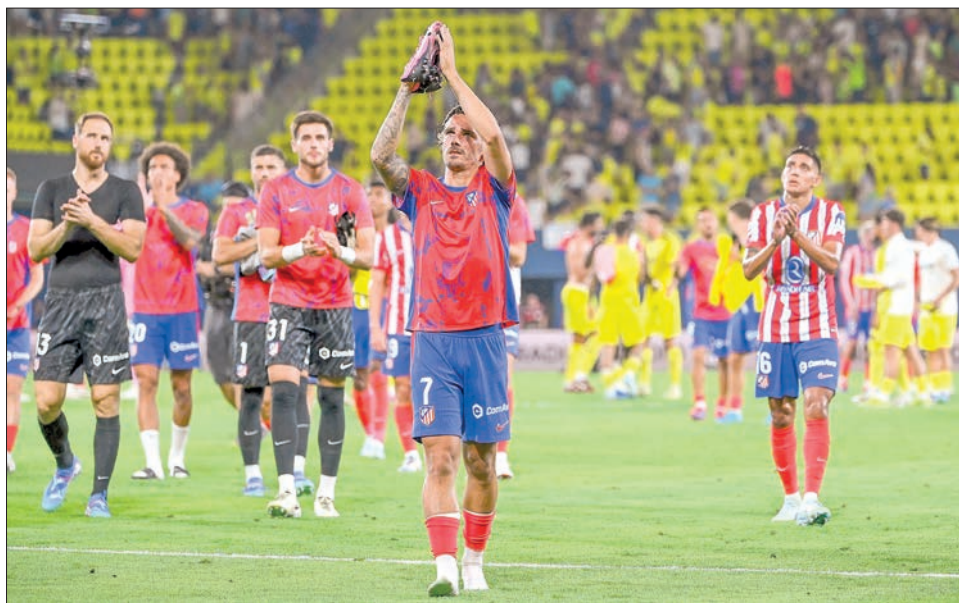
Atletico Madrid's French forward (7) Antoine Griezmann and teammates acknowledge supporters at the end of the Spanish league football match between Villarreal CF and Club Atletico de Madrid at La Ceramica stadium in Vila-real on 19 August 2024.

Villarreal took the lead through Arnaut Danjuma in the 18 th minute with the forward starting his team's La Liga opener after spells on loan at Tottenham