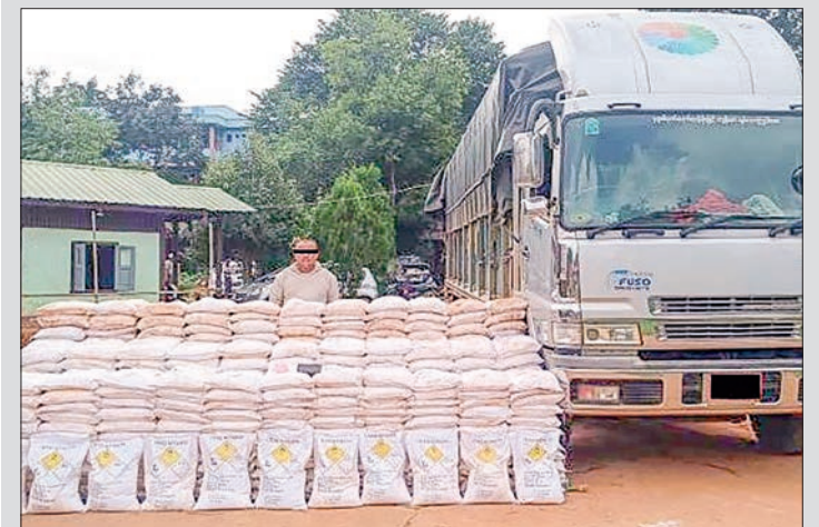
An arrestee is seen alongside seized drugs and a vehicle.