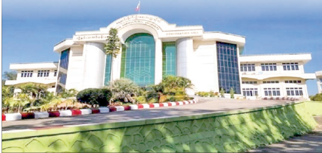
Yezin Agricultural University in Nay Pyi Taw Council Area.

in Mandalay, offering a three-year diploma course. In 1938, the college became a constituent college of Rangoon University,