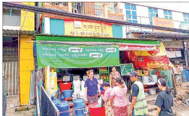
Rice is sold at affordable prices to the public by rice traders and rice millers association under the management of Nay Pyi Taw Council Area.