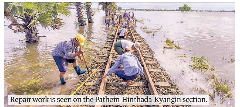
Repair work is seen on the Pathein-Hinthada-Kyangin section.

Moreover, the up and down trains to and from Pathein-Hinthada-Kyangin will resume on 21 August.