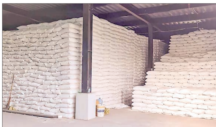
Fertilizer sacks are neatly organized in the warehouse.

Additionally, 1,957 registrations were voluntarily cancelled according to individuals’ consent. The department revoked