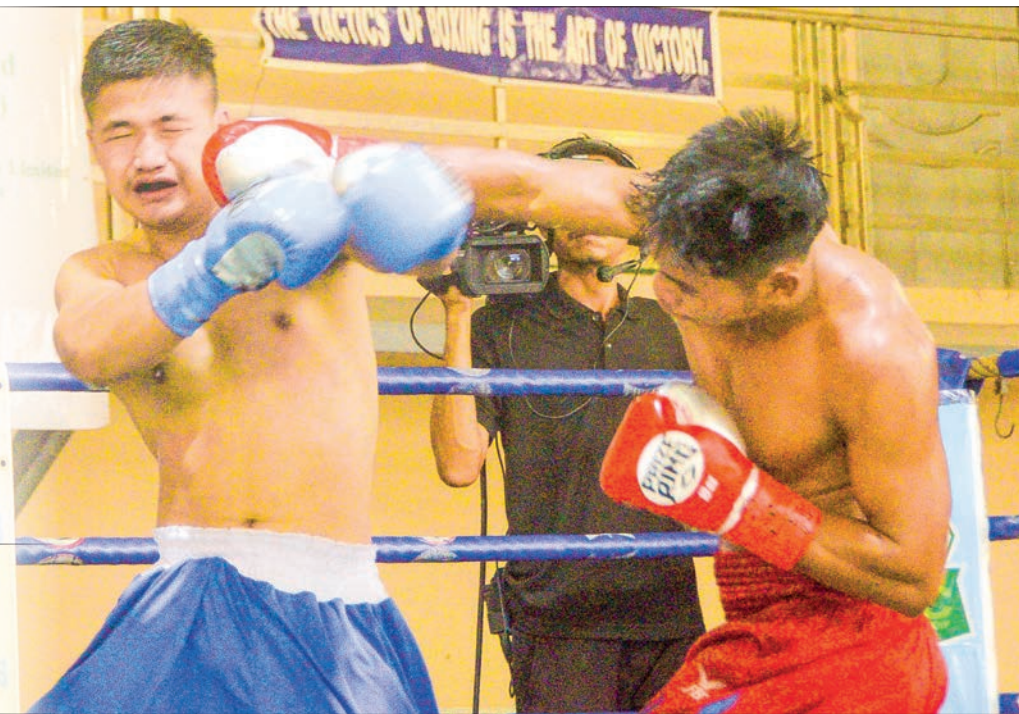
One of the qualifiers in action in Yangon yesterday.

The qualification tournament will be held in September.