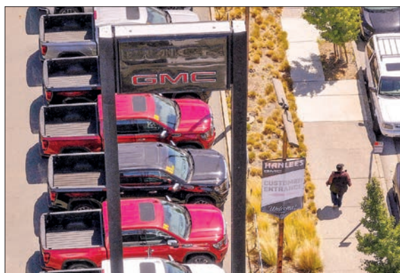
In an aerial view, brand new GMC trucks are displayed on the sales lot at Hanlees Hilltop GMC on 2 July 2024 in Richmond, California.