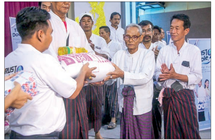
The donation ceremony is in progress on 19 August.

"Trust Double 9 donated 12 Pyi of rice, 50 ticals of cooking oil, and K50,000 in cash to each of 210 individuals. The original plan was to donate to 100 people, but we wanted to include those with poor health as well. Academy Win Lwin Htet and I