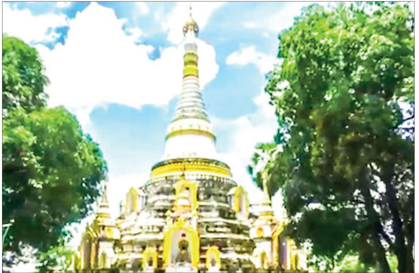
Photos showcase the PhaungdawU Pagoda (above) and waterfall (below) in Kayin State.