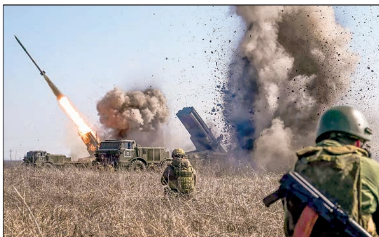
Russian servicemen of the artillery brigade division of the Centre group of forces fire a BM-27 9K57 Uragan (Hurricane) multiple launch rocket system towards positions of the Ukrainian Armed Forces in the Avdiivka sector of the front line amid Russia's military operation in Ukraine, Russia. PHOTO: SPUTNIK

Gaza ceasefire talks were held in Doha last week involving Qatar, Egypt, the United States and Israel. Hamas leadership refused to participate in the talks due to a lack of specifics on the terms of the truce. A joint statement by the United States, Qatar and Egypt, released by the office of Egyptian President Abdel Fattah Sisi, said the mediators had presented Israel and Hamas with a ceasefire proposal that narrowed the differences between the parties. — SPUTNIK