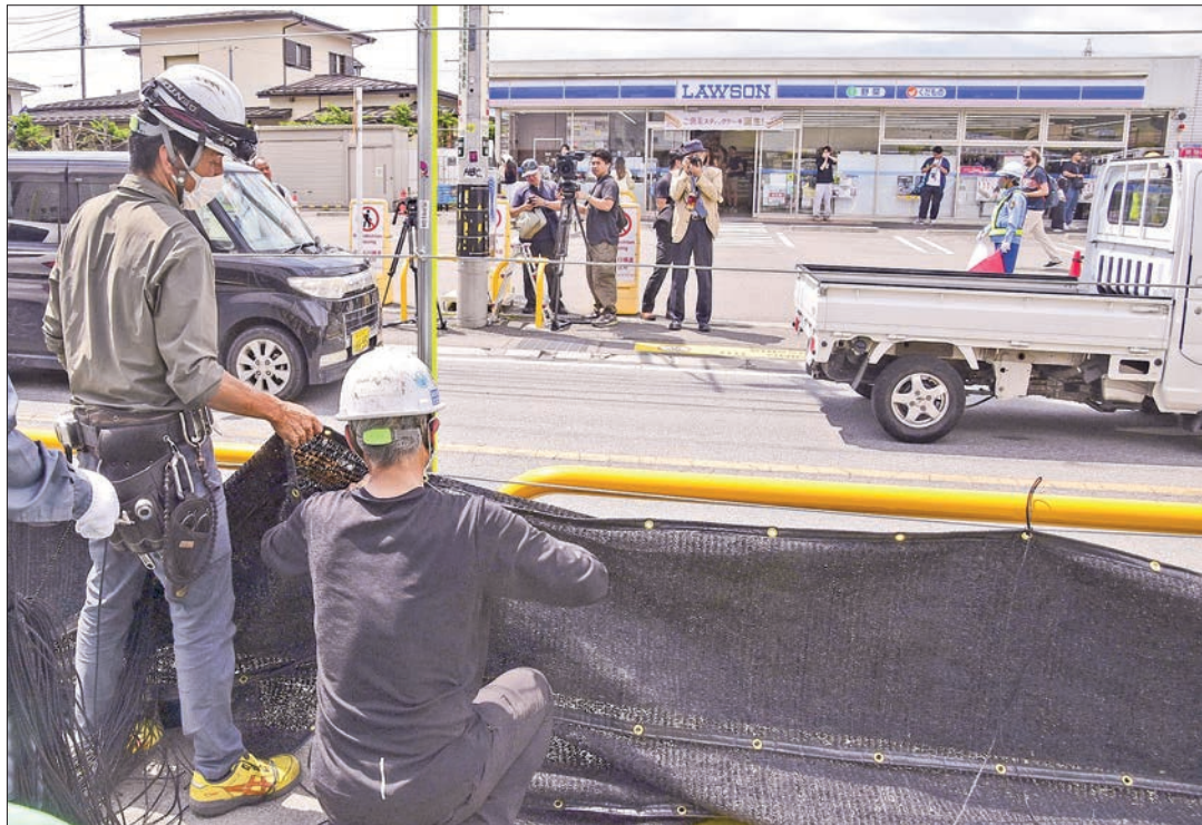
Workers begin setting up a large black screen to block the view of Mt Fuji at a popular photo spot in the Yamanashi Prefecture town of Fujikawaguchiko on 21 May 2024.

A barrier erected in Japan to block a popular view of Mount Fuji has been taken down — for now — after succeeding in discouraging unruly tourists, a town official said Tuesday.