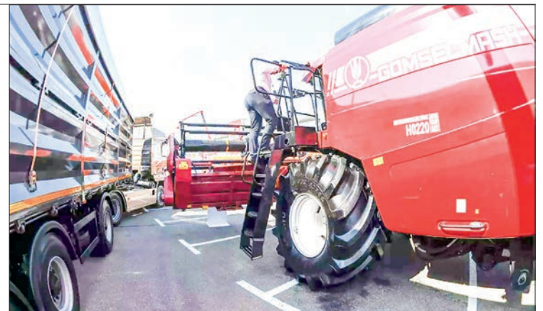
Agricultural equipment manufactured by Gomselmash, Belarus on display at the 14 th Russia - Islamic World: KazanForum International Economic Forum.

tion in 2025 must be kept within the parameters of the five-year programme — no more than 5 per cent. "Achieving the planned indicators of the target scenario will ensure a growth in real household incomes by 104 per cent, with real wages increasing by 4.7 per cent," the prime minister said. — SPUTNIK