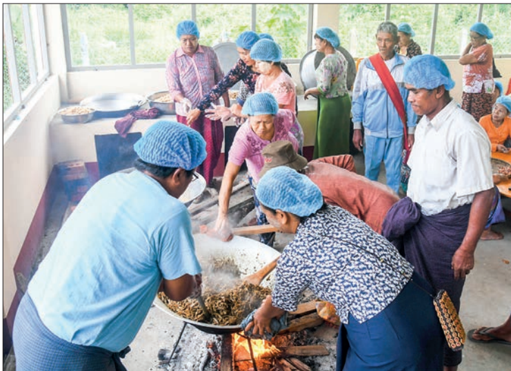
Cooking processes are underway to donate food to Tatmadaw members.

These food items will be delivered to frontline Tatmadaw personnel and security forces using military planes, helicopters, and vehicles. — MNA/TKO