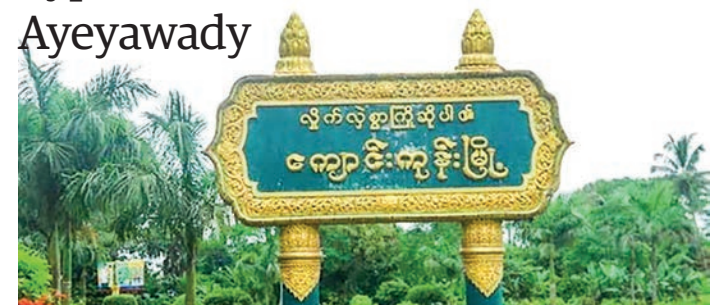
The Kyaunggon Township in Ayeyawady Region