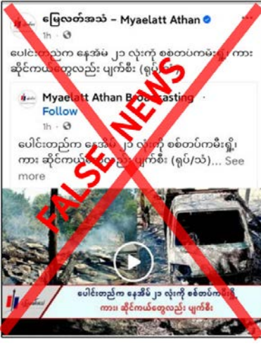
Screenshots reveal false claims of disruptive media outlets.