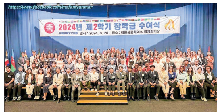
This photo shows attendees at the Woojung Education and Culture Foundation Scholarship Award.

The ambassador urged the students, along with their parents and family members, to remain committed, emphasizing that the scholarships reflect the dedication and hard work of the students. He also expressed appreciation to the Woojung Foundation for increasing the number of scholarships from 83 to 99 in this second semester, following his request made during the first-semester Scholarship Award Ceremony in February of this year. — ASH/TMT