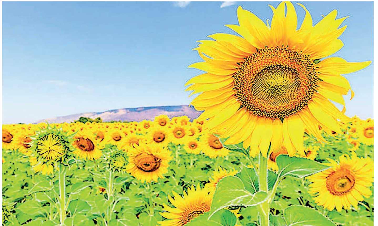
A sunflower plantation in the central Myanmar area – an essential oil crop to reduce palm oil imports.

Yangon house moving services market expands with increased users