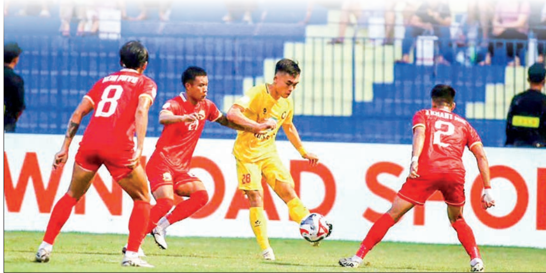
A player from Vietnam's Thanh Hoa dribbles the ball against players from Shan United on 21 August 2024.

The Shan United is scheduled to match with Indonesian club PSM Makassar on 25 September.