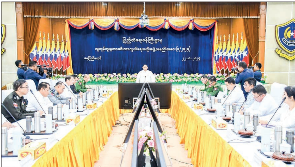
The 1/2024 meeting of the Central Body for Suppression of Trafficking in Persons in progress yesterday in Nay Pyi Taw, chaired by SAC Member Union Minister Lt-Gen Yar Pyae.

After the outbreak of COVID-19, online communication,