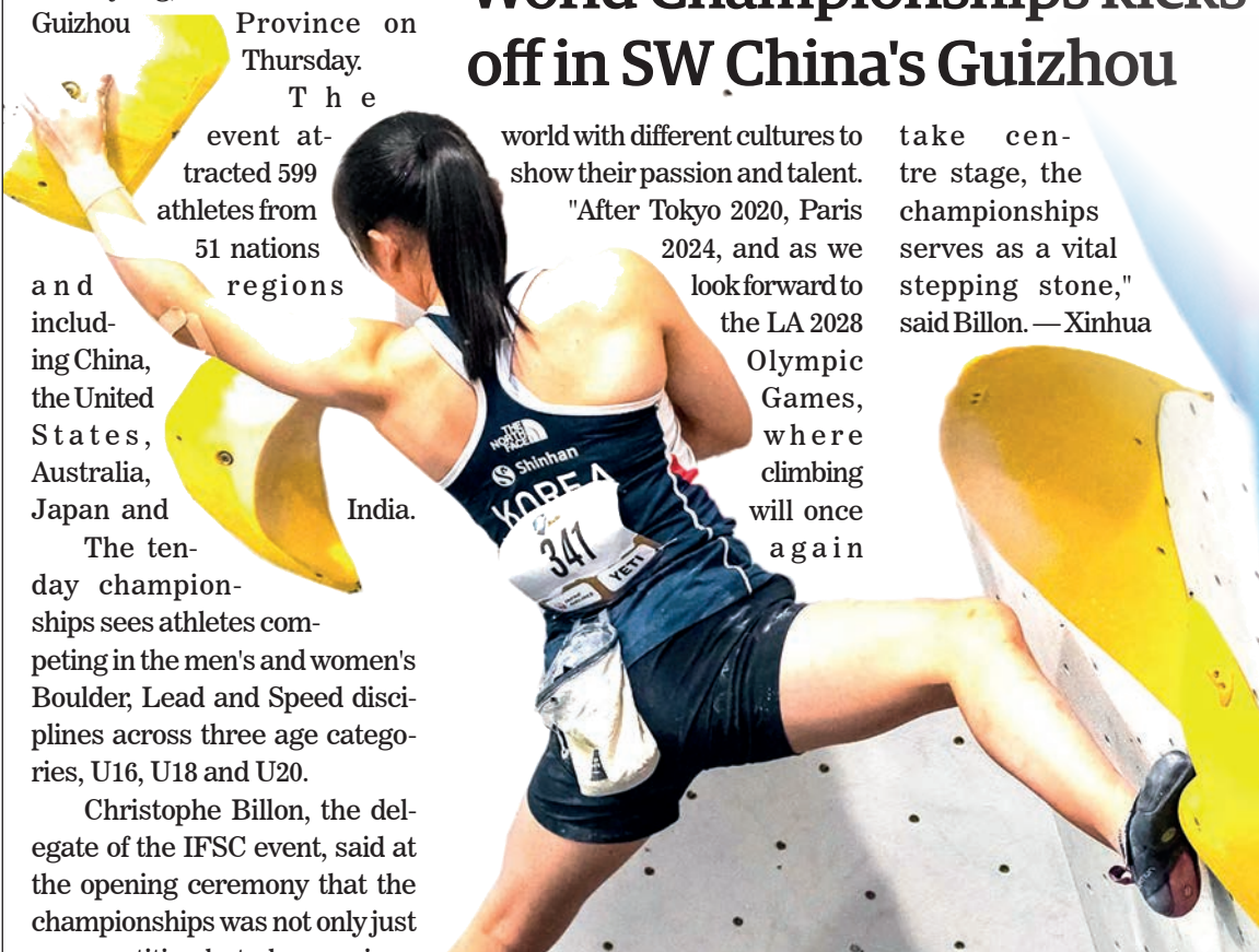
Over ten days, climbers will showcase their skills in Boulder, Lead, and Speed disciplines across U16, U18, and U20 categories.

take centre stage, the championships serves as a vital stepping stone," said Billon. — Xinhua