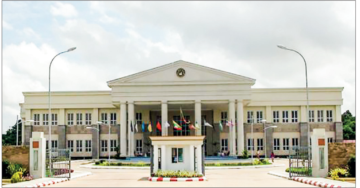
This photo shows the facade of the Myanmar Economic Bank (MEB) in Nay Pyi Taw.

branch 4, Thanlyin branch, Kyimyindine branch, Kamayut branch, Thingangyun branch, Loilem branch, Lashio branch, Monywa branch, Hmawby branch, Sagaing branch, Shwebo branch, Htantabin (Insein) branch, Myaung branch, Hpan branch, Budalin branch, KhinU branch, Shwepyitha branch, Hlinethaya branch, MEB branch 3 (Mandalay), Tamway branch, Myawady branch, Debayin branch, Mingaladon branch, NyaungU branch, Meiktila branch, North Okkalapa branch, Kawkareik branch, Namtu branch, Kawhmu branch, Insein branch, Magway branch, Yanbye branch, Kungyangon branch, PyinOoLwin branch, Bago branch, Thayet branch, Kutkai branch, Kyauktan branch, Myingyan branch, Toungoo branch, Minbu branch, Moemeik branch, Amarapura branch, Kyaukse branch, Thayawady branch, Pakokku branch, Mabein branch, Patheingyi branch, Yamethin branch, Pyay branch, MEB branch 1 (Mawlamyine), Hsihseng branch,