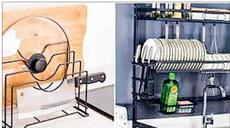
This photo showcases some household items available in the market.

THE sale of household utensils has flourished now in Yangon, according to shop owners.