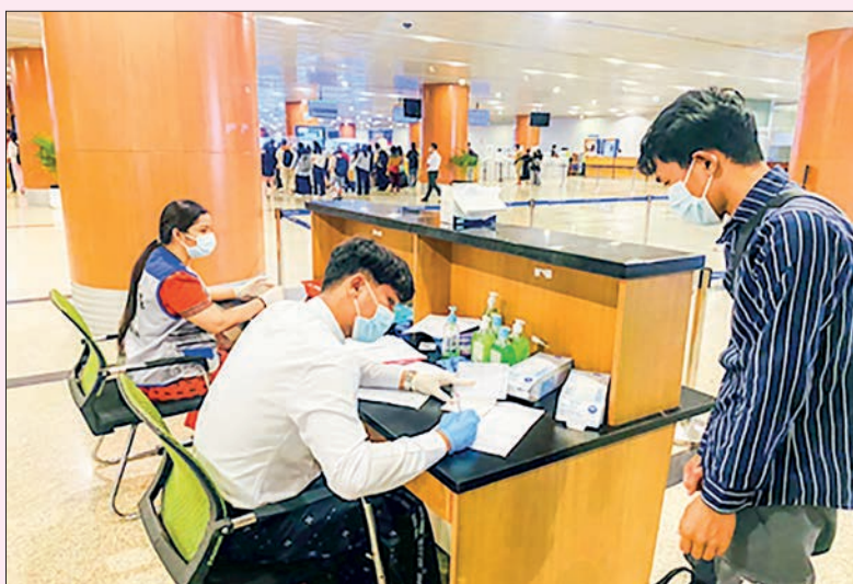
Mpox surveillance checks underway at Yangon International Airport.

Although there are significantly fewer chances that Myanmar will have Mpox, according to WHO, the ministry has conducted public health awareness programmes, preventive measures, surveillance, and control programmes in advance.