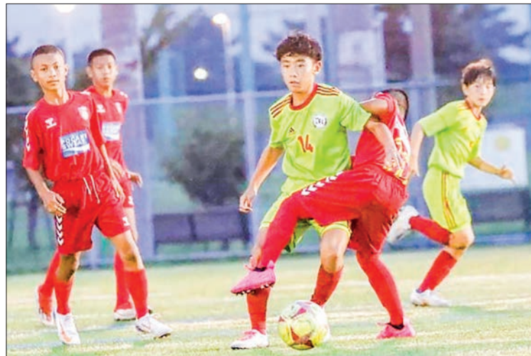
This photo shows the match between Myanmar U-12 and Japan's Dragon Kashiwa teams.