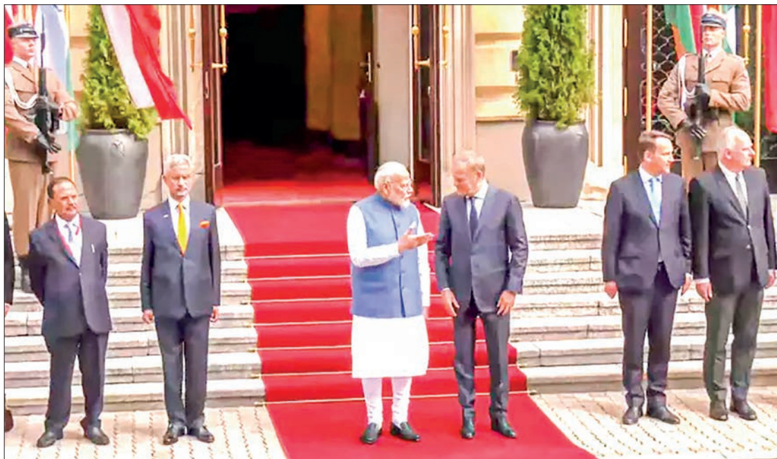
Prime Minister Narendra Modi with his Polish counterpart Donald Tusk during his ceremonial welcome at the Chancellery.

“A new landmark in the India-Poland partnership. PM Narendra Modi was warmly received by PM Donald Tusk of Poland at the Federal Chancellery