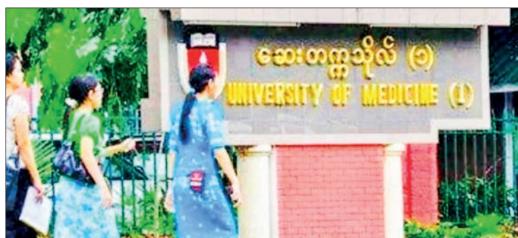
Students walk through the entrance to the University of Medicine 1 in Yangon.

Requirements for medical university acceptance are mentioned in the university admission handbook. Students are advised to read thoroughly before applying to universities. Medical universities will accept application forms from 26 August to 12 September, including weekends and public holidays, according to the Ministry of Health. — NN/KK