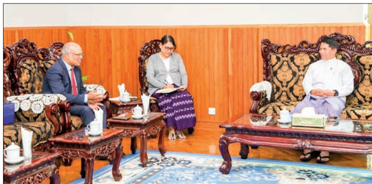
Union Minister U Min Naung receives the Bangladeshi ambassador yesterday.

They cordially discussed the matters relating to agricultural produce and aquatic products sectors of the two countries and cooperation in food security and surplus in the region. — MNA/TS