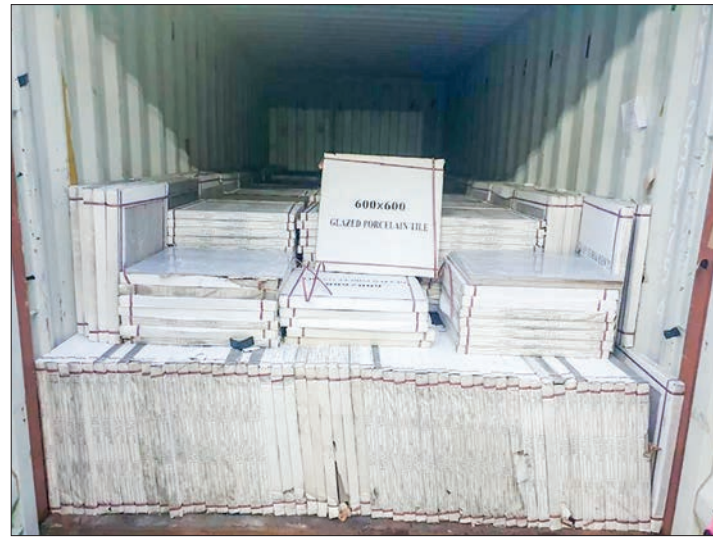
Confiscated illegal items in different states and regions.

UNDER the supervision of the Illegal Trade Eradication Steering Committee, efforts to combat illegal trade continue effectively in accordance with the law.