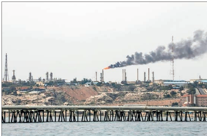
Iran will welcome Japanese companies interested in working in the oil and energy sector. A picture taken on 12 March 2017, shows an oil facility in the Khark Island, on the shore of the Gulf.

Araghchi believes that Iran and Japan, with their distinct yet complementary capabilities, hold immense potential for forging a mutually beneficial and stabilizing partnership across Asia. — Kyodo