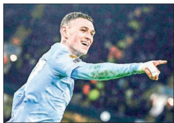
Phil Foden of Manchester City has been named the Professional Footballers' Association Player of the Year.

MANCHESTER City forward Phil Foden won the Professional Footballers' Association Player of the Year award on Tuesday.