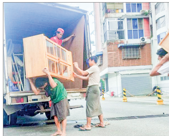
Yangon home moving services are seen operating in the city.

When using this service, in addition to saving time and