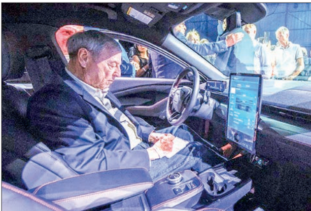
The interior of Ford's first mass-market electric car.

Among the changes, Ford is dropping a plan to produce a three-row electric utility vehicle that had previously been expected to be constructed in Oakville, Ontario. — AFP