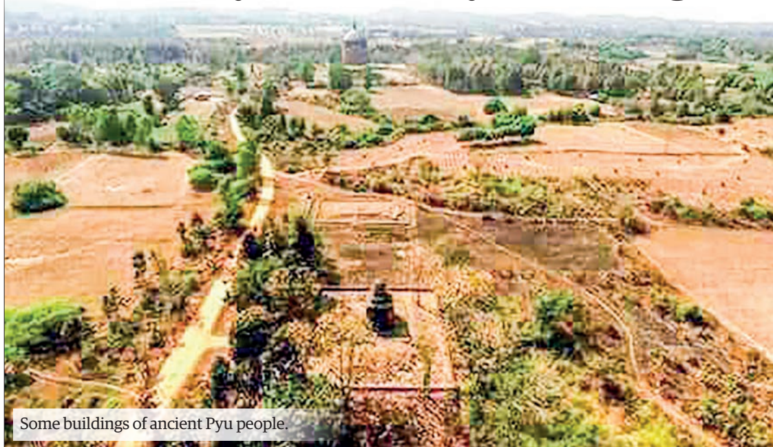
Some buildings of ancient Pyu people.

and religious buildings were constructed on a little high ground with a hard subsoil. At the same time, the villages were often located at some distance away from these religious build-