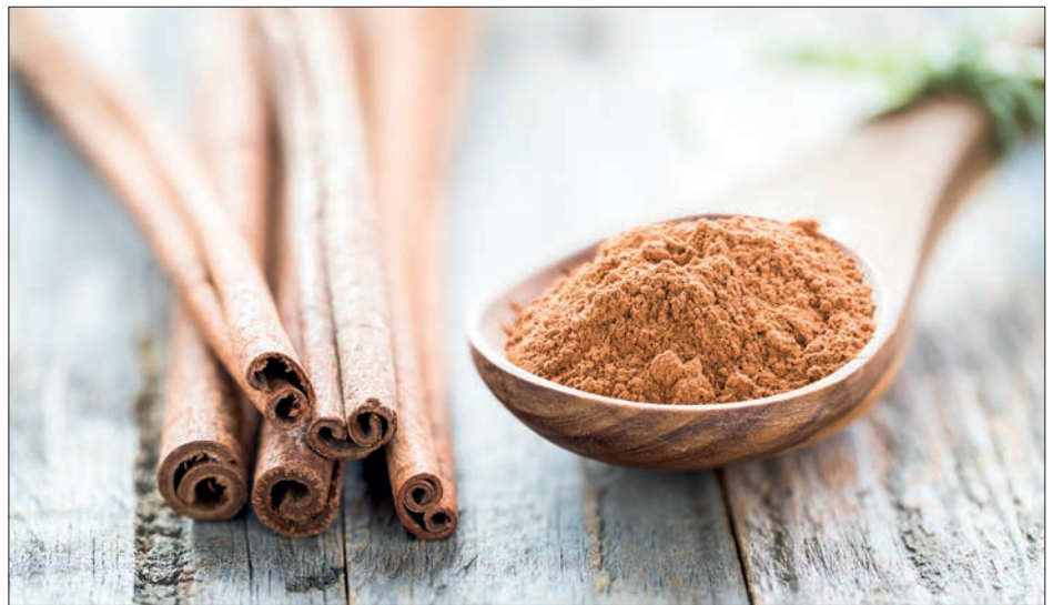
Cinnamon is a spice derived from the inner bark of trees from the genus Cinnamomum, commonly used in cooking and baking for its warm, sweet flavor.

The country's cinnamon is grown across 180,000 hectares, with reserves estimated at 900,000 to 1,200,000 tonnes and an annual harvest of 70,000 to 80,000 tonnes.