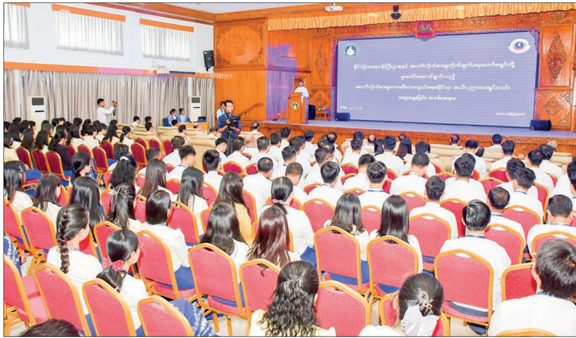
The awareness seminar on anti-corruption jointly organized by the Anti-Corruption Commission and the Ministry of Foreign Affairs in progress yesterday.