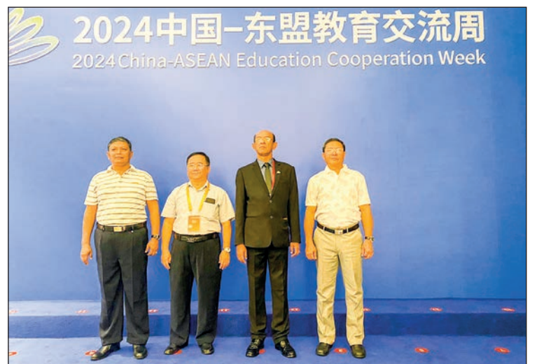
Deputy Minister for Education Dr Moe Zaw Tun (2R) poses for the documentary picture at the 2024 China ASEAN Education Week on 20-25 August in China.

The event, which runs from 20 to 25 August, focuses on educational cooperation between China and ASEAN countries, the development of Myanmar's education sector, and the potential signing of an MoU between China and ASEAN nations.