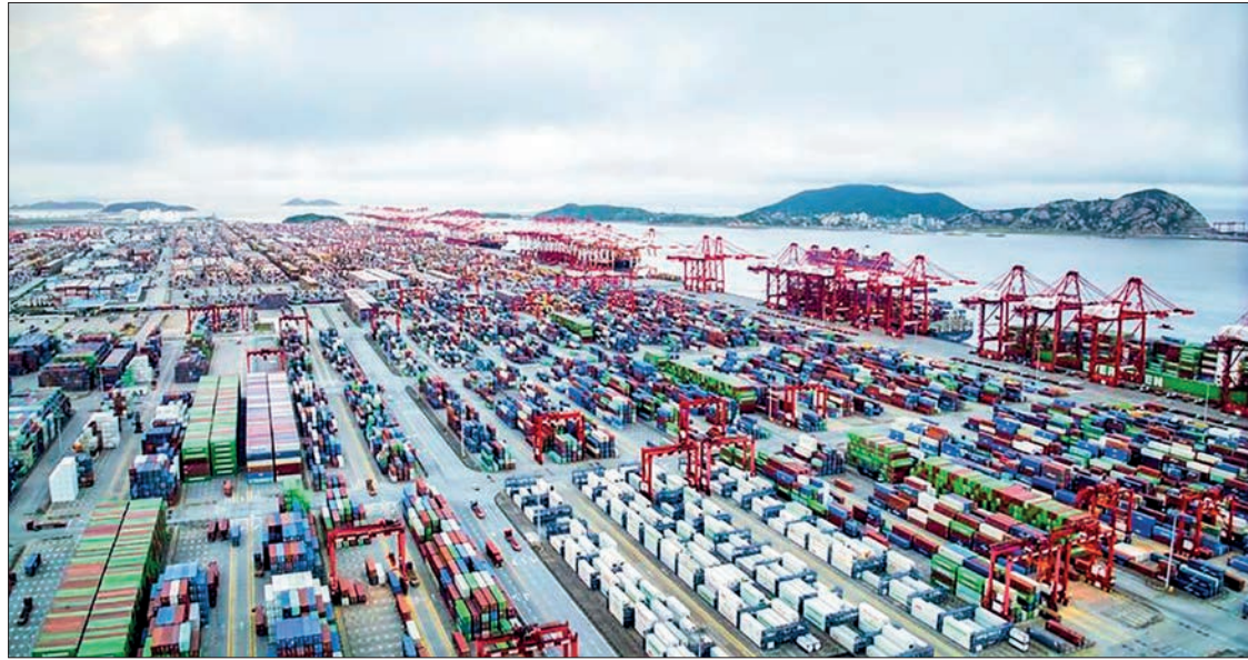
This photo taken on 17 September 2023 shows a view of the automated container terminal of Shanghai Yangshan Deep Water Port in east China's Shanghai.

In 2023, Shanghai Port handled 49.16 million TEUs, maintaining its position as the world's top port for container throughput for the 14 th consecutive year.