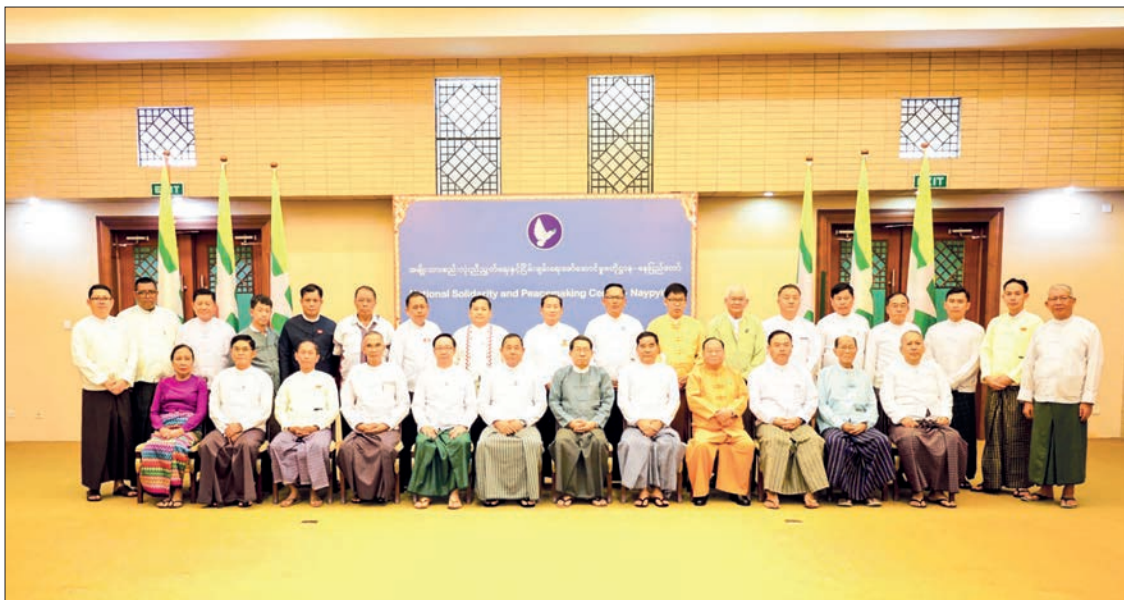
A commemorative group picture taken on the final day of talks between the NSPNC and the political parties' working group.

THE second day of the meeting between the National Solidarity and Peacemaking Negotiation Committee (NSPNC) and the political parties' working group continued at the National Solidarity and Peacemaking Centre in Nay Pyi Taw yesterday.