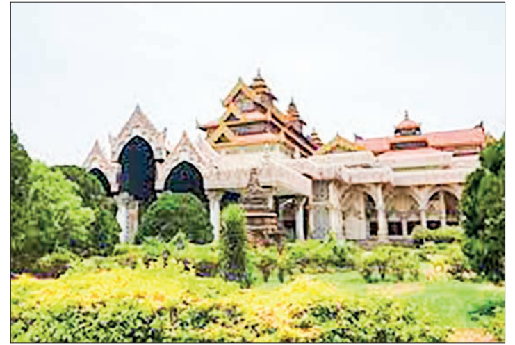
A general view of the Bagan Archeological Museum.

80 visitors on a regular basis, more than 100 on weekends and public holidays. "There were only 43 admissions on 1 August but exceeds 100 on weekends and public holidays. The rest days receive 50-60 visitors on average and just 20 on some days," she said.