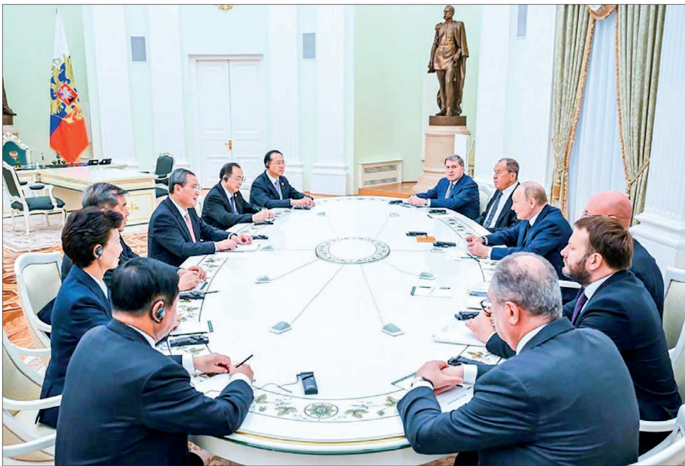
Chinese Premier Li Qiang meets Russian President Vladimir Putin at the Kremlin in Moscow, Russia, 21 August 2024.