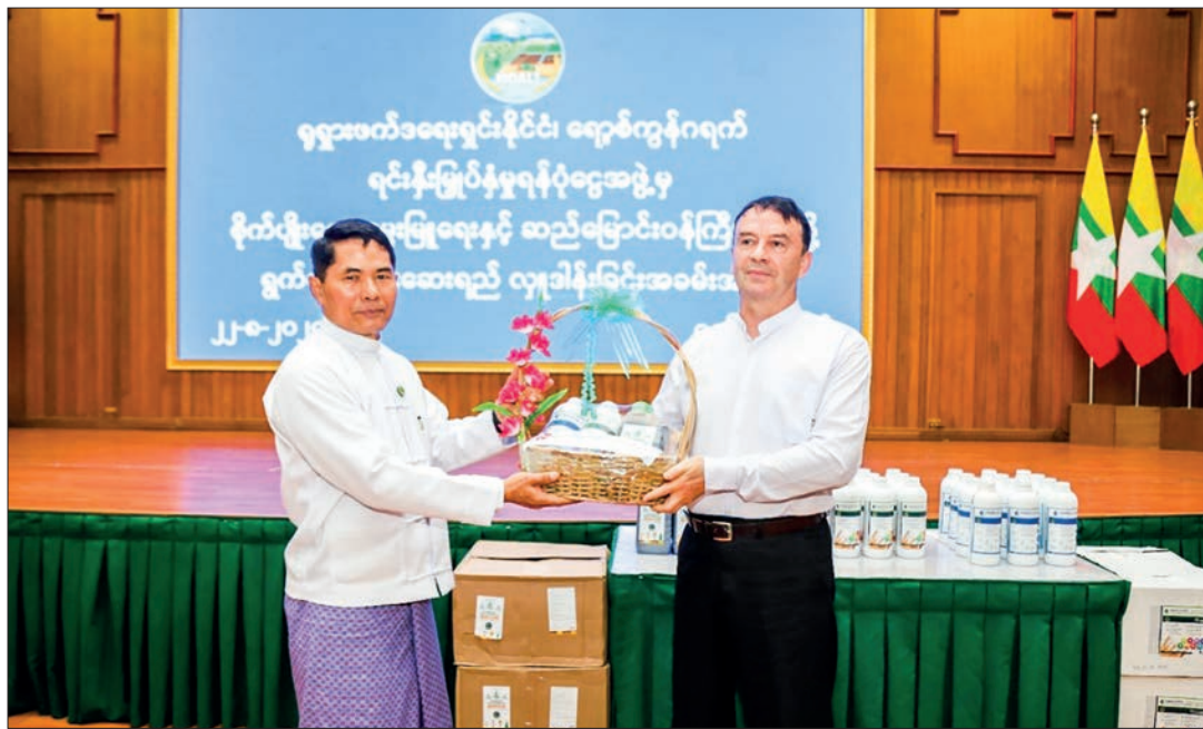
Union Minister U Min Naung receives the handover of plant nutrient spray for monsoon paddy yesterday.

Finally, the Union minister provided proper instructions.