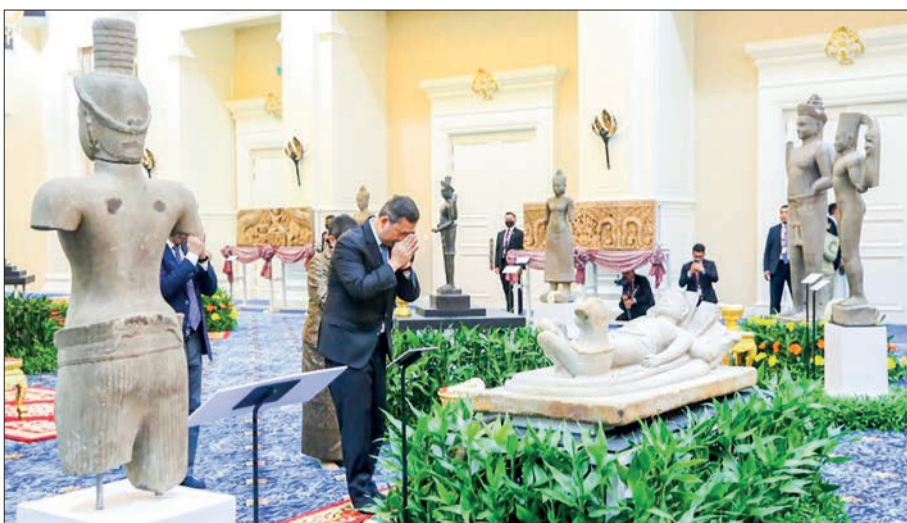
Cambodian Prime Minister Hun Manet worships Khmer ancient statues at the Peace Palace in Phnom Penh, Cambodia on 22 August 2024. Cambodia on Thursday celebrated the return of 70 stolen Khmer ancient artefacts to the Southeast Asian nation from abroad.

CAMBODIA on Thursday celebrated the return of 70 stolen Khmer ancient artefacts to the Southeast Asian nation from abroad.