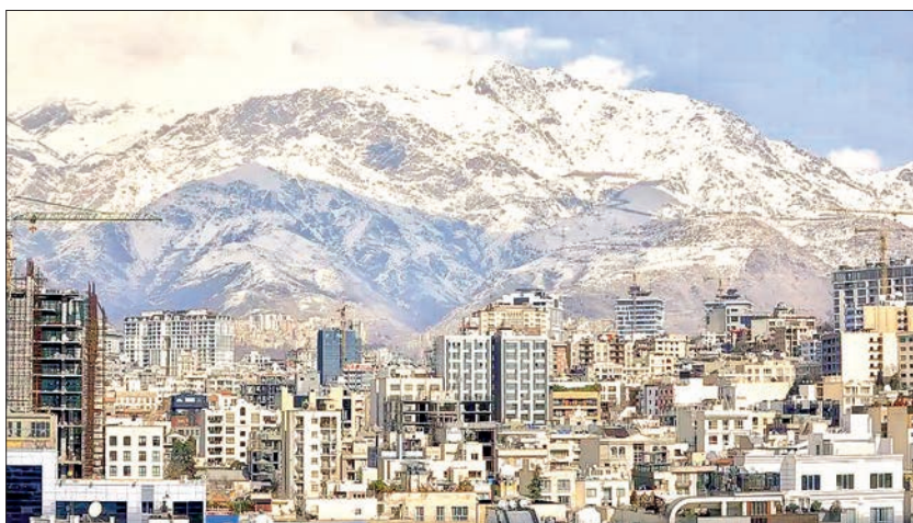
The snow-covered Alborz mountain range appears behind buildings in Tehran, during the cold winter season on 8 February 2025.

Qatar, Saudi Arabia, and Oman have persuaded US President Donald Trump to avoid attacking Iran,