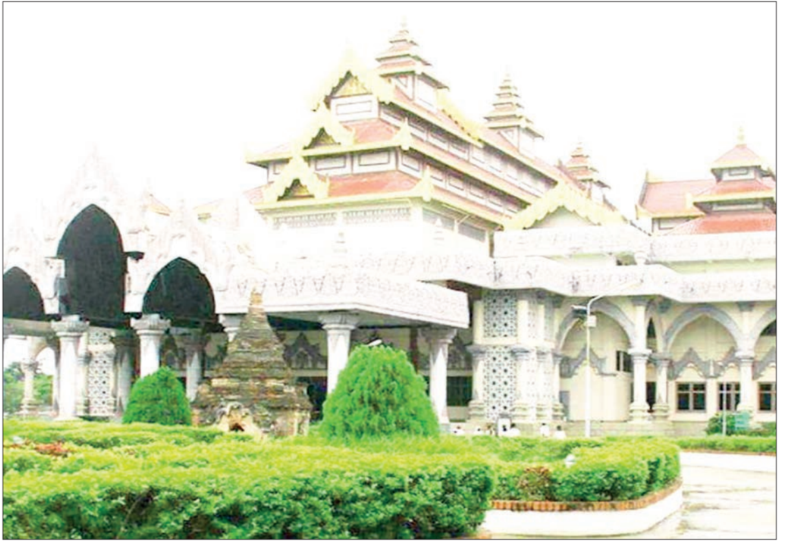
This image depicts the Bagan Archaeological Museum.

It is open from 9:30 am to 4:30 pm daily, except Mondays and public holidays, with entrance fees of K1,000 (locals), K10,000 (foreigners) and exemptions for children under 12, students with recommendation letters, monks and nuns. — MT/ZN