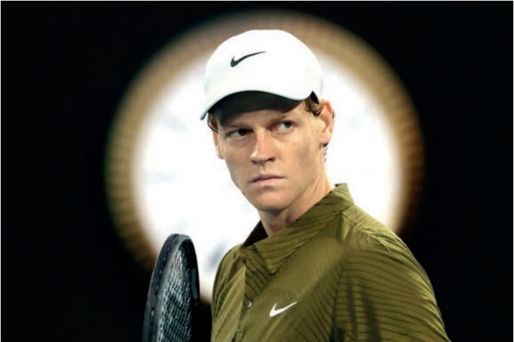
Italy’s Jannik Sinner beat Ben Shelton in their Australian Open quarter-final.

Sinner has a 6-4 win-loss record over the Serb, but has won their last five encounters. — AFP