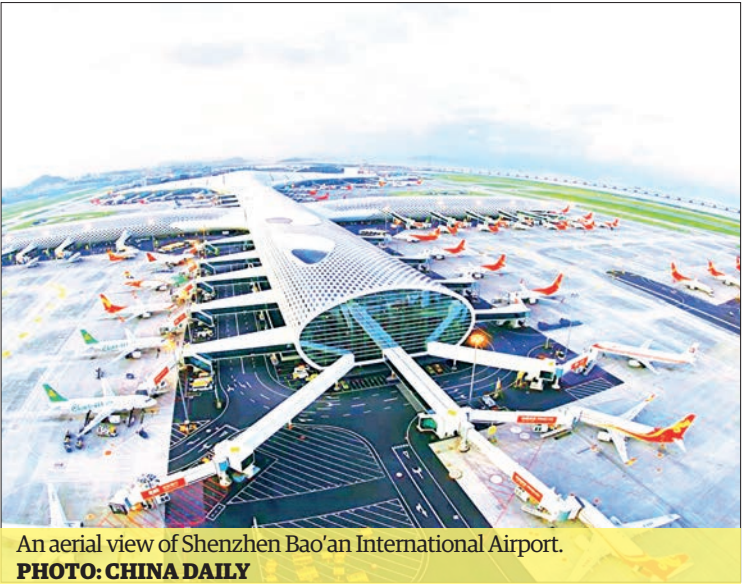
An aerial view of Shenzhen Bao'an International Airport.

The core hubs within the cluster, namely Guangzhou, Shenzhen and Hong Kong, reported particularly good results last year. Guangzhou Baiyun International Airport, notably, achieved a historic milestone in 2025, with passenger throughput amounting to 83.59 million trips and cargo and mail throughput totaling 2.44 million tonnes, both reaching record highs. — Xinhua