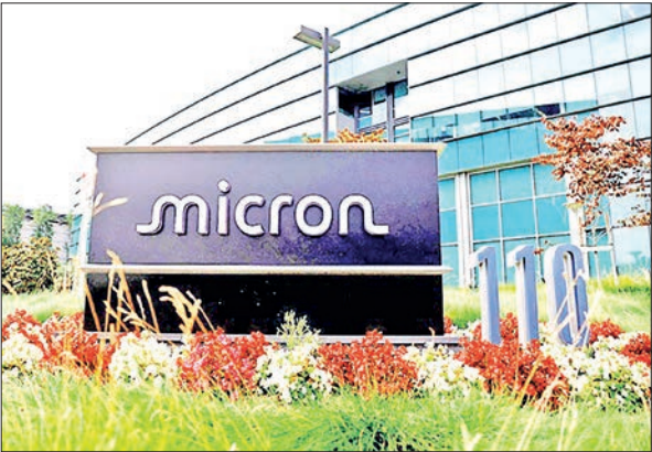
Micron Technology has announced a massive $24 billion investment to build a new semiconductor fabrication plant in Singapore, aimed at meeting surging global demand for memory chips driven by artificial intelligence (AI). PHOTO: AFP/FILE

US chip firm Micron said Tuesday it was building a $24 billion plant in Singapore to help meet soaring AI-driven demand that has caused a global shortage of memory components. Artificial intelligence data centres worldwide are hoovering up the memory chips used in consumer electronics — a crunch threatening higher prices for phones, laptops and other devices. Micron said it had broken ground Tuesday on an “advanced wafer fabrication facility located within the company’s existing NAND manufacturing complex in Singapore”. NAND storage components power everyday gadgets but are also needed to help process the vast amounts of data crunched by generative AI. “This new facility represents a planned investment of approximately US$24 billion (SG$31 billion) over 10 years” with output scheduled for the second half of calendar 2028, Micron said. — AFP