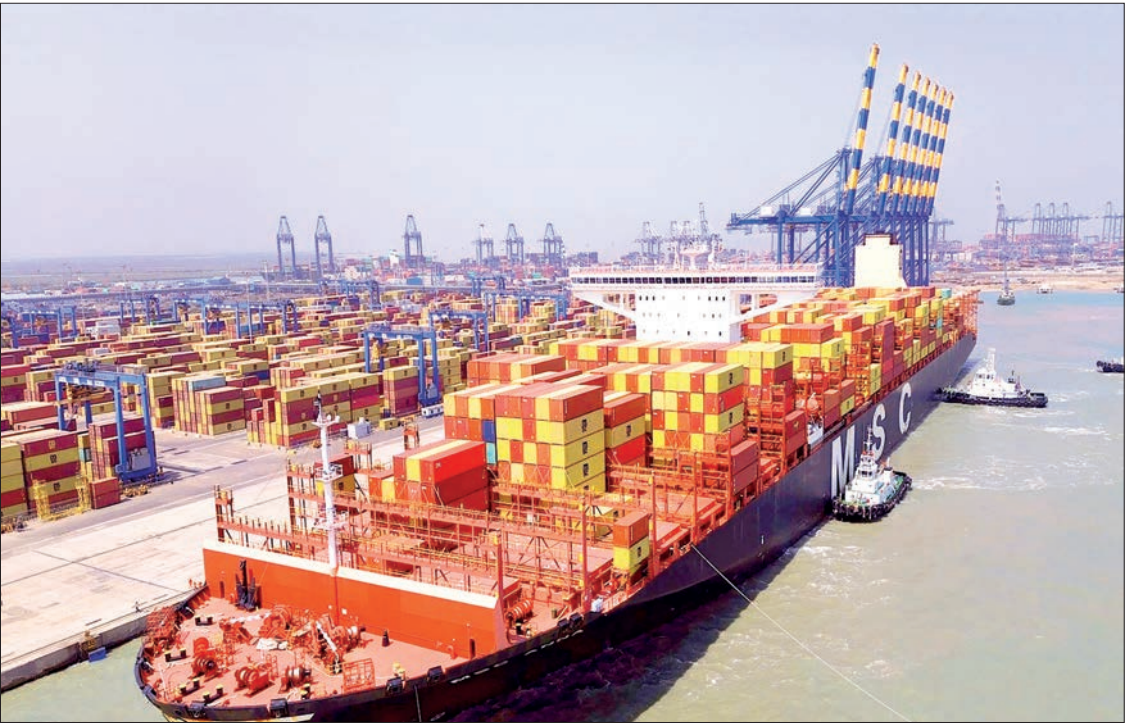
The India-EU Free Trade Agreement grants India preferential access across 97 per cent of EU tariff lines, covering nearly 99.5 per cent of trade value, resulting in 91 per cent of Indian exports facing no import duties from the agreement's effective date.

and Turkiye. Similar benefits are expected for exports of chemicals, leather products and footwear. EU imports nearly US$125 billion worth of textiles and apparel annually, making it one of the world's largest markets for clothing and fabric. Jefferies analysts note that India has secured preferential access across 97 per cent of EU tariff lines, covering nearly 99.5 per cent of trade value. As a result, around 91 per cent of Indian exports to the EU will face no import duties from the effective date of the agreement. — ANI