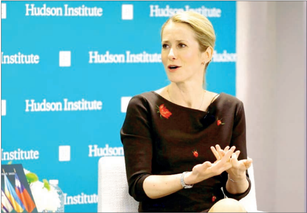
Kaja Kallas, the European Union’s high representative for foreign affairs, speaks at the Hudson Institute in Washington.

Kallas noted that Washington’s primary centre of gravity has moved away from Europe.