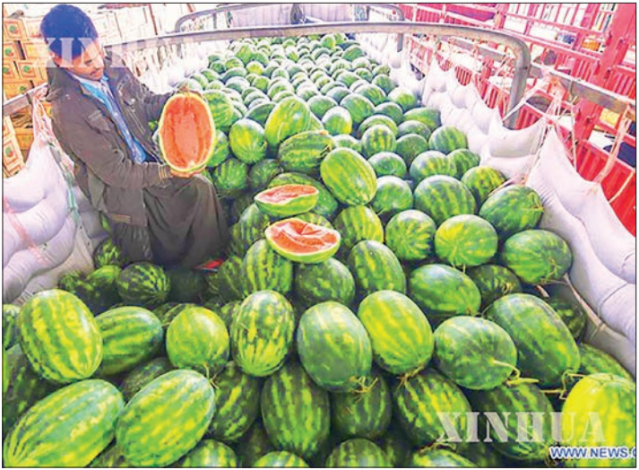
This image shows a truck ferrying melons to China.

WHEN the Chinese New Year approaches, melon and muskmelon prices have started getting high, according to border fruit traders. Melons and muskmelons grown in Myanmar are being exported to China through the Mongla border trading route, and the fruit market has been slow due to competitive selling. At present, the Chinese New Year is drawing near, and the fruit trading has begun to be active again, said traders. "We expect the prices get high when the new year is right around the corner. They compete to buy when there are a few trucks or adjust their purchase when there are more than 25 trucks. The muskmelon price has now started getting active, and so has the watermelon price. Prices vary depending on col-