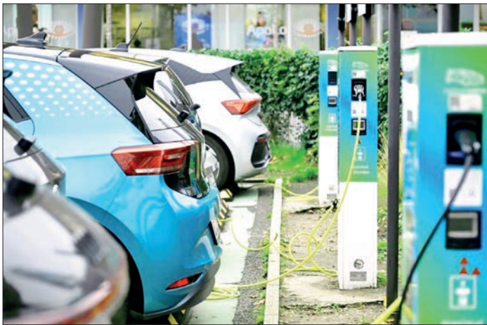
New car sales "remain well below pre-pandemic levels". PHOTO: AFP/FILE overall sales growth, consumers continued to shift towards hybrid and battery-electric vehicles. — AFP

HYBRID-ELECTRIC vehicles dethroned purely petrol-powered cars as the top power option among consumers in Europe last year, data showed Tuesday. Some 10.8 million new vehicles were registered in 2025 in the European Union, an increase of 1.8 per cent from the previous year, according to the European Automobile Manufacturers' Association (ACEA). New car sales "remain well below pre-pandemic levels", however, the trade association said in a statement. Despite the only modest