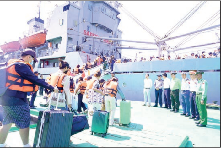
Returnees from Cambodian are seen embarking onboard the naval vessel to head for Yangon.

manent residency, studying or working, said the embassy. The total length of their stay shall not exceed 90 days in a calendar year, said the embassy. Foreign Affairs Ministers of the two countries signed the agreement on mutual exemption of entry visa for ordinary passport holders on 28 October 2025. — MT/ZS