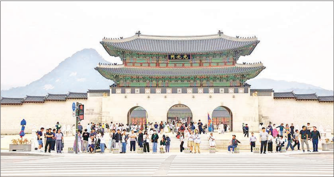
People visit the Gwanghwamun Square in Seoul, South Korea, on 24 May 2024.