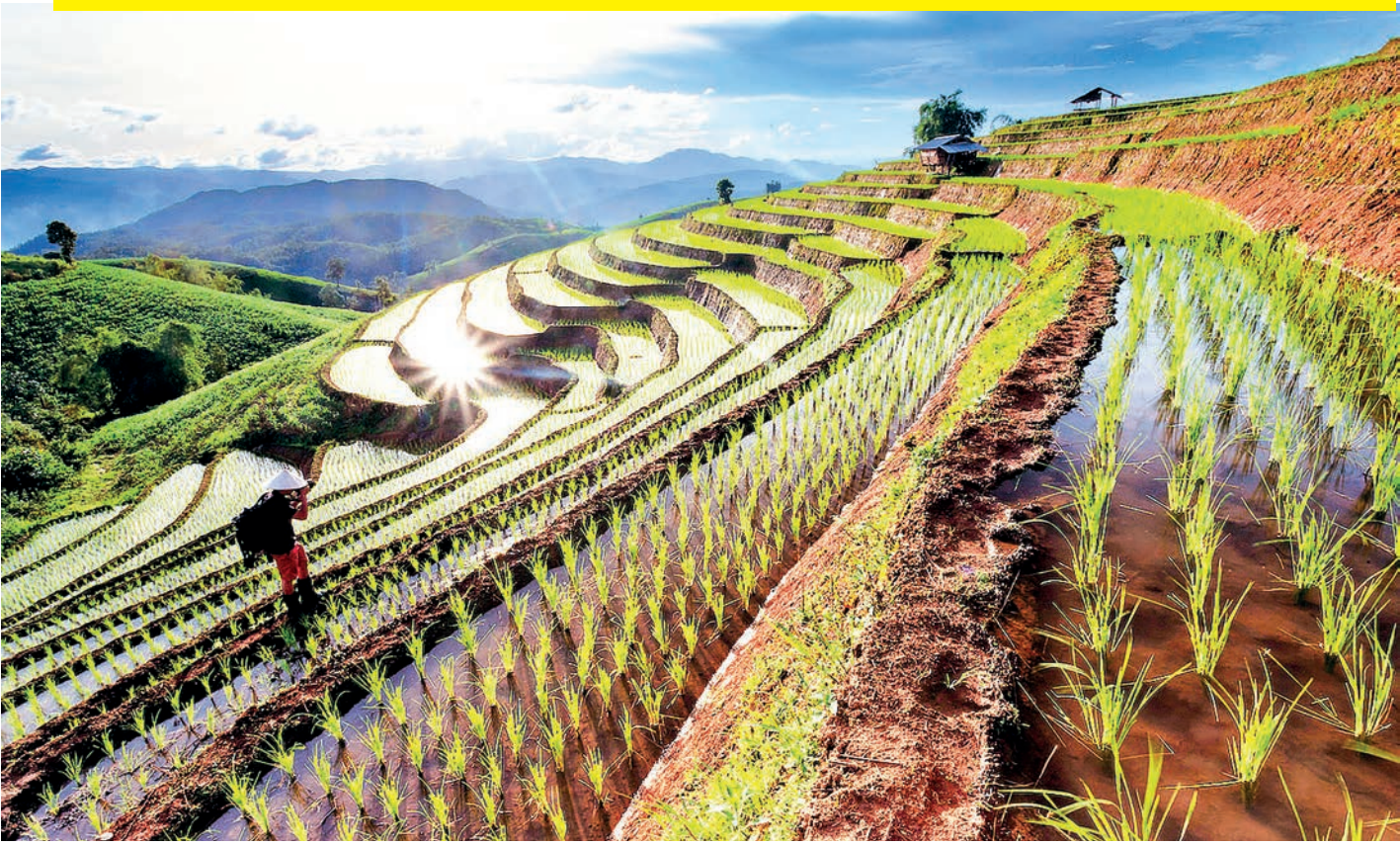
Farming flourishes in Kalaw’s ladder-type agricultural system, Shan State.

In the previous year, southern Shan State also secured two ASEAN awards, with Sikyainnn Village CBT in Pindaya Township winning the ASEAN Community-Based Tourism Award, while the public restrooms at the Culamuni Lokachantha Pagoda in Taunggyi received the ASEAN Public Toilet Award.