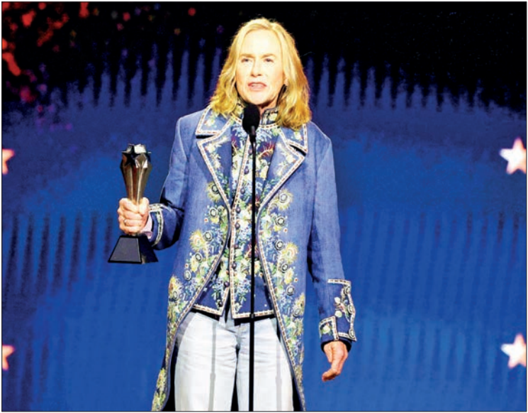
Oscar-nominated actress Amy Madigan will appear as a guest star in the upcoming series All The Sinners Bleed.