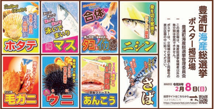
Posters for candidates in a vote for the most popular seafood to be held in Toyoura, Hokkaido, northern Japan.

lower house called by Takaichi last week. It will be the fourth seafood popularity contest in the town famous for scallops and is part of the local tourism association's drive to encourage people to vote in elections and revitalize the town. A total of eight candidates are vying to land the most votes, including herring, mackerel and trout. Around 26,000 people voted in the previous contest in 2024, with scallops, unsurprisingly, triumphing for a third time. — Kyodo