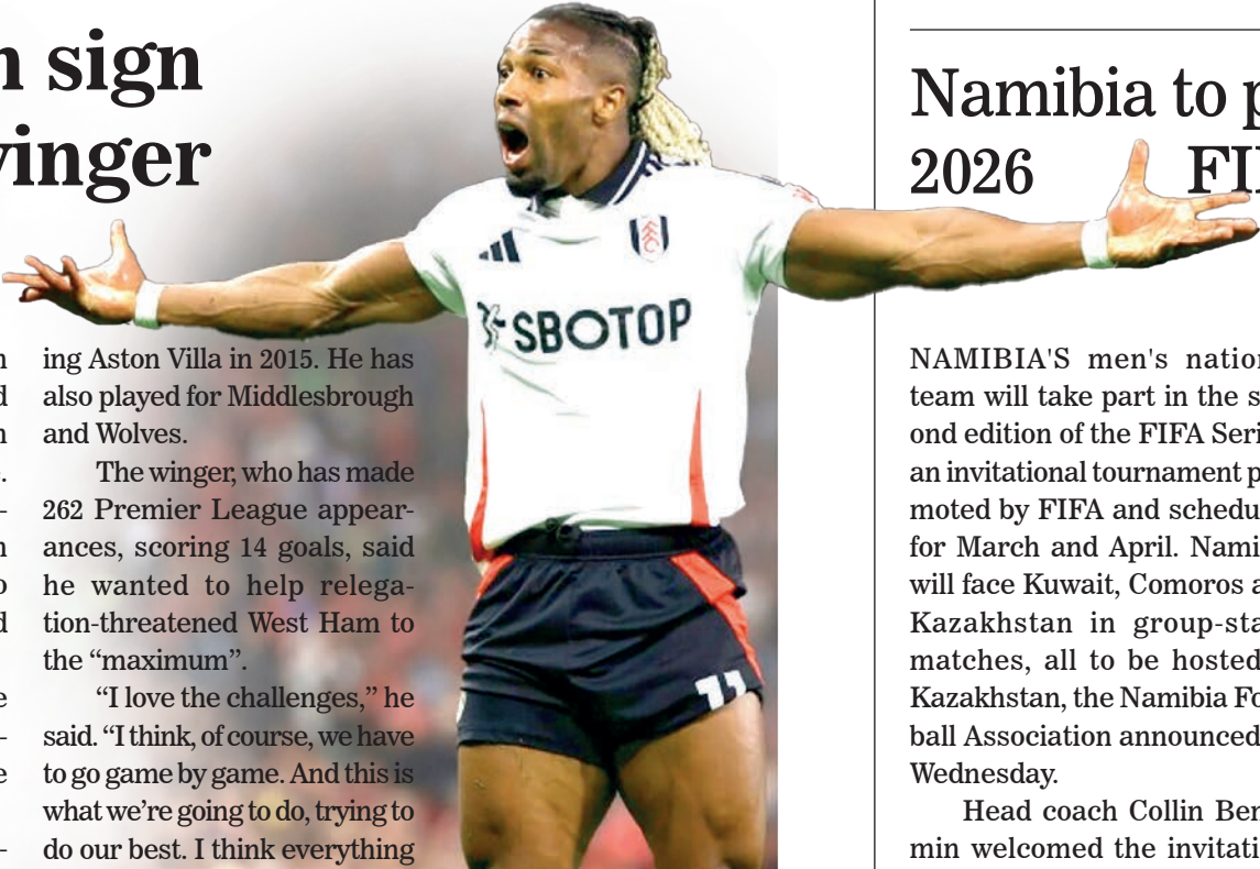
Winger Adama Traore has joined West Ham from Fulham.

“I love the challenges,” he said. “I think, of course, we have to go game by game. And this is what we’re going to do, trying to do our best. I think everything comes from belief. And I believe we’re going to achieve what we’re looking for”. — AFP