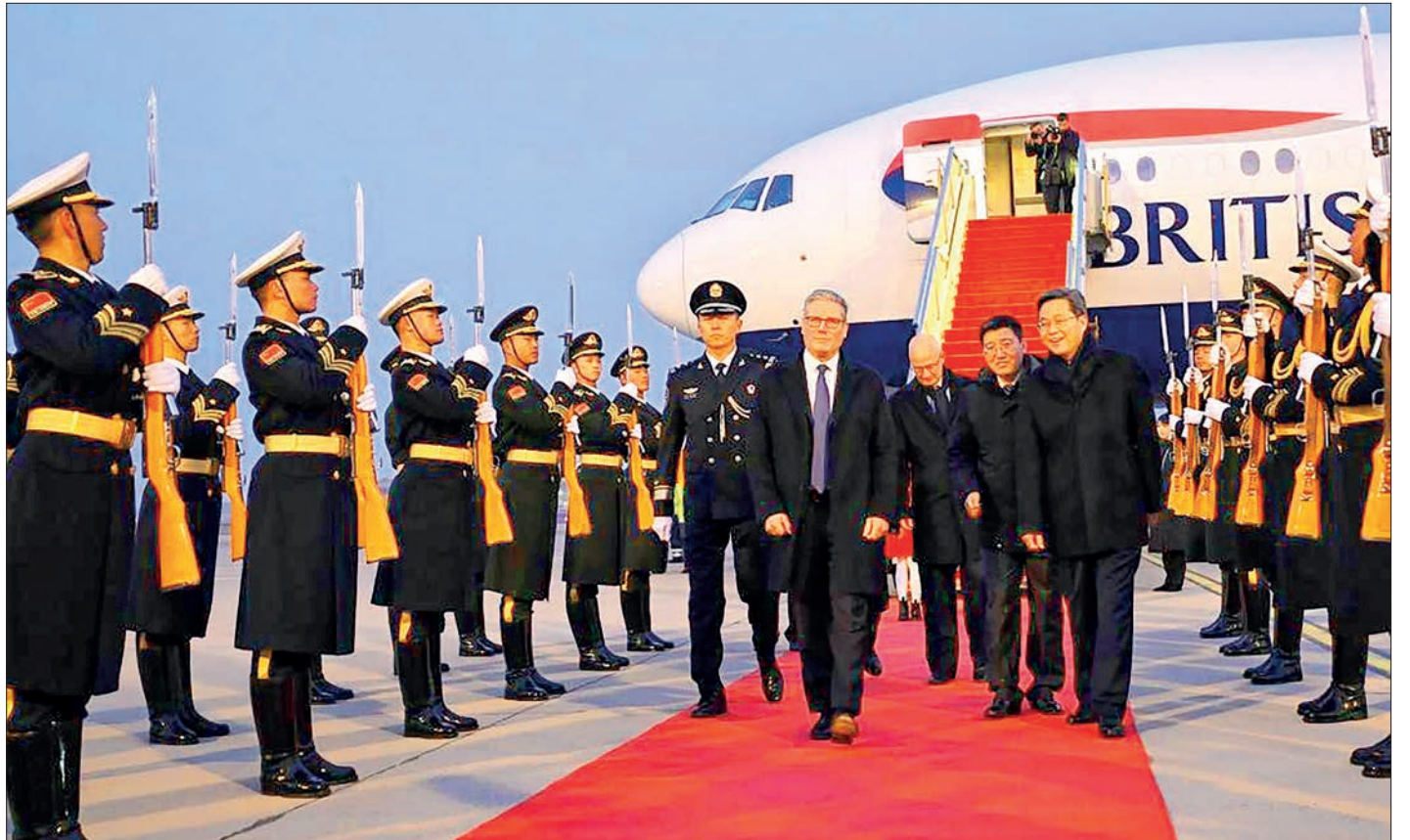
British Prime Minister Keir Starmer arrives in Beijing, capital of China, 28 January 2026. Starmer arrived here on Wednesday for an official visit to China through Saturday.

Under the leadership of Prime Minister Keir Starmer, the British Labour Party government is pursuing a strategic re-engagement with China, prioritizing economic stability and pragmatic cooperation.