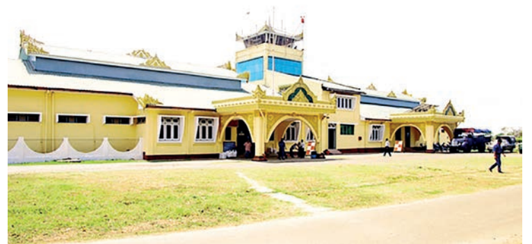
This photo captures the Sittway Airport.

For more details, enquiries can be made through the following contact numbers: 09 427714041 and 09 36570111, Deputy Director U Aung Kyin San of the Rakhine State government office. — MT/ZS