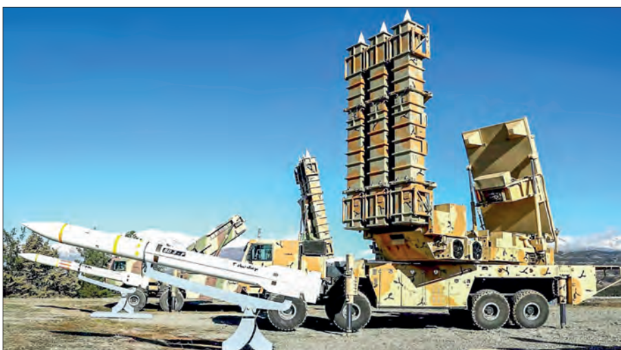
Iran fired around 180 missiles at Israel in response to the Israeli military offensive in Lebanon that killed Hezbollah leader Hassan Nasrallah.

Iran's Islamic Revolution Guards Corps (IRGC) said that if Israel retaliates by attacking Iran, it will face "crushing and destructive" attacks. — Xinhua