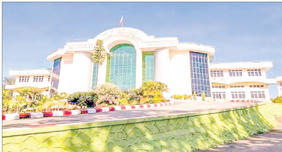
File photo shows the Yezin Agricultural University in Nay Pyi Taw Council Area.

YEZIN Agricultural University, under the Ministry of Agriculture, Livestock and Irrigation, announced again that it is accepting first-year admission to a four-year bachelor's degree BAgSc for the Academic Year 2024-2025.