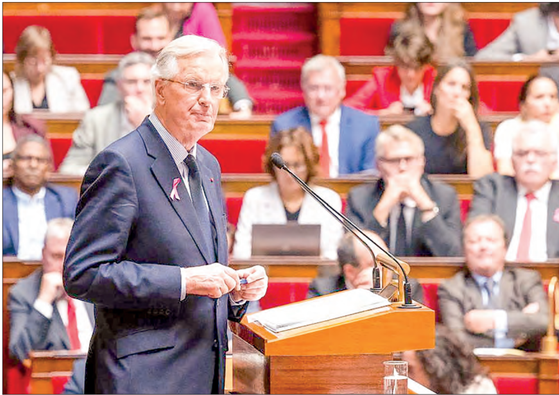
French Prime Minister Michel Barnier delivers a speech in the National Assembly in Paris, France, on 1 October 2024.

Key priorities include reducing the public deficit, reforming immigration, and implementing new retirement policies.