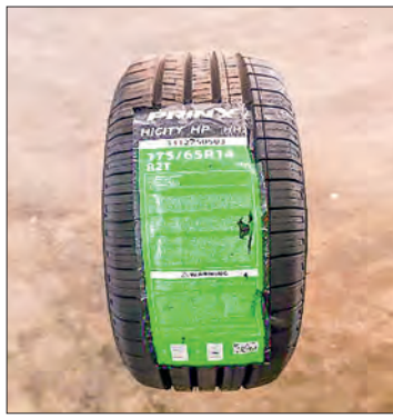
Confiscated illegal goods in various regions and states.

On 1 October, combined teams under the Kayin State Illegal Trade Eradication Task Force intercepted three vehicles carrying foodstuffs and industrial materials worth K62.04 million, along with a Mitsubishi Fuso truck containing car parts,