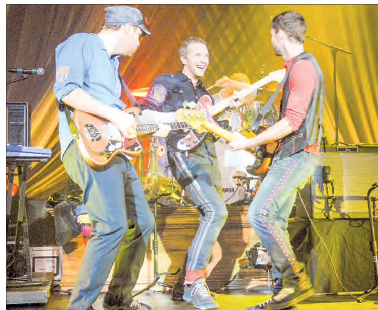
British rock band Coldplay has captivated audiences worldwide with their emotive lyrics and innovative sound.