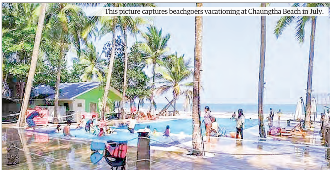
This picture captures beachgoers vacationing at Chaungtha Beach in July.

AMONG those who visit Chaungtha Beach during public holidays through travel companies, the majority are Yangon residents.