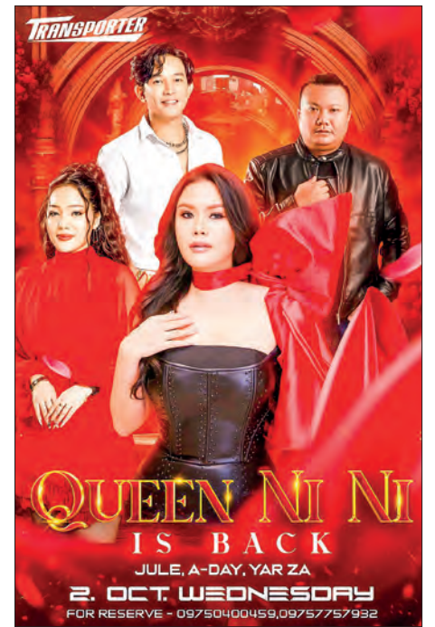
This image showcase a poster for the concert.