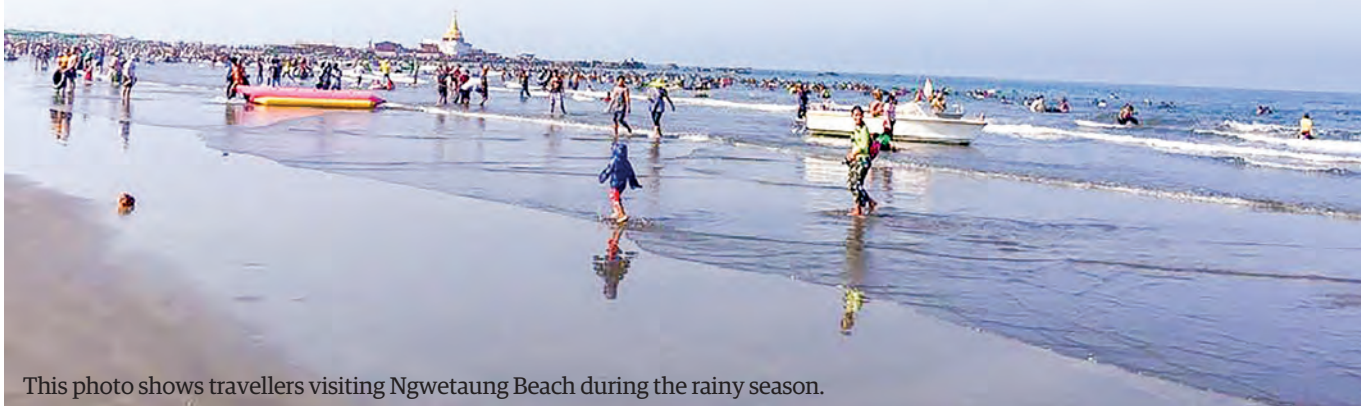
This photo shows travellers visiting Ngwetaung Beach during the rainy season.

Ngwetaung Beach provides a peaceful and safe environment for beachgoers. Visitors can enjoy services such as bicycle and motorboat rentals, as well as horse riding. In addition, market stalls offer local cuisine, accessories, and souvenirs for sale. — ASH/MKKS