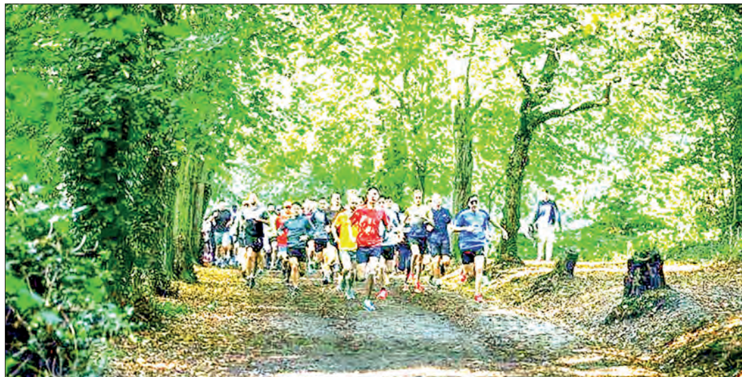
There are now 2,500 Parkruns across 23 countries.