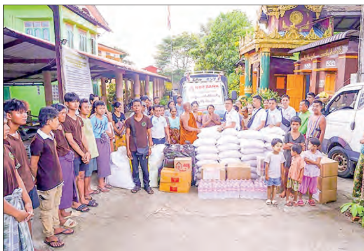
This picture captures the donation event to flood victims.

taking refuge at Mahasi and Shwelinyon monasteries in Taungoo Township, Bago Region, received additional donations from the same organ-