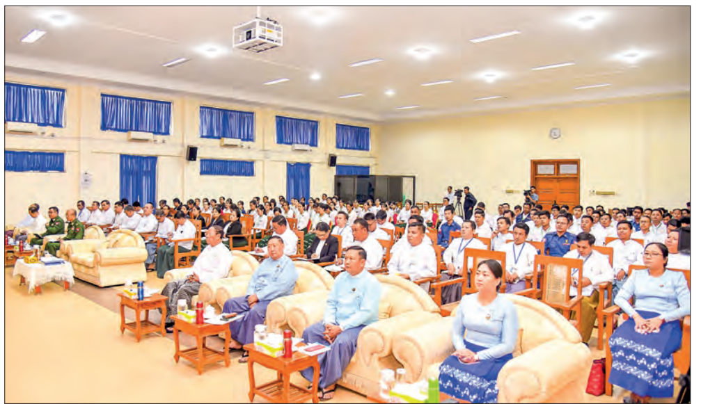
State Administration Council Member Deputy Prime Minister Union Minister for Defence Admiral Tin Aung San delivers a speech at the awareness seminar on anti-corruption in Nay Pyi Taw yesterday.

and educating programmes to build a society that totally opposes corruption and to eradicate the corruptions.