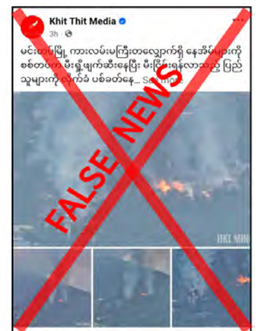
This screenshot validates misinformation.

During their retreat, terrorists set fire to several homes to prevent security forces from pursuing them further. Malicious media outlets aligned with terrorists are now distorting the facts, accusing security forces of committing