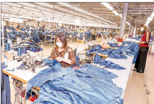
Employees make clothes for export at a textile and garment company in My Hao district, Hung Yen province, Vietnam, on 29 March 2022.

The FDI accounts for 65 per cent of the sector's total export turnover, said the report. Many large FDI corporations have poured money into building modern garment and textile factories in Vietnam, according to