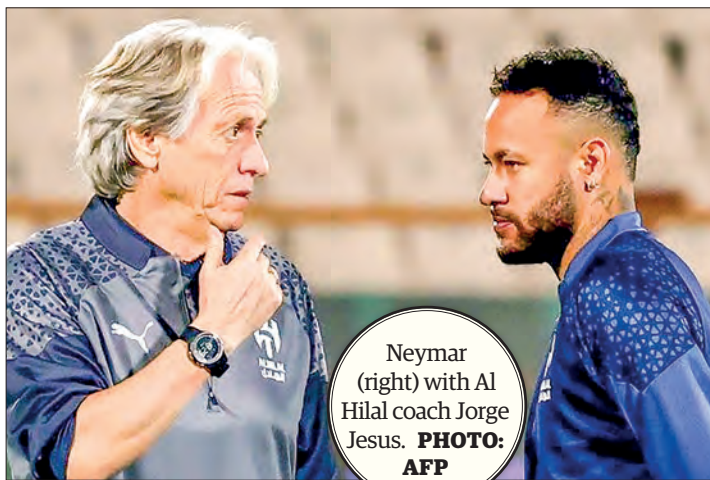
Neymar (right) with Al Hilal coach Jorge Jesus.

Returned to training after a year out due to a left knee injury, following his transfer from Paris Saint-Germain in August 2023 and subsequent injury on international duty in October 2023.