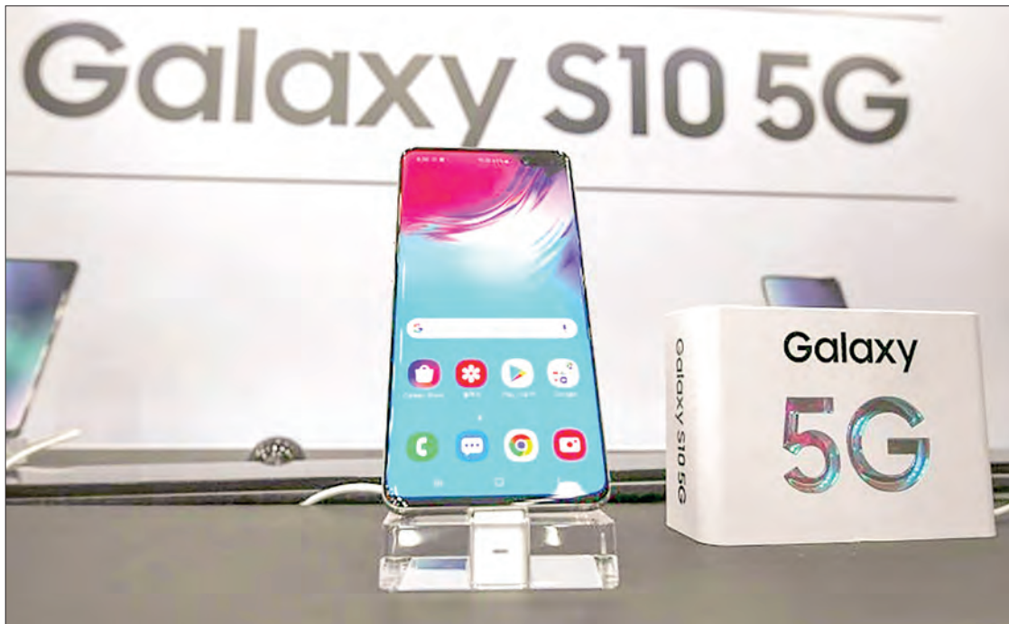
Mobile device shipment jumped 19.0 per cent to 1.92 billion dollars. South Korea remains a significant market for mobile devices, with major brands like Samsung and LG being prominent players.

Notably, semiconductor exports surged 37.1 per cent to $13.62 billion, fuelled by AI-related chip demand and new smartphone launches.