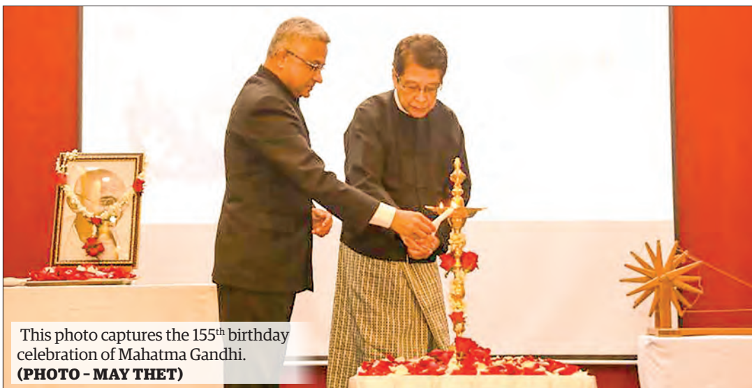
This photo captures the 155 th birthday celebration of Mahatma Gandhi.

ON 2 October, the 155 th birthday of Mahatma Gandhi was celebrated at the India Centre in collaboration with the U Ne Oke Foundation. The event focused on Gandhi's teachings of non-violence, truth, and justice, which continue to inspire generations and show the path to true liberation through dialogue, social reform, and uplifting people with low incomes with dignity.