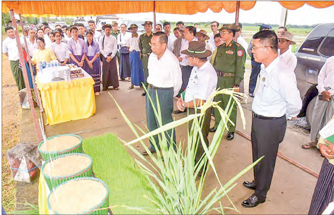
State Administration Council Member Mahn Nyein Maung observes the recultivation of paddy in farmlands that were submerged in Ingapu, Ayeyawady Region.

The SAC member and party first observed the Byaw Tun paddy plantation on 2.50 acres of farmland in Ingapu Township of Myanaung District, Sinshwekyia-2 sunflower plantation on five acres of farmland in Kanyingu village, monsoon sunflower (Sinshwekyia-2) and monsoon peanut (Magway-12) on 350 acres of land in Kazungon village-tract and rotary weeding and Leersia hexandra killing processes in monsoon paddy (Sinshwekyia-2) field and