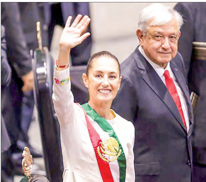
Claudia Sheinbaum Pardo (front) attends her presidential inauguration ceremony in Mexico City, Mexico, 1 October 2024.

In her speech, which was interrupted by applause and cheers on several occasions, Sheinbaum praised Lopez Obrador's political legacy, describing the former president as a true democrat and patriot in the tradition of the country's great national heroes. Sheinbaum, who takes office for the 2024-2030 term, has unveiled a 17-point government plan that prioritizes the "republican austerity" of her predecessor, who rejected the lavish lifestyle and corruption of former government officials, as well as strengthening welfare programs and education. — Xinhua