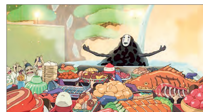
အပင်းချ /a painn hkya/