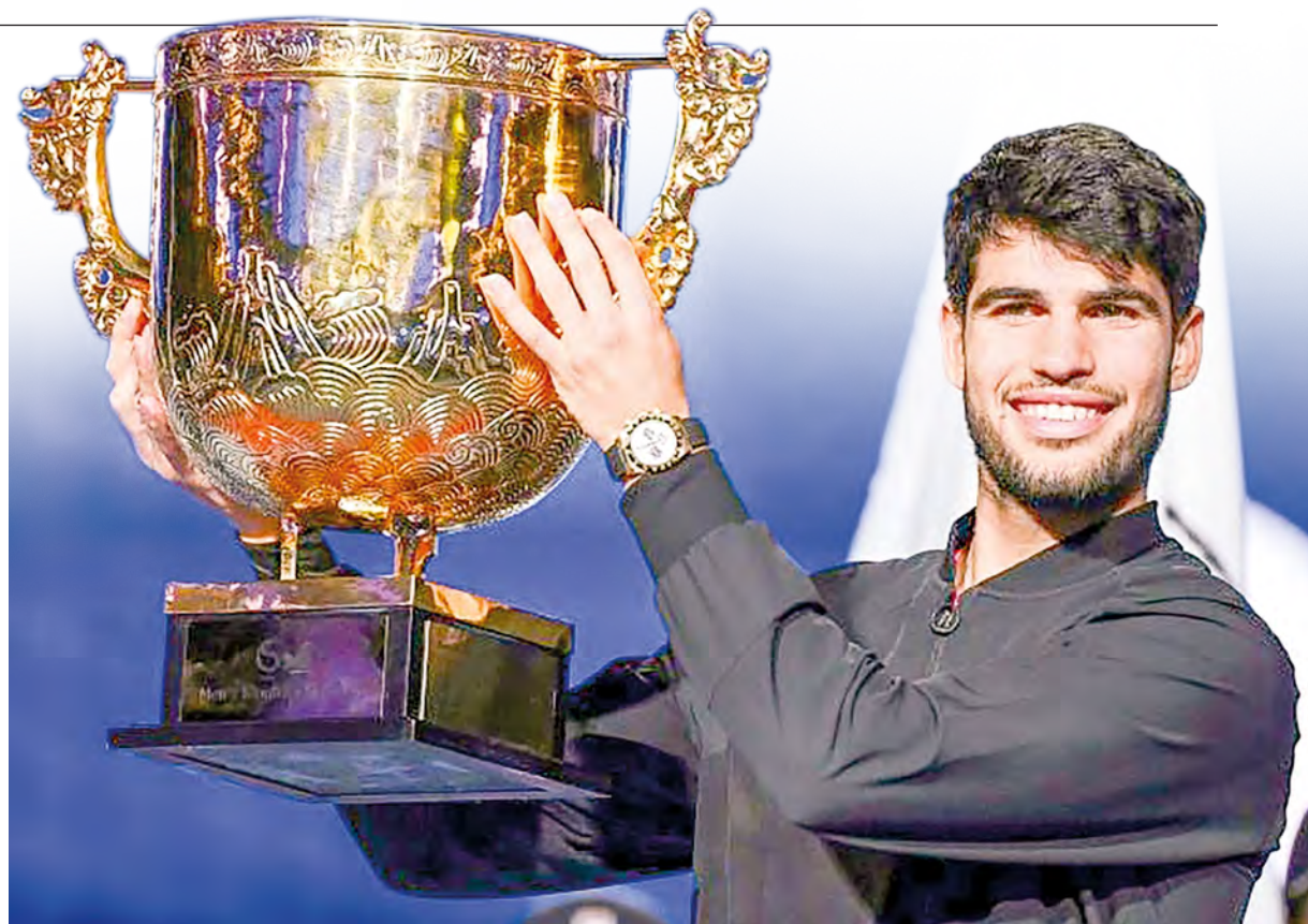
Spain's Carlos Alcaraz defeated Italy's Jannik Sinner to win the China Open tennis tournament in Beijing.

US Open champion Sinner has been playing in Beijing under fresh scrutiny. The Italian has admitted to sleepless nights over his doping case, which was reignited at the weekend when the World Anti-Doping Agency (WADA) said it had appealed the decision to clear him. — AFP