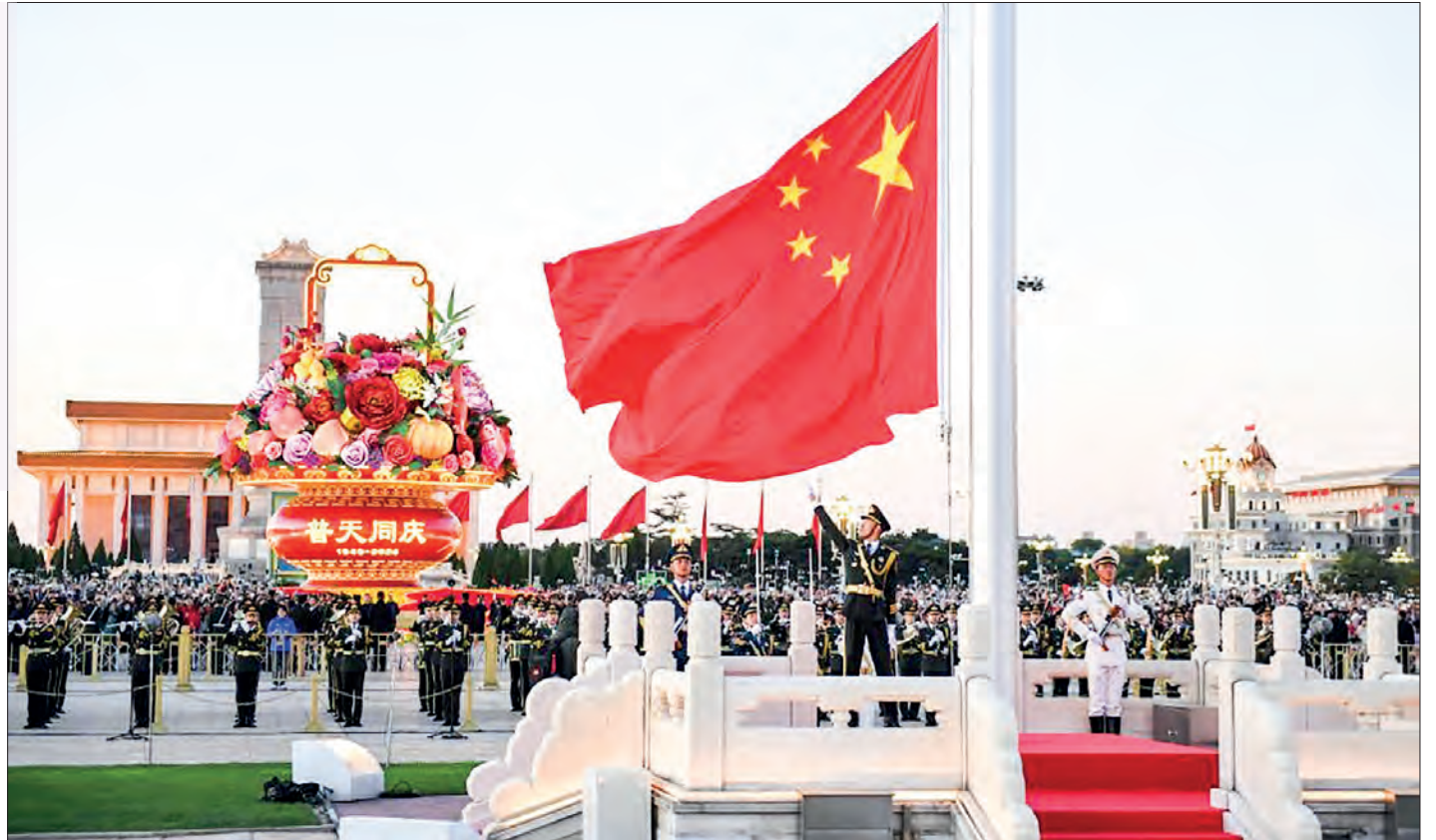
A flag-raising ceremony marking the 75 th anniversary of the founding of the People's Republic of China is held at the Tian'anmen Square in Beijing, capital of China, 1 October 2024.

He made the remarks in a congratulatory message sent to Russian President Vladimir Putin on the 75 th anniversary of diplomatic ties between the two countries. — Xinhua