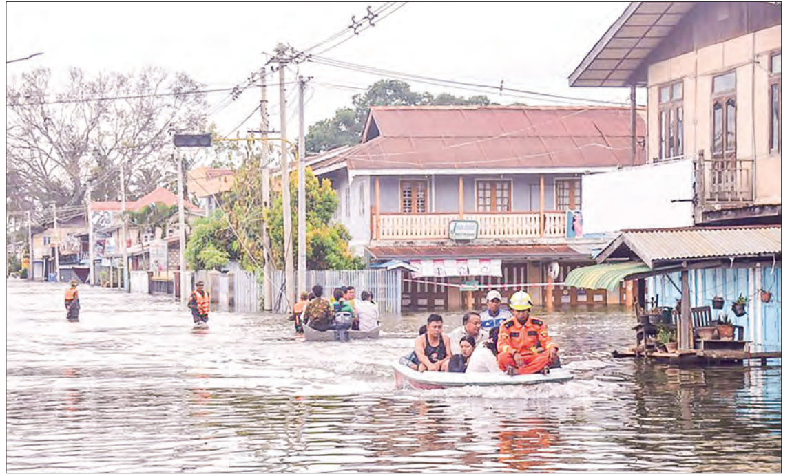
This photo shows rescuers evacuating flood victims during the flash floods.

Additionally, health teams have been providing essential medical services and education sessions in temporary relief camps for flood victims. They distribute aid supplies, including