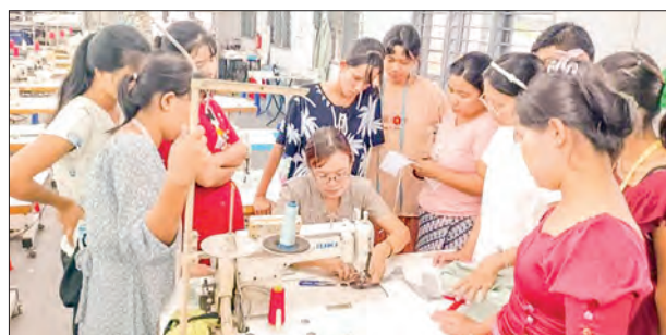
(File) Trainees are diligently observing demonstration during the Advanced Sewing Machine Operator Training (Batch 4).

MYANMAR Garment Manufacturers Association (MGMA) will conduct a Basic Sewing Machine Operator Training Course (Batch 244) from 7 to 25 October 2024 at the Myanmar Garment Human Resources Development Training Centre (MGHRDC).