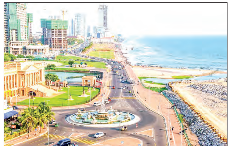
Sri Lanka's new government announced it would review a $12.5 billion sovereign bond debt restructure deal, a key part of the IMF rescue plan agreed upon last year following an economic crisis.

But new foreign minister Vijitha Herath told reporters that the new administration was still weighing whether to proceed with it. "We will review the debt restructure agreement the previous government announced," Herath said. — AFP