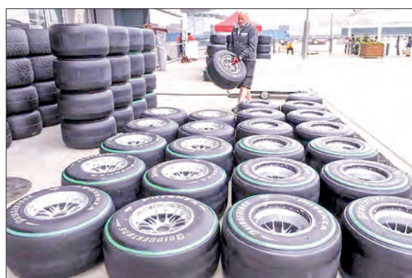
Bridgestone struck sponsorship deals with the Olympics for 10 years in 2014 and the Paralympics for six years in 2018.

Toyota's chairman Akio Toyoda has said the Olympic Games were "becoming increasingly political," while Panasonic announced their withdrawal citing "management considerations." — AFP