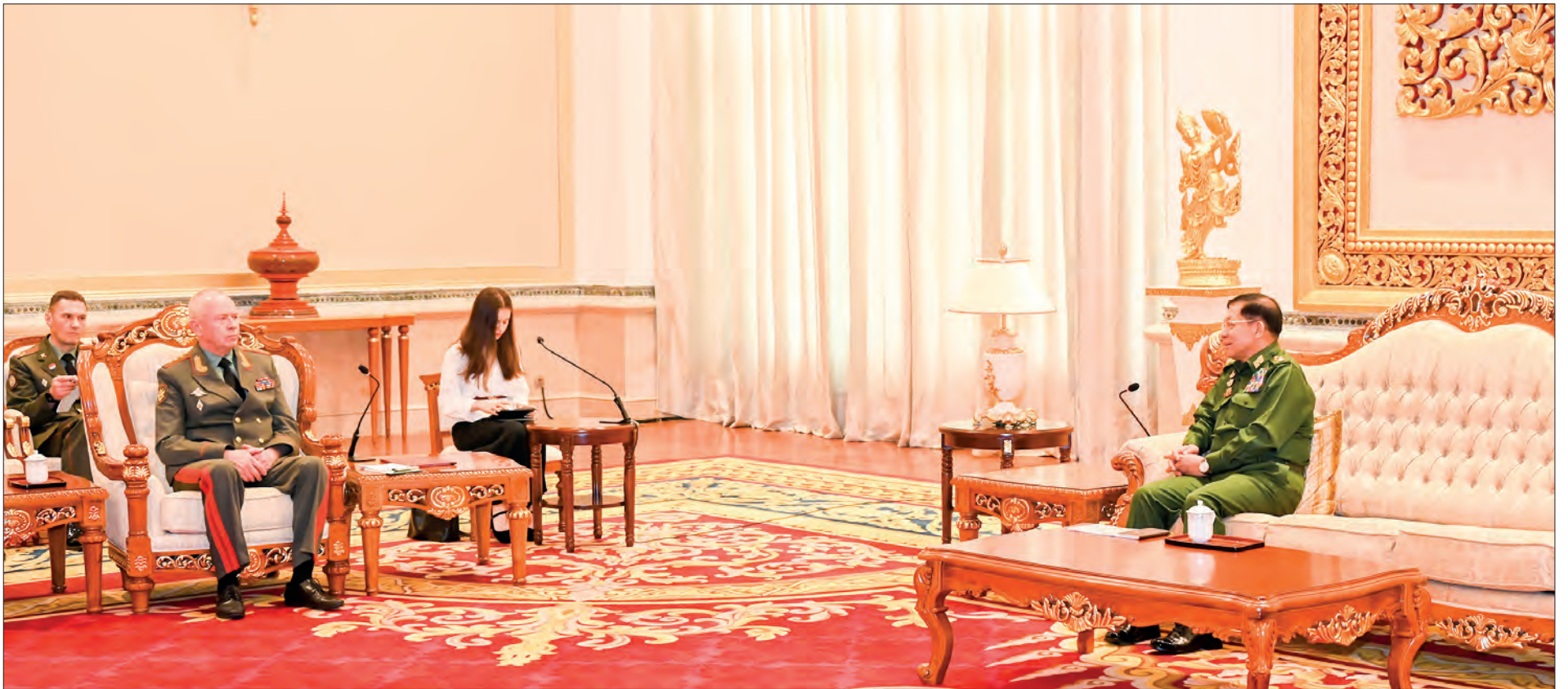
The Russian delegation led by Deputy Minister for Defence Col-Gen Aleksandr Vasilyevich Fomin pays a courtesy call on State Administration Council Chairman Defence Services Commander-in-Chief Senior General Min Aung Hlaing yesterday in Nay Pyi Taw.