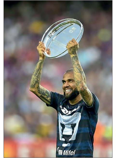
Former Barcelona and Brazil star Dani Alves has had his rape conviction overturned by a Spanish appeals court.

"In terms of the bond between fans and the squad, it is growing, it is getting stronger. — AFP