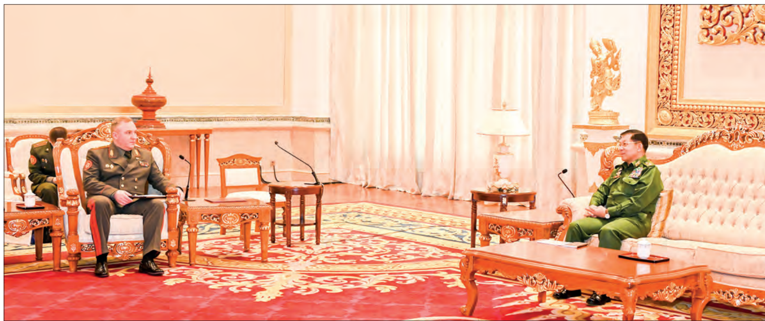
The Belarusian delegation led by Defence Minister Lt-Gen Viktor Gennadievich Khrenin pays a courtesy call on SAC Chairman Defence Services Commander-in-Chief Senior General Min Aung Hlaing yesterday in Nay Pyi Taw.

They cordially discussed further enhancement of friendly relations and cooperation between the two countries after turning the 25-year diplomatic relations,