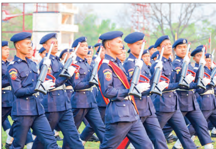
The graduation ceremony of the Assistant Fire Staff Officer Course in action yesterday.

The course was conducted in line with the Ministry of Home Affairs' policy guidelines and the objectives of the Fire Services Department,