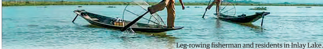
Leg-rowing fisherman and residents in Inlay Lake.

findings from the research and there are Bithniidae species (small freshwater snails) recorded from the Inlay Lake basin and surrounding area. Some of them are endemic species to