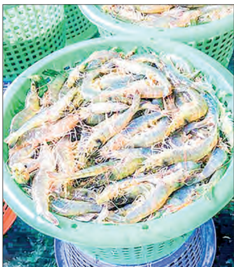
Myanmar's export shrimp.

Myanmar exports fishery products to 40 international countries, including Japan, Bangladesh, China and Thailand, through maritime and land borders. — NN/KK