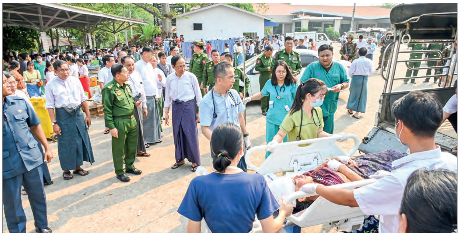
State Administration Council Chairman Prime Minister Senior General Min Aung Hlaing shows care to patients receiving treatment after strong earthquake.