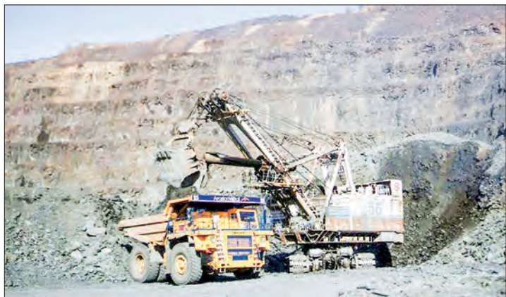
The Ukrainian government approved a deal with the United States, which envisages a joint investment fund to be financed with future revenues from Ukraine's mineral resources.

UKRAINE has received a revised minerals agreement from the United States, Ukrainian First Deputy Prime Minister and Economy Minister Yulia Svyrydenko said Friday.