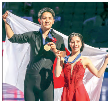
Japanese figure skating pair Riku Miura (R) and Ryuichi Kihara pose with their gold medals after winning the world championship at TD Garden in Boston on 27 March 2025.

"We made a lot of little errors but I'm so glad we were able to win the title," Miura said. "I'm feeling a mixture of emotions, because we managed to win despite injuries and a lot of difficulties over the past two years." — Kyodo