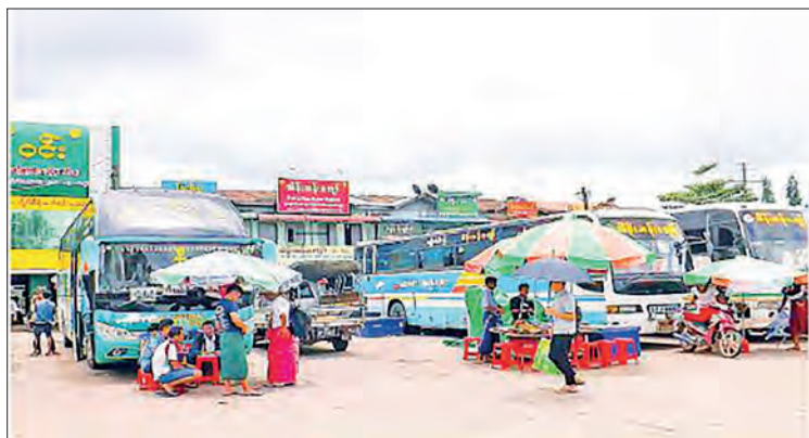
Bus line stations at the express bus terminal.

The Yangon Region Public Transport Committee (YRTC) will also take action against buses that raise fares or drivers who drive recklessly, consume alcohol, or treat passengers rudely during Thingyan. — ASH/MKKS