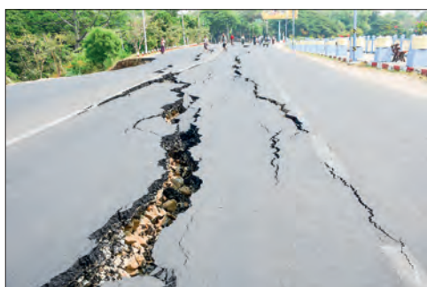
Debris in Meiktila.