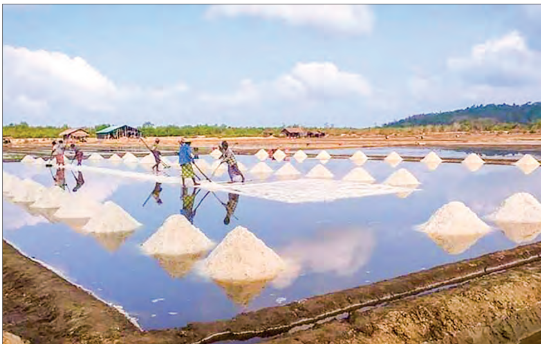
Workers harvesting salt at the salt farm.

The director of Monko International Services Co Ltd informed Myanmar officials of the inclusion in the list of salt-importing countries. — NN/KK