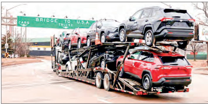
Vehicles like these Toyotas on their way to enter the United States from Canada are set to face 25 per cent tariffs if they are not US-made, according to President Donald Trump.

WORLD powers on Thursday blasted US President Donald Trump's steep tariffs on imported vehicles and parts, urging retaliation as trade tensions intensify and price hikes appear on the horizon.