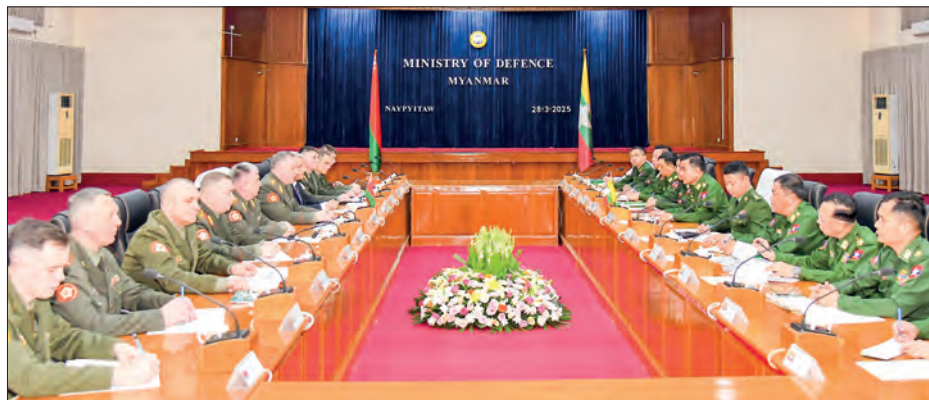
SAC Member Deputy Prime Minister Union Defence Minister General Maung Maung Aye receives the Belarusian delegation yesterday.

At the meeting, they cordially exchanged views on military relations between the Republic of the Union of Myanmar and the Republic of Belarus, cooperation in military training and education, potentials for cooperation in bilaterally military technology, explo-