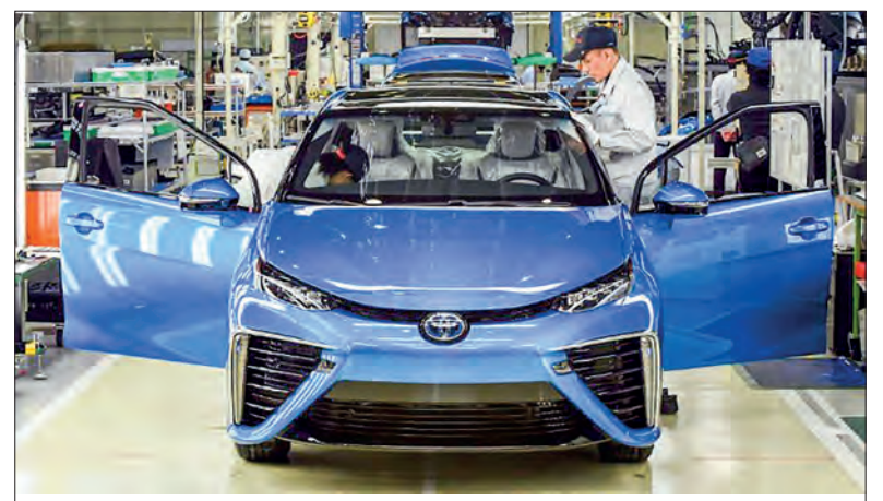
Tariffs on Japanese vehicle imports could be on the agenda, resulting in a "considerable" impact on Japan's economy.

Bank of Japan policy board members also voiced concern about the negative impact of the tariffs on the nation's economy, a summary of opinions from a March policy meeting showed Friday, at a time when it has become inclined to lift interest rates to curb inflation. The central bank "will need to be particularly cautious when considering the timing for raising the policy interest rate" since tariffs pursued by US President Donald Trump could hurt Japan's economy, one member was quoted as saying.