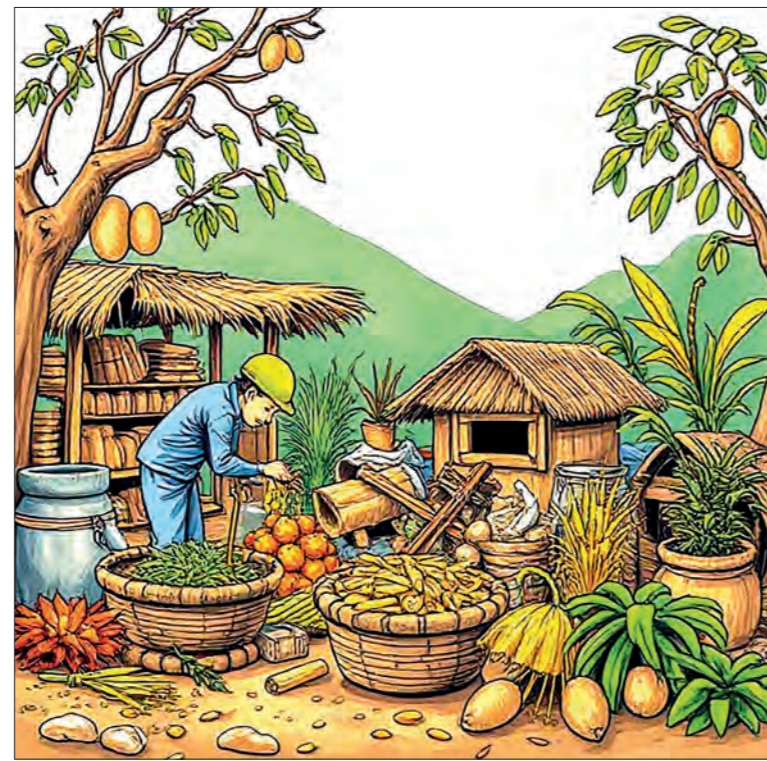
The development of MSMEs will not only create job opportunities but also increase income for entrepreneurs by processing local raw materials into finished products, contributing to regional development. ILLUSTRATIVE IMAGE: CONCEPT ART

T O improve the country's economy, prioritizing the production of agricultural products has been encouraging and the country is implementing plans to export new export items, and striving hard to develop micro, small, and medium enterprises (MSMEs).