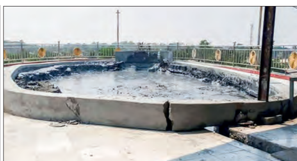
Damage in the compound of the Nagabwet.