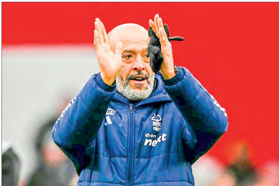
Nuno Espirito Santo is aiming to lead Nottingham Forest to the FA Cup semifinals for the first time since 1991.

Forest, who needed penalty shoot-outs to get past third-tier Exeter and