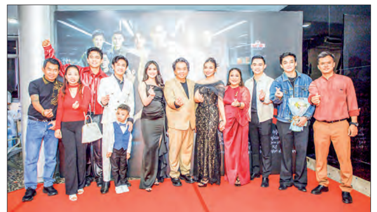
Cast members of the ‘Kinn’ movie at the premier show.