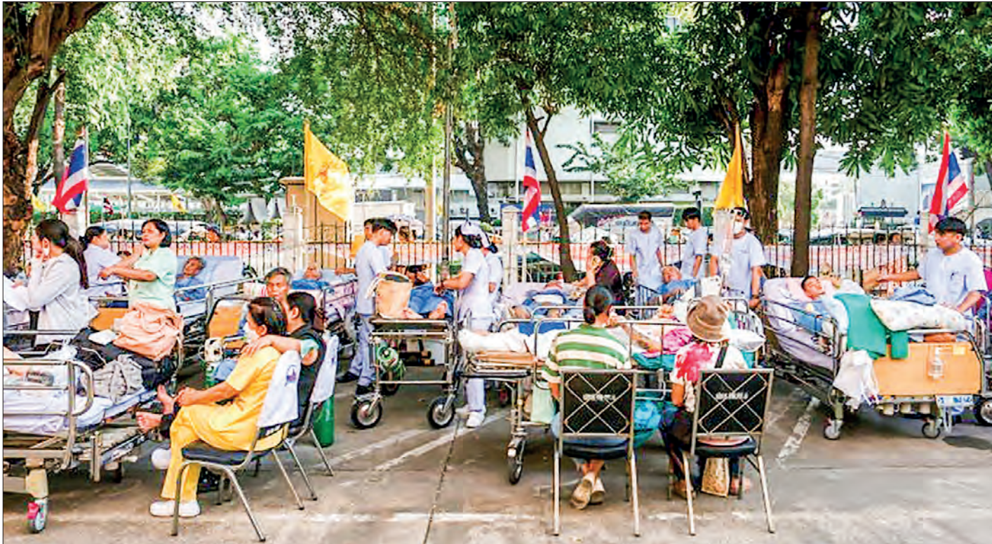
Patients lie on beds in the compound of Bangkok's Phramongkutklo Hospital following the earthquake.