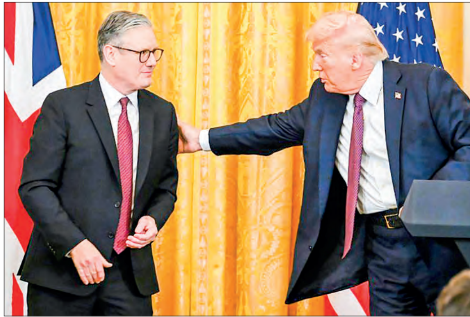
US President Donald Trump (R) holds a press conference with British Prime Minister Keir Starmer in the East Room of the White House in Washington, DC, on 27 February 2025.

She announced 14 billion pounds (about US$18 billion) in spending cuts and welfare reforms to restore the government's previously projected surplus of 9.9 billion pounds (about US$12.82