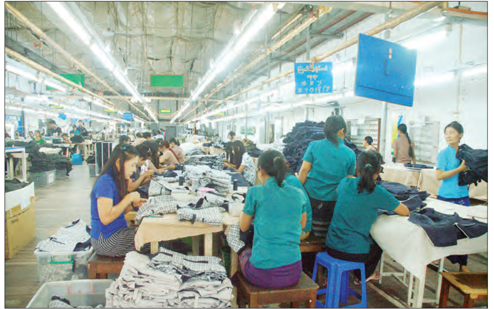
Female workers are seen working at a foreign-invested garment factory in Yangon Region.

Moreover, the existing businesses are also found to increase capital and labour force. The regional investment committee has been endorsing investment projects in conformity with rules and regulations under Myanmar Investment Law to spur investments and create more job opportunities. — ASH/KK