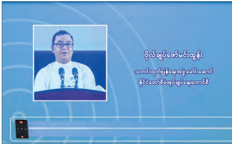
SAC Information Team Leader Maj-Gen Zaw Min Tun.

AT 12:51 pm on 28 March, an earthquake with a magnitude of 7.7 on the Richter scale struck, centred 21 kilometres northeast of the Mandalay Seismological Station. In response to the impact of this earthquake, the National Disaster Management Committee has declared a state of emergency in the affected areas, including Sagaing Region, Mandalay Region, Magway Region, northeastern Shan State, Nay Pyi Taw Council Area, and Bago Region. The government will promptly carry out investiga-