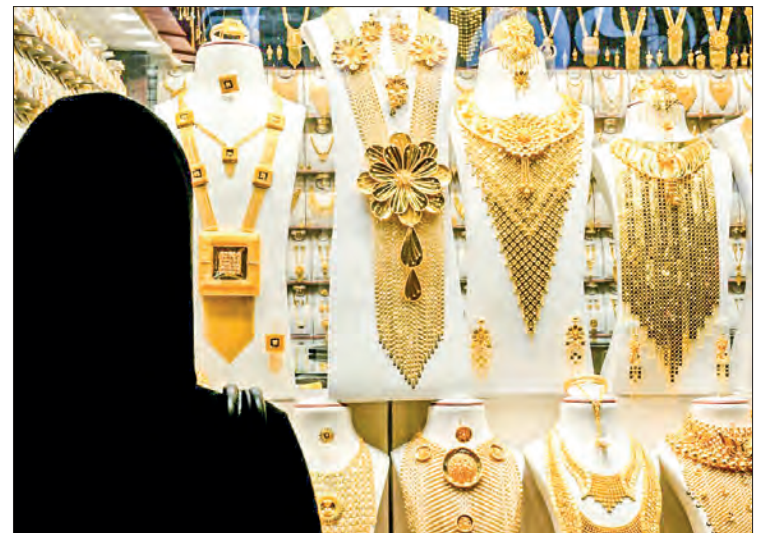
Sudanese economist Abdelazim al-Amawy stated that demand for the country's vast gold reserves is a key factor in prolonging the war.