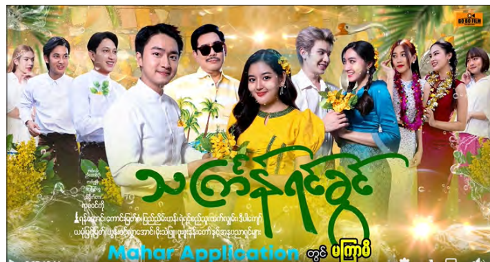
This image depicts a poster for the film and its scenes.