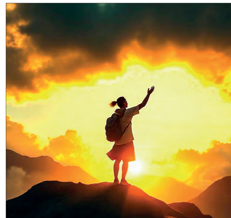
The interconnection between life, wisdom, and human capital development is crucial for fostering individual well-being and collective prosperity. ILLUSTRATIVE IMAGE: CONCEPT ART

Wisdom is the process of understanding cause and effect — a transmission of knowledge, experience, and thought that illuminates the human condition. It functions as a beacon, guiding individuals through the complexities of existence. We gain knowledge from learning and education. Education extends beyond formal instruction; it is a lifelong process of learning and self-discovery. In the