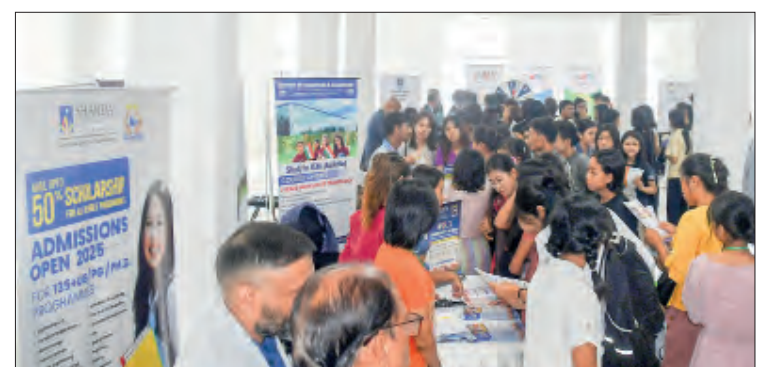
Education enthusiasts flock to the fair.

Students, parents, and the public attended the opening ceremony of the education fair, where education service associations explained how they facilitate access to world-class education at a reasonable cost. The India Education Fair will be held for two days, from 10 am to 5 pm, until 29 March. — Kyaw Kyee/MKKS