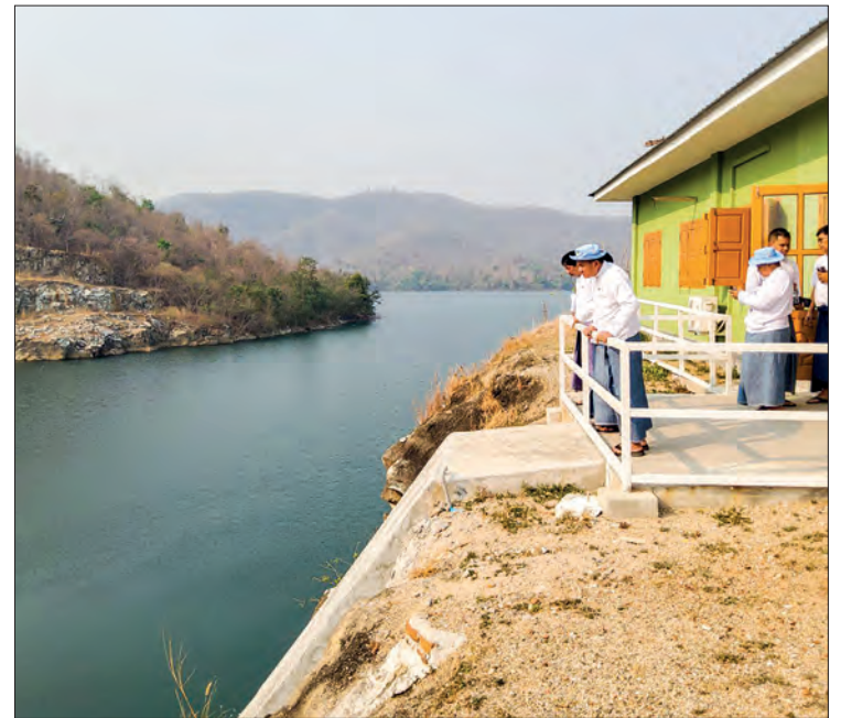
Inspection of reservoirs in Nay Pyi Taw Union Territory underway.

The authorities have warned that the Sagaing Fault is one of the most geologically dangerous areas in Myanmar, and it is important to be prepared for the risk to be reduced by building earthquake-resistant buildings and educating the public about earthquake hazard protection.