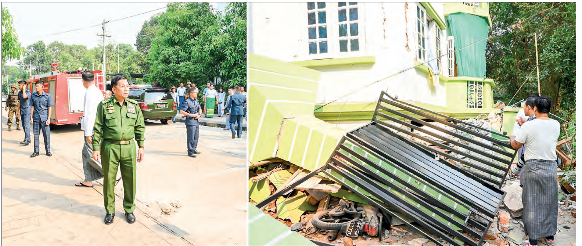
State Administration Council Chairman Prime Minister Senior General Min Aung Hlaing observes damage and debris after powerful earthquake in Nay Pyi Taw Council Area.

A T 12:51:02 pm on 28 March, a very strong earthquake with a magnitude of 7.7 on the Richter Scale struck, centred at a depth of 10 kilometres. The epicentre was approximately 21 kilometres northeast of the Mandalay seismic station and about 20 kilometres northeast of Mandalay City, at coordinates 22.09° North Latitude and 96.23° East Longitude. Following the main quake, about three aftershocks