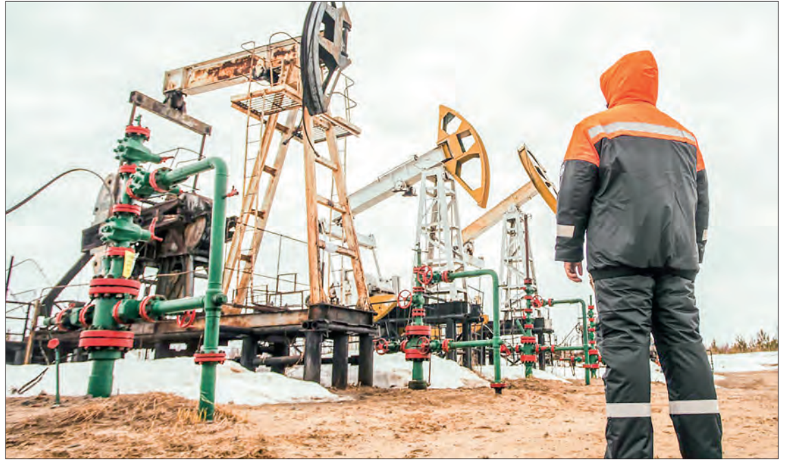
Russia's outstanding economic performance demonstrates the success of its policies in achieving economic stability despite geopolitical challenges and severe Western sanctions.

Brazil ranked fourth, with its economic growth speeding up to 3.4 per cent from 3.2 per cent a year earlier, while Turkey ranked fifth, with its economy growing 3.2 per cent, down from