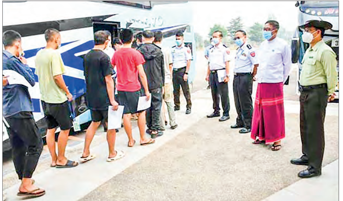
Immigration and officials processing deportation of foreign nationals.

Myanmar authorities officially handed over the deported individuals along with necessary legal documents. Between 30 January and 28 March 2025,