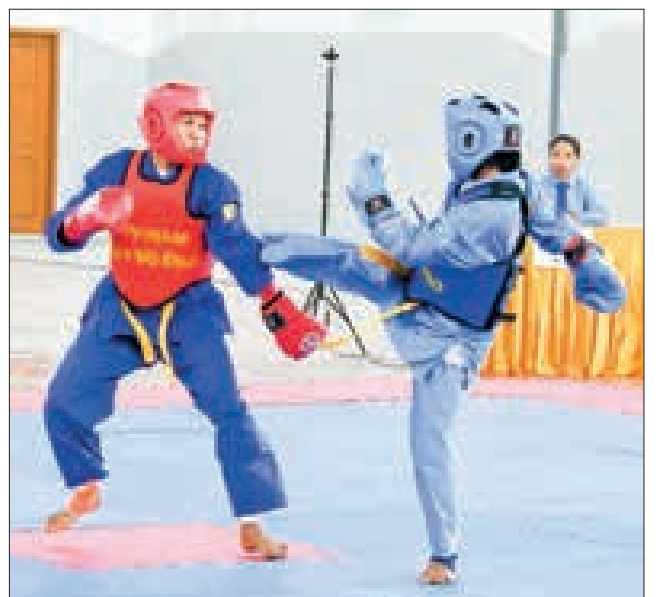
ISR Boinam competitions are underway at the Fifth National Sports Festival in Nay Pyi Taw yesterday.