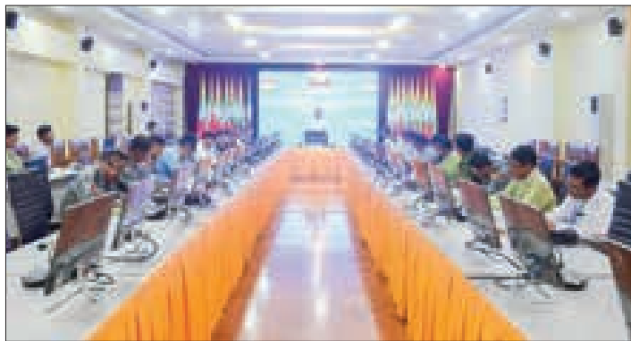
The coordination meeting to resettle Loikaw returnees in progress yesterday.

In his opening remarks, U Zaw Myo Tin stated, "Due to the destructive actions of terrorist, it is essential for relevant authorities to work together systematically to ensure the safe and smooth return of displaced individuals to their hometowns. A well-structured plan is needed to address security and administrative matters effectively. The state government will render necessary assistance to returnees, including access to clean