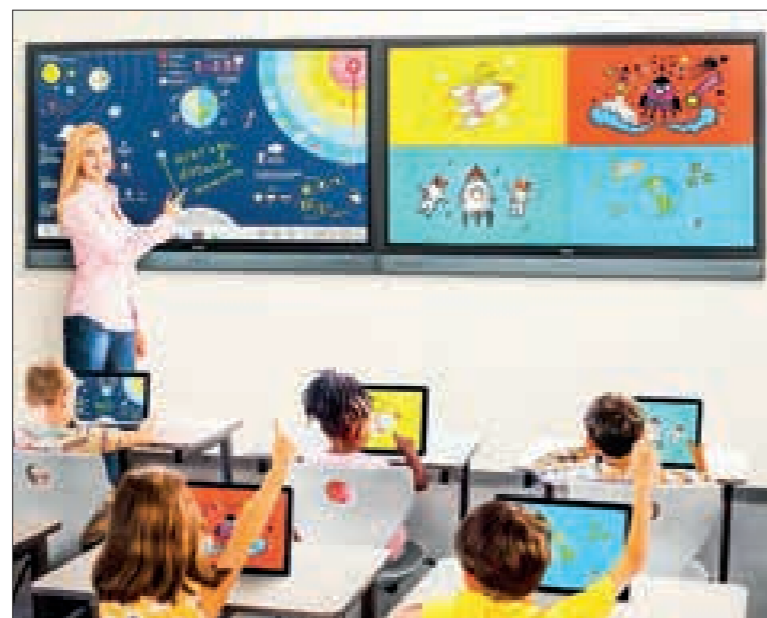
When considering instructional media, materials (e.g., still pictures) and equipment (e.g., projector, bulletin board) work together to create an effective medium.

T EACHING aids or instructional media are a powerful tool for the teacher for his students' learning. Broadly speaking, a teaching medium is any person, material or event that establishes conditions which enable the student to require knowledge, skill and attitude. In this sense, teachers, textbooks and the school environment are all instructional media. Since media are also defined as the graphic, photographic, electronic or mechanical means for arresting, processing and reconstituting