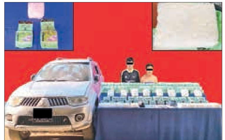
Offenders are seen alongside a seized vehicle and drugs.

Action has been taken against perpetrators, and an ongoing investigation is underway to apprehend others involved in the case. — MNA/MKKS