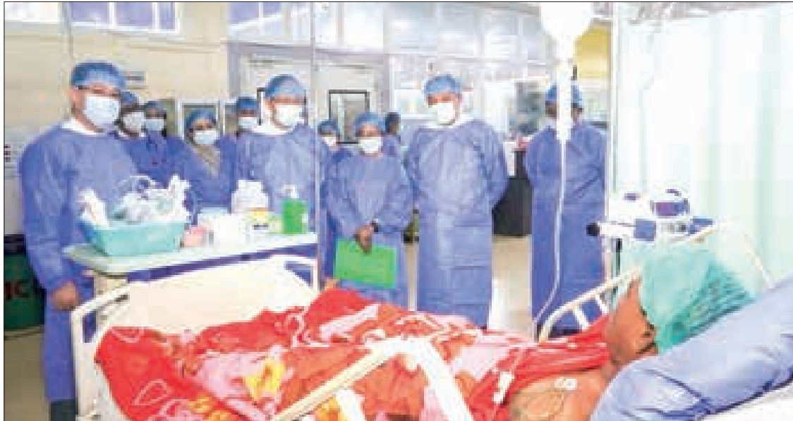
Union Minister Dr Thet Khaing Win encourages the patient and donor following Nay Pyi Taw's first Kidney transplant yesterday.

The kidney transplant operations are conducted every month at Yangon Speciality Hospital (500-bed), and the Ministry of Health arranges to perform