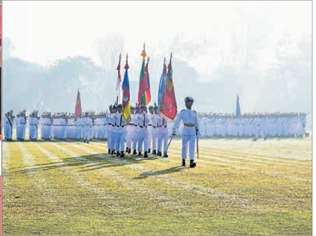
State Administration Council Chairman Commander-in-Chief of Defence Services Senior General Min Aung Hlaing returns the salute of cadet companies during the passing-out parade of the 26 th Intake at the Defence Services Technological Academy in PyinOoLwin yesterday.