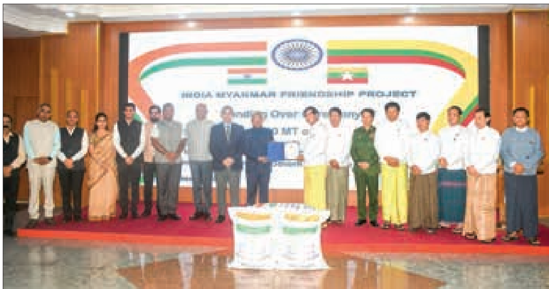
A commemorative group photo from the handover ceremony of 2,200 tonnes of rice donated by the Indian government in Yangon yesterday.

"The donation of 2,200 tonnes of rice reflects the government of