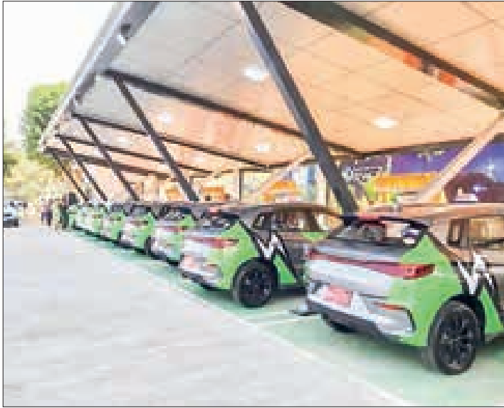
This photo showcases EV taxis that will be operated in Yangon.

E-CHOICE Taxi Co Ltd has announced plans to introduce electric vehicle (EV) taxis in Yangon, with a fleet of 100 EVs set to operate in 2025. To facilitate this, the company is in the process of registering imported EVs and applying