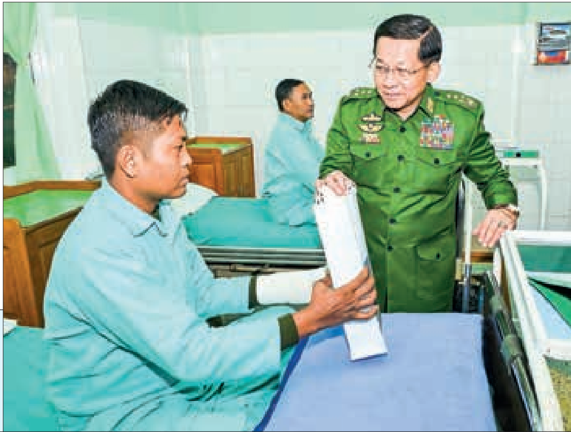
Senior General Min Aung Hlaing offers cash awards and foodstuffs to the patient.