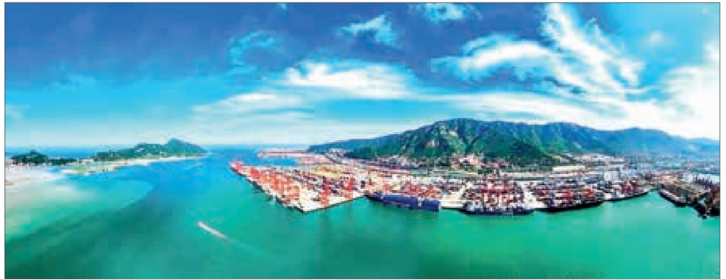
An aerial drone photo taken on 26 June 2024 shows freight ships docked at the container terminal of Lianyungang Port, east China's Jiangsu Province.

A smart microgrid at Lianyungang Port in Jiangsu, China, pioneers a zero-carbon port plan using advanced energy technologies.