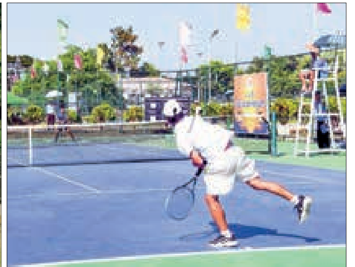
Bago versus Ayeyawady in ISR Tennis competition.