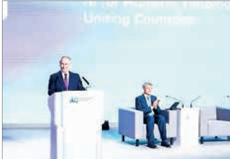
The President took part in AI Journey, an annual international conference on artificial intelligence and machine learning taking place in Moscow from 11 to 13 December.