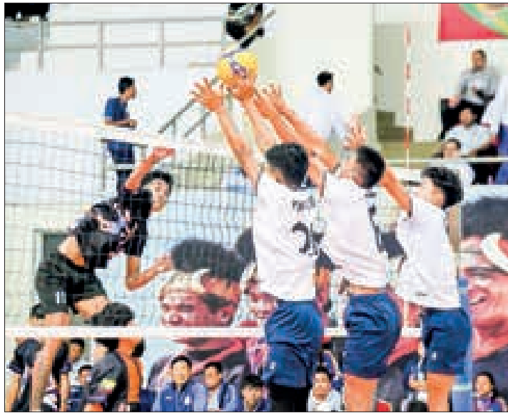
Mandalay versus Shan in the ISR Men's Volleyball.

The Inter-State and Region Under-21 Men's Football Championship group stage matches were held at the Wunna Theikdi Sports Complex, with teams from Mandalay Region and Kachin State drawing 1-1, while Yangon Region defeated Chin State 4-0, and Magway Region triumphed 1-0 over Mon State.