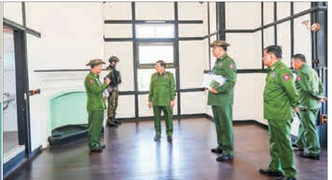
The Senior General inspects the maintenance work of Tatmadaw guesthouses.

they sustained while serving in the defence and security duties of the State.