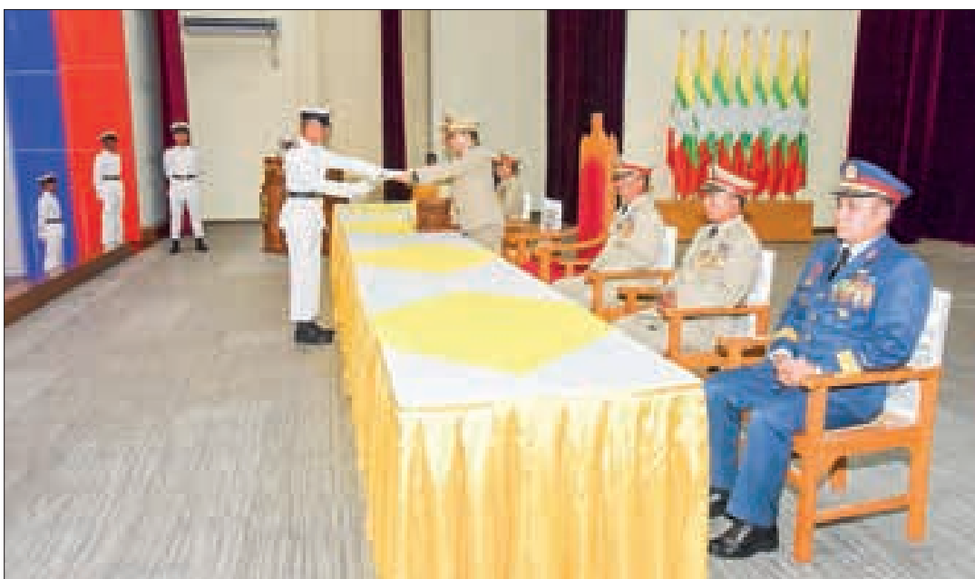
A graduate cadet receives their commissioning certificate.

THE commissioning ceremony for cadets of the intake 26 th from the Defence Services Technological Academy (DSTA) was held yesterday morning at the Academy's Convocation Hall.