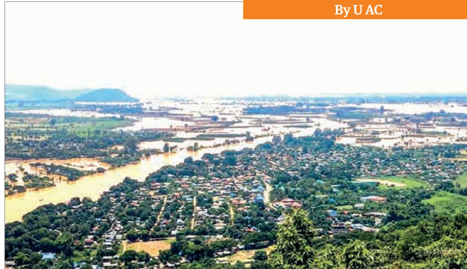
The eastern side of Nay Pyi Taw's greater region was submerged in water, a fact totally unheard of in the past. Photo taken on 16 September 2024 shows a flooded area in Nay Pyi Taw, Myanmar.

landslides and buries people and houses altogether. Our favourite destination Inn Lay was not spared either. The accumulation of torrent waters from the mountains surrounding the famous lake, resulted in a significant rise in water levels across the lakes, causing the houses on stilts to collapse and even the floating farms to be swept away across the lake. Most of the houses are underwater now, with only the roofs being visible from afar.