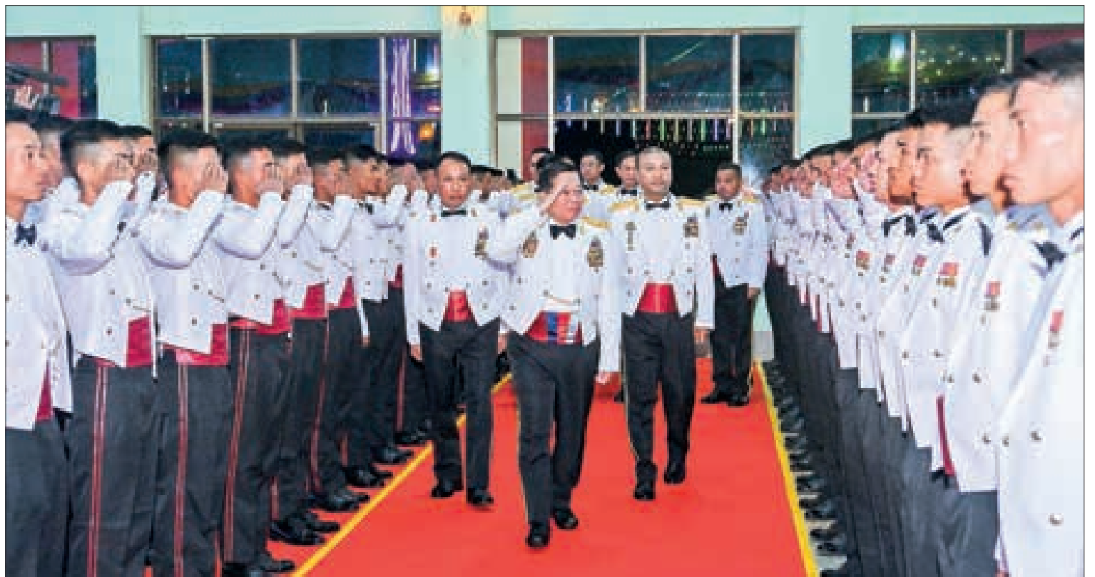
State Administration Council Chairman Defence Services Commander-in-Chief Senior General Min Aung Hlaing warmly greets graduate cadets during yesterday's dinner.