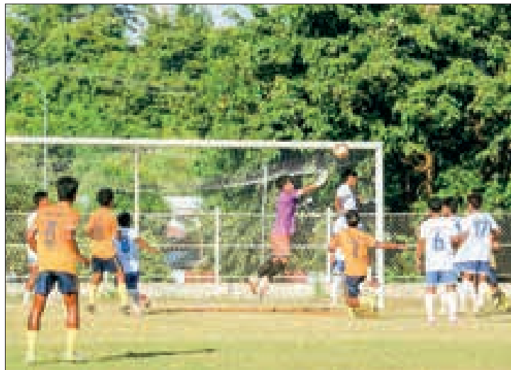
ISR Football tournament.