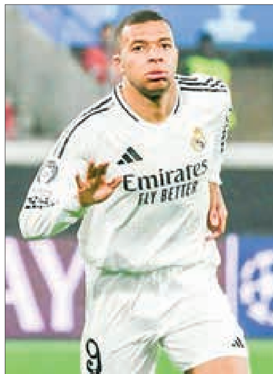
Kylian Mbappe moved to Real Madrid from Paris Saint-Germain this year.

Speaking for the first time about the case on Sunday, he told French television show Clique he was "not involved". — AFP