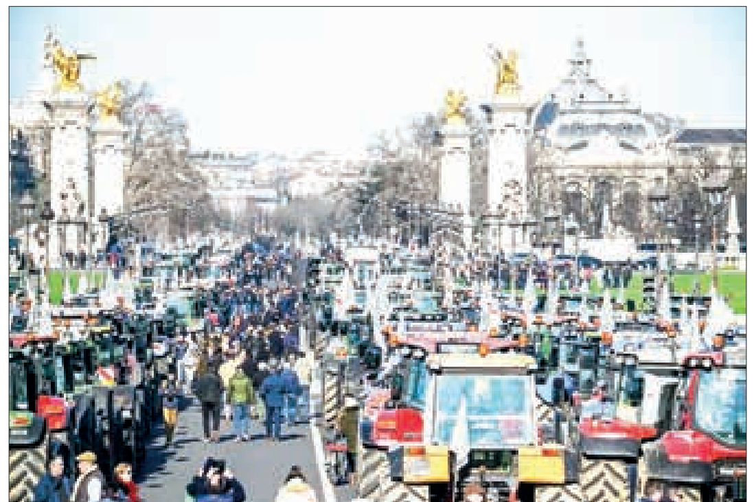
French farmers with their tractors gather at the Esplanades des Invalides during a protest organized by unions including FNSEA (National Federation of Farmers Union) against the EU pesticide ban and other environmental regulations they say will threaten agricultural production, in Paris, France.

European Commission President Ursula von der Leyen said last week that she had signed a political agreement with the South American trade bloc Mercosur in the Uruguayan capital Montevideo to create the world's largest free trade area with more than 700 million EU and South American consumers, despite protests from a number of EU countries led by France. — SPUTNIK