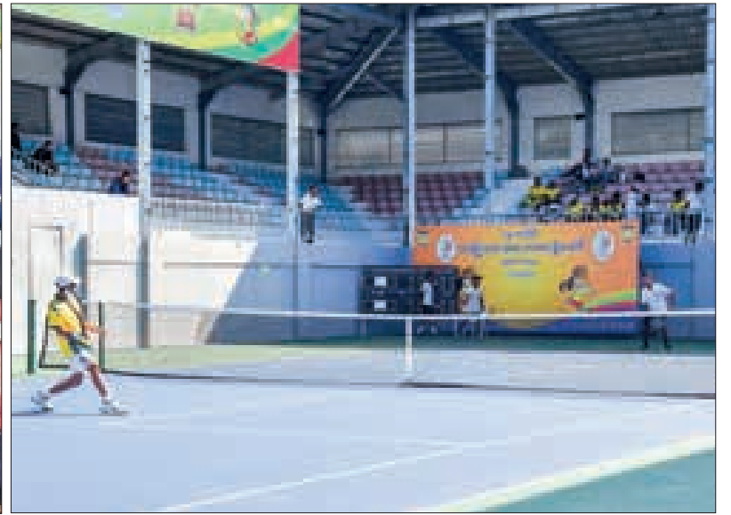
ISR Tennis match.

Football Group Stages, the Ministry of Planning and Finance team won 7-0 against the Ministry of Agriculture, Livestock and Irrigation, the Ministry of Sports and Youth Affairs defeated the Ministry of Natural Resources and Environmental Conservation 3-1, and the Ministry of Information won 2-0 over the Ministry of Energy.