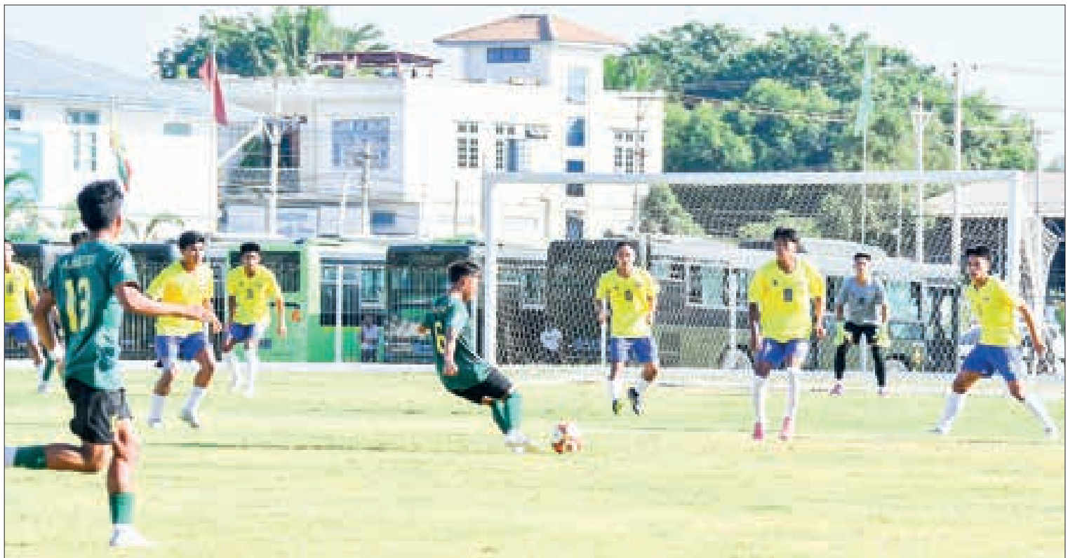
MoSYA versus MoNREC in the Inter-Ministerial Men's Football Tourney.