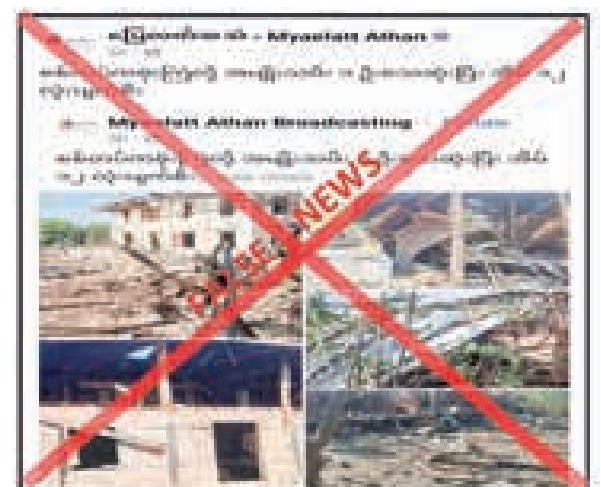
This screenshot validates misinformation.

In response to these reports, relevant security officials have clarified that the information is false. They confirmed that security forces consistently carry out necessary activities to ensure the people of Taungtha Township can live in peace. There were no bombings; instead, terrorists used drones and heavy weapons to instil fear in the people of villages and quarters that did not support them. The circulation of such false news by media outlets is intended to cover up terrorists’