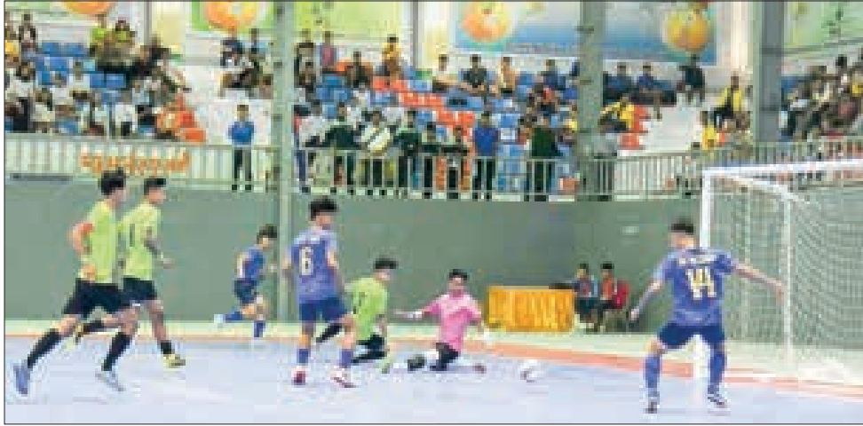
Inter-Ministerial Futsal match in action.