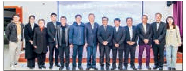
The documentary group photo taken during the visit Deputy Minister Dr Aung Zeya-led Myanmar delegation.

DEPUTY Minister for Science and Technology Dr Aung Zeya led a delegation to Kunming, Yunnan Province, China, on 9 December to enhance cooperation in science and technology in commemoration of the 75 th Anniversary of China-Myanmar Diplomatic Relations in 2025.