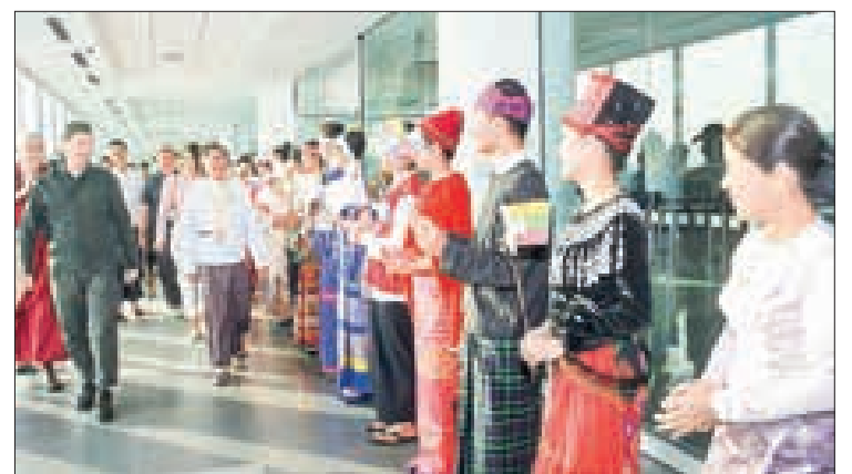
The photo captures the Russian Kalmykia Republic delegation being seen off at Mandalay International Airport.