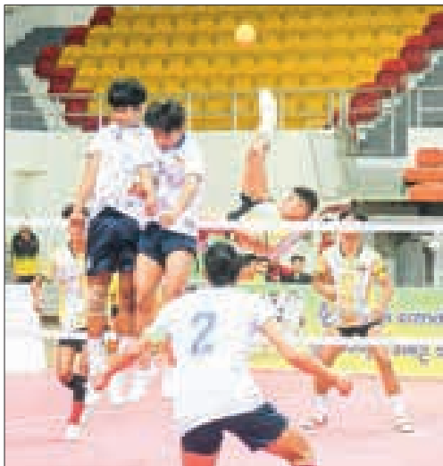
ISR Sepak Takraw.

ranking first in the ministry-level sports events. The Ministry of Defence took two gold and one bronze, placing second, while the Ministry of Planning and Finance secured two silver, taking third. In the regional sports events, Yangon Region topped the chart with 26 gold, 11 silver, and 11 bronze, followed by Shan State with 13 gold, 14 silver, and 22 bronze in second, and Taninthayi Region with 11 gold, six silver, and 10 bronze in third. — MNA/KZL