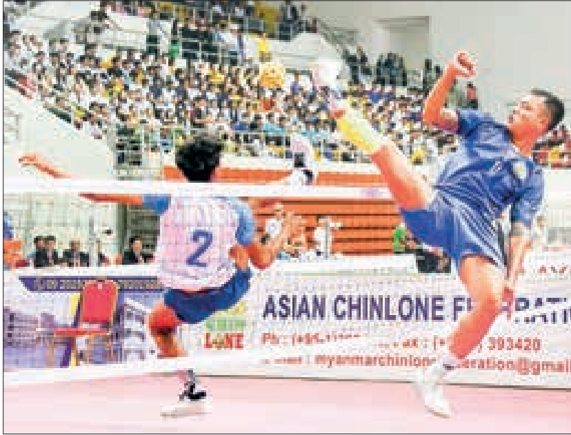
Inter-Ministerial Sepak Takraw matches between MoHA & MoD (left) and MoC and MoHT (right) yesterday.

namment, Mandalay Region triumphed over Shan State with a 3-1 victory. Mandalay secured first place, Shan State second, while Kayin State and Nay Pyi Taw shared third place. In the women's volleyball competition, Shan State defeated Taninthayi Region 3-0 to secure first place, with Taninthayi Region in second and Kachin State and Mandalay Region sharing third place.