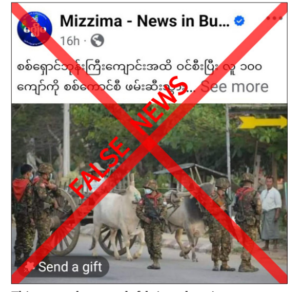
This screenshot reveals fabricated stories.

FALSE reports were circulated by malicious news media claiming that around 100 displaced persons were arrested by security forces at Nyaunglebin Village Monastery, Ngazun Township, Mandalay Region.