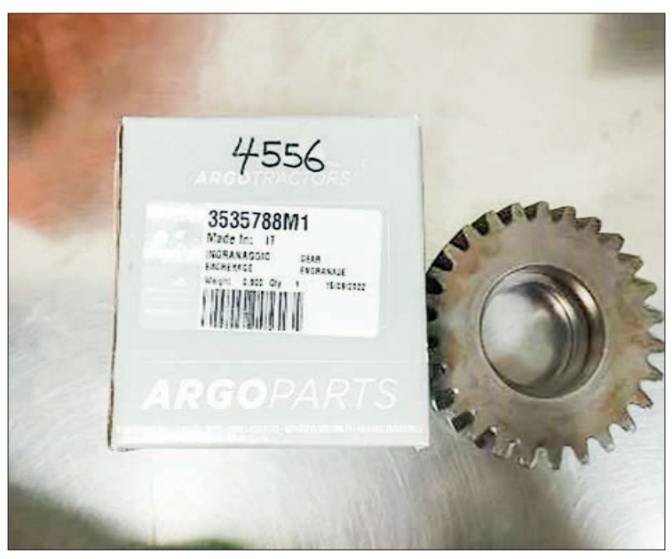
Seized illegal items in different states and regions.

On 9 October, the combined on-duty teams captured a Mitsubishi Fuso truck and a Toyota Dyna truck (worth approximately K55 million) carrying jewellery worth K89.952 million without official documents in Pyigyidagun Township, a Nissan Diesel truck (worth approximately K35 million) carrying 25 kinds of motorbike spare parts and two kinds of consumer goods valued at K33.504 million without official documents at the checkpoint in Singaing Township. The action