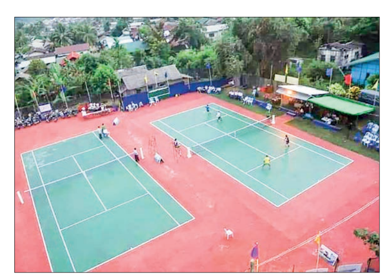
The tennis tournament in action marking the 110th anniversary of Dunlop courts on 9 October 2024 in Myeik.