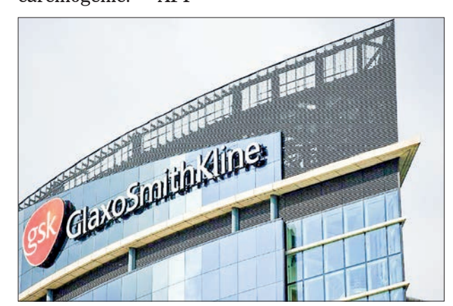
British pharmaceutical company GSK.

However the pharmaceutical giant said it "has not admitted any liability" by settling the case as "the scientific consensus remains that there is no consistent or reliable evidence" that ranitidine is carcinogenic. — AFP