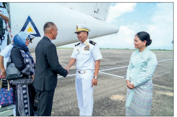
Photos showcase ASEAN navy chiefs and delegates being welcomed upon their arrival at Nay Pyi Taw Airport.