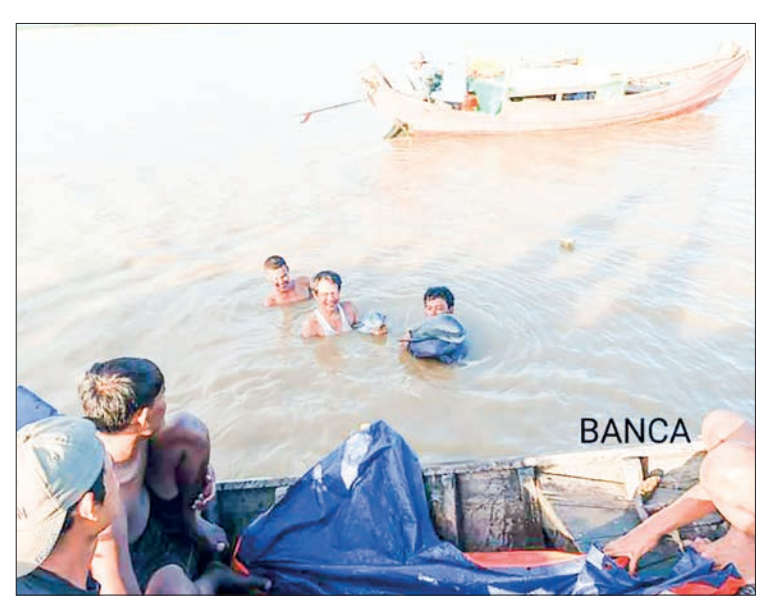
Photos show the attempt to save the Irrawaddy dolphin mother and its baby.

BANCA has been active since 2004 to identify and conserve critically endangered spe-