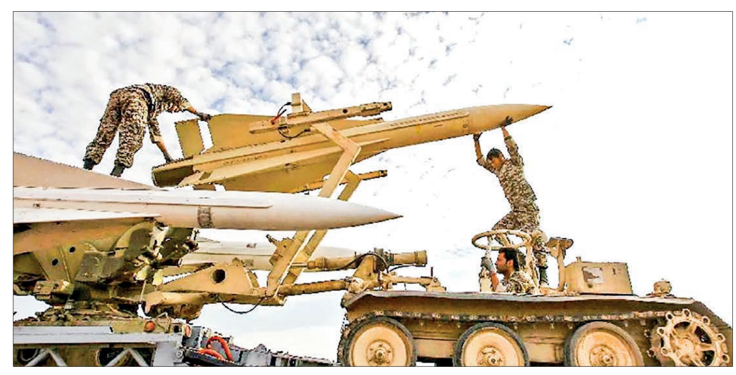
An Iranian military truck carries missiles during a 18 April 2018 parade in Tehran to mark the country's annual army day.

Despite Islamic law prohibiting nuclear weapons, this stance may be reconsidered, according to an official.