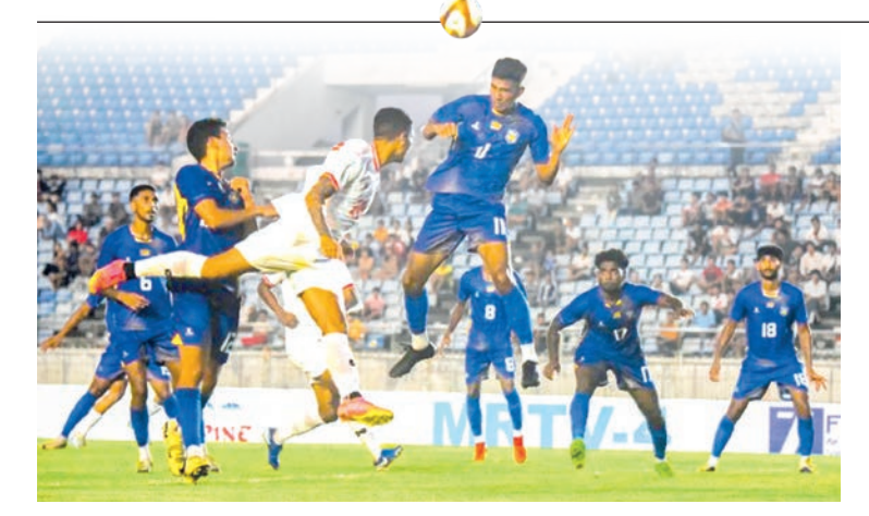
Myanmar and Sri Lankan teams in action during their first friendly match.