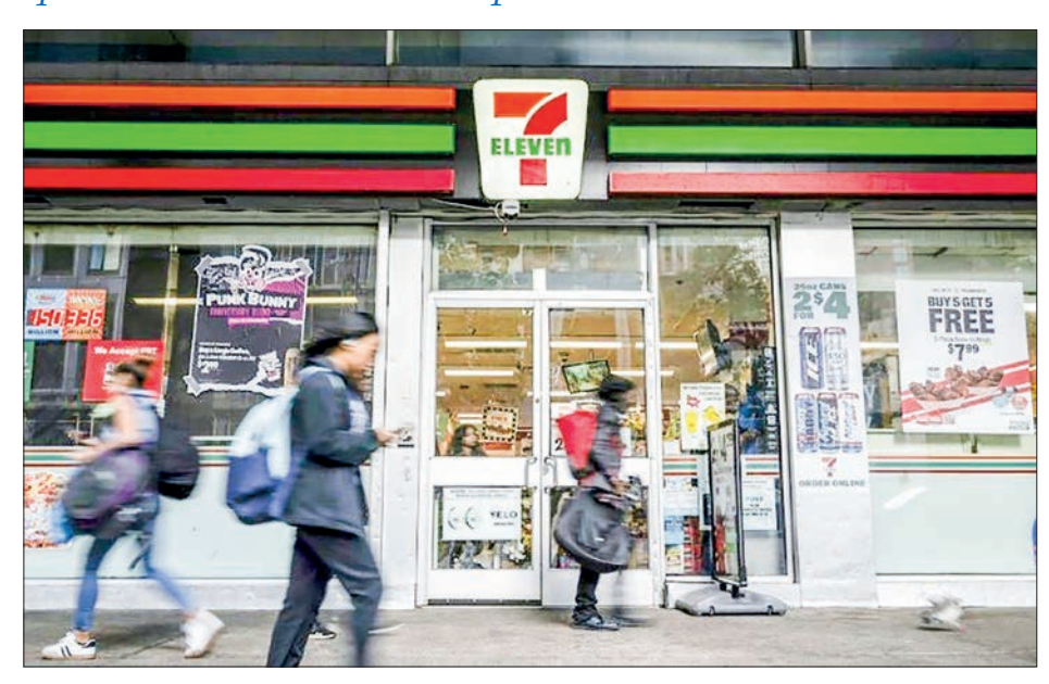
7-Eleven is the world's biggest convenience store chain.

7-Eleven is the world's largest convenience store chain, with over 85,000 locations globally, about a quarter of which are in Japan.