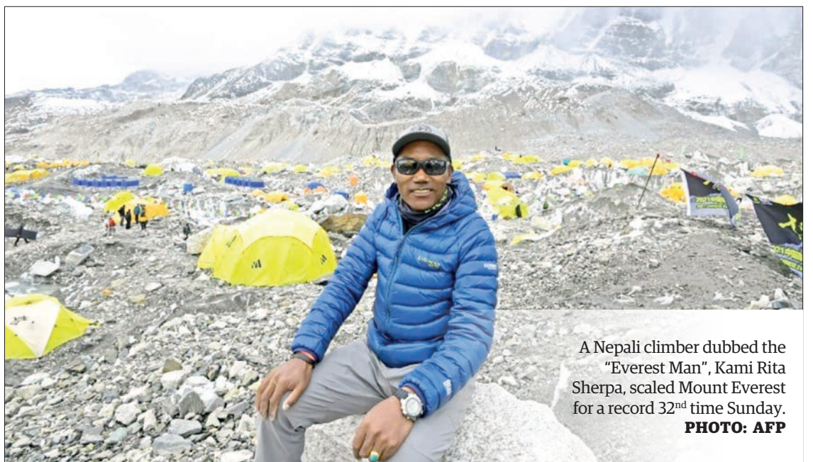
A Nepali climber dubbed the "Everest Man", Kami Rita Sherpa, scaled Mount Everest for a record 32 nd time Sunday.

Lhakpa Sherpa, 52, known as the "Mountain Queen", first stood on the top of Everest in 2000, becoming the first Nepali woman to successfully summit and descend the world's highest peak. — AFP