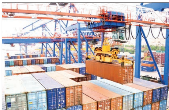
FESCO plans two-way trade flows, including Tanzanian tea, coffee and agricultural exports to Russia.