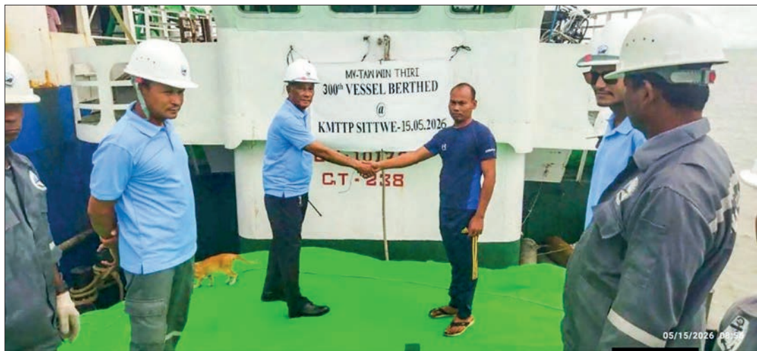
MV Taw Win Thiri is seen arriving at Sittway Port in Rakhine State as the 330 th vessel to dock at the port.

The Kaladan River Basin Development Project is a joint cooperation project with India and is expected not only to improve connectivity between Myanmar and India, but also to further promote bilateral trade between the two countries.— ASH/KNN