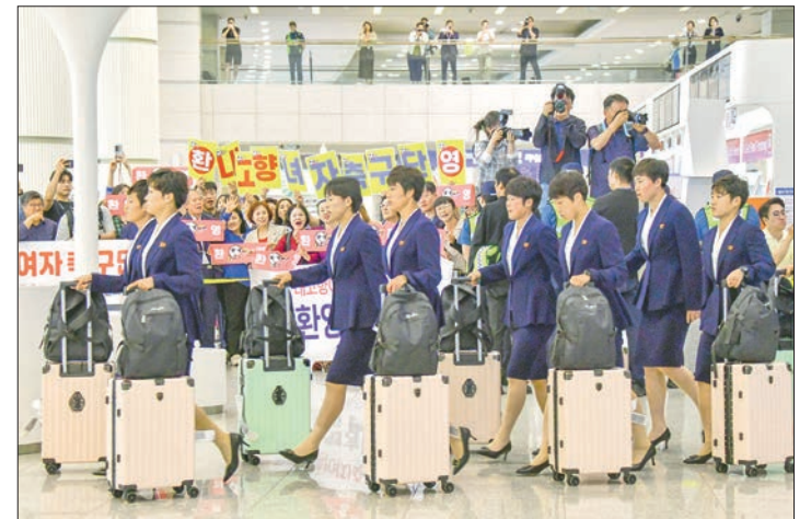
Players of North Korea's Naegohyang Women's FC board a bus after arriving at Incheon International Airport in South Korea on 17 May 2026.

The 37-year-old Dubliner had withdrawn from a planned comeback fight in June of 2024 with a toe injury. McGregor has dealt with multiple issues outside the Octagon. — AFP