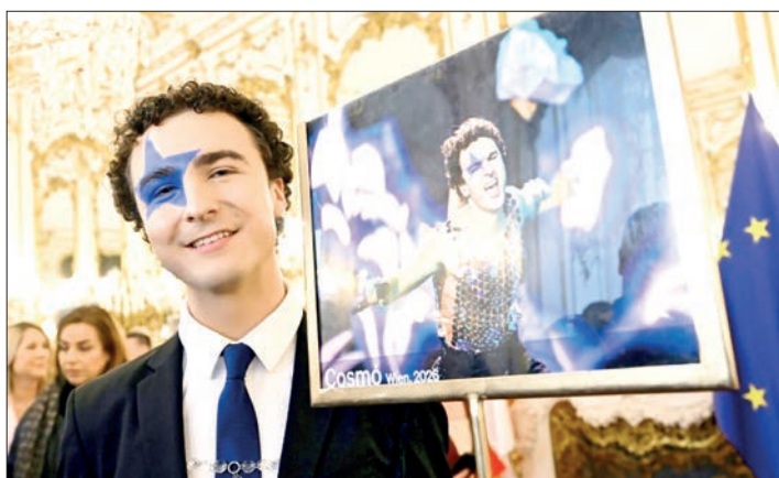
Austrian-Hungarian singer Benjamin Gedeon, aka Cosmo, represents Austria at the 2026 Eurovision Song Contest.

the Netherlands, Slovenia and Iceland withdrew from this year's competition, marking an unprecedented rupture. — Xinhua