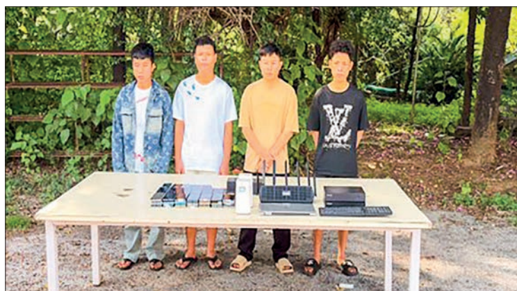
Suspects were arrested along with mobile phones, computers and other accessories.

THE Myanmar Government is giving serious priority, as a matter of national responsibility, to combatting online scams and gambling activities that pose threats worldwide. In order to prevent such operations from taking root within Myanmar, the authorities are actively cooperating not only with domestic organizations but also with neighbouring governments through coordinated efforts.