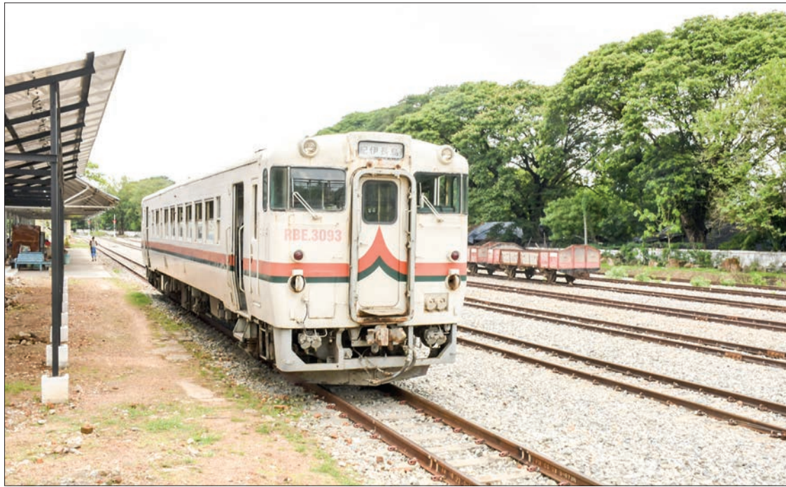
This photo shows a RBE train of Myanmar Railways.

As a result of this expansion, train services are being operated daily on the Nay Pyi Taw-Toungoo and Toungoo-Nay Pyi Taw sections. The RBE Down train departs from Nay Pyi Taw Station at 6 am and arrives at Toungoo Station at 8:25 am. The RBE Up train departs from Toungoo Station at 2 pm and arrives at Nay Pyi Taw Station at 4:25 pm.