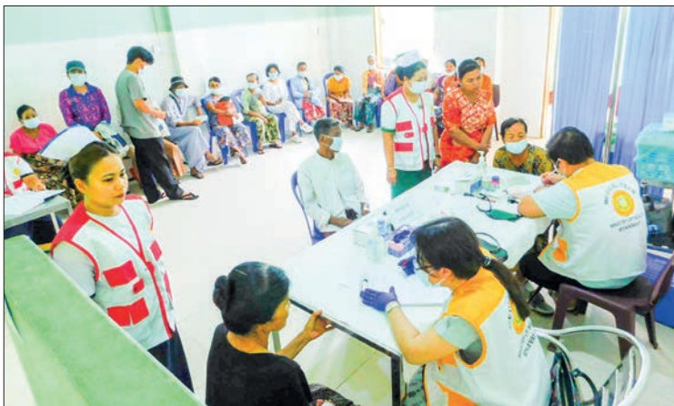
The specialist medical team from Hlinethaya People's Hospital is seen at Htantabin Township People's Hospital on 16 May.

Officials from township, head of the township Medical Services Department and members from civil social organizations arranged the necessary support measures.