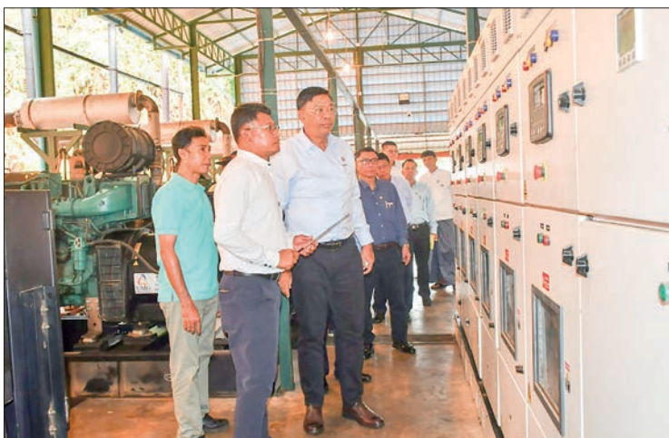
Taninthayi Region Chief Minister U Zaw Naing Oo inspects the workplace of electricity distribution in Kawthoung.

TANINTHAYI Region Chief Minister U Zaw Naing Oo inspected ongoing development works at Kawthoung Airport yesterday morning and instructed officials to ensure timely completion of the project in line with set standards and specifications.