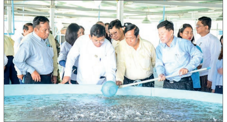
Ayeyawady Region Chief Minister U Aye Kyaw observes the experimental fish farm of Global Earth Agro & Aqua Industry Public Co Ltd in Phayachaung Village-tract, Pantanaw Township, Maubin District, yesterday.

AYEYAWADY Region Chief Minister U Aye Kyaw inspected the operations of Global Earth Agro & Aqua Industry Public Co Ltd in Phayachaung Village-tract, Pantanaw Township, Maubin District, yesterday morning.