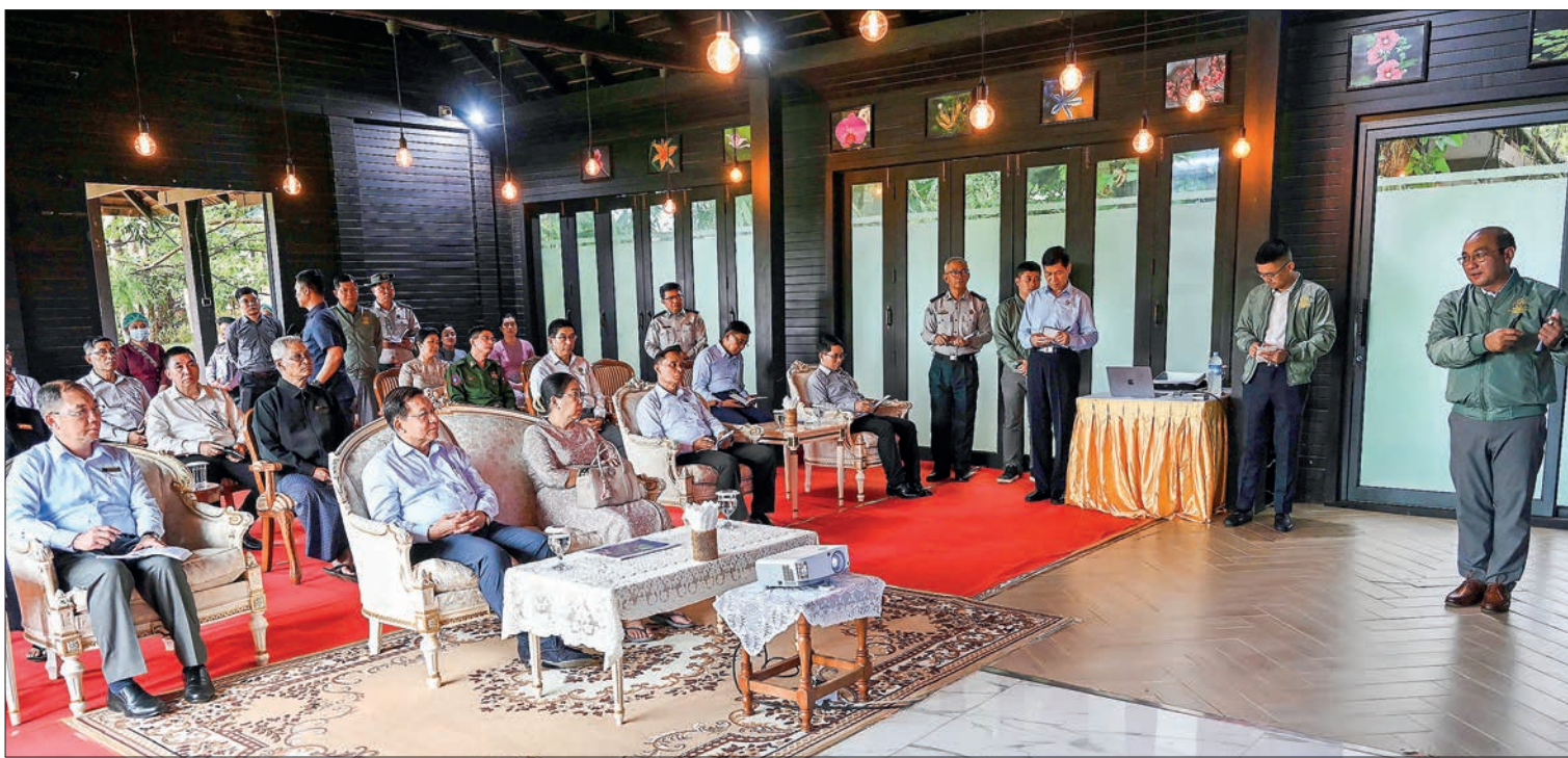
President of the Republic of the Union of Myanmar U Min Aung Hlaing hears the report on the National Kandawgyi Gardens upgrade works from an official in PyinOoLwin yesterday.

President of the Republic of the Union of Myanmar, U Min Aung Hlaing, conducted an inspection tour of several key sites in PyinOoLwin, including the Pwekawk Waterfall recreation resort (BE Falls), Thumingala Market, the National Kandawgyi Gardens, and the Anisakhan Airfield.