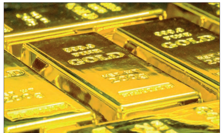
The gold deficit represents the financial gap caused by India importing far more gold than it exports, which surged by US$2 billion in April 2026 due to skyrocketing global prices and heavily pressured the country's overall trade balance.

The core deficit, excluding oil and gold, deteriorated to US$13 billion from US$9 billion, driven by higher shortfalls across chemicals, electronics, ores and agriculture. "The electronics deficit rose by US$0.7 billion to an all-time high of US$7.6 billion," Nuvama said, highlighting it as the key driver of the broader widening. Exports showed a rebound on a weak base, with goods exports expanding 14 per cent YoY in April after contracting 7.4 per cent in March. On a trend basis, export growth improved to 1.6 per cent from -2.8 per cent, though Nuvama described the underlying momentum as still subdued. — ANI