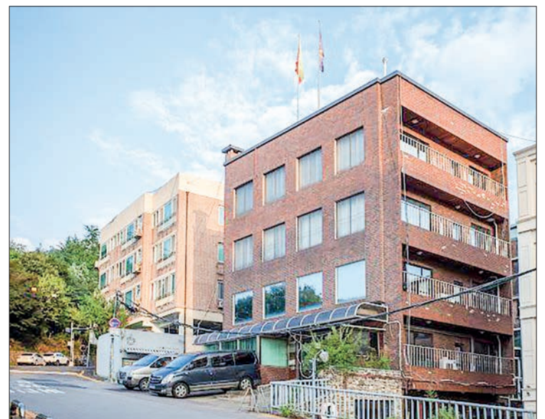
The Myanmar Embassy in Seoul, the Republic of Korea.

Requirements for PE extension include originals and copies of acceptance letter, score report of the latest test, evidence for school fee payment and the enrolment letter, it stated. — MT/ZS