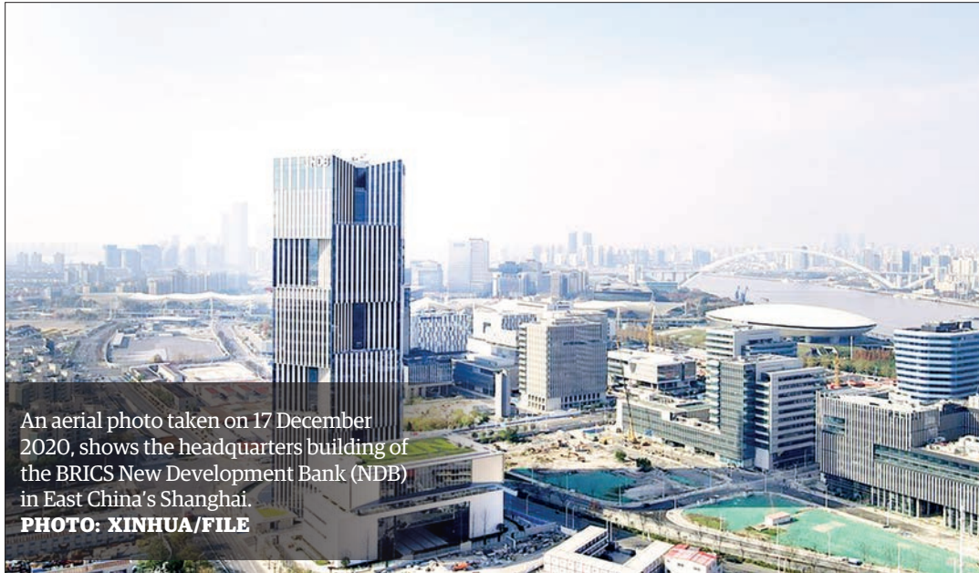
An aerial photo taken on 17 December 2020, shows the headquarters building of the BRICS New Development Bank (NDB) in East China's Shanghai.