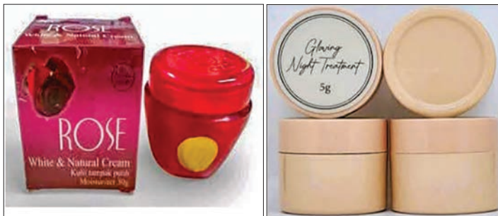
Some of the cosmetic products declared unfit for public use.

The three cosmetic products are: Glowing/Night Treat-