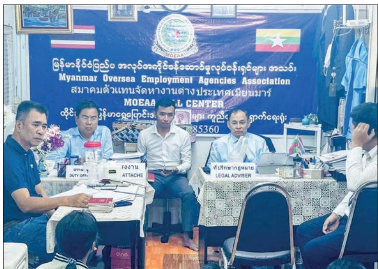
Officials from the Labour Attaché Office in Thailand held a mediation session at the MOEAA.

scam and gambling activities from being established within and prevent such operations Myanmar. — MNA/KZL