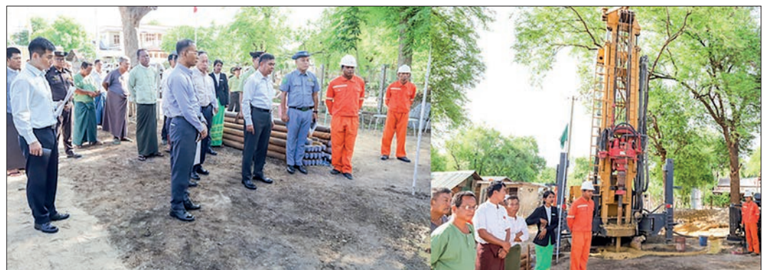
Union Minister for Border Affairs Lt-Gen Phone Myat observes the sinking of tube-wells in Kantaung village in Meiktila Township yesterday.

Subsequently, the Union minister inspected the tube-well sinking project and earth-pond renovation work in Ywashe Village, Wundwin Township, as well as the completed concrete road along the ascent route to Pyetkhayway Mountain in Kume Town. — MNA/TH