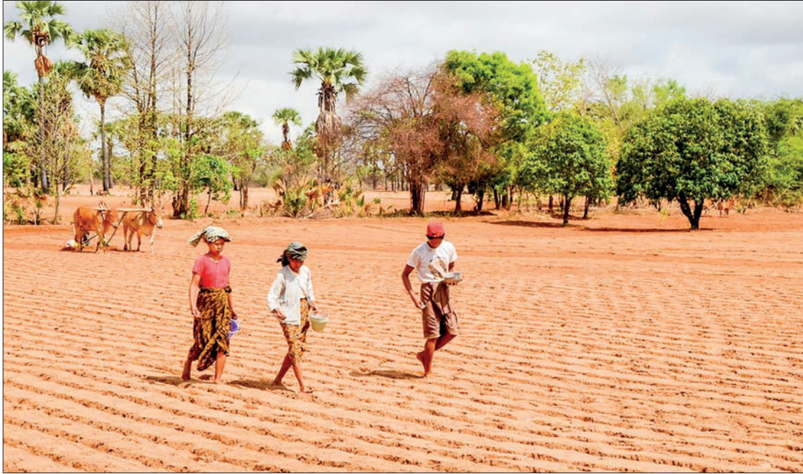
Farmers are seen in cultivation of crops in villages of Kyaukpadaung Township thanks to rain in late April and early May.

FARMERS in Kyaukpadaung Township have begun cultivating groundnuts, sesame, pigeon peas and green gram following the squalls that occurred on 28 April and the early monsoon rains that continued into early May.