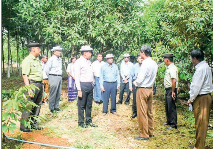
Mon State Chief Minister U Aung Win Than visits U Nyi Soe Wai's model rubber-based multi-crop plantation farm in Kyaikkaw Ward, Thuwunnawati Town, Thaton, on 17 May.

visited Basic Education High School No 2 in Thaton to review preparations for school enrolment activities, and travelled by RBE-2524 from Tha-