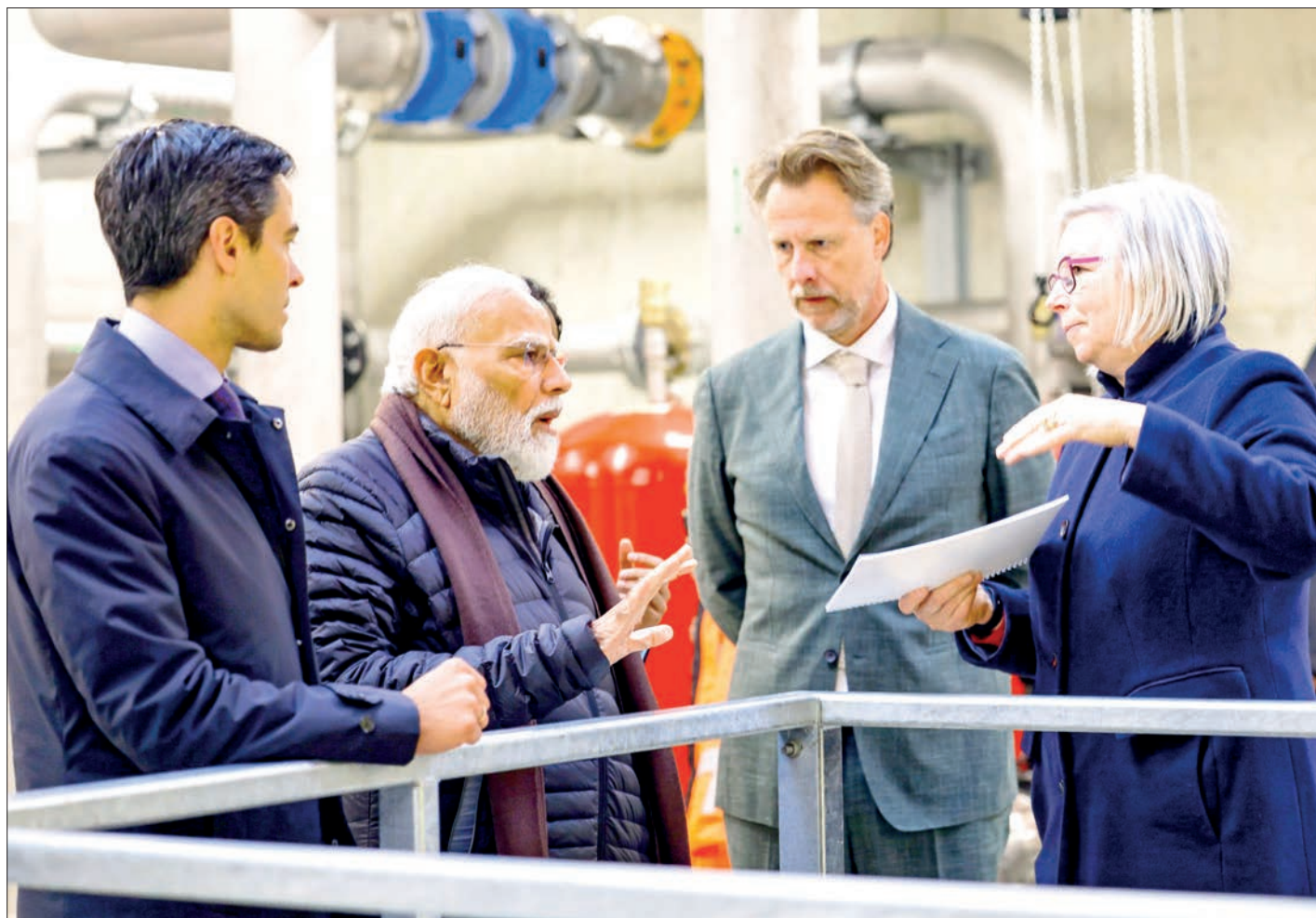
Prime Minister Narendra Modi along with Prime Minister of the Netherlands, Rob Jetten, visits Afsluitdijk dam, on 17 May.

Accompanied by Dutch Prime Minister Rob Jetten, PM Narendra Modi inspected the expansive barrier dam, which has shielded the low-lying European country from catastrophic flooding for decades.