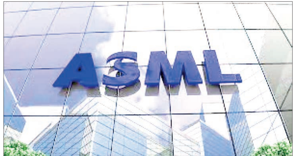
ASML is a Dutch multinational corporation and one of the leading suppliers for high-precision lithography equipment, a critical requirement in manufacturing of semiconductor chips.

PM Modi highlighted the partnership as an important step in India's journey for developing a semiconductor ecosystem in the country. In a post on X, he said that India's strides in the world of semiconductors offers immense