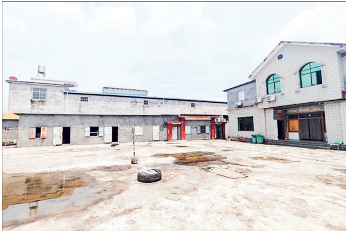
The seized buildings where online scam and gambling activities were committed in Muse, Shan State (North) yesterday.