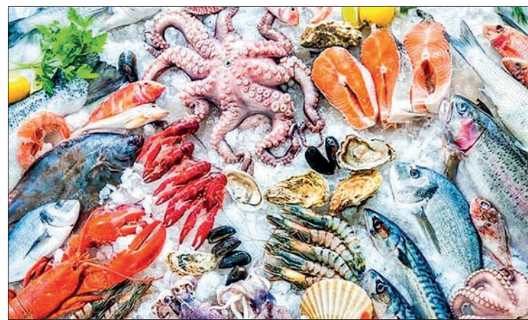
Seafood products seen in the market.

ACCORDING to the domestic seafood market, demand for frozen seafood has risen significantly due to the decline in the supply of fresh marine fish in the local market.