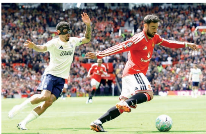
Bruno Fernandes equalled the Premier League record of 20 assists in a season.

"I want collective awards more than anything," said Fernandes. "But knowing that