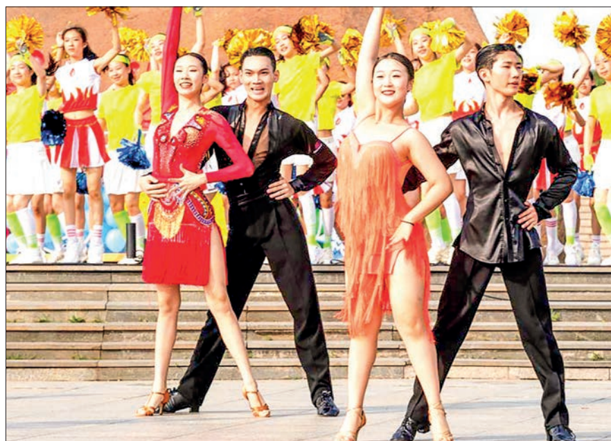
Dancers perform during a celebration event for Harbin's successful bid in Harbin, capital of northeast China's Heilongjiang Province on 8 July 2023.

THE torch, medals and anthem for the 2025 Asian Winter Games in Harbin were officially unveiled on Wednesday.