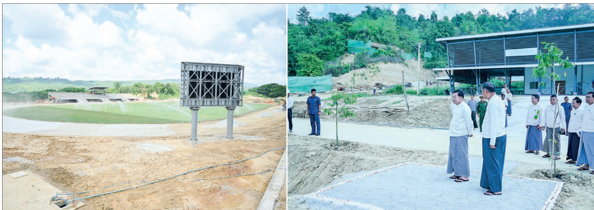
State Administration Council Chairman Prime Minister Senior General Min Aung Hlaing views the construction progress of the Naypyitaw State Polytechnic University yesterday.

(Excerpt from guidance given by Chairman of the State Administration Council Prime Minister Senior General Min Aung Hlaing to Shan State cabinet members and state-level departmental officials on 3 September 2024)