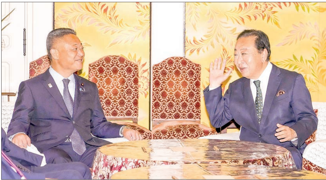
Yoshihiko Noda (R), head of the main opposition Constitutional Democratic Party of Japan, and Nobuyuki Baba, Japan Innovation Party head, are pictured in Tokyo on 30 October 2024, ahead of their talks as Noda seeks cooperation among opposition parties following the weekend's general election.

The opposition bloc remains divided, as the Democratic Party for the People (DPP), which significantly increased its seats, declined the CDPJ's invitation for leadership talks.