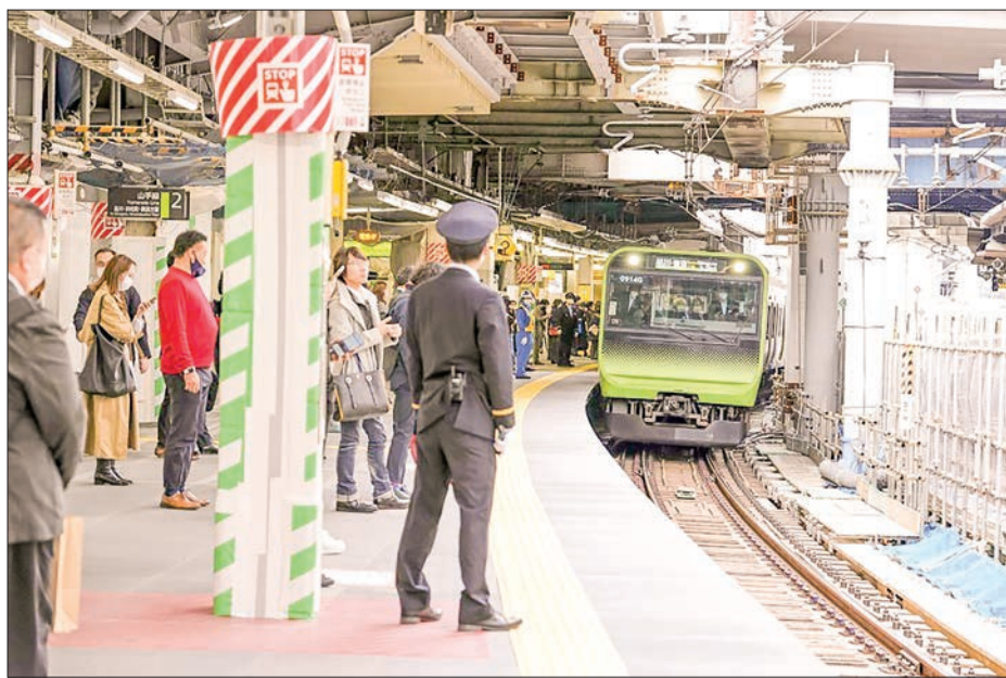
People wait on a platform as a train arrives at Shibuya Station in Tokyo on 25 October 2021.

The Uetsu Line's Murakami-Tsuruoka section experienced the largest loss at nearly 5 billion yen.