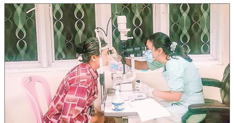
A patient undergoes examination at Pyinmana Sangha Hospital.