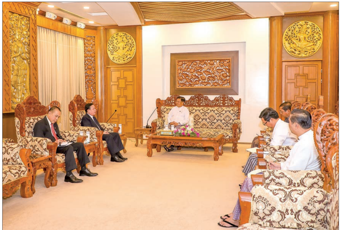
Deputy Prime Minister Union Minister for Foreign Affairs U Than Swe meets Lao Ambassador Mr Heuangseng Khamdalavong who is leaving Myanmar after completion of his tour of duty in Myanmar yesterday in Nay Pyi Taw.

During the farewell call, they reviewed the development of the existing traditional friendly relations. They candidly discussed matters on a wide range of issues pertaining to the potential for further strengthening the mutually beneficial cooperation, especially in the areas of trade and investment, tourism and people-to-people contacts between the two countries, as well as closer collaboration in both regional and multilateral arenas. — MNA