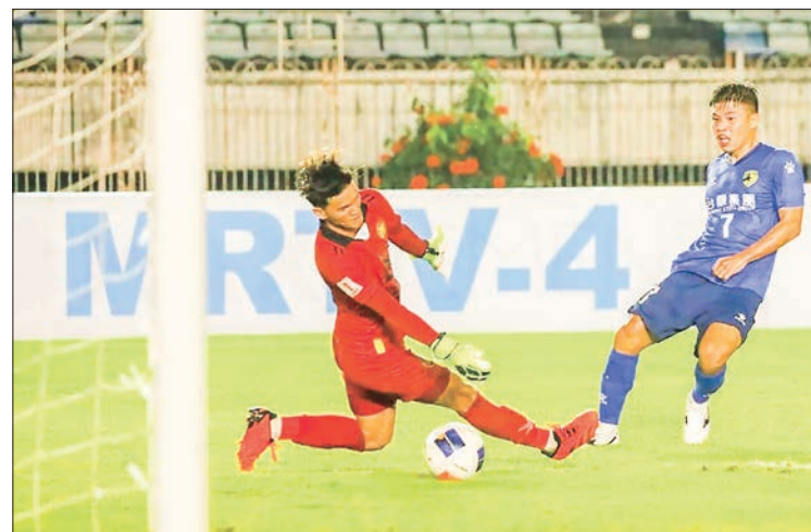
The Tai Nan City Team competes against Young Elephant.

In Group D, both Shan United and the Tainan City team have earned three points