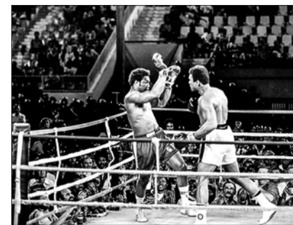
Muhammad Ali (R) goes toe to toe with George Foreman in the Rumble in the Jungle on 30 October 1974.