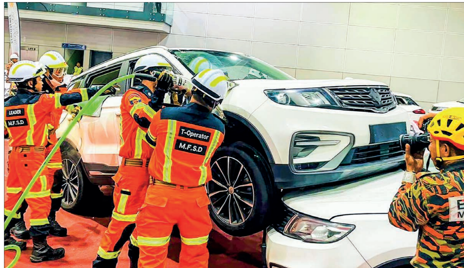
Myanmar participants competing in the rescue skills competition.

prizes in the International Rescue Extrication Challenge (MIREC) Joint Drill of the fifth International Fire Conference Exhibition Malaysia (IFCEM) 2024 hosted by the Fire and Rescue Department Malay-