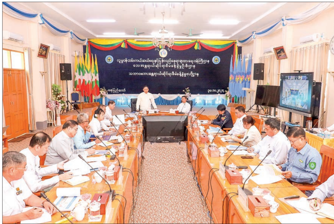
A coordination meeting of the Natural Disaster Management Centre in progress in Nay Pyi Taw yesterday.

Union Minister Lt-Gen Yar Pyae first said the SAC Chairman and Prime Minister announced that rehabilitation work in flood-hit areas should be carried out and completed on 15 March 2025. Requirements should be presented at the meeting for the National Disaster Management Committee to support the projects that have