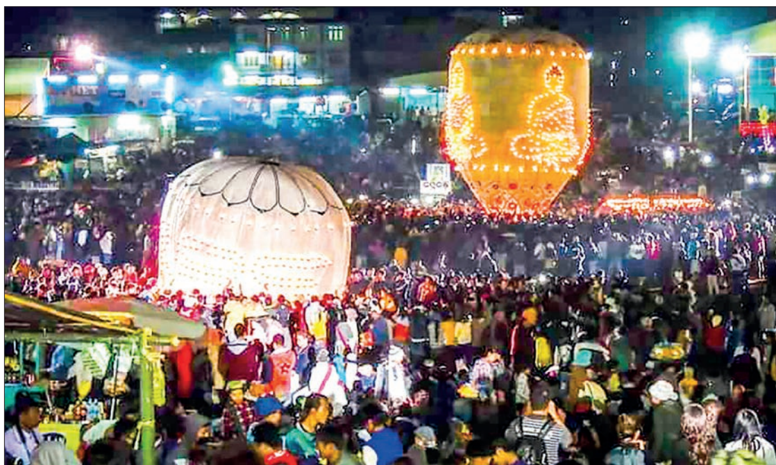
A vibrant scene from last year's hot-air balloon festival is seen with great enthusiasm.

ditional Hot Air Balloon Artistes Association stated, "This year, we are dedicated to preserving and showcasing our cultural traditions through the beauty and precision of hot air balloon displays and fireworks. We aim