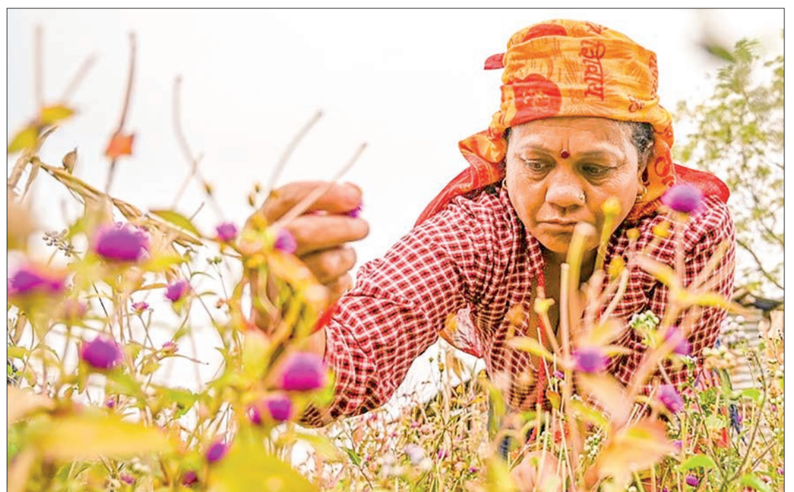
Nestled on the rim of Kathmandu Valley, the village of Gundu is renowned for supplying the brightly-coloured globe amaranth and marigold flowers.

The women of Gundu have turned this seasonal bloom