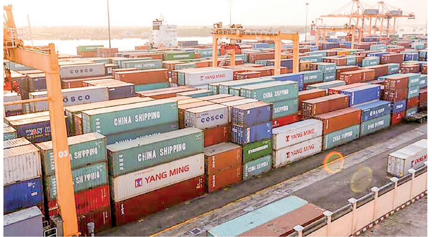
A bird's-eye view of containers from shipping lines at Yangon Port's container yard.

A total of 57 container vessels are scheduled to arrive at the Yangon Port in November, the Myanmar Port Authority announced.