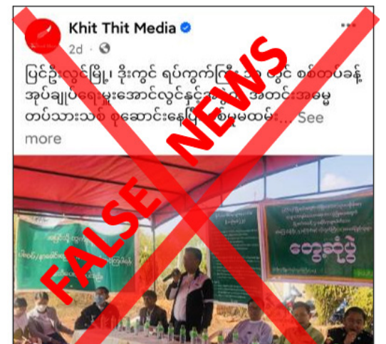
This screenshot reveals false claims.

Since the establishment of the People's Military Service Law, relevant authorities have been actively engaging in public awareness campaigns to inform citizens and enhance their understanding of the military service. Furthermore, state-run media outlets also work