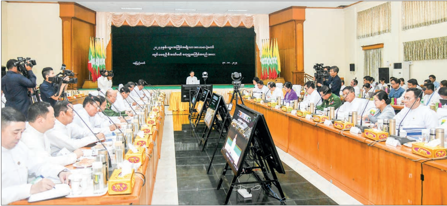
State Administration Council Vice-Chairman Deputy Prime Minister Vice-Senior General Soe Win chairs the fourth meeting of the Fifth National Sports Festival 2024 yesterday.