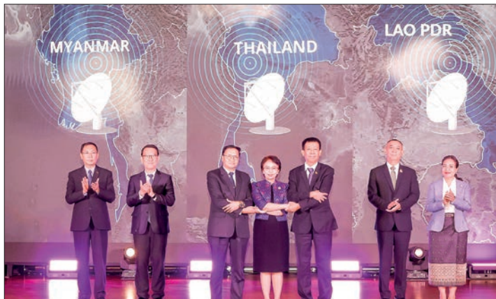
Participants, including Myanmar delegate Union Minister U Khin Maung Yi, pose for the documentary photo during the launch ceremony of the Joint Plan of Action-CLEAR Sky Strategy in Bangkok, Thailand, on 29 October 2024.

THE Myanmar delegation led by Union Minister for Natural Resources and Environmental Conservation U Khin Maung Yi attended the launch ceremony of the Joint Plan of Action-CLEAR Sky Strategy in Bangkok, Thailand, on Tuesday.