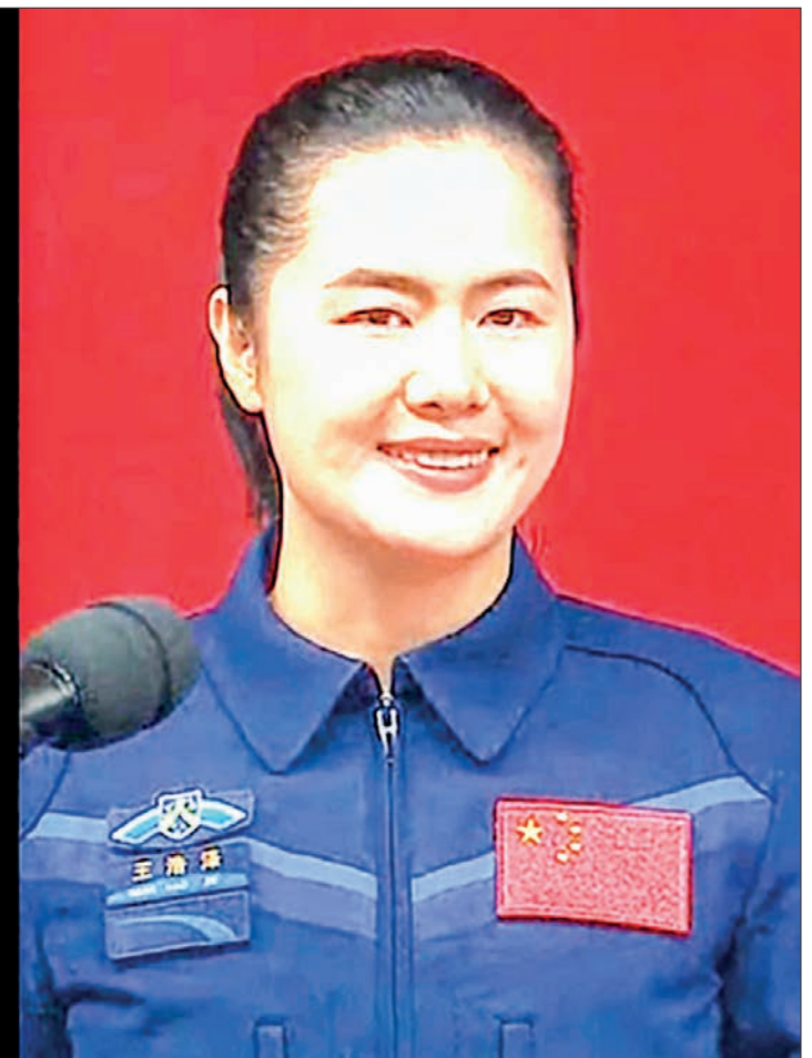
Wang became the first female space engineer from China to embark on a space mission during the Shenzhou-19 flight.