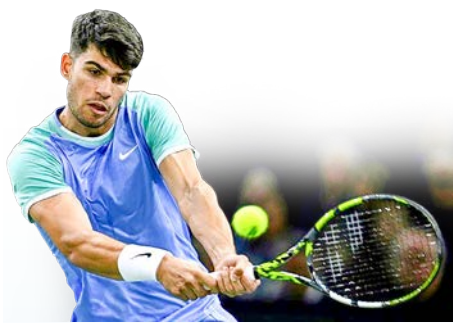
Carlos Alcaraz won his opener at the Paris Masters 7-5, 6-1.

will see Myanmar's Shan United facing off against the Tainan City team on 2 November.