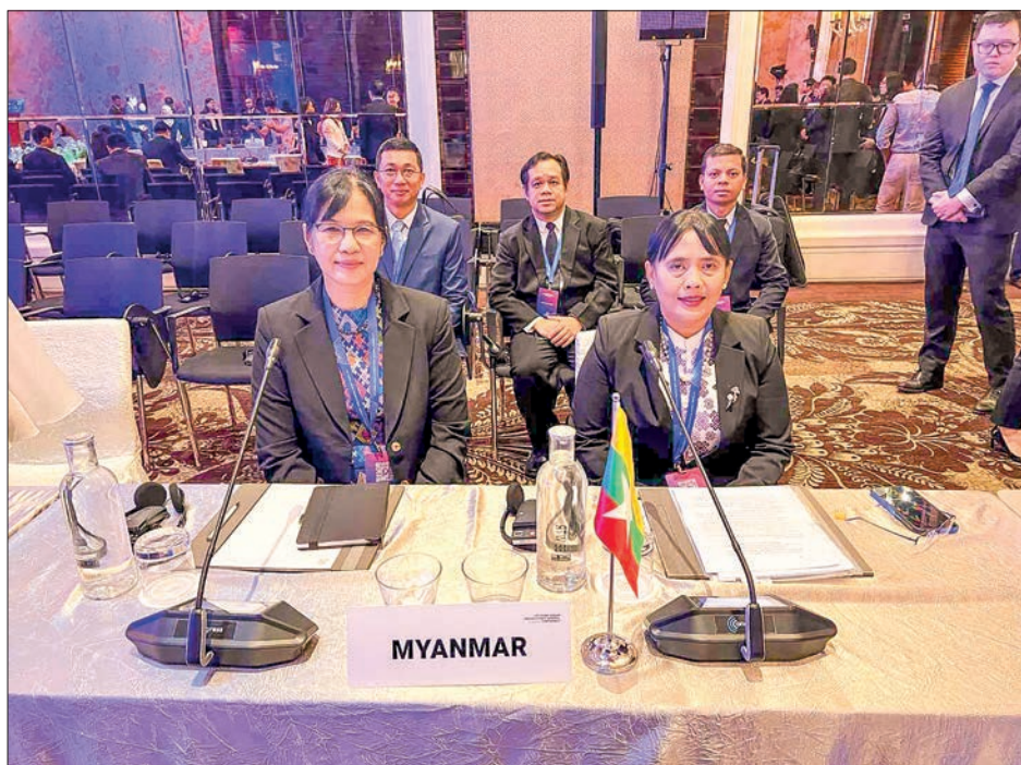
Union Minister for Legal Affairs and Union Attorney-General Dr Thida Oo takes part in the 14 th China-ASEAN Prosecutors-General Conference in Singapore.

The conference concluded with the signing of the Joint Declaration of the 14 th China-ASEAN Prosecutors-General Conference by the chief prosecutors of China and ASEAN countries, which aims to strengthen collaborative efforts in addressing cross-border financial crimes. For Myanmar, this collaboration is expected to reinforce relationships within ASEAN and with China, fostering cooperation in combatting financial crimes.