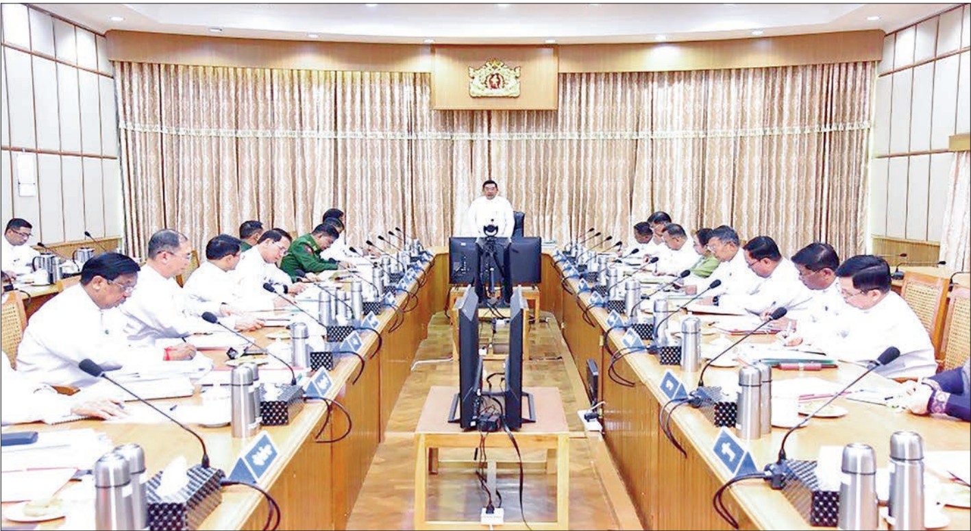
Prime Minister U Nyo Saw addresses the first meeting 2026 of the Union government in Nay Pyi Taw yesterday.

Illegal trade and the production, distribution, and sale of narcotic drugs pose a threat to national security, and effectively combatting these issues will, in one way or another, help contribute to national stability and peace, said Prime Minister U Nyo Saw at the meeting 1/2026 of the Union government at the Union government office in Nay Pyi Taw yesterday. He continued to say that transnational crimes will continue to be thoroughly investigated and eradicated as a national duty, and that effective penalties will also be imposed accordingly. Concerning the election process, the Prime Minister noted that the it has successfully held a multiparty democratic general election in line with the will of the people, enabling the country to proceed along a genuine and disciplined democratic path, and that it will continue to facilitate the transfer of State responsibilities