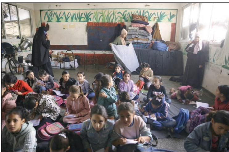
Palestinian children, many of whom are part of displaced families, sit on the floor as they attend class, at the UNRWA Deir al-Balah Joint School, west of Deir al-Balah, in the central Gaza Strip on 6 December 2025, under the first phase of the fragile US-brokered ceasefire between Israel and Hamas in the Gaza Strip.

UNICEF was now dramatically scaling up its education initiative in the Palestinian territory, Elder said, in what he described as “one of the largest emergency learning efforts anywhere in the world”. The organization currently supports more than 135,400 children receiving education at over 110 learning spaces in Gaza — many of them in tents, he said. — AFP