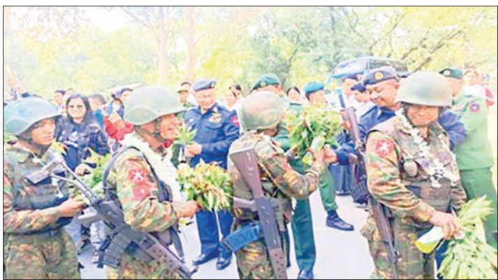
This image shows Tatmadaw's triumphant troops being warmly welcomed back at the station.

A ceremony to welcome and honour frontline-returning Tatmadaw personnel who had bravely fought armed terrorist groups and organizations operating under the name of the PDF – groups that had committed violent acts causing suffering to the public and undermining regional development – and who had achieved repeated victories, was held this morning at a local battalion in Minbu Township, Magway