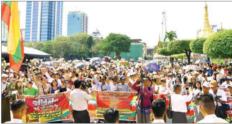
This image shows the Yangon rally supporting the Myanmar delegation at the ICJ.

A rally in support of the rebuttal submissions made by the Myanmar delegation at the International Court of Justice (ICJ) in The Hague, the Netherlands, in defence of the dignity and just cause of the Republic of the Union of Myanmar, was held this afternoon at the car park in front of Yangon City Hall.