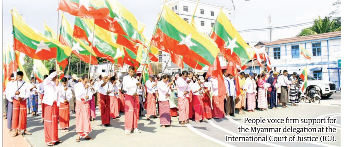
People voice firm support for the Myanmar delegation at the International Court of Justice (ICJ).

Such actions reflect the truth of Myanmar and are also an important factor in enabling the international community to better understand and place trust in Myanmar. They further expressed deep appreciation and recorded their recognition of the efforts of the Myanmar delegation, which has gone to the ICJ on behalf of the country, standing on the side of truth to safeguard the dignity, sovereignty and interests of the Republic of the Union of Myanmar; and their attitude standing with the policies of the country. — Sithu (IPRD)/KTZH