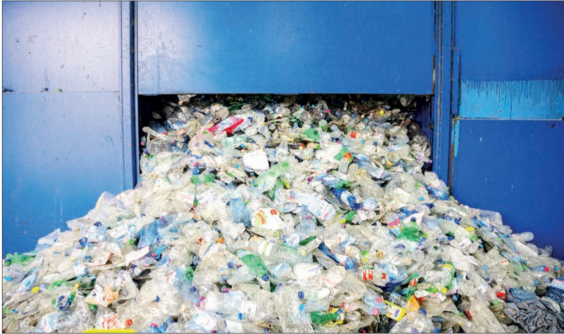
This picture shows plastic bottles at a Recycle Factory in the city of Corfu on 15 October 2025.

THE threat posed by plastic production, usage and disposal to human health will skyrocket in the coming years unless the world does something to address this global crisis, researchers warned Tuesday.