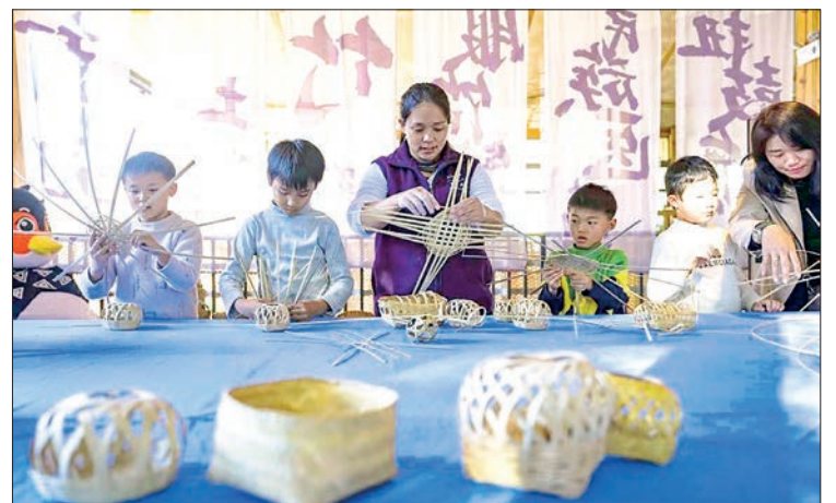
An instructor (3 rd L) teaches children to make bamboo weaving works at a study tour centre in Manhai Village, Mojiang Hani Autonomous County of Pu'er City, southwest China's Yunnan Province, 20 December 2025.

To ensure the momentum translates into long-term fiscal strength, he said the government is adopting a "whole-of-government" approach. This involves total mobilization of the state machinery to streamline coordination across all ministries, departments, and agencies. — Xinhua