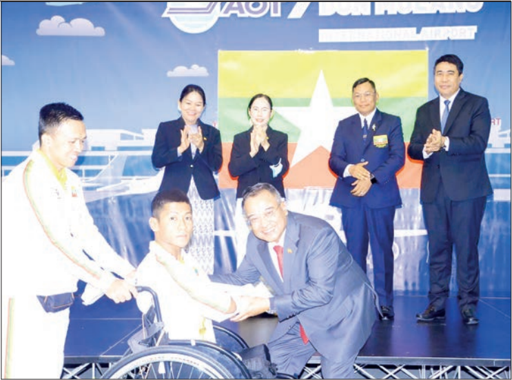
Cash awards presented by KBZ Bank to Myanmar para-athletes.