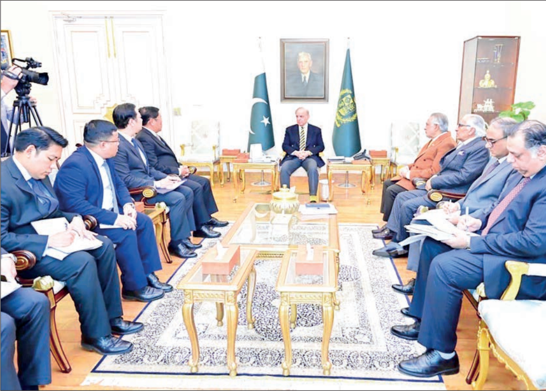
Prime Minister of Pakistan Mr Mohammad Shehbaz Sharif receives Union Foreign Affairs Minister U Than Swe yesterday.

ARMED terrorists have been launching attacks by using residential homes and administrative buildings in towns and villages as cover, where they have forcibly settled. They aim to shield themselves from Tatmadaw counterattacks while also persuading temporarily displaced persons to return to their native areas and recruiting new members. That enables terrorists to use civilians as human shields. Tatmadaw is committed to safeguarding the sovereignty of the State and will respond to these threats based on intelligence and prevailing conditions. Therefore, residents in areas where terrorists have taken control must prioritize their safety and protect themselves from being exploited by these groups. (An excerpt from guidance given by Chairman of the State Administration Council, Prime Minister Senior General Min Aung Hlaing to Shan State cabinet members and state-level departmental officials on 3 September 2024)