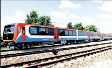
MR launches pilot online railway ticketing and payment system