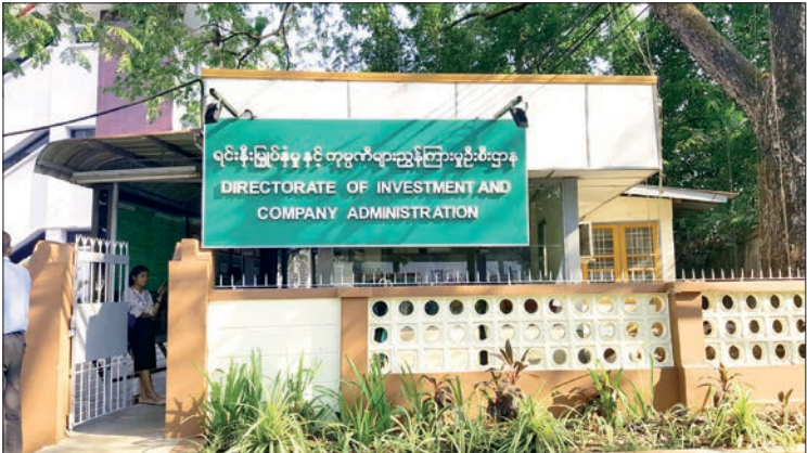
The facade view of the Directorate of Investment and Company Administration (DICA) office in Yangon.

off the register from the date of the directive, under 430 (F) of the Myanmar Companies Law, according to the DICA’s notification. A total of 19,000 companies also failed to submit the AR in 2024. The registration and re-registration of companies on the MyCO website commenced on 1 August 2018, in keeping with the Myanmar Companies Law 2017. All registered companies need to submit AR on the MyCO registry system within two months of incorporation, and at least once every year (not later than one month after the anniversary of the incorporation), according to Section 97 of the law. Under Section 266 (A) of the Myanmar Companies Law