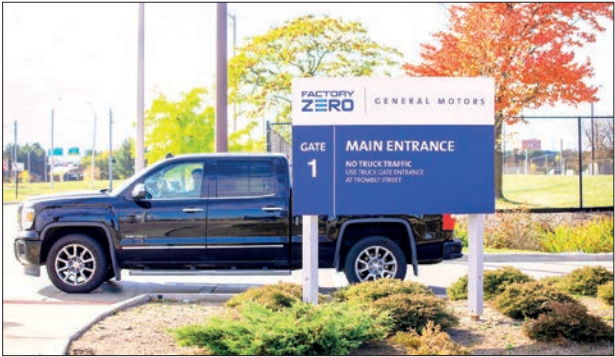
A sign for General Motors' Factory Zero plant is seen on 29 October 2025 in Detroit, Michigan.

GENERAL Motors reported a fourth-quarter loss Tuesday due to a big write-down of electric vehicle investments, but forecast solid profits in 2026. Shares in the US auto giant rose in pre-market trading after GM announced a dividend increase and a new share repurchase programme. GM reported a loss of