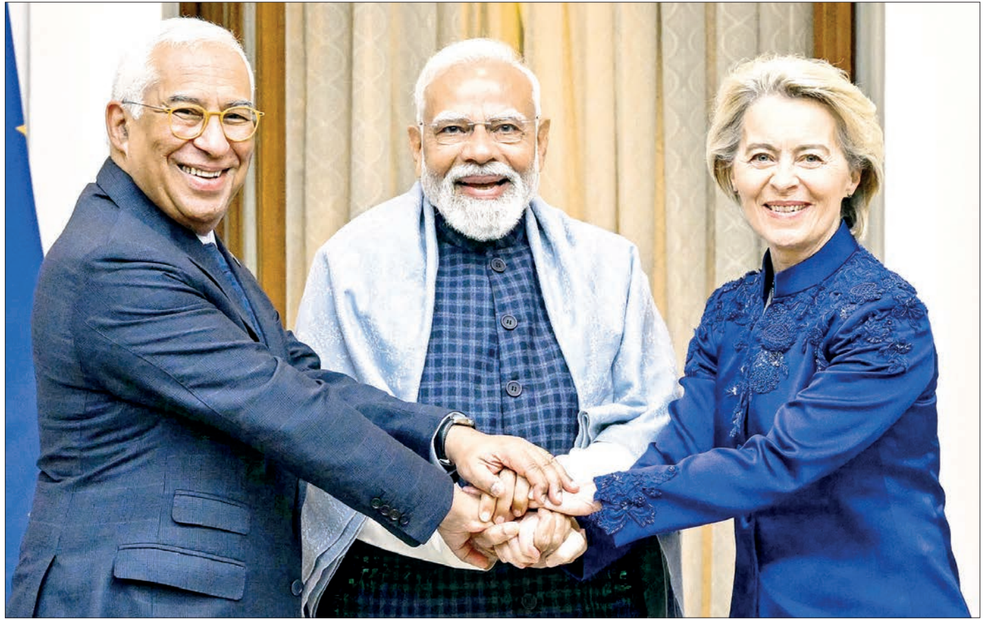
India’s Prime Minister Narendra Modi (C) poses for a photograph with European Commission President Ursula von der Leyen (R) and European Council President Antonio Costa before their meeting at the Hyderabad House in New Delhi on 27 January 2026.