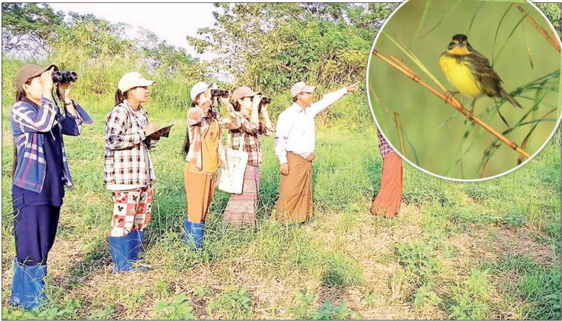
This image, including an inset, shows yellow-breasted buntings wintering at the Kyonkapyin-Tapseik conservation area alongside visitors.

HUNDREDS of thousands of yellow-breasted buntings, a species at risk of extinction, have arrived to winter in the Kyonkapyin-Tapseik Conservation Group (KTCG)’s area, one of its members told the Global New Light of Myanmar. These birds require urgent conservation efforts, said environmentalists. According to the KTCG, only about 3,000 of these birds were recorded in the first survey, but that number has surged to hundreds of thousands this year. “The yellow-breasted bunting, a rare endangered species, has arrived for the winter. We’ve observed them returning annually in recent years. They