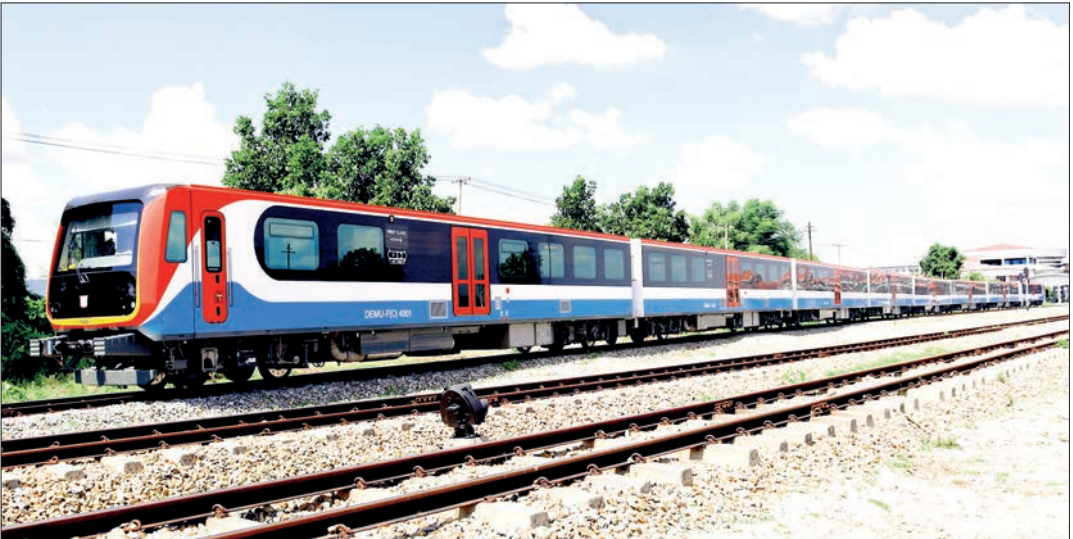
A DEMU train is seen ready for a safe, smooth journey.

The State is actively cooperating with neighbouring and regional countries and international organisations to identify, arrest, and take effective action against individuals involved in online scam centres, including foreign masterminds operating behind the scenes. At the same time, authorities are coordinating efforts to swiftly repatriate distressed foreign nationals and victims of human trafficking to their respective countries. — MNA/KZL