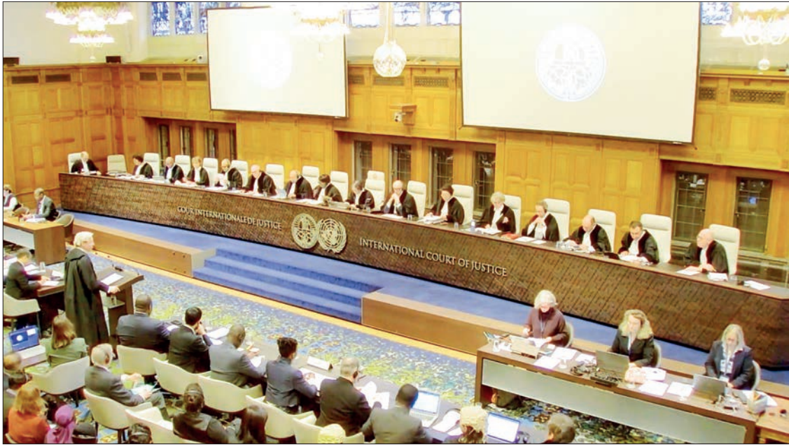
The ongoing oral hearings in The Gambia-Myanmar case at the International Court of Justice (ICJ).