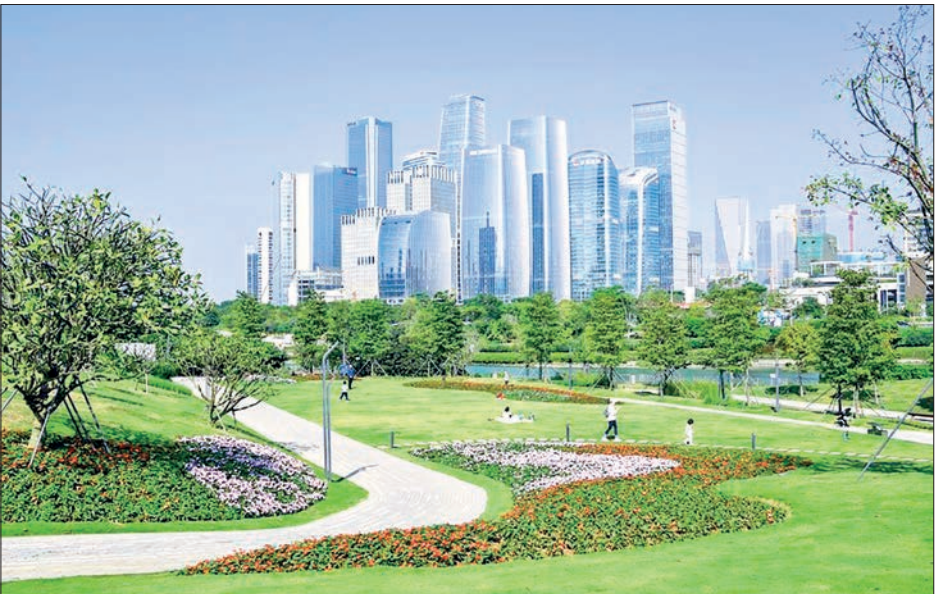
This photo taken on 8 December 2022 shows a view of the Qianhai Shenzhen-Hong Kong Modern Service Industry Cooperation Zone in the southern metropolis of Shenzhen, south China's Guangdong Province.

duced 267 GBA standards and issued 308 GBA certifications. The region now hosts 84 innovation and entrepreneurship bases for young people from Hong Kong and Macao, having attracted more than 7,000 projects. This momentum reflects Guangdong's broader economic heft. According to the provincial government work report, which was released at the annual session, the southern province ranked first nationwide in total GDP for the 37 th consecutive year in 2025. — Xinhua