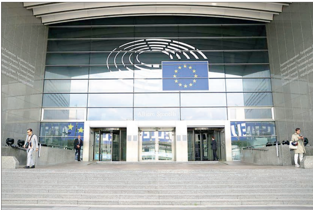
This photo taken on 6 June 2024 shows an exterior view of the European Parliament in Brussels, Belgium.

THE European Parliament has delayed until next week a decision on whether to restart work on the EU-US trade deal, after pausing its approval process last week, in protest over US President Donald Trump's push to acquire Greenland and his tariff threats against European allies, according to a senior lawmaker on Monday.