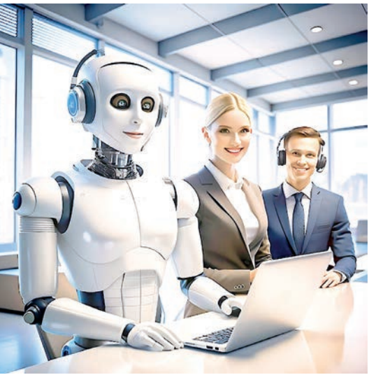
Technology alone will not define the future of work. Instead, today’s investments in people will be the deciding factor. These human capital strategies determine how well businesses and societies adapt.

EDUCATION is often spoken of as a right, but in reality, it is much more than that. It is a quiet promise made to every child, every learner, and every dreamer – that their future can be shaped, strengthened, and given direction. On International Day of Education, the world is invited to pause and reflect not only on classrooms and textbooks, but on the deeper meaning of learning itself and the role it plays in shaping individuals, communities, and nations.