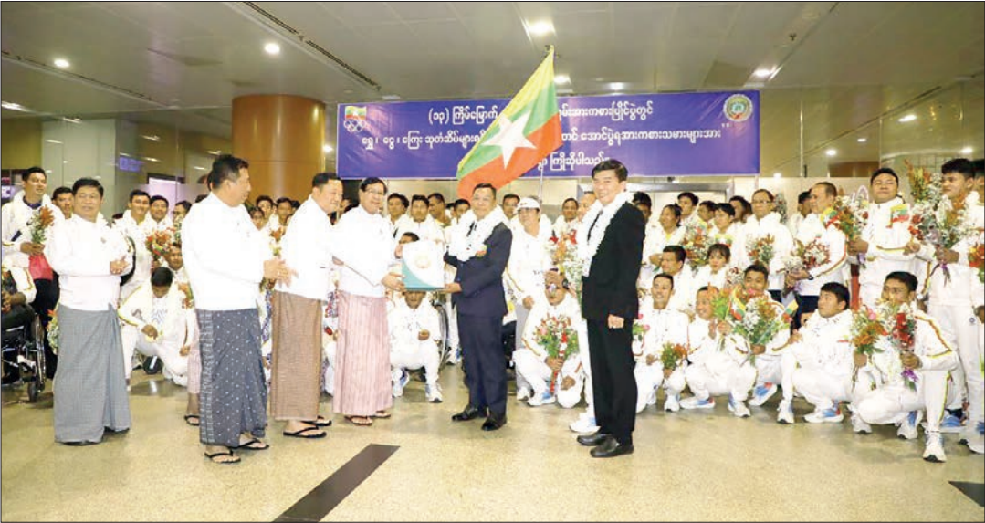
Yangon Region Chief Minister U Soe Thein presents cash awards to the Team Myanmar chief yesterday.

Deputy Minister U Zin Min Htet of the Ministry of Sports and Youth Affairs, regional ministers, officials, students from the Institute of Sports and Physical Education (Yangon), family members and sports enthusiasts. They were greeted with ceremonial gifts, wreaths and flowers. In recognition of their achievements, Chief Minister U Soe Thein presented a cash award of K10 million to the victorious Myanmar para-athletes. — MNA/KZL