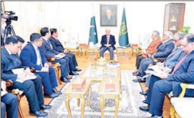
MoFA Union Minister pays courtesy call on Prime Minister of Pakistan