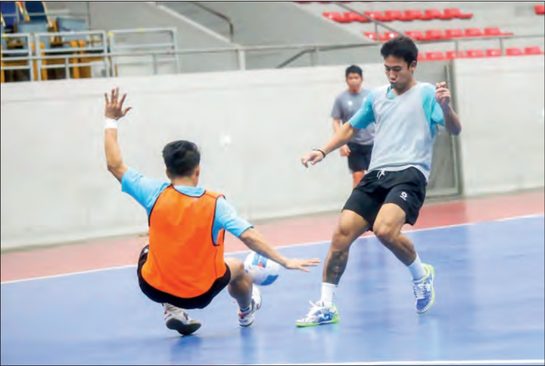
The Myanmar national futsal team is seen training in Yangon before leaving for Thailand.

THE Myanmar men's futsal team arrived in Thailand on the evening of 8 December to participate in the 33 rd SEA Games, and from 9 December onwards, they will begin training and preparation sessions. The team travelled to Thailand in advance to take part in pre-tournament preparations, including two warm-up matches. The head coach of the Myanmar national team, Thai national Pattara Pikhun, brought a squad of