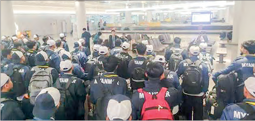
This photo captures Myanmar workers arriving in the Republic of Korea in November.

FOR Myanmar nationals in the Republic of Korea to cast the advance vote, the polling period has been extended another five days, said the Myanmar Embassy to the Republic of Korea. The polling station was open on 6 and 7 December at the embassy in Seoul, and now an additional five days have been extended from 8 to 12 December, from Monday to Friday, between 10 am and 4 pm. Therefore, voters can come to cast a vote during these days, it said. For advance voting, an original Myanmar passport or original or copy of the Citizenship Scrutiny Card is required. — MT/ZS