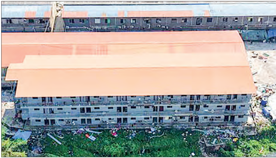
Photos show the three-storey structure linked to telecom fraud and online gambling in the KK Park Section 3.