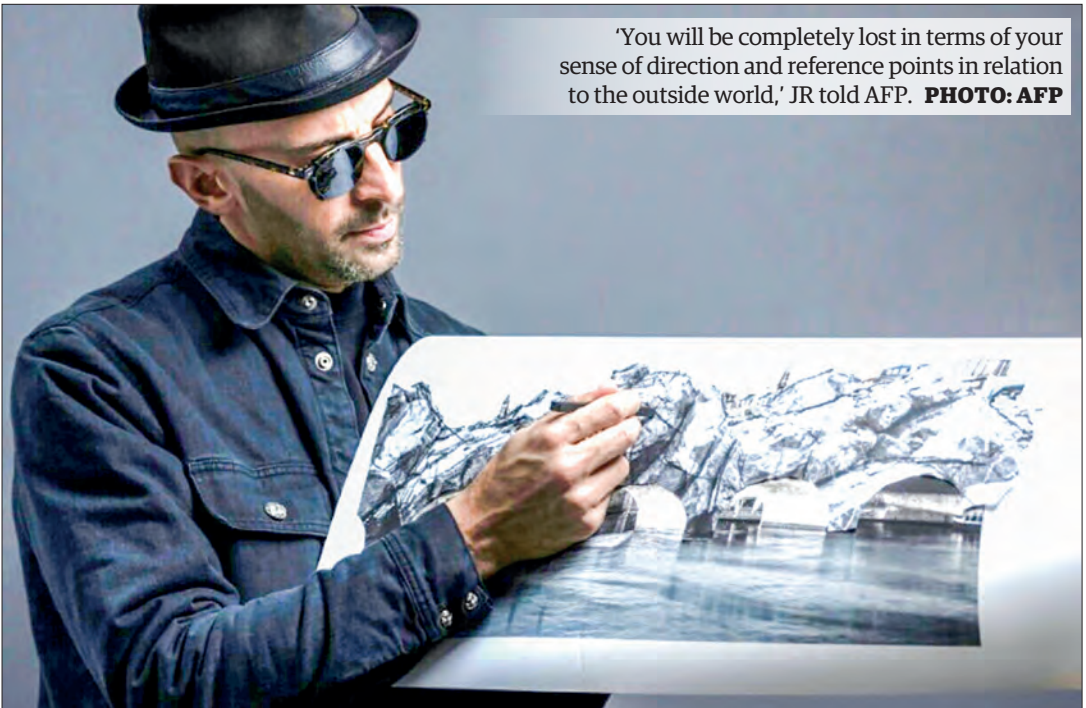
'You will be completely lost in terms of your sense of direction and reference points in relation to the outside world,' JR told AFP.

Fiji has recorded a tenfold increase in cases over the past decade, driven mainly by injecting drug use, while Papua New Guinea declared HIV a national crisis in June amid spikes among women of reproductive age and children. — Xinhua