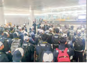
ME to South Korea extends polling by 5 days