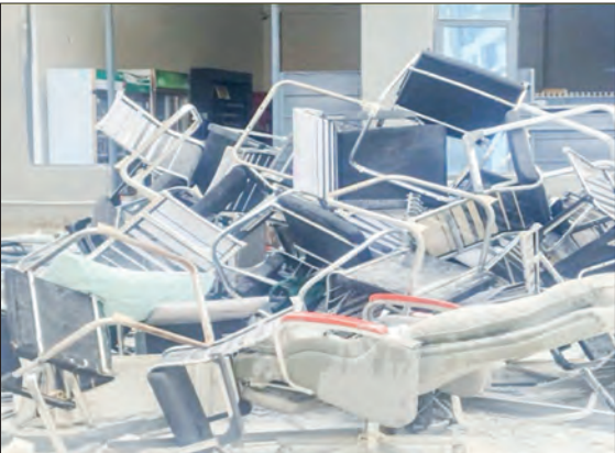
Images show the burning of the online scam-related items in the Shwe Kokko area.