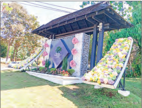
A glimpse of the flowers festival.

The National Kandawgyi Gardens in PyinOoLwin covers a total area of 436.96 acres, comprising 366.96 acres of land area and about 70 acres of water surface. The gardens, first established in 1924, have been operated by the Htoo Group of Companies on a 15-year lease since 2010. — ASH/KNN