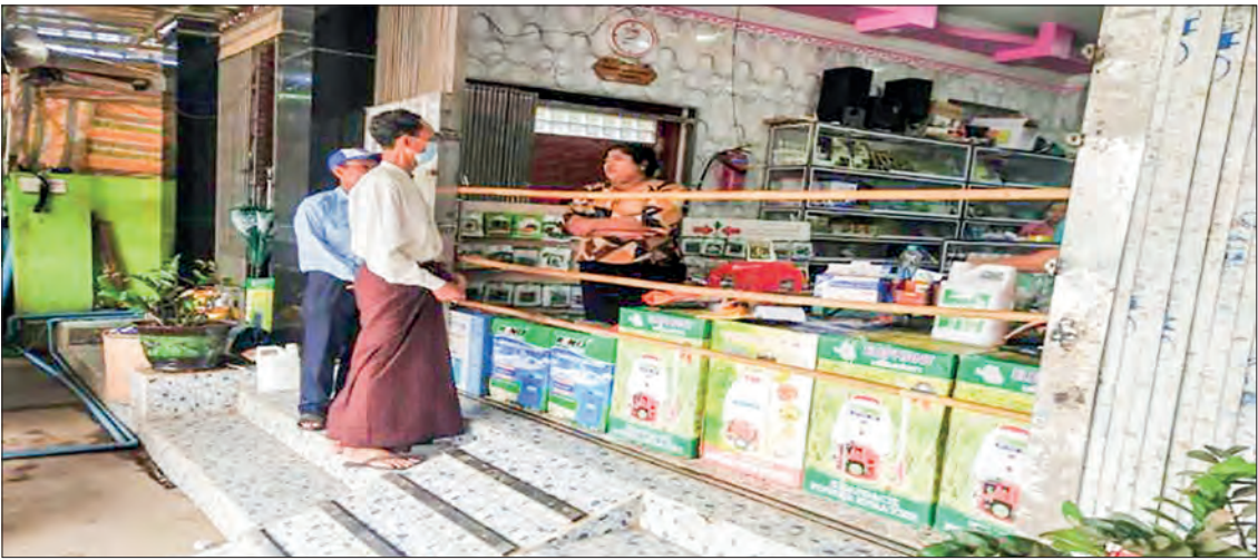
Fertilizers and pesticides are displayed at a shop in DaikU Township.

THE Urea Fertilizer Purchasing and Distribution Steering Committee recommended importing licences of over 1.5 million tonnes of fertilizer and 27,490 tonnes of pesticide in the nine months of the current financial year 2025-2026 beginning 1 April. The Union Minister for the Cooperatives and Rural Development attended the work coordination meeting held on 3 December. The objectives of the meeting is to import agricultural inputs and set reference prices. Additionally, 1.6 million tonnes of fertilizer and 32,000 tonnes of pesticide are planned to be imported in the current financial year 2025-2026. The Steering Committee recommended that business companies seek import licences for over 1.5 million tonnes of