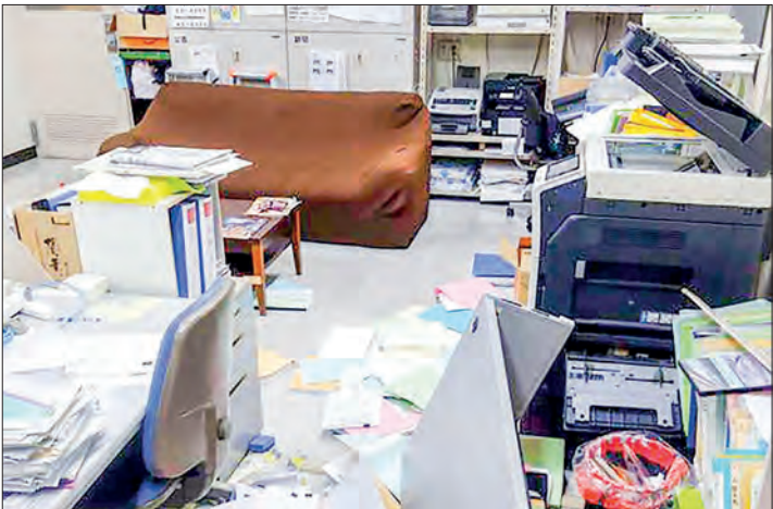
Office items are seen scattered on the floor of Kyodo News’ Hakodate bureau in Hakodate, Hokkaido, shortly before midnight 8 December 2025, after a powerful earthquake struck the region.

A powerful quake with a preliminary magnitude of 7.6 struck northeastern Japan late Monday night, with the weather agency issuing a tsunami warning for coastal areas of Hokkaido as well as Aomori