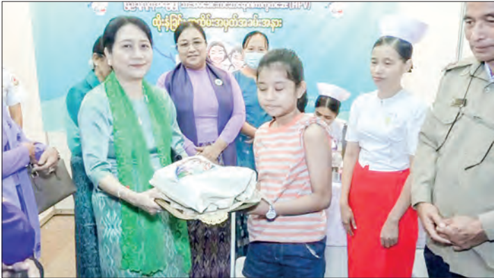
A young girl receiving the vaccine at the commemorative ceremony for the community-based cervical cancer (HPV) vaccination.

He emphasised the need to strengthen efforts for the community-based vaccination approach. The vaccination (HPV MAC - HPV Multi-Age Cohort Vaccination) for girls will be further extended, increasing