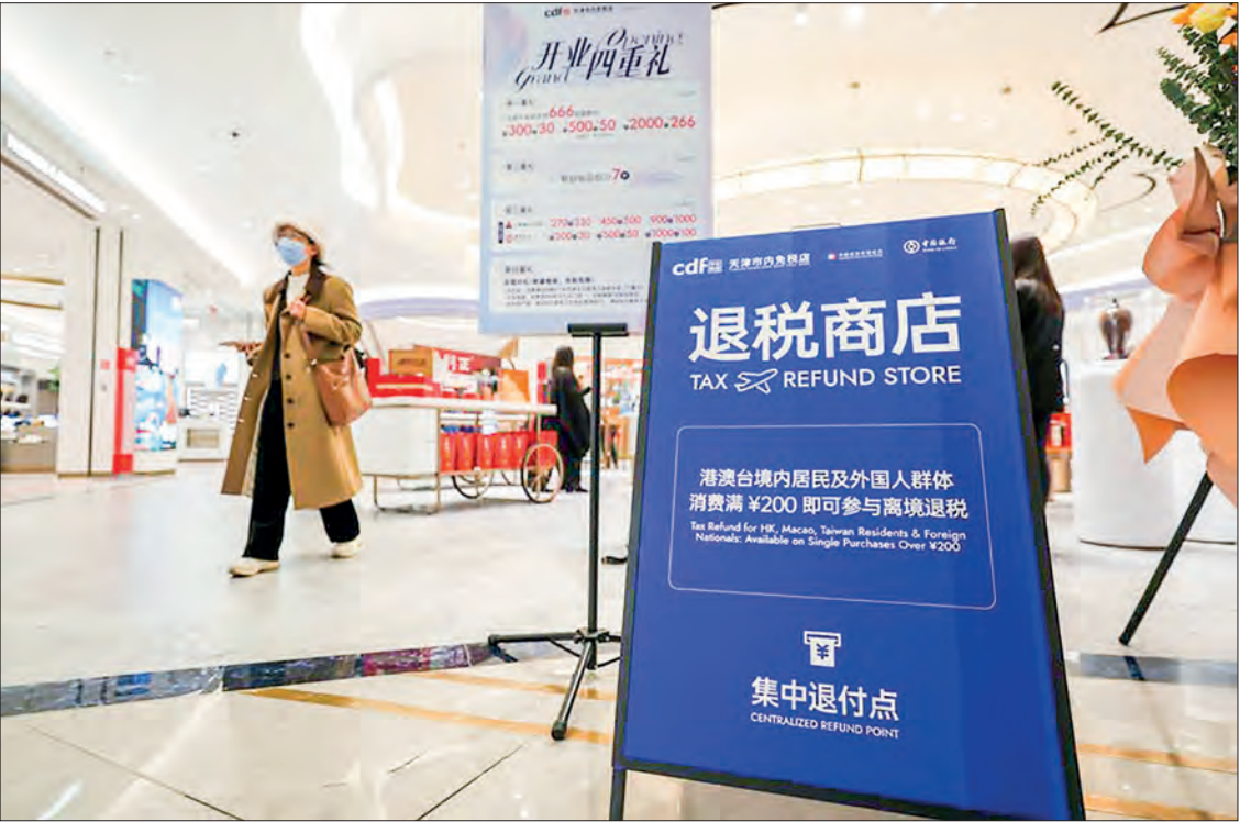
A sign of tax refund point is seen at a downtown duty-free shop in north China's Tianjin Municipality, 28 November 2025. the administration. China first implemented the departure tax refund policy for overseas visitors in 2015. Since then, the scale of departure tax refunds has continued to grow year by year, benefiting an increasing number of overseas visitors. — Xinhua

THE number of overseas visitors claiming China's departure tax refund surged 285 per cent year on year in the first 11 months of 2025, according to data released by the State Taxation Administration on Monday. In the same period, both the sales of tax refund-eligible goods and the total amount of tax refunds increased 98.8 per cent year on year, the data showed. China has introduced a series of measures since April to optimize its tax refund system for overseas visitors. The policy optimization has included the establishment of instant tax refund counters in major shopping districts in cities such as Beijing, Shanghai, Chongqing, Chengdu and Guangzhou. Cities including Shanghai and Hangzhou have also introduced online refund options, making the process more efficient. The continued optimization of tax refund services has better met overseas visitors' refund needs and further fuelled their enthusiasm for traveling in China. As of the end of November, there were 12,252 departure tax refund shops across the country, with more than 7,000 of them offering immediate refund upon purchase services, according to