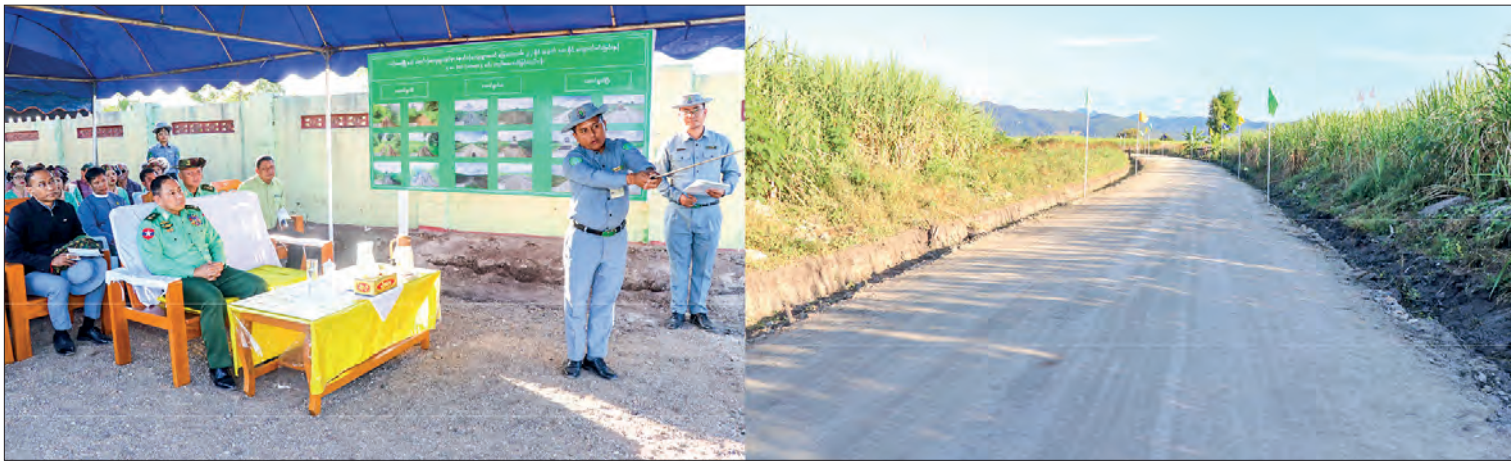
Union Minister for Border Affairs and for Ethnic Affairs Lt-Gen Yar Pyae hears the report on the two-mile-two-furlong gravel road on the entrance road to Naunglong Village, Langkho Township.

STATE Security and Peace Commission Member and Union Minister for Border Affairs and for Ethnic Affairs Lt-Gen Yar Pyae, along with Shan State Minister for Security and Border Affairs Col Sein Win and other officials, visited the