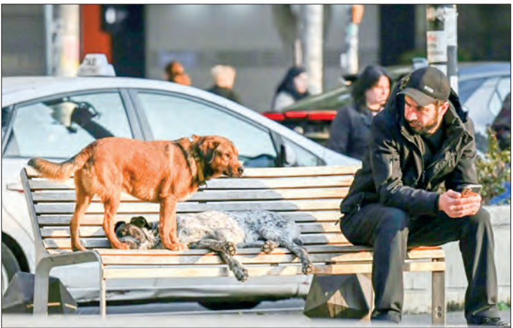
Many welcome the dogs as a symbol of Tbilisi, a showcase of Georgian hospitality. PHOTO: AFP

On cafe terraces, regulars slip bones under tables as mongrels curl up between patrons' feet, while each neighbourhood and cul-de-sac has its own local canine mascot. — AFP