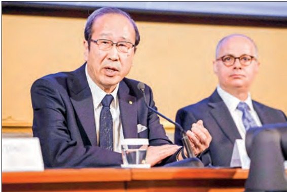
This photo shows this year's Nobel chemistry prize co-winners, Susumu Kitagawa (L) and Omar Yaghi, at a press conference in Stockholm on 7 December 2025.

the debris near the residents' houses so they can access their homes," he said, adding the elephants would be used for the rest of the week. The downpours and subsequent landslides throughout western Indonesia have injured at least 5,000 people and devastated infrastructure, including schools and hospitals. In the city of Banda Aceh, long queues formed for drinking water and fuel, and prices of basic commodities such as eggs were skyrocketing, an AFP correspondent said. Costs to rebuild after the disaster could run up to 51.82 trillion rupiah ($3.1 billion), the BNPB said late Sunday. In Sri Lanka, the military deployed thousands of extra troops to aid recovery efforts on Monday after a devastating cyclone caused a wave of destruction and killed 627 people. — AFP