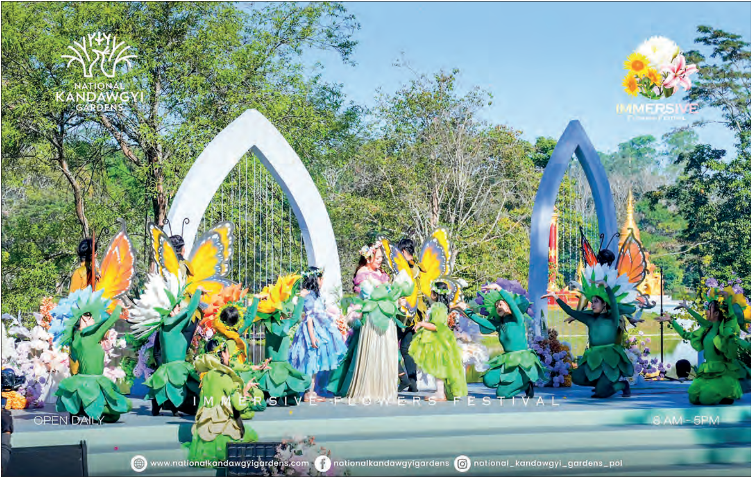
This image shows the inauguration ceremony fot the 18 th Immersive Flowers Festival at PyinOoLwin National Kandawgyi Gardens.

The National Kandawgyi Gardens in PyinOoLwin, first established in 1924 and now operated by the Htoo Group of Companies under a 15-year lease since 2010, span a total of 436.96 acres, including 366.96 acres of land and about 70 acres of water surface.