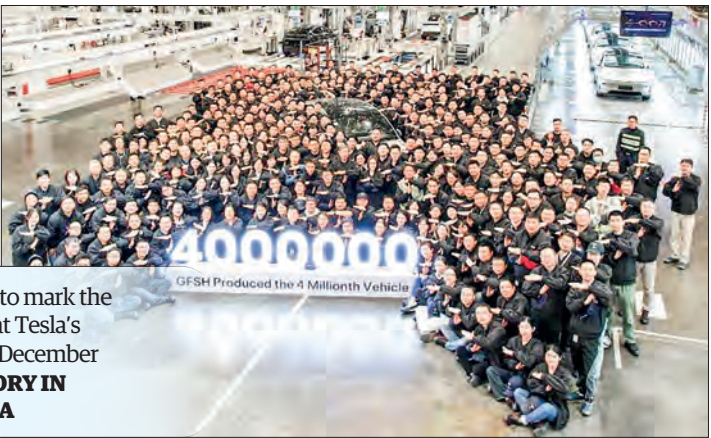
Staff members pose for a group photo to mark the four millionth vehicle produced here at Tesla's Gigafactory in Shanghai, east China, 8 December 2025.

customers, with vehicles exported to Europe and the Asia-Pacific region. In October, the Shanghai plant shipped more than 35,000 vehicles abroad, the highest monthly export volume in two years, according to the company. — Xinhua