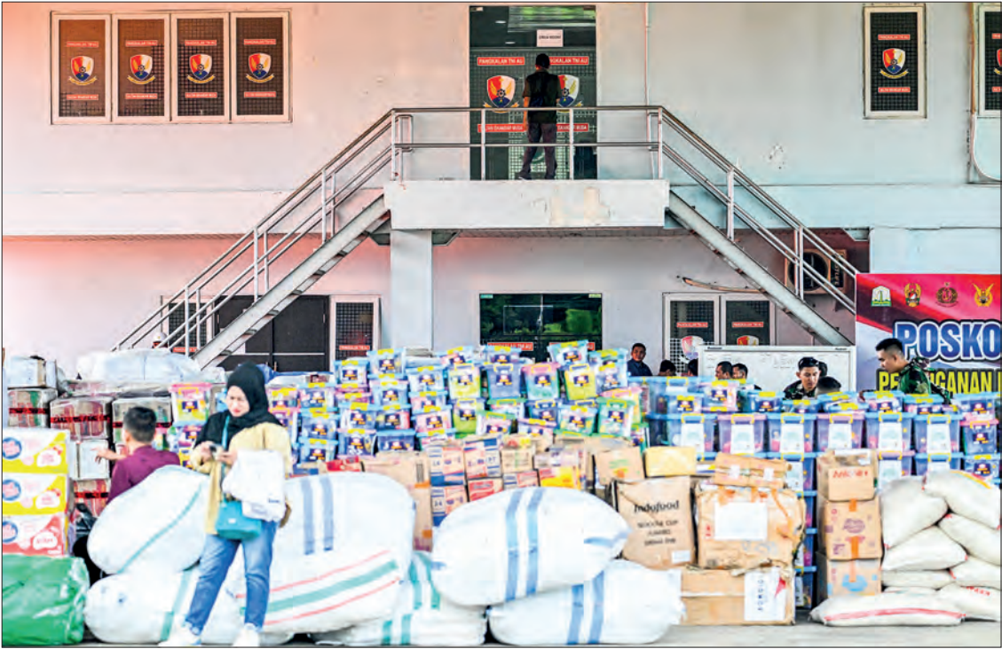
Volunteers pack relief supplies for delivery to flood victims, at the Indonesian air force home base in Blang Bintang, Aceh province, on 7 December 2025.

Indonesia's national disaster mitigation agency (BNPB) said 961 people in Aceh, North Sumatra and West Sumatra had been killed, while 293 were missing. More than a million people were displaced, the agency said. In Pidie Jaya, a district in