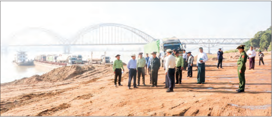
Sagaing Region Chief Minister U Myat Kyaw and officials oversee the distribution of provided construction supplies in Sagaing yesterday.

The top-left and left images show advance voting in the 2025 Multiparty Democratic General Elections at the Myanmar Embassies in Bangkok and New Delhi.