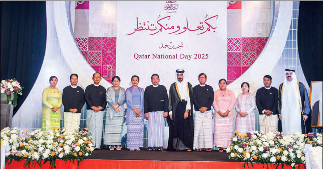
The Prime Minister poses for the group documentary photo session at yesterday's Qatar National Day event.

PRIME Minister U Nyo Saw and his wife attended the dinner reception marking Qatar's National Day held yesterday evening at the Lotte Hotel in Yangon. Also present at the event were Yangon Region Chief Minister U Soe Thein, Deputy Minister for Foreign Affairs U Naing Min Kyaw, regional ministers, ambassadors and chargés d'affaires from foreign embassies, representatives of United Nations agencies, and other guests. The Prime Minister and attendees were warmly welcomed by Mr Ahmad Ali RA Al-Marri,