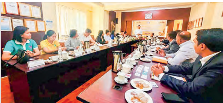
The Sri Lankan delegation and UMTA are seen discussing the tourism development.

IN an effort to strengthen the cooperation in the tourism industry between Myanmar and Sri Lanka, the business delegation led by the Sri Lankan ambassador had a meeting with