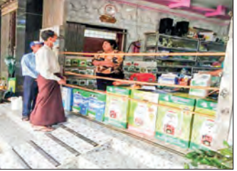
Urea fertilizer committee recommends fertilizer and pesticide imports