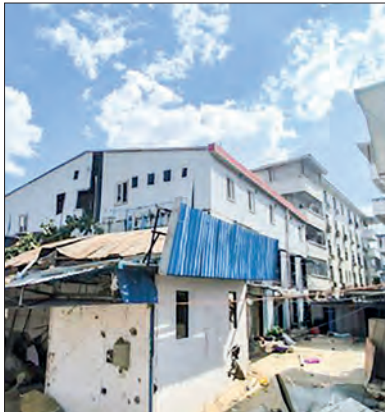
Ongoing demolition measures in Ward 3, Myawady.

Ghana and one from Kyrgyzstan, through the Myanmar-Thailand Friendship Bridge II. The government considers the eradication of telecom fraud and online gambling crimes as a national responsibility and, to ensure that such activities can no longer operate within Myanmar, will continue its efforts in coordination not only with domestic forces but also with the governments of neighbouring countries. — MNA/KTZH