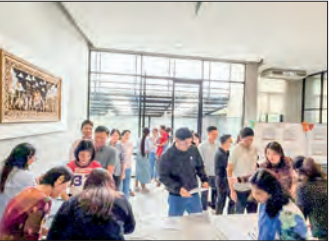
Advance voting for 2025 Multiparty Democratic General Elections