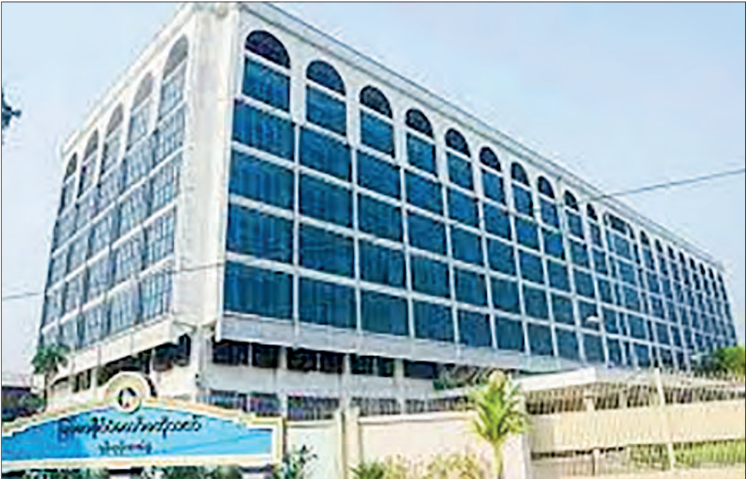
The Central Bank of Myanmar.

have been granted after the 41 st meeting of the Fertilizer Committee. With individuals' consent, 1,957 registrations were voluntarily cancelled. The department revoked 2,793 registrations for expiration of validity and 6,823 registrations are still under processing for now. — NN/KK