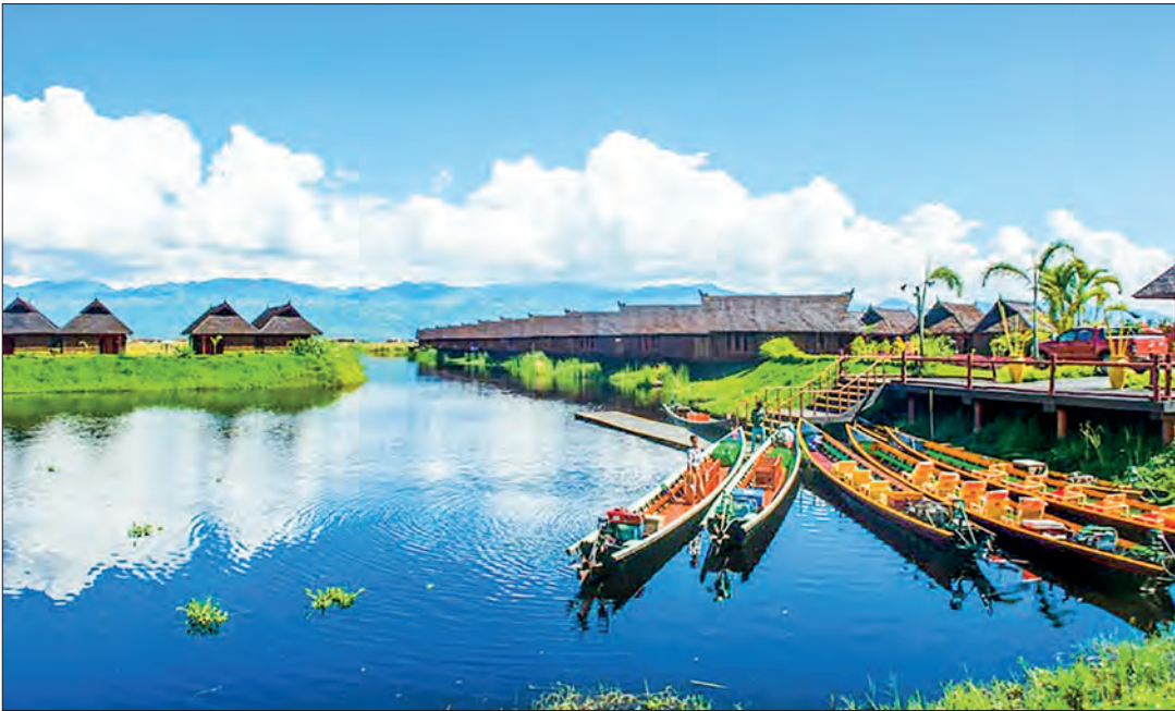
This photo showcases some sceneries and visitors in the Inlay region.

ACCORDING to the Shan State Directorate of Hotels and Tourism, over 7,000 domestic and foreign travellers visited Inlay region in Nyaungshwe Township, Shan State (South), in October and December 2024.