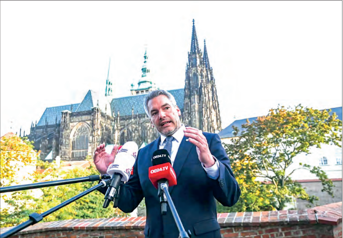
Austrian Chancellor Karl Nehammer attended a news conference after the Informal Summit and Meeting within the European Political Community at Prague Castle, in Prague, Czech Republic.

Nehammer refused to form a coalition with the Freedom Party, and has sought to cobble together a new government with the New Austria and Liberal Forum (NEOS) and the SPOe, respectively, with both attempts ending in failure.