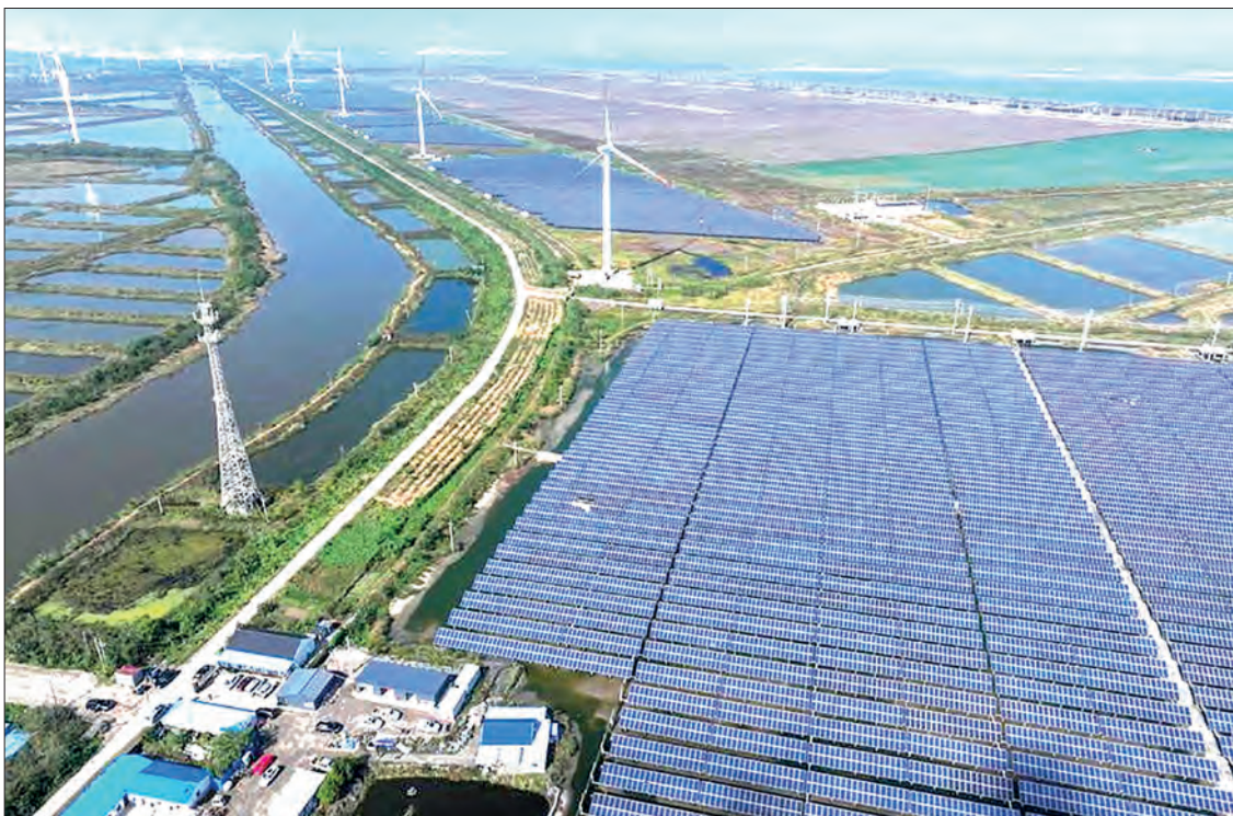
A drone photo taken on 3 November 2024 shows a photovoltaic power project in Rudong County of Nantong City, east China's Jiangsu Province.

With a total installed capacity of 400 megawatts, the Rudong project, spanning 4,300 mu (about 287 hectares), features a newly constructed 220 kV onshore booster station, a 60 MW/120 MWh energy storage facility, and a hydrogen production and refueling station with a production capacity of 1,500 standard cubic metres per hour and hydrogen refueling capability of 500 kilogrammes per day. Once fully operational in 2025, the project is expected to generate an average of 468 million kilowatt-hours of electricity annually, equivalent to saving approximately 151,000 tonnes of standard coal each year. — Xinhua