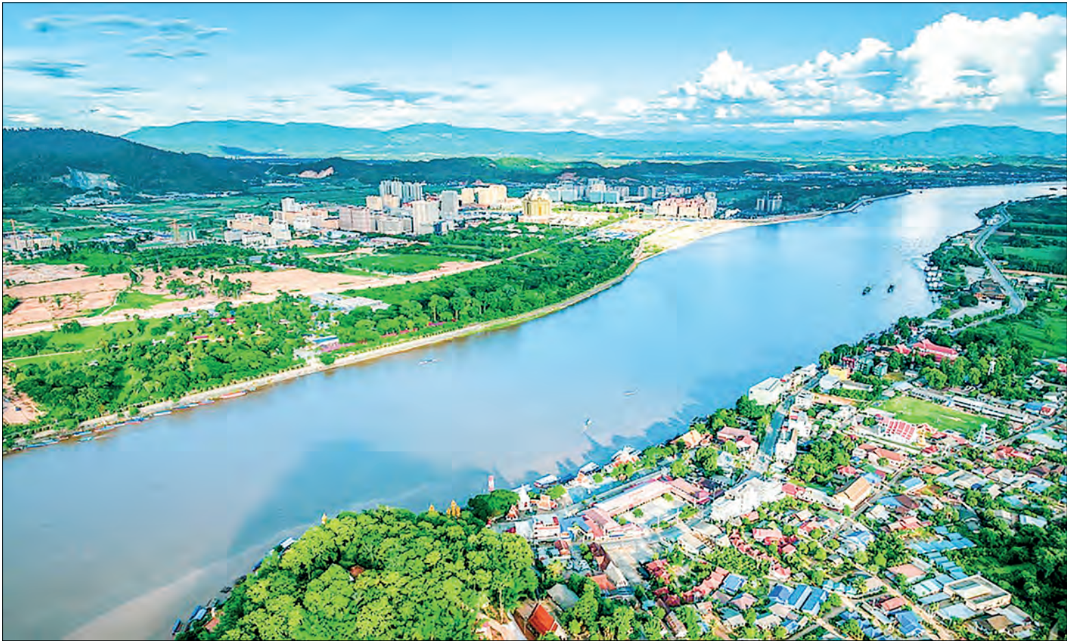
Southeast Asian countries have increasingly turned to compact, issue-specific groupings like the Ayeyawady-Chao Phraya-Mekong Economic Cooperation Strategy (ACMECS) and the Cambodia-Laos-Vietnam Development Triangle Area (CLV-DTA). The Mekong River is the longest river in Southeast Asia.