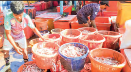
Yangon’s marine exports flourish with over 80 products shipped to international markets