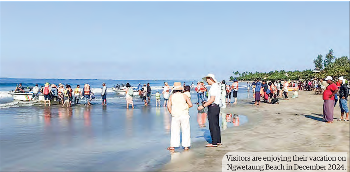
Visitors are enjoying their vacation on Ngwetaung Beach in December 2024.

safe and pleasant experience, the Ngwetaung Beach offers a range of services, including bi-