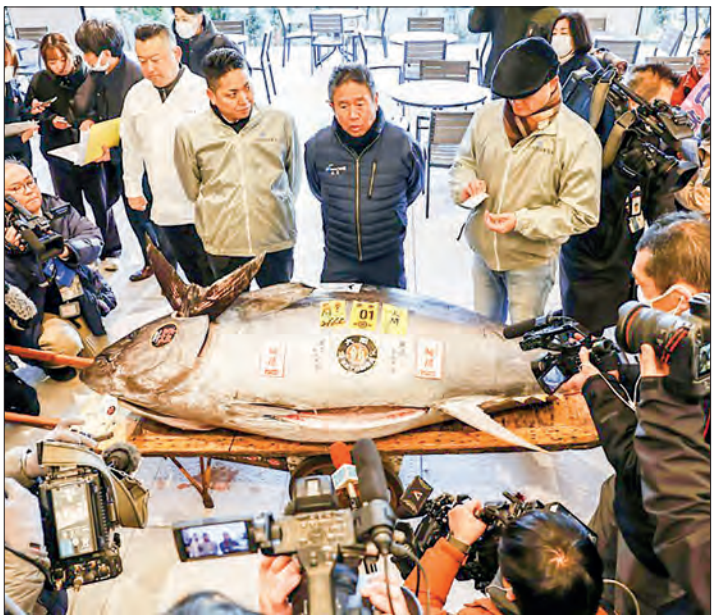
Photo shows the bluefin tuna that fetched 207 million yen ($1.3 million) during the year’s first auction at Tokyo’s popular Toyosu fish market on 5 January 2025.

A bluefin tuna fetched 207 million yen ($1.3 million) during the year’s first auction at a popular fish market in Tokyo on Sunday, the second highest price on record and fueling hopes for a continued economic recovery in Japan.