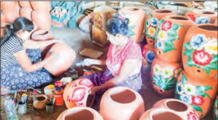
Students on excursion tour of observing pottery industry, laterite culture in Twantay Township