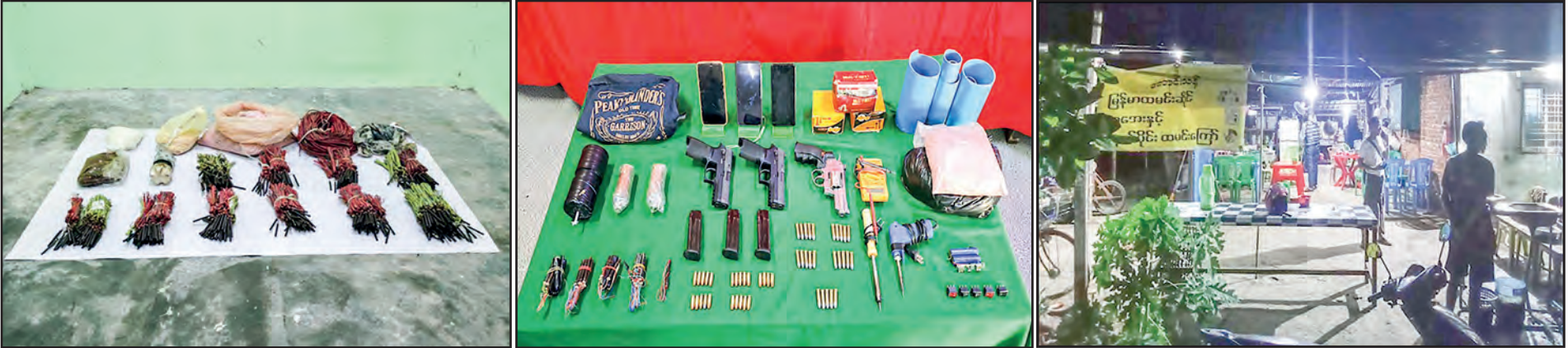
Photos show explosive materials and its related items and arms and ammunition seized in the precinct of the Yadana Theingkha Monastery on Insein Road, West Gyogon Ward, Insein Township. Photo shows a restaurant where hundred-household head U Saw Win Lwin being shot in West Gyogon Ward, Insein Township on 30 May 2024.