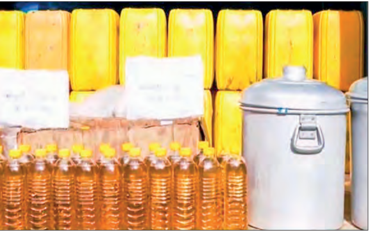
This photo shows some types of cooking oil bottles being sold in the domestic market.

Myanmar has a growing demand of 1.1 million tonnes of cooking oil per year. Beyond domestic production, about 900,000 tonnes of oil are yearly imported. — ASH/KK