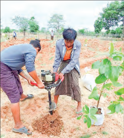
The Yenantha Dinga Brothers Parahita members were planting shade trees.

To ensure the survival of the plants, the gardeners are provided with houses in the gardens and financial support as maintenance fees.