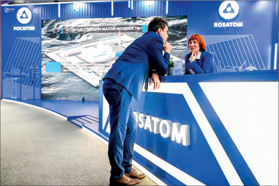
People gather at the stand of Russian State Atomic Energy Corporation Rosatom during the 2023 Russian Energy Week international forum at the Manezh Central Exhibition Hall in Moscow, Russia.