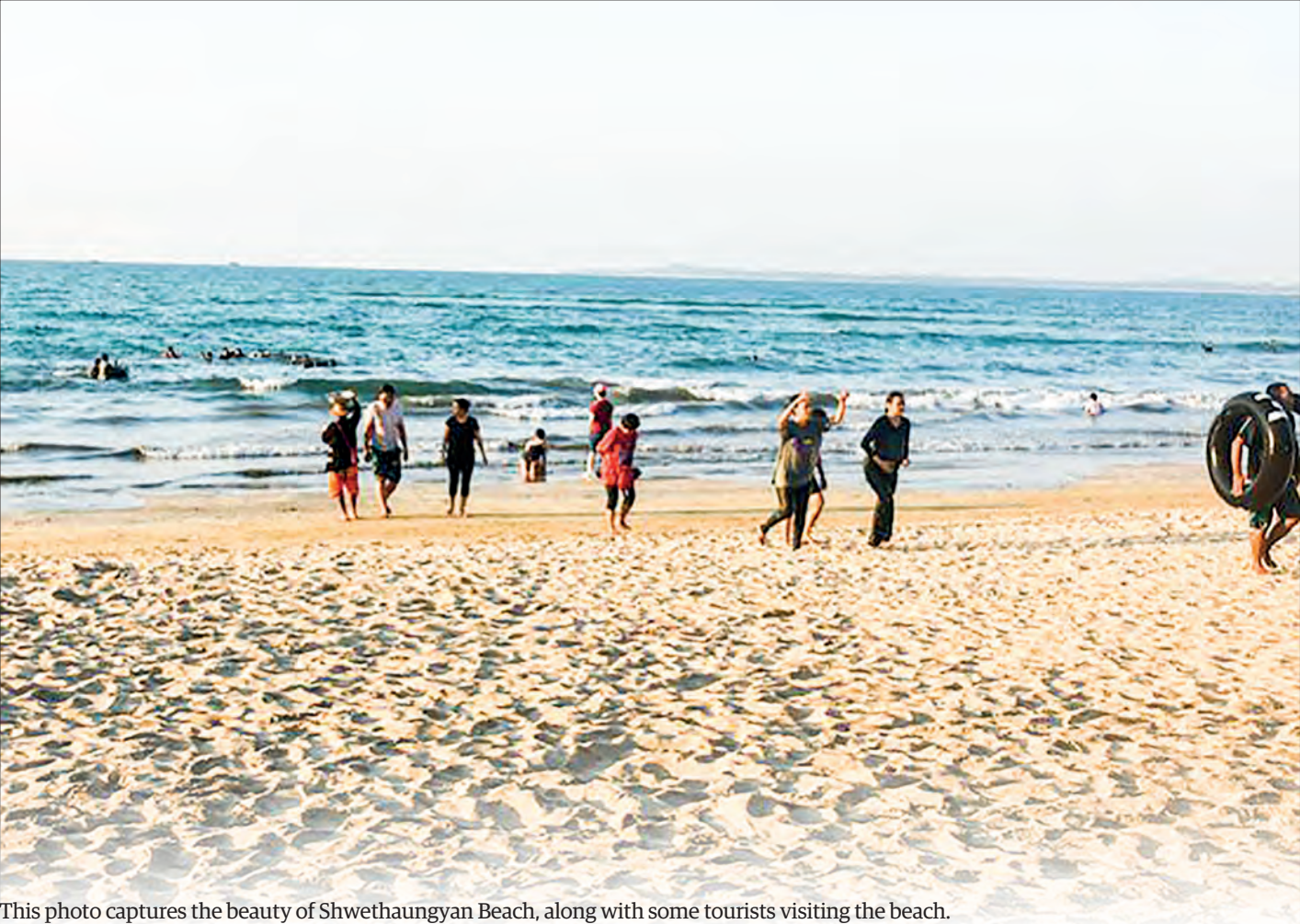
This photo captures the beauty of Shwethaungyan Beach, along with some tourists visiting the beach.