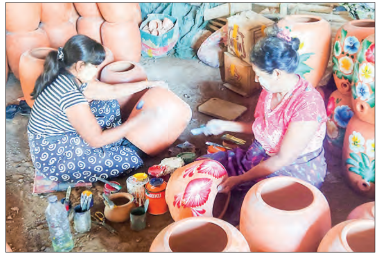
Female workers are seen in production process of pottery industry in Twantay Township.