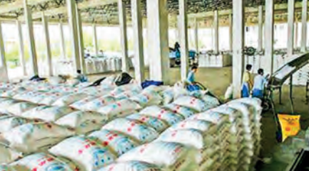
Myanmar imports 1.4M tonnes of fertilizers, over 26,000 tonnes of pesticides in Apr-Dec