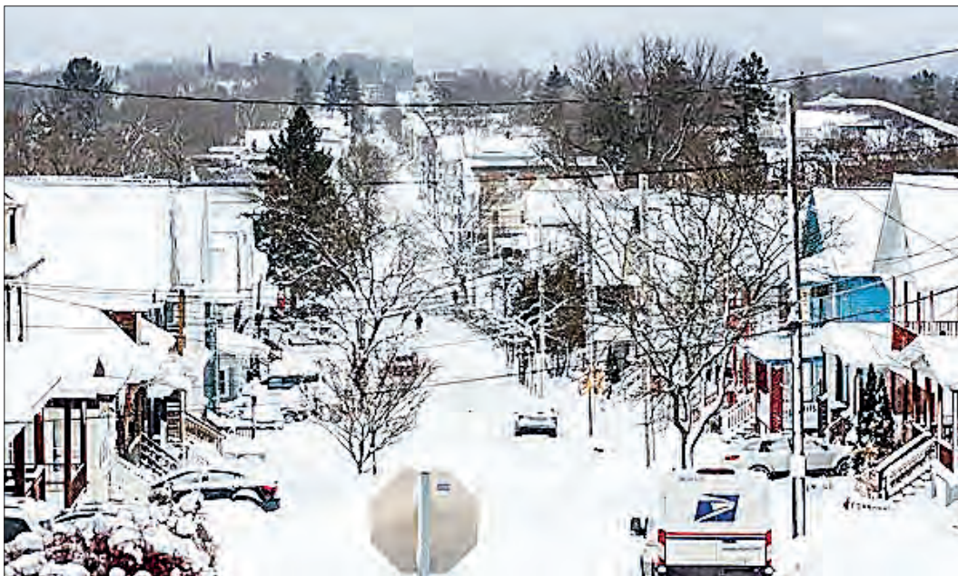
The major winter storm of 2025 is bringing heavy snow, freezing rain, and severe thunderstorms from the Central Plains to the East Coast.

In central Kansas, icy roads caused multiple truck