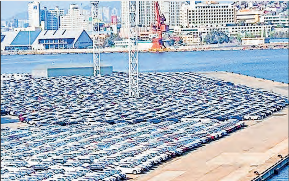
Sales of electric vehicles, on the other hand, dropped 21.2 per cent to 91,385 units in 2024, the data showed.

SOUTH Korean carmakers’ domestic sales of eco-friendly cars hit a new record last year, driven by the popularity of hybrid