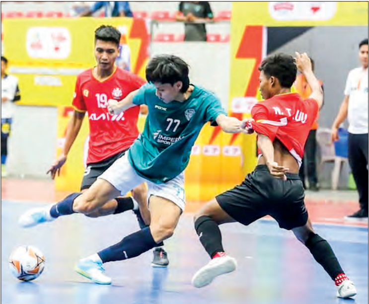
MIU and SGF futsal teams in action during the Futsal League.