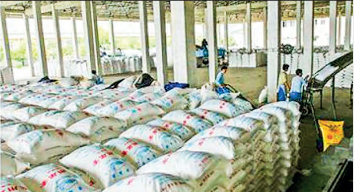
Bags of imported fertilizers in the domestic market.

he added. The steering committee is asked to govern shops in each region and state if they follow the set reference prices of fertilizers after adding transport cost and set profit margin, to report overcharging, to monitor market manipulation with stocks piled up and to cooperate with the officials concerned and the relevant departments. The Union minister also addressed the departments concerned to ensure no delay in import of agricultural inputs, quality assurance and price fairness. At present, the Fertilizer Committee holds a quarterly meeting to ensure quality fertilizers for growers without facing shortages. Under the approval of Fertilizer Technology Group, 11,573 fertilizer registrations