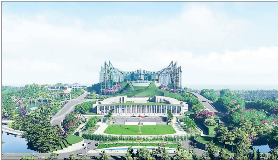
President Joko Widodo has been hampered by a lack of foreign investment, land ownership issues and delays.

"Allow me to apologize for any mistakes and shortcomings in my duties," added Bambang, a former Asian Development