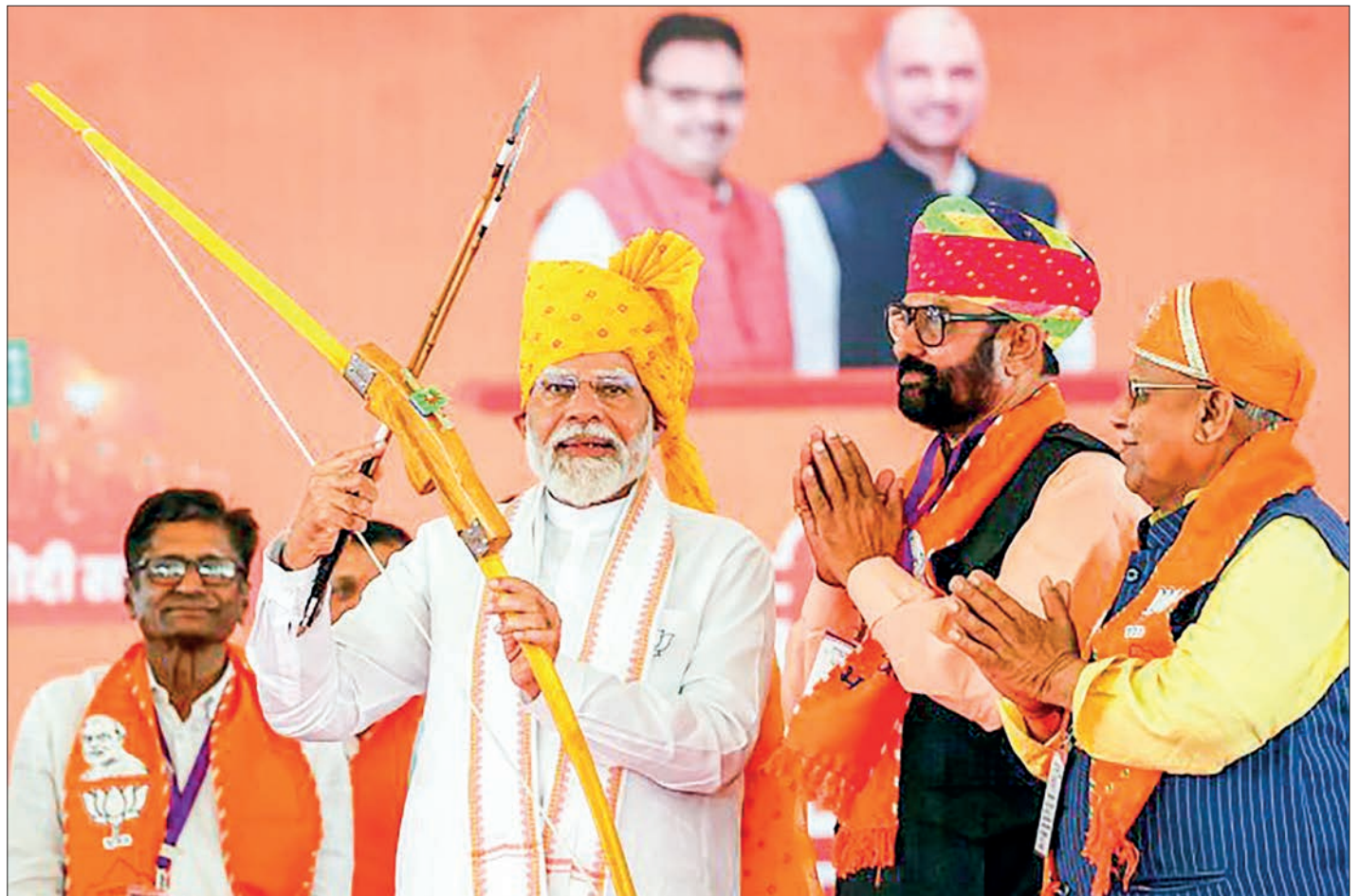
Modi holds a bow and an arrow during a public meeting in Banswara, 21 April 2024.

“ Prime Minister Narendra Modi’s third consecutive victory in the Lok Sabha polls has elicited congratulations from leaders worldwide.”