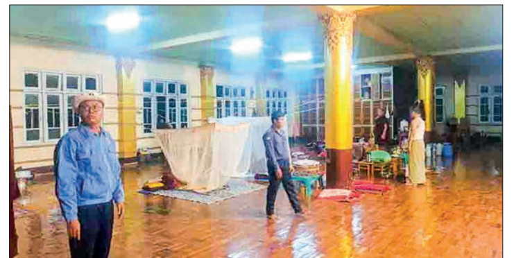
One of the monasteries in Hsehseng, Pa-O Self-Administered Zone, Shan State, restores electricity after repair and restoration work by officials from the Hsehseng Township Electricity Supply Enterprise.

Hsihseng Township Electricity Distribution Committee, township officials and employees have completed the repair work of one 33/11 kV (5) AV main transformer, 113 rooms of 11 kV power lines, 359 rooms of 400-volt power lines and eight damaged 11/0.4 kV (200) kV transformers. Currently, electricity has been restored to six departmental offices and 295