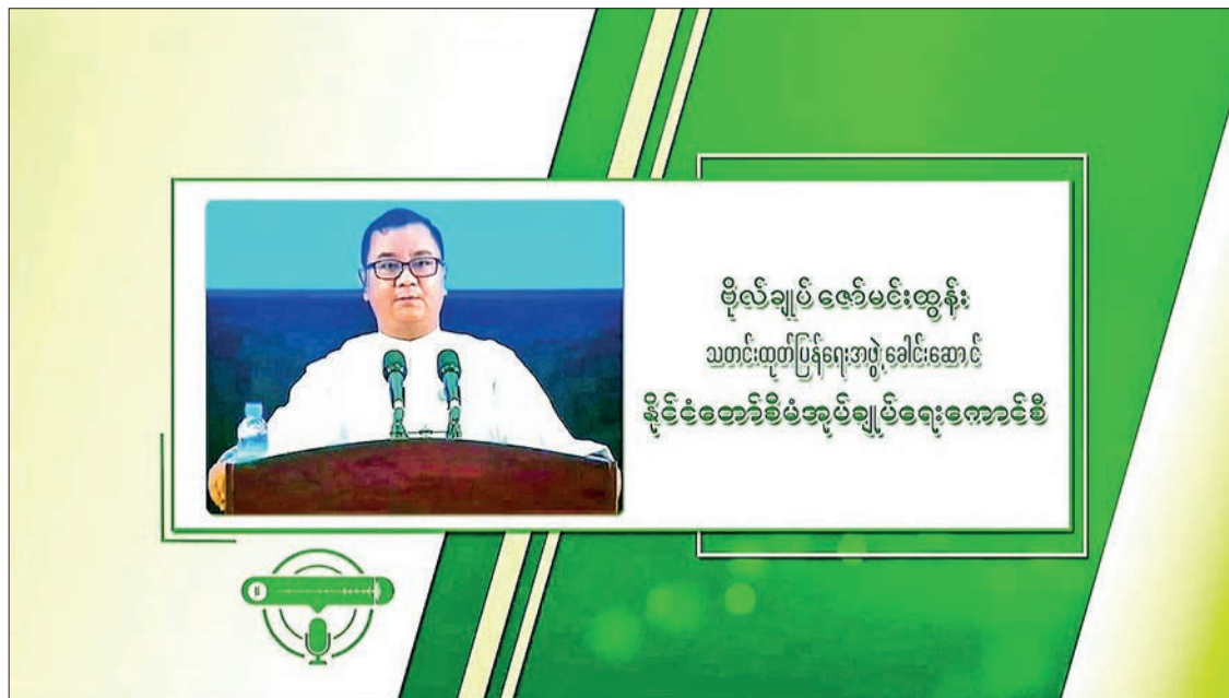
Maj-Gen Zaw Min Tun, Leader of the Information Committee of the State Administration Council.

It is mentioned in the AA's cunning and propagandistic news report that about 40 persons died and women were raped. Such incidents did not take place. There is a reason behind the AA's release of the fabricated news. AA committed the murder of Bengalis in