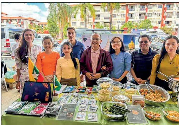
Myanmar ambassador, his spouse and embassy staff at the Myanmar booth.

The report states that the GCCM will donate the proceeds from the bazaar to orphanages, homes for older people, and charities supporting disabled people, people experiencing poverty, and those in need.