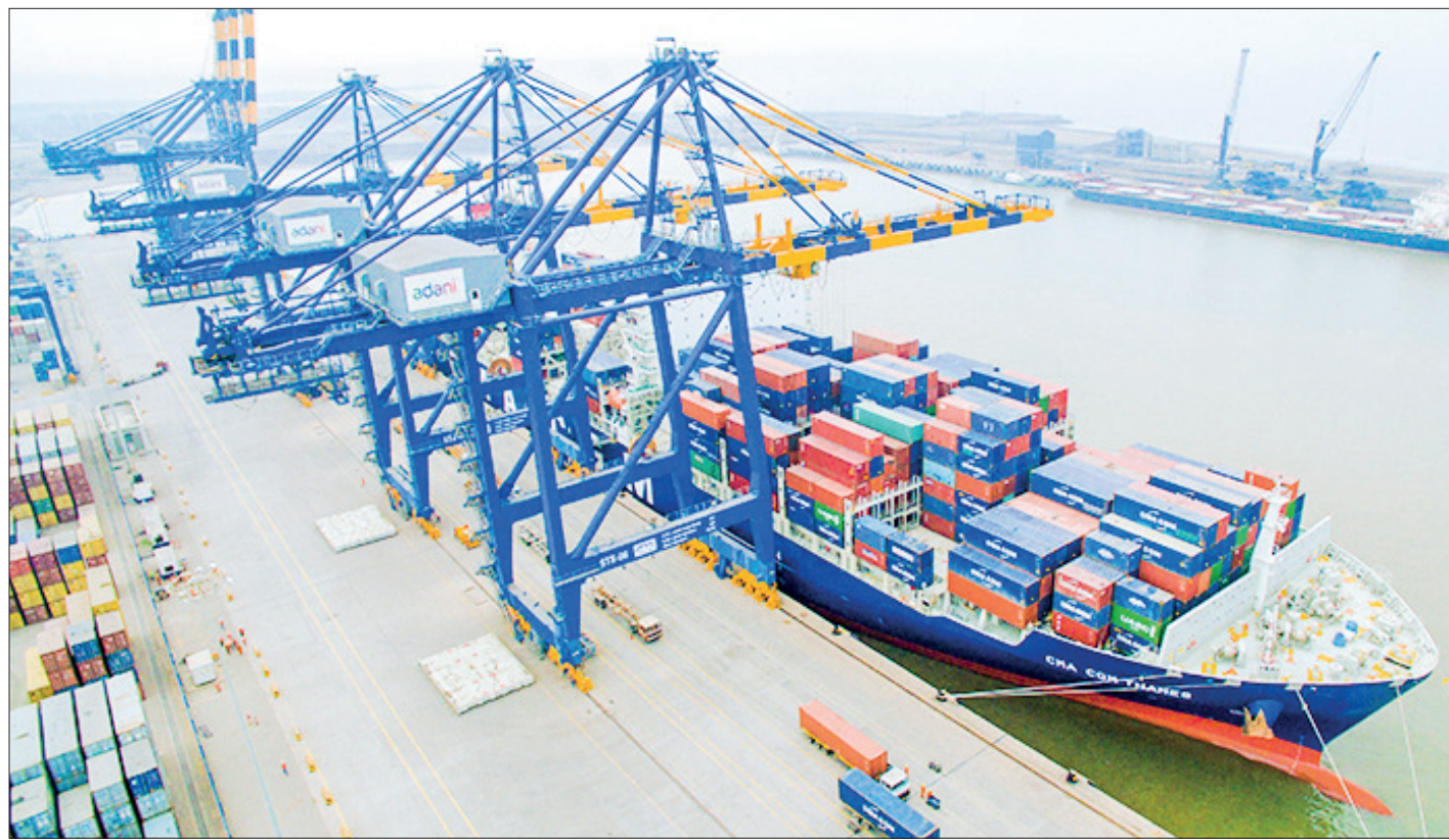
A bird's-eye view of the Yangon International Gateway Terminal on the Yangon River.

Over 260 gem trading licences to expire in July