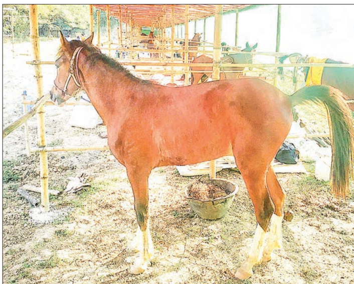
A healthy racehorse.

“Horses don’t like being wet and damp. So, in monsoon season, they need to be kept dry, and we have to care for their hooves. If their hooves are muddy, we need to clean them. Cleaning should be done on a regular basis. Their hooves always get stained because they go on the ground. If they are caught in the rain, we need to dry them back so that they will