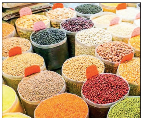
The photo shows pulses and beans seen in a market.

The Myanmar Pulses, Beans, Maize and Sesame Seeds Merchants Association stated that black grams, which India primarily purchases, are commonly found only in Myanmar, whereas pigeon peas, green gram and chickpeas are grown in African countries and Australia. — NN/EM