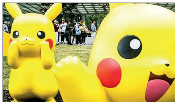
A pandemic-fuelled streaming boom helped boost the global profile of anime.

In 2022, Japan's gaming, anime and manga sectors raked in 4.7 trillion yen ($30 billion) from abroad -- close to microchips exports at 5.7 trillion yen, government data shows. "In recent years, content like anime and manga has played an extremely important role in attracting bigger and bigger young audiences abroad, serving as their 'gateway' to Japan," the strategy document said. — AFP