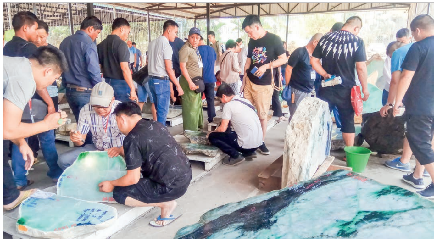
Gem merchants are seen evaluating jade at the previous Gems Emporium.

A total of 268 gem trading licences are due to expire in July 2024, Myanma Gems Enterprise notified.