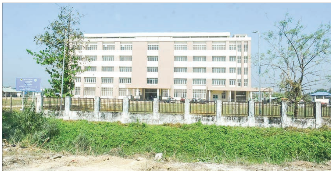
The National Cancer Treatment Centre in Dagon Myothit (Seikkan) Township, Yangon Region.

THE Ministry of Health has reported that various cancer treatments and tests, including cancer drug injections, radiation treatment, and radioiodine administration, were provided at the General Hospitals located in Nay Pyi Taw, Yangon, Mandalay, and Taunggyi in 2023.