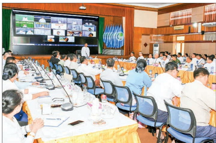
The Government Printing House Management Committee’s coordination meeting 1/2024 in progress in Nay Pyi Taw yesterday.

DEPUTY Minister for Information U Ye Tint, in his capacity as Chairman of the Government Printing House Management Committee, addressed the 1/2024 coordination meeting in Nay Pyi Taw yesterday.