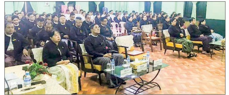
The opening ceremony of the capacity-building training programme 1/2024 for Yangon Region High Court staff.

This course aims to implement the lessons learned effectively, enhancing the efficiency of staff members at the Yangon Region High Court and various court departments. It also seeks to improve office management skills and ensure adherence to staff rules and ethical standards. — TWA/TMT