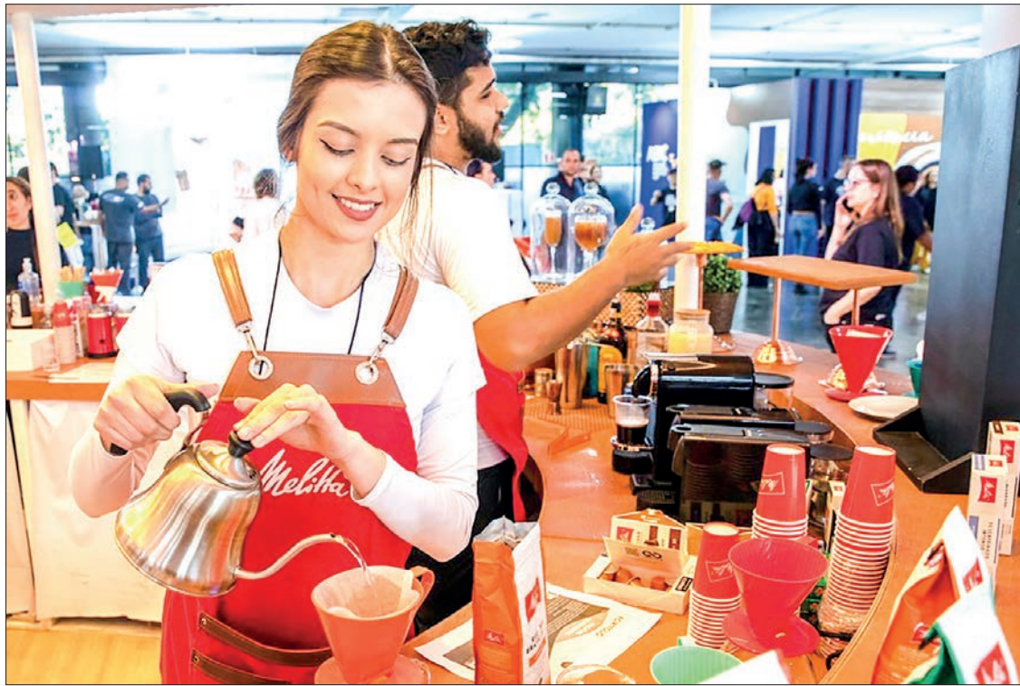
A staff member prepares coffee during the Sao Paulo Coffee Festival in Sao Paulo, Brazil, on 23 June 2023.

Brazil's GDP in the first quarter of 2024 grew by 2.5 per cent compared to the same period in the previous year, according to the Brazilian Institute of Statistics (IBGE).