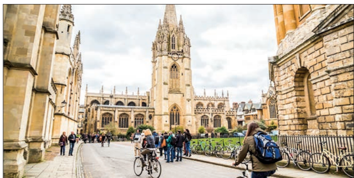
Four British universities retained their spots in the top 10 of more than 1,000 universities ranked by Quacquarelli Symonds (QS).

"This year's results suggest that British higher education has limited capacity remaining to continue excelling in the face of funding shortages, drops in student applications," and restrictions affecting the intake of international students, said head of QS Jessica Turner. In the last few months, the Conservative government has introduced several measures to reduce regular migration which it judges to be too high. — AFP