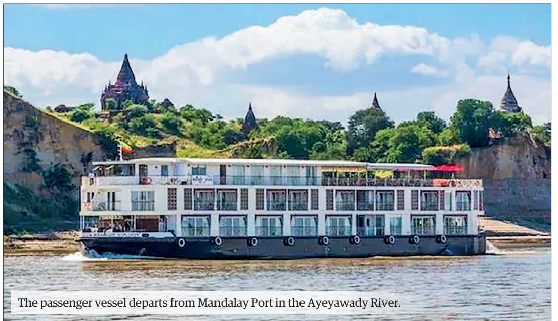
The passenger vessel departs from Mandalay Port in the Ayeyawady River.

Central Executive Committee Young Men's Buddhist Association-YMBA (Central)