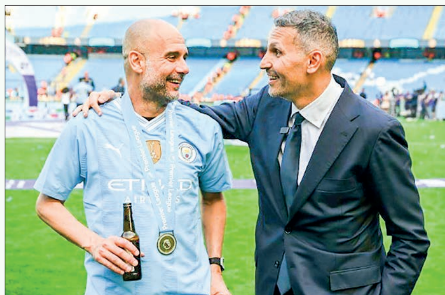
Pep Guardiola (left) has won six Premier League titles in the past seven seasons.

Guardiola's tenure at City has been characterized by short contracts, leaving his future beyond the next season uncertain.