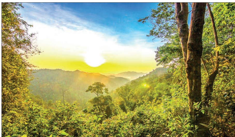
Climate change and biodiversity loss pose significant threats to health, the regional economy, and livelihoods.

WORLD Environment Day is celebrated annually on 5 June, after it was established at the Stockholm Conference on the Human Environment in 1972. Led by the United Nations Environment Programme, it is the largest global platform for public outreach to raise awareness and taking action on urgent environmental issues – the planet’s most-pressing environmental problems.