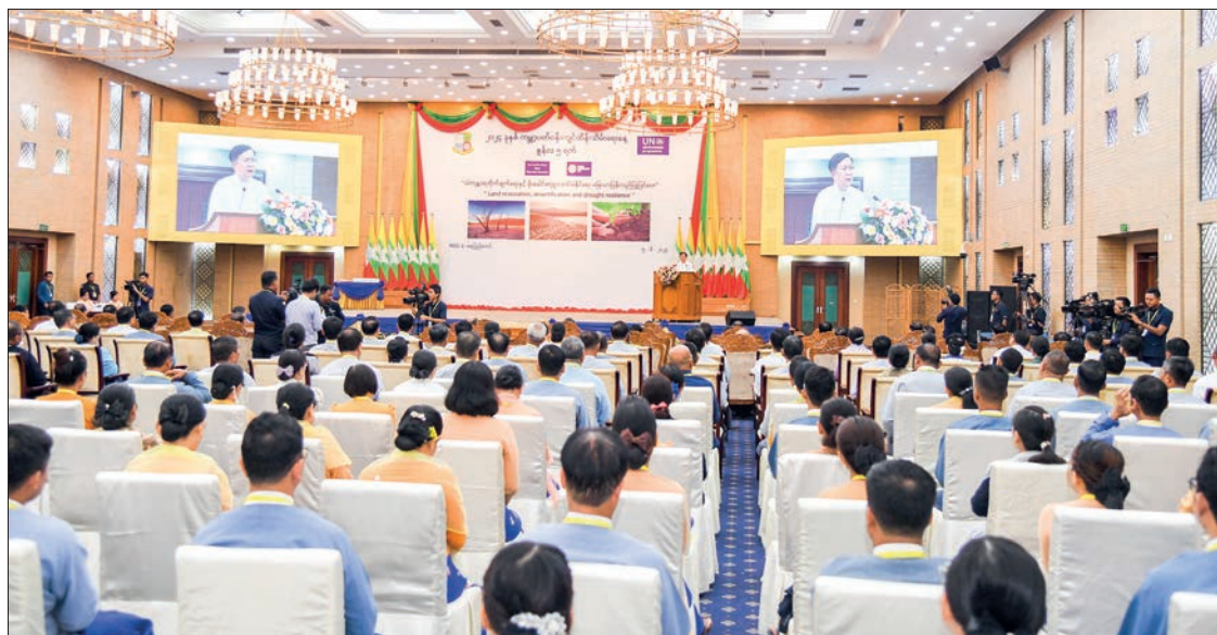
State Administration Council Secretary Lt-Gen Aung Lin Dwe delivers a speech at the 2024 World Environment Day at MICC II in Nay Pyi Taw yesterday.

He also mentioned Chauk Township of Magway Region was hit by the highest temperature at 48.2 degrees Celsius that, past the old highest temperature of 47.4 degrees Celsius, which occurred 56 years ago, vast impacts of increasing temperatures, potential conditions due to climate change, activities to implement the commitments on combatting desertification of Convention objectives by the government after being a member of UN Convention to