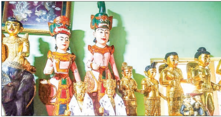
Spirit images used in Nat Festivals.