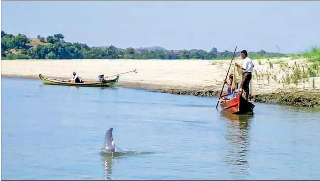
The photo shows artisan net fishing being assisted by Irrawaddy dolphins.

THE Mandalay Region's Irrawaddy Dolphin Conservation Area is experiencing a surge in domestic visitors, according to U Maung Maung Lay, Chairman of the Department of Fisheries' Irrawaddy Dolphin Conservation Group. Tourists are flocking to witness the unique collaboration between local fishermen and dolphins during the Ayeyarwaddy River's high water season.