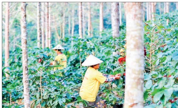
Female workers are seen harvesting coffee beans in PyinOoLwin.

The micro, small and medium-sized enterprises (MSMEs) based on coffee and local products are being prioritized in the PyinOoLwin area. Efforts are being exerted to enhance coffee cultivation in PyinOoLwin to contribute to the socioeconomic development of the region. There are around 40,000 acres of coffee across the country, with an estimated production of 8,000-10,000 tonnes. Coffee zones are designated in northern Shan State, Nawnghkio, Ywangan and PyinOoLwin, Mandalay areas. The coffee plantation is also found in