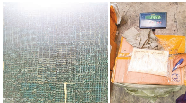
Confiscated illegal items at Myanmar Industry Port, Yangon.

The Illegal Trade Eradication Steering Committee reported that five arrests were made on 3 and 4 June, totalling an estimated value of K127 million. — MNA/MKKS