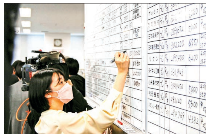
An official from the Japan Association of Metal, Machinery, and Manufacturing Workers writes down offers received by member labour unions from management during annual wage negotiations in Tokyo.

Despite this improvement, uncertainty remains regarding when real wages will turn positive, considering the anticipation of price hikes in essential items such as food, driven by higher raw material costs and the depreciation of the yen.