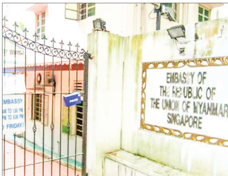
Myanmar Embassy in Singapore.

Those who want to do passport extension on 23 June can register along with passport page and front and back copy of unexpired Identity Card (IC) which are required to submit to WhatsApp number +6581748993, from 1 June to 14 June and the list of eligible names will be an-