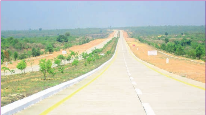
A general view of the Yangon-Mandalay Expressway.