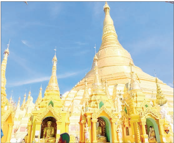
The photo captures the Shwedagon Pagoda.

nuns, more than 3 million local men and over 3.6 million local women, as well as over 36,000 foreign men and nearly 40,000 foreign women, visited Shwedagon Pagoda, bringing the total number of pilgrims to more than 6.9 million. The number of pilgrims averages at least around 10,000 per day from Monday to Friday, and is higher on government and public holidays,” said U Bo Thin, a member of the Pagoda Board of Trustees. Currently, due to the increasing number of pilgrims, Shwedagon Pagoda has been open from 4 am to 10 pm. since 21 June 2024, in order to ensure that pilgrims can visit the pagoda in peace and tranquillity. — ASH/MKKS