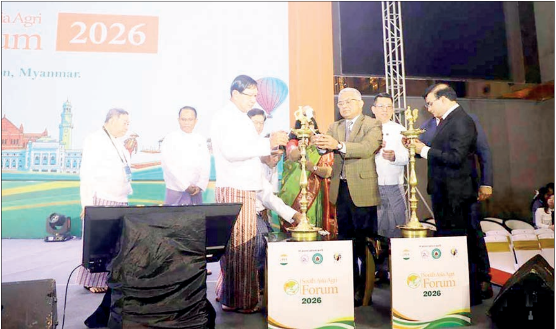
Participants are seen attending the 4 th South Asia Agri Forum 2026.

According to a Memorandum of Understanding signed in 2021, India has been importing 250,000 tonnes of black gram and 100,000 tonnes of pigeon pea from Myanmar for five consecutive years from the 2021-2022 financial year to the 2025-2026 financial year. This government-to-govern-