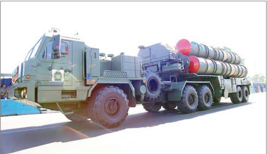
Military equipment is displayed during the Army Day parade in Tehran, Iran, 18 April 2025.

MILITARY actions in Iran can create chaos in the region and lead to the destabilization of the situation in the entire region, Kremlin spokesman Dmitry Peskov said on Thursday. “Any forceful actions can only create chaos in the region and lead to very dangerous consequences in terms of destabilizing security systems throughout the region,” Peskov told reporters. The official called on all parties to exercise restraint and abandon the use of force to resolve the issue, noting that the negotiating potential on the situation around Iran is far from exhausted. The New START (New Strategic Arms Reduction Treaty) is about to expire, and the United States has not yet responded to Russia’s initiative under this treaty, Dmitry Peskov said. “We keep waiting, but the deadline is running out. There was no response from the United States,” Peskov told reporters, adding that Moscow will see how the situation around the treaty will develop. — SPUTNIK