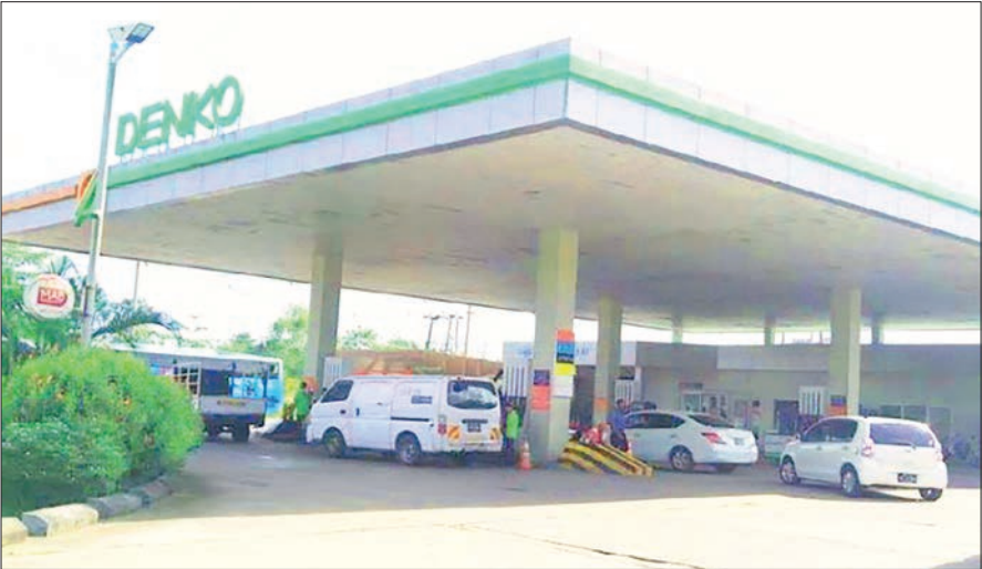
Vehicles are seen refuelling at the petrol station.

CBM aims to curb the instability in the foreign exchange market and currency devaluation. According to CBM's notification on 15 March 2024, it has been collaborating with law enforcement agencies to combat and prosecute those who attempt to manipulate the currency market under the existing laws. CBM allowed authorized dealers (private banks) to operate online foreign exchange trading freely as per the market rate, depending on supply and demand, starting from 5 December 2023. — NN/KK