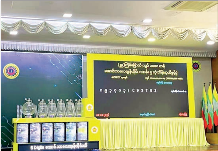
The lucky number for the jackpot grand prize drawn at the 29 th opening. tery opens on the 1st and 16th day of the month at every 2 pm and selects winners of the jackpot grand prize, unit prizes and other prizes by a digital drawing machine. — MT/ZS

AT the 31 st opening, the five-digit Aung Bar Lay online lottery has raised the jackpot grand prize to K200million. Tickets can be available until 31 January, and your luck will be locked at 11:59 am on the day. No jackpot winner appeared at the 30 th opening, so the prize will be doubled to K200 million at the 31 st opening. At Myanmar’s first five-digit ABL application, you can choose lottery tickets at your desire with K1,000 per ticket and make payment by e-wallet or by dialling *117# with a Mytel sim. The five-digit online lot-