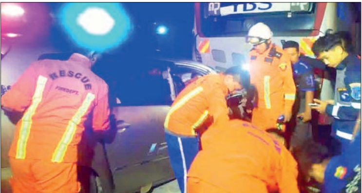
An accident involving a YBS bus and a private vehicle is pictured on 3 January 2026.

IN response to a query from The Global New Light of Myanmar (GNLM), the Yangon Region Public Transport Committee (YRTC) stated that during 2025, YBS accidents resulted in 54 injuries and 32 deaths, marking a decrease in casualties compared to the previous year. There were a total of 72 incidents (64 collisions and eight other cases) between January and December. Monthly breakdown shows: January: seven collisions, two others (12 injuries, five deaths), February: three collisions, one other (four injuries, one death), March: three accidents, another one (one injury, three deaths), April: two collisions (two deaths), May: six collisions (six injuries, two deaths), June: four collisions, another one case (three injuries, two deaths), July: six collisions, another one case (five injuries, five deaths), August: eight collisions (eight injuries), September: 11 collisions (five injuries, four deaths), October: five collisions (seven injuries, three deaths), November: three collisions, another one case (one injury, two deaths) and December: six collisions, another one case (two injuries, three deaths). In 2024 (from 1 January to 15 December), there were 70 YBS accidents resulting in 36 deaths and 136 injuries. YRTC stated it is continuously working towards its primary goal of providing “Safe Public Transport to All” and establishing a secure, high-quality public transport system. — MT/ZN