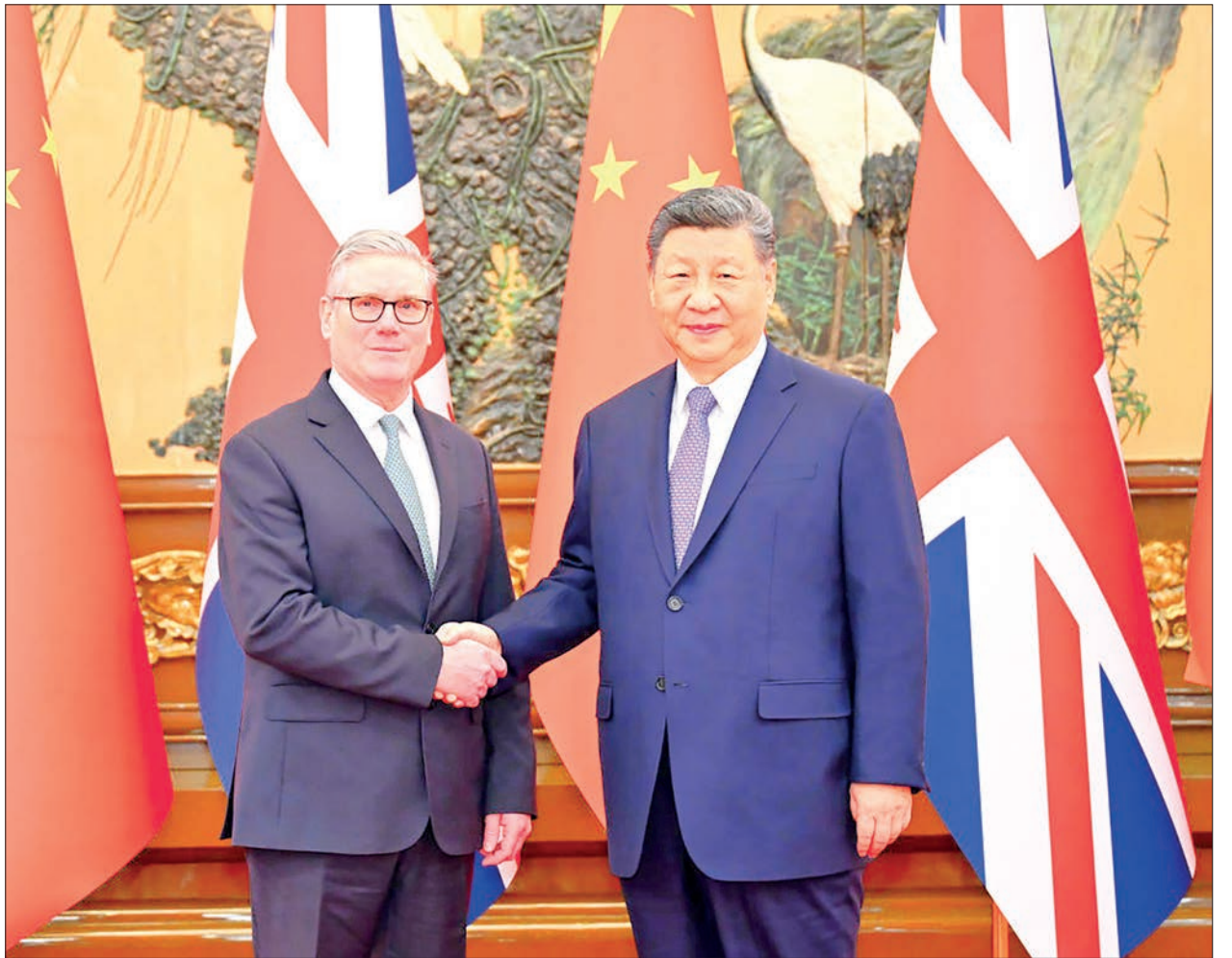
Chinese President Xi Jinping (right) and British Prime Minister Keir Starmer shake hands as they meet in Beijing, China, 29 January 2026.

Xi urged extending frontiers in mutually beneficial cooperation with Britain in education, medicare, finance and the service industry. — Xinhua