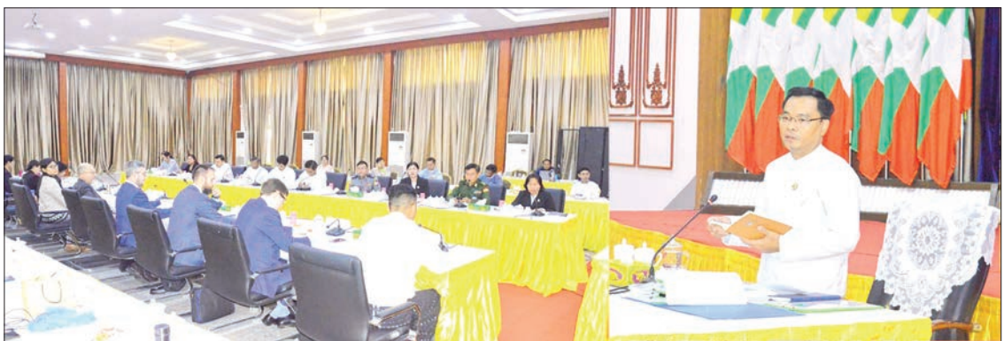
The third Myanmar-Russia Biosafety Meeting is underway yesterday, addressed by Deputy Minister Dr Aung Zeya.

Confidence Building Measures (CBMs) to the Implementation Support Unit on eight occasions between 2016 and 2025, contributing to trust-building among countries each 15 April. Given historical experience and contemporary biological hazards, biosafety is a sector of critical importance for ensuring the long-term survival of humanity. Threats may emerge from animals, plants, genetically modified crops and products, as well as AI-based biological technologies. The meeting is regarded as a key step in fostering strategic, long-term cooperation between Myanmar and Russia to address such risks. Officials from the Russian Federation also attended, ref-