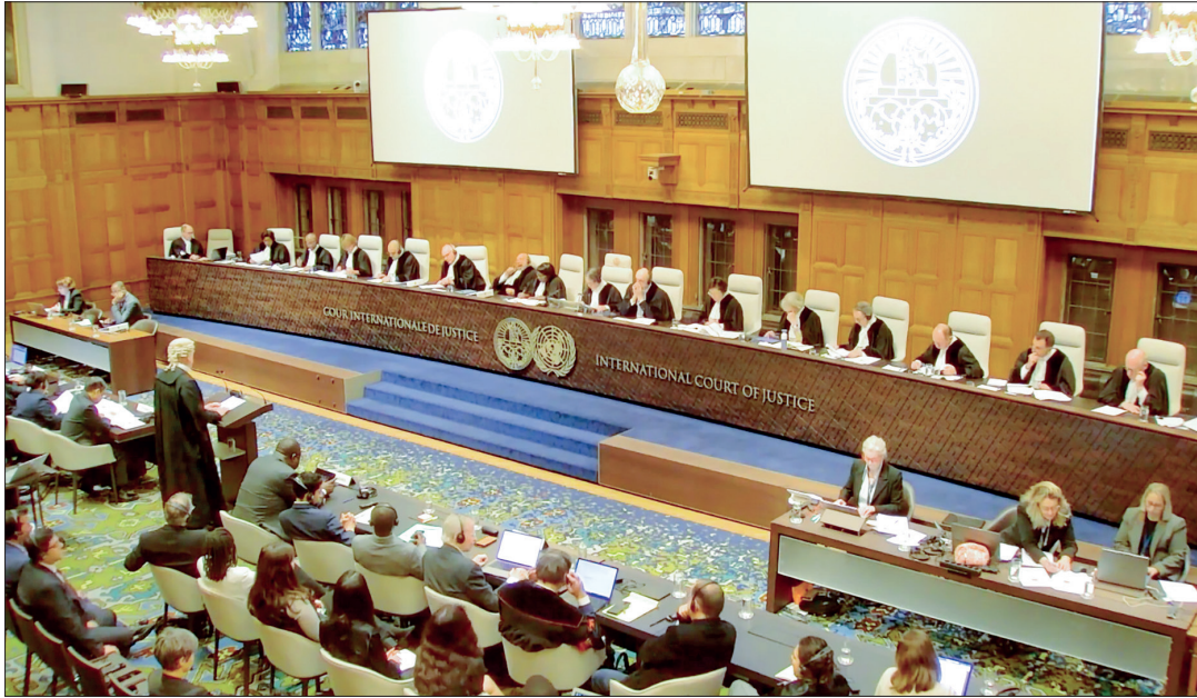
The second round of Myanmar's oral arguments is underway at the International Court of Justice (ICJ) in The Hague, the Netherlands.

ORAL hearings in the case between The Gambia and Myanmar are currently held at the International Court of Justice in The Hague, the Netherlands, from 12 to 29 January, with Myanmar's second round of submissions having begun at 3 pm local time on 28 January. Myanmar's legal team re-