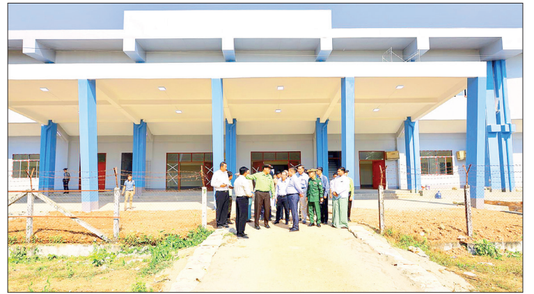
The Mon State chief minister and officials are pictured during their inspection tour in Mawlamyine.

Mon State Chief Minister U Aung Kyi Thein also inspected progress in the construction of the gymnasium in the Mon State Sports Park and the Cultural Museum in Minywa Village of Mawlamyine Township.