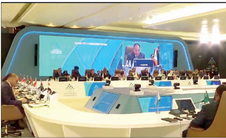
Union Minister U Aung Kyaw Hoe speaks at the Global Labour Market Conference 2026 in Riyadh, Saudi Arabia.

A Myanmar delegation led by Union Minister for Labour U Aung Kyaw Hoe attended the Global Labour Market Conference 2026, held on 26-27 January in Riyadh, Saudi Arabia, and arrived back in Yangon on 28 January. The conference was convened with the aim of addressing challenges currently faced by labour markets worldwide and creating better employment opportunities for the future. The first section of the conference took place at the Ritz-Carlton Hotel in Riyadh on 26 January, and Mr Ahmed bin Sulaiman Al-Rajhi, Minister of Human Resources and Social Development of Saudi Arabia, delivered an opening speech. During the Ministerial Roundtable themed “From Policy to Practice: Opening Immediate Pathways to Work Amid Rapid Change”, the Union minister stated that the Global Labour Market Conference was first initiated in 2023 to prepare young people for technology, and