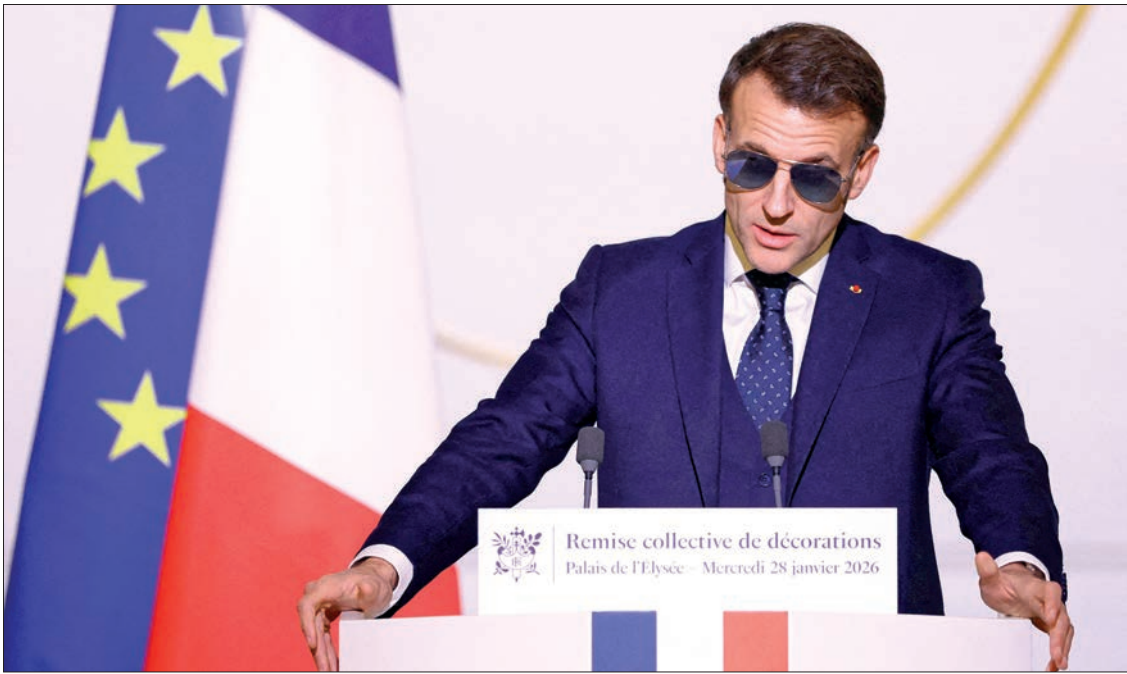
French President Emmanuel Macron, wearing sunglasses, delivers a speech during a ceremony to award the Chevalier of the French Order of Merit at the Elysee Palace in Paris on 28 January 2026.

Rising diplomatic tensions between Europe and the United States over Greenland's strategic importance in the Arctic. FRENCH President Emmanuel Macron said on Wednesday that escalating tensions with the United States over Greenland constitute a strategic wake-up call for Europe as a whole, while reiterating France’s solidarity with Denmark and Greenland. “Recent events confirm that the situation in Greenland is a strategic wake-up call for all of Europe: on asserting our European sovereignty, on our contribution to Arctic security, on combatting foreign interference and disinformation, on the fight against climate change, and on a privileged partnership for sustainable development and reducing strategic dependencies,” Macron said at a joint press conference with the leaders of Denmark and Greenland in Paris. Macron said France is deeply committed to the principles of sovereignty and territorial integrity with all its partners in the European Union, adding that France will continue to defend these principles in accordance with the Charter of the United Nations. — Xinhua