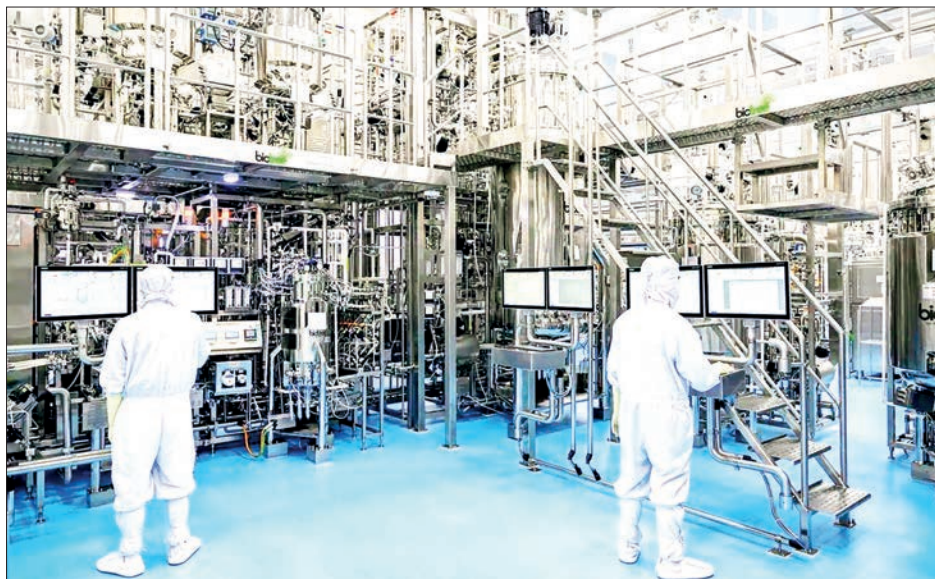
The Serum Institute of India (SII) is the world's largest vaccine manufacturer by volume. Based in Pune, India, the company produces approximately 1.5 to 1.9 billion doses annually, supplying vaccines to over 170 countries.

THE conclusion of the India-EU Free Trade Agreement (India-EU FTA) has opened major opportunities for the two regions to emerge as a global supplier of affordable and quality medicines, according to the Indian Pharmaceutical Alliance (IPA).