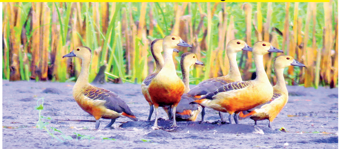
This image shows the Indawgyi Lake hosting both migratory and resident birds.