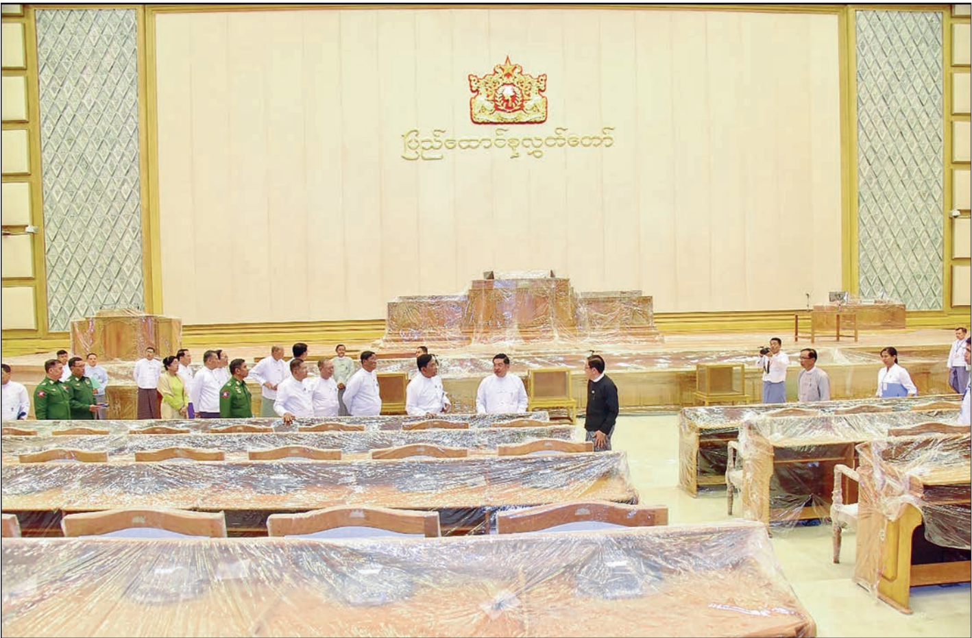
Prime Minister U Nyo Saw inspects the preparatory work at the Hluttaw buildings after presiding over the first coordination meeting of the Hluttaw Session Convening Central Committee yesterday.

Furthermore, the Prime Minister stressed the need to check and conduct test-running of the telecommunications