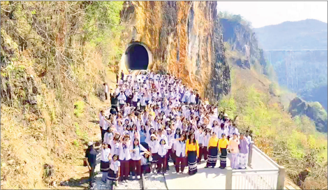
Joyful train travellers pose for a group commemorative photo near the PyinOoLwin -Gokteik railway.

Since the service began, a total of 13 regular train trips have been operated, carrying 621 passengers. In addition, eight trips have been run using upper-class RBE accommodating 24 passengers each under package arrangements, while six trips using ordinary-class RBE carrying 40 passengers each have transported 432 passengers. Furthermore, special trips were arranged with large chartered trains for school groups: on 12 and 16 January, 540 students and teachers from Snow Queen Private High School from PyinOoLwin were transported; on 28 January, 300