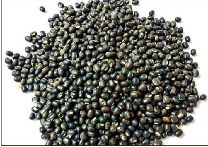
India has been partnering with Myanmar for the black gram trade for a long time.

INDIA, the leading buyer of Myanmar's black gram (urad), is possibly to bring in 50,000 tonnes of urad from Brazil, citing news reported by the Hindu Businessline.