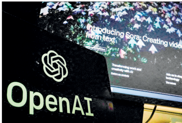
In this photo illustration, Open AI's newly released text-to-video "Sora" tool is advertised on their website on a monitor in Washington, DC, on 16 February 2024

"The new voice (and video) mode is the best computer interface I've ever used. It feels like AI from the movies," said OpenAI CEO Sam Altman in a blog post.