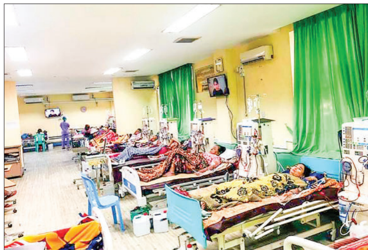
Some patients are in the renal unit of Pyinmana Sangha Hospital.

"A dialysis patient is a person whose kidneys have stopped working. When the kid-