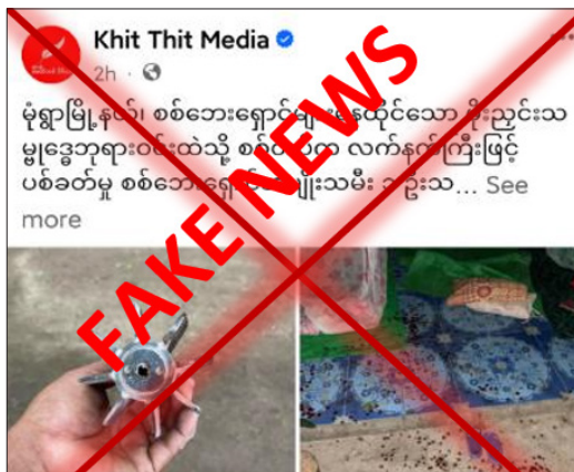
The screenshot validate false claims.

Terrorists often take cover behind public places such as schools, hospitals, and religious buildings during confrontations. Certain media outlets with ill intentions are spreading misinformation to sow discords and create misunderstandings between the public and security forces. — MNA/NT