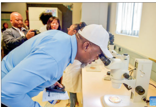
A man looks at a sample under a microscope at a laboratory during a commemoration of the International Day of Plant Health in Gaborone, Botswana, on 13 May 2024.

Results for the Lok Sabha Elections are scheduled to be declared on 4 June. — ANI