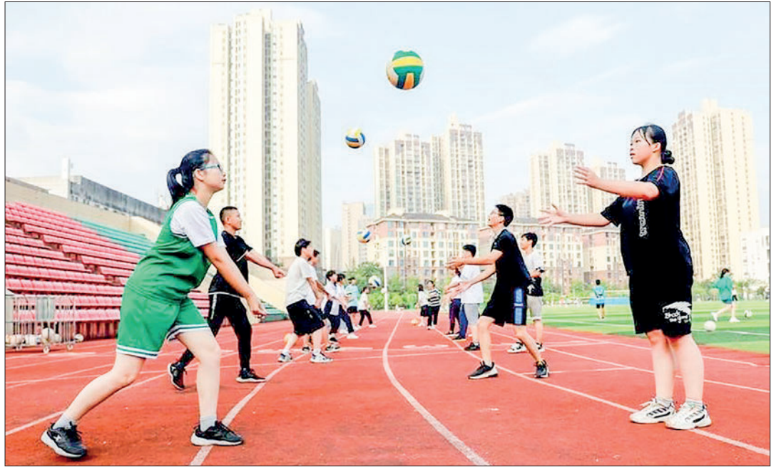
Students play volleyball during a physical class as a daycare service during summer vacation provided by Shuanghe No 2 High School in Huaying City, southwest China's Sichuan province, 22 July 2021.