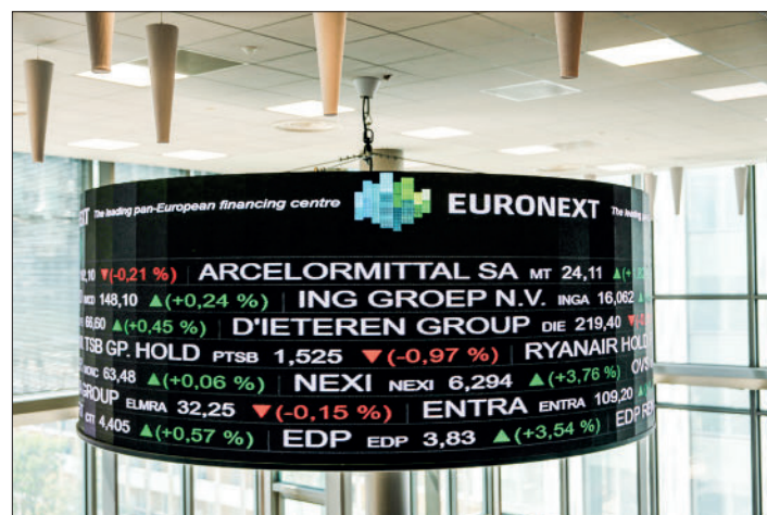
This photograph shows the Euronext's stock price indicator display at Euronext building in La Defence, on the outskirts of Paris, on 10 May 2024.

The reports come after a survey by the New York Fed showed inflation expectations among US consumers had climbed to their highest level since November. — AFP