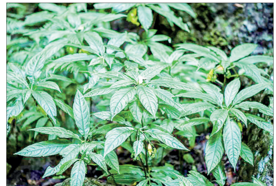
This photo taken on 7 October 2019 shows a new species of impatiens named Impatiens beipanjiangensis in Panzhou City, southwest China's Guizhou Province.