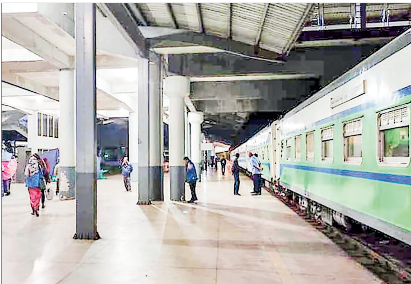
Photos showcase the Up and Down trains that run the Yangon-Mawlamyine-Yangon railway.

Thai and Bangladeshi buyers visit Myanmar for coconuts