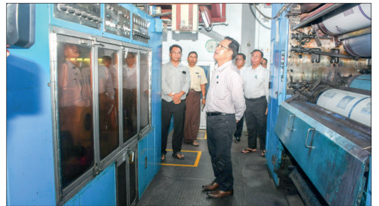
Union Minister U Maung Maung Ohn views the printing press of The Global New Light of Myanmar.

He then called on the attendees to ensure the printing quality, complete the printing services without any errors in time and be aware of the waste of raw materials.