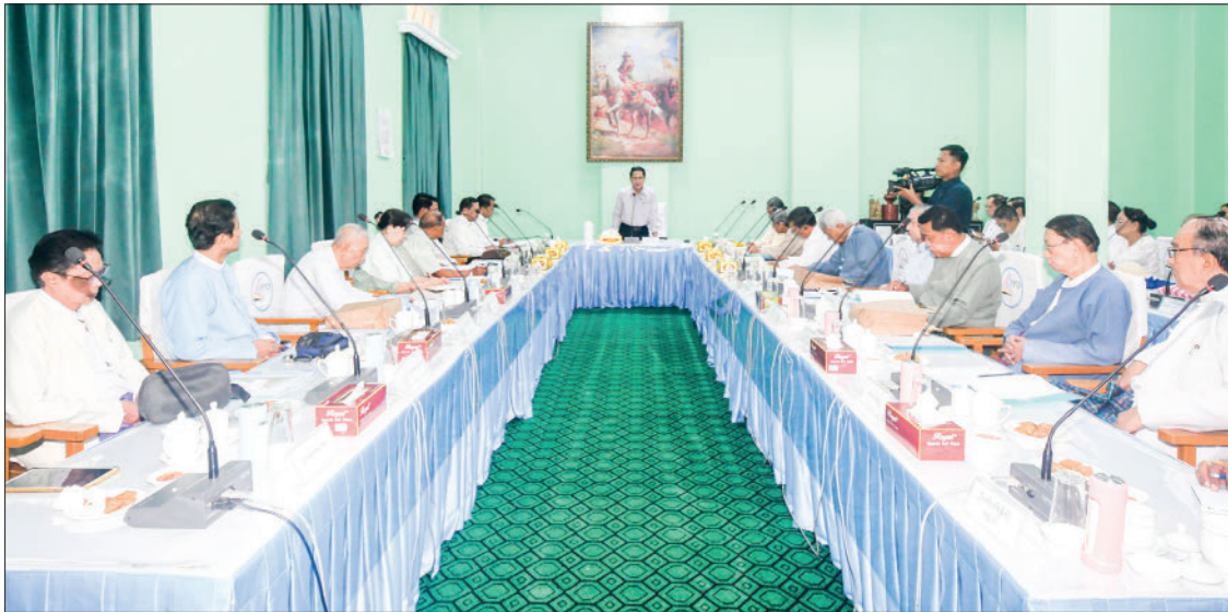
Union Minister U Maung Maung Ohn meets doyen of the literati yesterday in Yangon.

UNION Minister for Information U Maung Maung Ohn met members of the National Literary Award Selection Committee and the Sarpay Beikman Manuscript Award Selection Committee yesterday in Yangon.