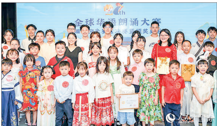
A glimpse of the Seventh Global Chinese Language Prose Reading Competition.

The Union minister, Myanmar Libraries Foundation Patron U Kyaw San and relevant officials received cash donations from the well-wishers. The Union minister and party observed the books and publications displayed at the event. — MNA/KTZH