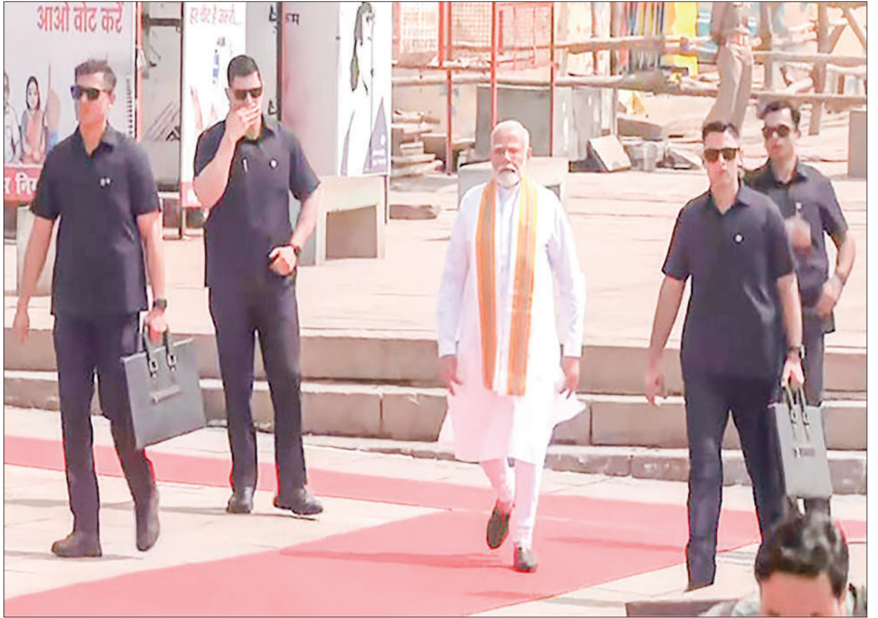
PM Narendra Modi in Varanasi ahead of filing his Lok Sabha nomination on 14 May.