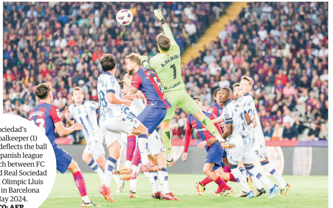
Real Sociedad's Spanish goalkeeper (1) Alex Remiro deflects the ball during the Spanish league football match between FC Barcelona and Real Sociedad at the Estadi Olimpic Lluis Companys in Barcelona on 13 May 2024.

"La Real are a great team, it's an important victory for us, we had a good game in general," Barca coach Xavi told Movistar. — AFP