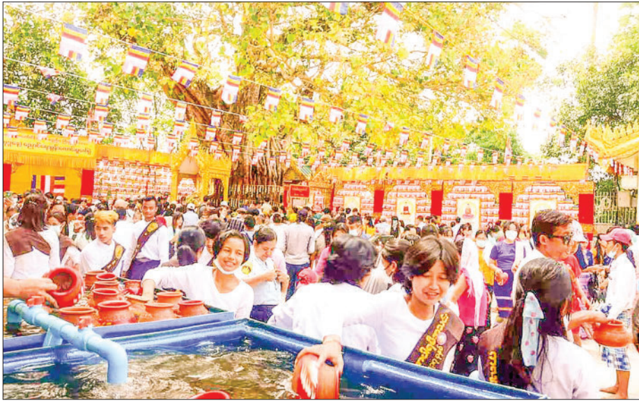
Devotees are seen pouring water onto the Maha Bodhi tree in the previous year.

THE 41 st Kason Water Pouring Festival will be held at the Shwedagon Pagoda, as announced by the Shwedagon Pagoda Board of Trustees.