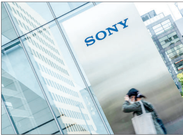
(FILES) This photo taken on 31 October 2022 shows a woman walking past the Sony logo outside the company's headquarters in Tokyo. Japan's Sony said on 14 May 2024, that annual net profit fell 3.5 per cent year-on-year to 6.2 billion USD in 2023-24, beating the company's forecast of 920 billion yen