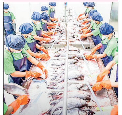
Diligent workers in action on the fishery processing line.

Myanmar sends fisheries such as fish, crab, and shrimp to neighbouring countries (China and Thailand) through Muse, Myawady, Kawthoung, Myeik, Sit-tway and Maungtaung border posts. They