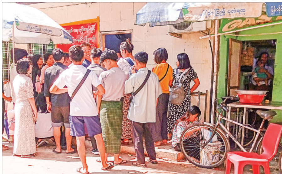
The photo shows the queue of people who are waiting to get UID numbers in Sangyoung Township.

UID numbers are being issued free of charge by the relevant immigration and population offices, as well as mobile teams conducting field operations. However, there have been reports of individuals employing brokers to obtain