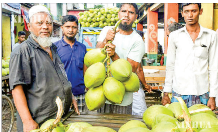
Green coconuts are on sale at a market in Dhaka, Bangladesh.

A virtual meeting to present the prospects of the coconut market, which has been promising as an export item, was held at Myanmar Trade Promotion in April. — Thit Taw/ZS