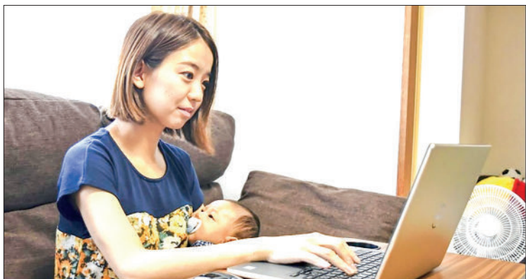
The survey indicated that the average frequency of teleworking remained unchanged at 2.3 days per week compared to the previous year.

After the government downgraded the legal status of COVID-19 in May last year, roughly aligning it with seasonal influenza, the change in teleworking patterns became notable. — ANI