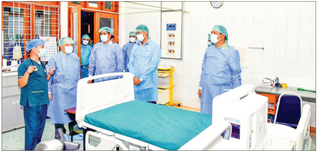
The Indian medical delegation is pictured during their visit to Myanmar Hospital.

training aids for capability development. This initiative will enhance the capabilities and capacities of Myanmar medical services to provide better healthcare facilities in the future. — MNA