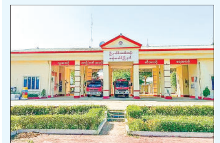
The photo shows the Dekkhinathiri Fire Station, where the tender form is to be submitted.

Furthermore, individuals encountering difficulties or facing demands for payment while attempting to obtain a UID number are encouraged to contact and report such issues through the Facebook page of the Electronic Registration System Department – eIDDept. — TWA/TRKM