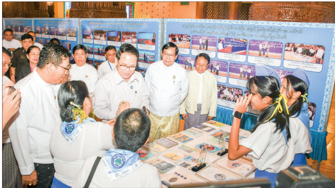
Developing libraries and raising reading habits campaign is launched yesterday, attended by Union Information Minister U Maung Maung Ohn.

Moreover, the State Administration Council organized the Myanmar Libraries Development Cooperation Committee, which aimed to improve read-