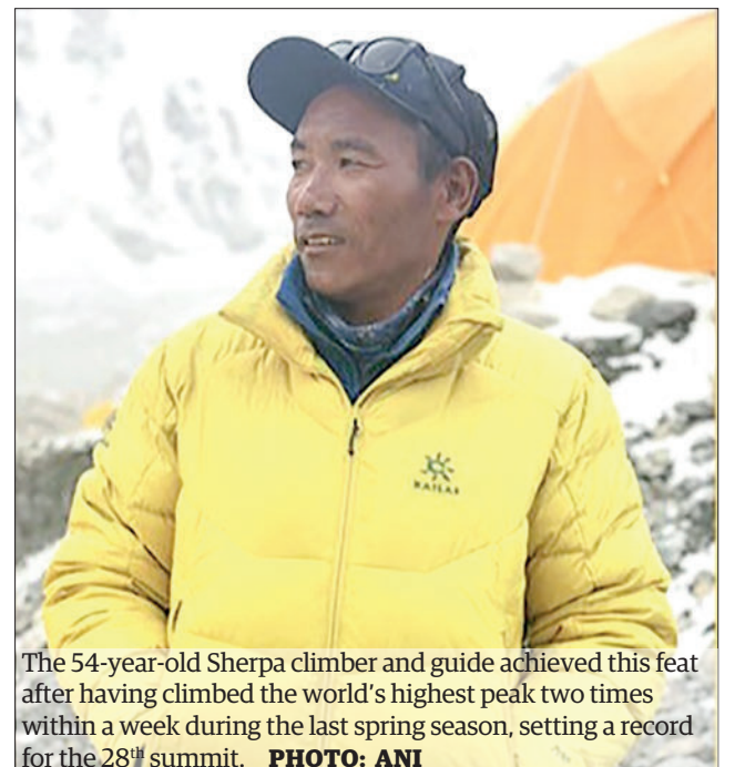
The 54-year-old Sherpa climber and guide achieved this feat after having climbed the world's highest peak two times within a week during the last spring season, setting a record for the 28 th summit.

Sherpa at the end of May had begun his expedition from Kathmandu accompanying a mountaineering expedition team comprising about 28 climbers. Kami Rita has been climbing Sagarmatha as a guide for the climbers.