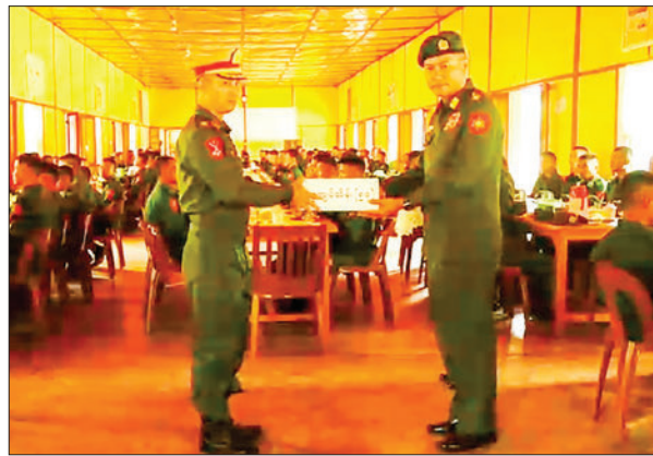
Photos depict the opening ceremonies and related activities of the Training No 2 for people military servants.

as every citizen is under a duty to safeguard Our Three Main National Causes: non-disintegration of the Union, non-disintegration of national solidarity and perpetuation of sovereignty.