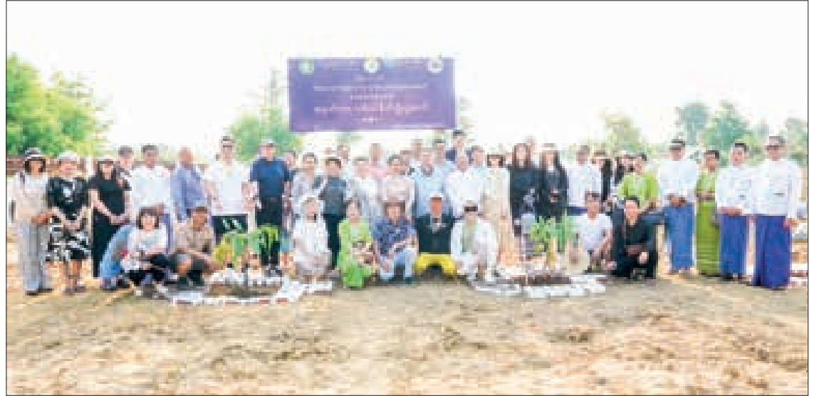
Myanmar-China FAM Trip participants pose for the group documentary photo at yesterday's event.