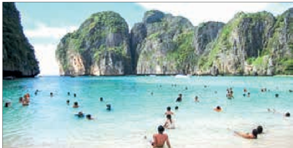
Maya Bay, Thailand. More than three-quarters of Thailand's coral reefs have been damaged by rising sea temperatures and tourism activities.

"I think we are beyond the 1.5 (degrees Celsius) already," he told AFP, referring to the increase in global temperatures from pre-industrial levels. "Now we have to come back and think about adaptation." — AFP