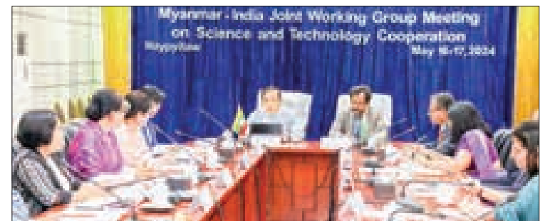
Myanmar-India Joint Working Group Meeting on Science and Technology Cooperation in progress in Nay Pyi Taw yesterday.

THE joint working group meeting on Myanmar-India science and technology cooperation was held on 16 and 17 May at the Ministry of Science and Technology Office in Nay Pyi Taw. They discussed the events in science and technology fields that will allow cooperation between Myanmar and India in the future, the possibility of joint projects and joint activities, and the establishment of joint research projects in science and technology.