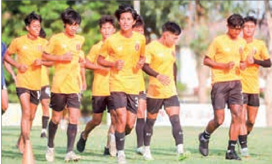
Myanmar U-20 team under training in the football ground.

MYANMAR'S U-20 men's football team, made up of talented new-generation players who have won some top domestic clubs, will play two friendly matches