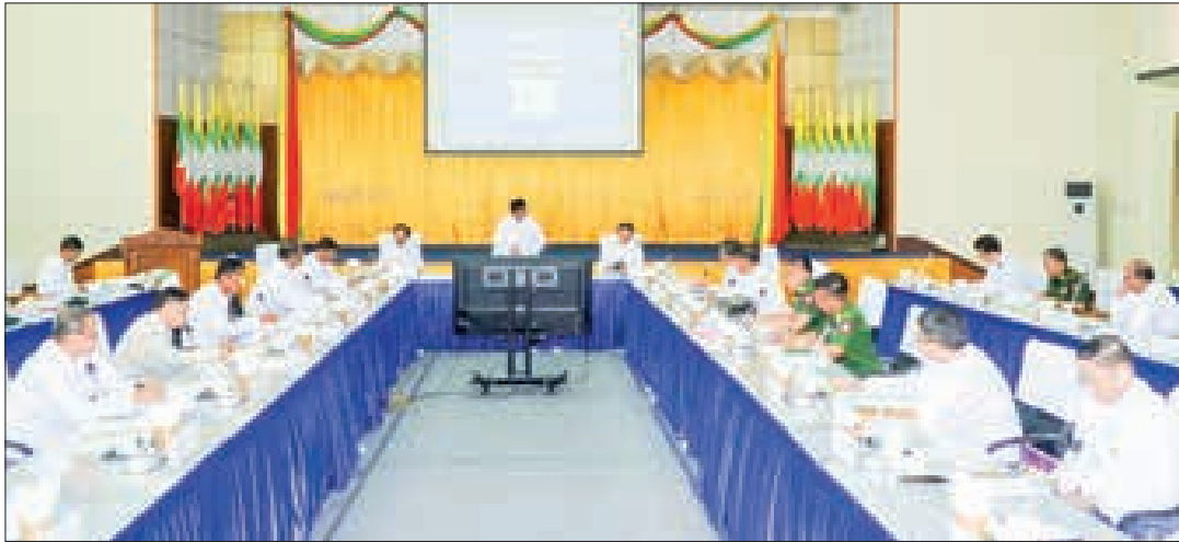
The meeting of Central Leading Body for Prevention of Hazards from Chemicals and Related Substances (1/2024) was held at Ministry of Industry on 14 May.

ETHYLENE oxide, previously listed as a prohibited chemical, will now be classified as a restricted chemical, according to the Central Leading Body for the Prevention of Hazards from Chemicals and Related Substances.