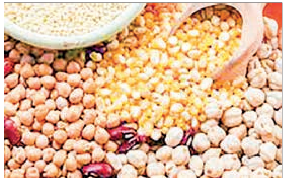
Pulses and beans seen in the market.

Myanmar mainly exports black grams, green grams and pigeon peas to foreign markets. Of them, black grams and pigeon peas are primarily shipped to