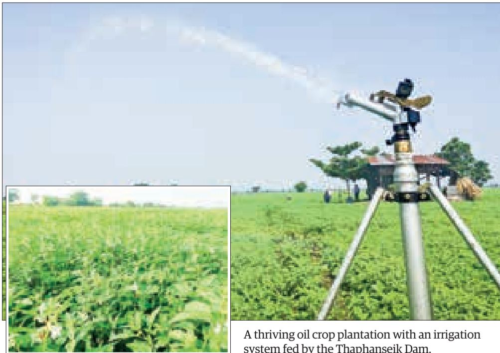
A thriving oil crop plantation with an irrigation system fed by the Thaphanseik Dam.

THE Regional Irrigation and Water Utilization Management Department has reported that sesame crop productivity is high in the Thaphanseik irrigated zones this summer cultivation season, thanks to the dams, lakes, and water reservoirs developed by the State. There are 35 sites in Sagaing Region and one at the border of the Sagaing and Magway regions, benefiting a total of 539,332 acres for water storage to support seasonal cultivations.