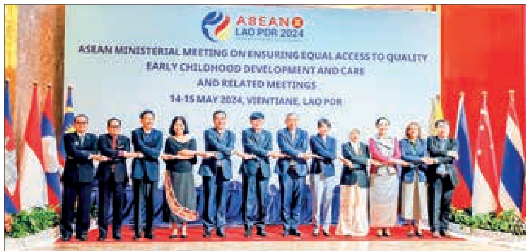
The group documentary photo of the ASEAN Ministerial Meeting and related meetings on 14-15 May in Laos.