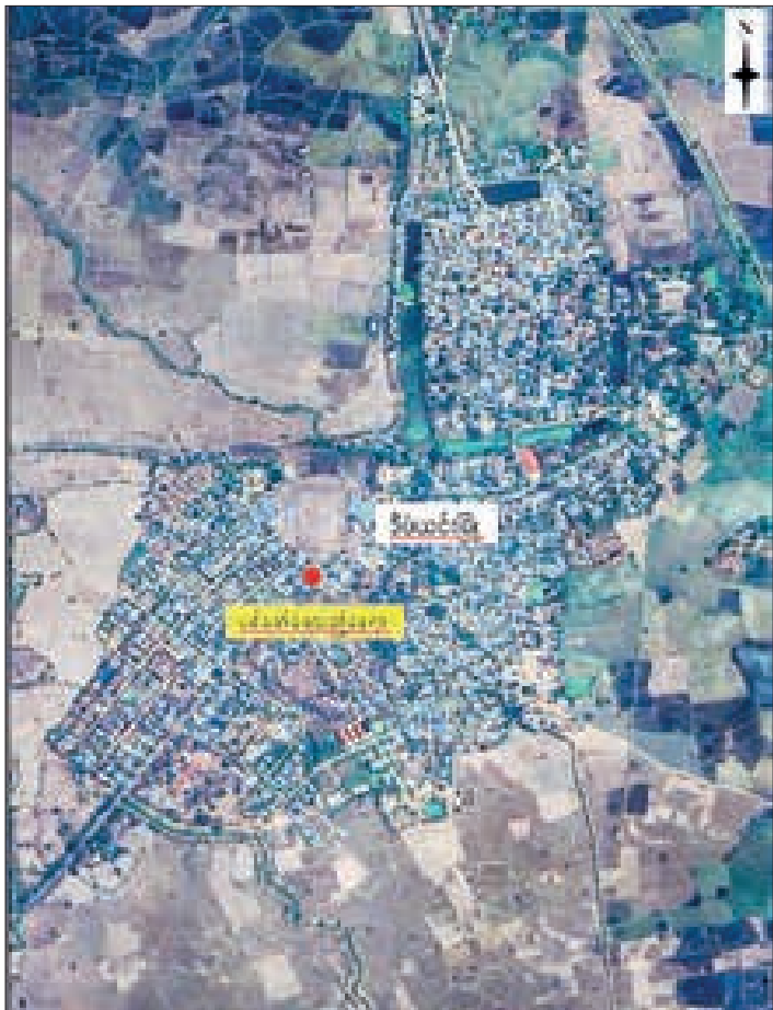
The location map of the incident.

PDF terrorists, prompted by NUG/CRPH, have been committing crimes, includ-