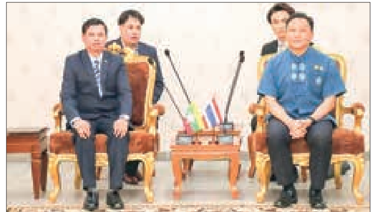
Consul-General U Min Kyaw Linn of the Republic of the Union of Myanmar in Chiang Mai is seen discussing with officials from Thailand.

The Myanmar consul-general also discussed measures to collaborate with the Chiang Mai Provincial Governor's Office and the Chiang Mai Mayor's Office in providing care for Myanmar nationals and workers in Chiang Mai. — ASH/TH