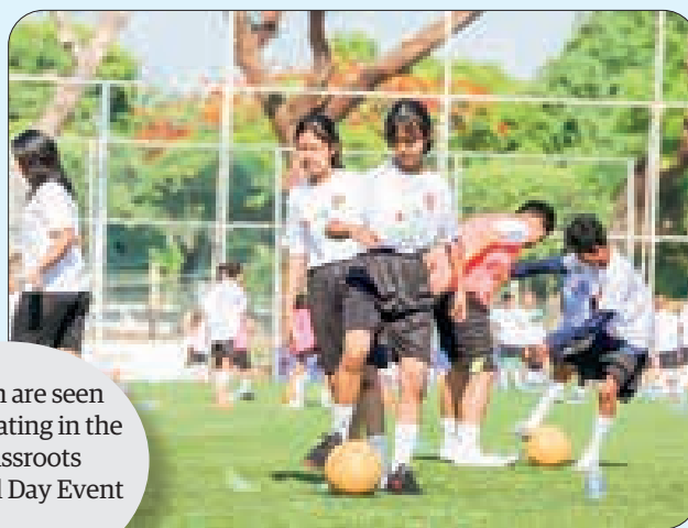
Children are seen participating in the AFC Grassroots Football Day Event 2024.