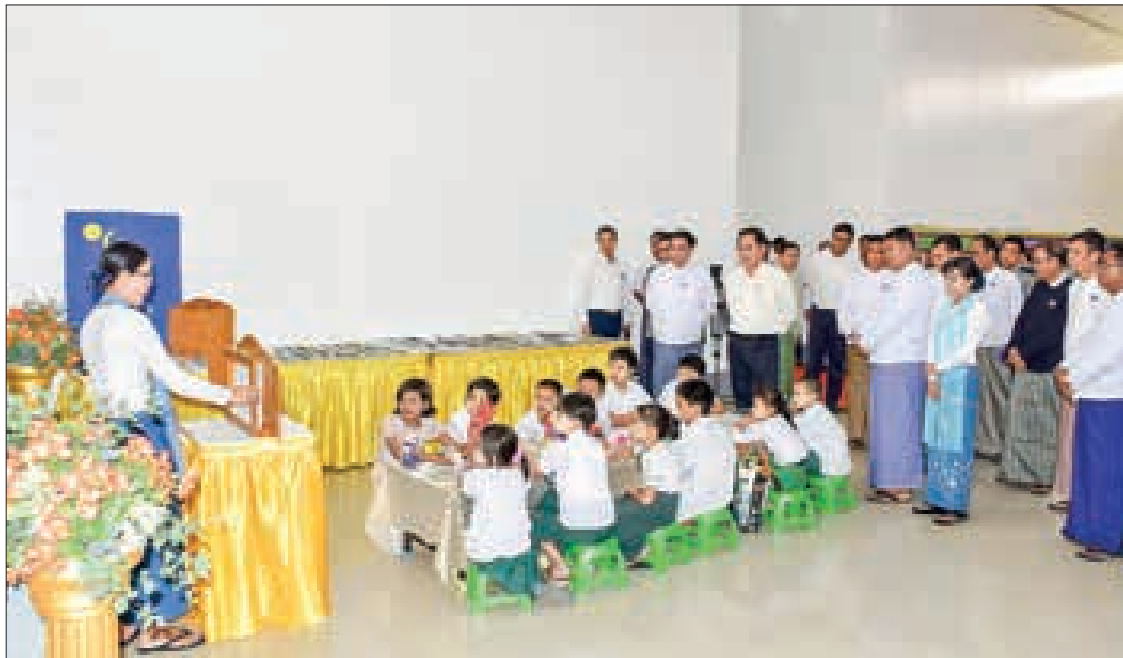
Union Minister U Maung Maung Ohn views the launch of the developing libraries and raising reading habits campaign in Bago yesterday.

He then urged the students to visit the library during school holidays and to try hard to be intelligent students and achieve