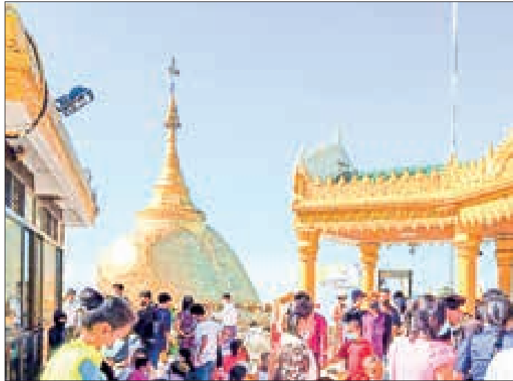
Kyaiktiyo Pagoda with throngs of devotees.