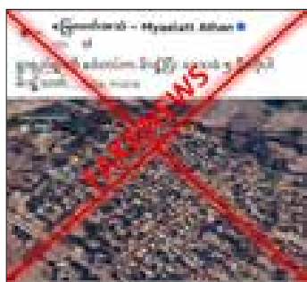
The screenshot validates misinformation.

However, the reality is that PDF terrorists committed an attack on security forces fulfilling their local security duties in Myingyan Township, employing both small and heavy weaponry. This led to an exchange of fire, during which the terrorists suffered