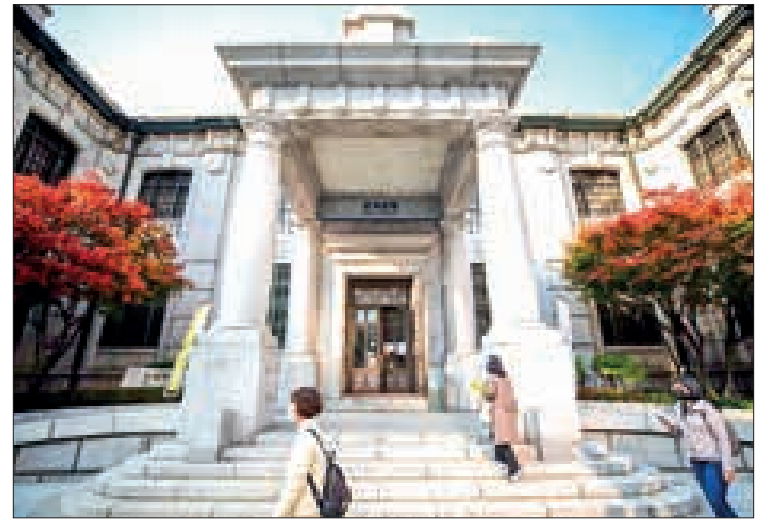
Pedestrians are seen in front of the Bank of Korea (BOK) in Seoul, South Korea, on 24 November 2022.

Excluding the settled bad loan, the delinquency ratio for new bank loan came to 0.11 per cent in March, down from 0.13 per cent in the previous month.