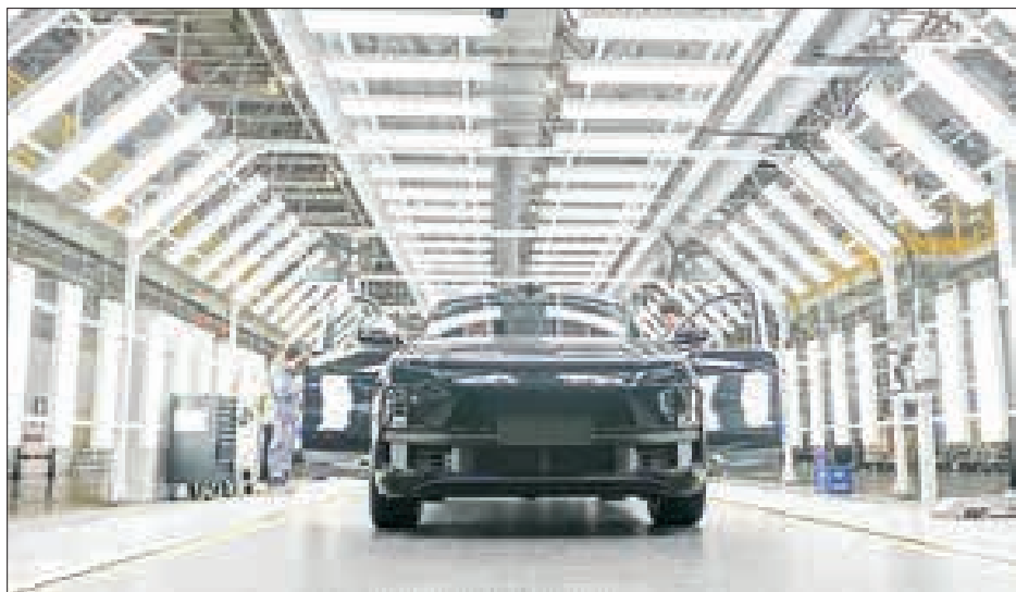
This photo taken on 10 January 2024 shows a factory of Chinese electric vehicle (EV) maker Li Auto Inc. in Changzhou, east China's Jiangsu Province.

An analysis by The Economist magazine pointed out Tuesday that "US domestic producers may also feel less of an incentive to develop cheap goods in the long term, knowing that