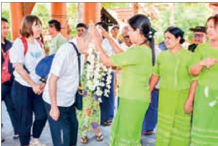
Chinese tourists seen being warmly welcomed on their arrival of Bagan.

THE Directorate of Hotels and Tourism (Bagan) reported that Chinese tourists visited the Bagan World Heritage Site in NyaungU township at 12:30 pm on 16 May as part of a Myanmar-China tourism familiarization trip.