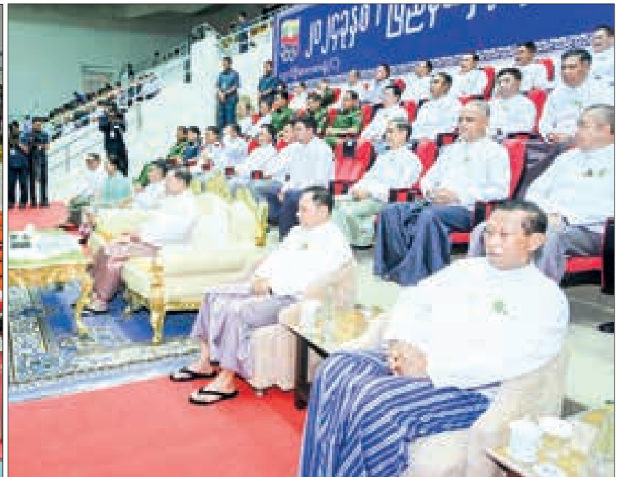
SAC Chair PM Senior General Min Aung Hlaing and dignitaries watch the final match of the Inter-State and Region Volleyball Tourney 2024 yesterday in Nay Pyi Taw.