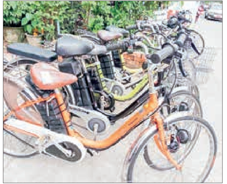
Ebikes are on sale at an outlet.

ty. Battery bicycle cannot faster like motorcycle but it can go farther. We also prefer to use bicycle. Battery bikes can run by both battery and pedalling. As far as I know, there are two kinds of markets for used and new bicycles. Some buy used bicycle and some buy new bicycles and customize it. I also use bicycle after customizations," said U Myint Naing who owns a battery bicycle from Thingangyun township. — Thit Taw/ZS