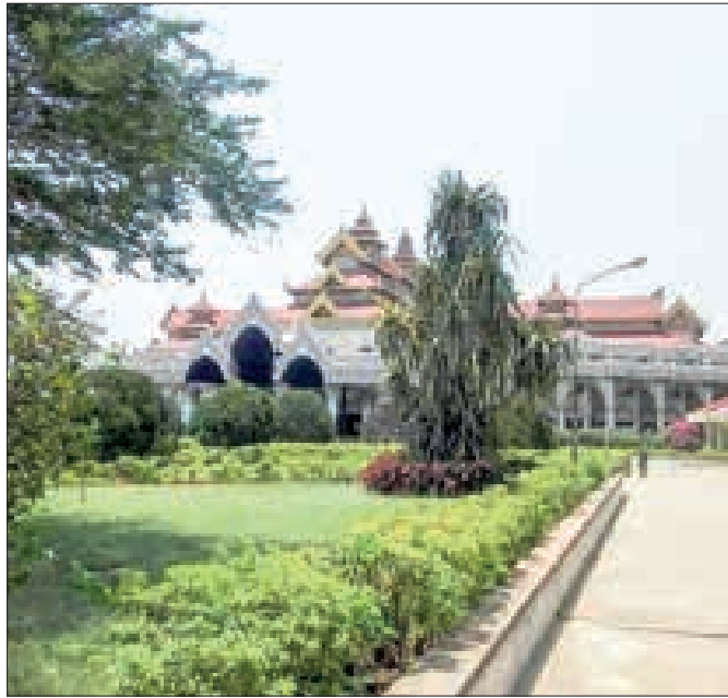
A glimpse of cloth paintings—one of the exhibits at the Bagan Archaeological Museum.

Cloth paintings from the 12 th century AD exhibited in the Bagan Archaeological Museum were unearthed on 2 March 1984 inside the Taungpon Lawkanatha Pagoda in Wetkyeinn village by the Department's field survey and enumeration team. These paintings underwent restoration at the antiques preservation and renovation centre in Italy from October 1986 to December 1987.