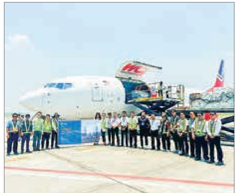
The Yangon-Nanning-Yangon cargo flight is seen ready to start operations. PHOTO: LIN YAMA

The Boeing 737-800 Freighter aircraft arrived in Myanmar on 24 January this year, and Myanmar National Airlines has announced that it is operating Yangon-Kunming-Yangon, Yangon-Bangkok-Yangon, Yangon-Singapore-Yangon and Yangon-Mansi-Yangon cargo trips. — Lin Yama/KZL