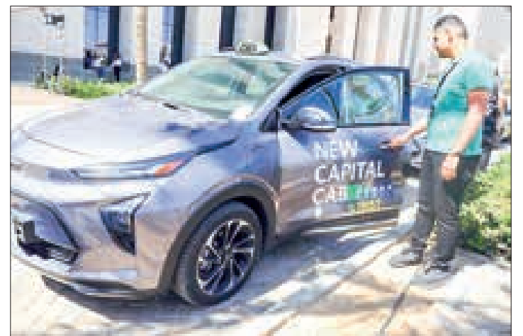
Electric taxis are seen during a pilot programme ceremony in New Administrative Capital, Egypt, on 15 May 2024.