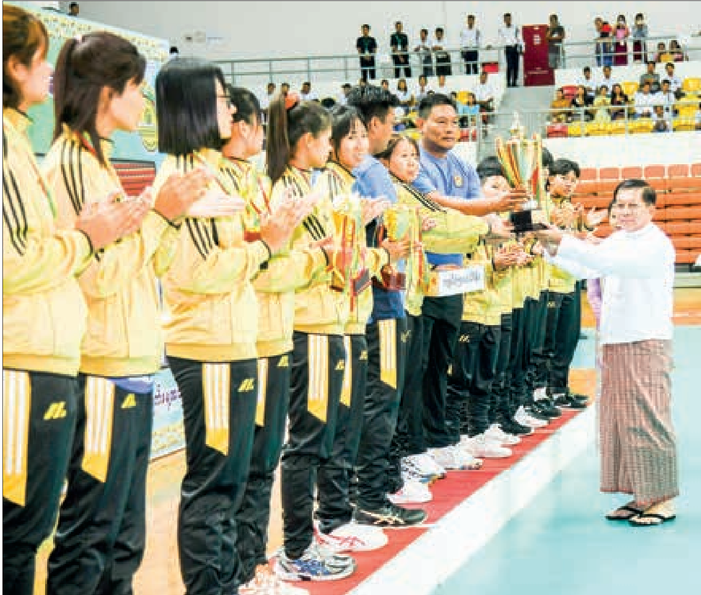
State Administration Council Chairman Prime Minister Senior General Min Aung Hlaing presents Championship trophies to the Shan State men's team and Mandalay Region women's team at yesterday's event.