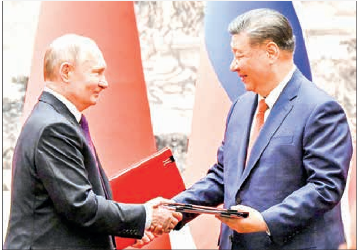
Russian President Vladimir Putin and Chinese President Xi Jinping exchange bilateral documents during a meeting in Beijing, China 16 May 2024.

stability and promoting greater democracy in international relations, Xi added.