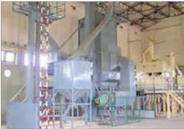
One of the rice mills located in the Ayeyawady Region.

THE Myanmar Rice Federation has disclosed ongoing discussions to secure an additional four hours of electricity in areas with numerous rice mills to enable them to operate at total capacity.