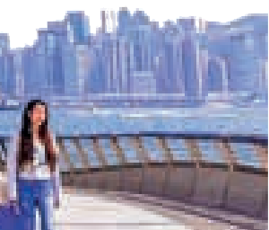
Tourists visit a scenic spot at Tsim Sha Tsui in Hong Kong, south China, 14 November 2019.

of this year, Hong Kong registered about 14.62 million tourist arrivals,