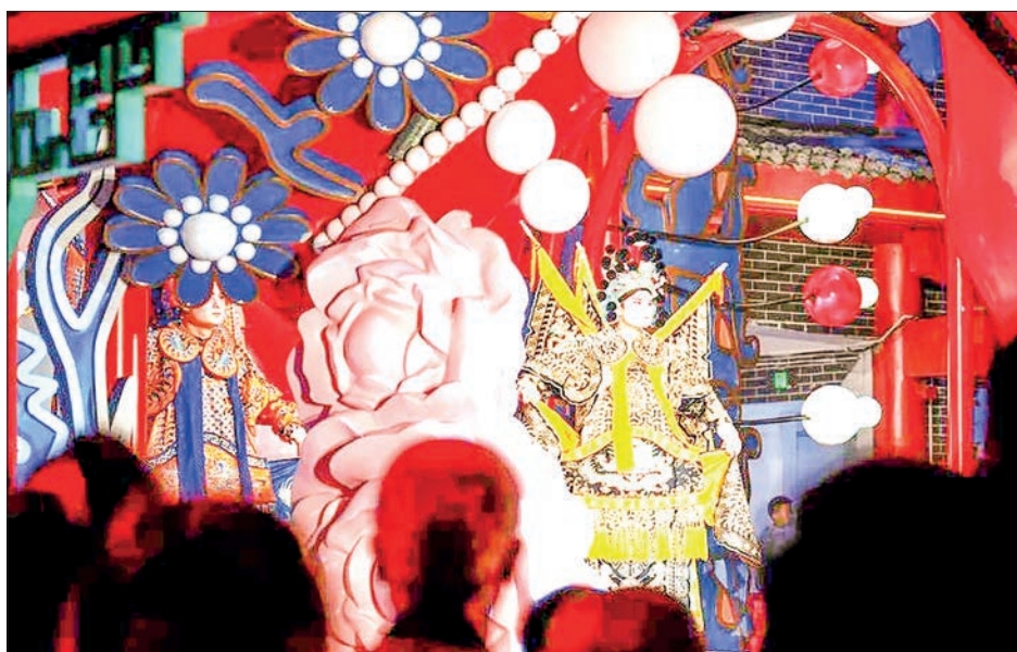
People watch a performance at a tourist attraction in Zhuxi County of Shiyan City, central China's Hubei Province, 12 October 2024.

ence, 17 city-level regions across the province inked 50 cultural tourism projects with a total investment estimated to