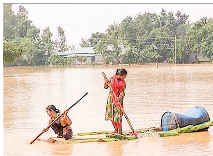
People take a raft in the floodwater in Mymensingh, Bangladesh, 7 October 2024.

This major reduction in growth comes after significant uncertainties around the polit-