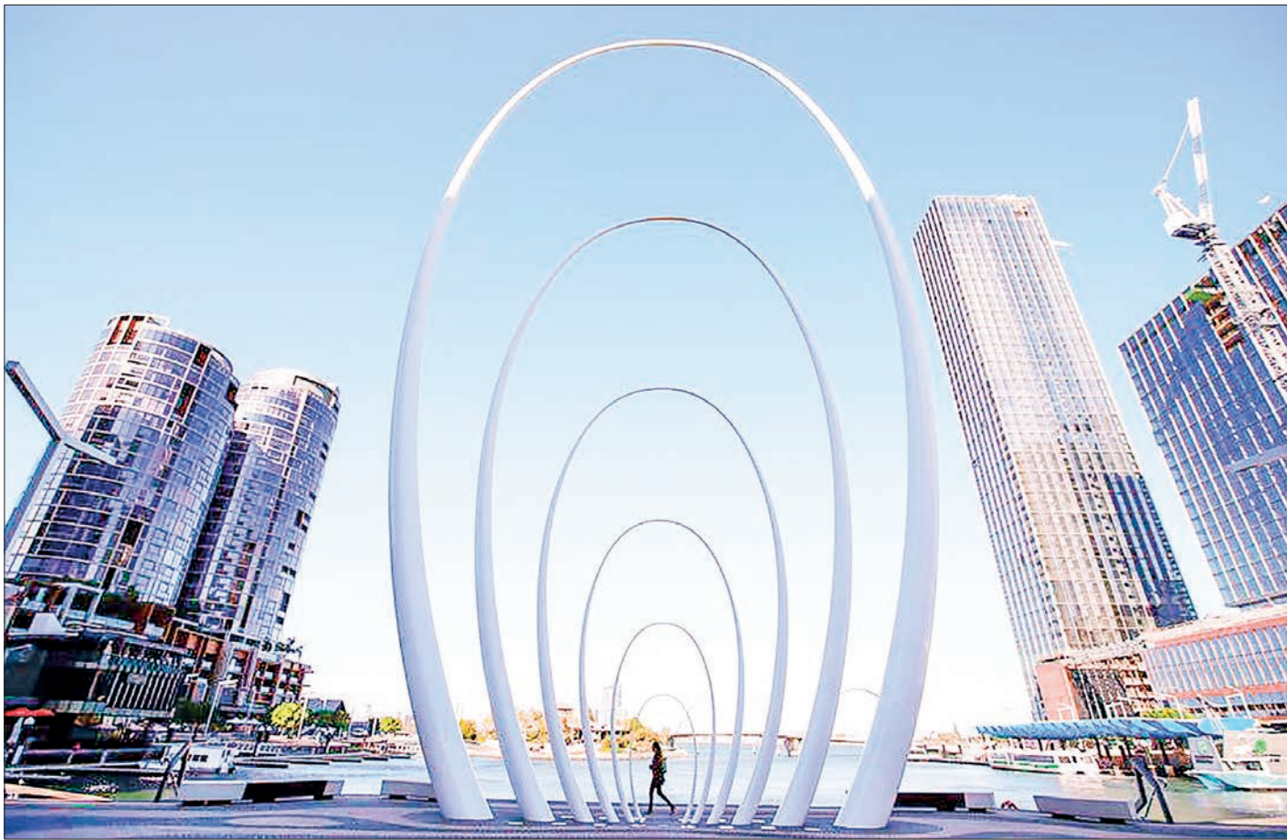
This photo taken on 29 April 2024 shows a view of Elizabeth Quay in Perth, Australia.

A WTTC report reveals business travel will exceed pre-pandemic levels, reaching $1.5 trillion, with China poised to lead globally.