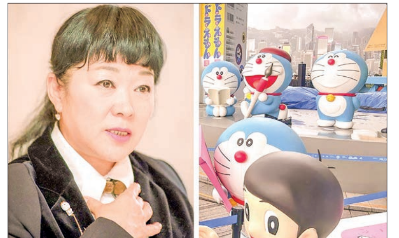
Nobuyo Oyama, the beloved voice of Doraemon from 1979 to 2005, has passed away at 90, leaving a legacy that shaped the hearts of anime fans around the world.

Her autobiography, "Boku Doraemon deshita" (I was Doraemon), garnered significant attention upon its 2006 release. — Kyodo