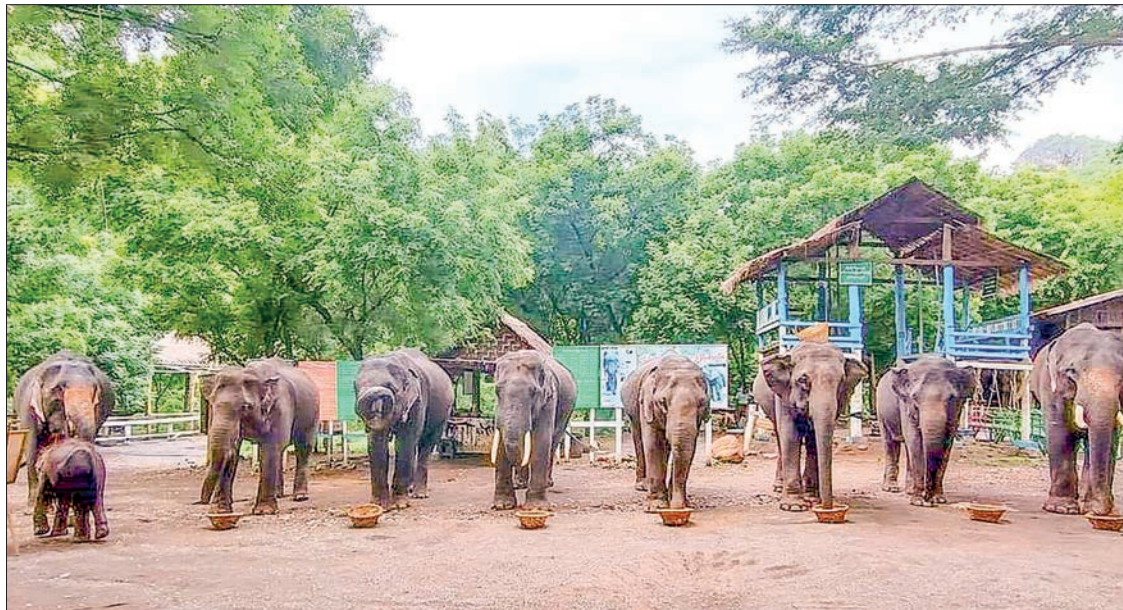
Elephants are seen at Wanet Elephant Camp.

“We have set up bungalow-style accommodations, benches, public rest areas, and family-friendly areas where visitors can unwind in shaded spots while appreciating the surroundings. Additionally, we have created play areas for children,” he added.