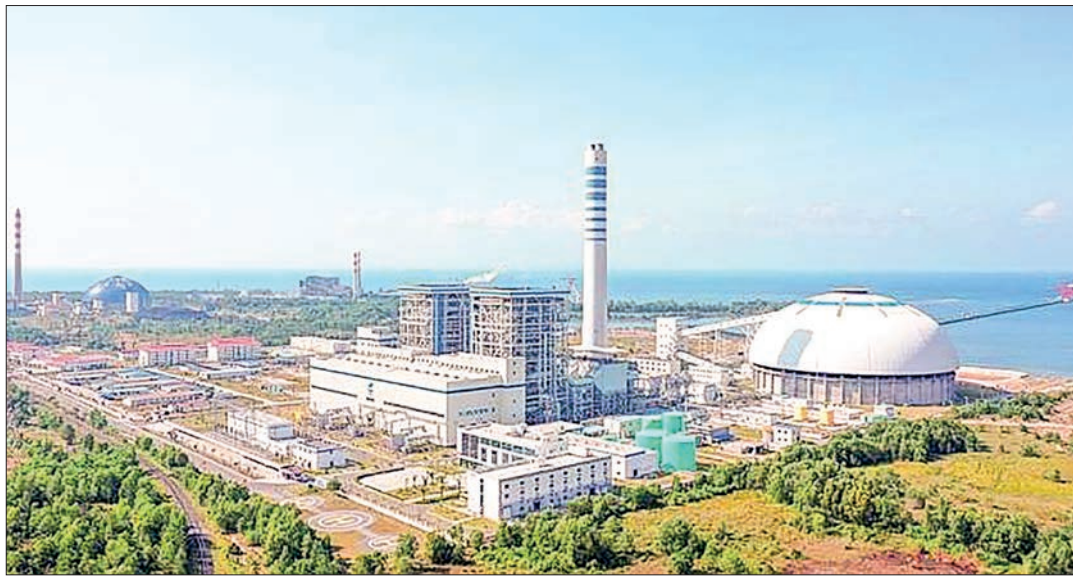
This undated aerial drone photo shows the Chinese-invested Huadian Sihanoukville Power Generation Co., Ltd. in Sihanoukville, southwest Cambodia.