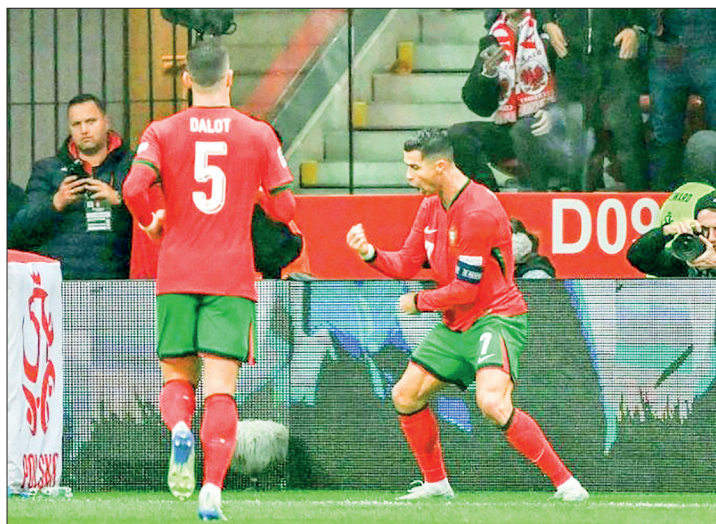
Cristiano Ronaldo (R) scored his 133 rd international goal in Portugal's win over Poland.

CRISTIANO RONALDO scored as Portugal beat Poland 3-1 for their third straight Nations League win on Saturday, while European champions Spain put an end to Denmark's perfect start in the competition. Bernardo Silva volleyed Portugal ahead in the 26 th minute in Warsaw as Bruno Fernandes