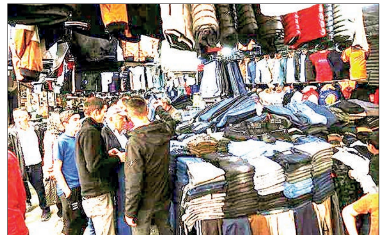
People shop for clothes at a store in Ankara, Türkiye, on 30 September 2024.

The country has faced significant economic challenges over the past five years, including high inflation, a weakened currency, and a large current account deficit. By mid-2023, Türkiye shifted from low interest rates to a disinflation strategy, successfully reducing consumer price growth from 85 per cent to below 50 per cent and rebuilding central bank reserves. — Xinhua