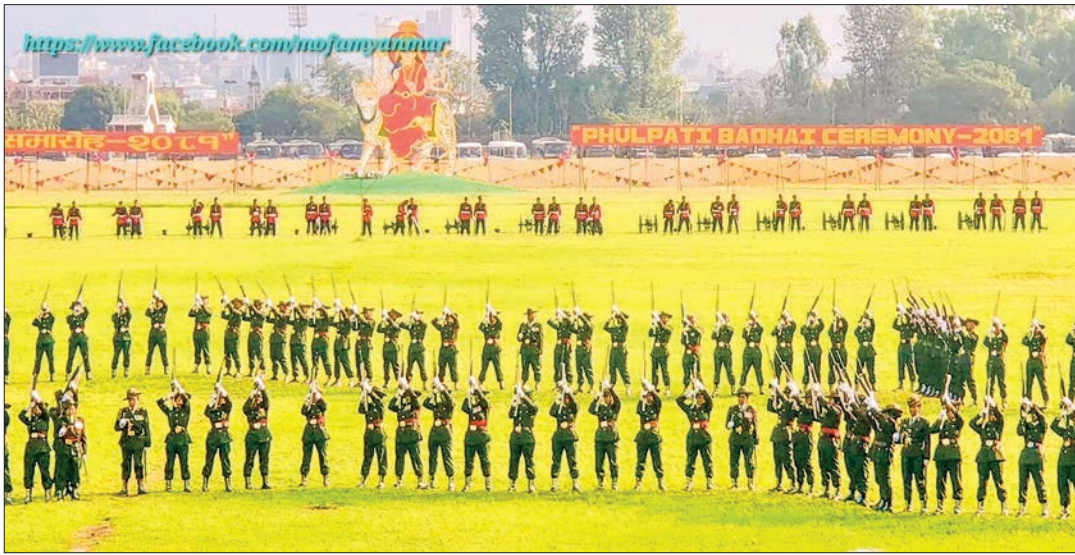
The “Phulpati Parade” organized by the Nepali Army in progress.

Honour at the parade. Other attendees included Vice President Ramsahaya Prasad Yadav, Prime Minister KP Sharma Oli, the Speakers of Parliament, Deputy Prime Ministers, ministers, high-ranking government officials, and heads of diplomatic missions based in Nepal.