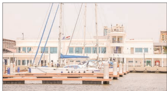
The move is part of the SCA's flexible marketing policies to encourage yacht tourism and develop marine tourism in the Red Sea region.

Yachts that arrive timely for transit and mooring at a yacht marina in Port Said or Suez to complete transit procedures will receive a 50 per cent discount on mooring fees, provided that they do not stay overnight or use any services such as electricity and water. — Xinhua