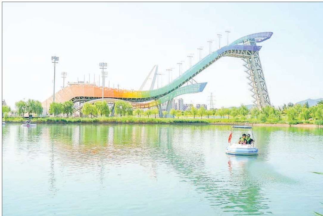
This photo taken on 23 August 2023 shows the Big Air Shougang in the Shougang Park in Shijingshan District of Beijing, capital of China.

RIDING along Beijing's iconic Chang'an Street to the city's west, cycling enthusiasts have the chance to sip a cup of iced coffee and enjoy the grand view of steel furnaces at Shougang Park, a recreation destination that has been transformed from an area known for steel mills.