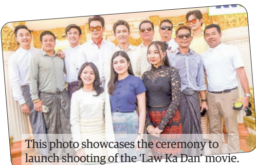
This photo showcases the ceremony to launch shooting of the ‘Law Ka Dan’ movie.