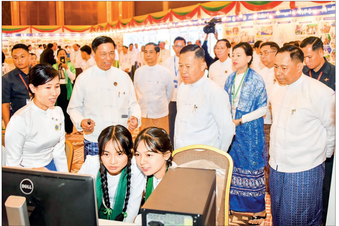
Chairman of the National Disaster Management Committee Vice-Chairman of the State Administration Council Deputy Prime Minister Vice-Senior General Soe Win visits the booths to mark the 2024 International Day for Disaster Risk Reduction, MICC-I in Nay Pyi Taw yesterday.

Candle sale surges this month, even orders are postponed