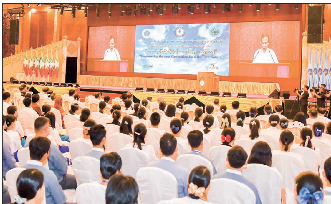
Chairman of the National Disaster Management Committee Vice-Chairman of the State Administration Council Deputy Prime Minister Vice-Senior General Soe Win delivers speech at the ceremony to mark the 2024 International Day for Disaster Risk Reduction, MICC-I in Nay Pyi Taw yesterday.

students from the school-age children to those from the higher education.