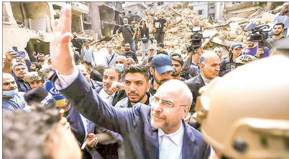
Mohammad Bagher Ghalibaf after visiting the site of an Israeli air strike on Beirut's Basta neighbourhood.

Ghalibaf, alongside Hezbollah lawmakers, criticized the silence of international organizations and the UN Security Council, asserting their ability to intervene against Israel's "crimes."