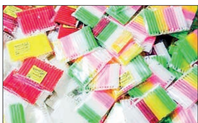
Candles are even out of stock now.

"Thadingyut Festival falls this month so candle trade has been pretty good, even wholesalers have to stop receiving orders because candle factories are unable to supply enough. We buy from Yangon candle factory," said a candle retail and wholesale distributor. In Thadingyut Festival, it is traditional that mass of candles are offered to the Buddha, making the candle sale surge.