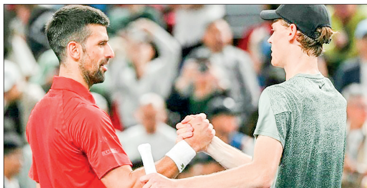
Jannik Sinner (R) is congratulated by Novak Djokovic after winning the Shanghai Masters.

Both players showed resilience in the first set as neither was able to break serve, but Sinner dominated the tiebreak by quickly taking a 4-1 lead en route to his win. The pivotal point of the second set came in the fourth game, where the Italian earned two break points at 40-15. Although Djokovic saved one with an ace, Sinner seized the second opportunity to convert his break, which laid the foundation for his championship. "It was a very tough match, obviously, playing against Novak is one of the toughest challenges we have," Sinner noted. "Because he doesn't have any weaknesses. You have to try and use the small chances that he gives you, but there are not many during the match." — Xinhua