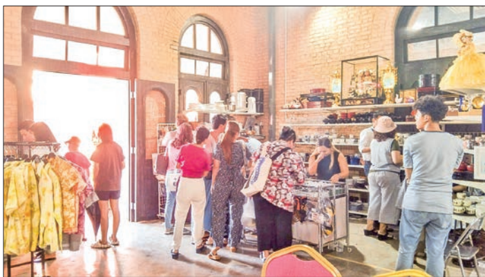
A market festival seen at Secretariat Yangon.

DORA Entertainment has announced that it will organize a Thadingyut market festival with a music show featuring popular singers at the Secretariat Yangon in Botahtaung Township, Yangon Region.