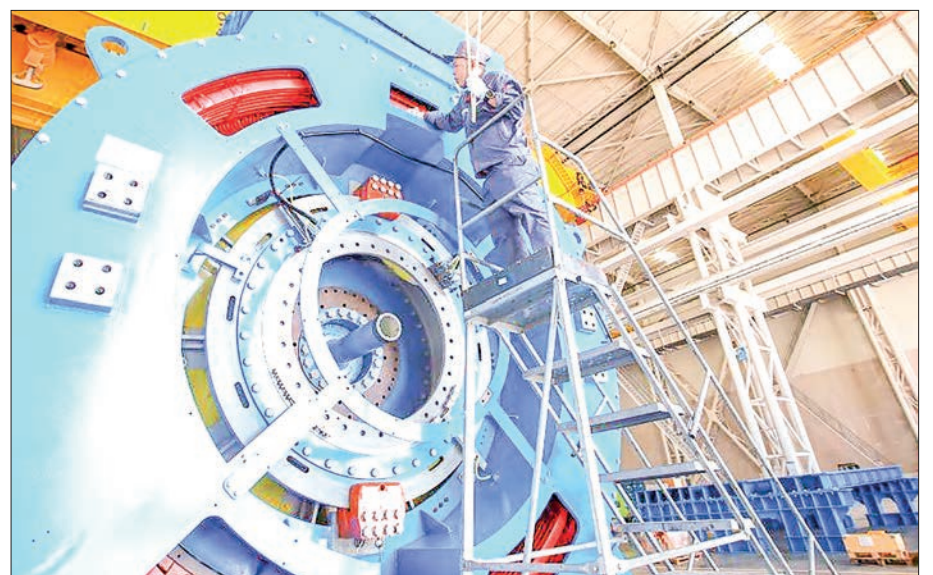
This undated photo shows a worker assembling the floating offshore wind turbine in Yancheng, east China's Jiangsu Province.

With its semi-submersible floating platform and mooring system, enhanced by smart control and sensing technologies, the turbine extends wind power's reach into deeper waters, ensuring stable operation.