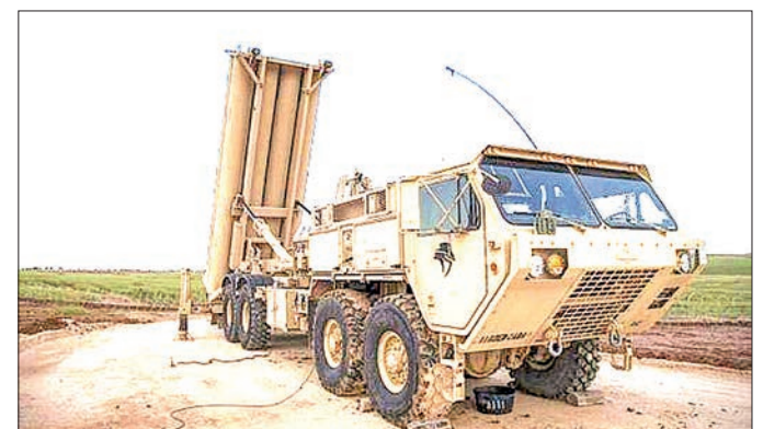
US military deploys a THAAD missile defence system in Israel, March 2019.

Iran launched a massive missile attack on Israel in October. The IDF reported approximately 180 ballistic missiles fired, claiming most of them were intercepted.