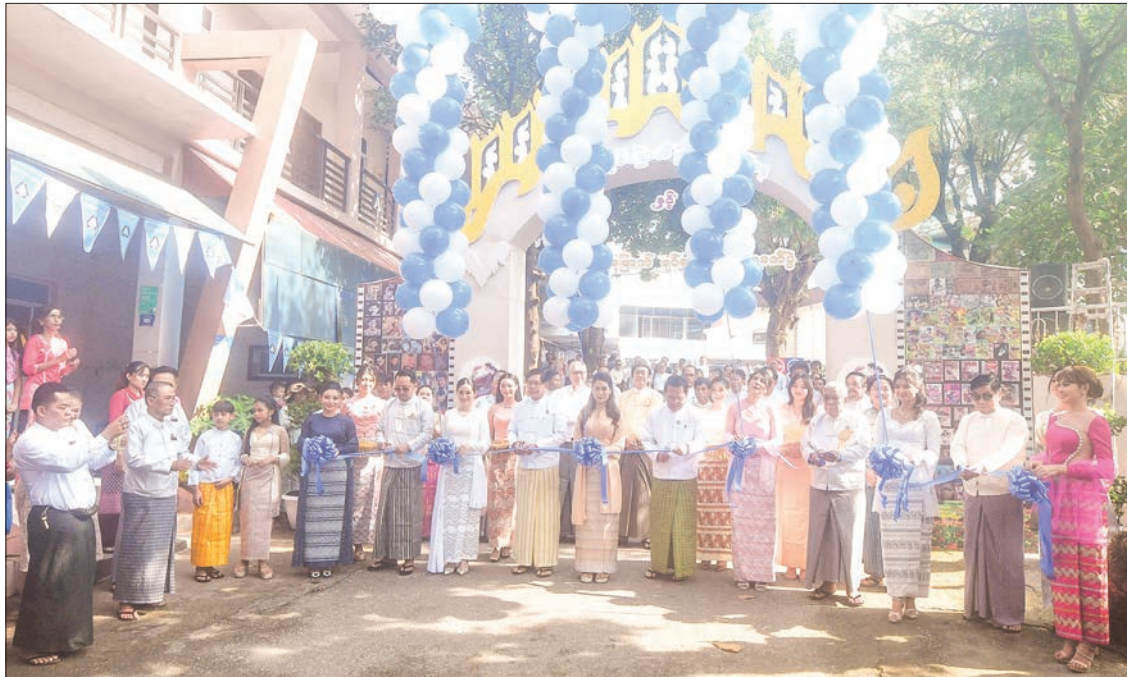
Union Minister U Maung Maung Ohn, Chief Minister U Soe Thein, MMPO Chairperson U Kyi Soe Tun, and Academy Khant Si Thu cut the ribbon to launch the Myanmar Film Day at the MMPO office in Bahan Township, Yangon Region, yesterday.

Union Minister U Maung Maung Ohn, Chief Minister U Soe Thein, MMPO Chairperson U Kyi Soe Tun, and Academy Khant Si Thu cut the ribbon to launch the Myanmar Film Day.