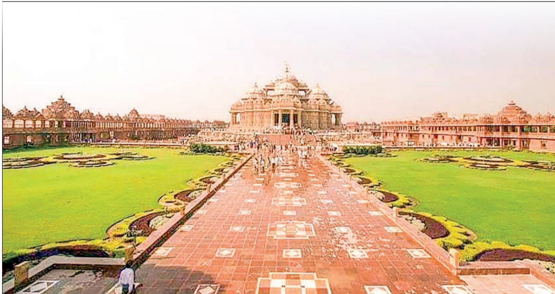
This photo captures the sacred relic reliquary in Varanasi and a group of Myanmar pilgrims.