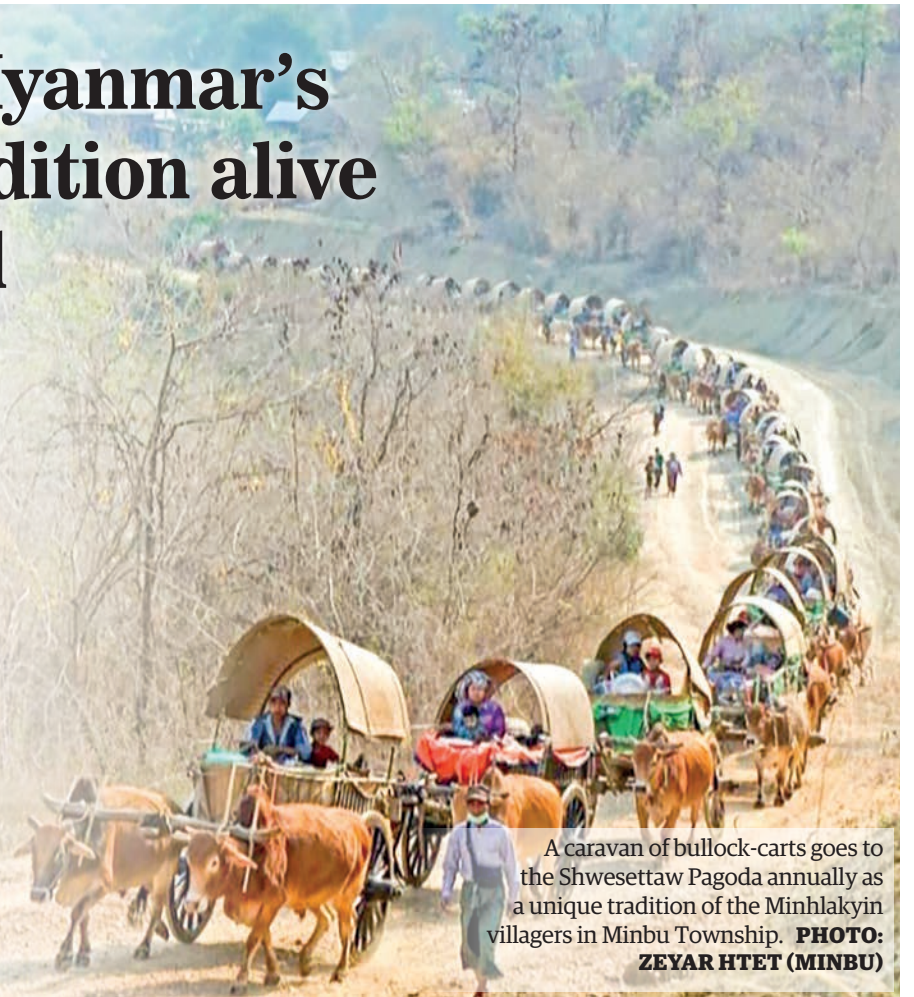
A caravan of bullock-carts goes to the Shwesettaw Pagoda annually as a unique tradition of the Minhlakyin villagers in Minbu Township.

Photographers from across Myanmar, drawn by the unique bullock-cart pilgrimage, visit the village to capture stunning photographs of the scenic landscapes and the bullock-carts with arched roofs, as they journey through valleys and hills towards the festival. These images are often shared widely on social media. — Zayar Htet (Minbu)/ TRKM