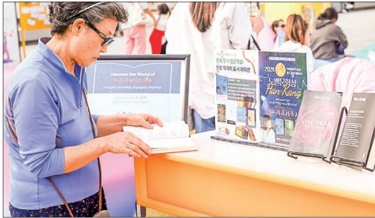
Major South Korean bookstores sold out of author Han Kang's books Friday, following her historic Nobel Prize win.

The 53-year-old was honoured with the Nobel "for her