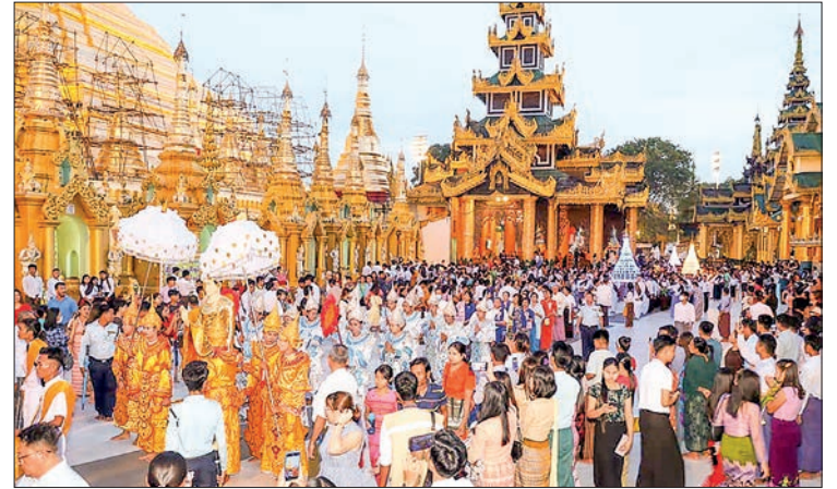
This photo depicts lamp pagoda sculpture procession and oil lamp offerings at the Shwedagon Pagoda last year.