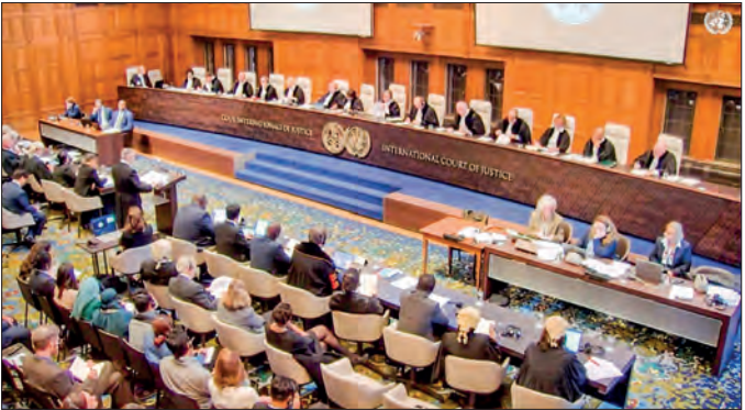
Ongoing oral hearings in the Gambia-Myanmar case.

During the second day of hearings, Gambian lawyers alleged that the Myanmar Tatmadaw had carried out a counter-terrorism operation on Bengalis in northern Rakhine State, claiming that the Border Guard Police and people’s militia were involved