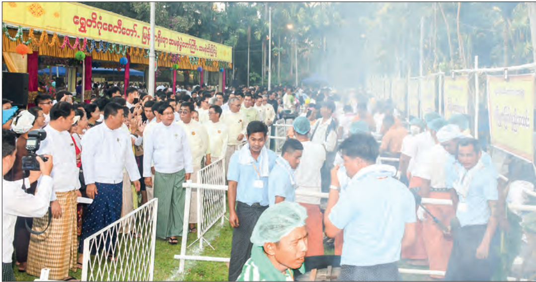
This photo showcases the Htamane-making competition being held at the Shwedagon Pagoda in the previous year.

ACCORDING to the Shwedagon Pagoda Board of Trustees, the 18 th traditional Myanmar Htamane festival and Htamane-making competition will be held on a grand scale on 31 January at the Shwedagon Pagoda. The ceremony of offering Htamane to Buddha images and monks and providing Htamane to pilgrims will be included in the Htamane festival. Teams representing