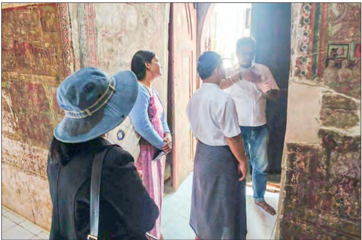
This photo captures ancient structures in the Bagan region being inspected by the ASI team from India, along with officials from the Department of Archaeology and National Museum (Bagan branch).

A total of 73 ancient structures in the Bagan region, damaged by the 2016 earthquake, are currently being restored and preserved through a joint effort by the Archaeological Survey of India (ASI) and the Department of Archaeology and National Museum (Bagan branch). Full restoration has already been completed for 22 structures in the first phase. In the second phase, from 2025 to 2028, restoration work will continue on 50 ancient structures, focusing on structural conservation as well as the preservation of mural and stucco paintings. In addition, officials from the Department of Archaeology and National Museum (Bagan branch) have stated that 15 ancient structures will be restored during 2025-2026. The ASI team from India, supported by the Government of India, has been undertaking structural preservation and the conservation of mural and stucco paintings in the Bagan region since 2020. — ASH/MKKS