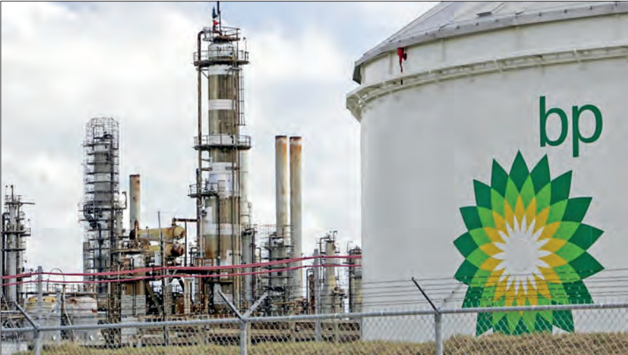
BP shares are trading lower this morning after it highlighted a significant impairment and weaker oil prices.

"BP shares are trading lower this morning after it highlighted a significant impairment and weaker oil prices," said Victoria Scholar, head of investment at traders Interactive Investor. — AFP