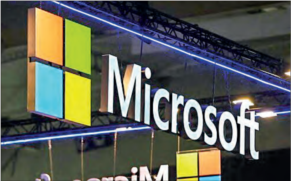
Recent fee increases may constitute indications of an unlawful restriction of competition.

"Microsoft is committed to complying with Swiss competition law and will cooperate with the Swiss Competition Commission in its preliminary investigation," a spokesman told AFP on Thursday. — AFP