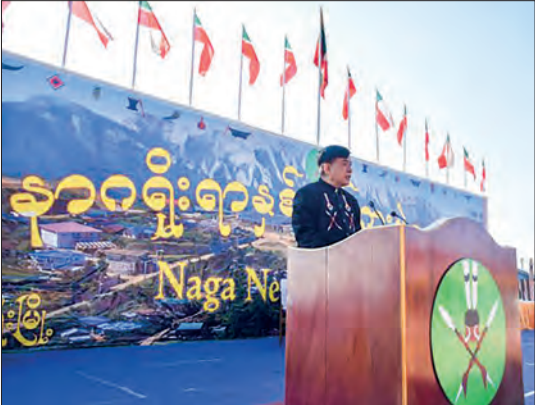
State Security and Peace Commission Member and Union Defence Minister General Maung Maung Aye speaks on the occasion of the 2026 Traditional Naga New Year Festival in Leshi, Sagaing Region.