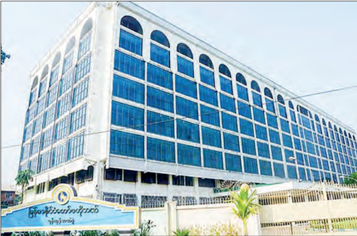
The general view of the Central Bank of Myanmar (CBM) in Yangon.

CBM sold over $1.17 million to edible oil-importing companies and $315,900 to fuel oil-importing companies on 9 January, in addition to sales of over 643,000 yuan and 1.9