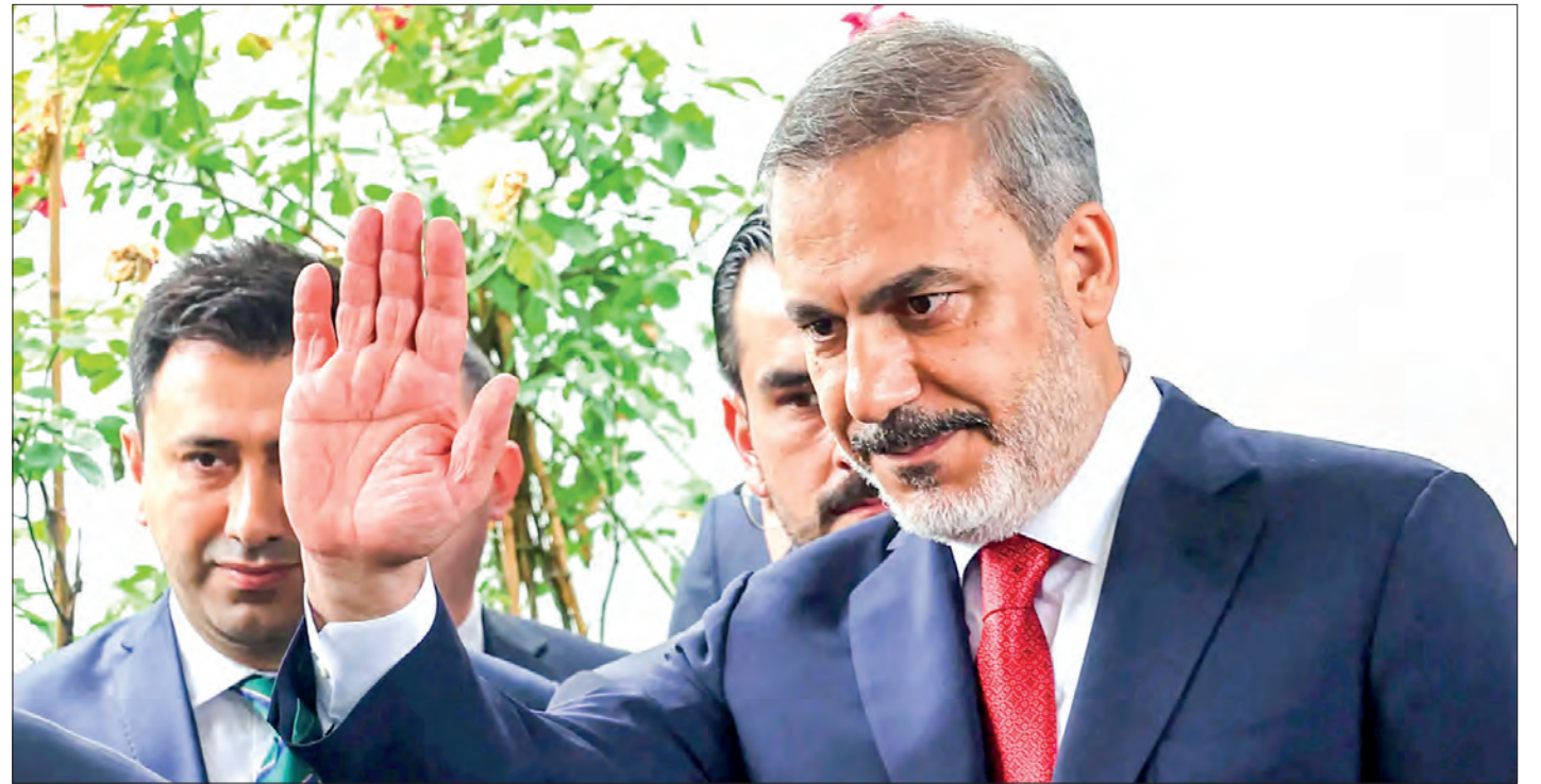
Hakan Fidan officially succeeded Mevlüt Çavuşoğlu as Türkiye’s foreign minister during a handover ceremony in Ankara on 5 June 2023.

Fidan warned that large-scale instability in Iran would create a crisis exceeding the region’s capacity to manage the fallout.