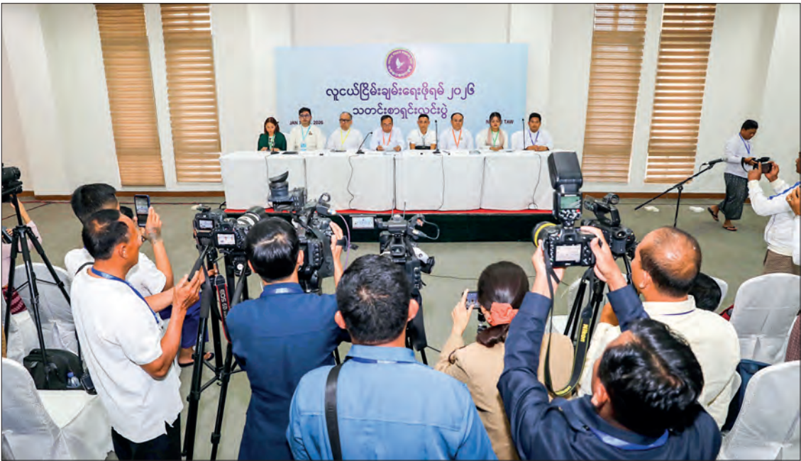
Press briefing of the 2026 Youth Peace Forum underway yesterday in Nay Pyi Taw.

The Youth Peace Forum 2026 was attended by member of the State Security and Peace Commission, and Chairman of the National Solidarity and Peacemaking Negotiation Committee (NSPNC) Union Minister Lt-Gen Yar Pyae, Union Minister for Information U Maung Maung Ohn Secretary of the NSPNC Lt-Gen Min Naing, members of the Negotiation Committee, Ministers for Social Affairs from regions and states, representatives from ministries, intellectuals and intelligentsia from various fields, youth representatives from various strata of the regions and states, ethnic armed organizations that have signed the NCA, diverse ethnic cultural and religious