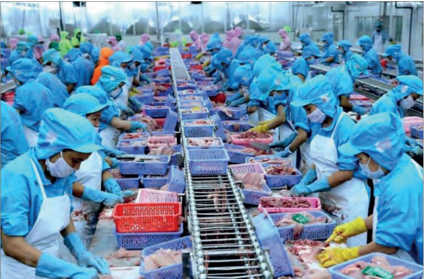
Workers are seen in the production line of fishery products at a local cold storage facility.

Job applications for 16 th EPS-TOPIK candidates extended