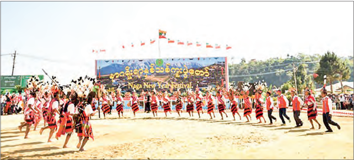
The Traditional Naga New Year Festival in vibrant action yesterday in Leshi, Sagaing Region.

should be made to develop small, micro, and medium-sized enterprises (MSMEs) by producing at least one speciality product per region. By processing local raw materials into higher-value products, the regional economy can be strengthened. It is also important, rather than producing a variety of small-scale goods, to focus on producing a single product in substantial quantities and with high quality.