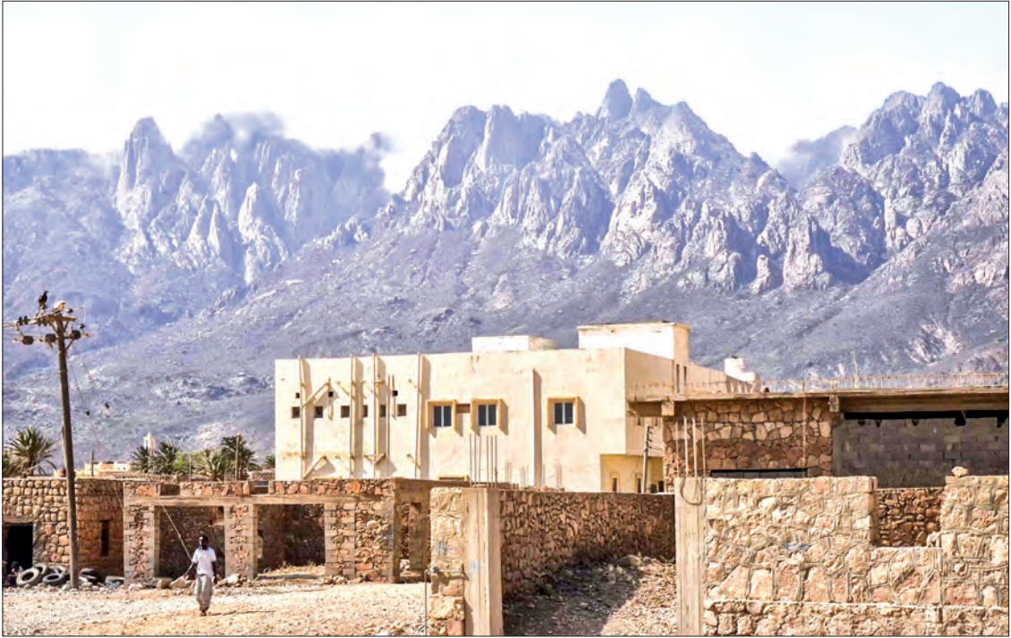
Saudi Arabia announced a massive $506 million (SR1.9 billion) development package for Yemen that includes the official opening and operation of a hospital on the island of Socotra.

we have a different position,” Rasmussen said, asserting that in Denmark’s view, Greenland’s long-term security “can be ensured inside the current framework.” “We agreed that it makes sense to try to sit down on a high level to explore whether there’s possibilities to accommodate the concerns of the president while we at the same time, respect the red lines of the Kingdom of Denmark. So this is the work we will start,” he said, adding that the working group is expected to meet for the first time “within a matter of weeks”. — Xinhua