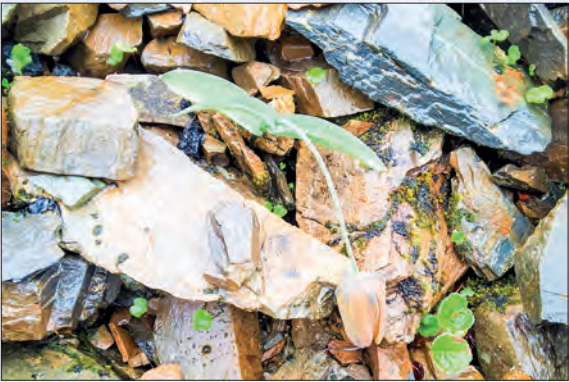
Photos capture a rare Gushar ( Fritillaria delavayi ) plant emerging from rocky terrain and a Gushar hunter struggling to scale Mountain Gushar in Kachin State.

One kilogramme of Gushar, which is the size of a fingernail, is valued at over US$600, and dealers sell to local warehouse markets in PutaO, as well as exporting to China. — Thitsa (MNA)/MKKS