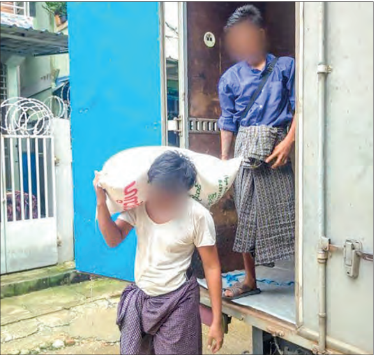
Selling rice by home delivery as a part of the joint effort to ensure rice prices are stable.

Consumers can place an order to MRF by dialling 09 400067240, 09 400067250 and 09 400067260 or by sending an SMS or Viber message about rice type, address and phone number. MRF will send the KB-