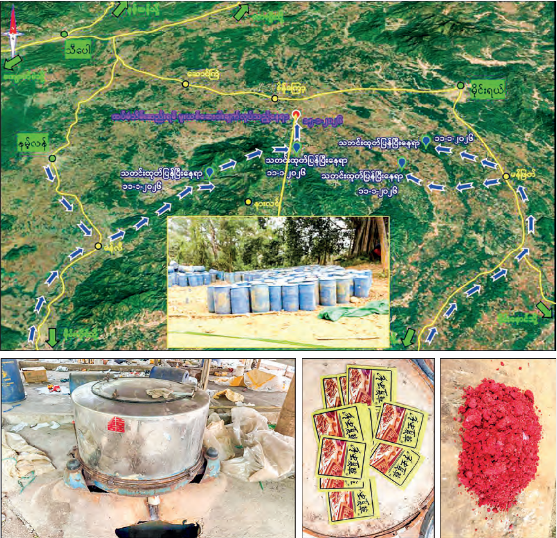
Images show the crackdown on drug-processing sites in Hsipaw Township, northern Shan State, alongside seized drug-refining equipment and related raw materials.

gas cylinders, two generators, nine tablet-pressing machines, one factory warehouse suspected to be producing Happy Water, 50 tablet-drying trays, 12 huts, seven warehouses storing acid containers, one hut used for drug production equipped with glass condensers, three warehouses, two warehouses storing raw materials for drug production, and two ration warehouses. Seized drugs will be examined by the combined teams, including experts, and transferred to relevant departments, and systematically destroyed through incineration or demolition. As there may still be additional suspicious drug-manufacturing sites in the surrounding area, security measures will be continuously carried out. Those involved in drug cases will also be thoroughly identified and effectively prosecuted. — MNA/KTZH