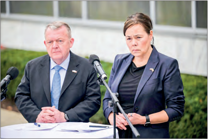
Danish Foreign Minister Lars Lokke Rasmussen (left) and Greenland’s Foreign Minister Vivian Motzfeldt speak during a news conference at the Danish Embassy in Washington, DC, on 14 January 2026.

THE United States, Denmark and Greenland have agreed to establish a “high-level working group” to explore possible areas of compromise since a “fundamental disagreement” persists over the future of Greenland, Danish Foreign Minister Lars Lokke Rasmussen said here Wednesday. His remarks came just after US Vice President JD Vance and Secretary of State Marco Rubio met him and Greenlandic Foreign Minister Vivian Motzfeldt at the White House. Though calling the meeting “a frank but also constructive” discussion “focused on how to ensure the long-term security in Greenland,” Rasmussen said at a press conference that Denmark and Greenland’s “perspectives continue to differ” from the United States. “I must say, the president (US President Donald Trump) has made his view clear, and