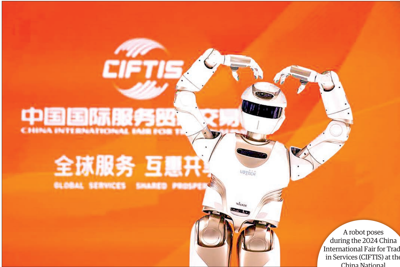
A robot poses during the 2024 China International Fair for Trade in Services (CIFTIS) at the China National Convention Centre in Beijing, capital of China, 12 September 2024.