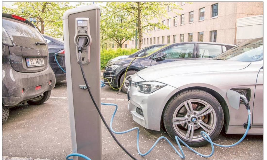
(FILES) Electric cars are being charged on a street in the Norwegian capital Oslo on 30 April 2019. Electric cars outnumber petrol cars in Norway for the first time ever, the Norwegian Road Federation (OFV) said on 17 September 2024.

ELECTRIC cars outnumber petrol cars in Norway for the first time ever, an industry organization said on Tuesday.