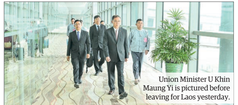
Union Minister U Khin Maung Yi is pictured before leaving for Laos yesterday.

THE Myanmar delegation, led by U Khin Maung Yi, Union Minister of the Ministry of Natural Resources and Environmental Conservation, left Yangon for Laos yesterday morning to attend the second ASEAN-Mekong River Commission Water Security Dialogue to be held in Vientiane, Laos, on 18 September. Officials from the ministry saw off them at Yangon International Airport.