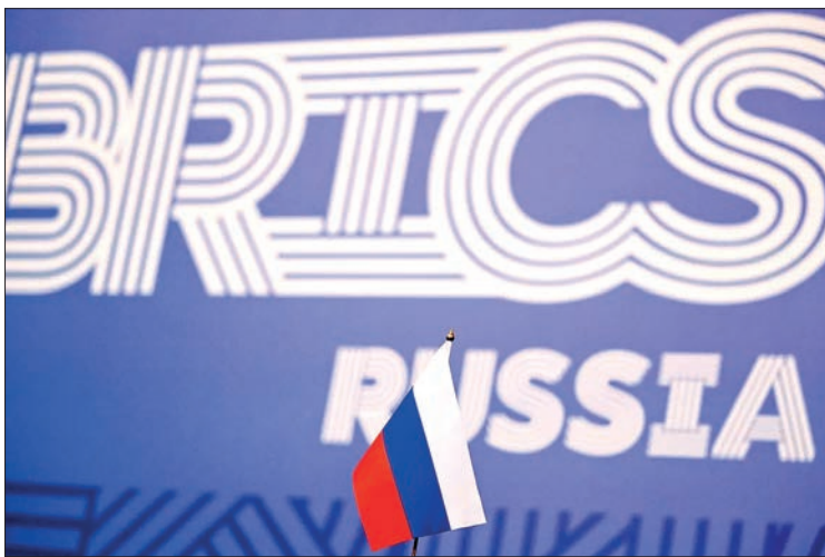
The emblem of BRICS.

Russia has repeatedly stated that it would cope with the sanctions pressure that the West had begun to exert on Russia several years ago and continued to increase. Moscow noted that the West lacked the courage to admit the failure of sanctions against Russia. In the West, opinions have repeatedly been voiced that anti-Russian sanctions were ineffective. Russian President Vladimir Putin stated that the policy of containing and weakening Russia was a long-term strategy of the West, and the sanctions had dealt a serious blow to the entire global economy. According to Putin, the main goal of the West is to worsen the lives of millions of people. — Sputnik