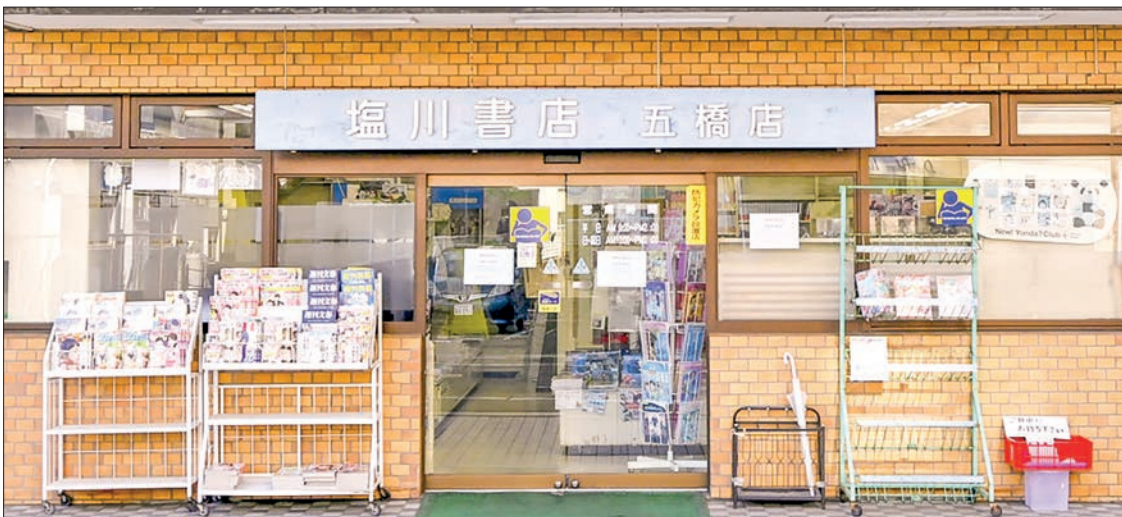
File photo taken in August 2024 shows a bookstore in Sendai, Miyagi Prefecture.

The survey, conducted every five years since fiscal 2008, covered 6,000 individuals aged 16 or older, with valid responses from 3,559 between January and March 2024. — Kyodo