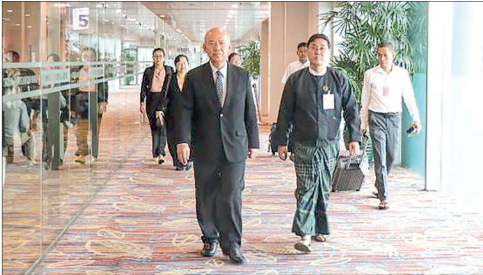
The Myanmar delegation led by Union Constitutional Tribunal Chair U Aung Zaw Thein (L) is seen before leaving for Thailand yesterday.