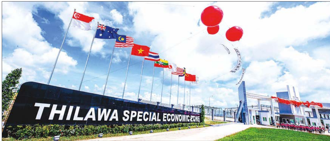
A panoramic view of Thilawa Special Economic Zone in Thanlyin, Yangon Region.

Thailand stood as the second largest investor this FY, with an estimated capital of over $44 million made by one enterprise. China is ranked third in the line-up with more than $35 million from 14 businesses and the existing ones.