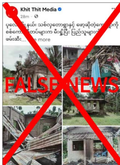
This screenshot validates false claims.

Security forces did not set fire and arrest the villagers, but terrorists raided villages and detained villagers. Therefore, subversive media circulate misinformation. — MNA/KTZH