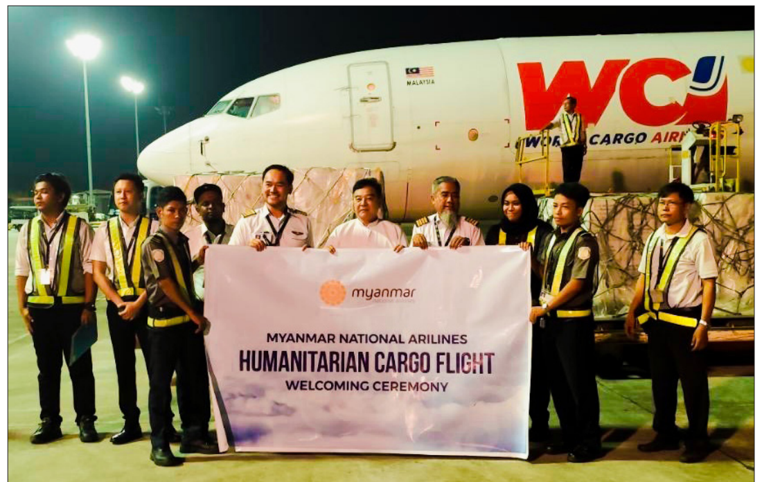
The commemorative group photo of the welcome ceremony for MNA's free relief cargo transport.

THE Myanmar National Airlines carry relief materials and medicines free of charge for the flood-stricken people. To provide convenient transport and deliver support to flood victims, Myanmar National Airlines transported 479 kilogrammes and 197 kilogrammes of relief items on 15 and 16 September with the UB-002 Singapore-Yangon flight. Moreover, it also carried AHA Centre-provided 5,560 kilogrammes of relief goods from Thailand to Yangon on 17 September with Humanitarian Cargo Flight, Boeing 737-800F (9M-WCA), Bangkok-Yangon (UB-2020). The airlines will provide the necessary assistance in delivering relief supplies. — Arkar Lin/KTZH