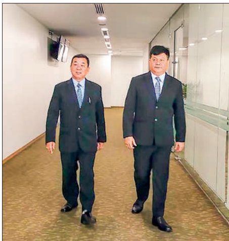
Myanmar delegates are seen yesterday before departing for Laos.

The governors of ASEAN countries, the mayor of Dili of Timor Leste will attend the event as observers, and relevant officials of UN agencies, NGOs, strategic partner countries, ASEAN ambassadors, representatives from the ASEAN Secretary-General office, Committee of Permanent Representatives to ASEAN and international organizations. — MNA/KTZH