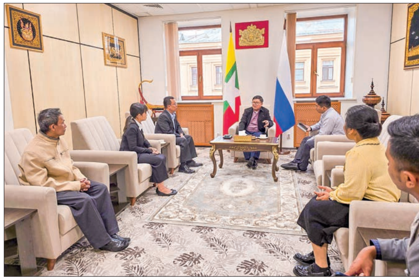
The meeting between Deputy Minister Dr Aung Gyi and staff members of the Myanmar Consulate-General progression 16 September in St Petersburg.

DEPUTY Minister for Agriculture, Livestock, and Irrigation Dr Aung Gyi, who is attending the seventh Global Fishery Forum and Seafood Expo Russia in Saint Petersburg, met staff and families of the Myanmar Consulate-General in the city on 16 September.