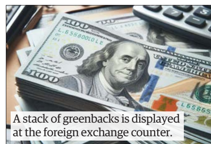
A stack of greenbacks is displayed at the foreign exchange counter.

The Agriculture Department encouraged growers to grow monsoon paddy, wheat and other crops again in flood-stricken regions before the season ends. Some monsoon paddy, wheat and other crops were battered by extreme rainfall and strong winds. As the season of monsoon paddy and late monsoon long-staple wheat has not ended, staff are requested to entice growers to re-cultivate them. Therefore, the department has reserved seeds. It is willing to cooperate with growers. It has issued guidelines to redevelop