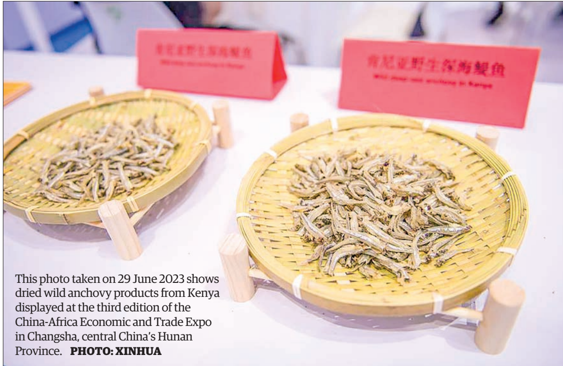
This photo taken on 29 June 2023 shows dried wild anchovy products from Kenya displayed at the third edition of the China-Africa Economic and Trade Expo in Changsha, central China's Hunan Province.