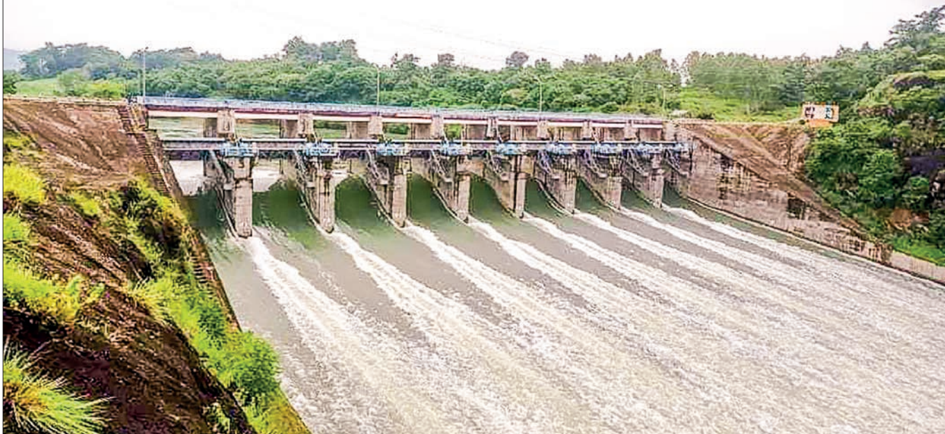
This photo shows the Kyeeohn Kyeewa Dam in Pwintbyu Township, Magway Region, on 14 September.

AS of the measurement taken at 6 am on 17 September, the water level of the dams, lakes, and reservoirs in Magway Region is gradually receding, according to the Department of Irrigation and Water Utilization Management.