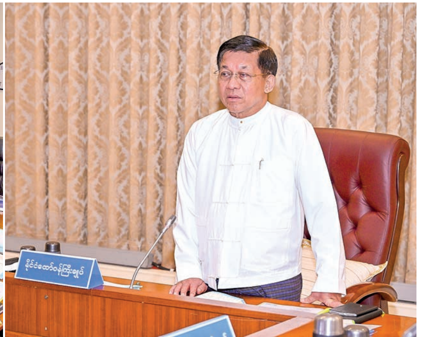
State Administration Council Chairman Prime Minister Senior General Min Aung Hlaing addresses the National Disaster Management Committee meeting yesterday in Nay Pyi Taw.

Although nobody can avoid natural disasters, they can strive to mitigate the impacts of disasters as much as possible and emphasize rapid rehabilitation.