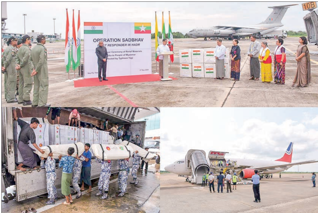
The handing over and receiving ceremony of the Operation Sadbhav: India's Humanitarian Assistance Disaster Relief to Myanmar is in progress yesterday in Nay Pyi Taw (top). AHA's relief supplies are also arriving in Myanmar yesterday (above).