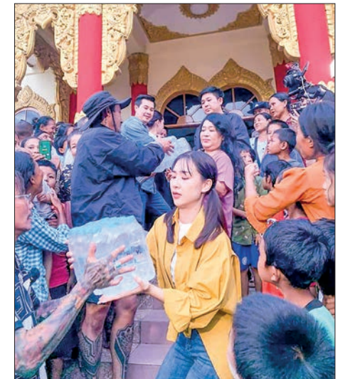
Movie stars are seen gathering relief goods for distribution to flood victims.