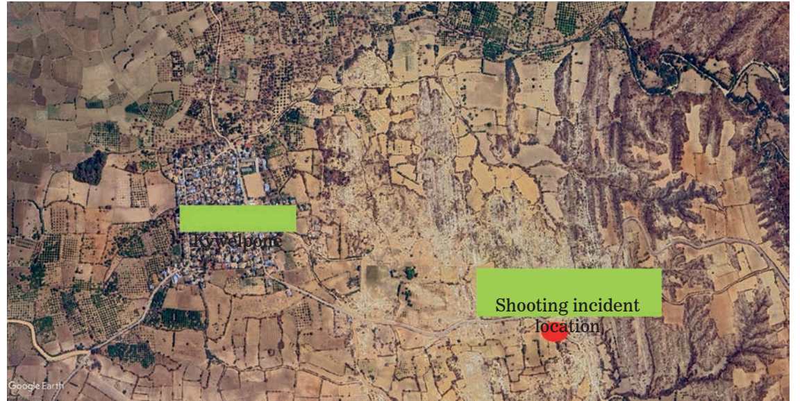
The shooting incident location map in Kywelpone Village, Sagaing Township.

In April 2023, PDF terrorists also targeted Kywelpone village with bombings, resulting in eight deaths, including five children and thirty-one injuries. Additionally, on 16 September, a monk travelling