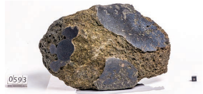
Photo shows a meteorite from Mars discovered by the National Institute of Polar Research.