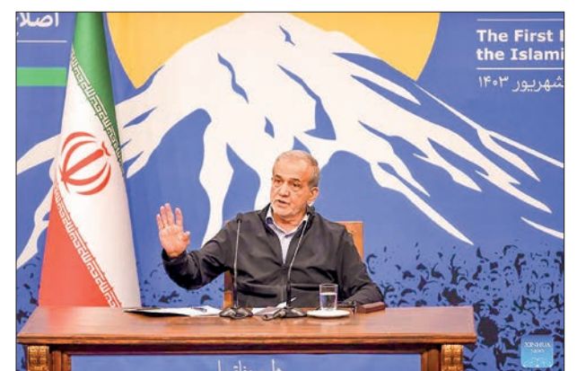
Iranian President Masoud Pezeshkian attends a press conference in Tehran, Iran, on 16 September 2024.

"If the United States and certain European countries fulfill their commitments, we will do the same," he said. "If they do not, neither will we." — Xinhua