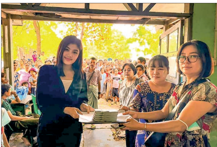
This photo showcases actress Soe Pyae Thazin and her family offering donations and foodstuffs to flood victims.

ACADEMY award-winning actress Soe Pyae Thazin and her family donated cash to flood-stricken communities in Taungoo Township, Bago Region, and Pyinmana Township, Nay Pyi Taw Council Area, on 16 September, sources close to the family confirmed.