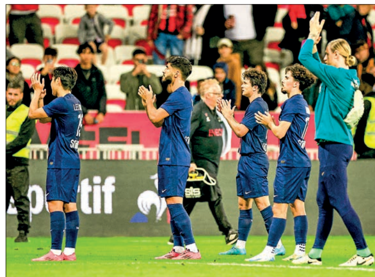
Paris Saint-Germain's players react at the end of the French L1 football match between Nice (OGCN) and Paris Saint-Germain (PSG) at the Allianz Riviera stadium in Nice on 6 October 2024.

Tottenham fell apart in the second half to suffer a 3-2 defeat away to Brighton after having led 2-0 at halftime. Ange Postecoglou's side was excellent in the first 45 minutes, leading through goals from Brennan Johnson and James Maddison. — Xinhua