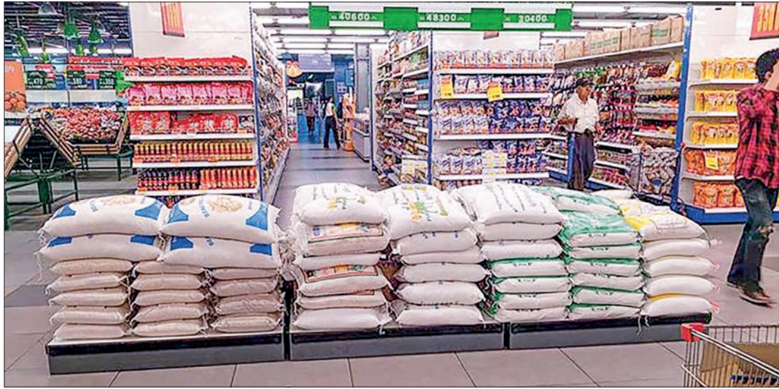
Rice sacks are neatly organized for sale in the supermarket.

eyawady Pawsan, and Shwebo Pawsan). Retailers are not allowed to make profits of more