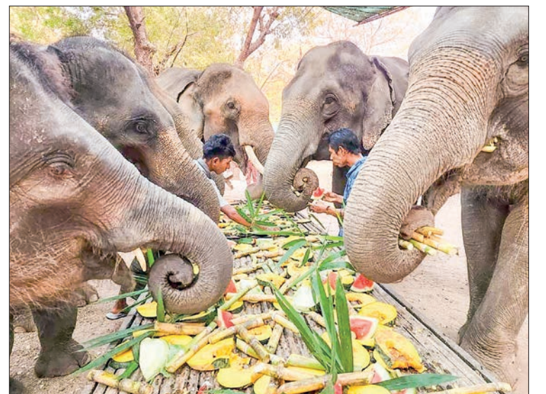
Gentle giants feast on a buffet of feed at the Palin Riverview Elephant Camp.

Asian elephants are considered brilliant creatures. They have close and less aggressive interactions with people. Visitors can also observe the livelihood, habitat, behaviour and characteristics of the Asian and African elephants and mahouts at the elephant museum, featuring the structure of elephants