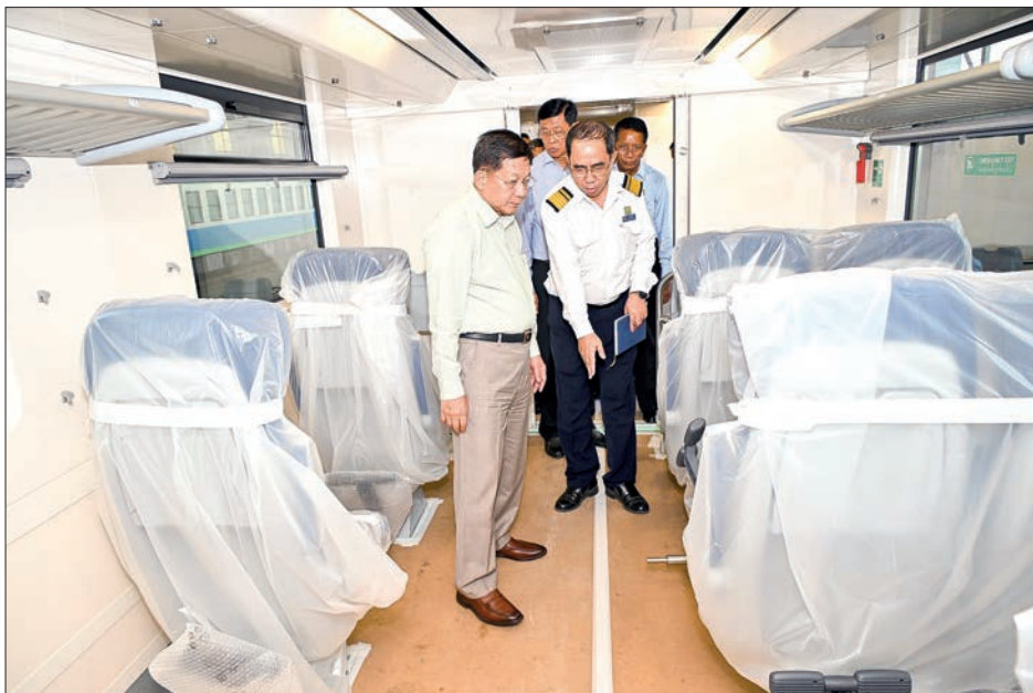
The Senior General inspects the interior of the DEMU carriage.

sleepers for all sections and further production of sleepers.