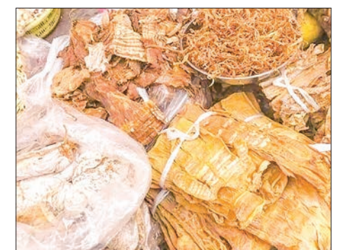
Dried bamboo shoots are produced in different varieties.

In addition to orders for sweet bamboo shoots, orders for dried bamboo shoots have been high, too, but only a few were able to export due to raw material shortage. — MT/ZS