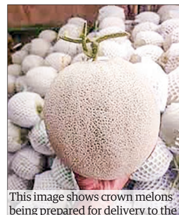
This image shows crown melons being prepared for delivery to the market.

“Crown melons are present all year round but it may be either abundant or scarce. It is grown here. If the market is good, they go up, and if not, they go down. In the Mandalay market, they buy a lot of gifts and offerings. The shops also sell it. The fruit is beautiful, and the market is good. They grow it in Kyaukse, where fruits are harder than spongy ones in other areas. Right now, it is quite rare, and the price is good,” said a wholesaler and retailer in Mandalay. — Thit Taw/ZN