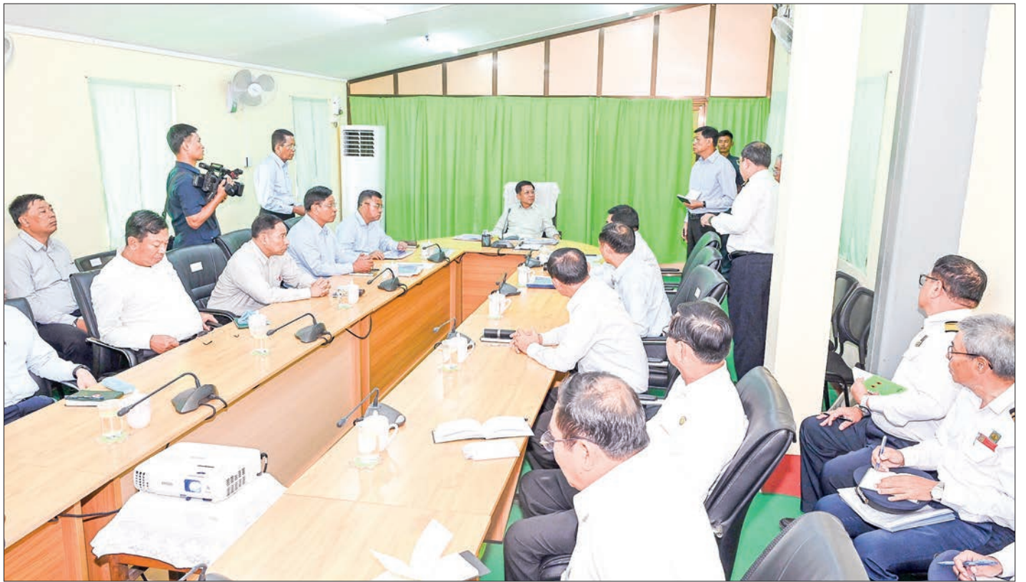
SAC Chair PM Senior General Min Aung Hlaing hears the reports from SAC Member MoTC Union Minister General Mya Tun Oo yesterday.