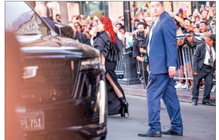
Lady Gaga attends the Los Angeles Premiere of Warner Bros Pictures "Joker: Folie a Deux" at TCL Chinese Theatre on 30 September 2024 in Hollywood, California.

Last week's box office leader, family-friendly sci-fi tale "The Wild Robot" from DreamWorks Animation, slipped a spot to second, taking in $18.7 million for the Friday-through-Sunday period,