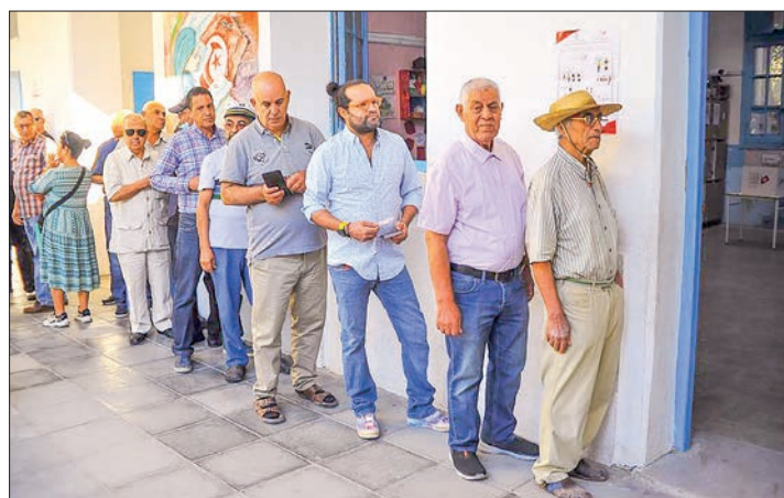
Tunisian voters line up to vote outside a polling centre in Tunis, Tunisia on 6 October 2024.

EXIT polls showed that Tunisian President Kais Saied is expected to win the presidential election on Sunday, Tunisian State TV reported.