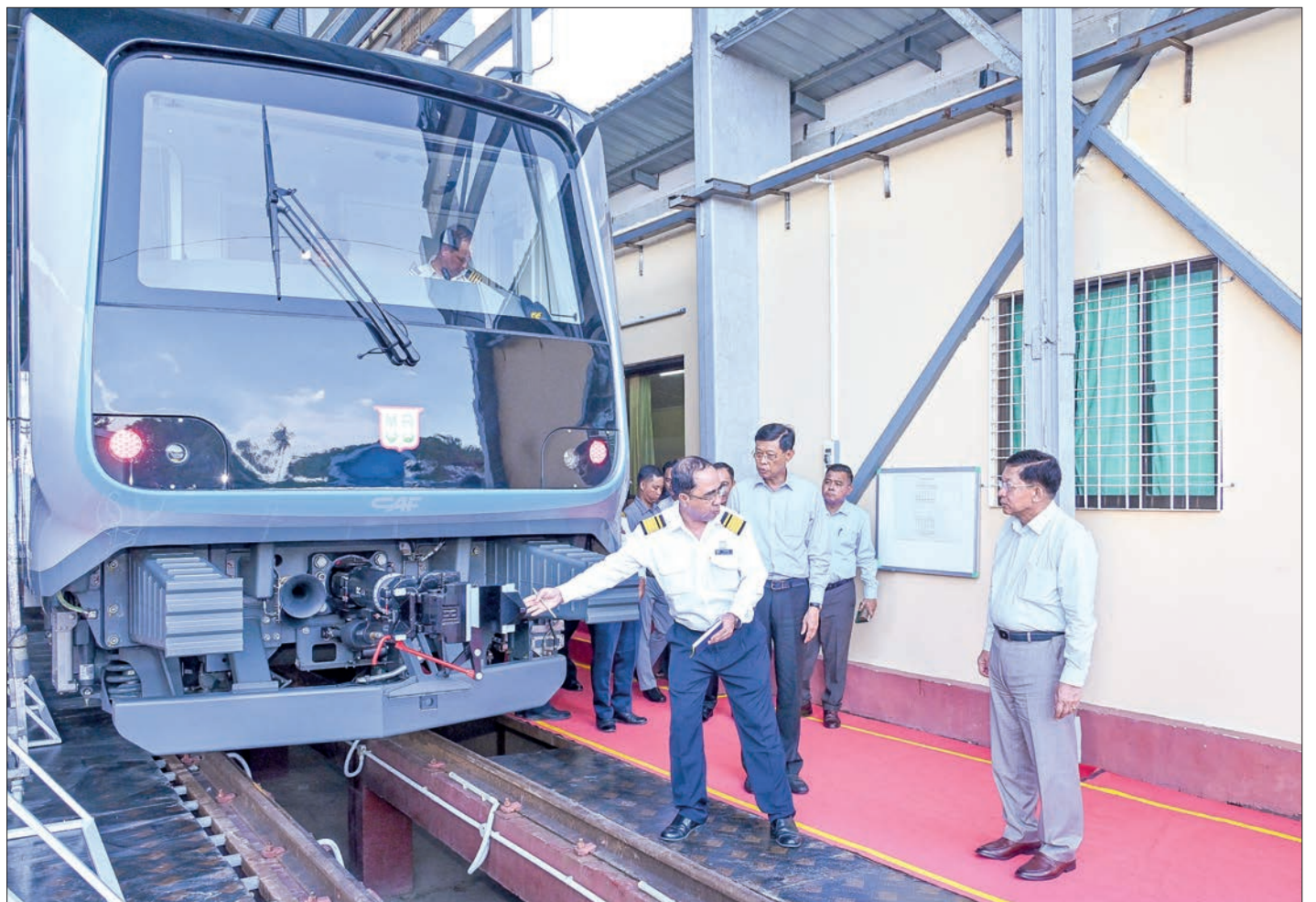
State Administration Council Chairman Prime Minister Senior General Min Aung Hlaing looks into the Diesel Electric Multiple Unit (DEMU) locomotive at the City Circular Diesel Locomotive Shed (Insein) in Yangon yesterday.