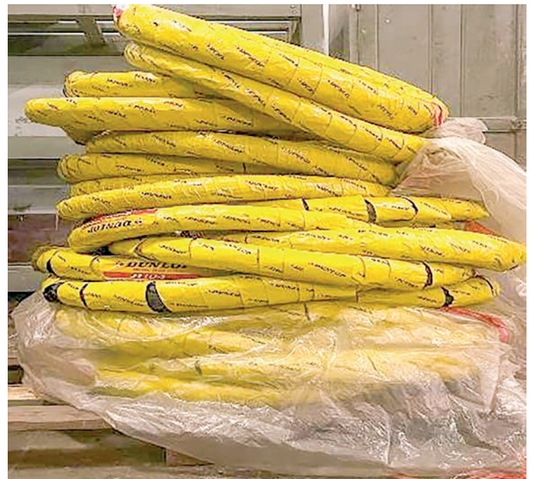
Confiscated illegal goods in Taninthayi Region.

tion Steering Committee reported that nine arrests were made on 6 and 7 October, resulting in