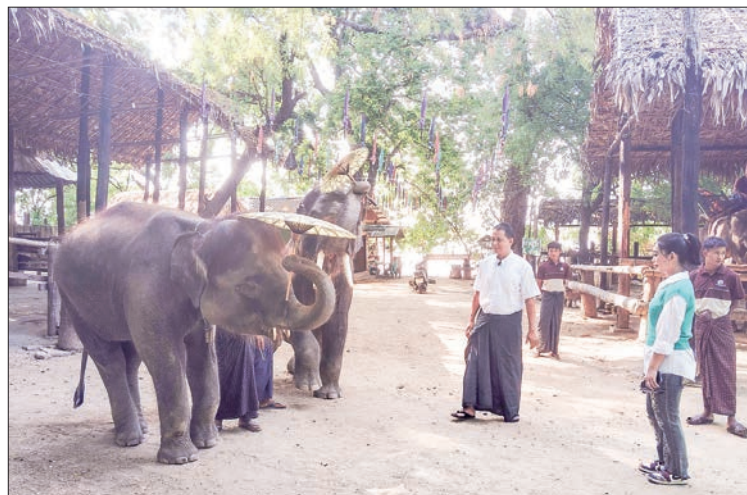
The Palin Riverview Elephant Camp presents an impressive demonstration of pachyderm intelligence.

and elephant tusks, the video presentation of the most dangerous areas with elephant hunting and 80-year record book stating Kings owning white elephants, spot for white elephants and timber production camp where twin elephants were born, a warden said.