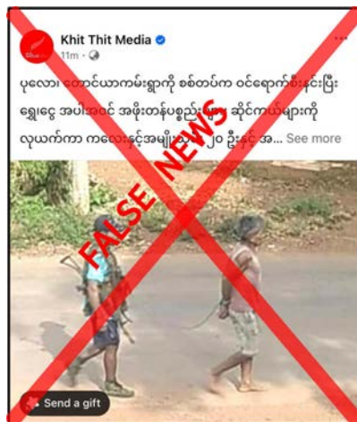
This screenshot validates fabricated stories.

The officer emphasized that malicious media spread false information, blaming Tatmadaw for actions carried out by PDF terrorists as part of their propaganda efforts. — MNA/TMT