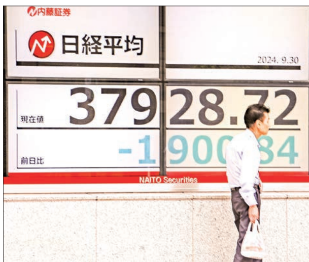
A financial monitor in Tokyo shows the 225-issue Nikkei Stock Average falling over 1,900 points from the previous trading day's close on the morning of 30 September 2024.

The dollar rallied on the reading as investors lowered their expectations the Federal Reserve will cut interest rates 50 basis points for a second straight meeting when it gathers this month.