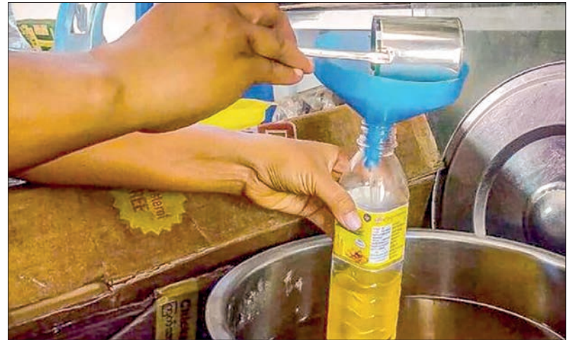
A vendor skilfully siphons cooking oil for sale at the market.

To control overcharging, the Consumer Affairs Department under the Ministry of Commerce informed the consumers of lodging the complaints for overcharging through the call centre