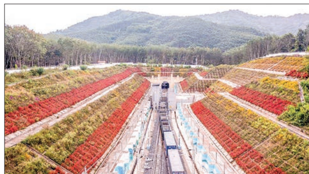
This aerial photo taken on 24 November 2022 shows a freight train to enter the China-Laos Railway's Friendship Tunnel connecting Mohan in southwest China's Yunnan Province and Boten in northern Laos.

Confident that opening-up is the right path, China has been implementing proactive strategies, including spurring trade growth, attracting foreign investment and expanding institutional opening-up, to accelerate cultivating new international competitive advantages and achieving mutual benefits with other countries. — Xinhua