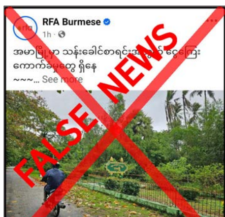
This screenshot validates fabricated claims.

MALICIOUS media outlets are falsely reporting that ward administration body teams in Amar, Pyapon District, Ayeyawady Region, have been collecting money in certain wards to provide food and entertainment for census enumerators.