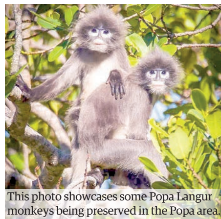
This photo showcases some Popa Langur monkeys being preserved in the Popa area.

year will be the third time. Together with locals, we have designated 11 November as Conservation Day and are focusing on an advocacy campaign. Because these