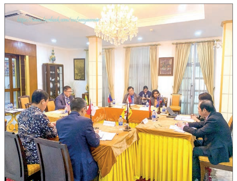
The 61 st Meeting of Heads of Mission of the ASEAN-Dhaka Committee (ADC) in progress on 3 October in Bangladesh.

The Thai ambassador handed over the alternate chairmanship of the ASEAN-Dhaka Committee to the Vietnamese ambassador during the meeting. — ASH/TMT