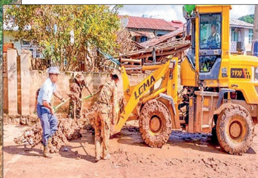
MEMBERS of Tatmadaw, Myanmar Police Force, Fire Brigade, Red Cross Society and social welfare organizations actively participate in cleanup measures and rehabilitation processes in flood-hit wards and

Moreover, medical teams provided healthcare services. They conducted health awareness programmes for the flood victims at the relief camps and provided relief items, commodities, foodstuffs and cash. The relevant officials inspected these working processes. Officials also repaired the damaged roads and bridges to facilitate public transport. — MNA/KTZH