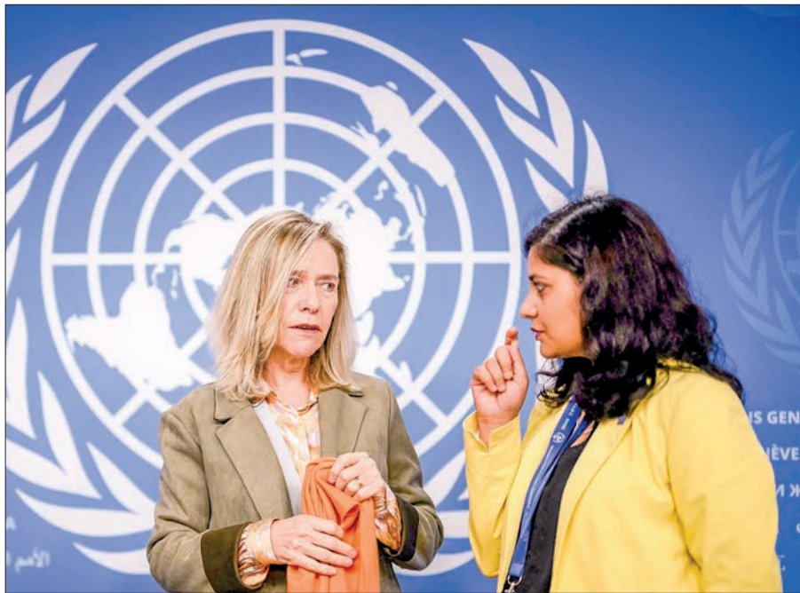
World Meteorological Organization (WMO) Secretary-General Celeste Saulo (L) speaks with WMO Scientific Officer Sulagna Mishra during a press conference on Switzerland, on their report on the state of world water resources, in Geneva, on 7 October 2024.

INCREASINGLY intense floods and droughts are a “distress signal” of what is to come as climate change makes the planet’s water cycle ever more unpredictable, the United Nations said Monday.