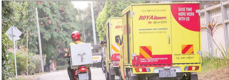
A box truck offering domestic and international express delivery services is pictured here.

The companies include MYGO Myanmar Company, OmniTech, Zhejiang BFS International Logistics, Asia Mega Link Services, Zego Express, Star Banner, Myanmar Elite Logistics, Thant Phyu Company, and Royal Express Services.