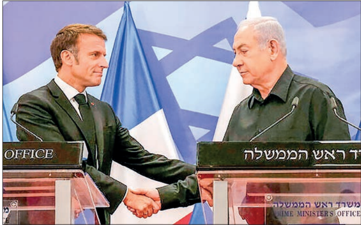
Prime Minister Benjamin Netanyahu (R) shakes hands with French President Emmanuel Macron (L), as they hold a joint press conference in Jerusalem on 24 October 2023.

FRENCH President Emmanuel Macron and Israeli Prime Minister Benjamin Netanyahu held a telephone conversation about the Middle East situation on Sunday after the latter criticized the French leader's call for an arms embargo on Israel.