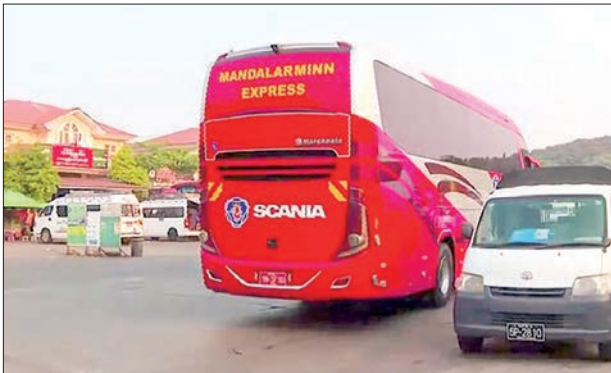
An express bus is parked at the bus stand.

Telematics devices will help monitor vehicles the whole day. An awareness period for telematics installation is set from 18 June to 15 October 2024. Afterwards, the department notified vehicle owners that telematics installation is compulsory for highway passenger vehicles from 16 October 2024. — NN/KK