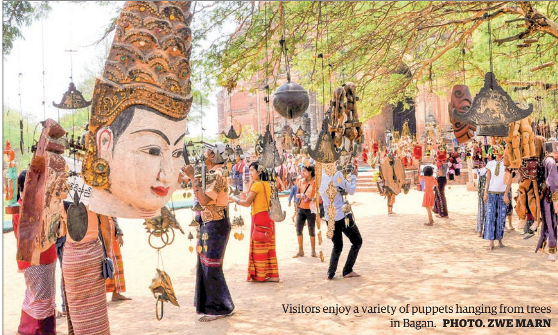
Visitors enjoy a variety of puppets hanging from trees in Bagan.

the 2023 Thadingyut Festival. Moreover, they prepare to facilitate the travellers arrivals