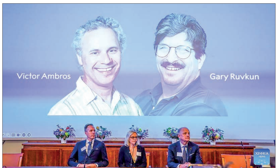
Portraits of the 2024 Nobel laureates in Physiology or Medicine, Victor Ambros and Gary Ruvkun, are seen at the Karolinska Institute in Stockholm, Sweden, on 7 October 2024. The 2024 Nobel Prize in Medicine was awarded Monday to two American scientists, Victor Ambros and Gary Ruvkun, for their discovery of microRNA and its role in post-transcriptional gene regulation.

The announcement marked the start of this year’s Nobel Prize award season. The Nobel announcements will proceed with the physics prize on Tuesday, followed by chemistry on Wednesday, and literature on Thursday. The Nobel Peace Prize will be revealed on Friday, and the Nobel Memorial Prize in Economic Sciences will be announced on 14 October. — Xinhua