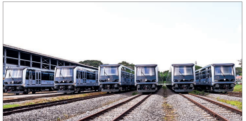
A glimpse of DEMU trains imported from Spain.