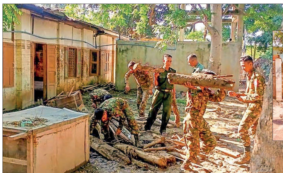
Members of Tatmadaw, police, fire brigade, Red Cross, and civil society organizations are diligently conducting cleanup efforts following the flash floods.