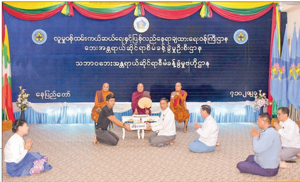
Union Minister Dr Soe Win receives the flood donations yesterday.