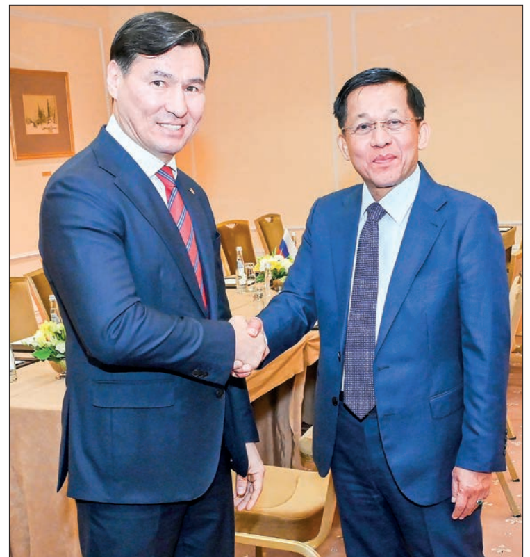
Head of Kalmykia Republic of the Russian Federation Mr Batu Khasikov shakes hands with the Senior General.

The Senior General also received Head of Kalmykia Republic of the Russian Federation Mr Batu Khasikov and party to talk about the establishment of