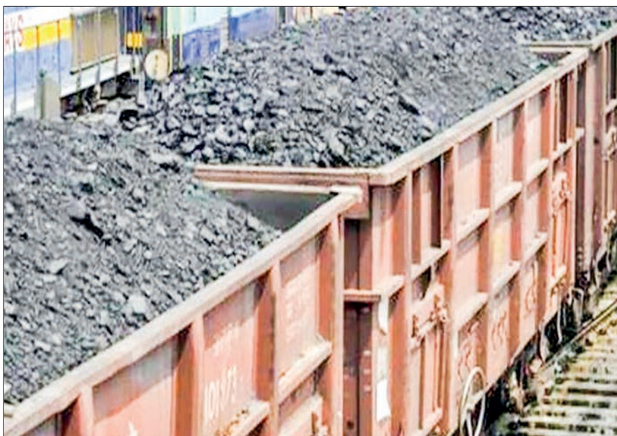
India's coal sector continues its strong performance with significant growth in both production and dispatch up to February 2025.

India's coal production for the month of February reached 928.95 million tonnes (MT), reflecting a 5.73 per cent increase compared to 878.55 MT in the same period last year, as per the ministry's data released on 1 March. — ANI