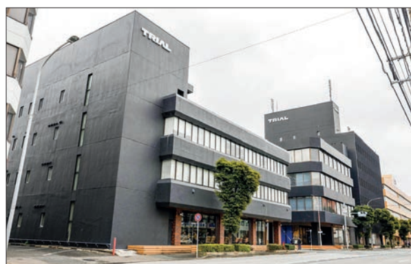
Photo shows the headquarters of Japanese discount supermarket chain operator Trial Holdings Inc in Fukuoka on 5 March 2025.

KKR and Walmart currently hold 85 per cent and 15 per cent stakes in Seiyu, respectively. — Kyodo