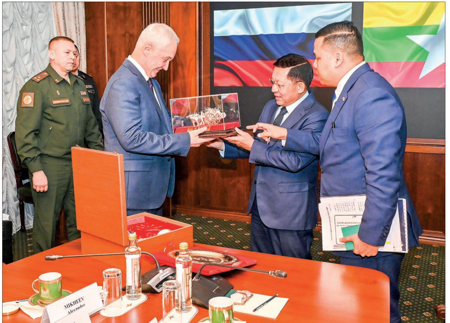
Photos showcase SAC Chairman PM Senior General Min Aung Hlaing exchanging gifts with Russian Defence Minister Mr Andrei Removich (above) and the meeting is underway (below).

Chairman of the State Administration Council Prime Minister Senior General Min Aung Hlaing, currently in Moscow of the Russian Federation, held a meeting with Minister of Defence of the Russian Federation Mr Andrei Removich at the meeting hall of the Ministry of Defence of the Russian Federation yes-