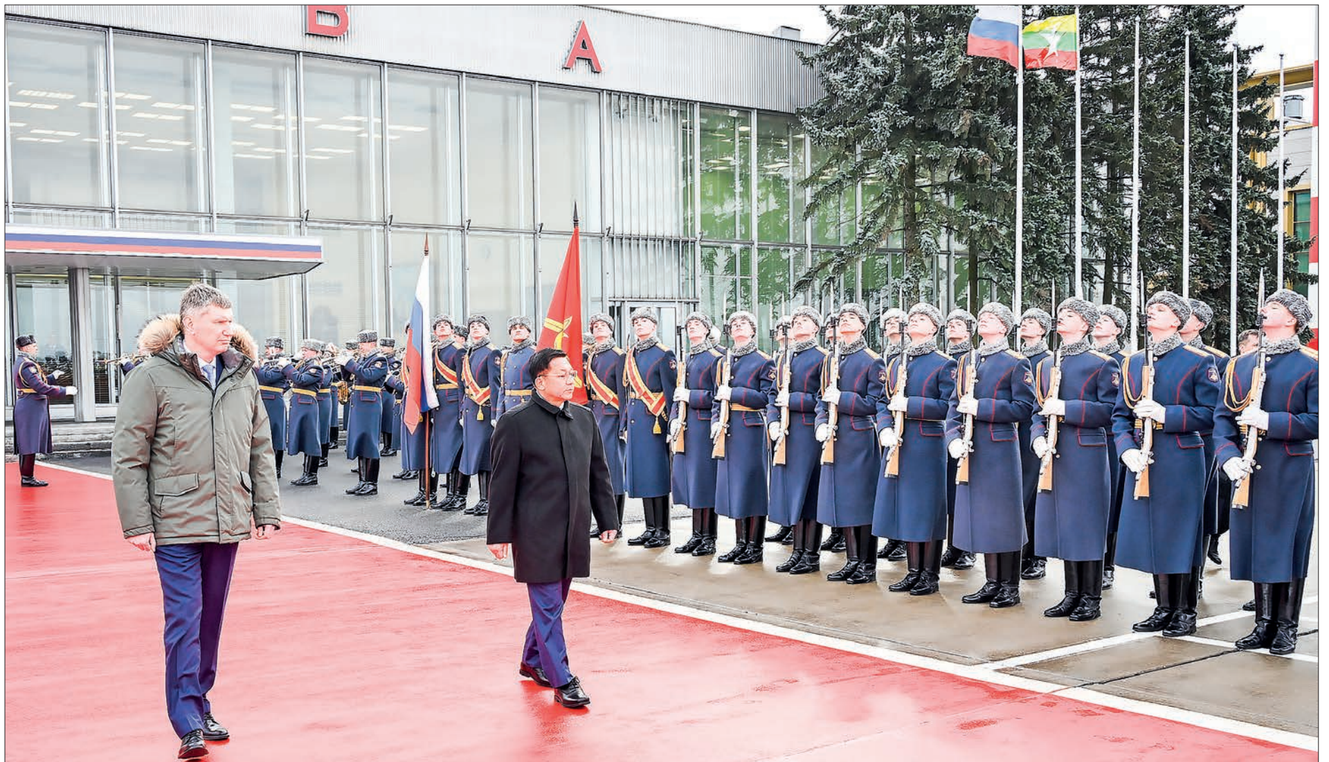
State Administration Council Chairman Prime Minister Senior General Min Aung Hlaing receives the salute of the Guard of Honour as he and his entourage leave Vnukovo International Airport in Moscow for Saint Petersburg.

A high-level Myanmar delegation led by Chairman of the State Administration Council Prime Minister Senior General Min Aung Hlaing, who is on an official