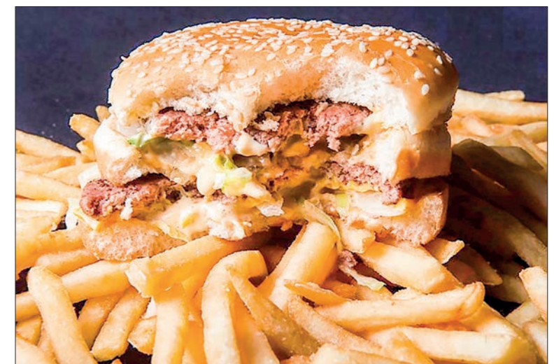
Obesity has soared as people eat more unhealthy foods, researchers have warned.