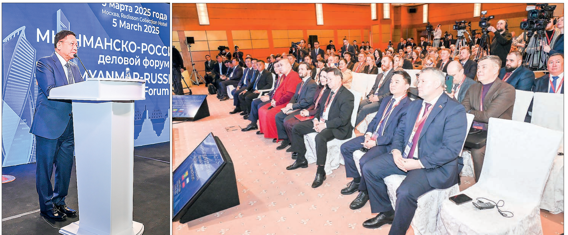
State Administration Council Chairman Prime Minister Senior General Min Aung Hlaing speaks at the Myanmar-Russia Economic Forum in Moscow yesterday.