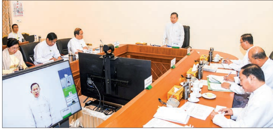
State Administration Council Vice-Chairman Deputy Prime Minister Vice-Senior General Soe Win addresses the coordination meeting on reviewing revenue and expenditure estimates of the Union for the 2025-2026 financial year yesterday.

Speaking at the meeting, the Vice-Senior General, who is also Vice-Chairman of the Financial Commission, said in drafting the annual budget estimates for each financial year, the government has to ensure that the budget deficit and GDP do not exceed five per cent. When reviewing the budget estimates for the 2024-2025 financial year, it is observed that certain revenue-generating ministries and organizations have not been able to reach their revenue targets due to various reasons. Similarly, on the expenditure side, there have been cases where unnecessary and excessive budget requests were submitted, as well as requests for projects that were presumed to be completed. Moreover, some projects are not completed, and certain operations fail to commence as planned due to various reasons by the end of the financial year. As a result, surplus funds are returned, leading to a significant amount of surplus funds for the State.