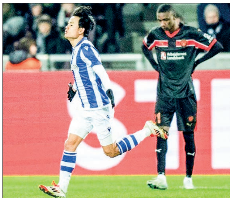
Real Sociedad's Japanese forward Takefusa Kubo will be fresh for the Man United clash after serving a suspension against Barca.

Luka Sucic and Spain's Euro 2024 final hero Mikel Oyarzabal should return after knocks to face Manchester United. — AFP