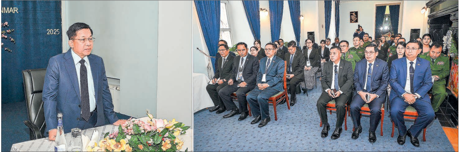
State Administration Council Chairman Prime Minister Senior General Min Aung Hlaing speaks at the meeting with family members of the embassy and military attache office.

T he State Administration Council Chairman and Prime Minister Senior General Min Aung Hlaing, who is on a goodwill visit to Moscow, the Russian Federation, met the families of the Myanmar Embassy and the Military Attaché office to the Russian Federation at the Myanmar Embassy yesterday morning, local time.