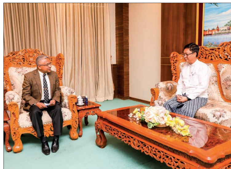
The Indian ambassador calls on MoFA Deputy Minister U Lwin Oo in Nay Pyi Taw.

They exchanged views on enhancing the existing ties of friendship and mutually beneficial cooperation between the two countries and emphasized the importance of utilizing existing bilateral mechanisms to achieve fruitful outcomes. — MNA