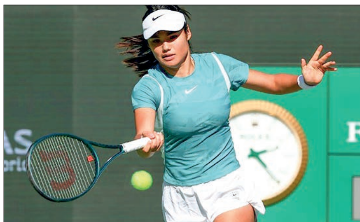
Emma Raducanu practices at Indian Wells, where she is returning to action for the first time since being targeted by a stalker in Dubai.

EMMA Raducanu revealed Tuesday she "couldn't see the ball through the tears" after being targeted by a stalker during last month's Dubai WTA 1000 tournament.