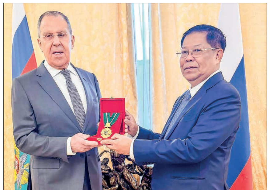
Russian Foreign Affairs Minister Mr Sergey Viktorovich Lavrov receives the 'Sithu' title.

Following the conferment ceremony, the two sides held open and cordial discussions on further enhancing bilateral relations and cooperation, as well as Myanmar's role as the country coordinator for ASEAN-Russia Dialogue Relations. — MNA