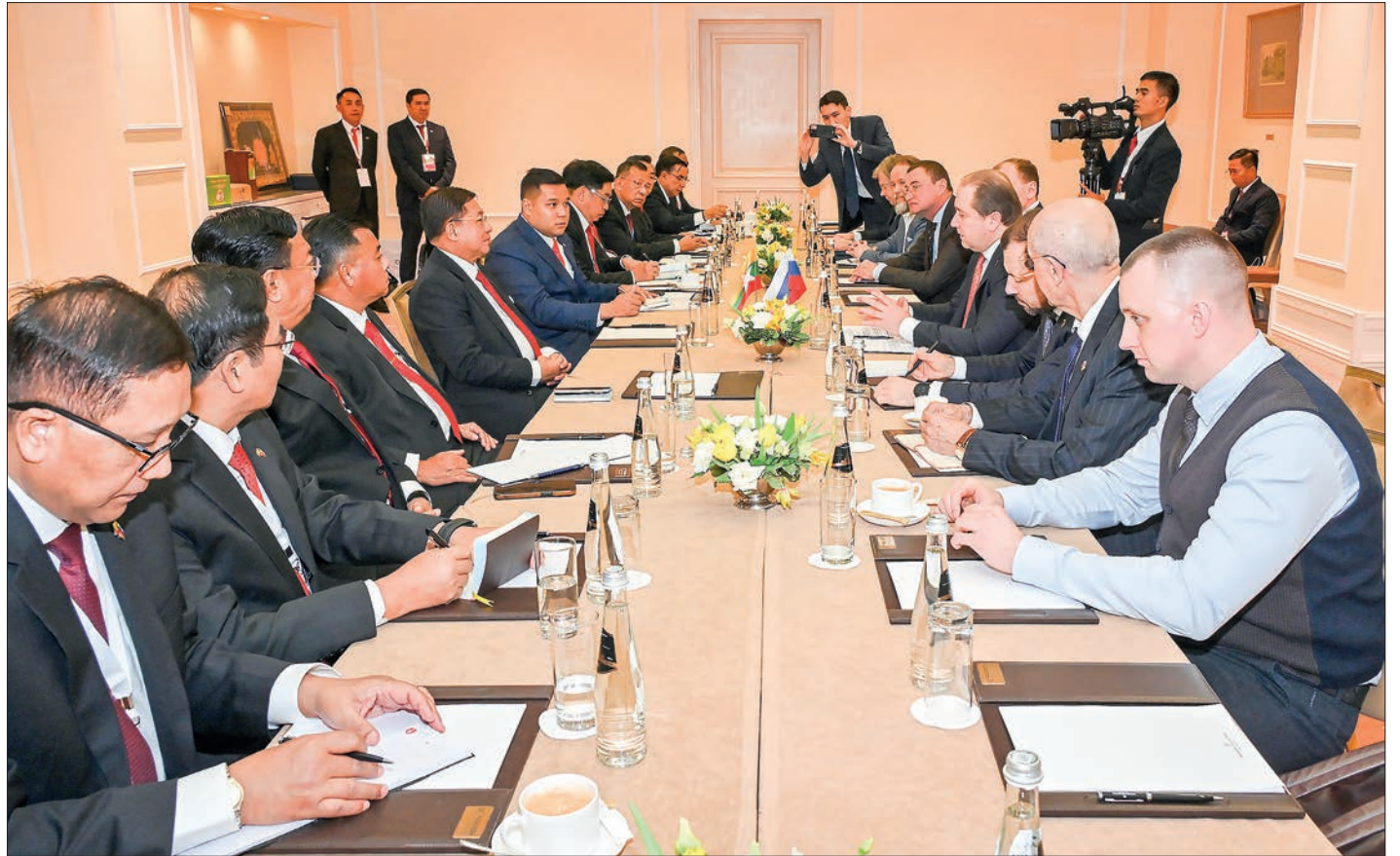
SAC Chairman Prime Minister Senior General Min Aung Hlaing holds talks with the Russia-ASEAN Economic Commission Chairman and his delegation.