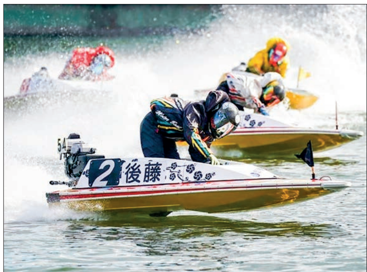
Japan's powerboat racing started as an outlet for legal betting.