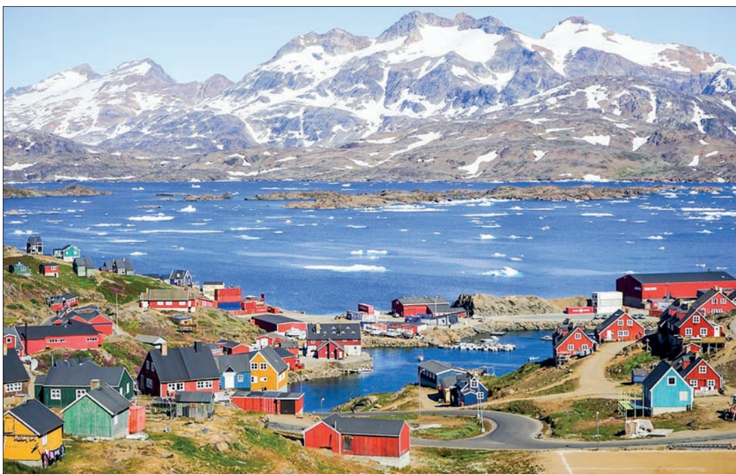
Prime minister Mute Egede ruled out Greenland becoming part of the United States.

“We are not for sale and can’t just be taken. Our future is decided by us in Greenland,” he said, six days before the island’s legislative elections where the longstanding question of independence tops the agenda. — AFP