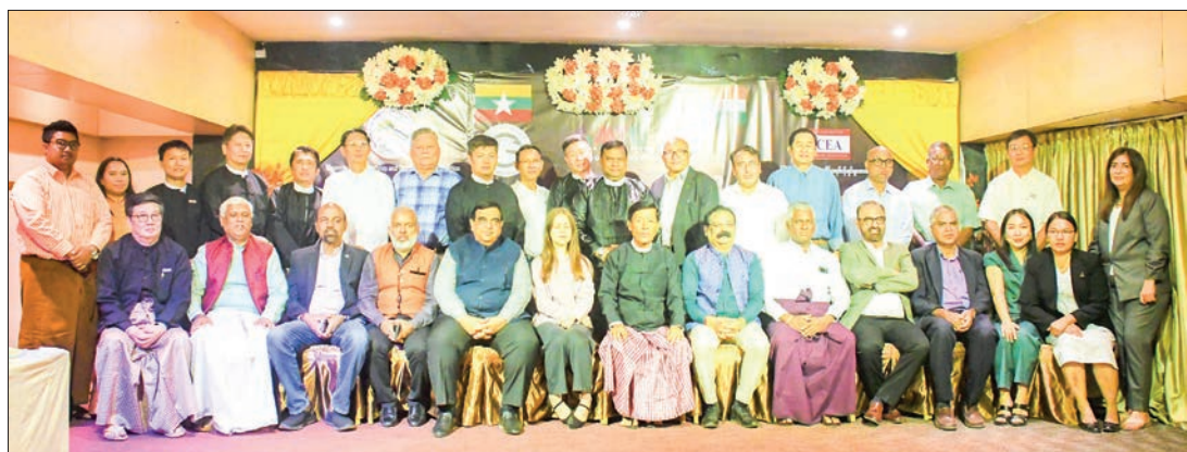
The commemorative group photo at yesterday's concluding event.

THE closing ceremony of the meeting on Agriculture and Economic Development with business leaders from five countries organized by the Myanmar-India Friendship and Development Association took place at the Esperado Lake View Hotel in Yangon yesterday.