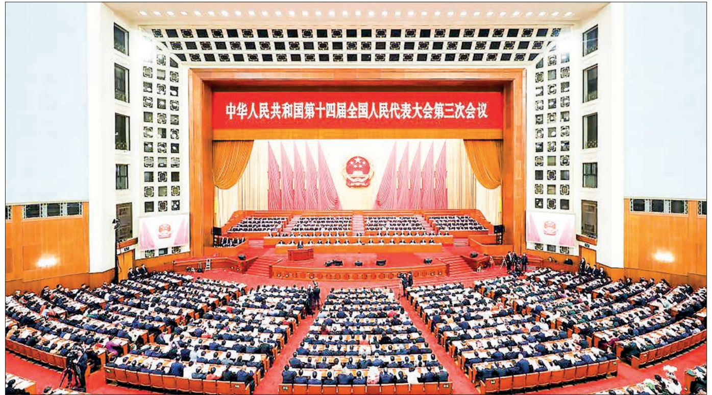
The opening meeting of the third session of the 14 th National People's Congress (NPC) is held at the Great Hall of the People in Beijing, capital of China, 5 March 2025.