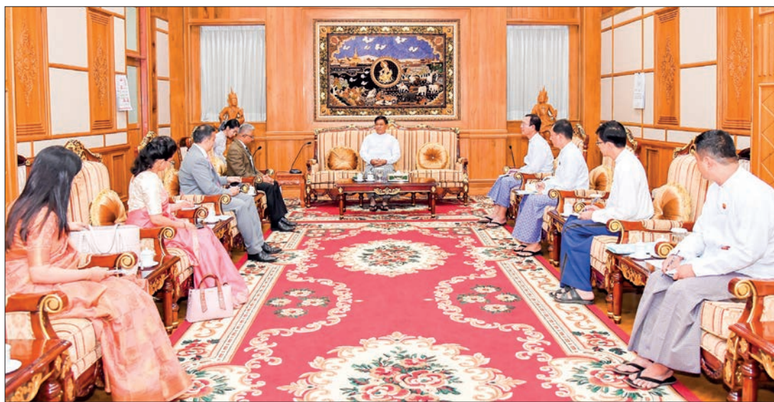
SAC Member, Deputy Prime Minister and Union Minister at the Prime Minister's Office Admiral Tin Aung San receives Indian Ambassador Mr Abhay Thakur yesterday.

MEMBER of the State Administration Council, Deputy Prime Minister and Union Minister at the Office of the Prime Minister Admiral Tin Aung San met Mr Abhay Thakur, Ambassador of India to Myanmar, at the guest hall of the State Administration Council Office yesterday afternoon. They held frank discussions and exchanged