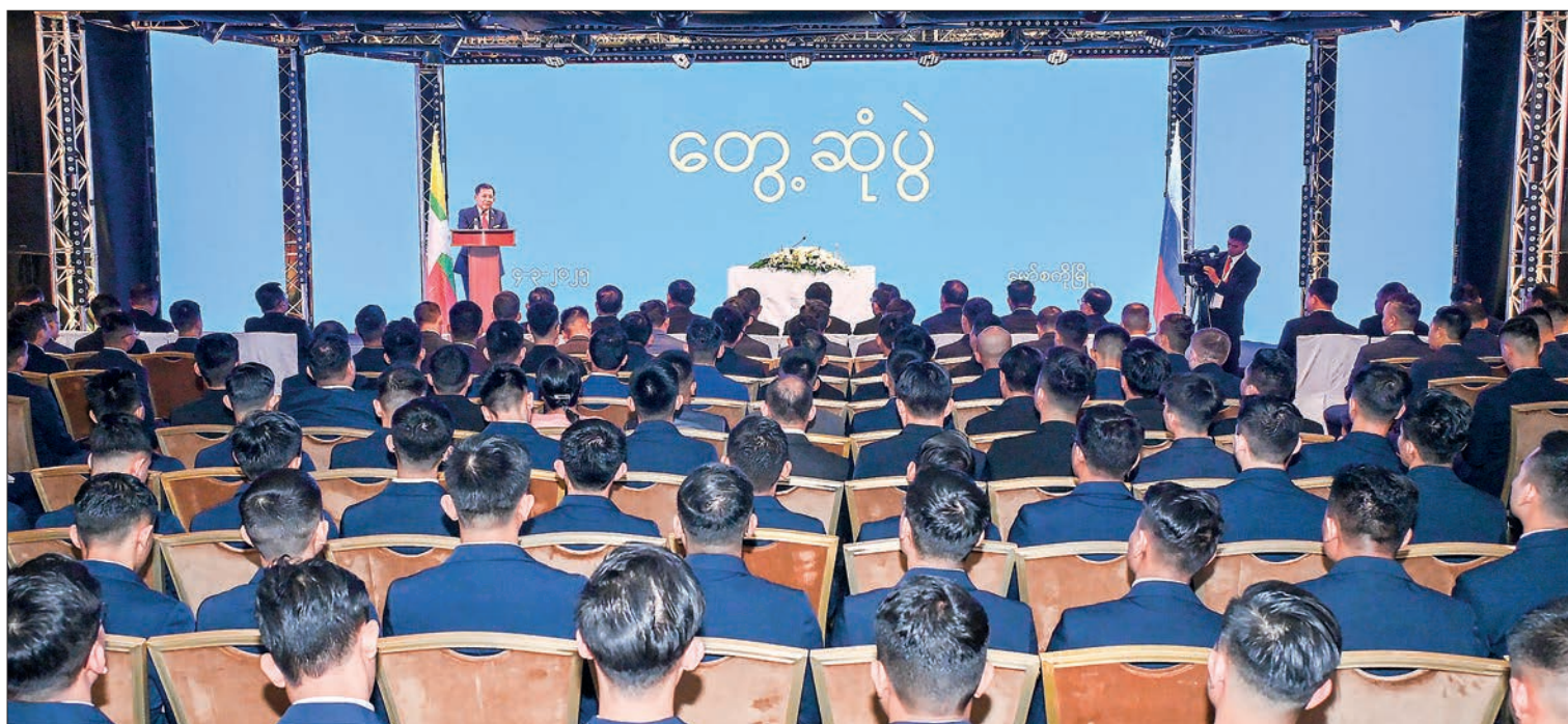
SAC Chairman Prime Minister Senior General Min Aung Hlaing meets military and civilian officer trainees in the Russian Federation.

Speaking on the occasion, the Senior General said that officer scholarship students have to be loyal to the State. As Tatmadaw members joined Tatmadaw by taking an oath of making the sacrifice of life for the sake of the State, they had to avoid the actions of harming the State's interests. They need to serve their duties with a firm concept of being loyal to the State and Tatmadaw. Likewise, as they all are State service personnel, they are required to be free from party politics.