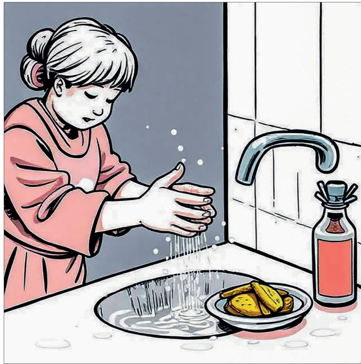
Always wash your hands thoroughly with soap and water before handling food to remove any potential germs that could contaminate the food. ILLUSTRATION: CONCEPT ART

a long time — longer than we have been alive, lurking in the shadows of human history. In recent years, its increase has been largely linked to unclean water and food, overcrowding, and poor sanitation, especially concerning toilets. If you think about it, you may have noticed that the number of infectious diseases has increased in recent years. I certainly didn't — until it hit me personally. My story isn't just about bad sushi; it's about how an invisible enemy travel, how it hides in plain sight, and how I fought it off with lessons I'll never forget.