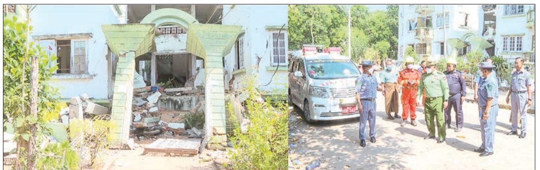
SAC Member Union Minister Lt-Gen Yar Pyae views the loss and damage at the MoBA and staff housing.

SAC Member and Union Minister for Border Affairs Lt-Gen Yar Pyae inspected the damage caused by the earthquake at the Ministry of Border Affairs and its staff housing on 28 March.