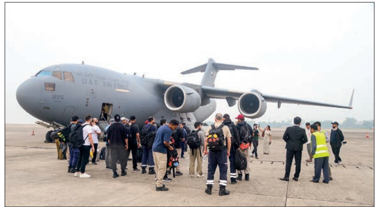
Rescue teams, medics, nurses and relief items arrive at Yangon International Airport yesterday.

The Chinese ambassador gave an explanation about the donation, and the regional chief minister expressed gratitude. Efforts are underway to arrange the supplies, which will be sent to disaster-stricken areas shortly.