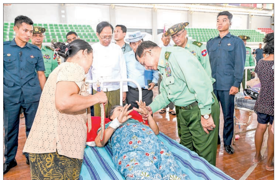
The Senior General cares for patients.