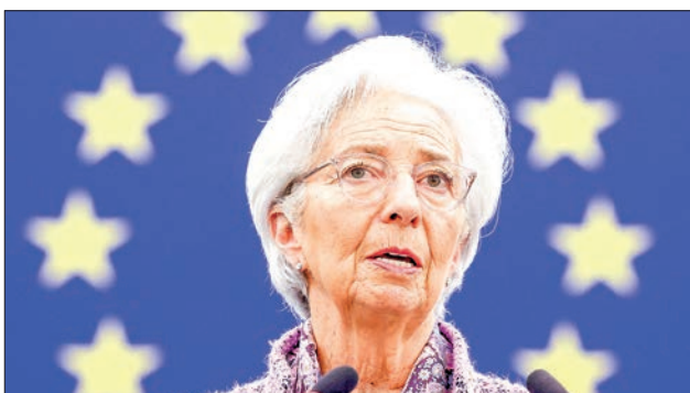
(FILES) European Central Bank (ECB) President Christine Lagarde speaks to present the bank's 2024 Annual Report to the European Parliament, in Strasbourg, eastern France, on 10 February 2025. Lagarde on 31 March 2025 said that Europe should move towards economic independence as US President Donald Trump prepares to unleash a new wave of tariffs.

On Sunday, Iranian President Masoud Pezeshkian confirmed that Tehran had formally rejected a recent US proposal for direct talks, conveyed in a letter from Trump. Addressing a cabinet meeting, Pezeshkian reiterated Iran's refusal to engage in face-to-face negotiations with Washington while sanctions remain in place but left open the possibility of indirect diplomacy. — Xinhua