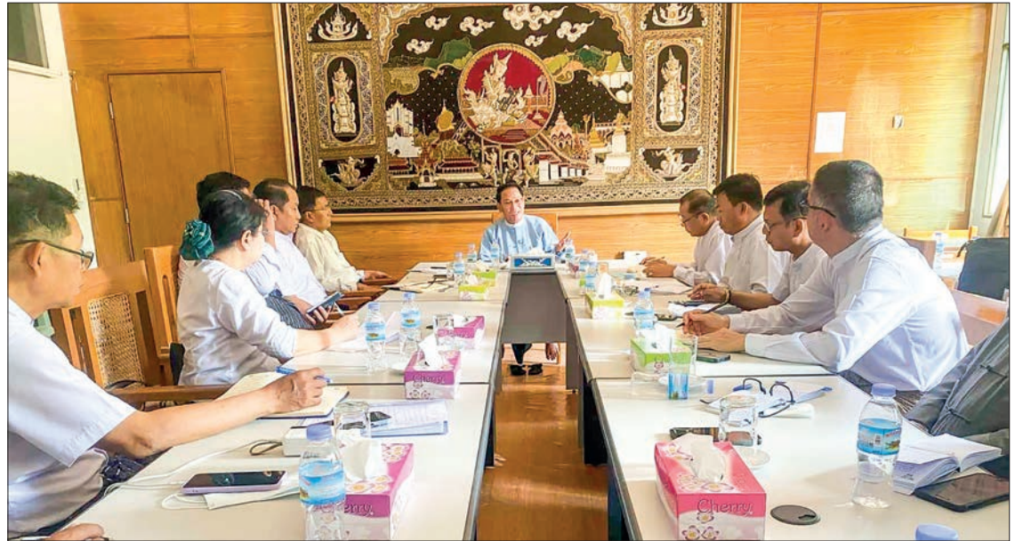
The discussion on the assistance for quake-impacted staff and families underway, led by Union Minister U Maung Maung Ohn.

The Union minister made proper instructions and concluded the meeting. — MNA/KTZH