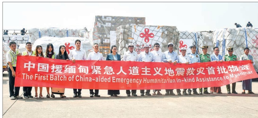
The first batch of Chinese aid arrives at Yangon International Airport.