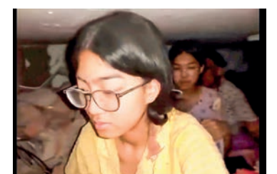
A granddaughter shares her survival story alongside her sister and their 76-year-old grandmother.

With their location now identified, rescuers were able to continue their efforts and successfully extract the grandmother and the remaining child. The authorities recognised the young girls' bravery, resourcefulness, and ability to remain calm under