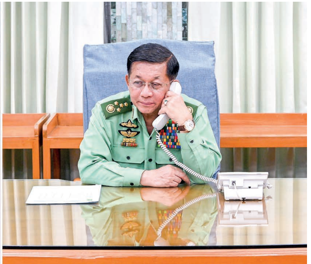
State Administration Council Chairman Prime Minister Senior General Min Aung Hlaing discusses potential earthquake aid with Pakistani Prime Minister over a phone call yesterday.

C HAIRMAN of the State Administration Council Prime Minister Senior General Min Aung Hlaing, reached out yesterday evening to Prime Minister of Pakistan Mr Mian Muhammad Shahbaz Sharif, via phone to explore potential avenues for assistance for loss and damage in Myanmar due to severe impacts of the powerful earthquake on 28 March.