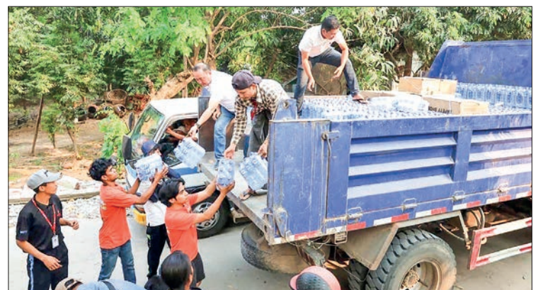
Relief items are unloaded for Sagaing earthquake victims.

Furthermore, the Ayeyawady Foundation has deployed machinery, including mini excavators, wheel loaders, and dump trucks, to assist in clearing debris from damaged buildings in Sagaing. The foundation has also provided water tankers to supply clean drinking water where needed. — Shine Htet Zaw/KNN