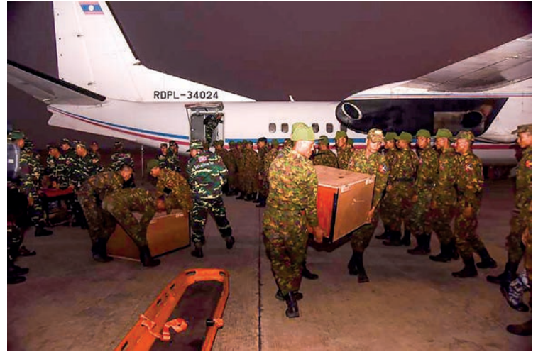
Medicines from Laos arrive at Tatmadaw airport in Nay Pyi Taw.

These teams will be deployed to different earthquake-hit areas to take search and rescue measures and provide medical treatment to the affected communities without delay. — MNA/KNN