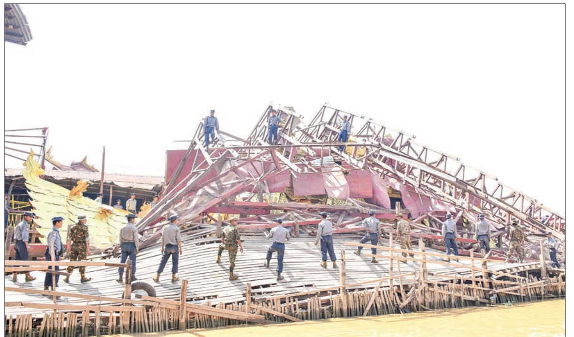
The Vice-Senior General views round the damaged structures.