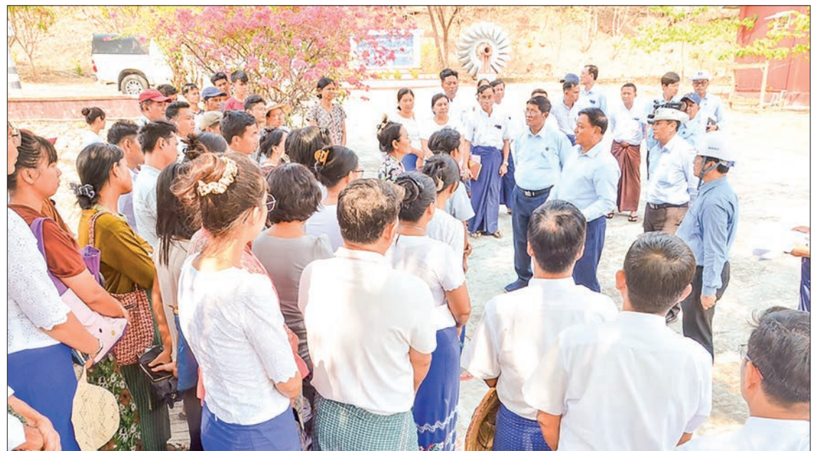
SAC Member Deputy Prime Minister Union Minister at the Prime Minister's Office Admiral Tin Aung San encourages staff families in Nay Pyi Taw yesterday.

ister for Energy U Ko Ko Lwin looked into loss and damage of the staff housing of the Ministry of Energy, rescue and relief measures, supply of water and running of a temporary clinic.