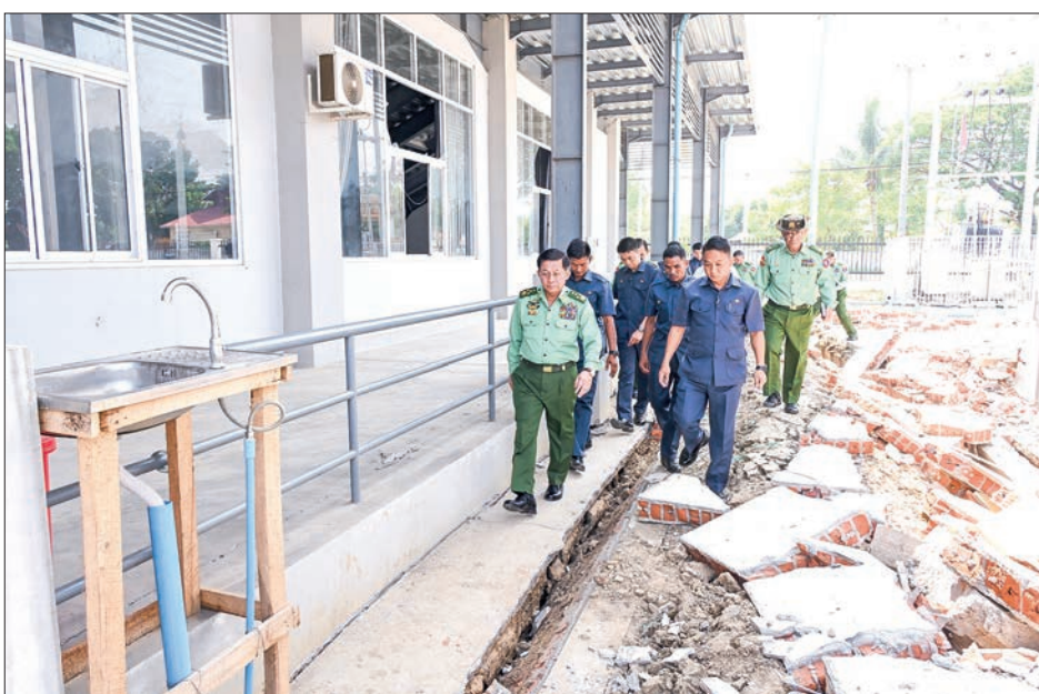
Inspection underway at the Nay Pyi Taw Stadium in Shwekyapin Ward.

the mobile operation theatre and medical officers from the Tatmadaw for medical treatment of the injured, accommodate medical teams from foreign countries, and provide medical treatment together with the foreign medical squads. — MNA/TTA