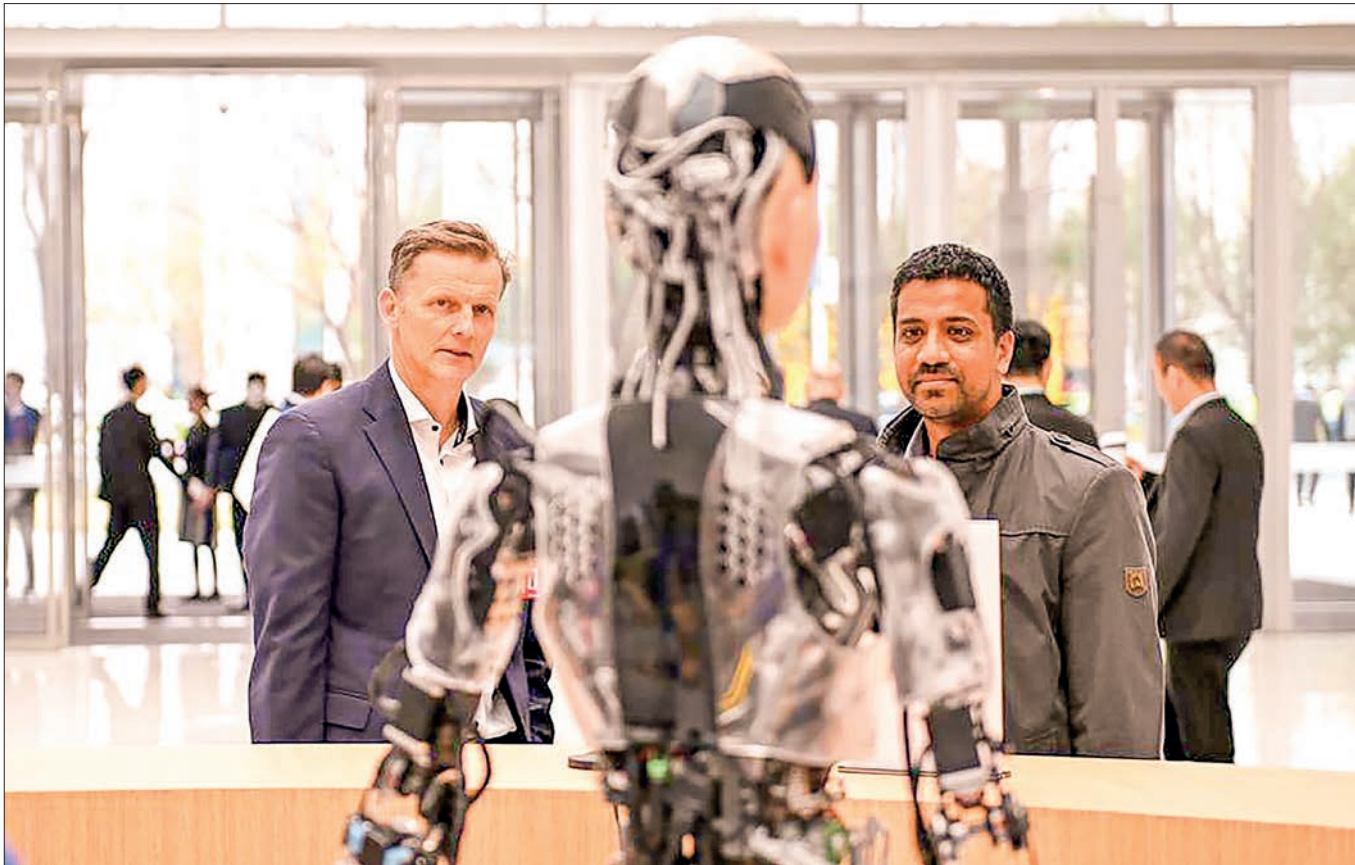
People learn about a bionic humanoid robot at the Zhongguancun International Innovation Centre during the 2025 Zhongguancun Forum Annual Conference in Beijing, capital of China, 27 March 2025.