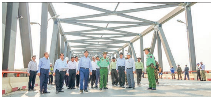
Union Minister U Myo Thant and officials views the damage to the Ayeyawady Bridge.

In response, the Union minister emphasized the importance of the Ayeyawady Bridge (Yadanabon) as a key link between Mandalay and Sagaing Regions, highlighting the need for uninterrupted road communication. He instructed that traffic speed should be reduced to prevent further