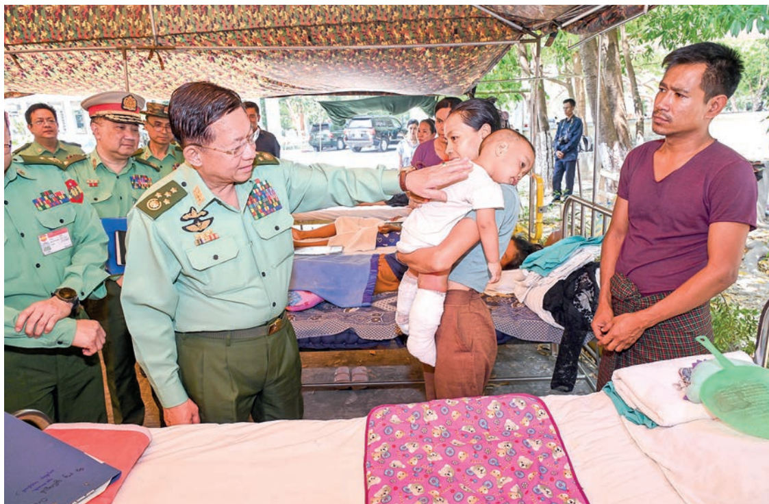
The Senior General shows compassion and support to earthquake victims in the Nay Pyi Taw Council Area.

The Defence Services General Hospital in Nay Pyi Taw provided necessary medical treatment to some 600 patients including civilians, State service personnel, Tatmadaw members and families who sustained injuries in the earthquake and managed emergency surgical operations on 30 persons. At present, the hospital admits 42 injured civilians, State service personnel, Tatmadaw members and families with necessary healthcare services. — MNA/TTA