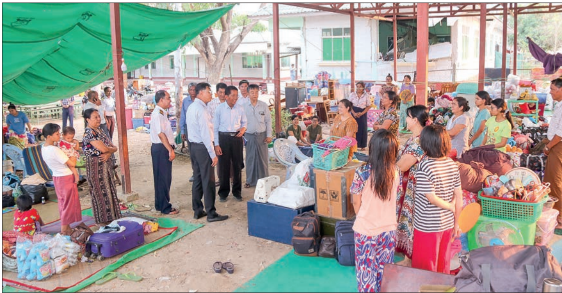
Deputy Prime Ministers General Mya Tun Oo and General Maung Maung Aye views and meets quake-hit staff families at the temporary camp.

Likewise, Deputy Prime Minister and Union Minister for Defence General Maung Maung Aye inspected the quake-affected staff housing of the Ministry of Defence yesterday and provided rice, cooking oil, eggs and other foodstuffs to staff for the second time and fulfilled their needs. — MNA/TTA