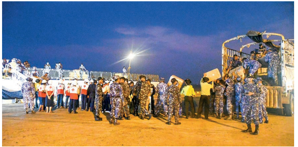
Relief items are unloaded from the Indian navy vessels to transport them to quake victims.

At the ceremony, Tatmadaw members from Tatmadaw (Navy), staff from Kyauktan Township General Administration Department and firefighters loaded the relief supplies on board the vehicles. These materials will be sent to the quake-hit areas under the supervision of the Yangon Region government.