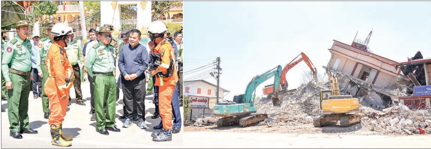
State Administration Council Vice-Chairman Deputy Prime Minister Vice-Senior General Soe Win inspects the use of machinery in rescue and relief operations in Aungban Township, Shan State (South).

DUE to the occurrence of a powerful earthquake on 28 March along with subsequent aftershocks, Sagaing, Mandalay, Magway and Bago regions, northeastern Shan State and Nay Pyi Taw Council Area have been affected. The earthquake caused damage to roads, bridges, and buildings, resulting in casualties and injuries among the people. Search and rescue operations are currently being carried out in the affected areas.