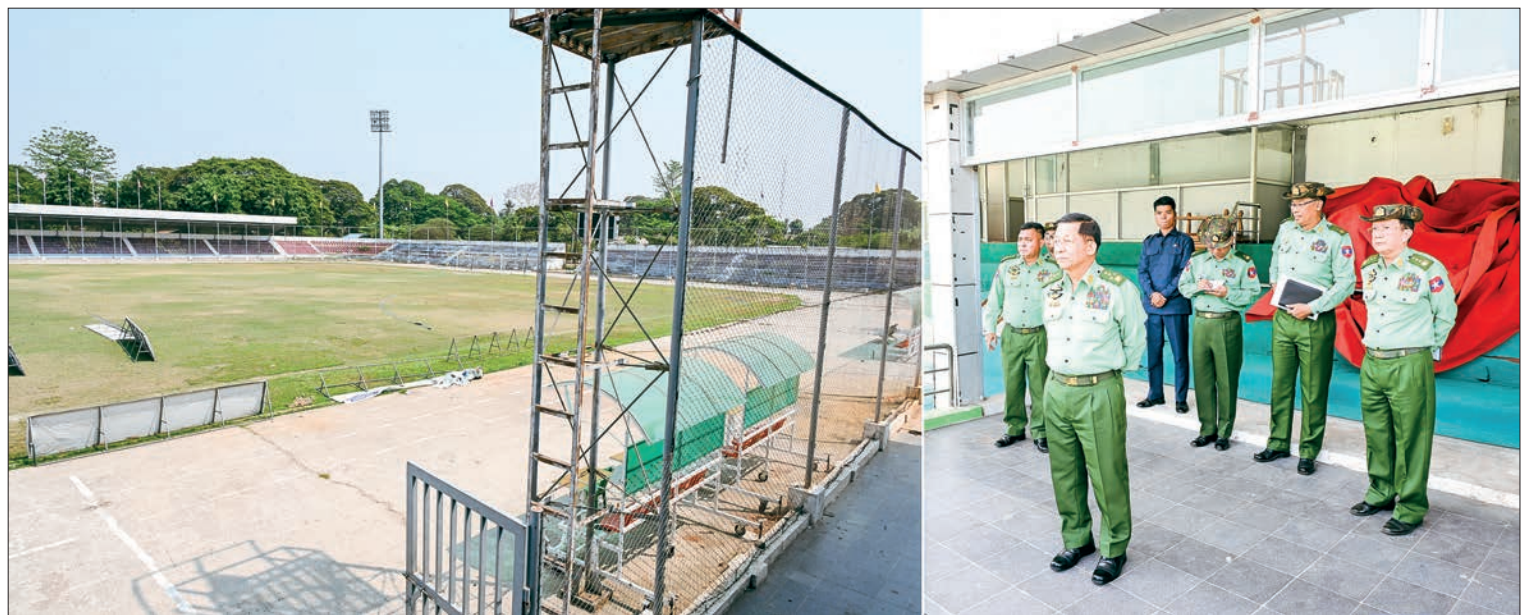
State Administration Council Chairman Prime Minister Senior General Min Aung Hlaing looks round the Paunglaung People's Sports Ground yesterday.

At the Paunglaung People's Sports Ground in Pynmana Township, the Senior General asked officials about accommodation for the people, supply of water and electricity and toilet facilities. In his guidance, he stressed the need to open a temporary hospital and relief camp in the sports ground to provide medical treatment for the injured people. Moreover, it is necessary to arrange mobile hospitals and mobile operation theatres. In addition to ensuring