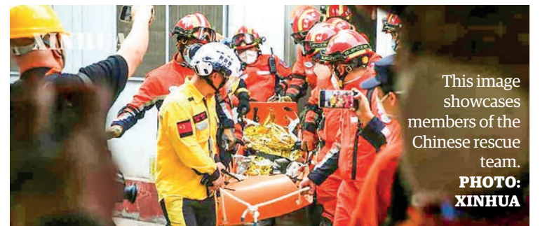
This image showcases members of the Chinese rescue team.

The Chinese rescue team has continued the rescue work in quake-affected areas. — Htun Htun/ZS