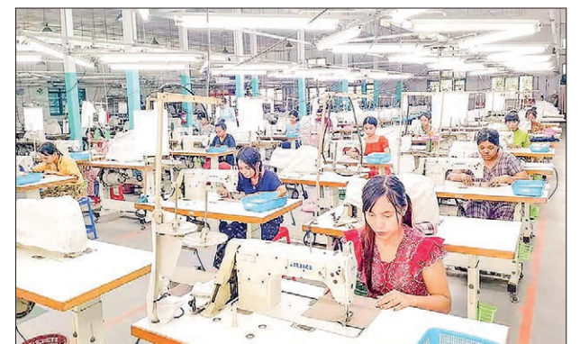
The photo shows sewing machine operators at a garment workplace.

Those who wish to attend the training can contact the MGHRDC through contact numbers 09 940858350, 09 450723262, 09 9403912570, 09 784085794, and 09 952802635. — NN/KK