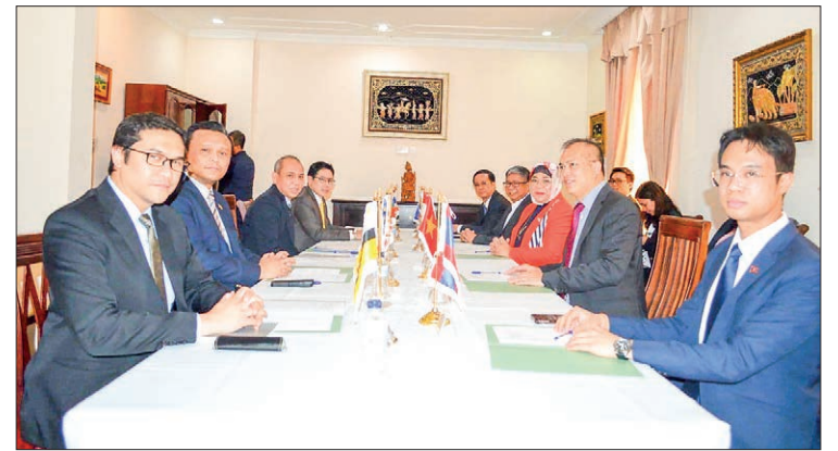
Attendees at the ASEAN Committee in Kuwait-ACK.

During the meeting, the ambassadors and heads of missions exchanged views on previous ACK activities, ongoing activities, and planned future activities. Following the meeting, the Myanmar Embassy hosted a luncheon featuring traditional cuisine for all attendees. — ASH/TMT