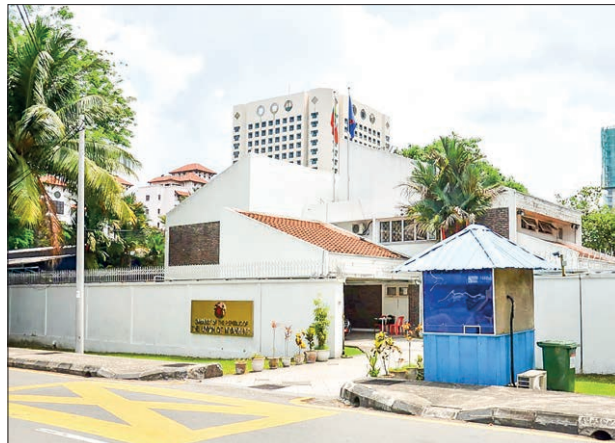
The image shows a general view of the Myanmar Embassy in Kuala Lumpur, Malaysia.

Monks, nuns, and laypersons in Malaysia who meet the criteria for these titles can apply by completing the specified application form and submitting the relevant documents. For inquiries, they can contact myanmarembassykl@gmail.com. — TWA/TH