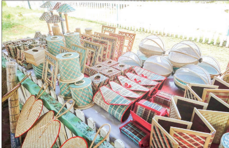
Photos show bamboo handicrafts made in Myanmar.

“These days, local restaurants, resorts and hotels use more bamboo materials. People seem to value handmade materials. In the past, many bamboo materials used to be moth-eaten or mouldy. With higher technologies, such incidents have been reduced. Bamboo used to be cut in its season before, mainly for drying. Later, it is better as a system has emerged where bamboo can be used in all seasons”, he said.