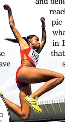
Ana Peleteiro of Spain competes during the Women's Triple Jump qualification round on the day two of the 14 th IAAF World Junior Championships in Barcelona 2012.

Peleteiro said she was lucky that her body doesn't "demand as much training as other people", and believes she will be able to reach 15 metres in the Olympic Games. "After seeing what I have been able to do in Rome, I am very clear that I will achieve it," she said. — Xinhua