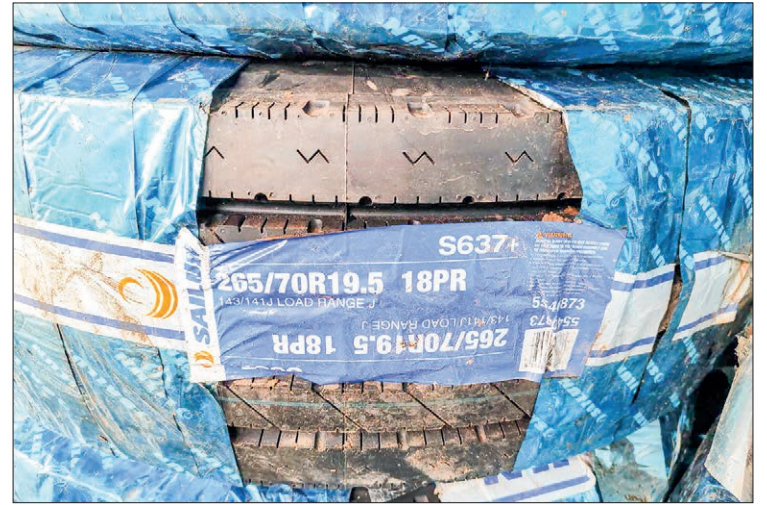
Confiscated car tyres in Yangon Region.

UNDER the supervision of the Illegal Trade Eradication Steering Committee, legal action is being taken nationwide against illicit trading.