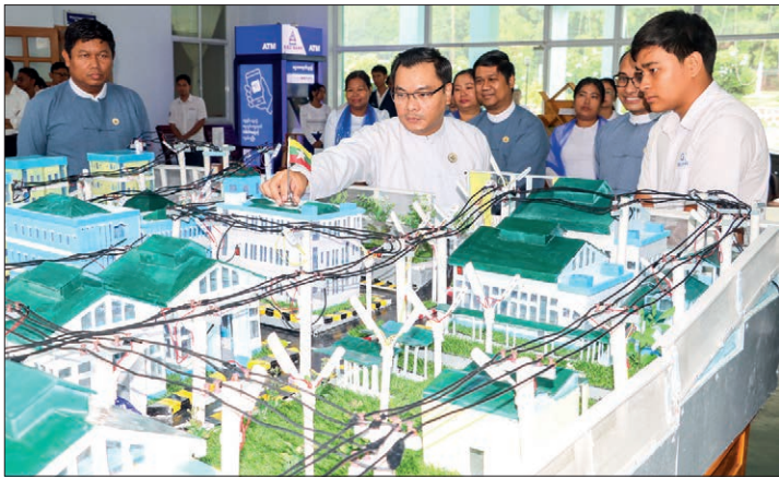
Deputy Minister Dr Aung Zeya observes a small model of the institute's electricity distribution system of engineering students from GTI, Nay Pyi Taw, recently.

Finally, the Deputy Minister inspected practical activities in workshops, functions of the school library, and the installation of a solar system for aesthetic enhancement at the school's main hall.