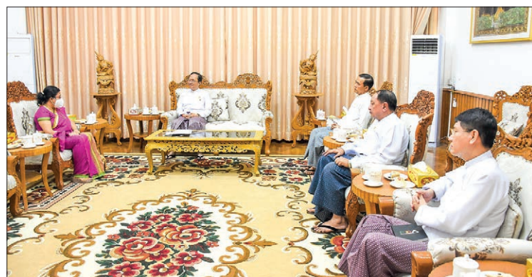
Union Minister Dr Thet Khaing Win discusses bilateral health cooperation with Sri Lankan Ambassador Mrs Ponnampere Arachige Prabashini Ponnampere in Nay Pyi Taw yesterday.

motion of bilateral cooperation in the health sector; collaboration between public and private pharmaceutical industries, traditional medicine producers and the exchange of experiences between traditional medical practitioners. — MNA/TKO