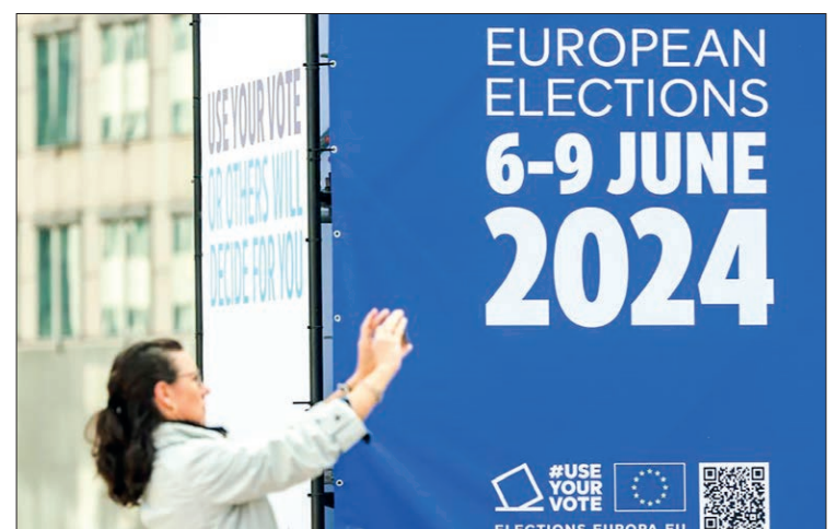
A woman takes photos outside the European Parliament in Brussels, Belgium, 6 June 2024. The European Parliament elections kicked off on Thursday.

"The European Parliament doesn't actually do anything. I mean, it doesn't actually do the minimum that you expect from a parliament, which is legislate. So it doesn't really do that. But, of course, foreign policy is not at all within the bailiwick of the European Parliament," explained George Szamuely on Sputnik's Fault Lines. — SPUTNIK