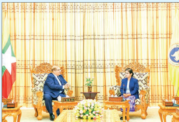
The Central Bank of Myanmar Governor Daw Than Than Swe meets Pakistani Ambassador Mr Imran Haider at the CBM office in Nay Pyi Taw yesterday.

THE Central Bank of Myanmar Governor Daw Than Than Swe received a delegation led by Pakistani Ambassador to Myanmar Mr Imran Haider at the conference hall of the Central Bank of Myanmar office in Nay Pyi Taw yesterday.