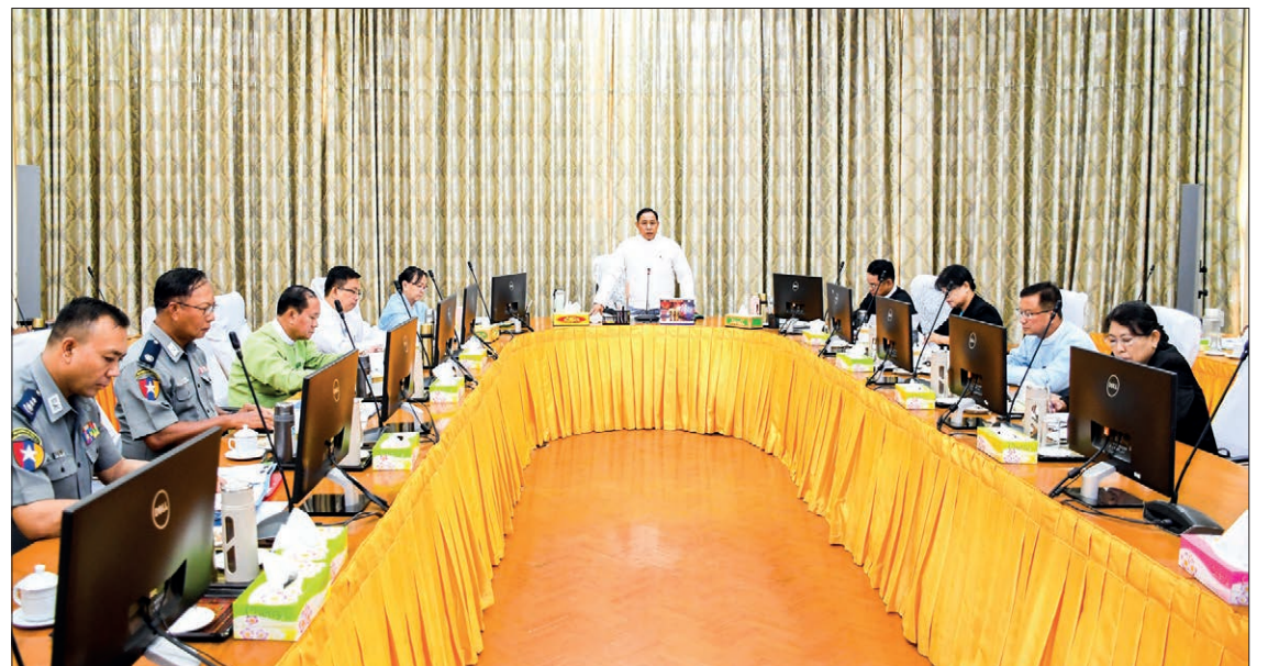
Union Minister Lt-Gen Yar Pyae chairs the first meeting of the Central Committee on Custody of Exhibits and Nay Pyi Taw, Region and State Committees on Custody of Exhibits yesterday.

He then urged the committee to follow the directive for custody of exhibits 4/2020 to prevent