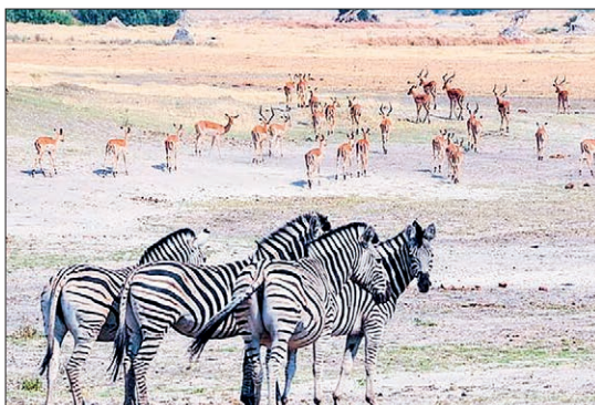
Maun, situated in Botswana, stands as one of the nation's premier tourist destinations, renowned for its spectacular natural beauty and abundant wildlife.

Ethiopian Airlines Group has introduced a new flight route to Maun, a prominent tourist spot in Botswana.