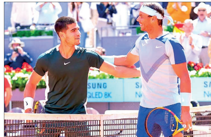
Carlos Alcaraz and Rafael Nadal will be lining up next to each other at the Paris Olympics.

In addition to the singles tournament, Alcaraz, 21, and