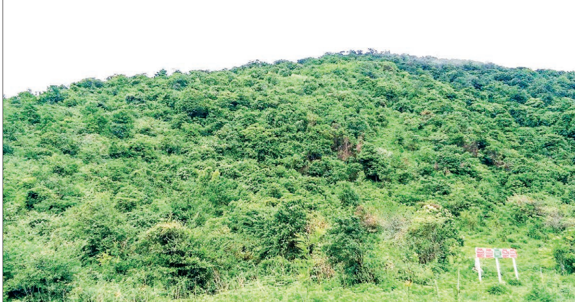
The landscape of Yone Taung protected public forest.

products, hunting, landslides, and natural disasters, to protect the natural water outlets and reduce the impacts on the natural environment.