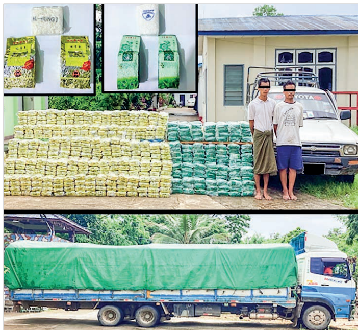
Offenders seen alongside confiscated drugs and vehicles.

Legal action has been initiated against the offenders, and an ongoing investigation is underway to apprehend other individuals involved in the case. — MNA/MKKS