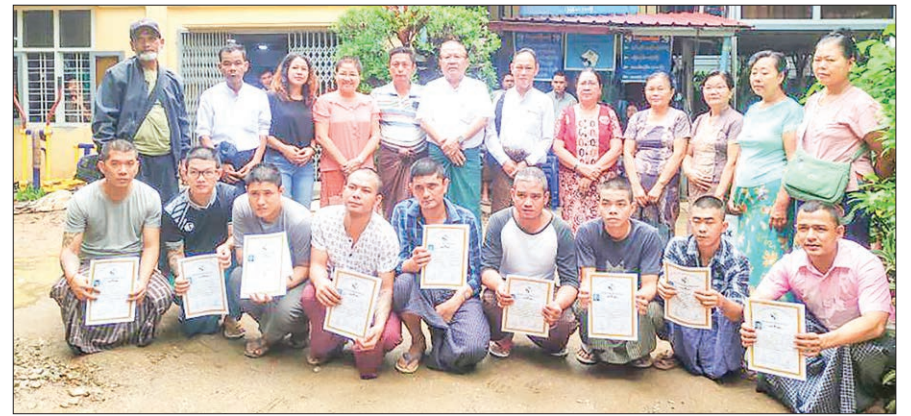
The fifth ceremony of handing over drug rehab trainees to their parents.

ACCORDING to the Drug Rehabilitation Centre, follow-up psychological and physical care has been provided to 65 recovering people with a substance use disorder in the first six months of this year. On 8 June, a ceremony for handing over individuals in recovery to their parents was held at the combined hall of the Drug Rehabilitation Centre in