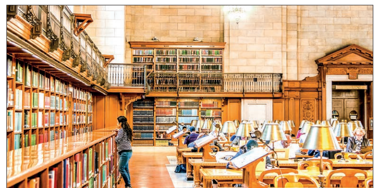
People read their computers in the New York Public Library in July 2021 in Manhattan.

outlets — politically motivated websites that present themselves as independent local news outlets — have been identified, the US-based research group NewsGuard said in a report. — AFP