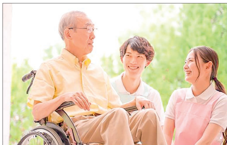
Article on those who aim to study in Japan on Kaigo scholarship, published in J Compass Magazine.

In 2023, follow-up psychological and physical treatment was provided to 64 recovering people with a substance use disorder.