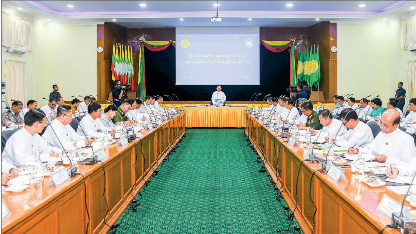
State Administration Council Vice-Chairman Deputy Prime Minister Vice-Senior General Soe Win chairs the meeting of the Leading Committee on Organizing the Myanmar Education Conference 2024 yesterday.