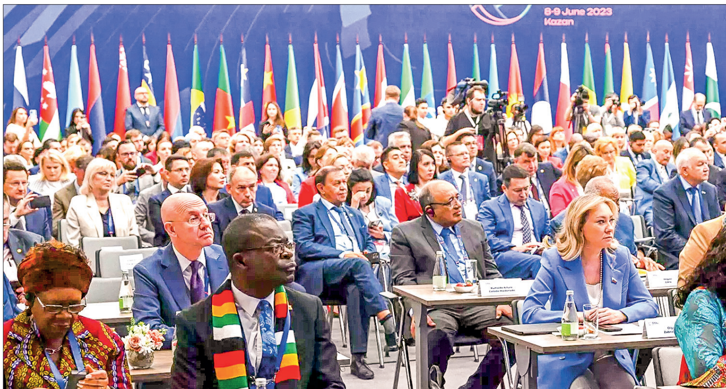
The declaration is open for other interested countries to join within the coming months, indicating a potentially broader impact in the future. PHOTO: SPUTNIK

Kravtsov noted that the areas of further cooperation might include progress in science education, teaching the Russian language, and organizing pupil and student exchanges. — SPUTNIK