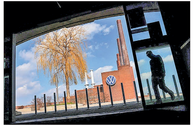
The power plant at the headquarters of German carmaker Volkswagen (VW) in Wolfsburg, Germany.

The result was driven by rising prices, said Destatis. In 2023, Germany's average inflation rate stood at 5.9 per cent, down from 6.9 per cent in the previous year. Since the beginning of 2024, inflation has once more fallen below three per cent. While large enterprises with at least 1,000 employees only accounted for 1.4 per cent of manufacturing and mining companies in Germany last year, their combined revenue made up more than 40 per cent