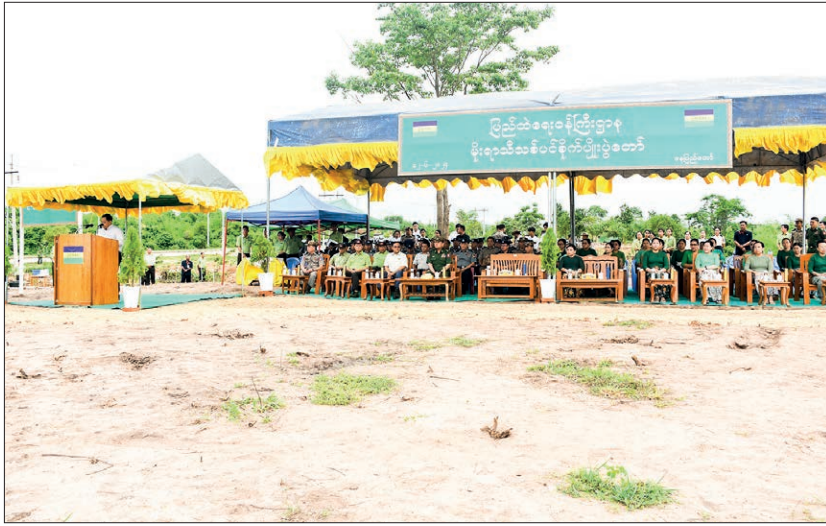
Ministry of Home Affairs' monsoon tree-planting ceremony in progress in Nay Pyi Taw yesterday.

THE Ministry of Home Affairs organized a 2024 monsoon tree-planting ceremony in Nay Pyi Taw yesterday. Union Minister for Home Affairs Lt-Gen Yar Pyae, also a member of the State Administration Council, along with senior officers, their spouses, and departmental staff under the Ministry of Home Affairs, attended the ceremony. During the event, the Union Minister delivered remarks highlighting the benefits of tree planting. After the plants had been grown, the Union minister and party inspected the tree-growing activities in the designated areas. The ministry grew 1,000 saplings, including ironwood, Spanish cherry, Burmese Padauk ( Pterocarpus macrocarpus ), Royal poinciana, cassia fistula and Eugenia during the event. Similarly, the ministry's affiliated departments across the nation also planted trees on the same day, and so the ministry grew a total of 32,639 trees. — MNA/KTZH