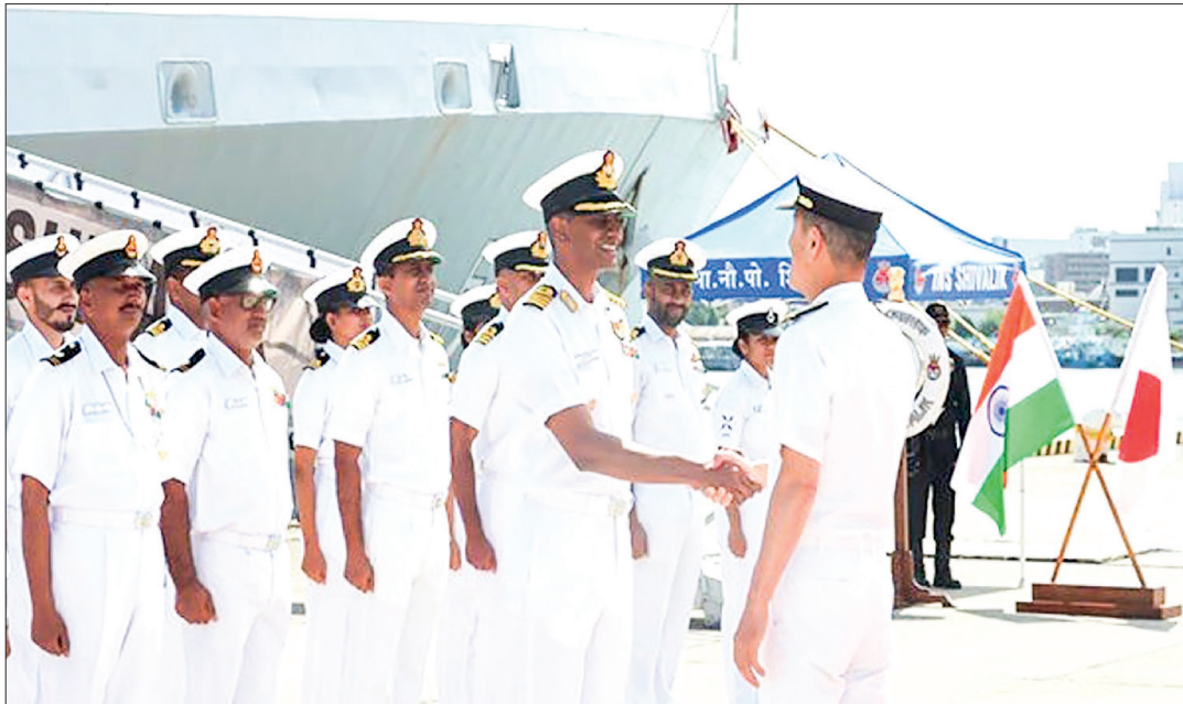
JIMEX 24 underscores the commitment of both navies to maritime security in the Indo-Pacific, promoting mutual cooperation and learning from each other's best practices.

INDIAN Navy's indigenous stealth frigate, INS Shivalik, arrived at Yokosuka, Japan, on Tuesday to participate in the eighth edition of the Japan-India Maritime Exercise 2024 (JIMEX 24).