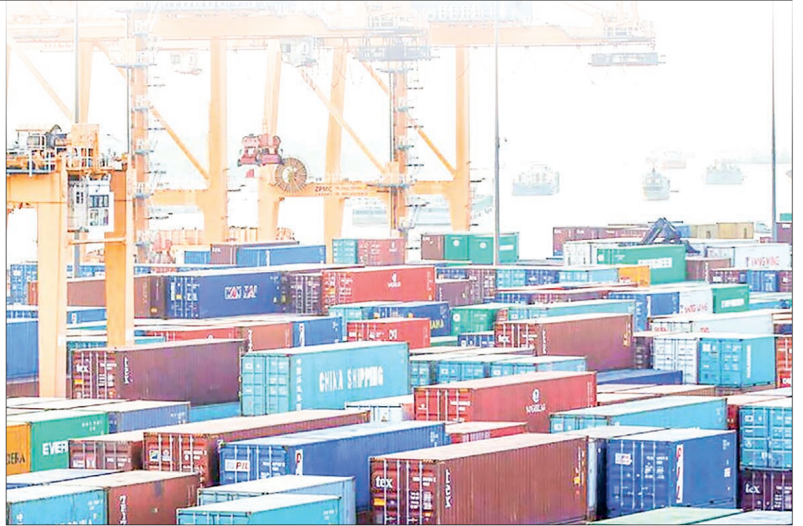
Loading and unloading containers are seen at Yangon Port along the Yangon River.

Without obtaining a permit, no one shall be allowed to export and import the specified goods that need to seek a licence. The Trade Department warned the exporters and importers of penalties for non-compliance with the Export and Import Law, directives and guidelines starting from 1 July 2024. It informed