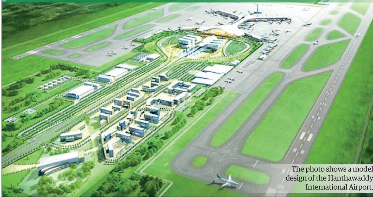
The photo shows a model design of the Hanthawaddy International Airport.

UPGRADING works for seven domestic airports will commence this financial year 2024-2025 beginning 1 April, according to the Ministry of Transport and Communication.