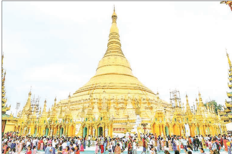
The image shows a general view of the Shwedagon Pagoda on the Kason Full Moon Day.