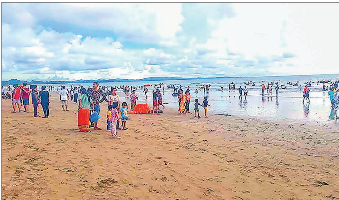
Beachgoers are pictured on the beach of Ngwetaung.

It has made sure of security to help tourists relax safely and peacefully at the beach, along with bicycle rental service, motorboat rental service and horse rental service, as well as a market stall which sells local food products, accessories and souvenirs has been provided. — ASH/ZS