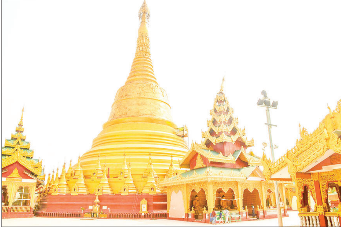
The Shwehsandaw Pagoda in Toungoo and the 445 th Buddha Pujaniya festival.