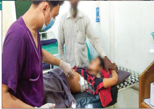
Wounded resident receiving medical treatment at military hospital in Buthidaung.

REPORTS indicate that AA terrorists on 11 May launched heavy weapon attacks on the people's hospital in Buthidaung, Rakhine State, where internally displaced people sought shelter. The assault resulted in the deaths of three residents and left ten others wounded, including a one-and-a-half-year-old and a ten-year-old.