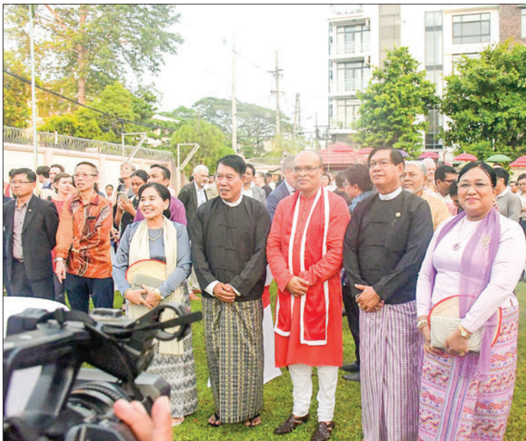
Bangladesh Embassy celebrates Bangladesh New Year Day event on 10 May at the Embassy of Bangladesh in Yangon, Myanmar.

THE Bangladesh New Year Day celebration took place on the evening of 10 May at the Embassy of Bangladesh in Yangon, Myanmar.