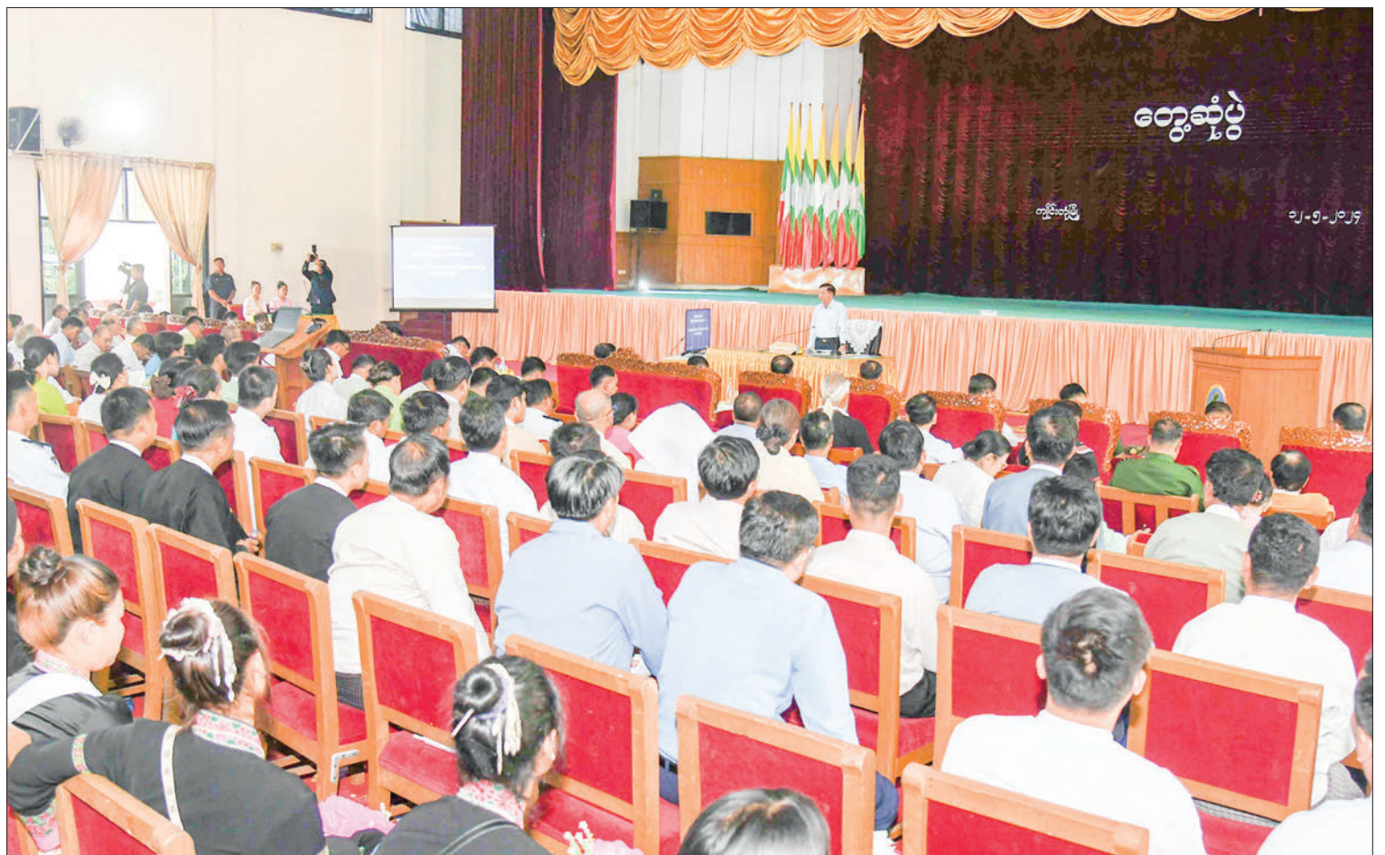
Chairman of the State Administration Council Prime Minister Senior General Min Aung Hlaing meets departmental officials at different levels and town elders at the City Hall in Kengtung of Shan State (East) yesterday.

He continued that as Kengtung region is endowed with beautiful natural environments