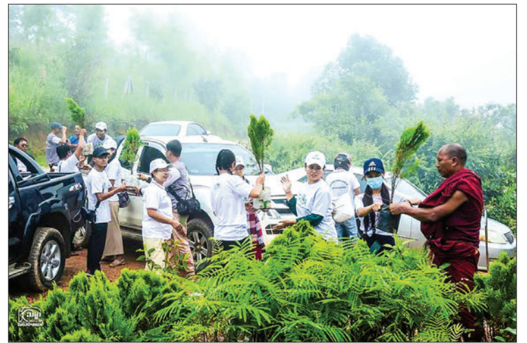
Green Challenge Association grew trees in 2023.

It is necessary to get food product codes for product expansion. Awareness campaigns for the Food Product Notification system will be conducted, and afterwards, mandatory labelling orders for on-the-go food will be exercised. — TWA/KK