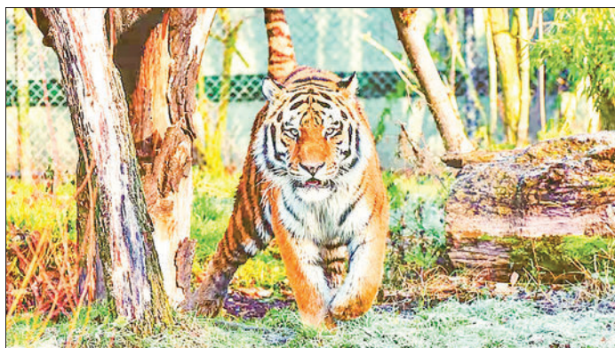
India celebrated 50 years of Project Tiger and 30 years of Project Elephant, demonstrating its commitment to species conservation.

India also highlighted the creation of the International Big Cat Alliance, another important step aimed at protecting and conserving the seven big cat species around the world through collaborative international efforts. — ANI