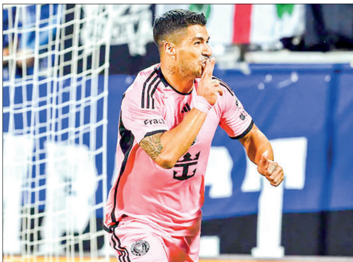
Luis Suarez in action.