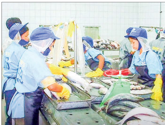
Aquatic products that will be exported abroad are sterilized and packaged in cold storage.