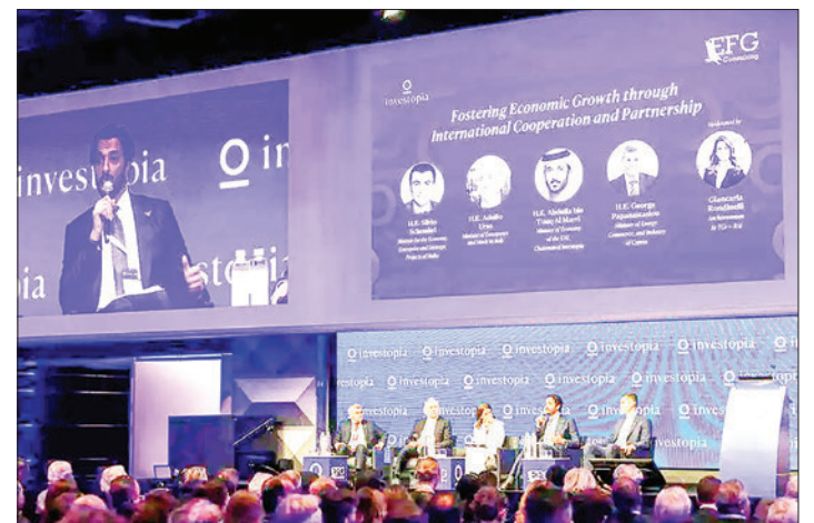
Investopia, a global ecosystem initiated by the UAE Government, launched the second edition of Investopia Europe at Palazzo Mezzanotte, the historic headquarters of the Italian Stock Exchange in Milan.

This event also aimed to explore the latest global trends in expanding business operations into new markets to attract investments and modern financing trends in European markets, with a focus on new and sustainable economic sectors.