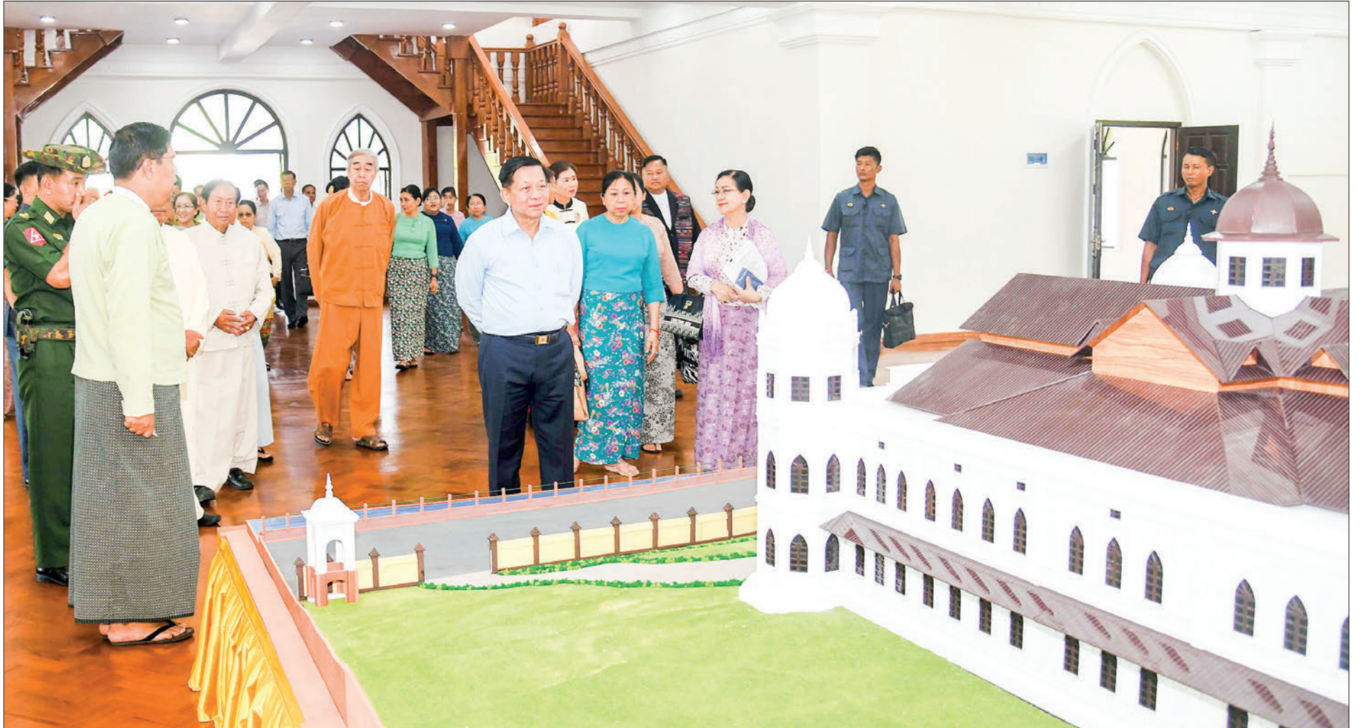
Chairman of the State Administration Council Prime Minister Senior General Min Aung Hlaing views round Haw Palace of Kengtung Saopha Sao Kawng Kiao Intaleng in Kengtung, Shan State (East) yesterday.