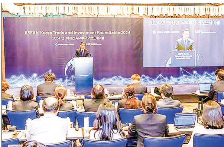
ASEAN-Korea Trade and Investment Roundtable 2024 in session.

Similarly, the Myanmar-Russia Tourism Promotion Familiarization Trip (FAM-Trip) was organized in October 2023, featuring 14 tour destinations in Myanmar. — ASH/TMT