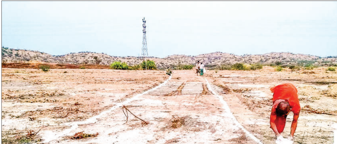
Land preparation at the Aung Mingala field in Chauk, where 5,000 trees will be planted.