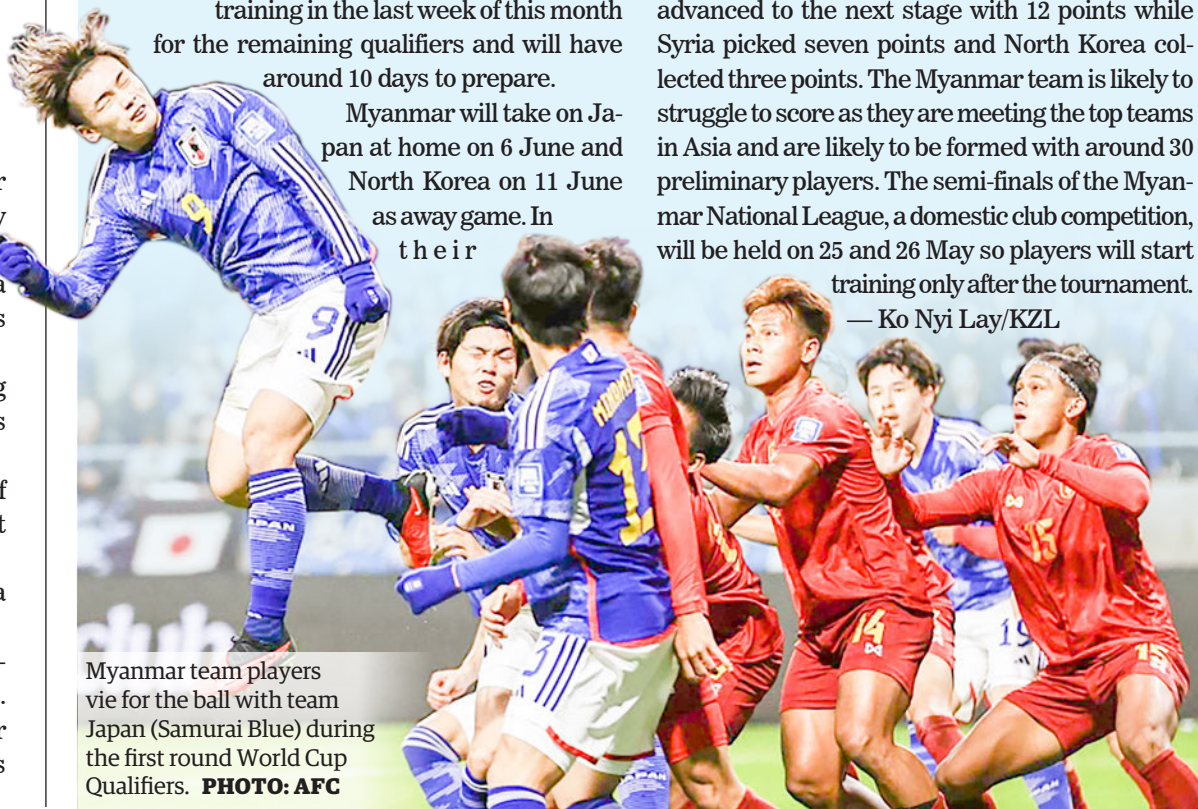
Myanmar team players vie for the ball with team Japan (Samurai Blue) during the first round World Cup Qualifiers.