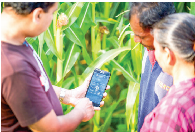
FAO's work involves scientific approaches, innovation, and the latest technologies.

"We have no option but to leverage innovation, technological advancements and tools to