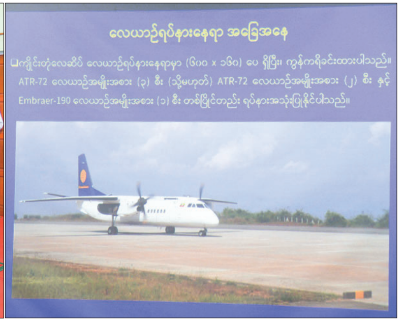
Chairman of the State Administration Council Prime Minister Senior General Min Aung Hlaing hears the report on progress of the Kengtung airport construction yesterday.