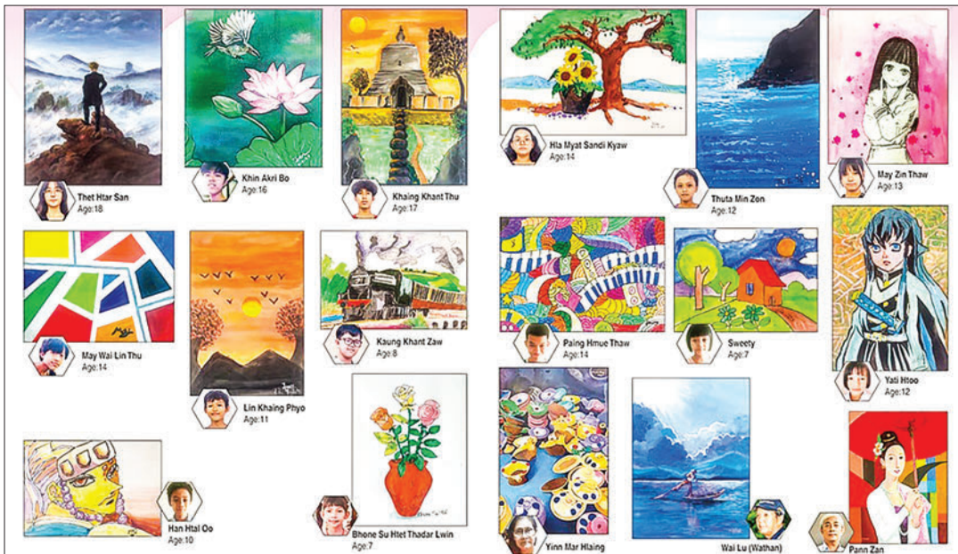
Some paintings which will be displayed at the gallery seen in the catalogue.

“We will show the paintings of the twenty children who attended the drawing class in March and the three coach artists. At the exhibition, the audience will also have to enjoy the painting of our six-year-old youngest artist”. — ASH/TRKM