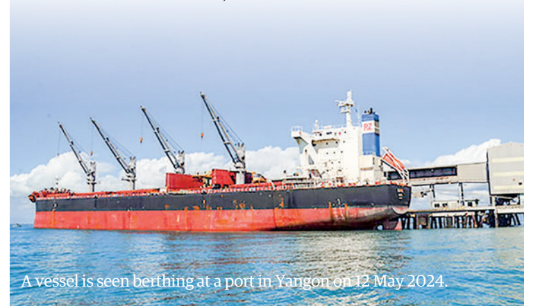
A vessel is seen berthing at a port in Yangon on 12 May 2024.

tonnes of rice from Sule Port Wharves (SPW), 53,500 tonnes of maize from Myanmar Industrial Port (MIP), 58,400 tonnes and 12,500 tonnes of rice from Ahlon International Port Terminal (AIPT), 29,500 tonnes of maize from The Myanmar Terminal-TMT, 5,400 tonnes of maize from Min Htet Min Port (MHM), 11,000 tonnes from Yangon International Gateway Terminal (YIGT), and 2,700 tonnes of maize from Myanmar Five Star Line (MFSL). These exports are set to continue.— MNA/TRKM