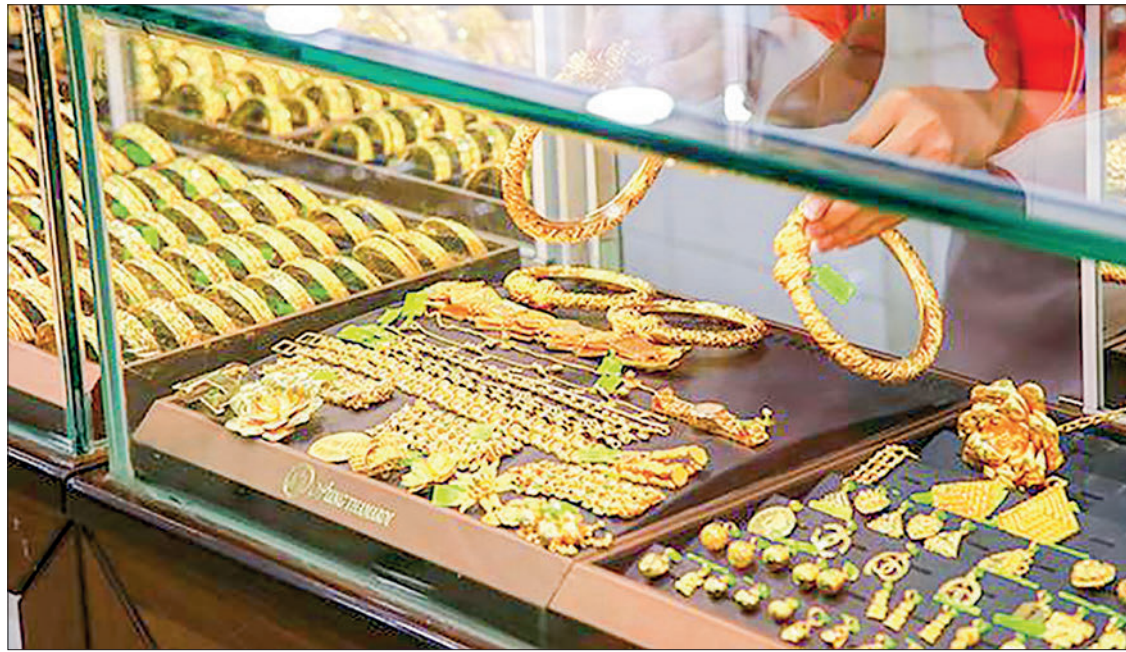
Jewellery and gold ornaments sold in the gold market.

The Gold and Currency Market Monitoring and Regulatory Working Committee, under the leadership of the Central Bank of Myanmar, has formed special joint forces and conducted on-site investigations at gold shops in Yangon Region