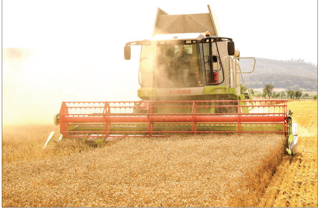
Israel's Minister of Agriculture, Avi Dichter, signed a memorandum of understanding with Romanian officials in Bucharest to bolster Israeli food security by securing emergency wheat supplies.