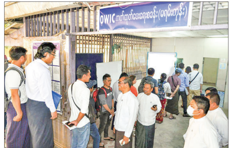
OWIC card issuing station (Mayangon).

If there are any discrepancies in country-wise lists without applying for OWIC by the agency or if there are any inconsistencies in the data, the