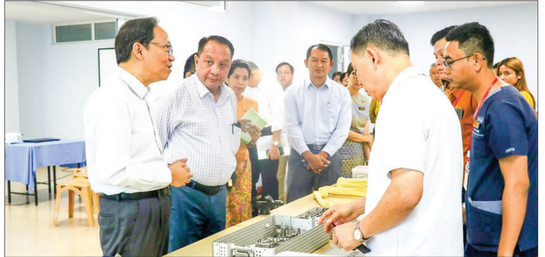
Union Minister for Health Dr Thet Khaing Win views round medical institutions in Yangon yesterday.

UNION Minister for Health Dr Thet Khaing Win inspected the Medical Skills, Simulation, and Research Centre of University of Medicine (1) in Yangon yesterday morning.