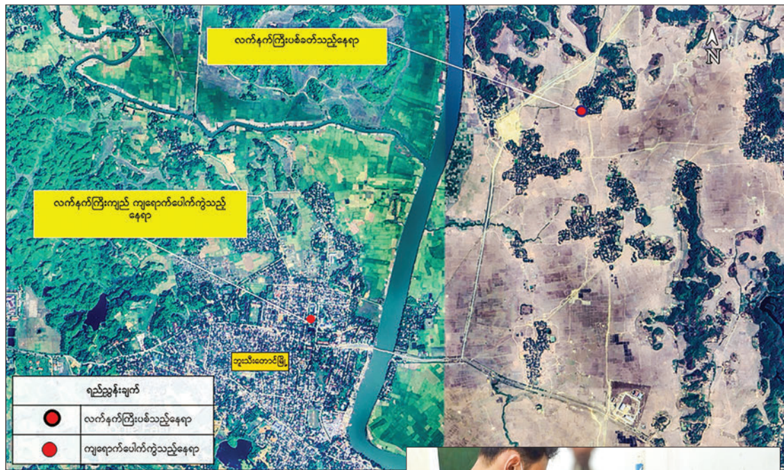
The map shows incident of AA terrorist attack at Buthidaung People's Hospital on 11 May.