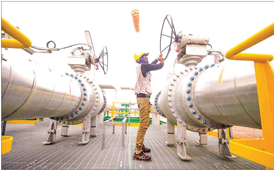
Untapped potential: An employee turns a valve at the Hammar Mushrif station inside the Zubair oil and gas field, north of Basra.

Iraq currently holds 145 billion barrels of proven oil reserves, among the largest globally, with 96 years' worth of production at the current rate.