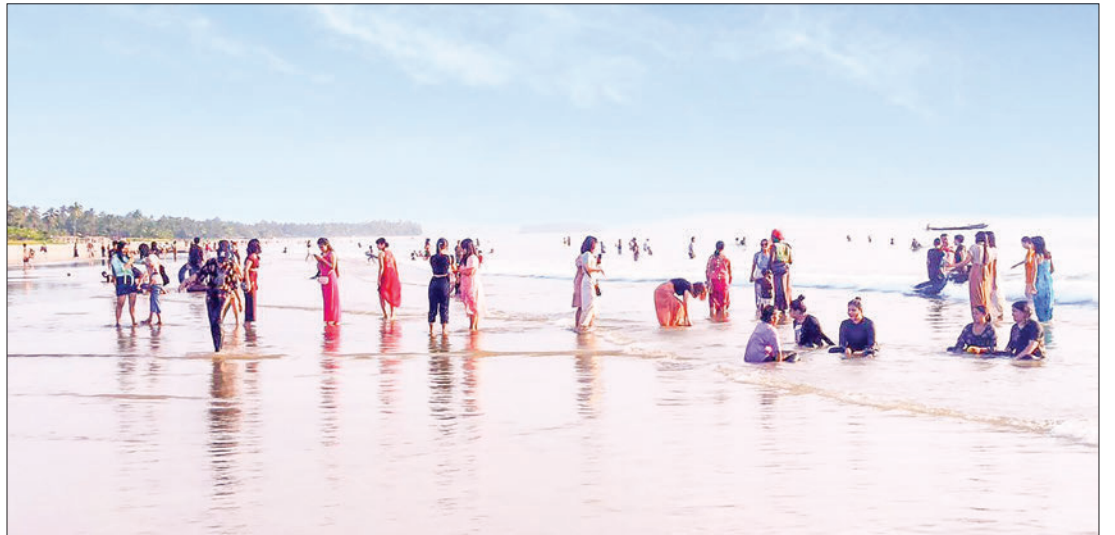
The photo shows Ngwehsaung Beach with travellers.

The ASEAN-Korea Centre has convened the ASEAN-Korea Trade and Investment Roundtable jointly with the Korea Institute for International Economic Policy four times, including this year. — ASH/NT