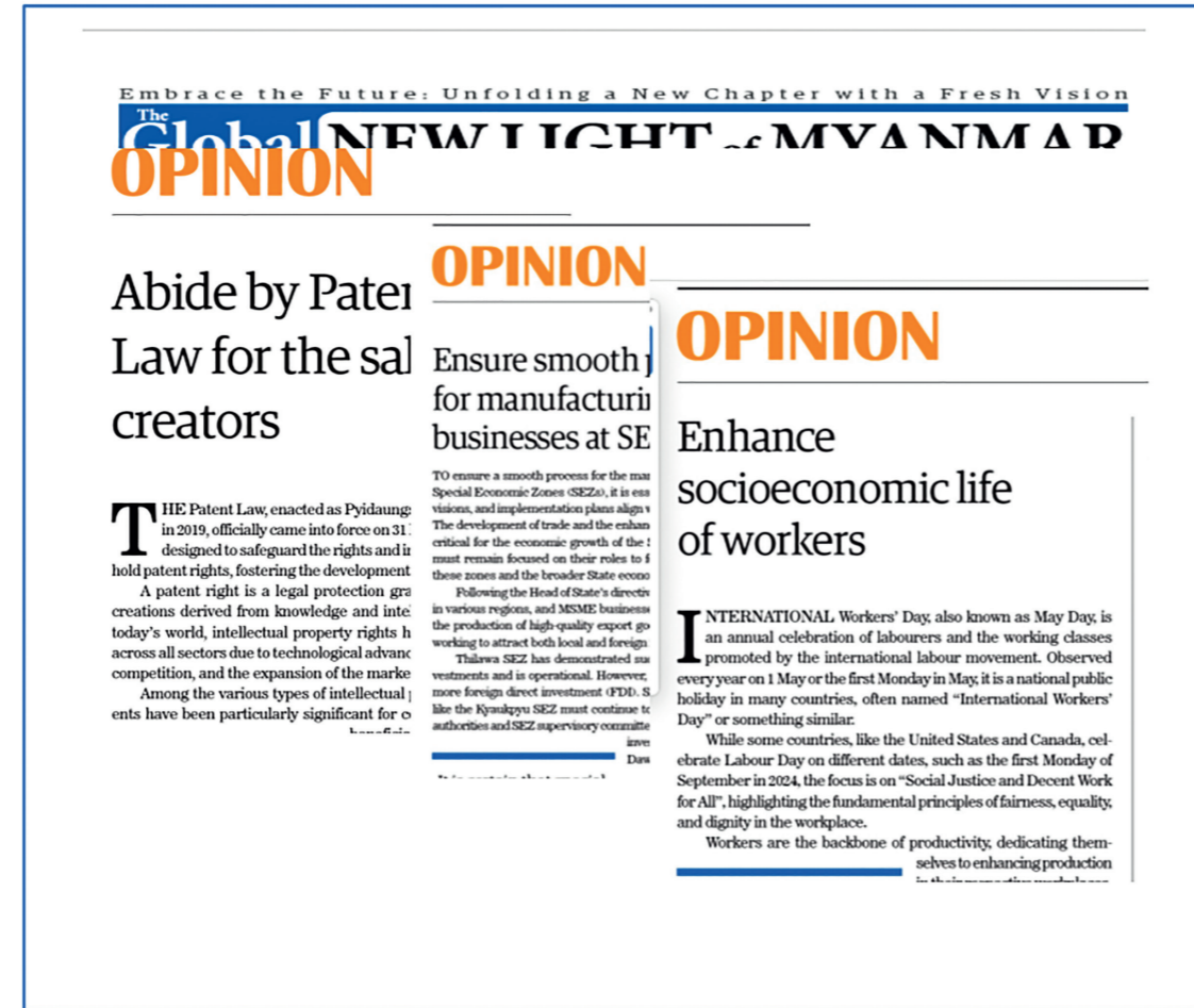
Editorials from The Global New Light of Myanmar.

During my early studies, I consistently ranked first in English in monthly examinations. Living in a rural area meant access to English books was limited to school textbooks. After completing sixth Grade, I delved into my sister's seventh-grade English textbook to prepare for the upcoming school term. I meticulously studied its comprehension passages and completed all exercises diligently throughout the entire summer break, along with revising my previous English composition exercises.