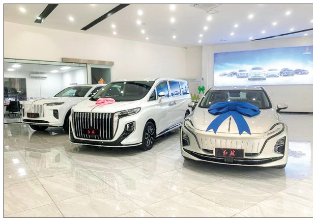
Chinese-made Hongqi electric vehicles are displayed at a showroom in Phnom Penh, Cambodia on 11 September 2023.

have gained momentum in Cambodia, as more and more people are interested in using them," the news release said. "Using EVs saves on fuel costs, with low or zero emissions."