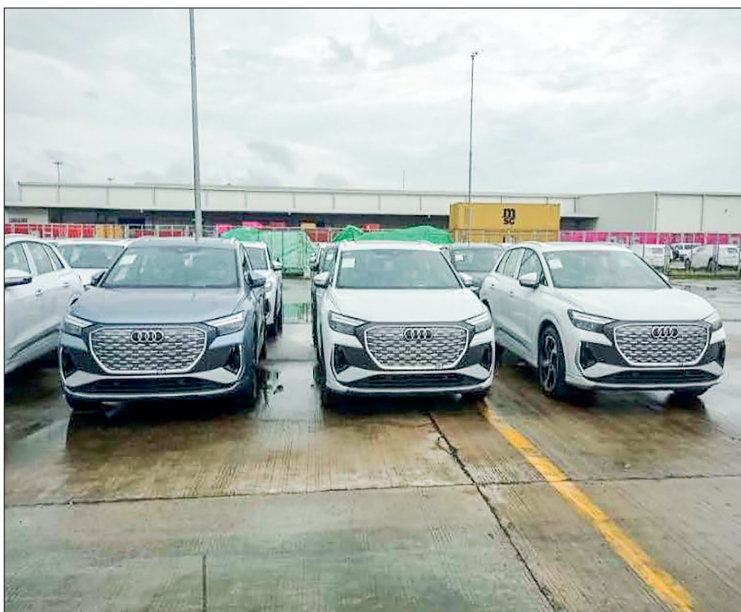
The newly arrival of battery electric cars seen at Yangon Port.

WITH the approval of the Steering Committee on National-level Development for Electric Vehicles and Related Industries, KIA EV-6 imported by Super Seven Stars Motors Industry Co Ltd whereas Faw Audi and Q4 E Tron-40 by Win Motor Myanmar Co Ltd, Dongfeng Nissan by Asia Pacific Automaker