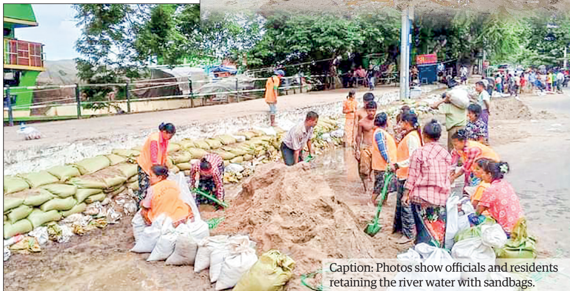
Caption: Photos show officials and residents retaining the river water with sandbags.

According to the weather forecast by the Department of Meteorology and Hydrology on 11 July, the Chindwin River will rise about 1-1.5 feet above existing levels in Mingin, Kani and Monywa townships and fall about 12-14 feet below existing levels in Kalewa, Maw-