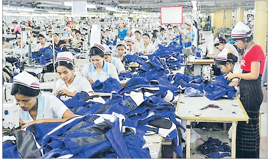
Workers sew garments at the manufacturing facility.