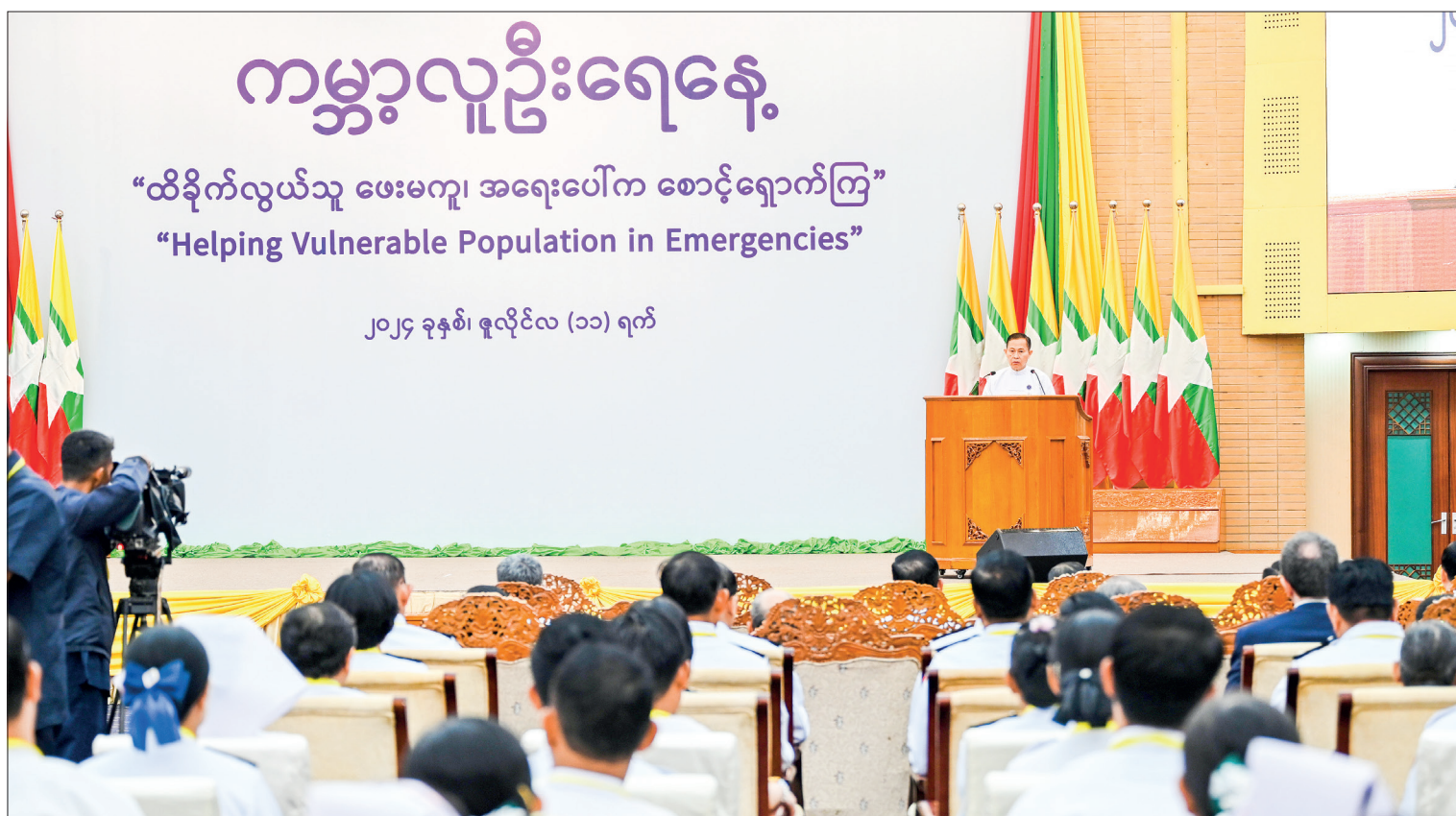
State Administration Council Vice-Chairman Deputy Prime Minister Vice-Senior General Soe Win addresses the 2024 World Population Day ceremony yesterday.

He continued that the majority of developing countries are experiencing a lesser number of children, a shortage of labour and an increasing number of older persons due to a remarkable decline in birth rates. At the same time, some developing countries and least developed countries are also facing high birth rates, lower standards of education, a larger