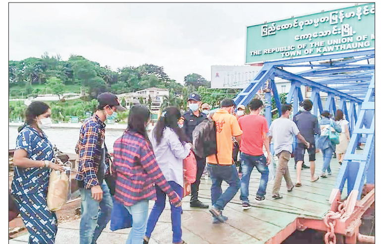
Myanmar migrant workers are seen at the Kawthoung jetty.

In addition, these listings play an important role and thus the agencies should follow them with respect, it said. According to reports published by Safe Migration on 9 June, there are 565 licensed overseas employment agencies in Myanmar. — MT/ZN