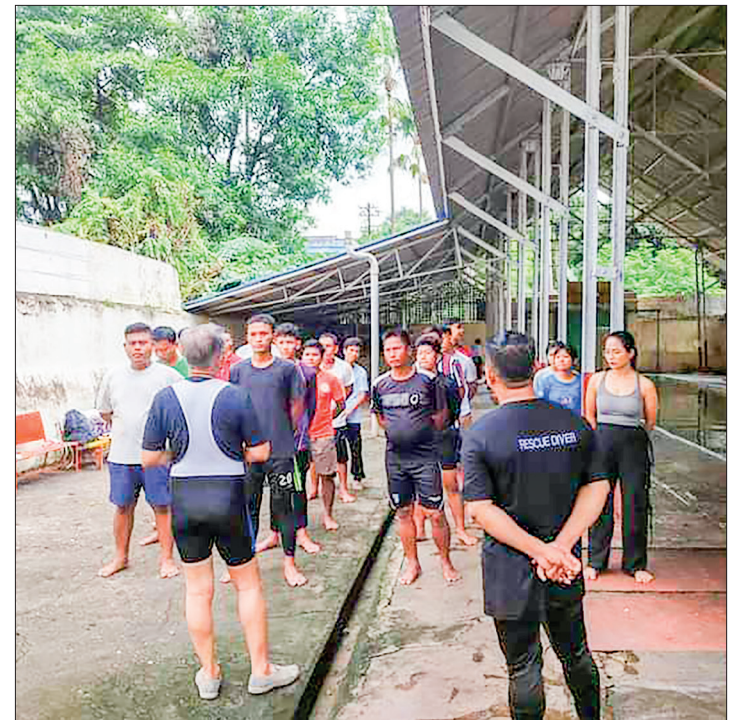
Training for flood disaster relief in action.

them. We train them what to do in the water and what to avoid. The most important thing is that the rescuers do not become second victims. That is why we are practising together,” she said. — Thit Taw/ZN