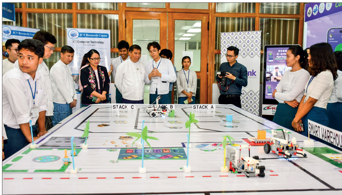
A glimpse of the scenes from the opening event of the Digital Talent & Career Fair/Scholarship Programme (India).

The event features booths of 10 job-seeking companies, interviews and scholarship programmes for the Professional Diploma in Java Programming Course (India).