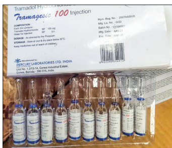
Confiscated illegal items.

On 10 July, a combined team under the Yangon Region Illegal Trade Eradication Special Task Force inspected and seized an unregistered Nissan Wingroad vehicle worth approximately K3.5 million near Yan-