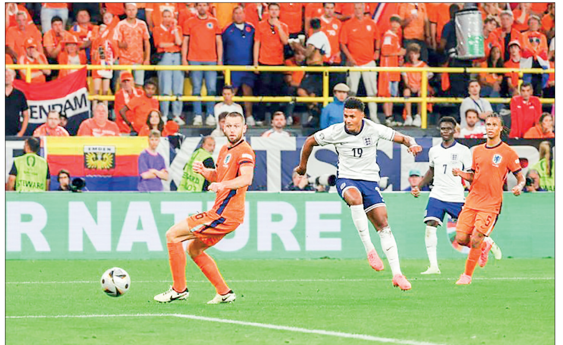
Please England do not leave the goals till the last minute jokes delighted King Charles III.

"If I may encourage you to secure victory before the need for any last minute wonder-goals or another penalties drama,