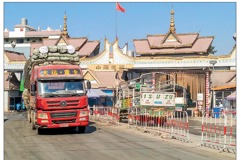
Trucks are seen at the Myanmar-China border.

Myanmar exports agricultural products, animal products, minerals, forest products, and finished industrial goods, while it imports capital goods, intermediate goods, raw materials imported by the CMP enterprises and consumer goods. — TWA/KK