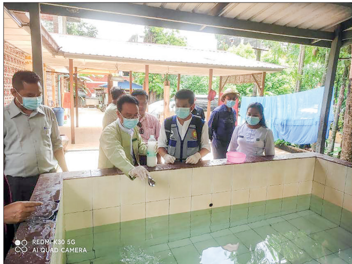
The prevention of severe diarrhoea underway in the markets of Tamway Township on 10 July.

The Ministry of Health stated that there have been 115 patients with diarrhoea as of 10 July.