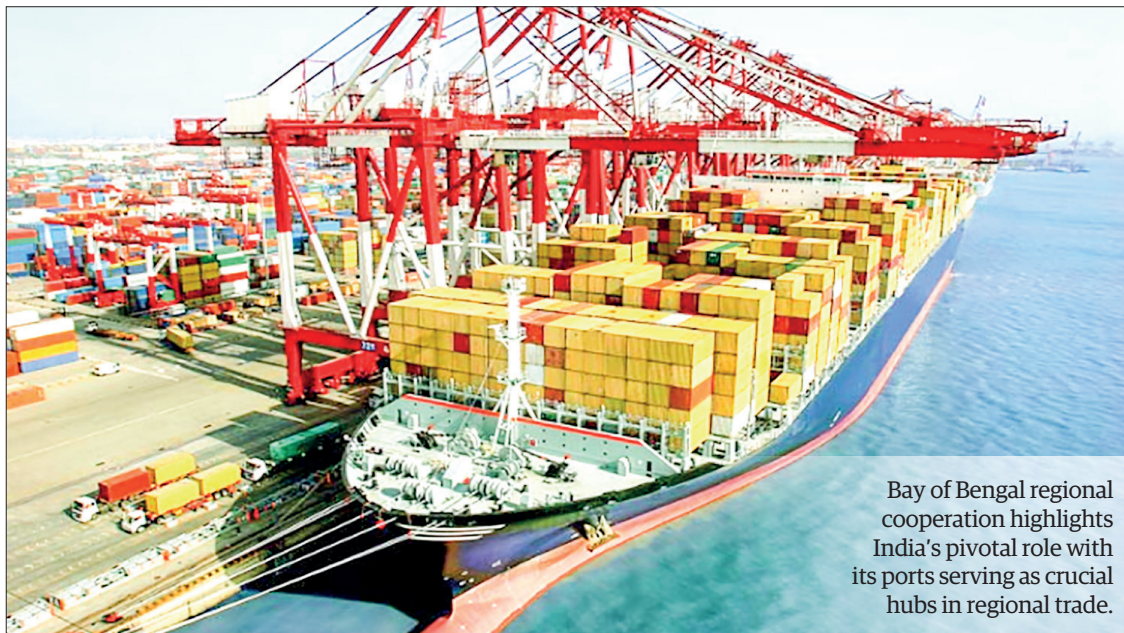
Bay of Bengal regional cooperation highlights India's pivotal role with its ports serving as crucial hubs in regional trade.

This event will gather Foreign Ministers from BIMSTEC nations to discuss and enhance cooperation across various sectors such as security, connectivity, trade, investment, and people-to-people contacts in the Bay of Bengal region and its littoral.