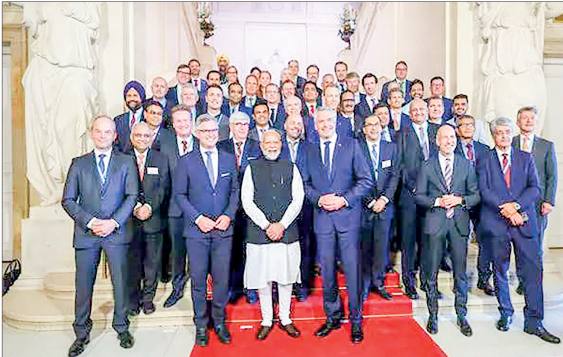
Prime Minister Narendra Modi invited Austrian companies to invest in India across sectors such as infrastructure, renewable energy, green technologies, fintech, and innovation.

DURING his official visit to the European nation, Prime Minister Narendra Modi has invited Austrian companies to invest in India, to strengthen the economic ties between the