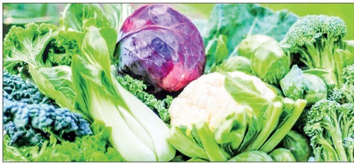
The figures rose from $843.6 million recorded in the corresponding period last FY, showing a sharp increase of $549.426 million.

cultural produce, animal products, minerals, forest products, and finished industrial goods through maritime and border trade channels. At the same time, it imports capital goods, intermediate goods, raw materials imported by the CMP enterprises and consumer goods.