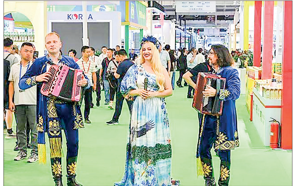
A Belarusian band performs before the Belarus booth during the 30 th China Lanzhou Investment and Trade Fair in Lanzhou, northwest China's Gansu Province, 6 July 2024.