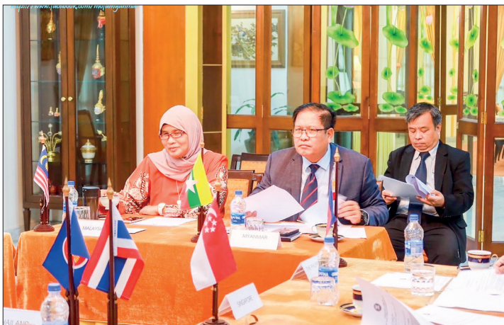
Myanmar Ambassador to Bangladesh U Kyaw Soe Moe taking part in the 59 th ADC meeting.

ACCORDING to the Ministry of Foreign Affairs, Myanmar Ambassador to Bangladesh U Kyaw Soe Moe participated in