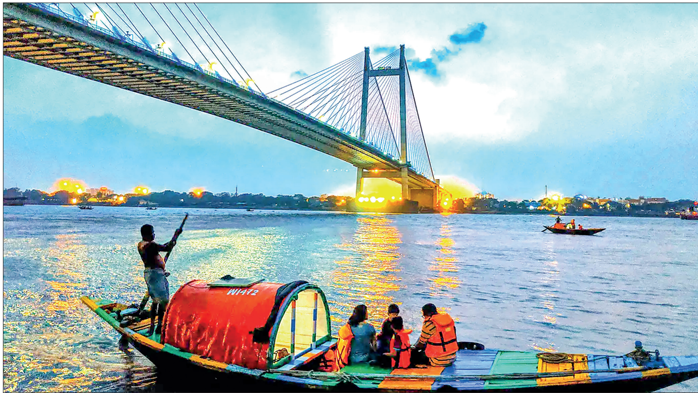
BIMSTEC focuses on regional grouping, sectoral cooperation, and people-to-people exchange. Howrah bridge and the tourists passing below. An iconic landmark in Kolkata, the Howrah Bridge is a huge steel bridge over the Hooghly River. It is considered to be one of the longest cantilever bridges in the world.

Jaishankar emphasized the need to swiftly enhance regional cooperation, acknowledging the importance of open and candid exchange of ideas among member nations.