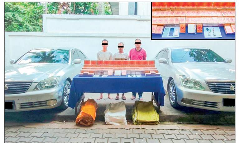
Three offenders seen alongside confiscated hero and vehicles.

A total of 300 blocks of heroin weighing 105 kilogrammes worth over K1.5 billion was impounded in Tachilek, Shan State (East), as stated by the Myanmar Police Force.