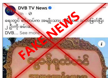
The screenshot validates misinformation.