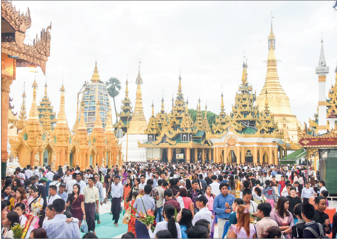
This picture depicts the Shwedagon Pagoda being thronged with pilgrims.