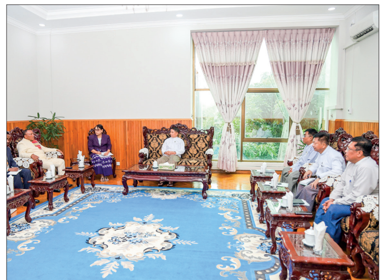
The Ethiopian ambassador calls on Union Minister U Min Naung yesterday.