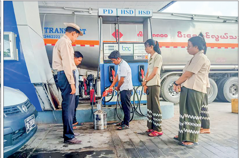
Photos (L & R) show surprise inspections in progress at Yangon's petrol stations.

in Nay Pyi Taw, Yangon, and Mandalay Regions, as well as