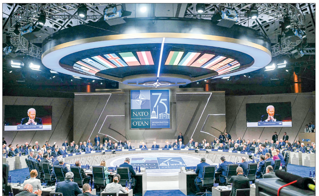
NATO heads of state meet during the NATO 75th anniversary summit at the Walter E Washington Convention Centre in Washington DC, on 10 July 2024.

CHINA deplors and strongly opposes the Washington summit declaration of the North Atlantic Treaty Organization (NATO), which hypes up tensions in the Asia-Pacific region and is full of bellicose remarks with a Cold War mentality, a Chinese foreign ministry