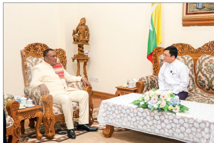
Union Minister U Myint Kyaing receives the Ethiopian ambassador yesterday.

U Myint Kyaing, Union Minister for Immigration and Population, met Mr Daba Debele Hunde, Ambassador of the Federal Democratic Republic of Ethiopia to Myanmar, in Nay Pyi Taw yesterday.