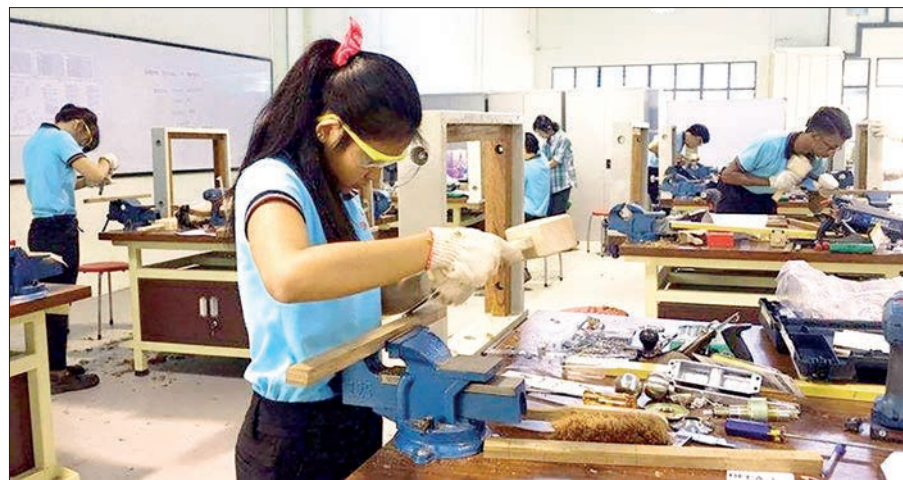
Trainees diligently practise their skills in the training session.

THE No 3 Industrial Training Centre (ITC) Thagara, located in Yedashe Township, Bago Region, will offer one-year industrial skills training (batch 16) from 18 May 2026 to 2 April 2027. Trainees are limited to 10 per Machinery Course, 15 per CAD/CAM Course, 15 per Electrician Course, 10 per Electronic Course and 10 per Foundry Course. Those interested who have taken the matriculation exam under the