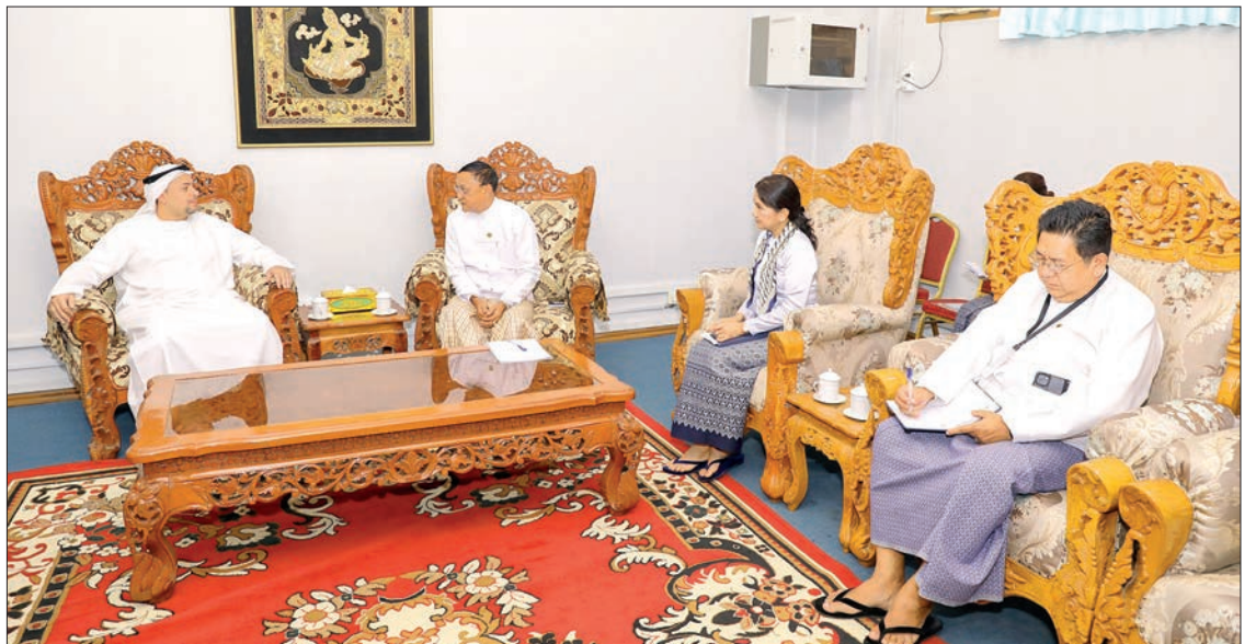
The ambassador of the United Arab Emirates (UAE) calls on Deputy Foreign Affairs Minister U Ko Ko Kyaw.

They cordially exchanged views on matters pertaining to the strengthening of the existing bilateral relations between Myanmar and the UAE, and mutually beneficial cooperation in various areas, including trade and investment. — MNA