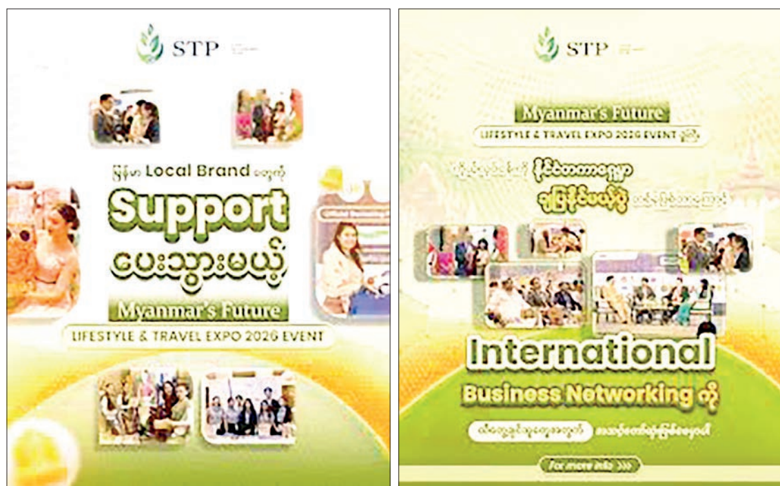
Images illustrate invite posters for the lifestyle and travel expo 2026.

MYANMAR'S Future Lifestyle & Travel Expo 2026 Event will take place at Inya Ballroom & Foyer (First Floor) of Melia Hotel Yangon, on 3-6 April, according to the STP event management team. The expo will bring about tourism branding, destination