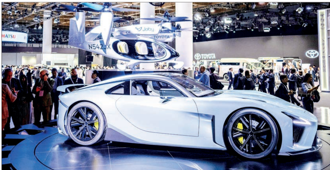
Members of media gather at the booths of Toyota and its luxury vehicle division Lexus during the press day of the Japan Mobility Show in Tokyo on 29 October 2025.

TOYOTA Motor Corp said Monday its global output sank 3.9 per cent in February from a year earlier to 749,673 vehicles, declining for the fourth consecutive month, weighed down by slowing production in China and Japan.