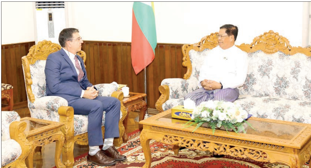
Union Minister U Than Swe receives Mr Barnaby Jones, Representative of the United Nations High Commissioner for Refugees (UNHCR) to Myanmar, yesterday.

REPRESENTATIVE of the United Nations High Commissioner for Refugees (UNHCR) to Myanmar Mr Barnaby Jones paid a courtesy call and presented his Credentials to Union Minister for