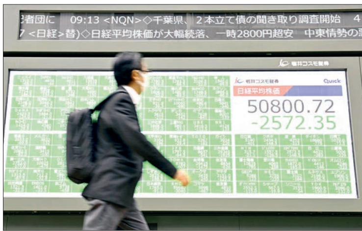
A display panel shows the Nikkei Stock Average falling below 51,000 in Tokyo on the morning of 30 March 2026.

Shares of oil companies such as TotalEnergies and BP