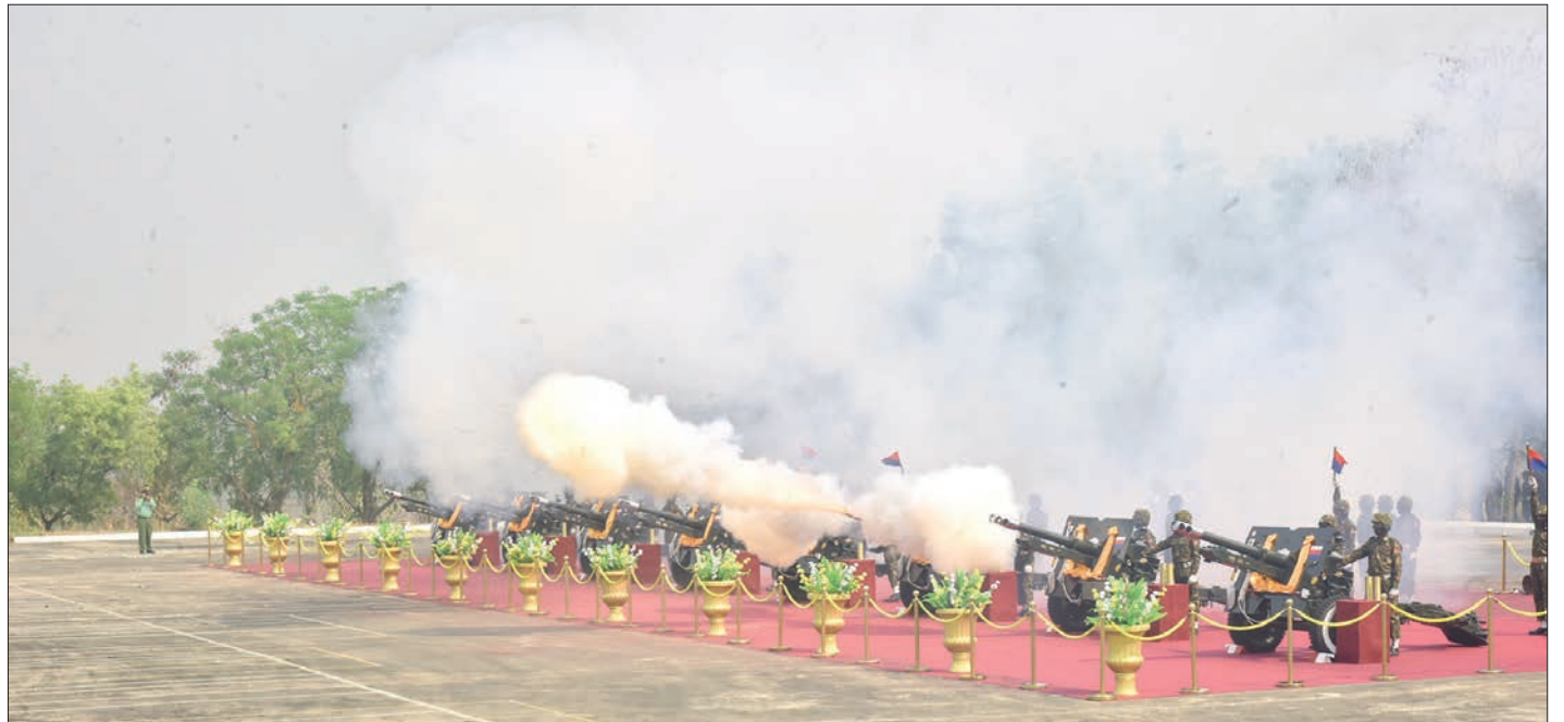
A 19-gun salute is underway to mark the handover of the Defence Services Commander-in-Chief.

Therefore, the current duties of the Commander-in-Chief of Defence Services have today been formally handed over to General Ye Win Oo. The Senior General stated that he will continue to contribute to the best of his ability for the benefit of the nation, the people, and Tatmadaw, as well as for the national interest of the State. He also expressed special gratitude to all Tatmadaw leaders, colleagues, and associates he has