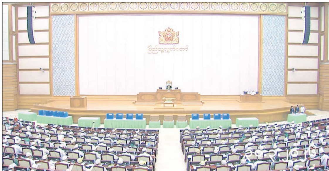
The first-day meeting of the group of elected Pyithu Hluttaw representatives forming the presidential electoral college convenes.