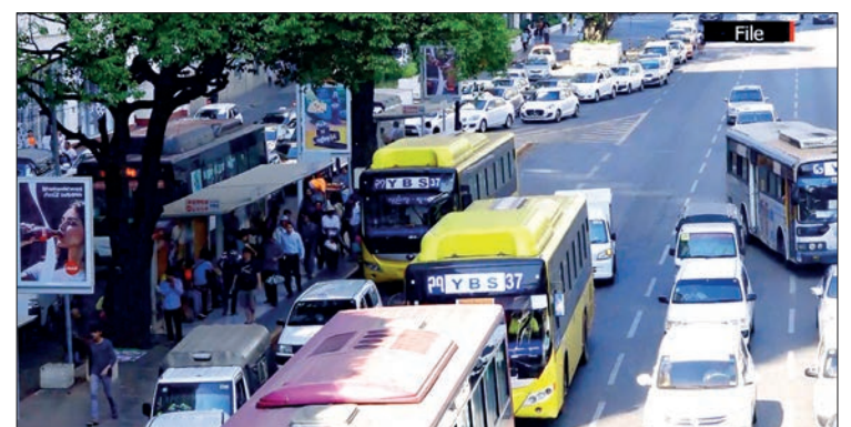
This photo captures YBS buses operating in Yangon.

During the 2025 Thingyan festival, more than 1,000 buses from over 60 YBS routes operated across Yangon. — ASH/MKKS