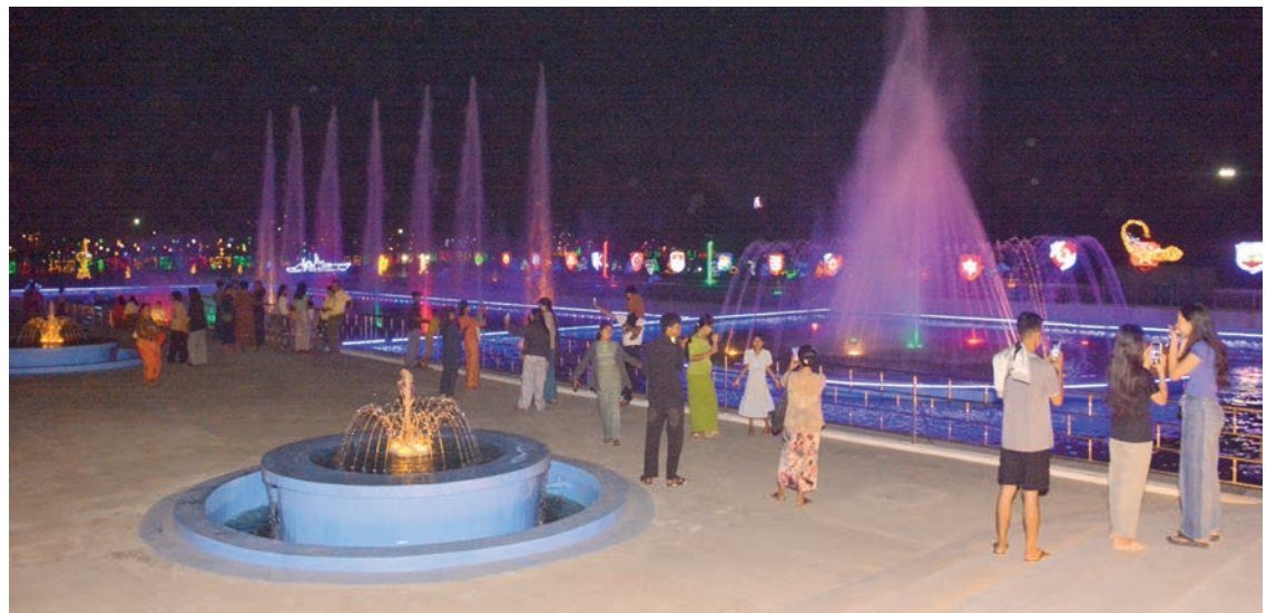
Visitors enjoy their time at the Tatmadaw Park, illuminated with colourful decorative lights in hour of the 81 st Anniversary of Armed Forces Day.

At the entrance to the Tatmadaw parade ground and along both sides of the road, truss beams, light boxes, lighting poles, LED strip lights, rain lights, uplights, programmed LED displays, and banners have been installed. In addition, the national flag and the Tatmadaw flags, lighting effects, and trees facing the dais of taking salute have been adorned with handmade lights. The two stars representing the Tatmadaw flag