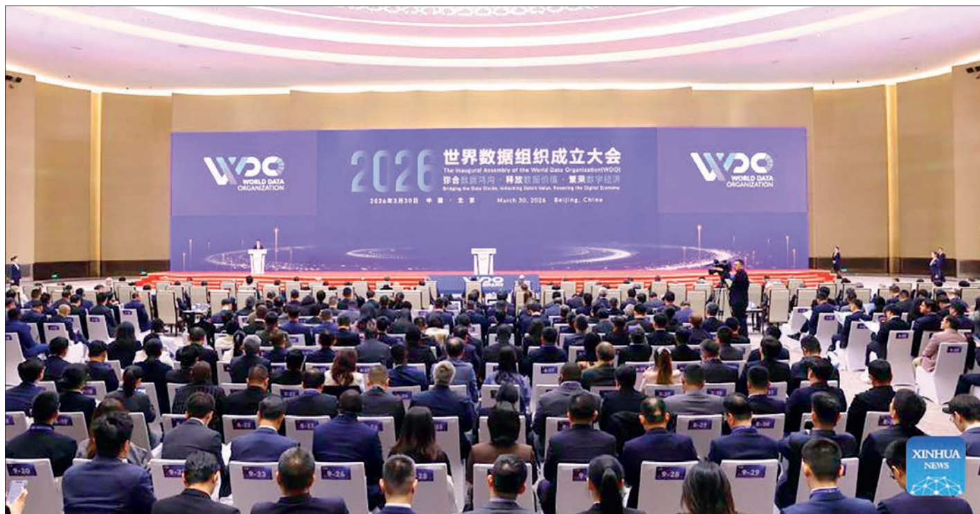
This photo taken on 30 March 2026 shows the inaugural assembly of the World Data Organization (WDO) in Beijing, capital of China.

According to Yang, the organization is also expected to boost the efficiency of data circulation, development and uti-