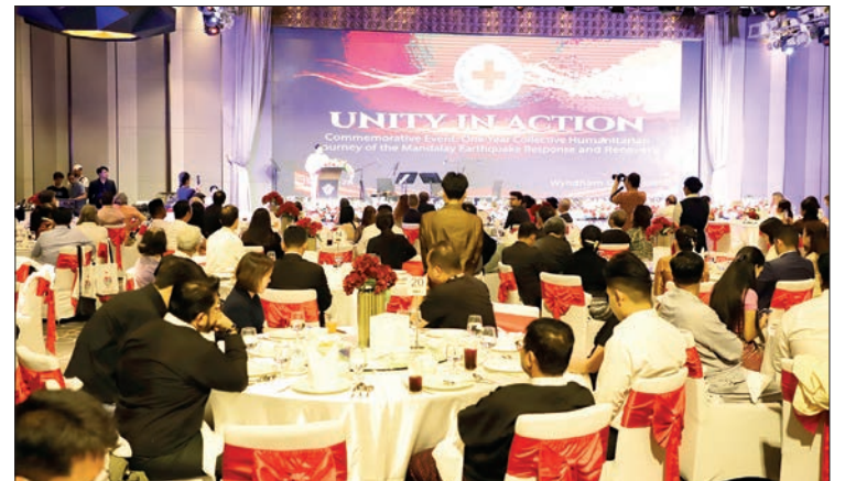
The Unity in Action ceremony is underway to mark the first anniversary of the Mandalay Earthquake.

THE Unity in Action ceremony was held to commemorate the first anniversary of the Mandalay earthquake at the Wyndham Grand Hotel in Yangon on the evening of 28 March.