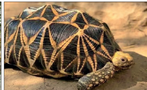
These images showcase the world's endangered species – tapirus, clouded leopards, pangolins, Irrawaddy dolphins, and star tortoises – being well protected in Taninthayi Nature Reserve, Htamathi Wildlife Sanctuary, Lampi Marine National Park, Ayeyawady River, and Minson Hill Wildlife Sanctuary.