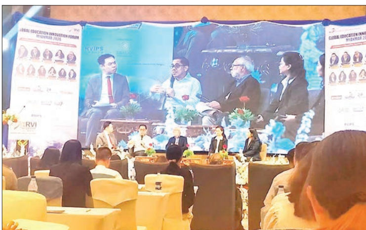
The Global Education Innovation Forum (GEIF)-Myanmar 2026 is in progress yesterday in Yangon.

TO analyze the future of the education sector in the age of Artificial Intelligence (AI) and to share innovative teaching methodologies for educators, the Global Education Innovation Forum (GEIF)-the RVi Group held Myanmar 2026 on 30 March at the Zealax Hotel in Yangon.