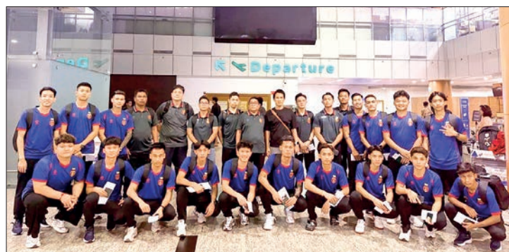
Players and coaches from the Myanmar national futsal team.

MYANMAR national futsal team (men) departed for training to prepare for the ASEAN Futsal Championship 2026 and