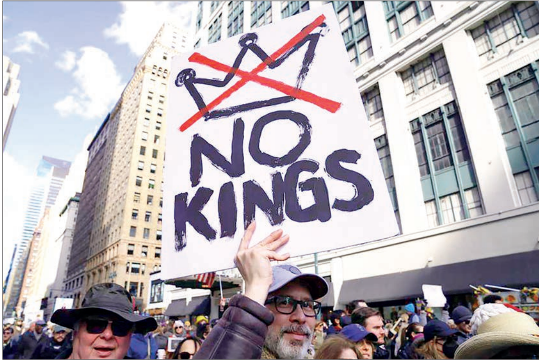
People participate in a "No Kings" protest in New York, the United States, on 28 March 2026.

RALLIES against the US-Israeli war on Iran swept numerous cities across the world over the weekend, with an estimated eight million people turning out for over 3,300 protest events.