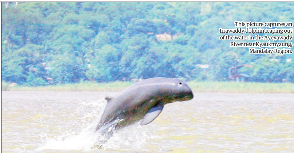
This picture captures an Irrawaddy dolphin leaping out of the water in the Ayeyawady River near Kyaukmyaung, Mandalay Region.

The Irrawaddy dolphin, recognized for its friendly appearance and close interaction with humans, is considered a