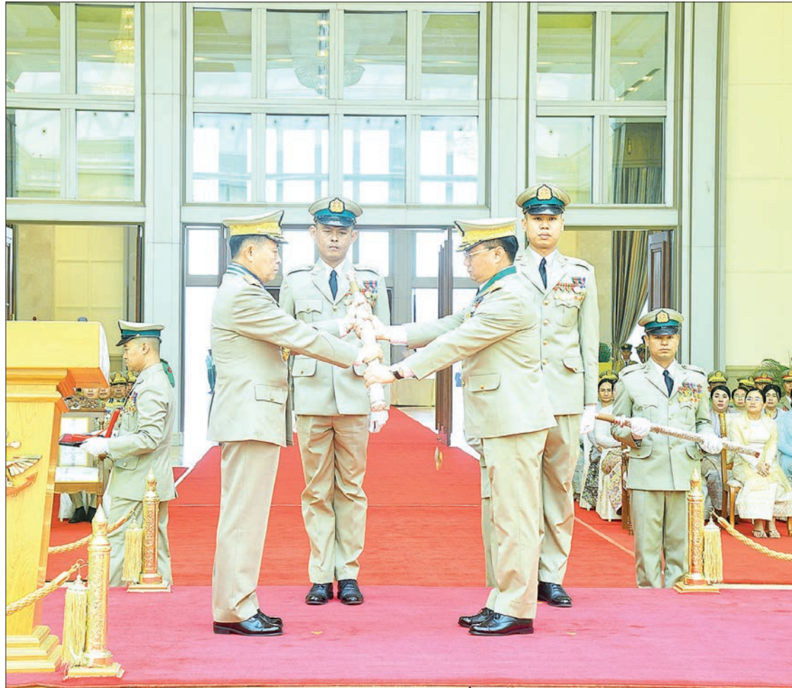
Incumbent Defence Services Deputy Commander-in-Chief Vice-Senior General Thiri Pyanchi Maha Thray Sithu Soe Win and newly appointed Deputy Defence Services Commander-in-Chief General Zeya Kyaw Htin Thray Sithu Kyaw Swa Lin are pictured during the handover of responsibilities.

On the occasion, the Vice-Senior General delivered a speech. He said: Tatmadaw has, through successive generations of leaders — from the pre-independence period, through the post-independence era to the present — provided training and systematically handed over responsibilities to ensure that it remains a young, dynamic, and revitalized force. Regardless of who serves within it, many capable Tatmadaw members are fully qualified to carry out the duties assigned to them. Those Tatmadaw members have become competent through training and refresher courses conducted by the Tatmadaw, as well as through battlefield experiences, staff officer experience, and the instructors' guidance, and shared knowledge of successive trainers and mentors. To enable the effective discharge of duties, senior leaders have