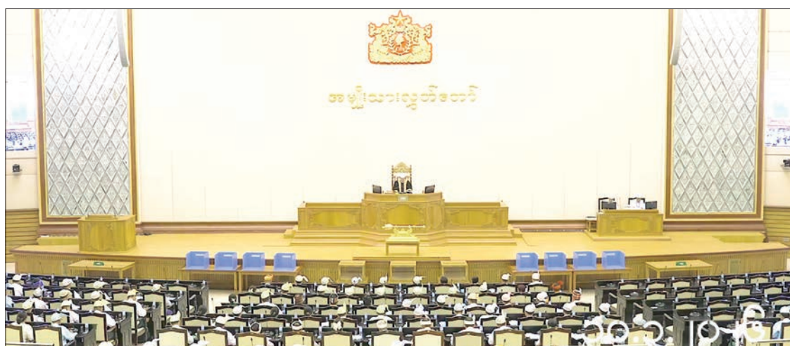
The first-day meeting of the group of elected Amyotha Hluttaw representatives forming the presidential electoral college is underway.