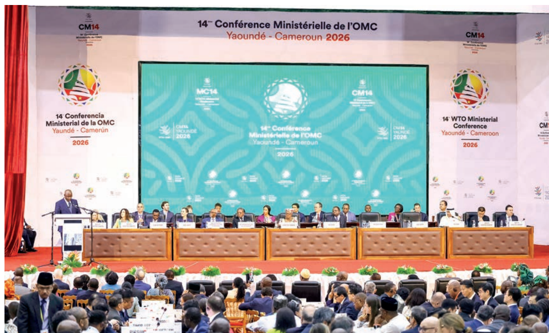
Cameroon's Minister of Trade Luc Magloire Atangana (L) speaks during the WTO ministerial conference in Yaounde on 26 March 2026.

THE WTO's failure to reach significant agreements during high-level talks in Yaounde