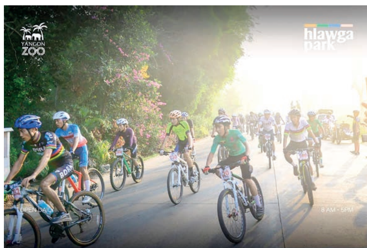
Cyclists are seen competing during the race.

Yangon Region government, the Forest Department, and the Department of Sports and Physical Education, this race was organized to produce new