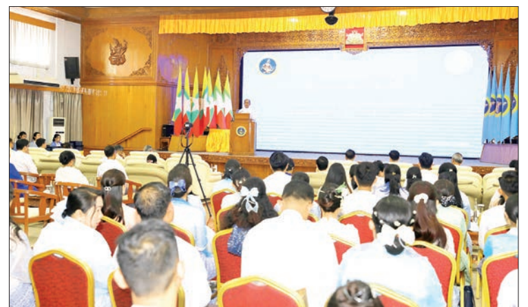
The closing ceremony of the Postgraduate Diploma in Diplomacy Course 1/2025 is underway in Nay Pyi Taw.

The Postgraduate Diploma in Diplomacy Programme Batch 1/2025 was conducted concurrently in Nay Pyi Taw and Yangon from 23 June 2025 to 26 March 2026, for a total duration of eight months. The programme was attended by officials from different government agencies, various ministries and individuals from the private sector who are interested in diplomacy and international relations. A total of 104 participants attended the programme. The Diplomas will be conferred at the convocation to be held at Naypyitaw State Academy in December 2026. — MNA