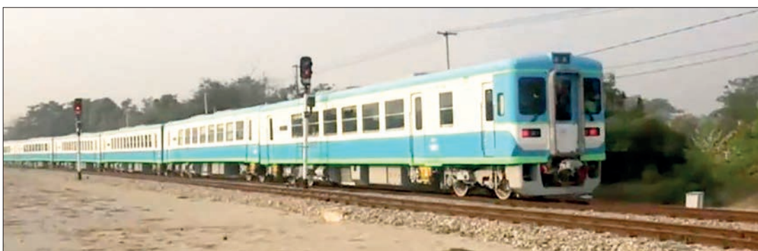
This photo depicts a passenger train operating with additional carriages attached.

MYANMA Railways has announced that additional carriages are being attached to passenger express trains operating on the Yangon-Nay Pyi Taw-Mandalay, Yangon-Mawlamyine, and Yangon-Pyay railway lines.