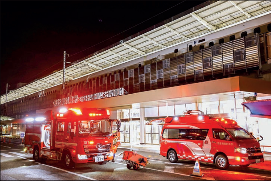
Photo taken in the early hours of 16 August 2025, shows fire department vehicles outside Gifu-Hashima Station, after smoke forced a Tokaido Shinkansen Line bullet train to be stopped mid-service in Hashima, Gifu Prefecture.

JR Central said Saturday that a fire originating from a piece of equipment under the floor of a carriage forced a bullet train to