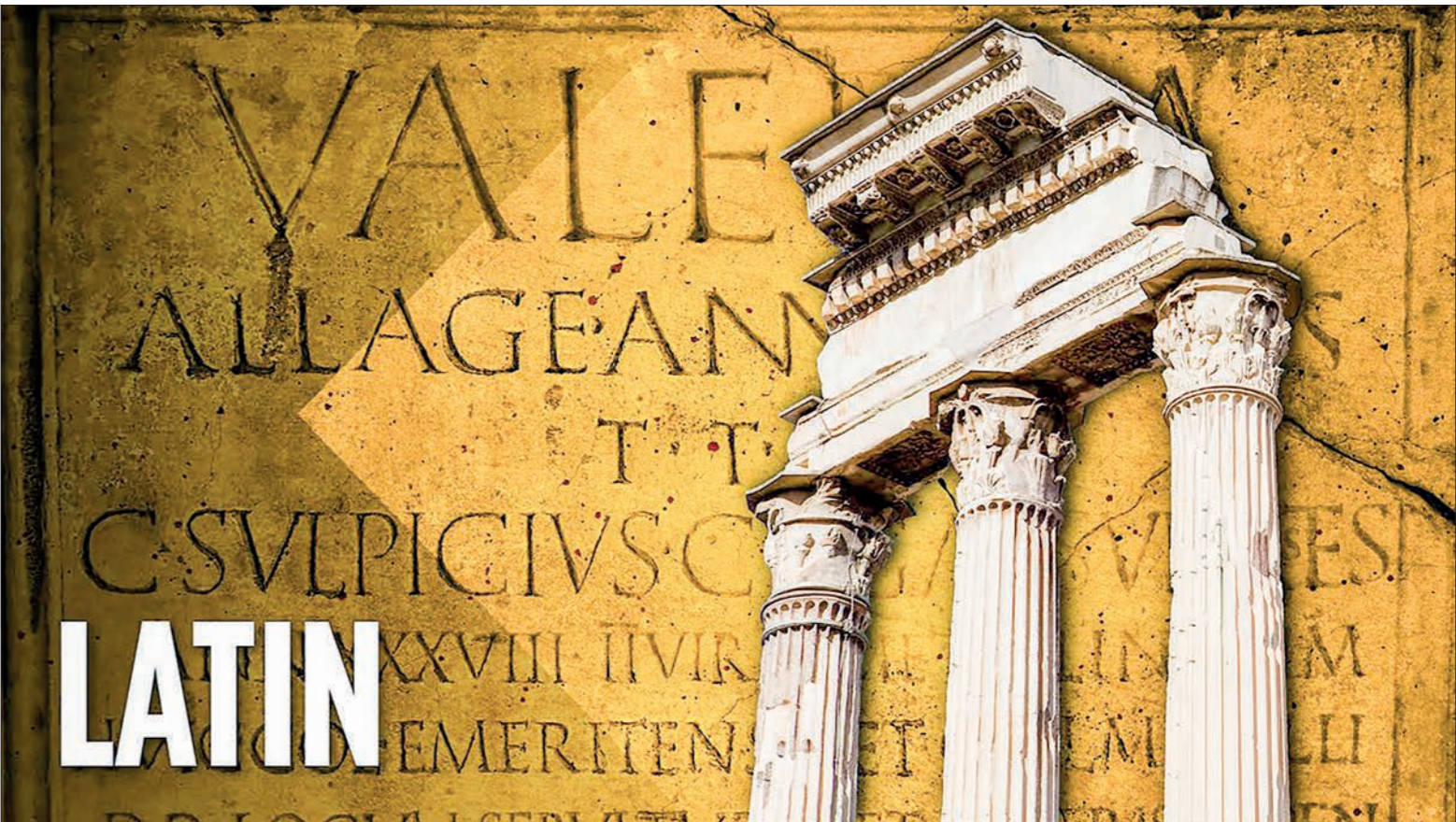
For journalists, editors, and writers, Latin expressions are more than ornamental; they are functional, elegant, and deeply embedded in the language of thought and inquiry.