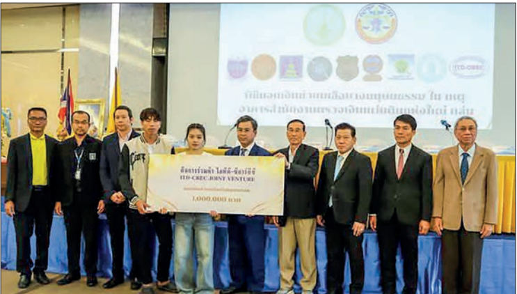
This photo shows authorities providing additional humanitarian aid to families of Myanmar workers who died in the building collapse in Bangkok.