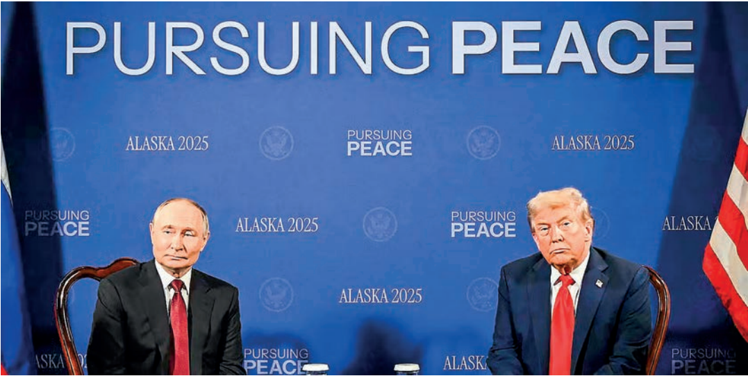
Russia's President Vladimir Putin (left) smiles as he listens to US President Donald Trump during a joint press conference at Joint Base Elmendorf-Richardson, Alaska, 15 August 2025.