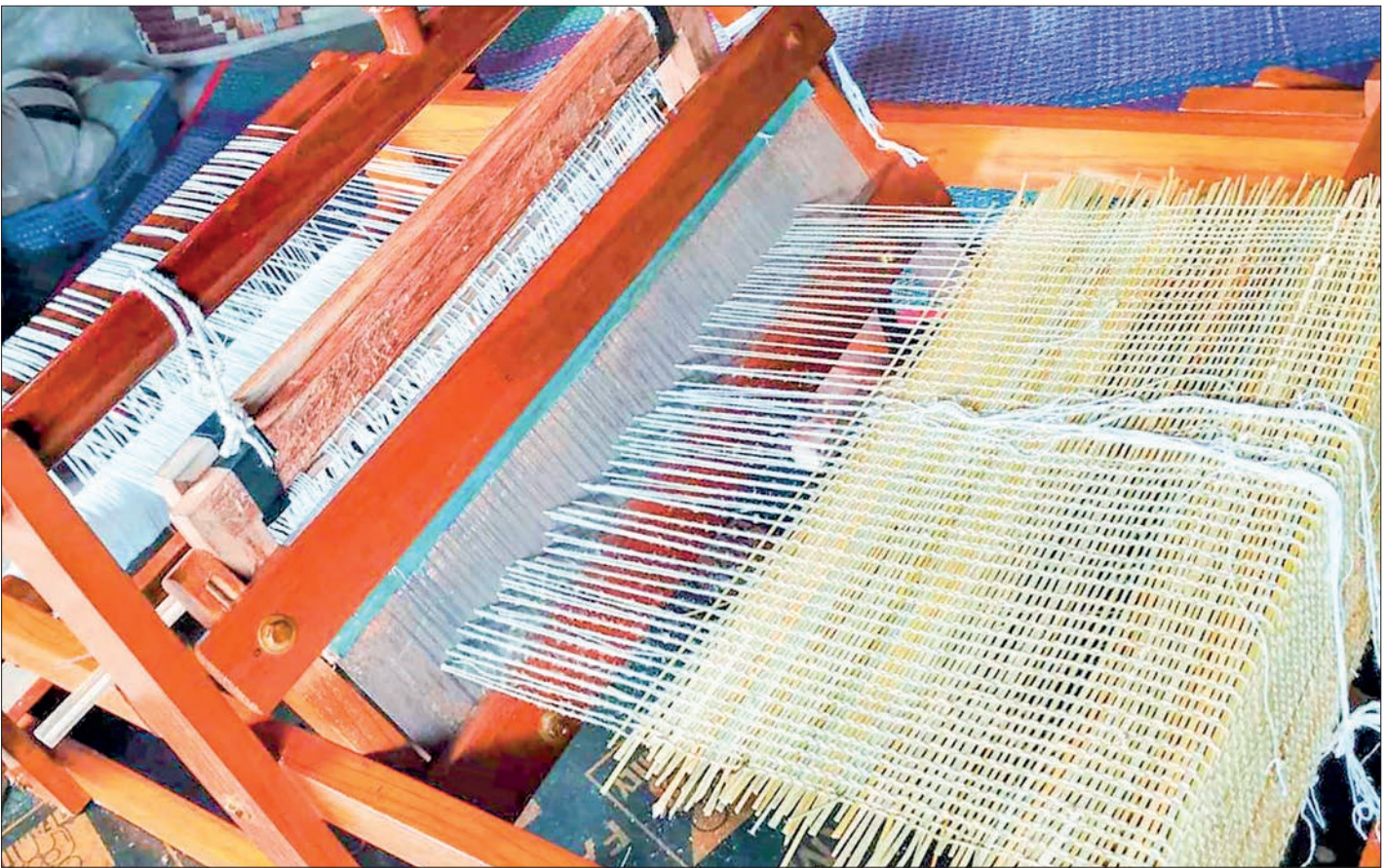
Photo shows a new type of loom to produce consumer goods from greater club-rush, bananas, water hyacinth, bamboo, and cotton. PHOTO ZWE MARN materials such as bananas, water hyacinth, bamboo, and cotton, and are displayed and sold at domestic and international exhibitions, which are especially popular with foreigners. Entrepreneurs from Myanmar have also collaborated with experts from the Weaving School to successfully develop a small weaving loom for producing consumer goods from greater club-rush, creating the first mat from this material and continuing production. SEE PAGE 7

G reen Banana Myanmar, located in the Nyaungnapin Industrial Zone of Hmawby Township, Yangon, has developed a new type of loom to produce consumer goods from greater club-rush (Scirpus grossus), a species of weed, with the aim of selling the products at domestic and international trade fairs. In ASEAN countries, commercial consumer goods are made from waste