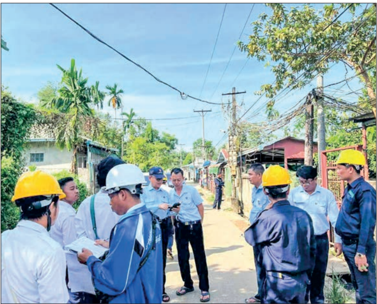
Officials from the Yangon Electricity Supply Corporation conducting inspections in December 2024.

ters to steal electricity. Violating Section 53 may result in a fine for the first offense, followed by both a fine and up to two years in prison for later offenses. Violating Section 53 may lead to the imprisonment of five to 10 years under Section 63. Section 64 states that accomplices will face the same penalties as the offender, while Section 65 stipulates that offenders must compensate for any loss caused. — Htun Htun/ZN