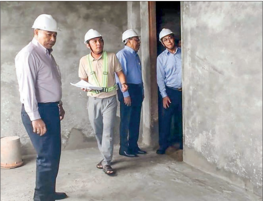
Union Minister for Border Affairs and for Ethnic Affairs Lt-Gen Yar Pyae looks into the progress of the construction of the Ethnic Centre in Dawei yesterday.

UNION Minister for Border Affairs and for Ethnic Affairs Lt-Gen Yar Pyae, together with Taninthayi Region Chief Minister U Myat Ko and Deputy Minister U Zaw Aye Maung inspected construction of the Taninthayi Region Ethnic Centre in Sanchi Ward of Dawei yesterday morning.