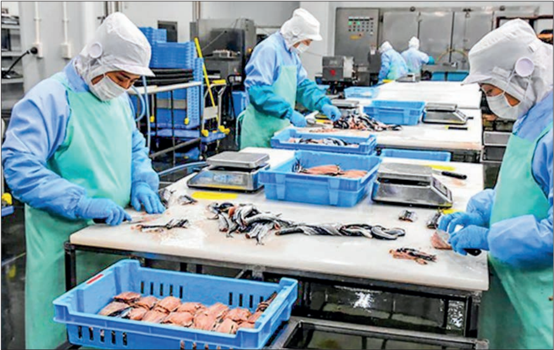
Foreign workers at a fishery company in Japan.