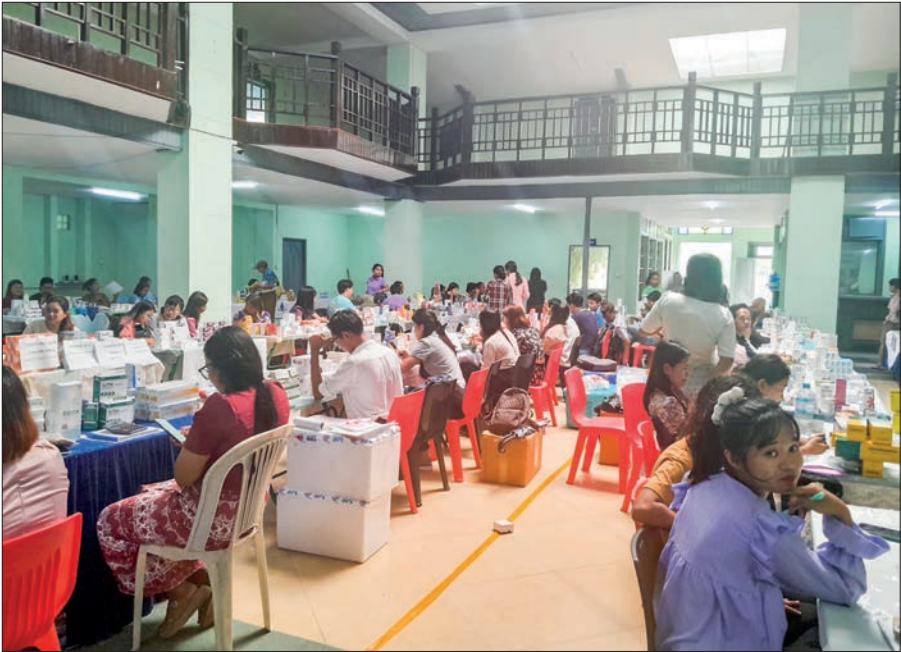
This photo features a demonstration of direct sales of medicines from pharmaceutical companies at reasonable prices.

ACCORDING to the Myanmar Pharmaceutical and Medical Equipment Entrepreneurs Association, there has been no long-term shortage of