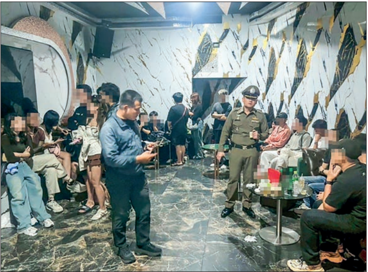
Some of those arrested at the karaoke bar on the night of 15 August.

parts of the city and regularly carry out such inspections. In this instance, the raid targeted a karaoke bar selling energy drinks and narcotic drugs. The Thai police announced that those arrested would be prosecuted for drug consumption, trafficking, and violations of national laws, while undocumented migrants would also face action under the Immigration Law. The Myanmar Embassy in Bangkok has been consistently issuing public reminders on social media urging Myanmar citizens in Thailand to reside lawfully. It was also learnt that the Embassy is preparing to provide necessary assistance regarding this incident. Thai media noted that this case has once again drawn attention to issues of cross-border drug trafficking and illegal labour migration between Thailand and Myanmar. — Htun Htun/KNN