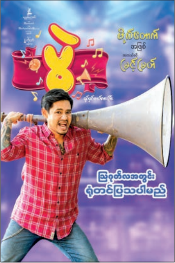
This image displays a poster for the film.